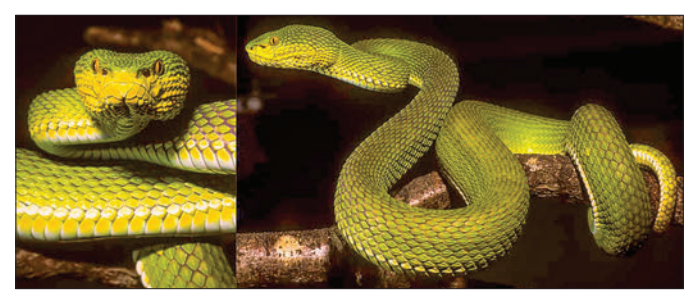
Ayeyawady Pit Viper – a recently found new species.

In addition to this newly identified species, scientists have also found another endemic variety named Trimeresurus uetzi in central regions of the country this year.