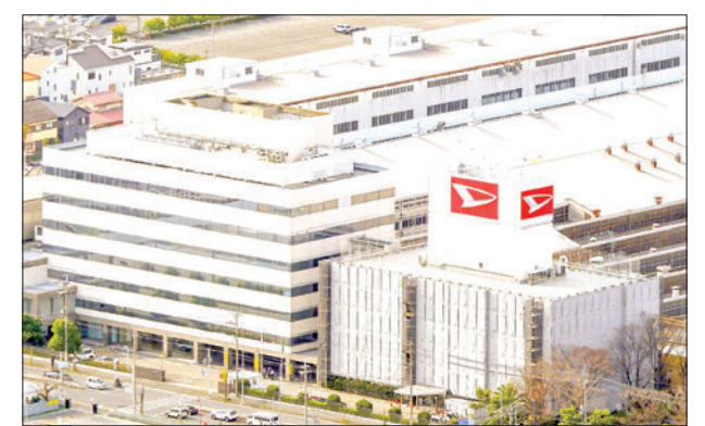
Photo taken from a Kyodo News helicopter on 20 December 2023 shows the head office of Daihatsu Motor Co in Ikeda, Osaka Prefecture.

A third-party panel it has set up identified 174 new counts of misconduct across 25 vehicle test items