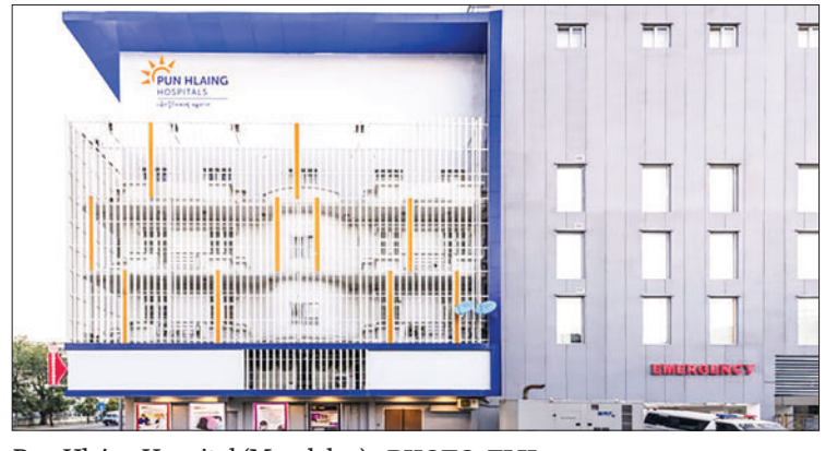
Pun Hlaing Hospital (Mandalay).

Memories Group, a travel agency of FMI Group, that has signed management contracts with famous buildings in Yangon, such as Boutique Hotel, Governor Residence and British Club, is expanding its resort services market amid the challenges of declining foreign tourist arrivals and slowing domestic tourism services, it also stated. — MT/ZN