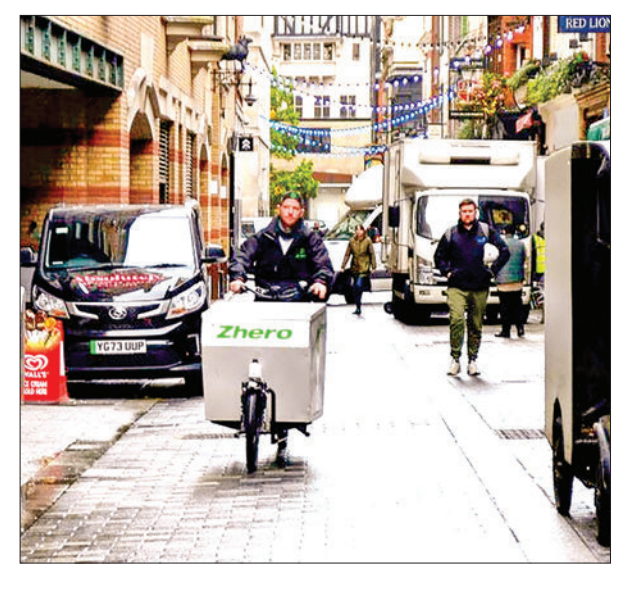
More businesses are turning to E-cargo bikes to beat London traffic.