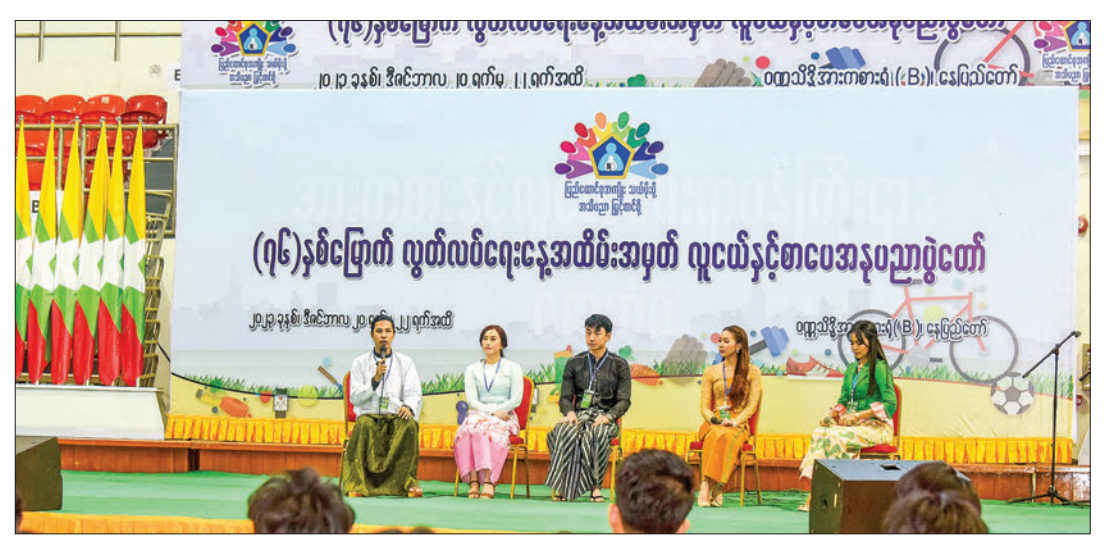
Students take part in the panel discussion on the topic of "Youth and Literature" at the Youth and Literary Fine Arts Festival in commemoration of the 76<sup>th</sup> Anniversary of Independence Day at Wunna Theikdi Stadium B in Nay Pyi Taw yesterday.

THE 76<sup>th</sup> Independence Day Youth and Literary Fine Arts Festival took place yesterday morning at Wunna Theikdi Gymnasium B in Nay Pyi Taw. In the afternoon, a youth panel discussion was conducted on "Youth and Literature", with students actively participating.