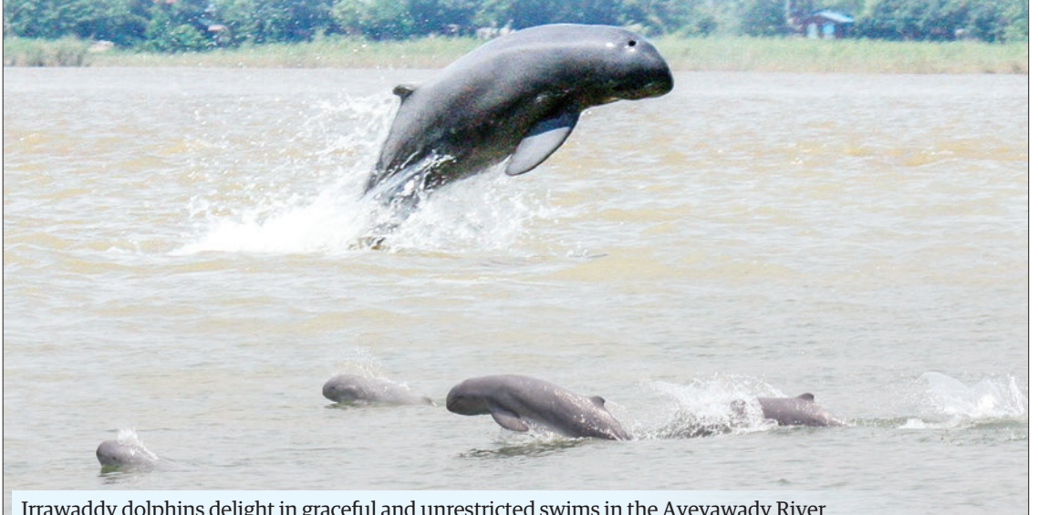
Irrawaddy dolphins delight in graceful and unrestricted swims in the Ayeyawady River

marily found in the Ayeyawady River, have been inhabitants of Myanmar for over 2,000 years. Recognized officially by neighbouring countries along the Mekong River and India, these dol-