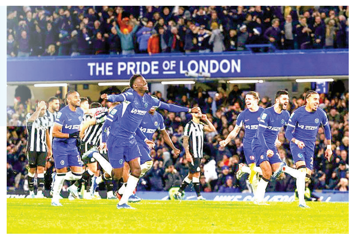
Chelsea celebrate after beating Newcastle in the League Cup quarter-finals.

Beaten three times in their previous five games, a wretched run that started with their 4-1 loss at Newcastle, Chelsea showed