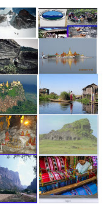
Fig 3. 10 Proposed Myanmar National Geoparks

posed of lava flows and domes (basalts to dacites).