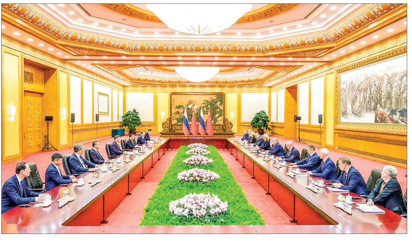
Chinese President Xi Jinping meets Prime Minister of the Russian Federation Mikhail Mishustin in Beijing, capital of China, 20 December 2023.

The Chinese economy has strong resilience, great potential and wide room for manoeuvre, and its long-term sound fundamentals remain unchanged, Xi said. China firmly promotes high-quality development and high-level opening up, which will provide new opportunities for the de-