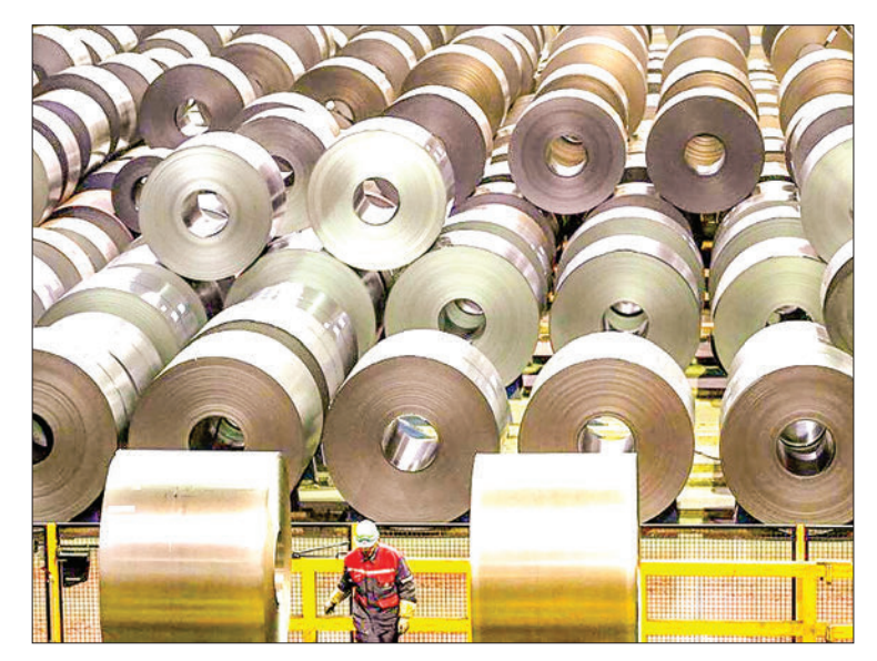
An employee works in a hall with coils of cold-rolled steel at the ThyssenKrupp plant in Duisburg, western Germany.

The write-downs had become necessary due to higher capital costs, the recession and the "structural changes specific to the steel industry", Thyssenkrupp said when publishing the figures at the end of November. — Xinhua