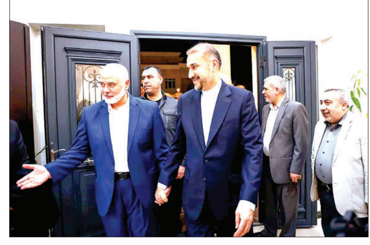
Hamas chief Ismail Haniyeh's arrival in Cairo on 20 December was preceded by a meeting with Iran's foreign minister Hossein Amir-Abdollahian (centre) in Qatar.

sible for the release of all the hostages," the premier told the relatives of some of the 129 captives still believed to be held in Gaza