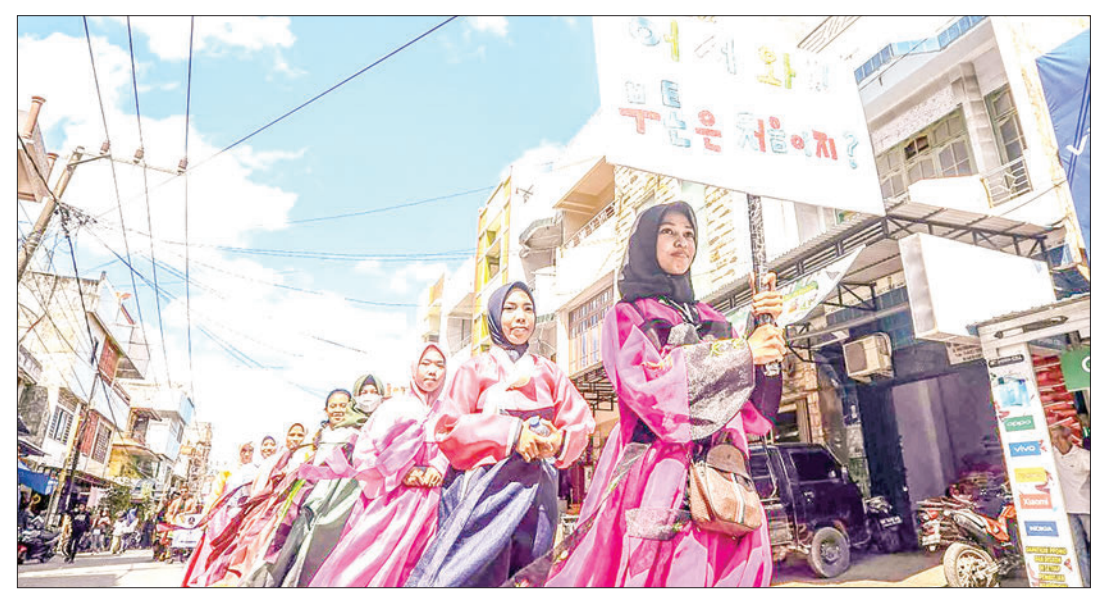
This picture taken on 14 October 2023 shows participants in traditional Korean attire holding signage in the Korean Hangul script, used to document the language of the Cia-Cia ethnic group which has no written form, during the city's anniversary event in Baubau on Buton island, Southeast Sulawesi.

The Cia-Cia language lacks a written form and doesn't easily translate to the Latin alphabet, but the syllable-based Hangul script aids in preserving the language for the 80,000 Cia-Cia people.