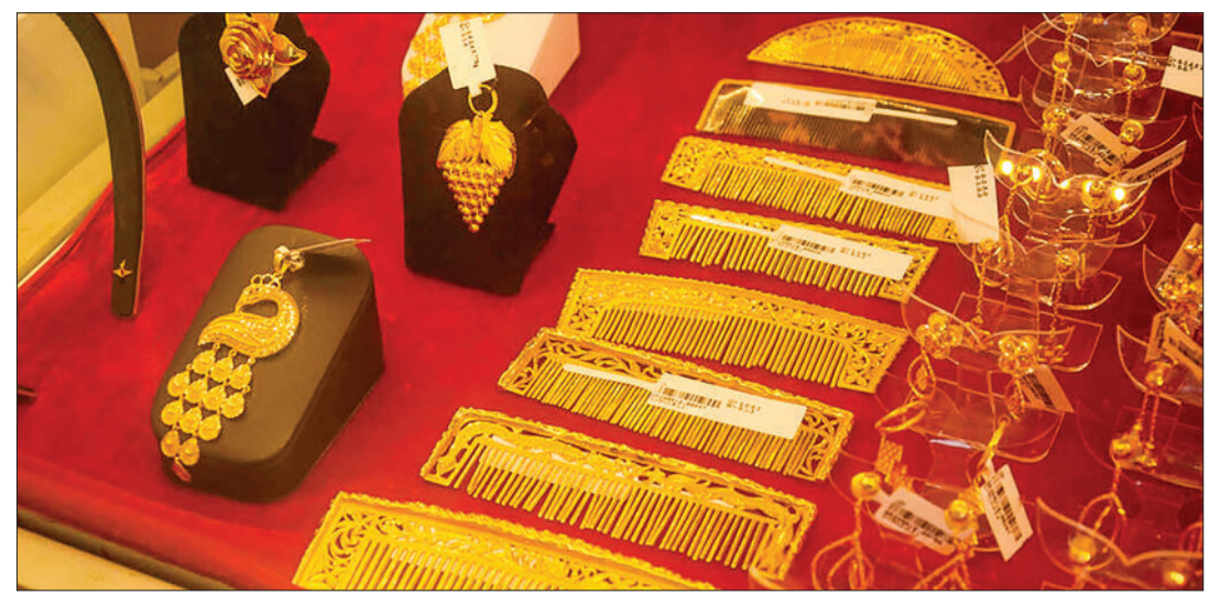
Jewellery items are displayed at the gold jewellery's outlet in Yangon.

YANGON Gold Entrepreneurs Association (YGEA) will offer gold education course (30<sup>th</sup> Batch) for free at its office at No 42/50 on Shwebontha Street, Pabedan Township, in the coming January (2-11 January 2024).