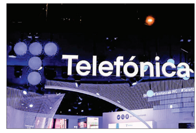
The Spanish government's stake in Telefonica will balance out a similar stake taken by Saudi Telecom (STC).