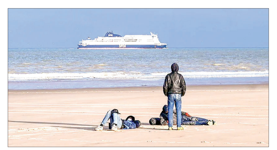
Three men are seen on a beach in Sangatte, northern France, after a failed attempt to cross the English

EU countries and lawmakers strike a deal on an overhaul of asylum and migration laws, featuring faster vetting, border detention centres, accelerated deportations, and a solidarity mechanism.