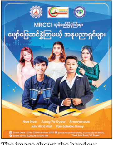
The image shows the handout from the MDY Intl Trade Fair and Investment Forum 2023.

The event will be held at the Mandalay Convention Centre in Chanmyathazi Township, Mandalay Region, from 20 to 22 December. A programme of music performances by ar-