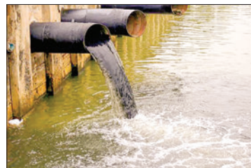
Factory sewage discharge raises environmental concerns.

According to the United Nations, in 2021 each person on the planet will produce on average 7.6 kilogrammes of e-waste, meaning that a massive 57.4