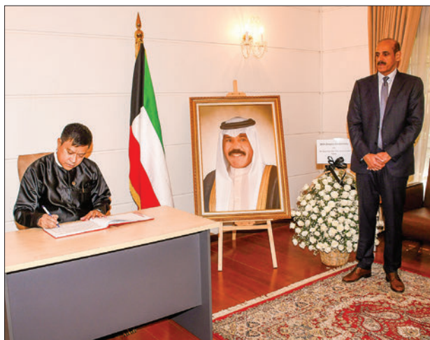
MoFA Director General U Zaw Phyo Win signs the condolences book yesterday in Yangon.

DIRECTOR-GENERAL of the Strategic Studies and Training Department of the Ministry of Foreign Affairs U Zaw Phyo Win signed the book of condolences for the death of His Highness Sheikh Nawaf al-Ahmad al-Jaber al-Sabah, the Emir of the State of Kuwait, yesterday morning at the Kuwait Embassy in Yangon. — MNA/KZW