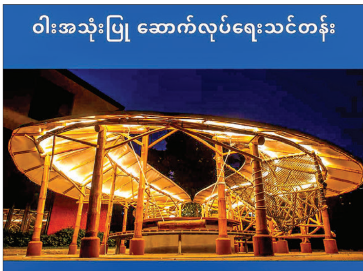
The pamphlet on the use of bamboo training.

Myanmar embassies in Korea, Singapore, Thailand, and Malaysia have communicated that Myanmar citizens living and working in these countries must fulfil their income tax obligations. — TWA/TRKM