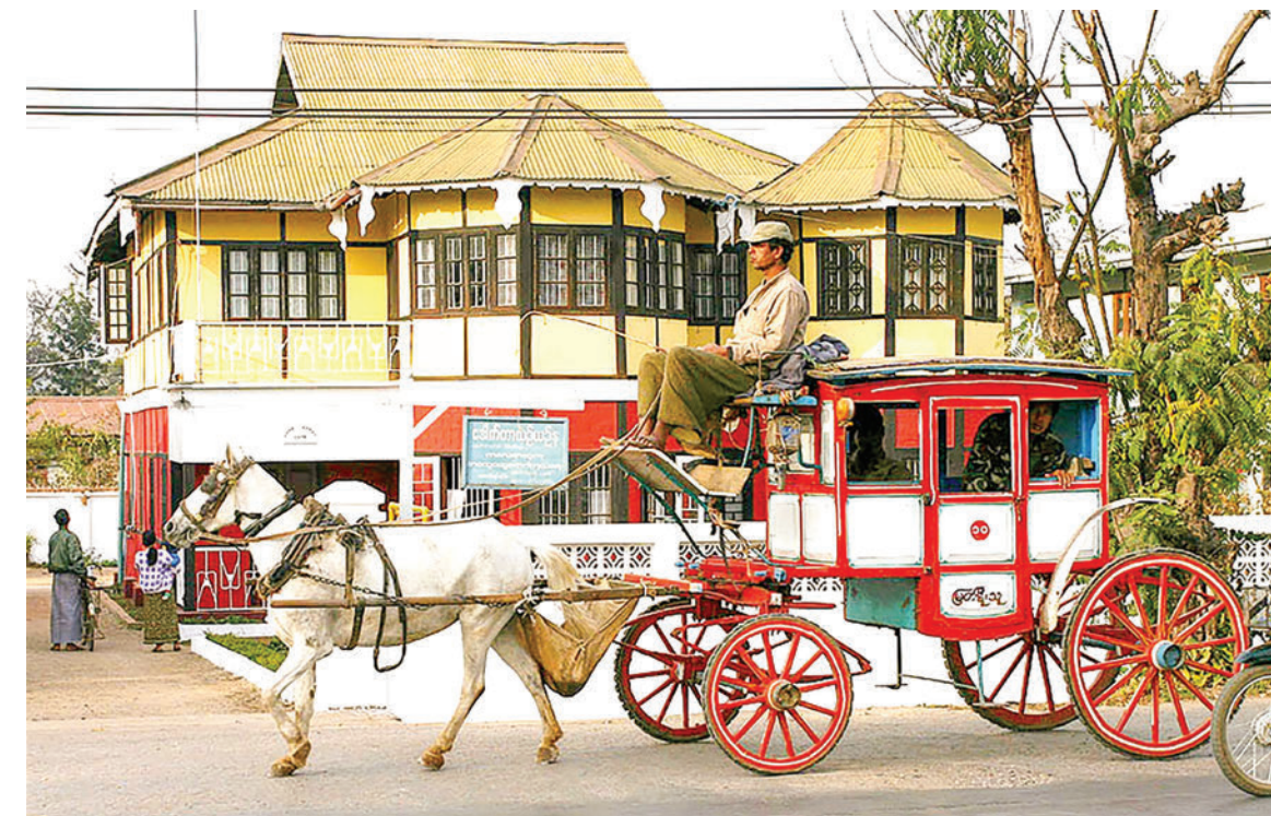
Unique horse carriages and British colonial houses make PyinOoLwin stand out from the rest of the towns in Myanmar.

PyinOoLwin boasts a diverse array of exotic trees and flowers, creating enticing flower gardens like Cherry City and Flower City, while its fertile soil has led to its transformation into a thriving Coffee City.