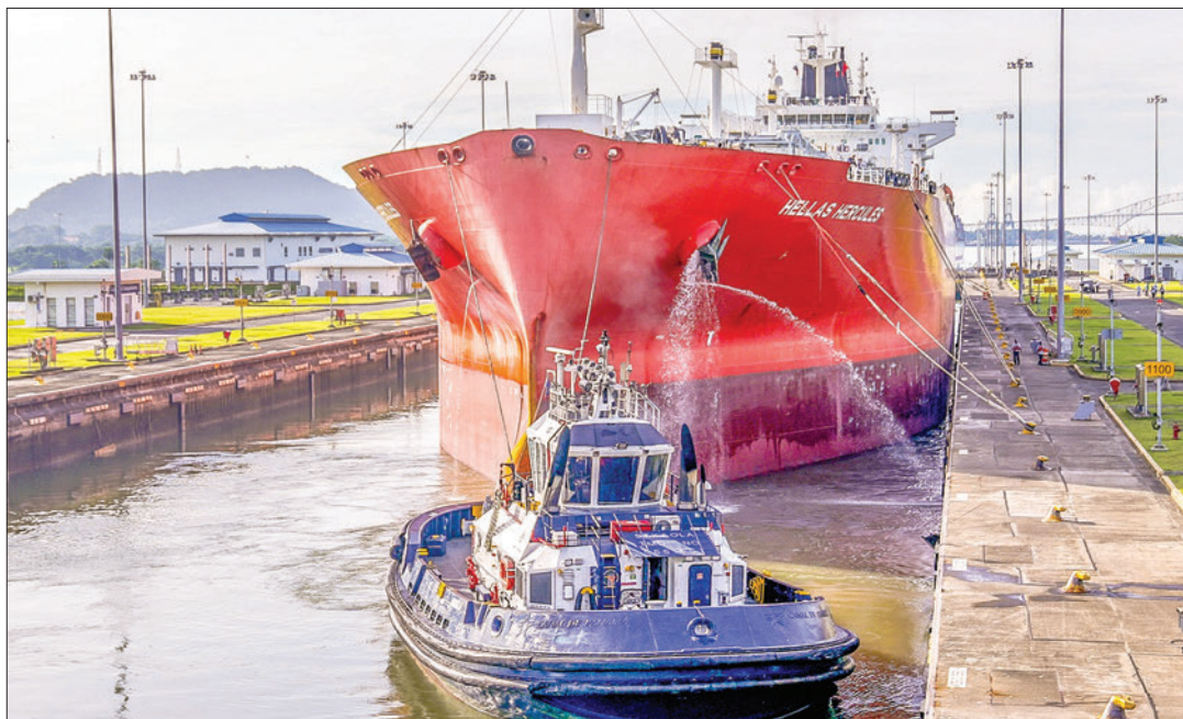
A cargo ship navigates through the Panama Canal in the area of the Cocoli Locks in Panama City on 25 August 2023. PHOTO: AFP

In 2023, 510 million tonnes of cargo passed through the Panamanian waterway, eight million less than in the previous year. — AFP