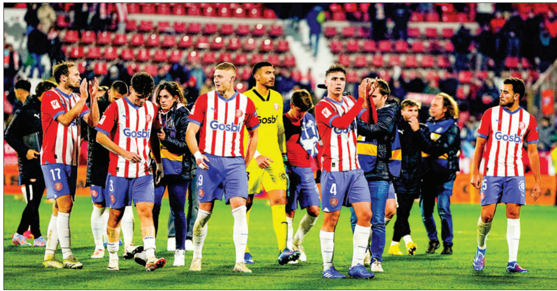
Girona's players celebrate victory at the end of the Spanish league football match between Girona FC and Deportivo Alaves at the Montilivi stadium in Girona on 18 December 2023. Girona won 3-0.