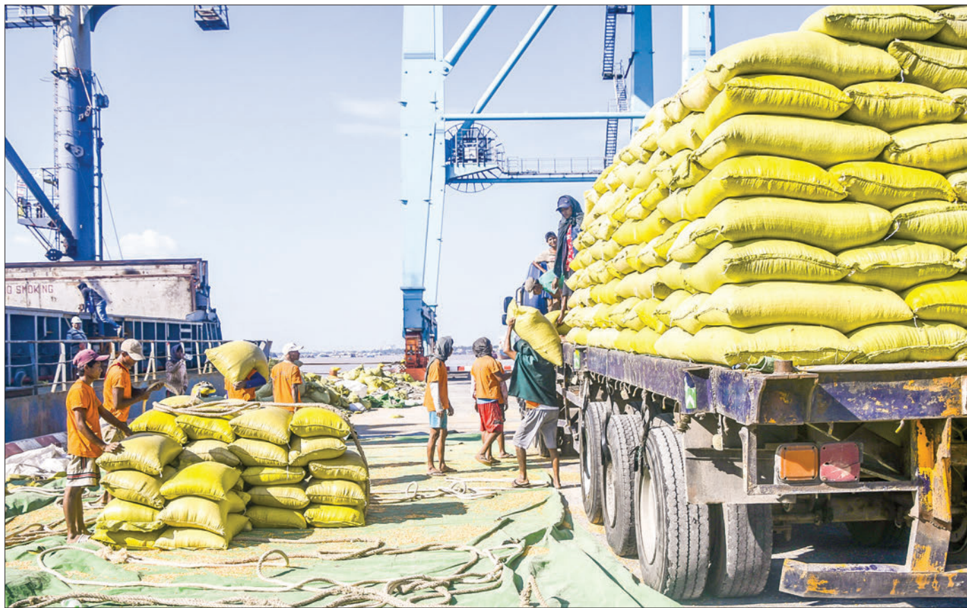
Export cargoes seen being loaded onto the overseas-going merchant vessel at Yangon Port.

I NDIA is reportedly to bring in 400,000 tonnes of pigeon pea (tur) and one million tonnes of black gram (urad) from Myanmar in two months (January and February) in 2024 to curb rising prices in the domestic market, citing a report by the Economic Times.