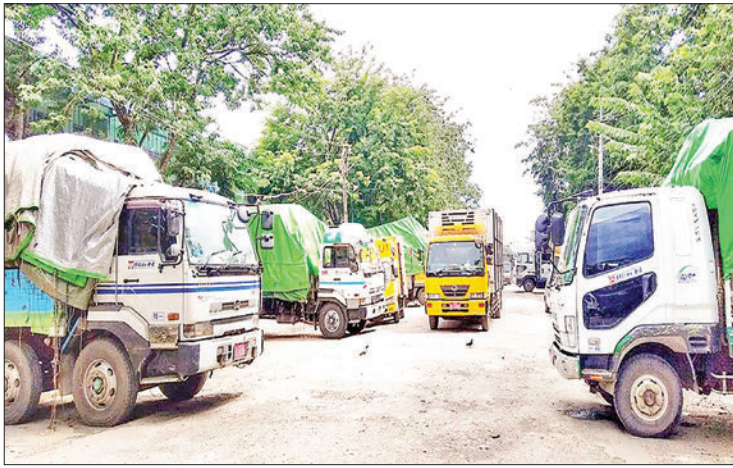
Trucks in the Bayintnaung Wholesale Market.

THE transport cost of goods has surged significantly, attributed to challenges in acquiring fuel, as reported by truck drivers from the Bayintnaung Wholesale Market.