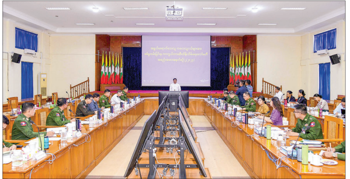
SAC Member Deputy Prime Minister MoD Union Minister Admiral Tin Aung San chairs the meeting 2/2023 of the Committee on the Prevention of Recruitment of Child Soldiers yesterday.

Attendees then coordinated discussions before the committee chairman concluded the meeting. — MNA/KTZH