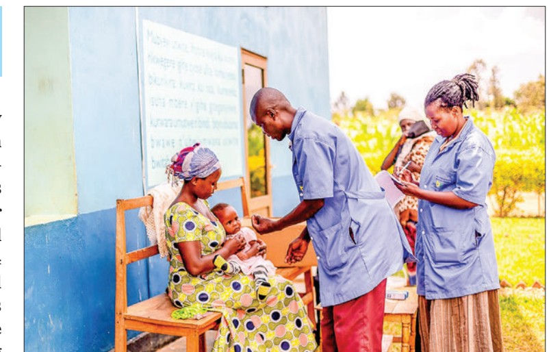
A new and important aspect of this year's global health expenditure report is the insights into health capital investments, which is essential to the functioning of health systems, now and into the future.