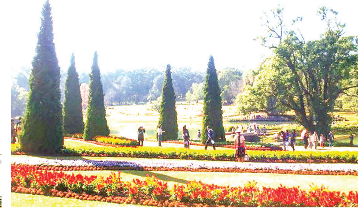
Kandawgyi National Garden at PyinOoLwin.

acres), but it is. It is possible to hire a cart to explore it in comfort, visiting features such as the petrifried wood museum, orchid garden, walk-in aviary, and view the town.