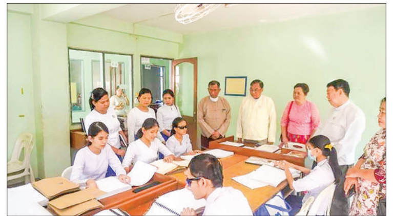
MNHRC Commissioners seen during their inspection tour on 19 December.