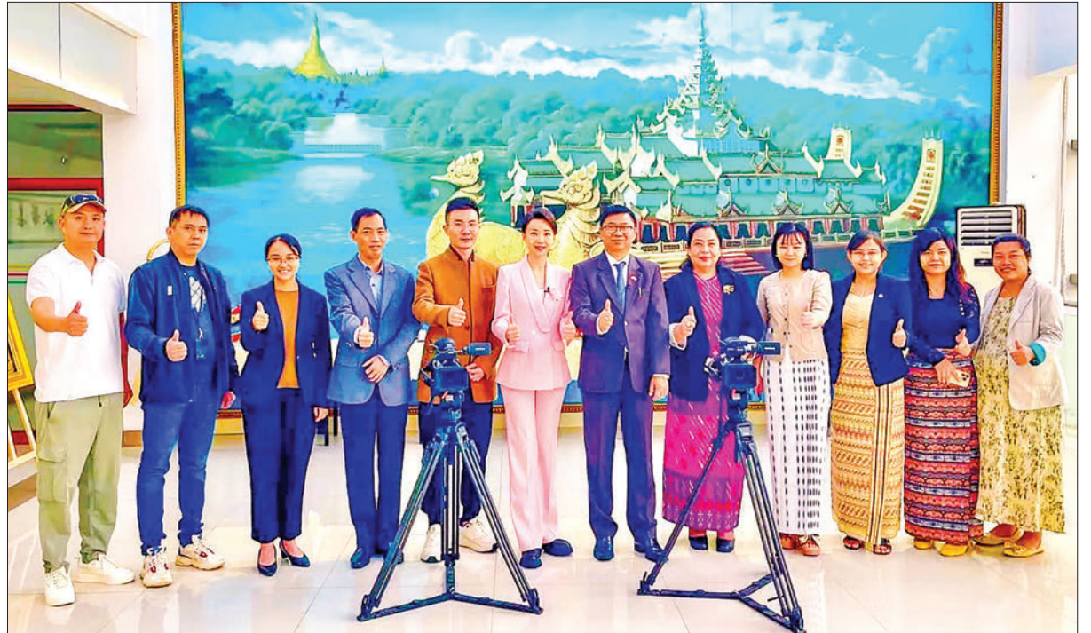
A documentary group photograph of the introductory event in Nanning, China.

The corn is cultivated in Shan, Kachin, Kayah and Kayin states and Mandalay, Sagaing and Magway regions. Myanmar has three corn seasons — winter, summer and monsoon. The country produces 2.5-3 million tonnes of corn every year. — NN/EM