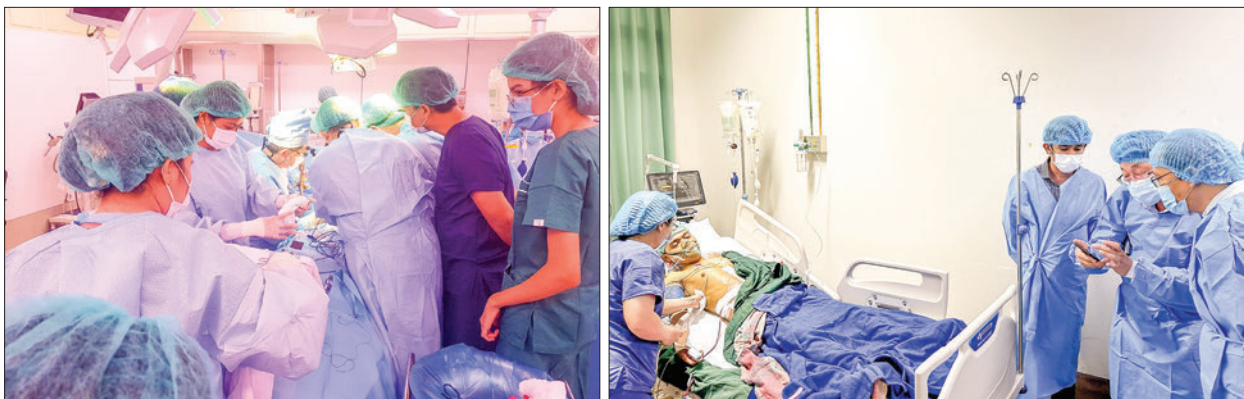
Photos show the successful surgical operation and post-operative patient update on 18 December 2023.

UNION Minister for Health Prof Dr Thet Khaing Win, accompanied by relevant officials, comforted the recipient of the 35 th liver transplant operation and donor at the Yangon Speciality Hospital, a 500-bed facility, on 18 December.