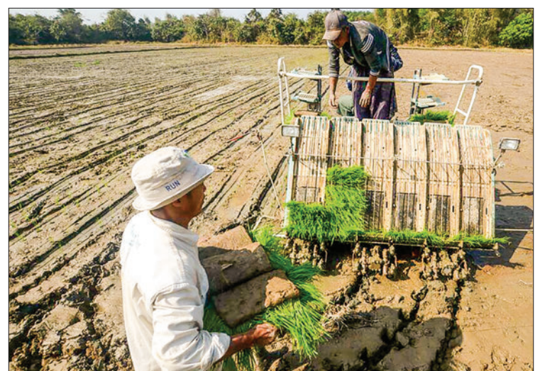
Farmers prepare to grow paddy with transplanter.