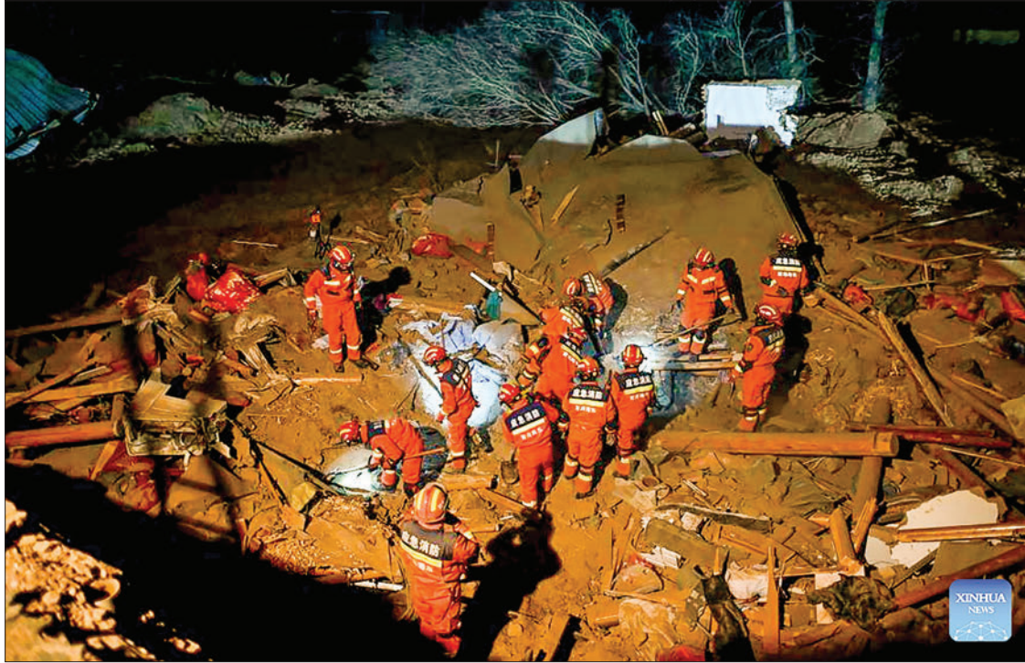
Rescuers are in operation at Caotan Village of Minhe Hui and Tu Autonomous County in Haidong City, northwest China's Qinghai Province, 19 December 2023.

PRESIDENT Xi Jinping has urged all-out search and rescue efforts and proper arrangements for affected people to ensure the safety of people's lives and property after a 6.2-magnitude earthquake jolted Jishishan County in northwest China's Gansu Province at midnight Monday.