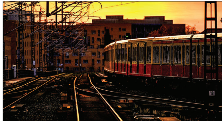
An S-Bahn train leaves the main railway station (Hauptbahnhof) in Berlin on 22 November 2023, as the sun sets over the German capital. The S-Bahn is operated by S-Bahn Berlin GmbH, a subsidiary of Deutsche Bahn.

DEUTSCHE Bahn on Tuesday said it had launched the sale process for its logistics subsidiary Schenker as the German rail operator looks to "focus on its core business".