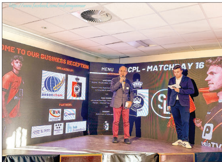
The business networking reception in progress on 17 December in Belgium.