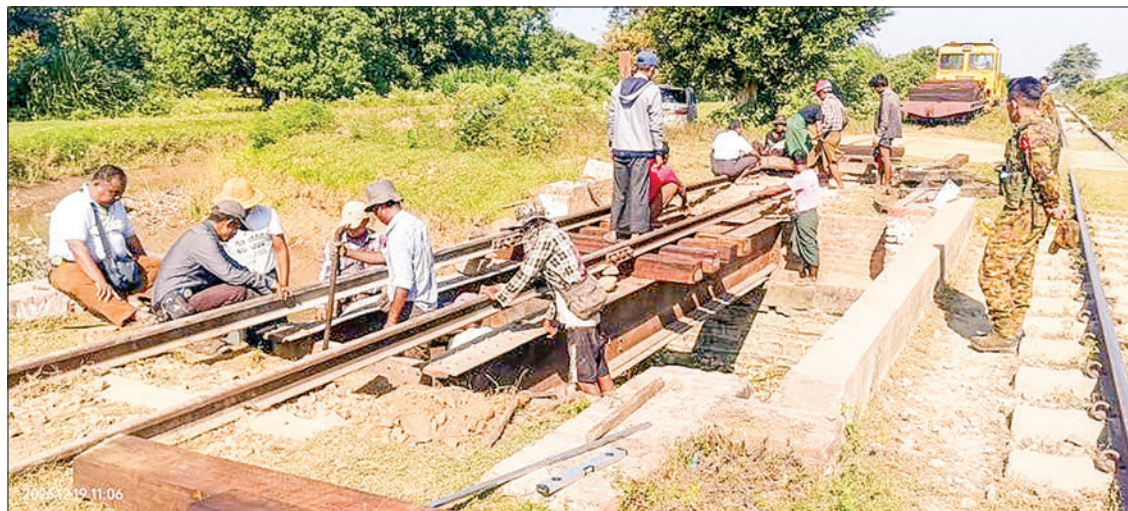
MR employees diligently repairing damaged rail sections for the smooth and fast public transport.

PDF terrorists attacked with landmines near bridge No 736, Mileposts 353/3 and 353/4, between the Minsu Station and Kyaukse Station, Kyaukse Township, Mandalay Region, yesterday.