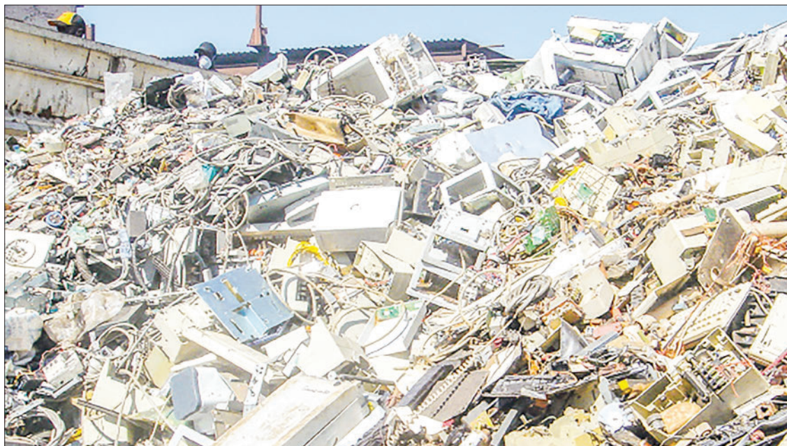
The photo illustrates stacks of discarded electronic gadgets and devices.

E-waste also contains toxic and hazardous materials such as mercury, cadmium, lead, nickel, beryllium, chromium, chemical flame retardants, etc. They can