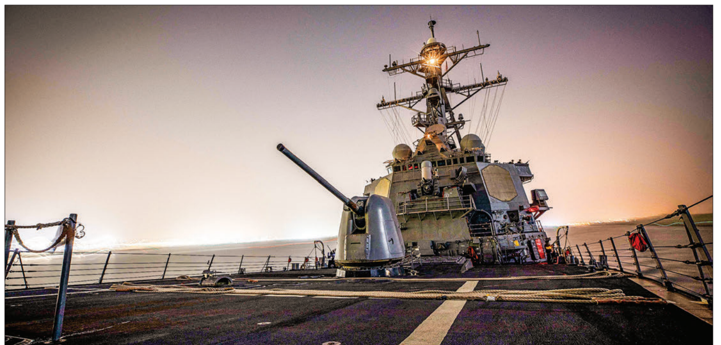
In this image obtained from the US Department of Defence, the Arleigh Burke-class guided-missile destroyer USS Carney transits the Suez Canal on 26 November 2023. The destroyer on 16 December 2023, shot down more than a dozen drones in the Red Sea launched from Huthi-controlled areas of Yemen, the US Central Command (CENTCOM) said.

tional initiatives... to restore security in the Red Sea to deter future Huthi aggression,” the statement added. — AFP