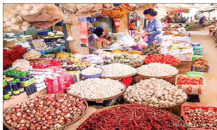
A housewife seen shopping for dry groceries at a retail outlet.

The prices of various pulses stood at K2,928,000 per tonne of black gram (Fair Average Quality/RC), K3,208,000 per tonne of black gram (Special Quality/RC), K3,005,000 per tonne of pigeon pea (red gram) RC, K3,750 per viss of green gram (Shwewah) and K6,000 — K6,150 per viss of chickpea in Yangon's wholesale markets. — TWA/KK