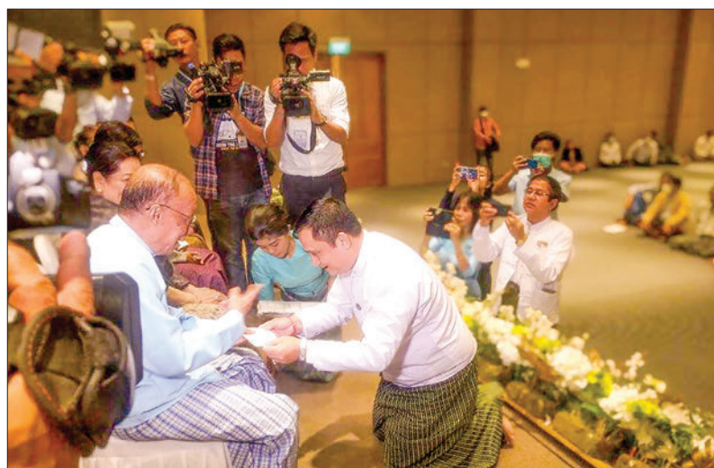
Music maestros receiving obeisance in the previous year.