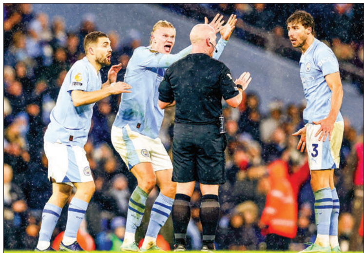
Manchester City's Croatian midfielder (8) Mateo Kovacic (L), Manchester City's Norwegian striker (9) Erling Haaland (2L) and Manchester City's Portuguese defender (3) Ruben Dias (R) appeal to English referee Simon Hooper during the English Premier League football match between Manchester City and Tottenham Hotspur at the Etihad Stadium in Manchester, northwest England, on 3 December 2023.

MANCHESTER City have been fined £120,000 ($152,000) after their players surrounded referee Simon Hooper in the closing moments of their 3-3 draw with Tottenham earlier this month.