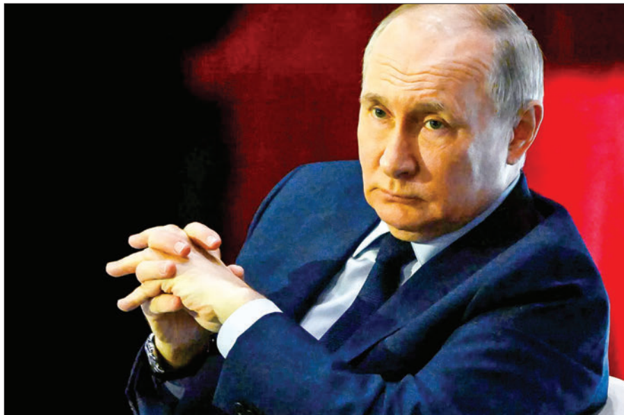
Russian President Vladimir Putin.

“Assessing the current situation on the ground, on the contact line, one can say with confidence that our troops have the initiative. In essence, we are doing what we think is necessary,” he said.