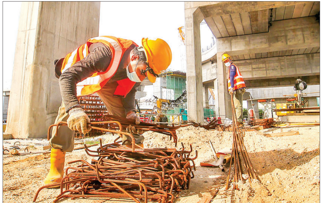
The photo depicts two Myanmar workers at the workplace in Malaysia.

Interested applicants can inquire in person at Monkey Joint, Ownchan Lanthit, City Bypass Road, and Bago during office hours, or they can email zin.zinn@gmail.com. — TWA/TRKM