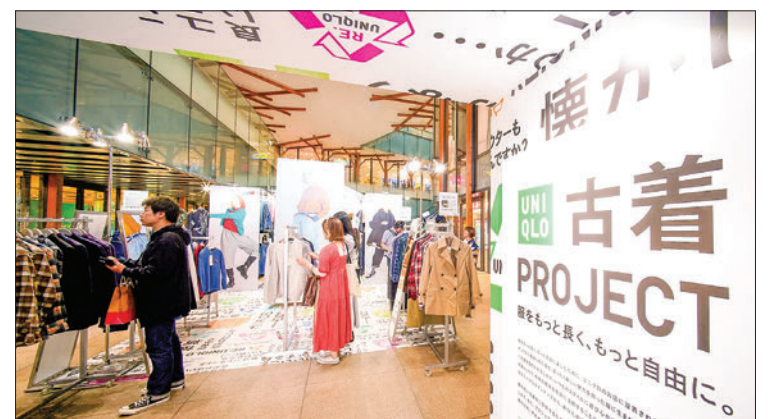
This picture taken on 17 October 2023 shows customers browsing through items sold as part of the Uniqlo Pre-owned Clothes Project at the brand's Harajuku store in Tokyo.

A second-hand pop-up store in Tokyo by casual clothing giant Uniqlo was a first for the Japanese firm, but also a sign that a local aversion to used garments may finally be fading.