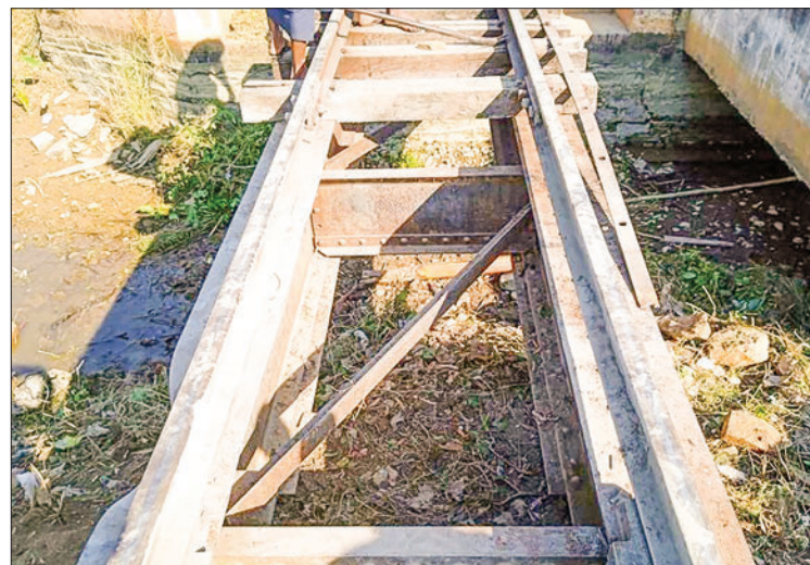
Debris in the aftermath of mine blasts perpetrated by terrorists.

Insurgents have repeatedly committed damage to state-owned locomotives, coaches and goods, so people strongly oppose and condemn the brutality of these terrorists, according to the statement. — MNA/KZL