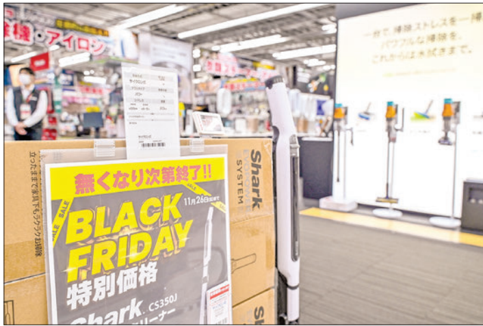
A sign for the "Black Friday" sale is posted in a department of an electronics chain store in central Tokyo on 24 November 2023.

nomics report came as the Bank of Japan's Tankan report for December showed last week that confidence among manufacturers and nonman-