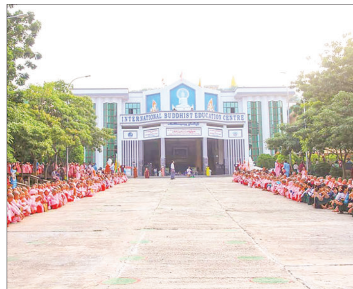
A general view of the International Buddhist Education Centre.

Under the theme “Education is shared with those in need”, the programme, which aims to help displaced children to continue their learning and to help all school-age children to learn peacefully and freely with no discrimination, is being carried out amid challenges, according to the school.