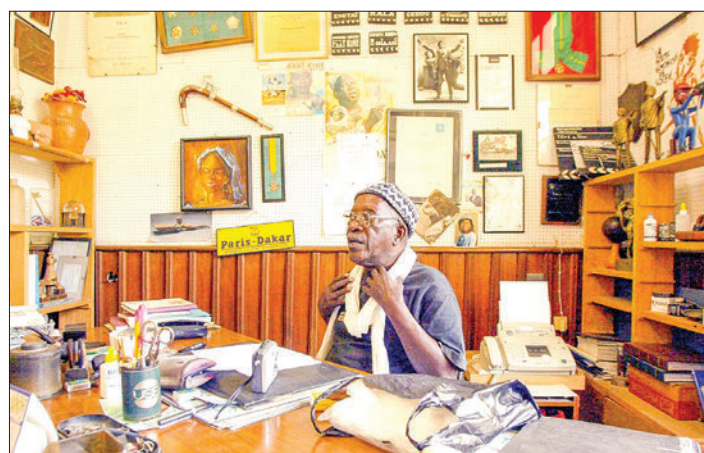
(FILES) Senegalese director Ousmane Sembene, 82, poses for a photo in his office in Dakar on 18 February 2005.

The African cinema archive fund ASM is now digitalising these old negatives and is due to exhibit them in Burkina Faso, France and Italy. — AFP