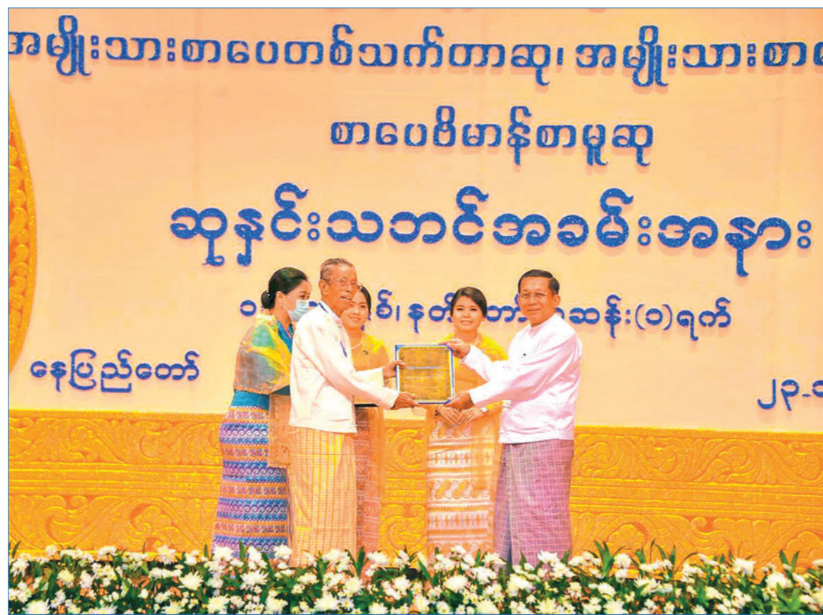
A Literary Award Presentation Ceremony held on the 1 st Waxing of Nadaw.

According to Sayagyi U Pe Maung Tin, a lifelong scholar of