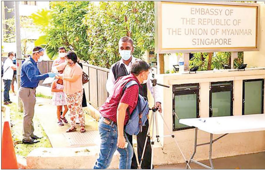
The photo shows Myanmar citizens at the Myanmar Embassy in Singapore.

THE Myanmar Embassy in Singapore has announced that Myanmar citizens residing in Singapore are obliged to pay income tax starting from 12 December 2023.