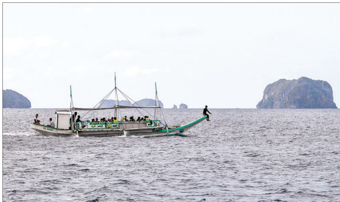
People sail on a tour boat in El Nido, Palawan province on 12 December 2023.

DOT data showed that 2.65 million international travellers visited the Philippines in 2022, raking in 208.96 billion pesos (roughly 3.8 billion dollars) in revenue. — Xinhua