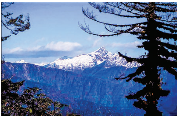
The breathtaking scenery of snow-capped Mt Phonkanrazi.

Kachin currently boasts 35 hotels and guesthouses in Myitkyina District, 12 in PutaO, and one in the Indawgyi area. Initiatives are under implementation to introduce homestay-based tourism in some destinations.— Nyein Thu (MNA)/NT