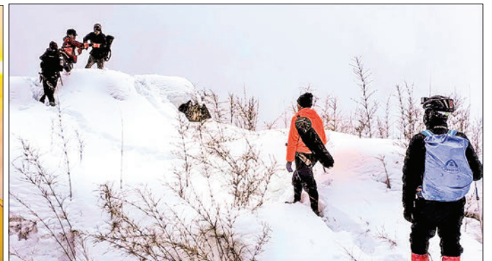
A trekking team conquering an icy mountain ascent.