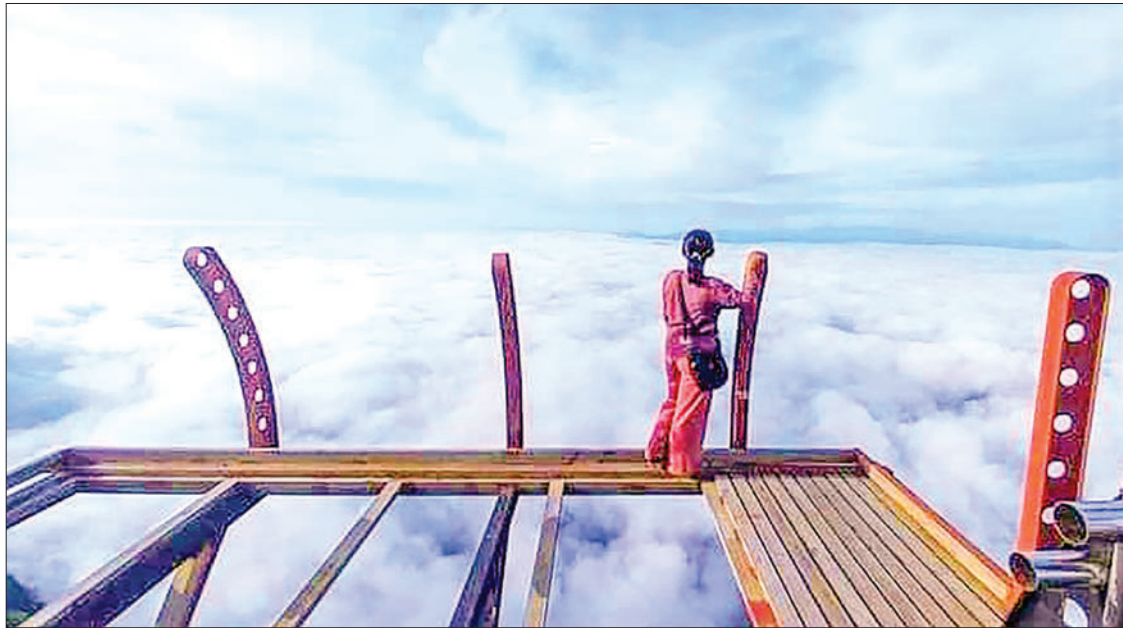
The Photo showcases a captivating natural destination in Myanmar.

The Ministry of Hotels and Tourism recommends destinations for this peak season, including Nay Pyi Taw, Yangon, Mandalay, Bagan, Ngwehsaung, Chaungtha, Ngapali, PyinOoLwin, Inlay, Kalaw, Taunggyi, Kawthoung, Kyaukpyu, Manaung Island, and PutaO.