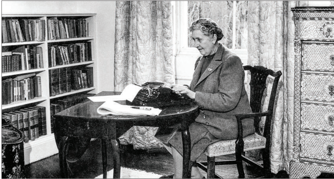
English writer Dame Agatha Christie, at work on a typewriter in March 1946 in her home, Greenway House, in Devonshire.

THE return of the sleeper train from Berlin to Paris is a reminder of the romance of railways that has long inspired writers, musicians and filmmakers.