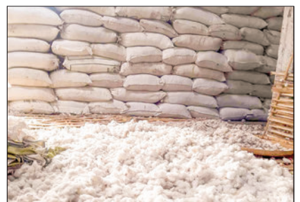
Leasing plan for 17 State-owned cotton grinding factories unveiled