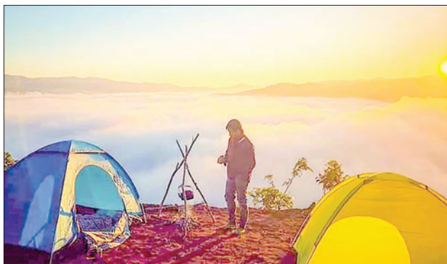
A camper enjoying the experience at a travel destination.