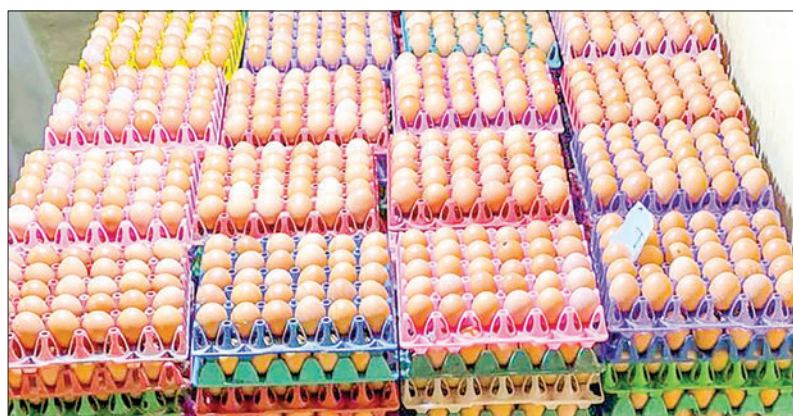
Card containers holding eggs displayed at the shopping mall.

When the egg prices decreased again, the shop offered the