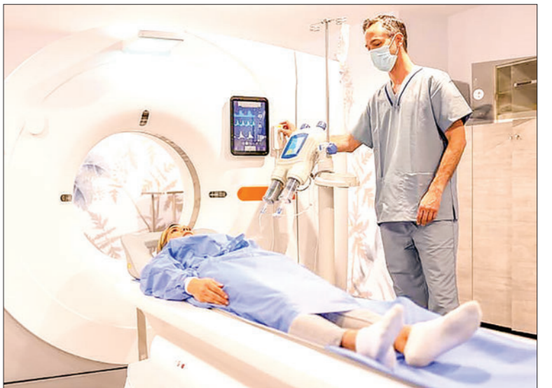
Magnetic resonance imaging may be used to diagnose breast cancer.