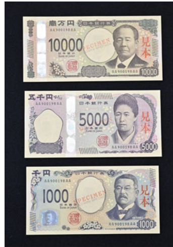
File photo taken April 2023 at the Bank of Japan’s headquarters in Tokyo shows samples of new banknotes scheduled to be issued from 3 July 2024.

At the end of December last year, 18.59 billion banknotes were in circulation, which is equivalent to about eight times the distance between the Earth and the Moon if they were lined up horizontally, according to the BOJ. — Kyodo