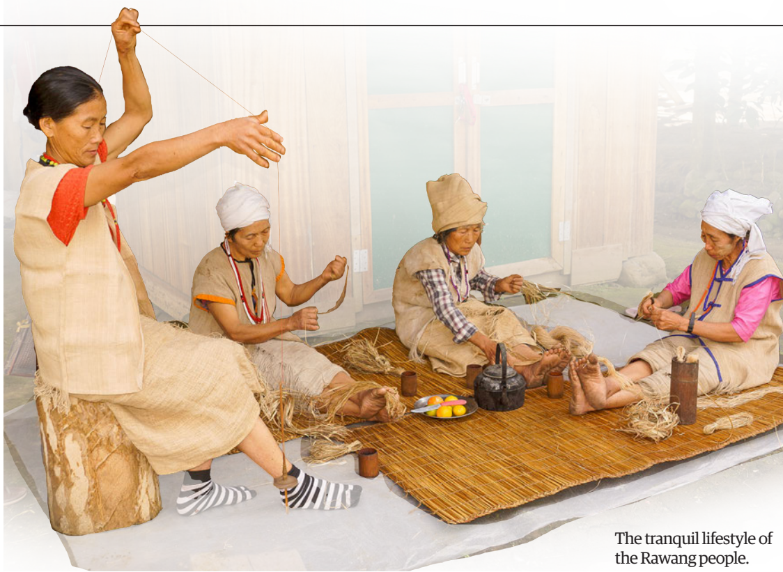
The tranquil lifestyle of the Rawang people.