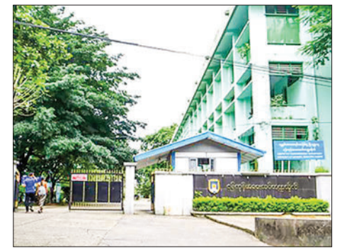
Yangon University of Distance Education.

Of the 161,850 individuals who took the matriculation exams in 2023, 109,850 candidates passed. Vocational degree colleges and universities began their programmes in November, and the launch of distance education degree colleges and universities will commence soon.