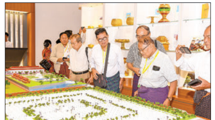
National Literary Award winners undergo medical checkups, visit Maravijaya Buddha Image