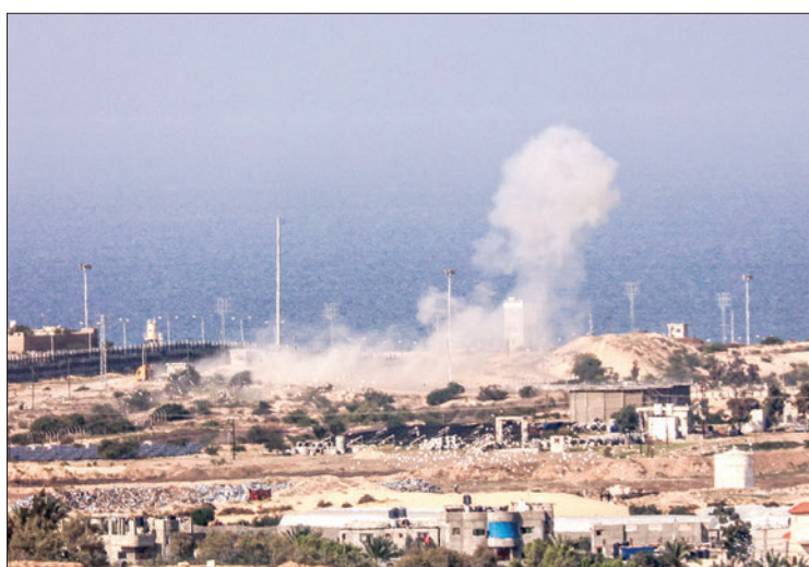
Smoke billows following Israeli strikes in Rafah near the Palestinian Egyptian border in the southern Gaza Strip on 12 December 2023 amid ongoing battles between Israel and the militant group Hamas. PHOTO: AFP

The UN humanitarian agency OCHA said earlier that "the hospital remains surrounded by Israeli troops and tanks, and fighting with armed groups has been reported in its vicinity for three consecutive days". — AFP