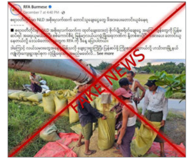
Screenshot validates misinformation.

Therefore, the news circulating on social networks is only false information published by the malicious media to mislead the Myanma Agricultural Development Bank and the farmers about the lending of agricultural loans. — MNA/KZL