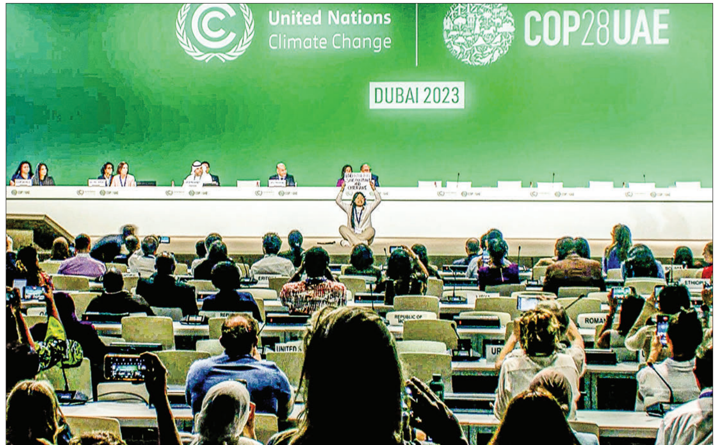
This image grab taken from AFPTV video footage shows an activist protesting on stage against fossil fuels during an event at the United Nations Climate Conference (COP28) in Dubai on 11 December 2023.

T HE United Arab Emirates promised Tuesday to try again to strike a deal as the Dubai climate summit passed their deadline, with at-risk nations and Western powers rejecting a proposal that stopped short of phasing out fossil fuels.