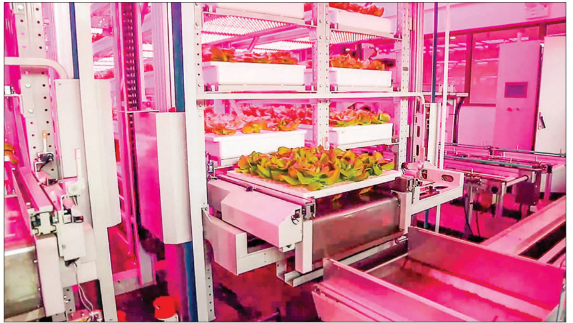
The picture shows the plant factory built at the Institute of Urban Agriculture at Chengdu, capital city of southwest China's Sichuan Province.

harvest high-quality grapes with high yields thanks to the root-limiting cultivation and precise control of water and fertilizers, in order to create and grow more fruits and vegetables in limited