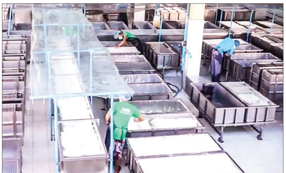
Workers engaged in export rubber processing on the production line.