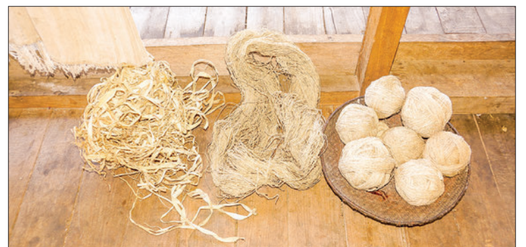
The Rawang people wear traditional clothes woven from Azi or hemp plant from generation to generation.

The Agriculture, Livestock and Rural Development Committee of Pyithu Hluttaw tried to amend the currently existing Narcotic Drugs and Psychotropic Substances Law in 2019 to legalize the plantation of Industrial Hemp, which is a type of cannabis plant. Industrial hemp contains