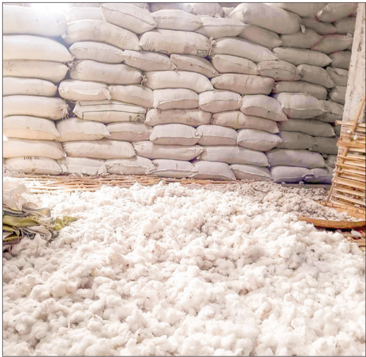
Cotton seen at a cotton grinding process mill.

Tender proposal forms can be obtained at the Department of Agriculture in Nay Pyi Taw commencing on 12 December, and the deadline for submitting proposals is 27 December. — TWA/ TMT