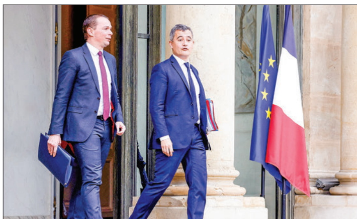
French Labour Minister Olivier Dussopt (L) and French Interior Minister Gerald Darmanin leave after a cabinet meeting at the presidential Elysee Palace in Paris on 12 December 2023.

FRANCE'S government insisted Tuesday it would implement tough measures against illegal migrants as it battled a political crisis following the rejection of its flagship immigration bill in the lower house of parliament.