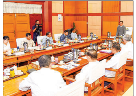
Myanmar Digital News receives tech-related equipment