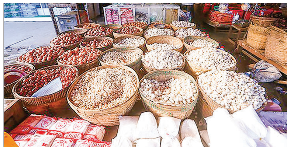
A retail outlet seen selling dry kitchen groceries.