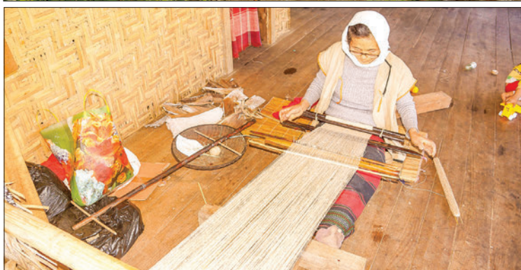
Above and top photos showcase a Rawang woman skilfully weaving traditional attire from hemp threads, offering a glimpse into the lifestyle of the Rawang people adorned in their cultural garments.