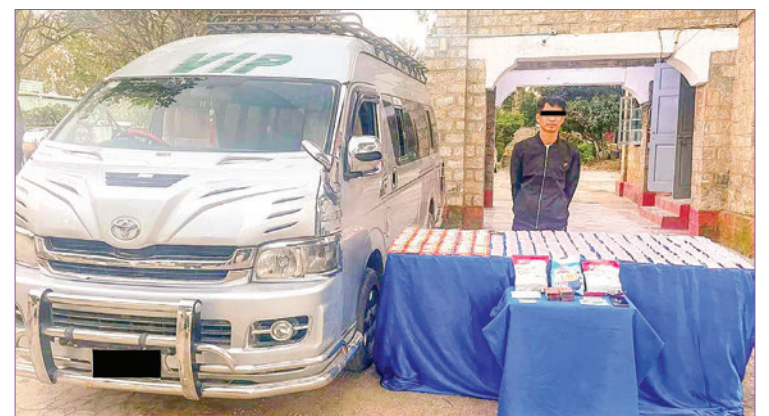
An arrestee seen with confiscated drugs and a vehicle.

The operation resulted in the seizure of 9.09 kilogrammes of happy water and 100 grammes of ketamine, valued at over K1 billion. Legal action has been taken against the offender, and an investigation is underway to identify the perpetrators of the crime chain. — MNA/MKKS