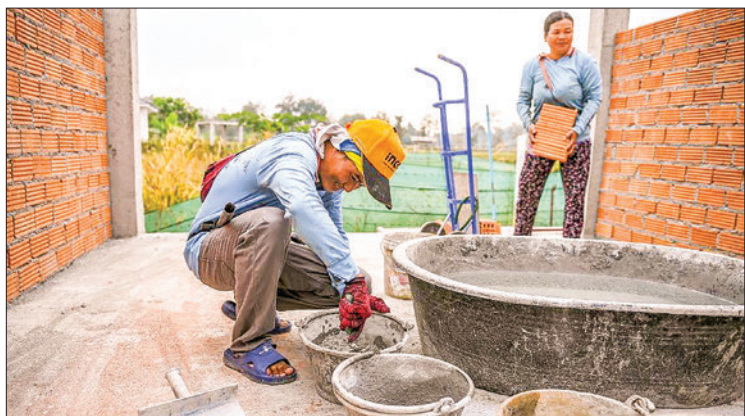
Myanmar migrant workers at a construction site in Thailand.

A considerable gap exists in access to healthcare for documented and undocumented workers from Myanmar in Thailand, according to a report by UNDP.