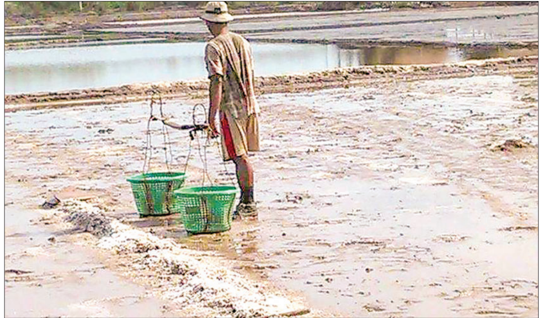
A salt worker inspecting the salt field in preparation for harvesting.