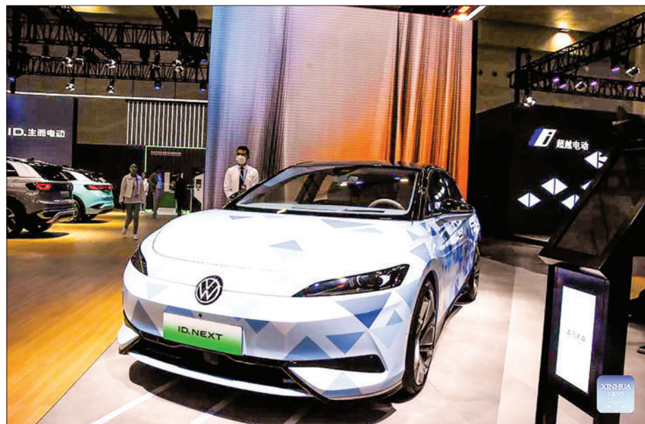
A Volkswagen ID.NEXT electric concept car is displayed during the 2023 World New Energy Vehicle Congress in Haikou, south China's Hainan Province, 7 December 2023.