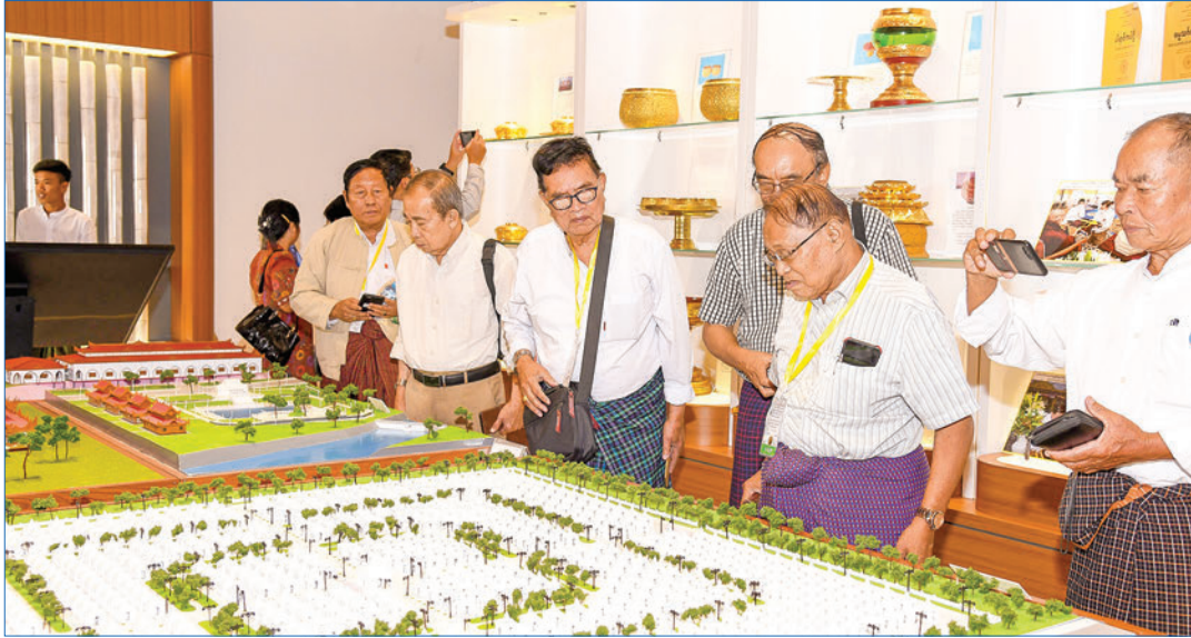
The literati are pictured during their observation tours in Nay Pyi Taw yesterday.

THE award-winning doyen writers staying in Nay Pyi Taw to attend the Ceremony of National Lifetime Awards for Literary Achievement and National Literary Awards for 2022 received medical checkups at Nay Pyi Taw's 1,000-bed General Hospital. They paid homage to the