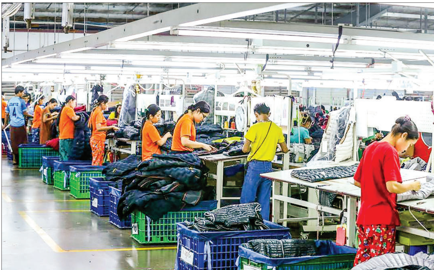
Employees work at a garment factory in Yangon on 12 May 2023. The export value from the manufacturing sector crossed US$6.185 billion in the past eight months of the current financial year 2023-2024, beginning 1 April.

T HE export value from the manufacturing sector crossed US$6.185 billion in the past eight months of the current financial year 2023-2024, beginning 1 April, the Ministry of Commerce's statistics showed.