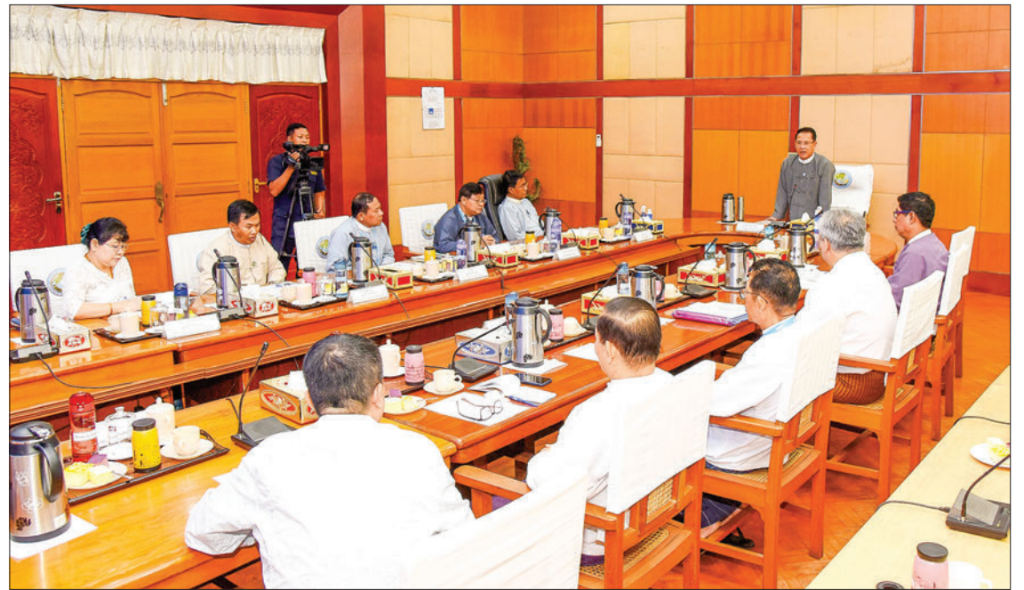
The technical equipment handover event in progress yesterday, attended by Union Minister U Maung Maung Ohn in Nay Pyi Taw.

The Union minister also highlighted the online version of Myanmar Digital News (MDN), such as Digital Newspaper and News Portal, and expressed