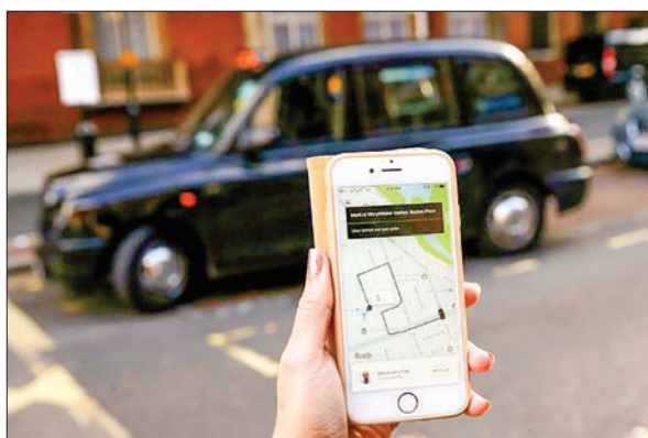
Uber has come into conflict with traditional 'cabbies', who accuse the service of undermining prices, workers' rights and safety standards. PHOTO: AFP/FILE

Uber launched in London over a decade ago, and has since provided over a billion trips in the UK capital. — AFP