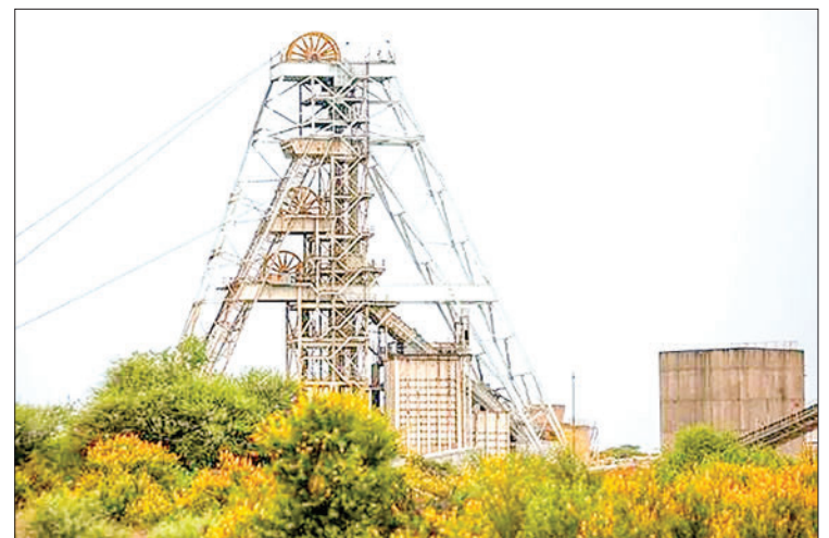
11 shaft at the Rustenburg platinum mine where 11 miners were killed and 75 injured when an elevator fell 180 metres.

There were 86 employees in the three-level lift when it "unexpectedly reversed direction and began descending back down through the shaft," Implats said in the statement. — AFP