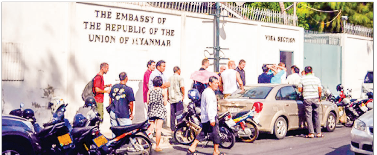
Myanmar citizens queued at the Myanmar Embassy in Bangkok last year to renew their passports.

The embassy emphasizes that individuals without a token for an appointment will not be accepted for passport renewal. — TWA/TMT