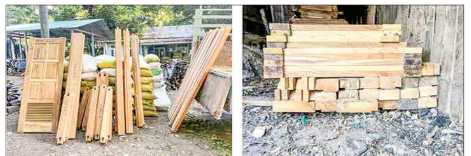
Confiscated illegal timbers in Sagaing Region.

On the same day, the joint teams impounded 560 gallons of informal diesel worth K940,800 without official documents in Monywa township, a total of 0.505 tonne of illegal teak worth K333,828 in Sagaing township and 0.497 tonne of illicit teak in Ottarathiri township. These