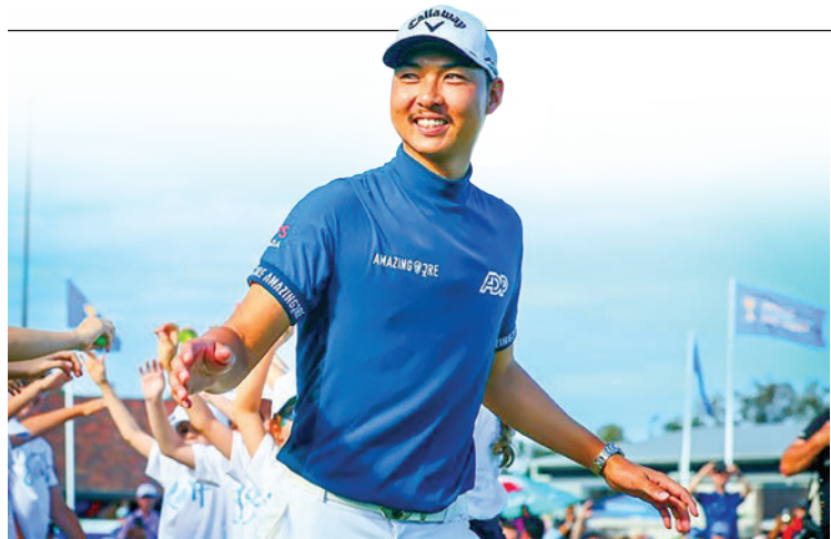
Min Woo Lee triumphed last week at Royal Queensland Golf Club. PHOTO: AFP

"Football fans have high expectations for the national team, (so) we have deemed it inappropriate to select Hwang Ui-jo for the national team." — AFP