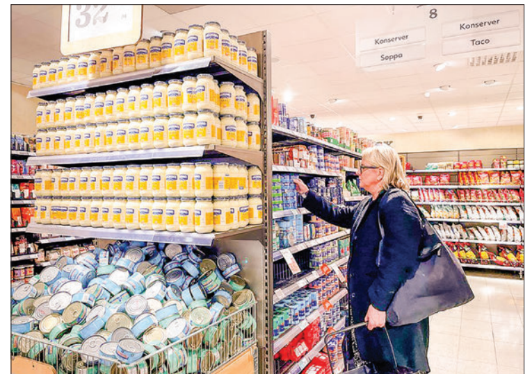
A woman shops at a supermarket in Stockholm, Sweden, 14 September 2022. PHOTO: HE MIAO/XINHUA/FILE

Household consumption shrank by 0.6 per cent in the third quarter from the second, while decreased industrial inventories contributed a negative 1.4 percentage points to the contraction. The country has been struggling with stubbornly high inflation for more than a year and a depreciating krona — prompting the central bank to successively raise its key rate to four per cent, its highest level in 15 years. Consumers have been hard hit by the higher prices and interest rates, with many households having mortgages with variable interest rates. — AFP