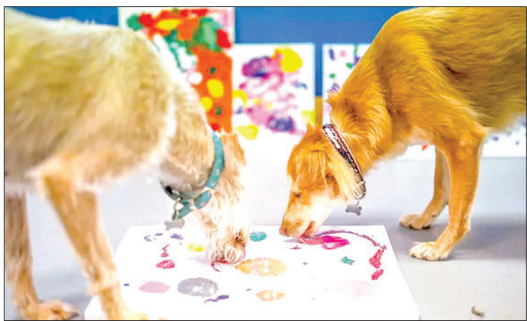
Former rescue dogs Alba and Rosie take part in an exercise to create a painting at the Bristol Animal Rescue Centre.

IN their studio in Bristol, western England, rescue dogs Rosie and Alba are hard at work on their canvases, redefining the essence of abstract art — one tail swish at a time.