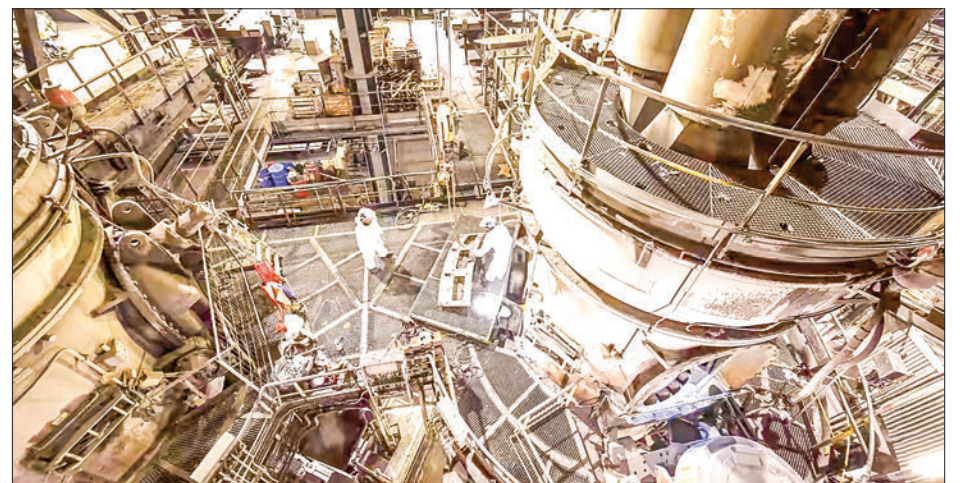
A power plant in eastern France. The EU's carbon border tax aims to level the playing field for European industries already forced to pay for their emissions.

It would also update a European pollutant release and transfer register known as E-PRTR. — AFP