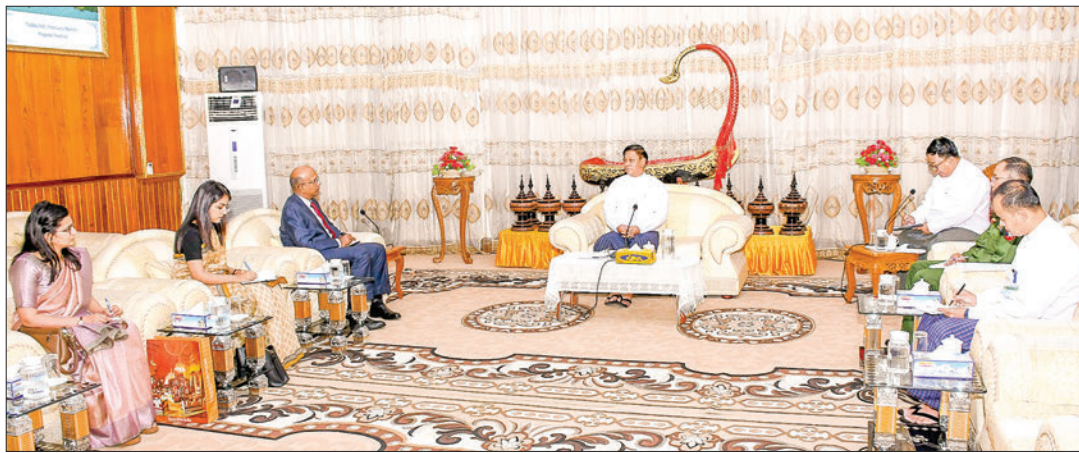
Member of the SAC, DPM and Union Minister for Defence Admiral Tin Aung San receives Indian Ambassador to Myanmar Mr Vinay Kumar yesterday in Nay Pyi Taw.