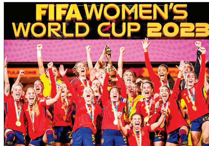
Revenue from women's sports events is predicted to surpass $1 billion in 2024.