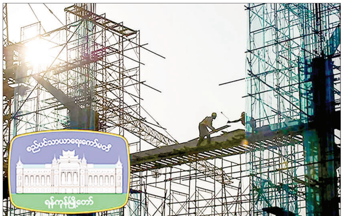
A construction site permitted within the YCDC municipal area.

contractors must include the Standard Operating Procedure (SOP) to communicate with the Electricity Corporation for access to electricity. Yangon Electricity Supply Corporation will invite licensed contractors to a meeting this week to install electricity meters in the buildings that have obtained the Building Completion Certificate (BCC). — TWA/TKO