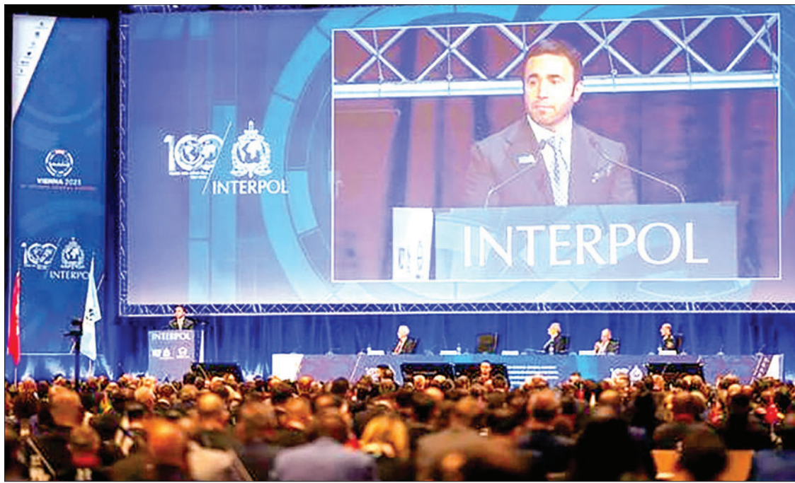
Interpol, short for the International Criminal Police Organization, is an international organization that facilitates cooperation among law enforcement agencies from different countries to combat transnational crime.

to step up controls after abuse of the notices led to criticism.