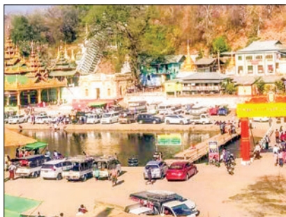
Pagodas in Magway Region including Myathalun and Mann Shwesettaw pagodas draw large crowds of pilgrims during the Buddha Pujaniya Festivals.