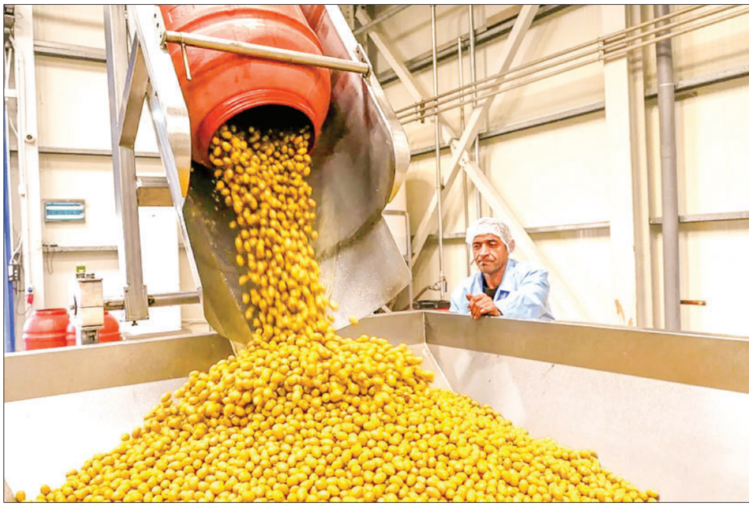
A worker of the olive industry looks on next to pouring green olives near Polygyros in Halkidiki region.