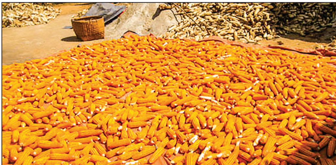
Corn seen being dried in the sunshine.

Thailand greenlit corn imports under zero tariff (with Form-D) between 1 February and 31 August. However, Thailand imposes a maximum tax rate of 73 per cent on corn imports to protect the rights of