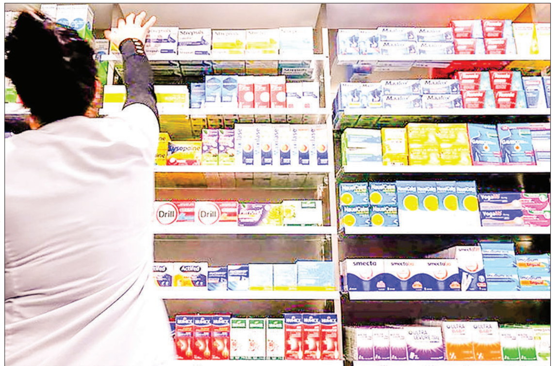
The survey was carried out in 14 countries, mostly in Eastern Europe and Central Asia.

The WHO's European region comprises 53 countries, including several in Central Asia. "All countries in our region