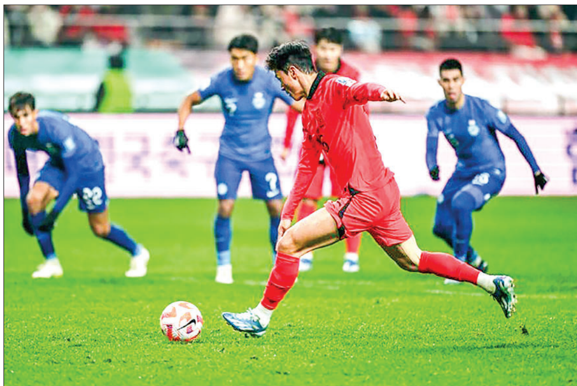
South Korea's forward Hwang Ui-jo scores a penalty against Singapore earlier this month.

The 31-year-old remains able to play for English second-tier club Norwich and scored in a 3-2