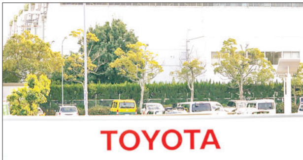
Toyota Motor Corp announced on Wednesday that its global production and sales reached record levels in October, with 900,285 cars manufactured worldwide, marking a 16.7 per cent increase from the previous year.

The pace of production picked up amid an easing semiconductor shortage, and its production outside of Japan increased 8.7 per cent to 617,590 cars, an all-time high for a single month, it said. — Kyodo