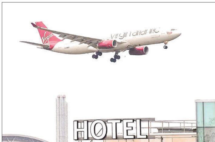
A Virgin Atlantic Airbus A330 passenger plane is seen above a hotel coming in to land at London Heathrow Airport in west London on 14 February 2021.

Sustainable Aviation Fuels are seen as the main tool for decarbonizing the sector over the coming decades, but the technology is still in its infancy and production remains very expensive.