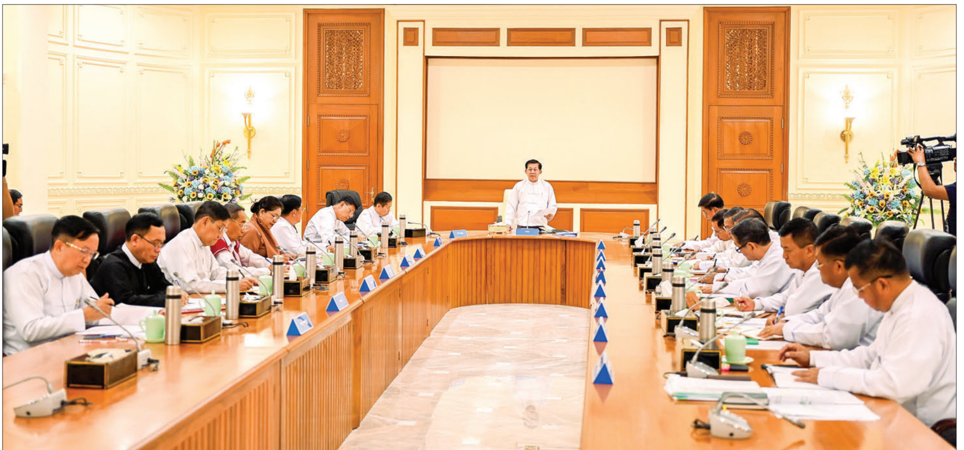
State Administration Council Chairman Prime Minister Senior General Min Aung Hlaing addresses the State Administration Council meeting 6/2023 in Nay Pyi Taw on 29 November 2023.

T ATMADAW, responsible for the State defence duty, will emphasize combatting insurgents, said Chairman of the State Administration Council Prime Minister Senior General Min Aung Hlaing.