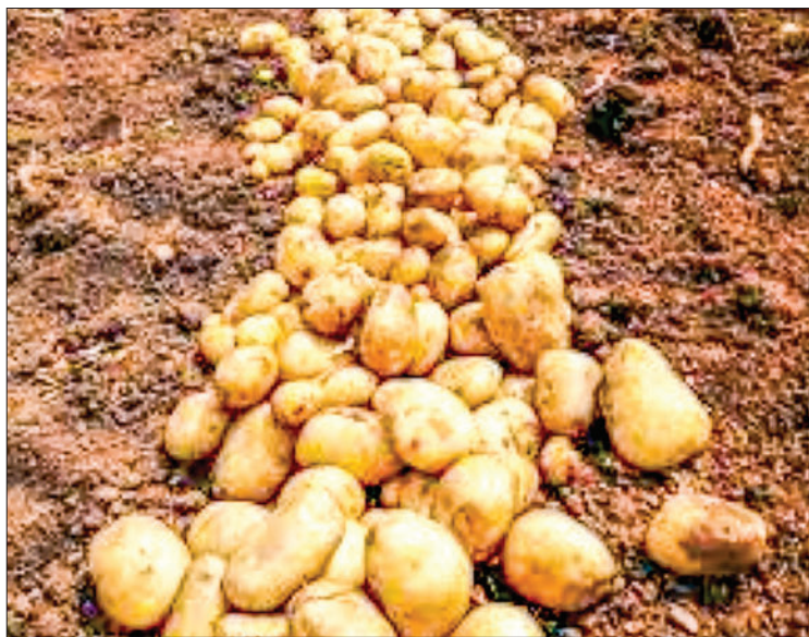
Harvested potatoes are seen in a field.

CHINESE potato price fell to K3,200 per viss on 29 November after hitting an all-time high of K4,200 per viss on 15 November.