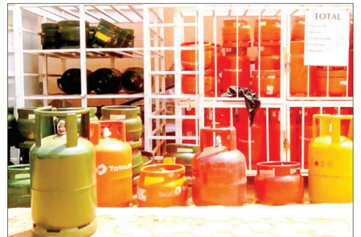
More Nigerian households have been turning to greener biofuels. PHOTO: AFP

Bioethanol gel releases far fewer harmful emissions into the atmosphere than traditional fuels. — AFP