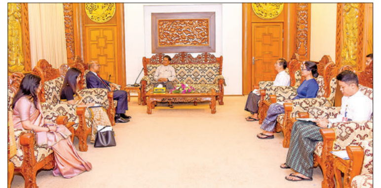
DPM and Union Minister for Foreign Affairs U Than Swe receives Indian Ambassador to Myanmar Mr Vinay Kumar yesterday in Nay Pyi Taw.

They cordially exchanged views on the further enhancement of existing traditional bonds of friendship and mutually beneficial cooperation between the two countries and closer collaboration for maintaining peace and stability, the rule of law and the development of the border areas between Myanmar and India. — MNA