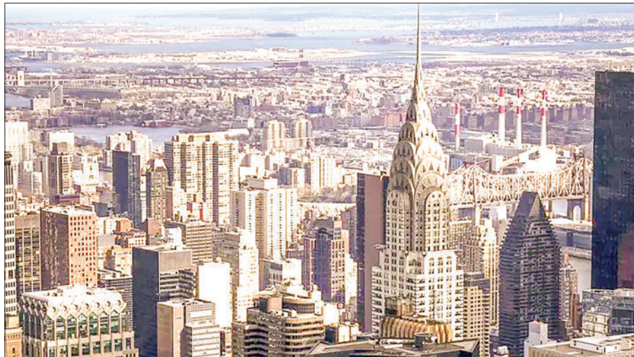
The Chrysler Building in New York City is one of the properties in the portfolio of Austria's real estate giant Signa, which is seeking court protection to restructure its operations.

Rene Benko — one of Austria's richest men —