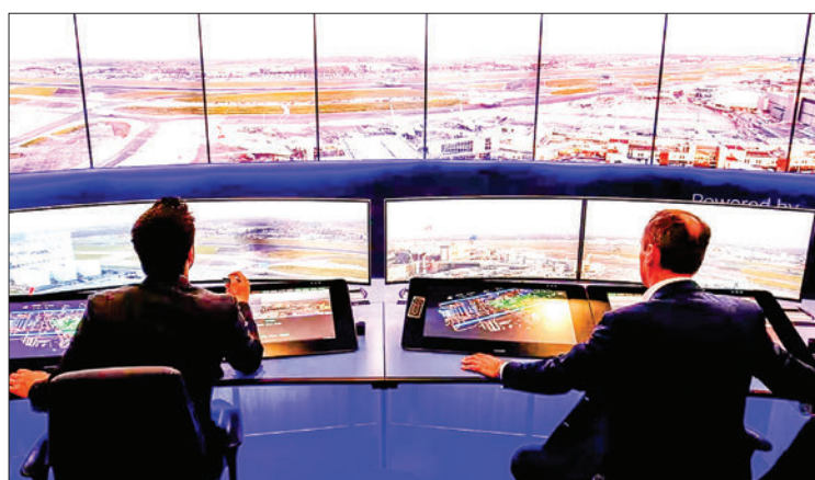
Ferrovial, a Spanish infrastructure company, is selling its remaining 25 per cent stake in London's Heathrow Airport to a French private equity group, Ardian, and Saudi Arabia's sovereign wealth fund, the Public Investment Fund (PIF), in a £2.37 billion ($3.01 billion) deal after 17 years of ownership

London's Heathrow Airport is undergoing a significant ownership change as Spanish infrastructure giant Ferrovial finalizes the sale of its remaining 25 per cent stake to a French private equity group and Saudi Arabia's sovereign wealth fund.