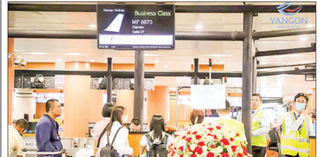
File photo shows travellers queuing with their luggage in front of a conveyor at Yangon International Airport.

THE Ministry of Hotels and Tourism said they will invite Chinese tourists to enjoy FAM Trip to Yangon, Bagan and Mandalay destinations in January 2024.