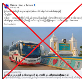
Screenshot validates a fabricated story.

Therefore, the malicious media intentionally spread false information to affect peace and stability and cause misunderstanding against service personnel serving their assigned duties so that residents can live peacefully. — MNA/KTZH