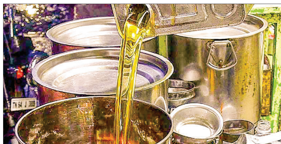
The photo shows the edible oil shop in the market.

To deal with the overcharging, the Consumer Affairs Department under the Ministry of Commerce informed the consumers of lodging the complaints for overcharging through the call centre's hotline in late August. The Department urged consumers not to buy palm oil at high prices. The Department is making concerted efforts to steer the high volatility in palm oil prices in the retail market and offer fairer prices to consumers in coordination with the Myanmar