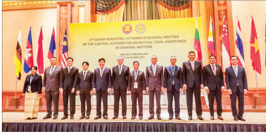
Union Minister for Legal Affairs Union Attorney-General Dr Thida Oo (L) poses for the group documentary photograph at the meeting in Brunei yesterday.

Since the legal systems of the countries are different, cooperation among respective