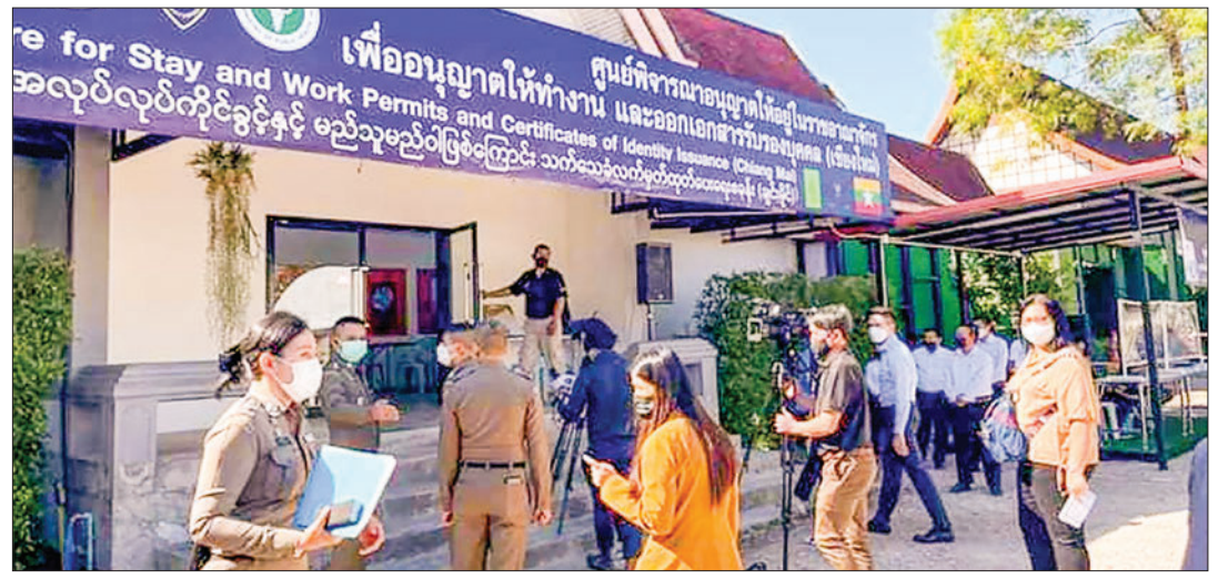
The photo shows the certificate of identity (CI) issuing office in Thailand.

Out of nearly 500 agencies that have obtained licences to send workers abroad from Myanmar, 150 agencies of which are authorized to send workers to Thailand. — TWA/MKKS