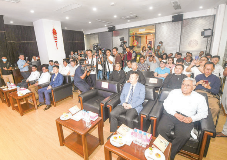
Union Information Minister U Maung Maung Ohn unveils the Chinese Film Week event yesterday in Yangon.

nificant historical milestones through cooperation in various sectors. The two countries fostered a bilateral relationship rooted in music and art, dating back to the Chinese Tang Dynasty and Myanmar Pyu Era. The Myanmar diplomat Pyu music troupe played a crucial role in promoting friendship between the two nations in China, utilizing music and art in 802 AD. This friendship laid the founda-