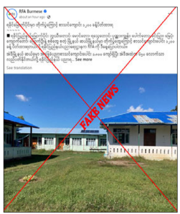
A screenshot exposing false information on school closures in Rakhine State.