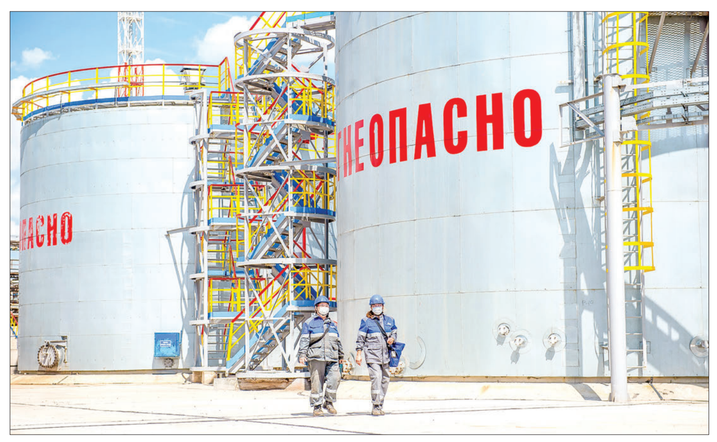
Russia is a major supplier of energy commodities, including oil and gas, contributing significantly to the global energy market.

MID mounting Western pressure, Russia and China are strengthening their economic ties, with the volume of trade expected to rise to $300 billion by the end of this decade, Russian First Deputy Prime Minister Andrey Bel-