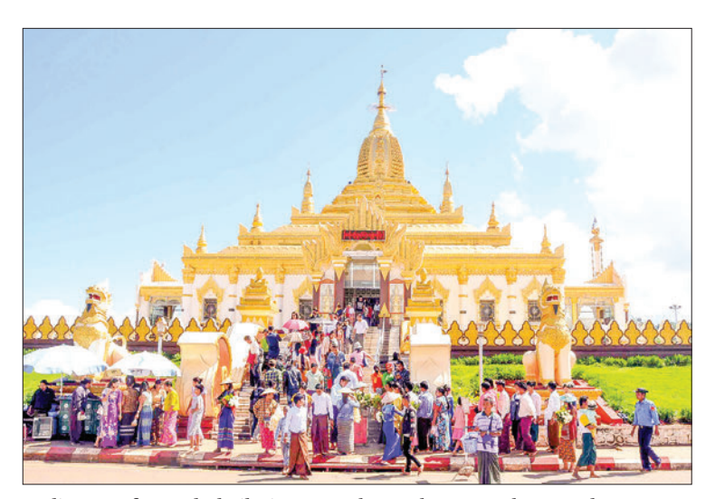
A glimpse of crowded pilgrims at Maha Anthtoo Kantha Pagoda.