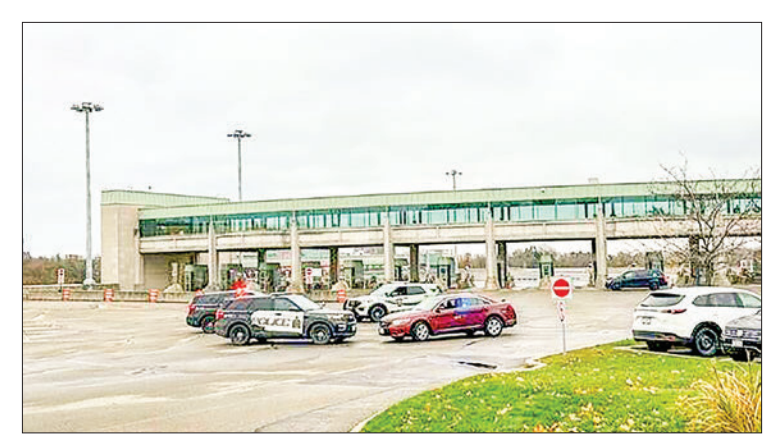
Canadian police secure the area near the Rainbow Bridge border crossing after a car exploded at the US-Canada checkpoint.

The blast happened at the major Rainbow Bridge cross-