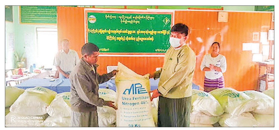
The Agriculture \ Department\ in\ Chaung U\ Township\ sells\ chemical\ fertilizer\ and\ quality\ seeds\ to\ farmers.

COOPERATIVE societies sold K5.09 billion worth of chemical fertilizers, seeds and pesticides to farmers in 78 townships in October, according to the Ministry of Cooperatives and Rural Development.