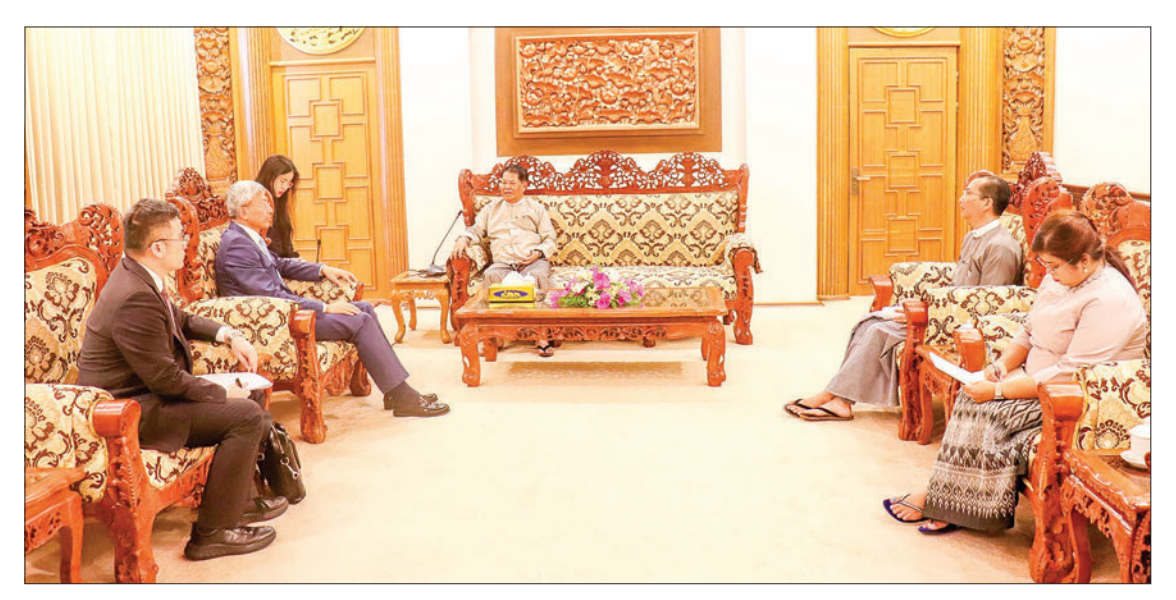
Deputy Prime Minister MoFA Union Minister U Than Swe receives Chinese Ambassador Mr Chen Hai yesterday.

U Than Swe, Deputy Prime Minister and Union Minister for Foreign Affairs of the Republic of the Union of Myanmar, received Mr Chen Hai, Ambassador of the People's Republic of China to Myanmar, yesterday at the