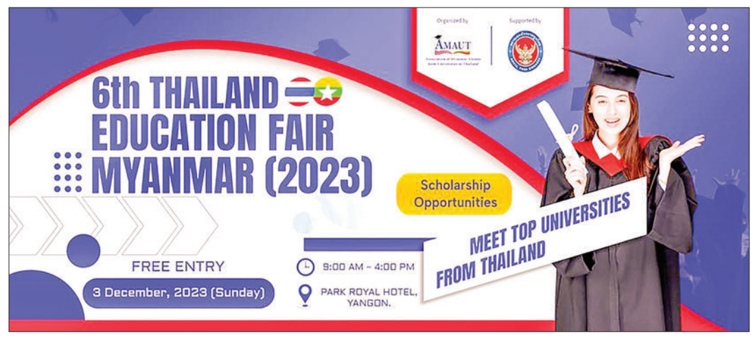
An advert of the Sixth Thailand Education Fair Myanmar 2023.

At the exhibition, officials from 12 famous universities in Thailand will hold direct discussions with visitors, and Myanmar students who want to attend universities in Thailand will be able to choose and study the information provided by the universities displayed at the exhibition in one place. — ASH/TKO