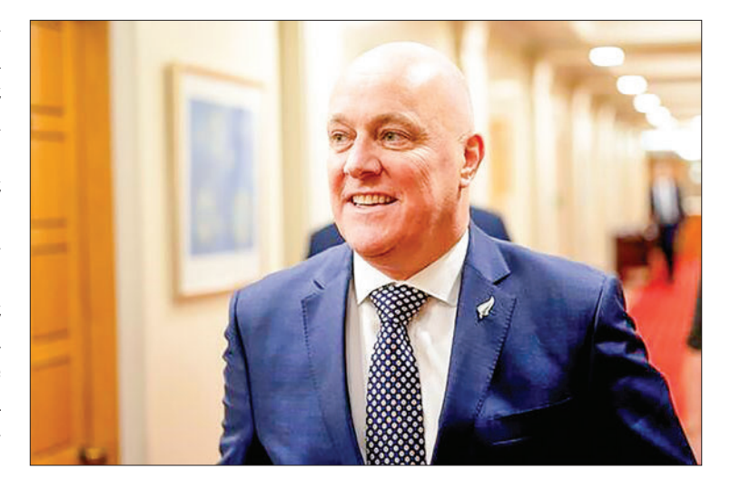
New Zealand's incoming Prime Minister Christopher Luxon expects the agreements to form a three-party coalition government to be signed on Friday.

"At which point, I'll talk again to the governor-general and formally confirm that we're