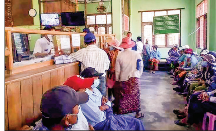
Farmers seen waiting to take out loans at the MADB.

Each farmer can borrow up to K70 million, with repayments available through short-term instalments spanning three years and long-term instalments of five years. — TWA/NT