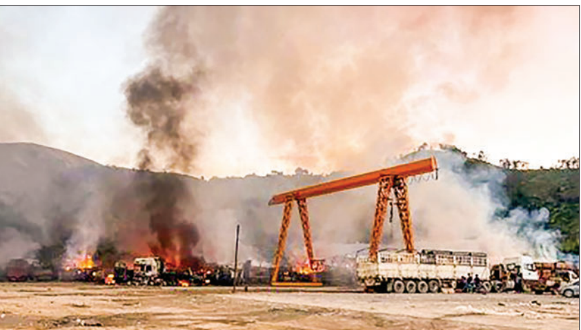
(L & R): Firefighters battle flames and debris after terrorist attacks on the Sino-Myanmar border.

MNDAA, TNLA and PDF terrorists are utilizing drop bombs in attacks to stop the flow of goods in the Shan State (North) and to undermine the peace and stability of the region by firing and attacking non-military targets.