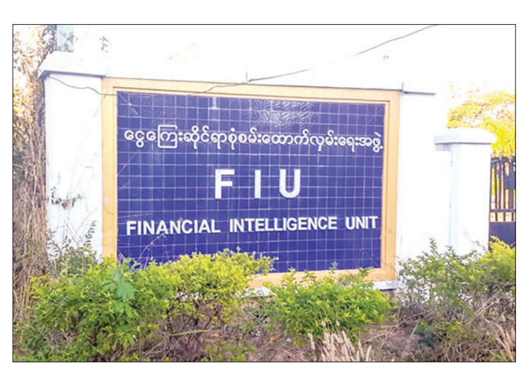
The Financial Intelligence Unit - FUI Office (Nay Pyi Taw).

The four critical factors encompass adherence to the supervisory guidelines of the Mobile Financial Services Supervisory Committee by mobile banking service providers. Additionally, prosecuting entities must take action against accounts discovered to be linked with counterfeit citizenship scrutiny cards. Suspicious financial transactions are to be reported to the Financial Intelligence Unit (FIU), and a list of bank accounts and mo-