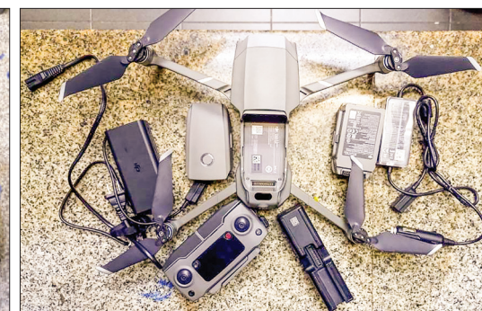
(L & R): Unmanned aerial vehicles (UAVs) or drones and remote controls.