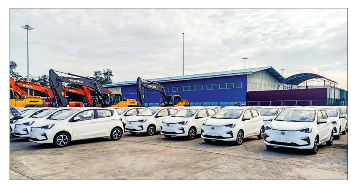
Newly arrived battery electric cars unveiled at Yangon Port.

CHINA-MADE Neta U, Neta V EVs, Leapmotor T03 (Luxury) EVs, BYD Atto3 EVs, Aiqar Arrizo E EVs and Changan Benni E-Star EVs, imported with the approval of the Steering Committee on Na-