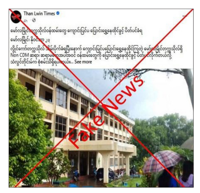
A screenshot of misleading report regarding Mawlamyine University.

Contrary to these claims, the meeting held on 16 November was a routine gathering, and there was no decision to restrict faculty members' movement. The misinformation being spread on social media platforms appears to be a deliberate attempt to cre-