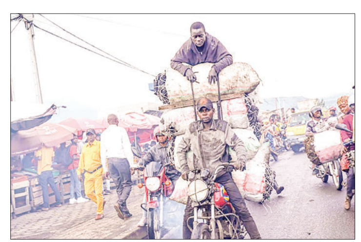
Charcoal is commonly used for cooking in DR Congo and local supplies must now take a long road through militia-riddled areas to reach the regional capital Goma.

DR Congo's president, who is seeking re-election, came to