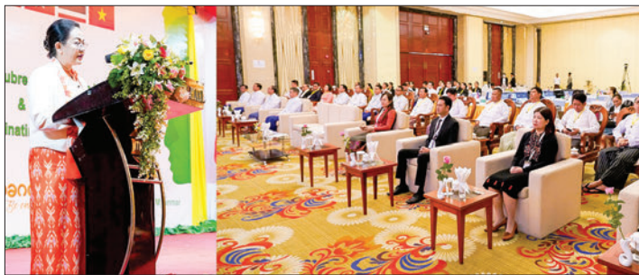
Union Minister Dr Thet Thet Khine addresses the MSR tourism meeting yesterday in Nay Pyi Taw.

MYANMAR held the 52 nd Meeting of the Greater Mekong Sub-Region Tourism Working Group and the Mekong Tourism Coordinating Office Board Meeting via a hybrid system at Mingala Thiri Hotel in Nay Pyi Taw yesterday.