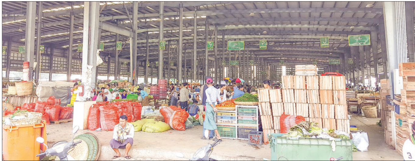
A general view of the Danyingon Wholesale Market in Yangon where seasonal fruits are traded.

MYANMAR Agro Exchange Public Ltd (MAEX) will soon open two more facilities for dried and green commodities at the Danyingon wholesale market with over 1,900 stalls.