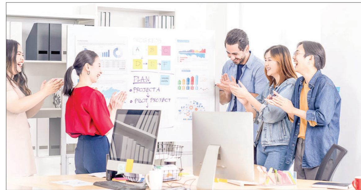
Asian colleague male and female friends in casual dress meeting work together with happiness at a successful brainstorming workplace.

can tackle the assigned issues. But, such kinds of chance will not appear many times. Sharpened employees can seek the chance and assess the opportune time when they should express their skills and capacity. Those who are sharpened and active to serve their duties and have skills to tackle assigned issues can contribute much to their workplaces as well as themselves. Such outstanding employees will have rewards in