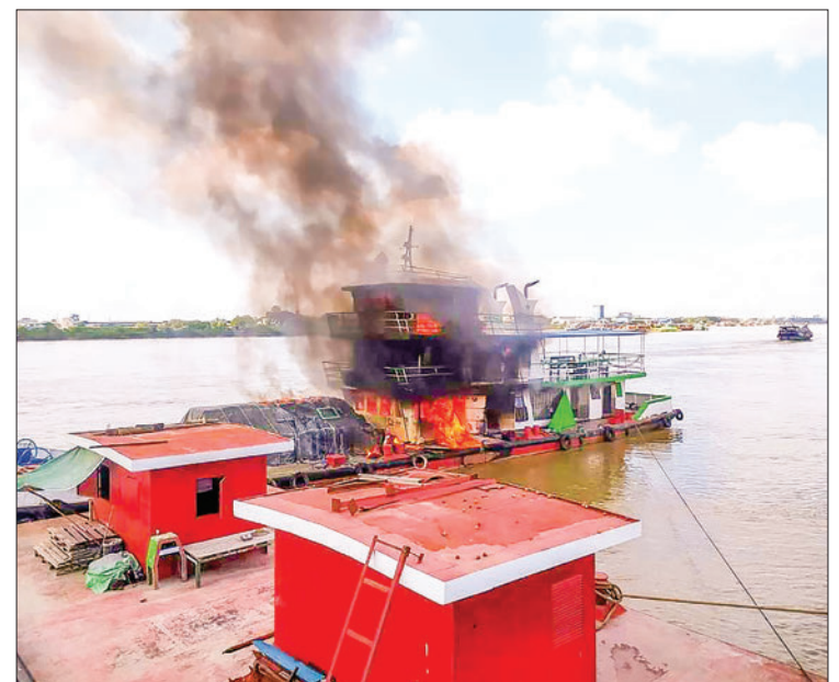
Vessel laden with cement cargo engulfed in flames.

Similarly, the two deceased individuals were conveyed to Insein General Hospital with the help of the Kanaung social assistance association. The cause of the fire is currently under investigation. — TWA/MKKS