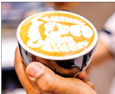
A cup of Myanmar's coffee.

products like Franchise Village that will bring together leading brands seeking to expand in the region and investors enthusiastic about establishing branches of renowned coffee brands. That platform will reinforce the role of the World of Coffee as a key event in exploring growth and collaboration opportunities.