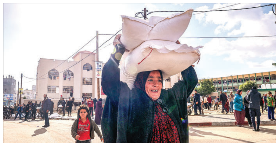
Palestinians receive bags of flour at the United Nations Relief and Works Agency for Palestine Refugees (UNRWA) distribution centre in the Rafah refugee camp in the southern Gaza Strip on 21 November 2023 amid ongoing battles between Israel and the Palestinian Hamas movement.

NEGOTIATIONS to free hostages seized in Hamas’s 7 October attacks on Israel are at their “closest point” to a deal and have reached the “final stage”, mediator