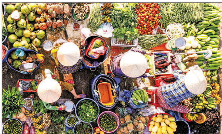
This aerial photo shows vendors selling vegetable at Vi Thanh market in Hau Giang province on 25 October 2023.

VIET Nam's vegetable export revenue is forecast to reach about 1-1.5 billion US