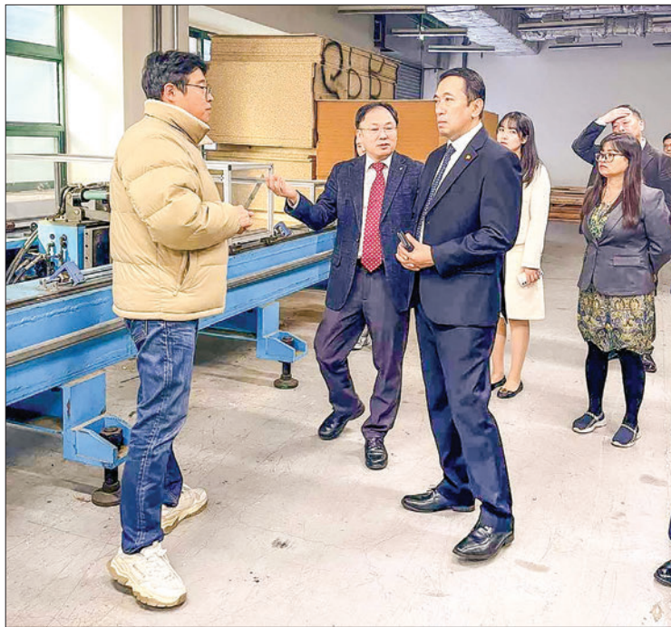
The bilateral meeting between Myanmar and the ROK.