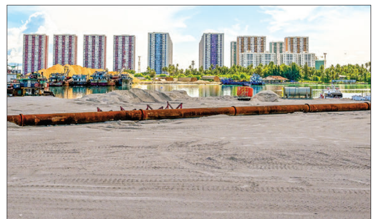
A general view of the island of Hulhumale, in the south of North Male Atoll, Maldives on 16 November 2023. PHOTO: AFP

But Muizzu, 45, while asking for $500 million in foreign funding to protect vulnerable coasts, said his citizens will not be leaving their homeland. — AFP