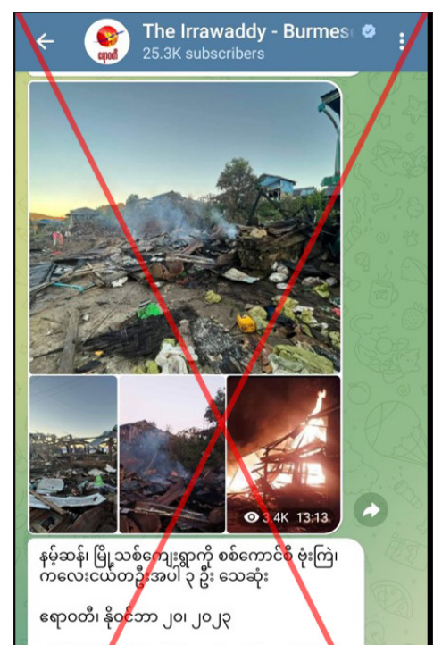
Screenshot validates viral spread of false news regarding Tatmadaw airstrike on social media.

Tatmadaw did not launch airstrikes in those areas, and the false information outlets that do not support the counter-terrorist operations of Tatmadaw and people spread false news and misinformation to cause dissension between the people and Tatmadaw. — MNA/KTZH