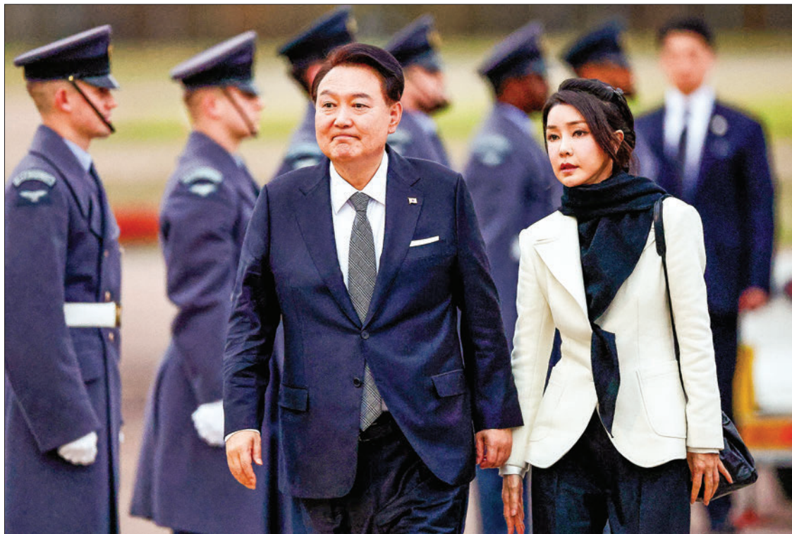
South Korea's President Yoon Suk Yeol and his wife Kim Keon Hee disembark from an aircraft after landing at London Stansted Airport on 20 November 2023 for a three-day state visit to the UK.

The UK government is keen to strike new deals with countries around the world following its departure from the