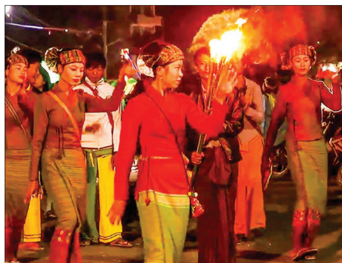
Kalaw damsels delight in annual Lighting and Fire Tower Festivals in the previous years.