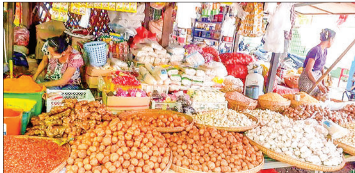
A retail shop seen selling kitchen dry groceries.

The wholesale prices of chilli peppers were K6,000-K95,000 per viss for long chilli pepper and Mohtaung variety. The long chilli processed in cold storage fetched K12,000-K15,000 per viss. The prices of bell peppers from the Sinphyukyun area and delta regions were K19,500-K23,000 per viss.