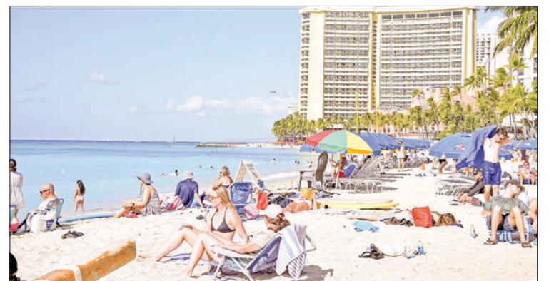
Tourists soak up the sun at Waikiki Beach in Honolulu on Hawaii's Oahu island on 17 November 2023.

travel more convenient and in turn boosting local economies that have seen a downturn in tourists from Japan since the coronavirus pandemic. The plan would include the island of Maui, which was devastated in August by wildfires that left more than 100 people dead or missing. "It's very important that people travel to Maui because our recovery will be accelerated if people do visit anywhere in Maui, anywhere at all," Green said during a recent visit to Japan. — Kyodo