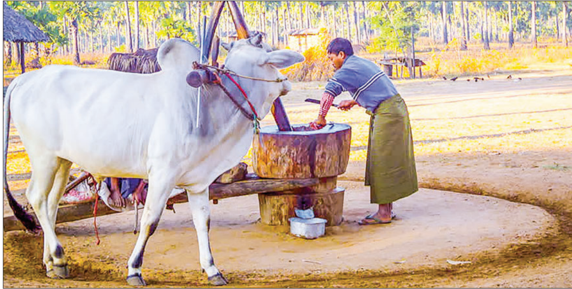
The photo shows the traditional production of peanut oil by a cow-driven oil mill in the central Myanmar region.

The gap between peanut oil wholesale price in the Mandalay market and the wholesale reference price for palm oil is estimated at K6,000-K7,000 per