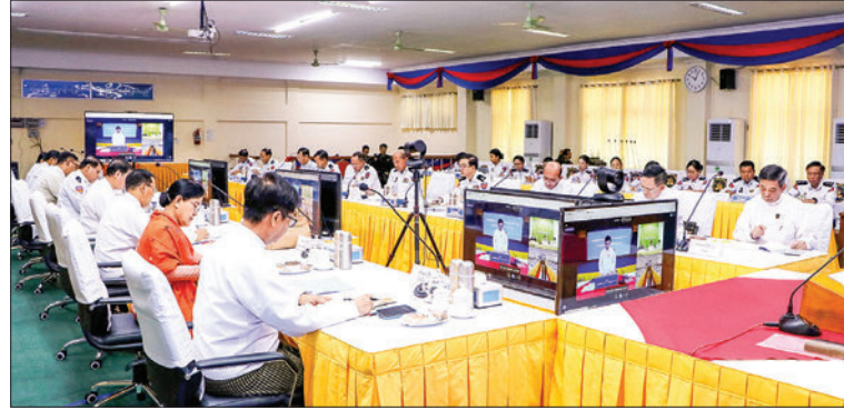
Union Minister U Myint Kyaing chairs the meeting 3/2023 of the Immigration and Citizenship Verification Work Committee yesterday in Nay Pyi Taw.

Despite that decision, the Rakhine State Stability, Peace and Development Work Coordination Committee decided to accept over 2,800 people under the pilot project, and it found out further 300 families of these 2,800 people. The Bangladesh side requested the verification group to inspect in Go and Talk trip and