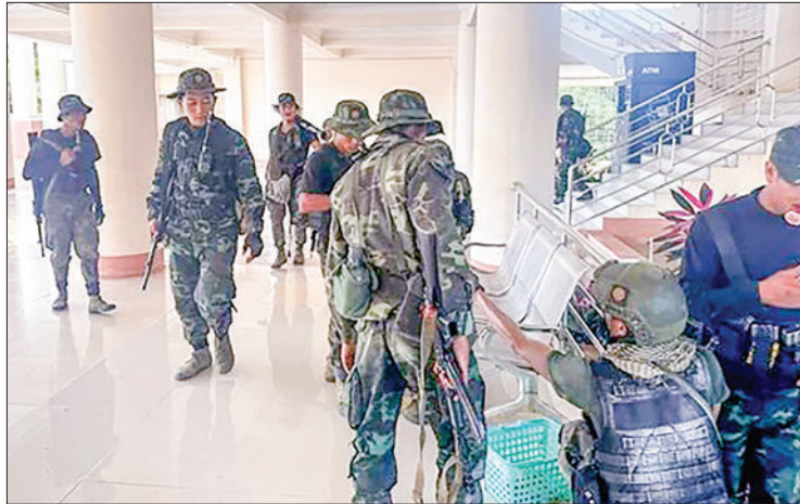
Online images validate KNPP and PDF terrorists' raid on Loikaw University, a non-military facility.

It was also found out that they broadcast false news that they rescued faculty members, families and the rector and placed them safely even though they forcefully seized them and video files of faculty members