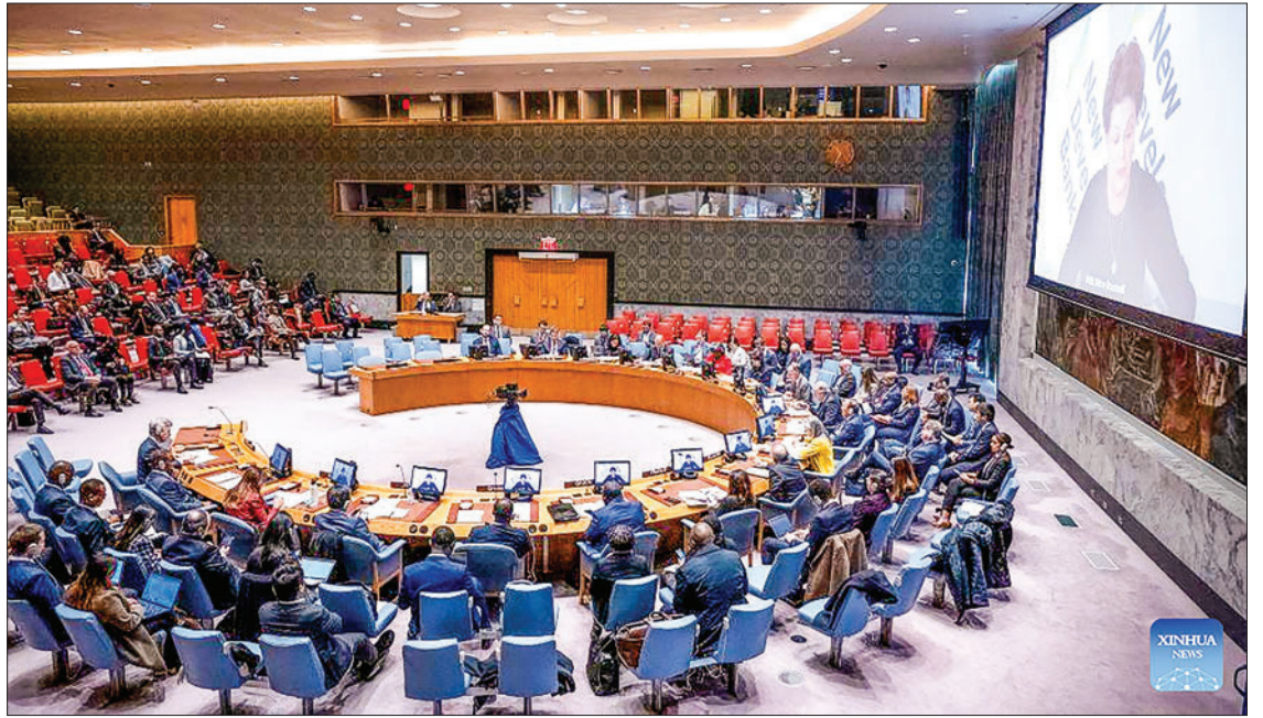
Representatives attend a UN Security Council open debate on promoting sustainable peace through common development at the UN headquarters in New York, on 20 November 2023.

“Nine of the ten countries with the lowest Human Development Indicators have experienced conflicts or violence in the past ten years,” he noted. — Xinhua