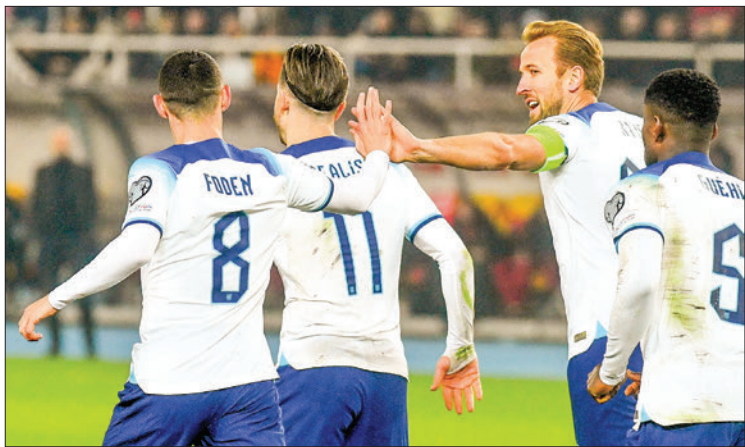
England's striker (20) Harry Kane (2R) celebrates a goal with England's midfielder (8) Phil Foden during the UEFA Euro 2024 group C qualification football match between North Macedonia and England at National Arena "Todor Proeski" in Skopje on 20 November 2023. PHOTO: AFP

"The really big results were in March against Italy and Ukraine. It meant coming here was a completely different test," he said. "I thought that given we had already qualified and everything had been achieved the mentality of the players was excellent. — AFP