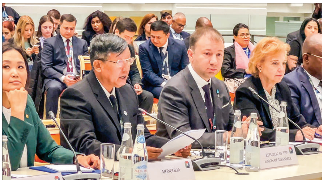
Union Minister U Tin Oo Lwin participates in the Ninth St Petersburg International Cultural Forum in St Petersburg, the Russian Federation, on 16-18 November 2023.

MYANMAR delegates participated in the Ninth St Petersburg International Cultural Forum and engaged in three discussion topics, as reported by the Ministry of Religious Affairs and Culture.