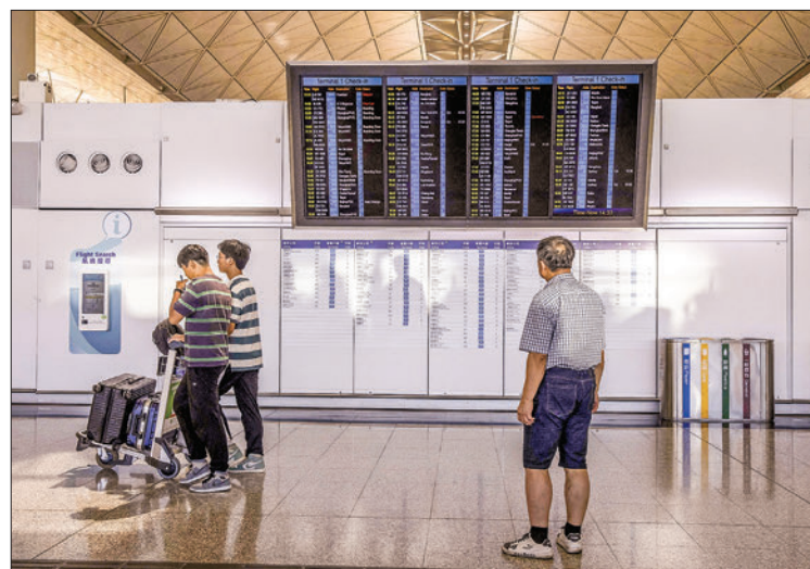
A man (R) looks at an information board at Hong Kong International Airport on 6 July 2023. PHOTO: AFP

Revenue was $4.7 billion, up 6.0 per cent from the equivalent period last year and beating predictions by Bloomberg analysts who had estimated a growth of 5.1 per cent. “Baidu reported solid third-quarter financial results, demonstrating resilience in a challenging economic climate,” Baidu’s CEO Robin Li said in a press release. — AFP