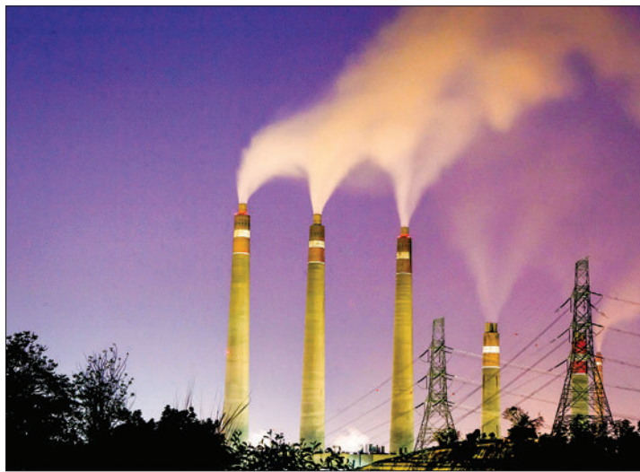
Smoke rises from the chimneys of the Suralaya coal-fired power plant in Cilegon on 14 September 2023.

INDONESIA on Tuesday launched an investment plan to attract $20 billion pledged by Western nations in a renewable energy transition pact agreed last year for the archipelago to slash emissions and wean itself off coal. The roadmap, which comes less than two weeks before the COP28 summit in Dubai, outlines Jakarta’s vision to reach net-zero power sector emissions by 2050 using cash from the Just Energy Transition Partnership (JETP).