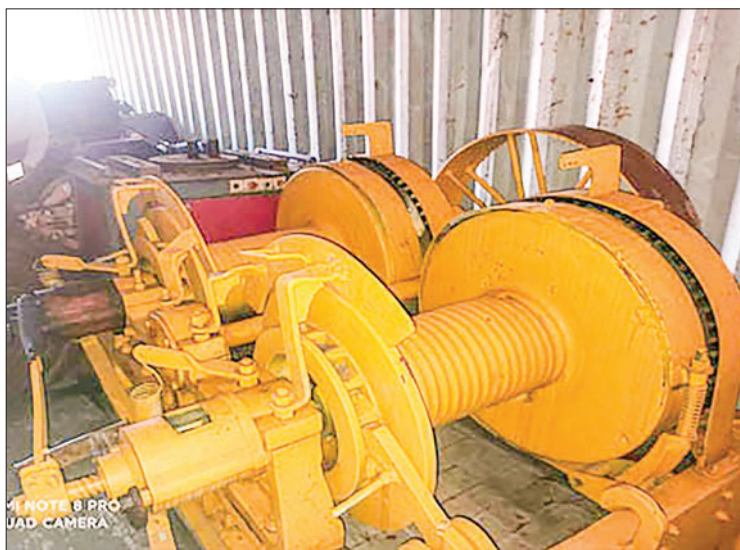
Seized illegal machinery at the Thilawa Port terminals.

Additionally, the joint team confiscated 60 bottles of Two-Shrimp palm oil (one litre) worth K330,000 in Pakokku township, a total of 1.268 tonnes of illegal teak, and 0.505 tonnes of other timber valued at K138,232 in Minbu district. They also seized a Nissan Diesel truck (estimated