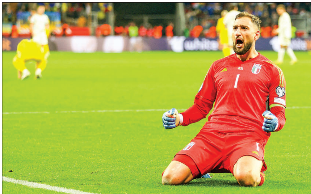
Italy's goalkeeper (1) Gianluigi Donnarumma celebrates at the final whistle of the UEFA EURO 2024 Group C qualifying football match between Ukraine and Italy at the BayArena Stadium in Leverkusen, western Germany on 20 November 2023.