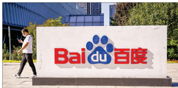
(FILES) An employee walks past the company logo at Baidu’s headquarters in Beijing on 6 September 2022. Chinese internet giant Baidu on 21 November 2023 announced modest year-on-year revenue growth of 6.0 per cent in the third quarter of 2023, beating analyst expectations.

The conference, jointly held by the Hong Kong Trade Development Council and the HKSAR government on 21-22 November, focuses on diversified strategies to cope with the changes and uncertainties in global trade, and at the same time, promotes Hong Kong globally. — Xinhua