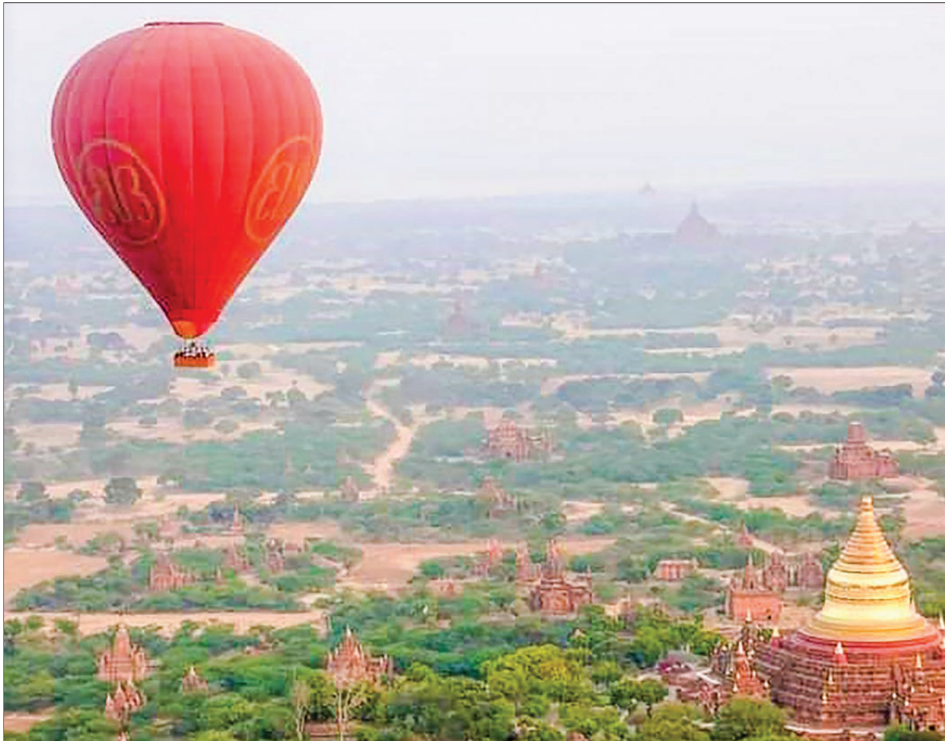
Hot-air balloon flight services are currently operational to local and foreign visitors.