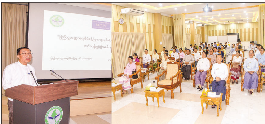
Deputy Prime Minister Union Planning & Finance Minister U Win Shein addresses the opening event yesterday in Nay Pyi Taw.

Deputy Prime Minister and Union Minister U Win