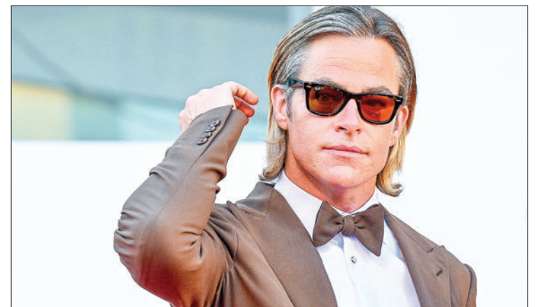
US actor Chris Pine arrives on 5 September 2022 for the screening of the film “Don’t Worry Darling” presented out of competition as part of the 79th Venice International Film Festival at Lido di Venezia in Venice, Italy.

FROM Cruella de Vil to Scar, Disney has created many of cinema’s most memorable villains — but bombastic baddies have been notably absent from the studio’s recent hits.