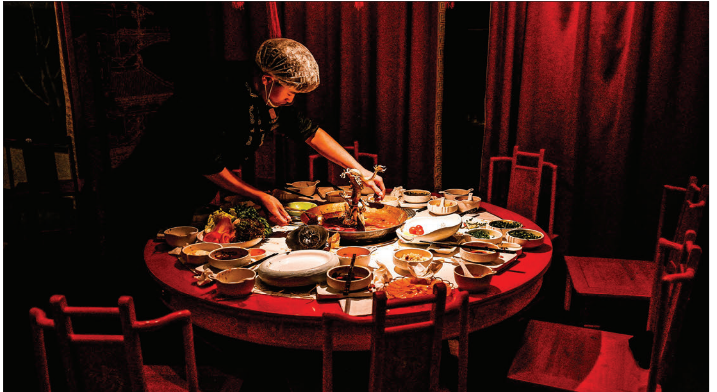
This photo taken on 21 October 2023 shows a restaurant employee taking away a pot of oily broth, which will be recycled, at an eatery in Chengdu, China’s southwest Sichuan province.

Donning thick aprons and elbow-length rubber gloves, collectors then