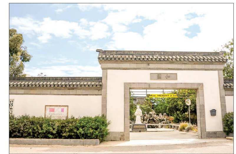
Photo taken shows the entrance of the Mediterranean Regional Centre for Traditional Chinese Medicine (MRCTCM), in Paola, Malta, 7 May 2022.

Since 1993, the Chinese government has sent 19 medical teams to Malta, treating approximately 250,000 patients. In 1994, China and Malta signed an agreement to cooperate on TCM