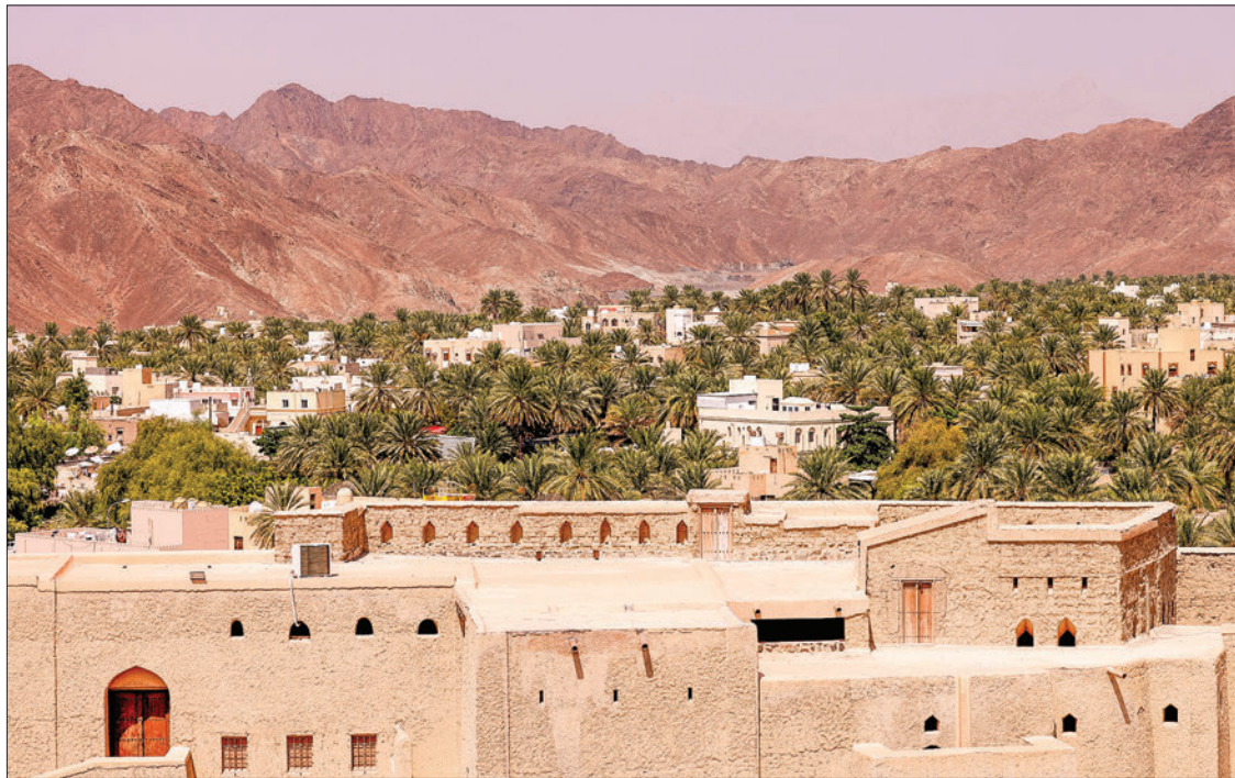
A picture shows a view of Bahla Fort, one of four historical forts located at the foot of the Green Mountain highlands of Oman, and the only fort in the country designated a UNESCO Heritage Site, in Bahla, 200 kilometres north of Muscat, on 5 October 2023.

Here, in one of Oman’s oldest inhabited settlements, belief is firm in jinn, which are described