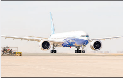
A Boeing 777-9 jetliner aircraft is pictured on the tarmac during the 2023 Dubai Airshow at Dubai World Central - Al-Maktoum International Airport in Dubai on 13 November 2023.