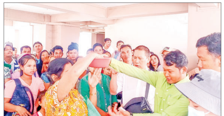
A drawing-lots event in progress for the Thukha Dagon housing on 13 November 2023.

The drawing lots for 1,376 apartments in 86 buildings will be held in April 2024, and applications for it will be sold in February 2024. — TWA/MKKS