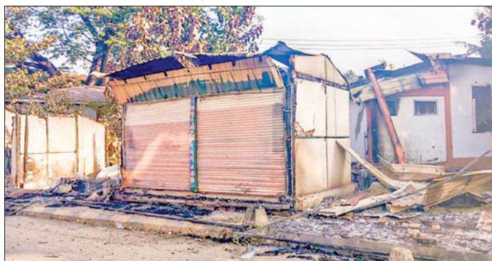
(L&R) The debris seen in the aftermath of the brutal attacks on civilian buildings by KIA and PDF terrorists.