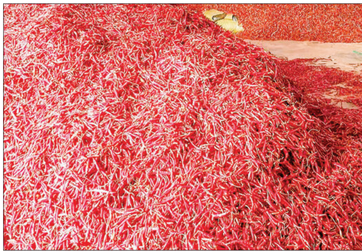
The photo shows a stockpile of chilli pepper (Mohtaung variety) at a warehouse in the Aungban area, Shan State.

Chinese bell peppers flowed into Yangon's market at K17,500 per viss in the last week of October. Then, the price increased to K18,000 per viss and was back in decline at K17,000-17,500 per viss.