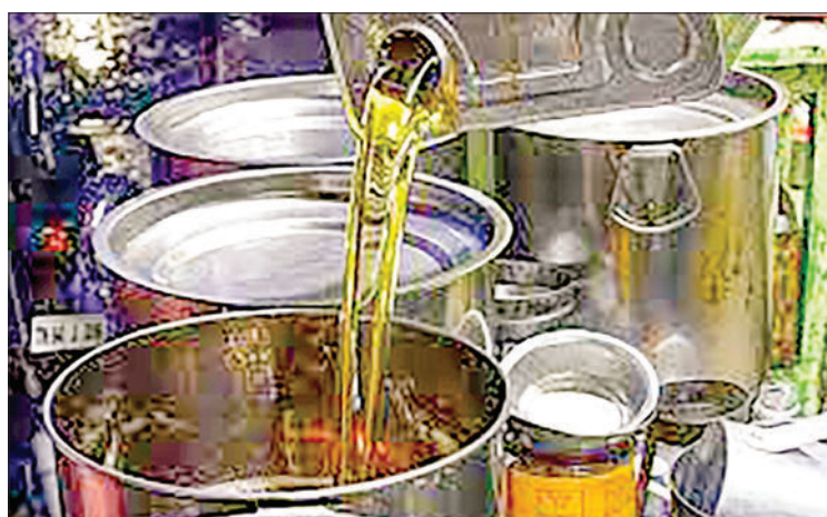
Palm oil being organized for sale at the market in Yangon.

The Supervisory Committee on Edible Oil Import and Distribution under the Ministry of Commerce has been close-