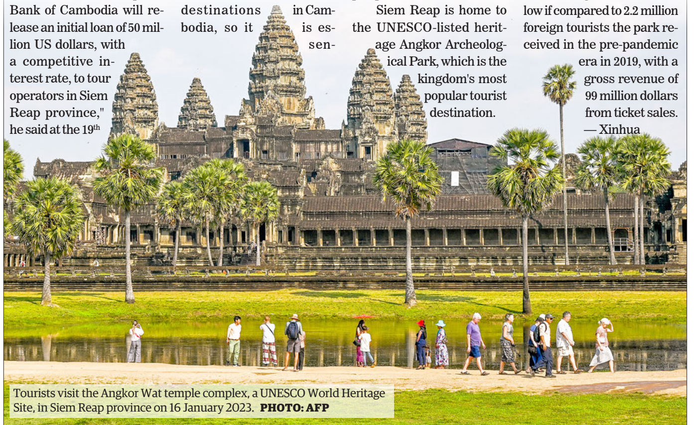
Tourists visit the Angkor Wat temple complex, a UNESCO World Heritage Site, in Siem Reap province on 16 January 2023.

The figures remained low if compared to 2.2 million foreign tourists the park received in the pre-pandemic era in 2019, with a gross revenue of 99 million dollars from ticket sales. — Xinhua