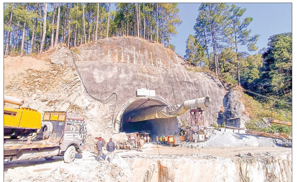
Rescue workers gather near the site after a tunnel collapsed in the Uttarakhand district of India's Uttarakhand state on 13 November 2023.

Rathodi said excavators had removed about 20 metres (65 feet) of heavy debris, but the men were 40 metres beyond that point. — AFP