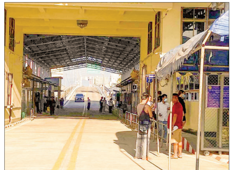
The image captures the panoramic scene of the Myawady border, a vital hub for trade exchange between Myanmar and Thailand.

Myanmar carries out border trade with the neighbouring countries China, Thailand, Bangladesh and India. It exports agricultural produce, livestock products, fisheries, minerals, forest products, finished industrial goods and other goods, while it brings in capital goods, intermediate goods, consumer goods and raw materials by the CMP enterprises. — NN/EM