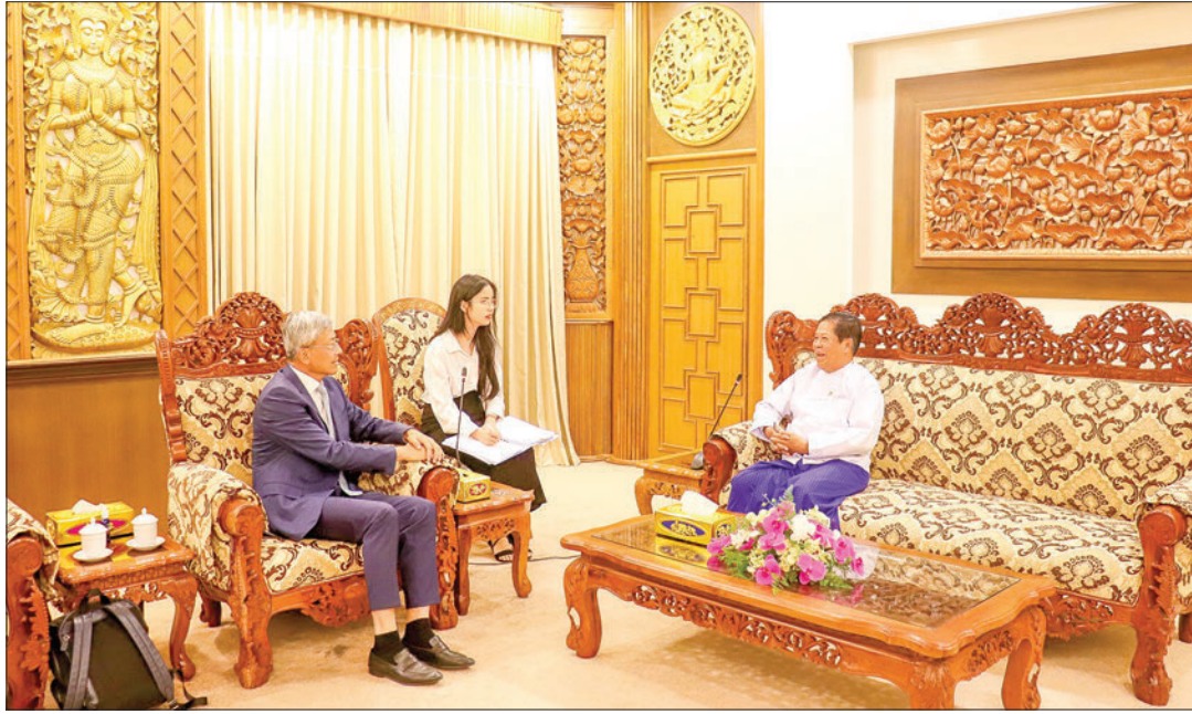
China's Ambassador Mr Chen Hai calls on Deputy Prime Minister MoFA Union Minister U Than Swe yesterday in Nay Pyi Taw.

DEPUTY Prime Minister and Union Minister for Foreign Affairs of the Republic of the Union of Myanmar U Than Swe received Mr Chen Hai, Ambassador of the People's