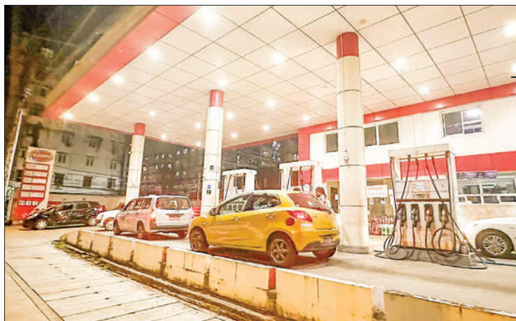
Vehicles are seen refuelling at the petrol station in Yangon.

Starting from 13 November, fuel is being sold at these filling stations as usual. If necessary, the supervisory committee will supply more fuel to the filling stations in time. So, people can buy fuel as necessary. — GNLM/TTA