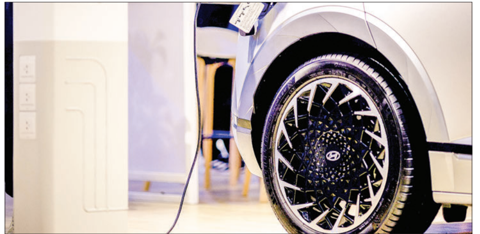
A Hyundai Ioniq 5 is pictured plugged in to a charging station at the 44th Bangkok International Motor Show in Bangkok on 22 March 2023.

Hyundai held a groundbreaking ceremony earlier in the day for the new EV-dedicated plant in Ulsan, some 300 kilometres southeast of the capital Seoul. The company will invest about two trillion won (1.5 billion US dollars) in the 548,000-square-metre EV factory with a capacity to manufacture 200,000 EVs per year. It aimed to launch mass production in the first quarter of 2026,