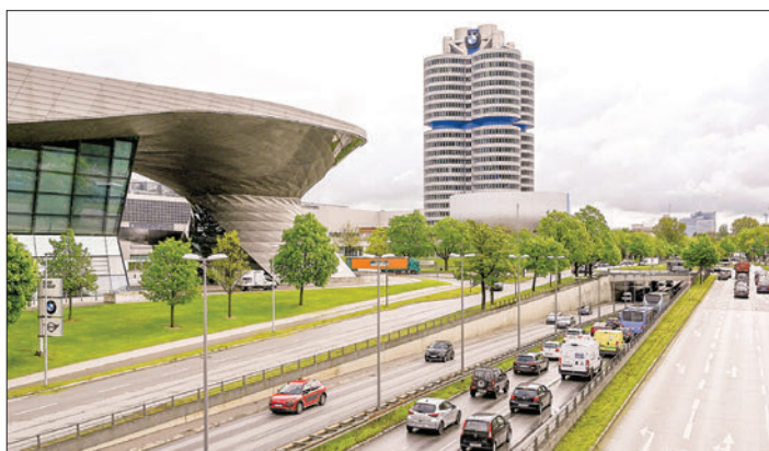
The headquarters building of German carmaker BMW is pictured on 10 May 2023 in Munich, southern Germany. The shareholders’ meeting of the carmaker BMW is to take place in Munich on 11 May 2023.

ees at the mine also reportedly claimed that Managem was breaching international standards for protecting workers.