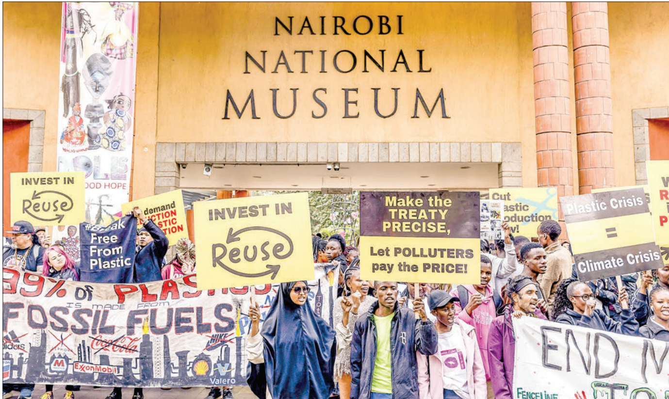
Climate activists chant slogans and hold banners as they march to demand drastic reduction in global plastic production during the Break Free From Plastic Movement March ahead of the third meeting of the Intergovernmental Negotiating Committee (INC-3) in Nairobi on 11 November 2023.