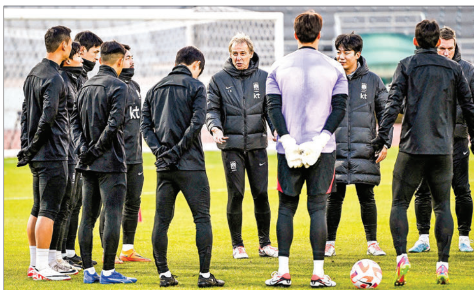
South Korea's head coach Jurgen Klinsmann (C) speaks to his players during a training session at Mokdong Stadium in Seoul on 13 November 2023, ahead of the 2026 World Cup qualifying match between South Korea and Singapore.

The Taeguk Warriors lost to Australia in the 2015