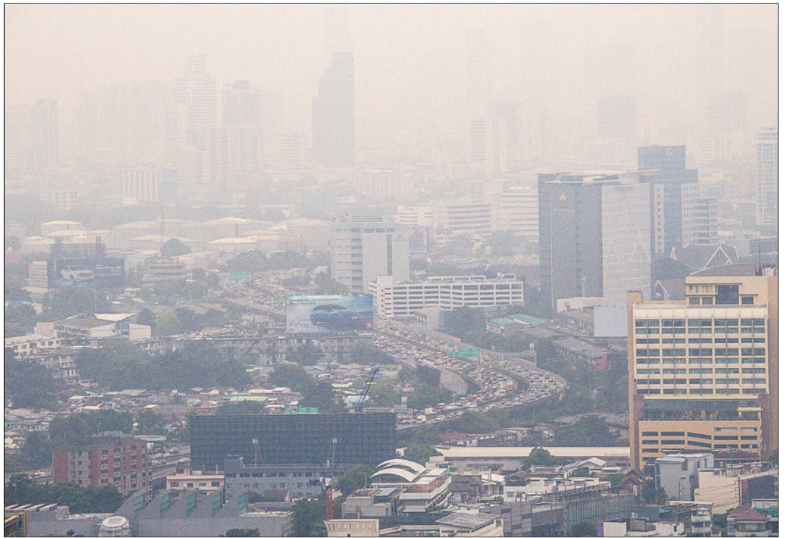
(FILES) Vehicles sit in traffic on a busy road amid high levels of air pollution in Bangkok on 18 October 2023.

Emissions from industry, along with vehicle exhaust fumes and smoke from stubble burning by farmers, send air quality plummeting in Thailand every year. The worst pollution period is usually from December to February — coinciding with the peak tourist season — but an unexpected spike in Bangkok last month brought hurried promises of action from officials. — AFP