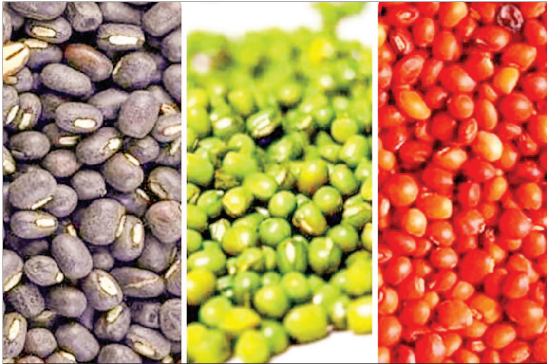
The photo shows a sample of some pulses found in the market.

The current FOB prices showed a decrease of $60 per tonne of pigeon peas and $40 per tonne of green gram compared to those recorded on 12-14 October. The prices hit K2,580-2,835 per viss of green grams from the Pakokku area and K3,580 per viss of green grams (Shwewah) on 8 November and decreased to K2,500-