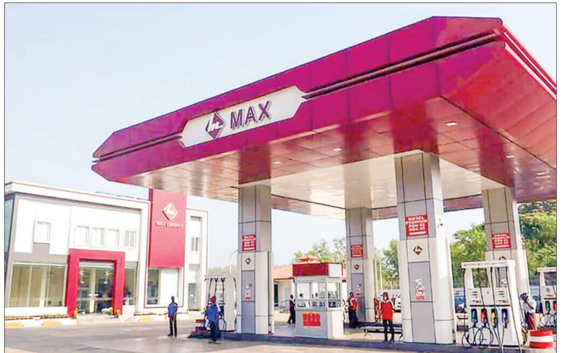
One of the filling stations in the city of Yangon.

The Petroleum Products Regulatory Department, under the guidance of the committee, is issuing the daily reference rate for oil to offer a reasonable price to energy consumers. The reference rate in Yangon Region