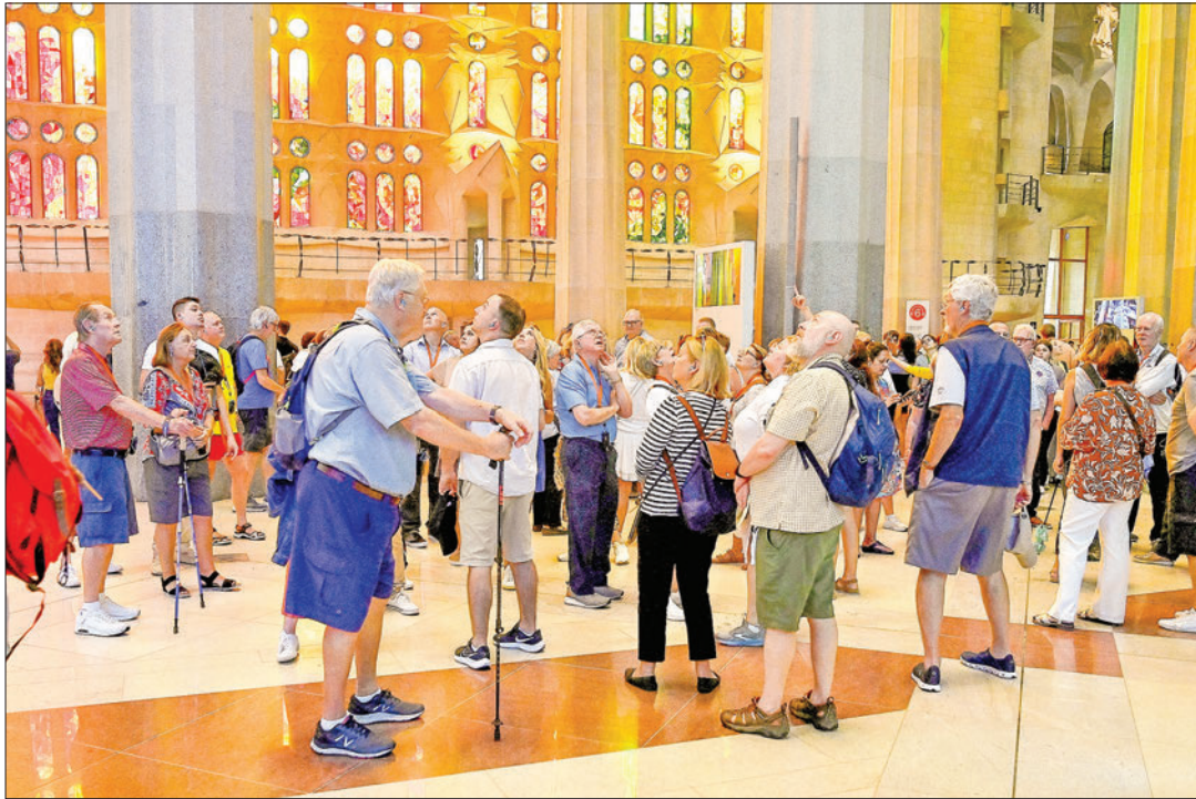
Tourists attend a guided tour inside the Expiatory Church of the Sagrada Familia basilica in Barcelona on 19 September 2023.

A celebratory light show graced the newest towers of Barcelona's Sagrada Familia basilica on Sunday as the iconic attraction moves closer to completion 141 years after construction started.