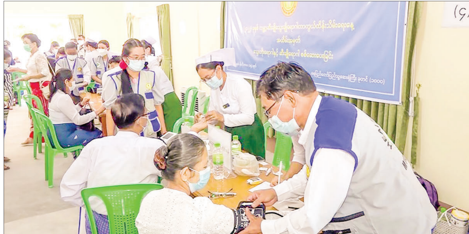
Diabetes screening in progress to mark World Diabetes Day from the previous year.

IN this 21 st century, people are not only facing communicable diseases like COVID-19, tuberculosis, and diarrhoea, but they also have to encounter non-communicable diseases. Non-communicable diseases are the result of a combination of genetic, physiological, environmental and behavioural factors and cause premature death around the world. Among the non-communicable diseases, diabetes accounts for a huge global health problem.