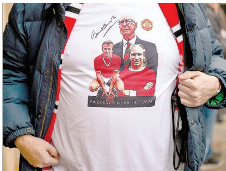
A member of the congregation displays his T-shirt commemorating England World Cup winner and Manchester United legend Bobby Charlton, as he leaves the Charlton's funeral service at Manchester Cathedral in Manchester, northern England, on 13 November 2023.