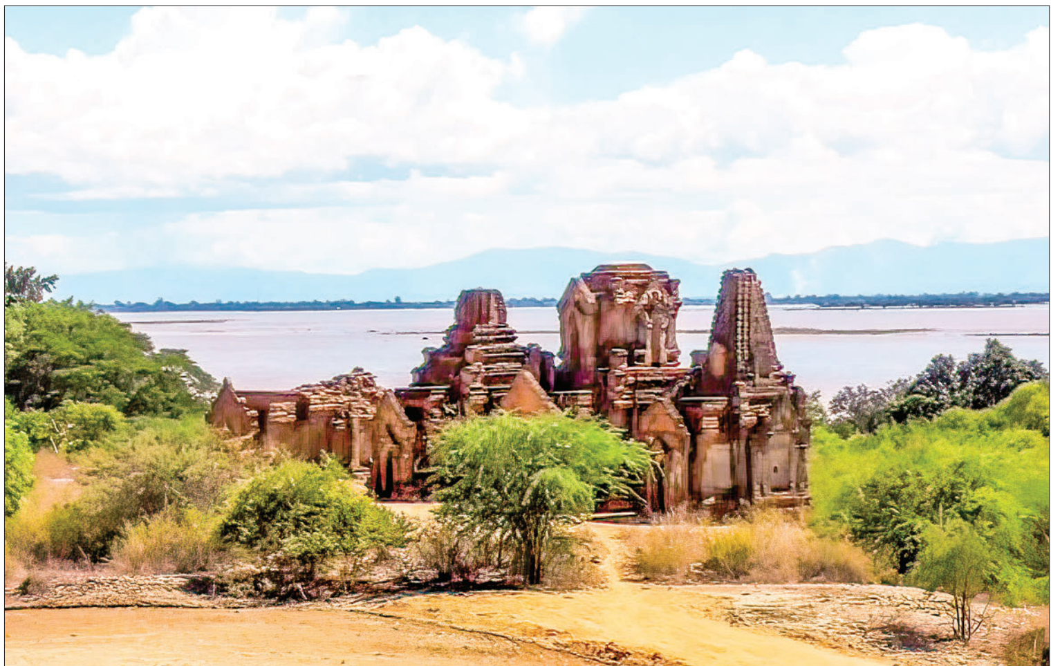
Pagodas are seen in the Sarle region of Yenangyoung Township which is described as the second Bagan.