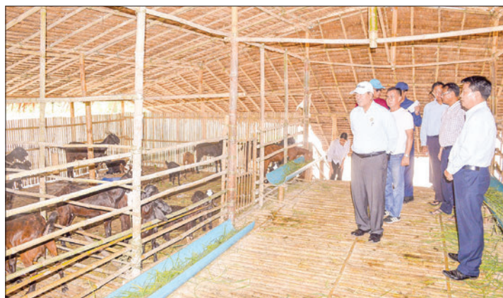
Yangon Mayor U Bo Htay(L) is pictured during his inspection tours on 12 November 2023.

Sanitation Department. They then visited concrete mixture plant of the Engineering Department (Roads and Bridges) on Magway Street, Ward 8 in Hlinethaya (East) Township. They inspected raising of 1,000 layers on the factory premises and addressed any identified needs. — MNA/KZW