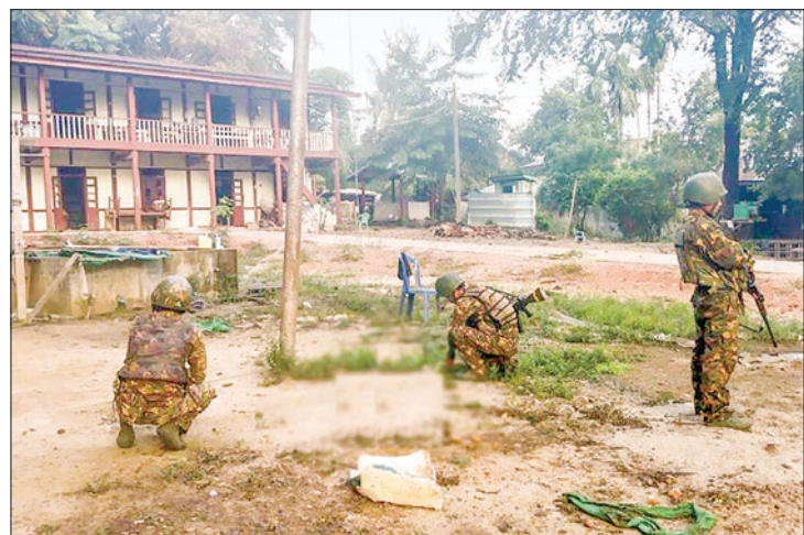
Mine clearance operation in progress in Htigyaing Township.

KIA and PDF terrorists raided Htigyaing Township of Sagaing Region on 9 November, killed locals, resorted to collecting money, committed arson attacks on houses and departmental buildings, and planted mines.