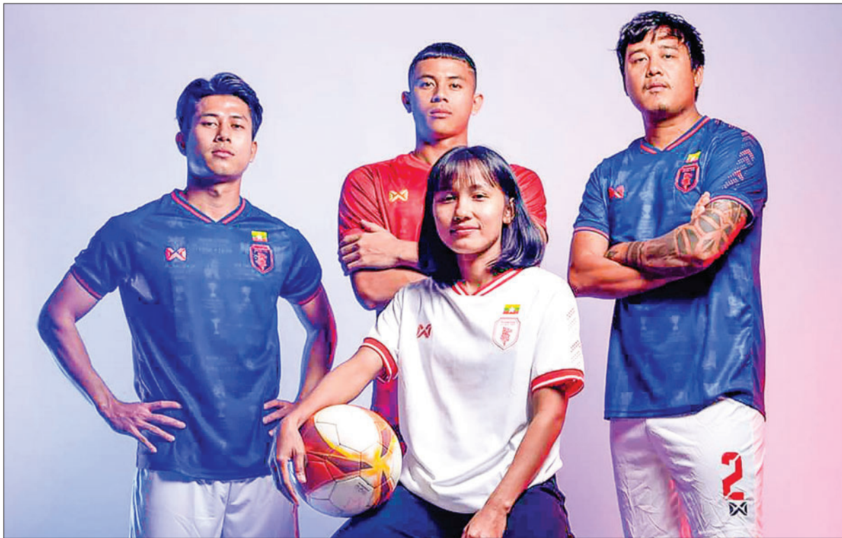
Myanmar's soccer stars showcase the striking design of the national team's new jersey.