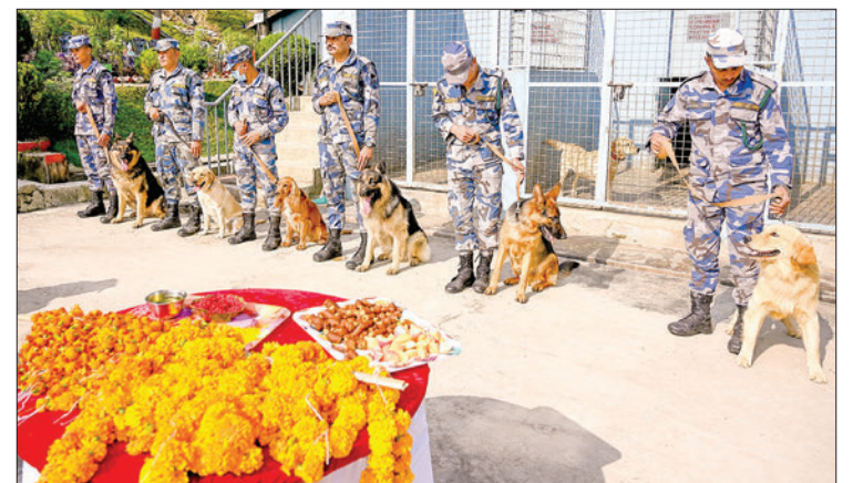
Nepal Armed Police dog handlers along with their dogs attend an event to mark the Hindu festival Tihar, at the Armed Police Dog Training School in Kathmandu on 12 November 2023.

But animal welfare groups say the special treatment should not be limited to a single day and inhumane treatment towards street dogs, such as poisoning them to cull the population or to prevent rabies, must be stopped. — AFP