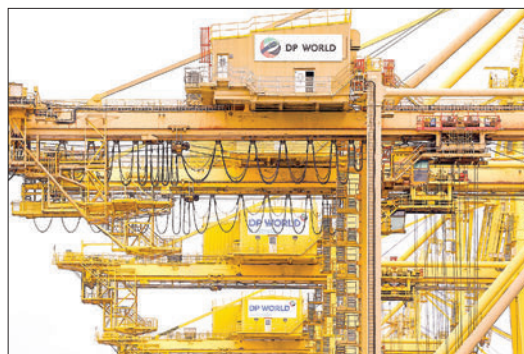
Gantry cranes adorned with logos for ports operator DP World is seen at Port Botany in Sydney on 13 November 2023.

It said it expected to move 5,000 containers out of the four terminals during the day -- not far