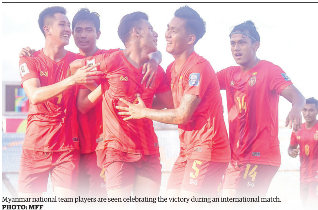
Myanmar national team players are seen celebrating the victory during an international match.