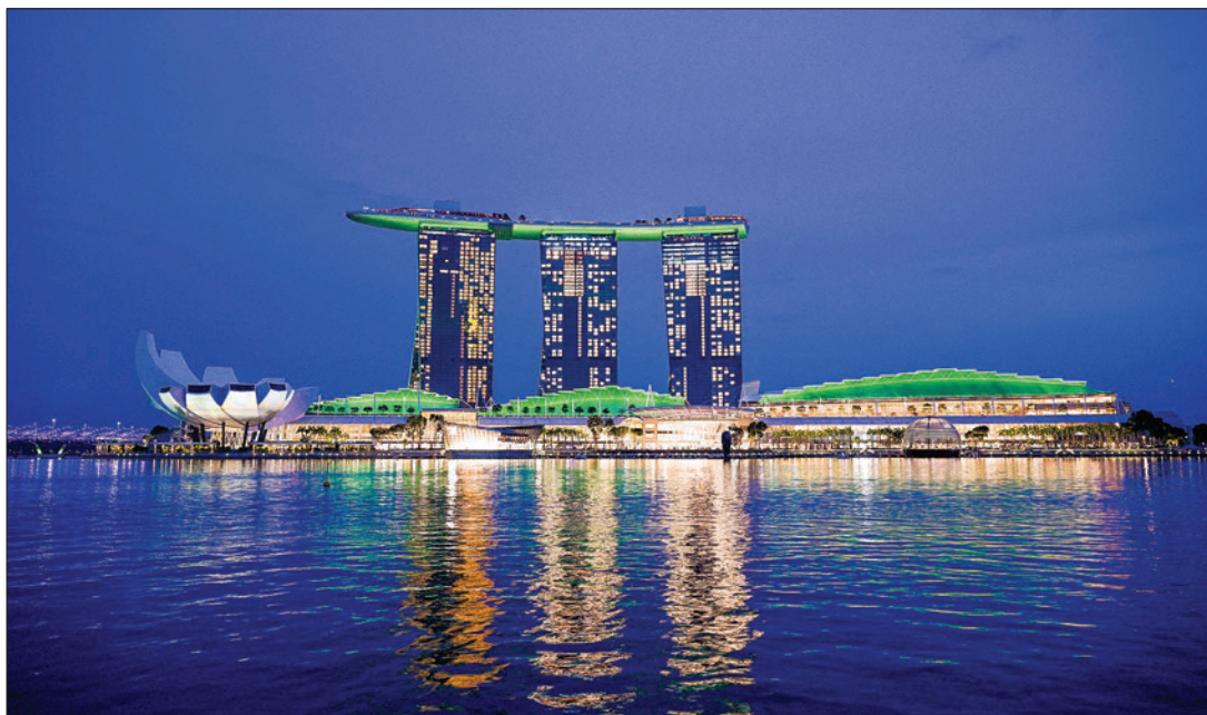
The Marina Bay Sands hotel resort is seen lit up in green to celebrate the Earthshot Prize and United for Wildlife, in Singapore on 6 November 2023.

“Based on our investigation, we do not have evidence to date that the unauthorized third party has misused the data to cause harm to customers,” Town said. — AFP