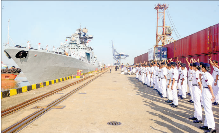
The Russian naval delegation and its fleet are seen off at Mingaladon Air Force Base (L) and at Thilawa Port (R) before their departure for the Russian Federation yesterday.