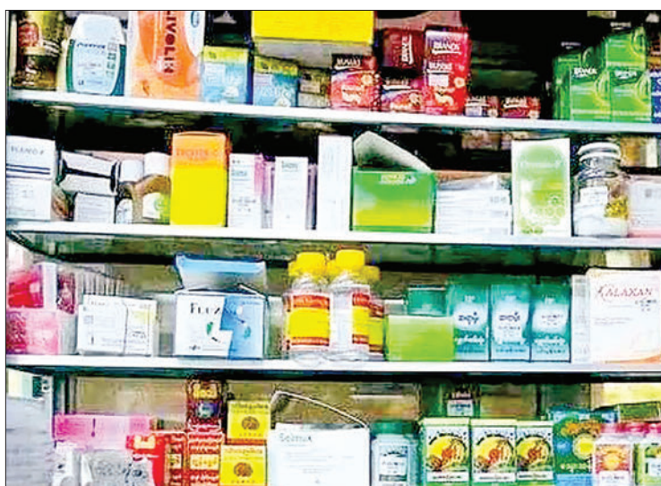
The photo shows foreign medications at a pharmacy outlet.

Approximately 80 per cent of the medicines used in the coun-