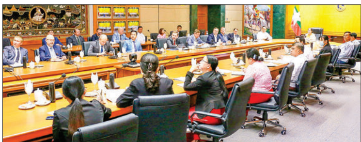
CBM Governor Daw Than Than Swe meets the Fund RC-Investments delegation from the Russian Federation yesterday.

trade and cross-border payments. Depending on the countries with the highest trade volume with Myanmar, the bilateral joint working group will continue to coordinate efforts aimed at using the Commodities Basket and implementing a Digital Financial Asset to facilitate payments and account clearance. These discussions are being led by the Central Bank of Myanmar and the Central Bank of Russia, involving Evrofinance Mosnarbank, chosen by the Russian Federation, and state-owned or private banks to be selected by the Central Bank of Myanmar. — MNA/KZW