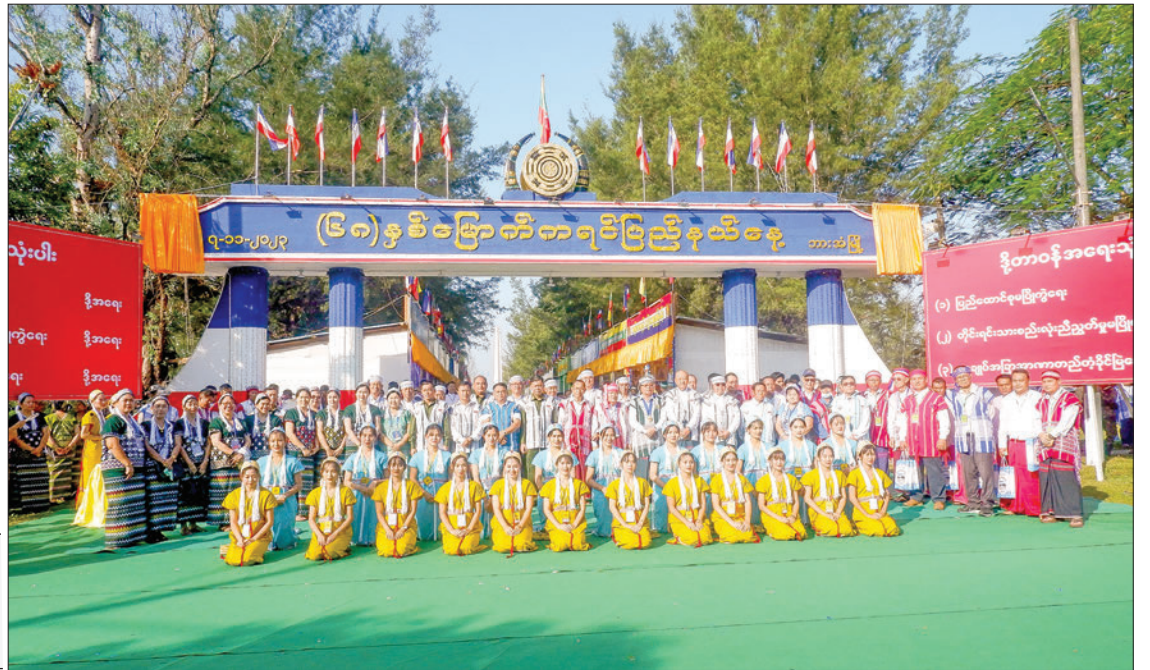
The 68 th Anniversary Celebration of Kayin State Day in progress yesterday in Hpa-an, Kayin State.