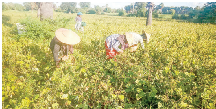
The picture shows some growers harvesting green gram in Aungtha village, Ngathayauk, NyaungU Township.

The main buyer India's demand for pulses is still strong. New green gram that will flow into the market in one month and black gram that will be harvested in early February and March next year are expected to fetch higher prices. Nonetheless, it is hard to forecast green gram prices. — TWA/KK