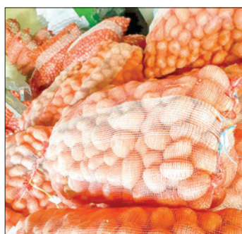
The photo shows Chinese potato stocks at a warehouse.

market will see potato supply from the Aungban area, Shan State. The price is estimated at K3,000 per viss, according to the potato depot from Yetama Street in the Bayintnaung area. — TWA/KK