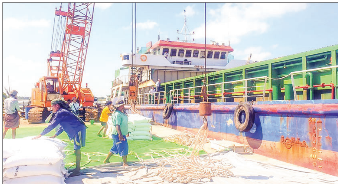
Export rice bags seen being loaded onto the overseas-bound cargo vessel.