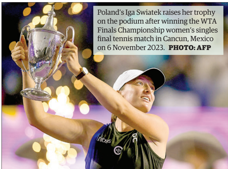
Poland's Iga Swiatek raises her trophy on the podium after winning the WTA Finals Championship women's singles final match in Cancun, Mexico on 6 November 2023.

"It just was one of those days where I felt like I was going for too much," Pegula said. "And she was just playing super solid." — AFP