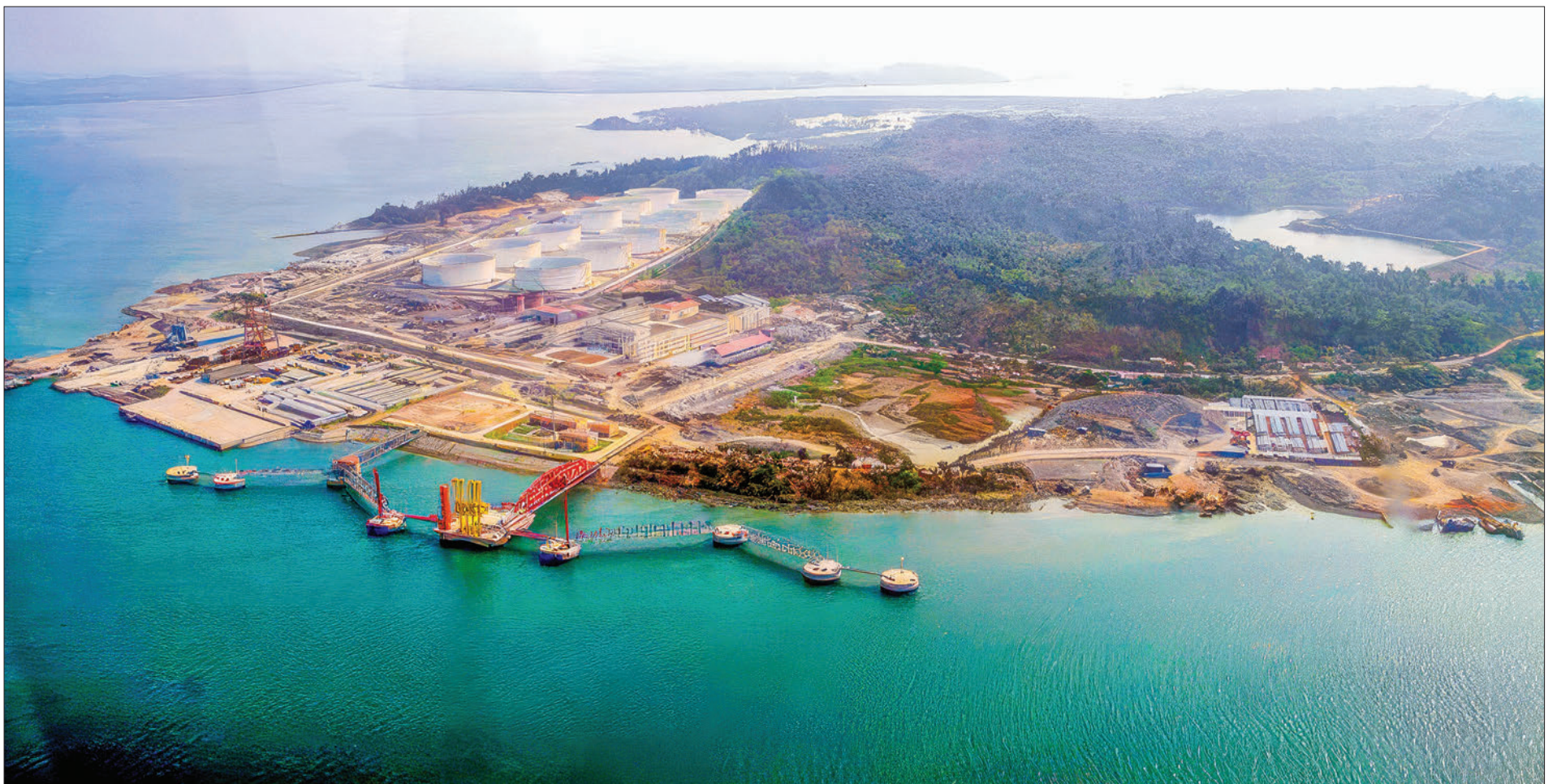
An aerial view of the Ma-de Crude Oil Discharging Terminal in Kyaukphyu Township of Rakhine State—major part of the Kyaukphyu Special Economic Zone.

The company must be incorporated for more than 10 years or must have five years of experience in successful infrastructure development processes.