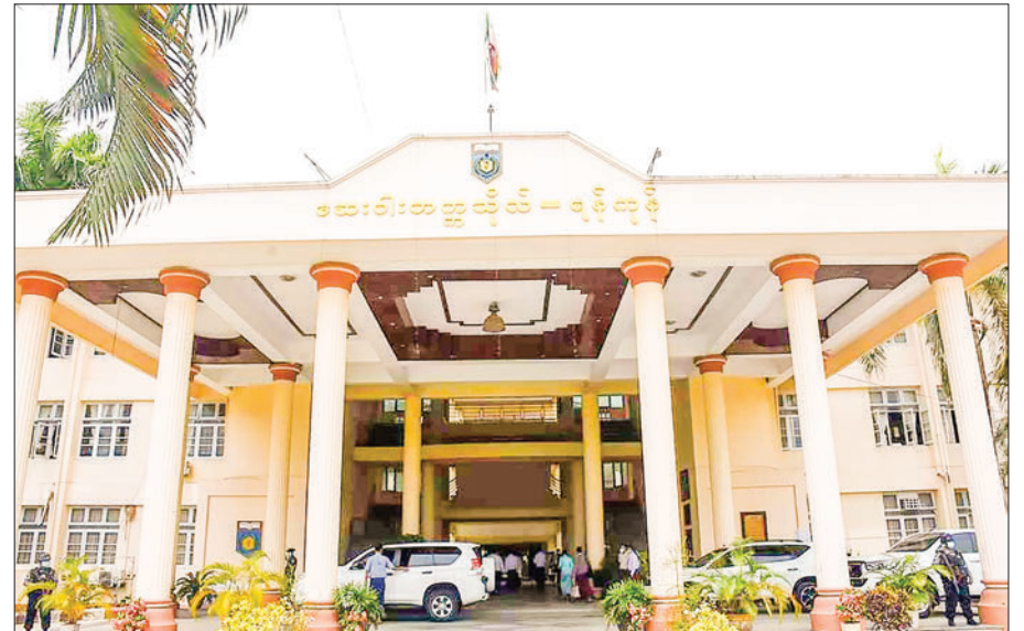
The photo shows the University of Pharmacy (Yangon).

cal universities are required to register at the universities where they have been accepted, beginning on 16 November.