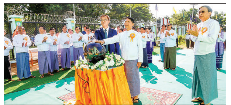
Union Minister U Min Naung presses the electric button to inaugurate the centre yesterday in Nay Pyi Taw.

The project to build the Crop Yield Assessment Cen-