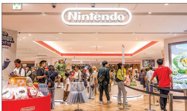
People look at merchandise on display at a Nintendo store in central Tokyo on 6 November 2023. The Japanese gaming giant is expected to announce second quarter earnings on 7 November

"The April release of 'The Super Mario Bros. Movie' positively impacted sales of Mario-related titles," the Kyoto-based firm added. For the April-September period, net profit jumped 17.7 per cent to 271.3 billion yen, with sales climbing 21.2 per cent to 796.2 billion yen. — AFP