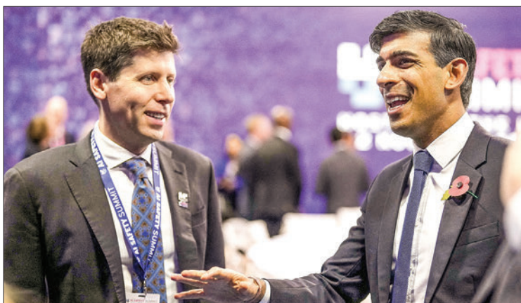
Britain’s Prime Minister Rishi Sunak (R) speaks with Sam Altman (L), CEO of OpenAI, during a plenary session at the UK Artificial Intelligence (AI) Safety Summit at Bletchley Park in central England on 2 November 2023.

Japanese Foreign Minister Yoko Kamikawa, who is chairing the first gathering of the G7’s top diplomats since the start of the conflict, is scheduled to hold a wrap-up press conference on Wednesday, the ministry said. — Kyodo