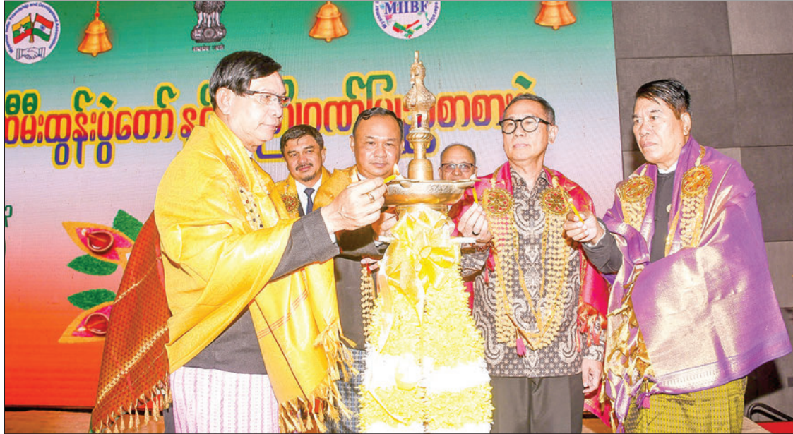
The Deepavali lighting festival in progress yesterday in Yangon, graced by Deputy Prime Minister Union Planning & Finance Minister U Win Shein (2R).

In his speech, the Deputy Prime Minister highlighted the festival as the noblest