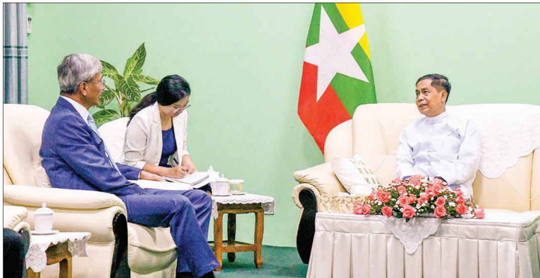
Chinese Ambassador Mr Chen Hai calls on Union Minister U Ko Ko Hlaing yesterday.

UNION Minister for the Union Government Office 2 U Ko Ko Hlaing received Mr Chen Hai, Chinese Ambassador to Myanmar, and his delegation at the Ministry of the Union