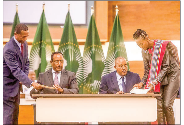
Redwan Hussien Rameto (2nd L), representative of the Ethiopian government, and Getachew Reda (2nd R), representative of the Tigray People’s Liberation Front (TPLF), sign a peace agreement in Pretoria, South Africa, 2 November 2022.

Reiterating its commitment to redoubling efforts to consolidate peace and ensure the full implementation of the peace agreement, it called on the international community to exert continued engagement for lasting peace in Ethiopia. — Xinhua