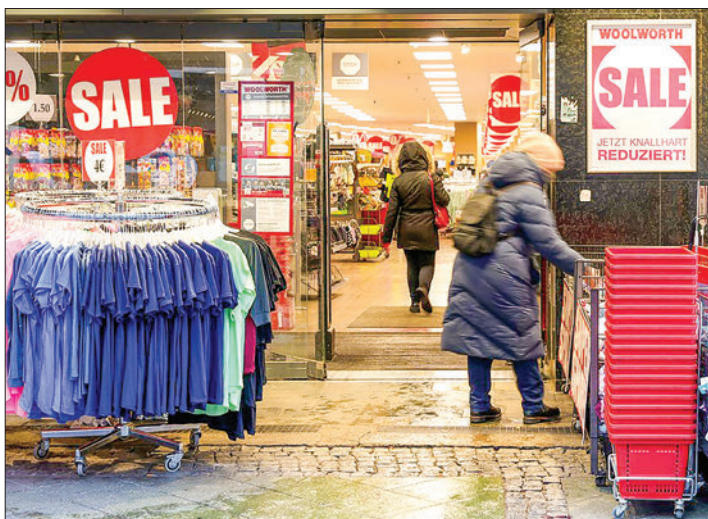
People shop at a store with discount signs in Berlin, Germany, on 1 February 2023.

Peek & Cloppenburg, one of Germany's largest fashion retailers with annual sales of over 1 billion euros, ended its self-administration proceedings in late September. The company filed for bankruptcy protection in March. It was forced to restructure and cut 350 jobs at its headquarters in the city of Duesseldorf in order to survive. — Xinhua