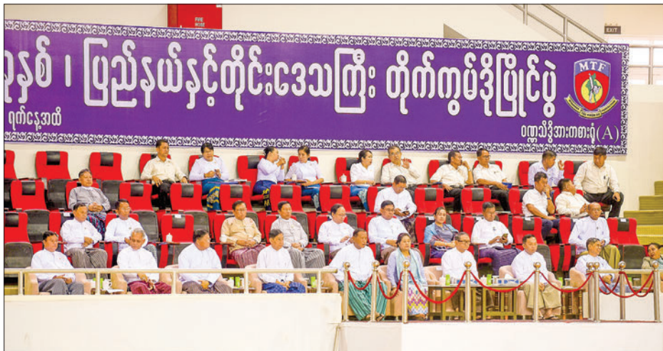
The 2023 Inter-State and Region Taekwondo Tourney opening match in action yesterday in Nay Pyi Taw, attended by SAC members and dignitaries.