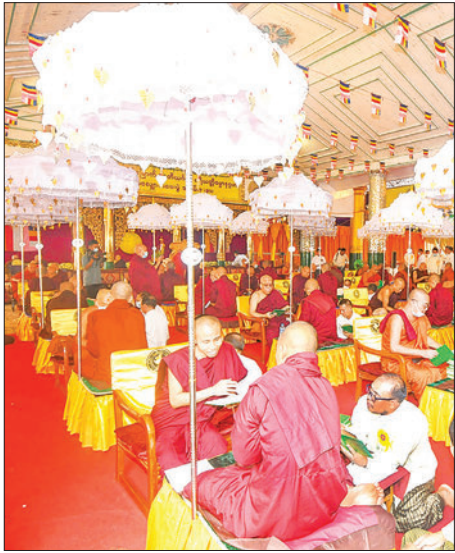
The photo shows the 104 th Cetiayangana Pariyatti Dhamma Nuggaha examination in progress.