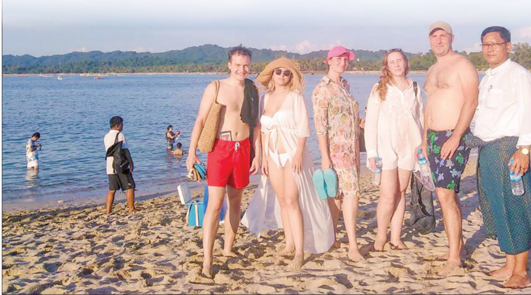
Beachgoers have the group picture taken on the Ngapali Beach during the holiday.

NGAPALI Beach welcomed a high number of travellers within the three-day Thadingyut festival, and the digits showed an increase of 64.94 per cent of local and foreign visitor arrivals than the previous year, according to Rakhine State Directorate of Hotels and Tourism.