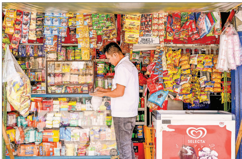
A man buys ice from a store in Manila on 5 October 2023.

But Balisacan warned that the El Nino weather phenomenon, which was expected to bring below-normal rainfall across the country in the coming months, could be detrimental for crops. — AFP