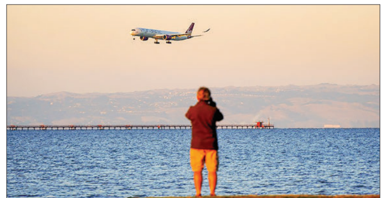
A plane is about to land in San Francisco International Airport in San Francisco, the United States, 15 July 2023.

Last week, the first airline based in China returned to SFO after an absence of more than three years. Air China, the flag carrier of China, restored non-stop flights to Beijing. On 11 November, China Southern will resume nonstop flights to Wuhan, followed by China Eastern to Shanghai on 29 November. — Xinhua