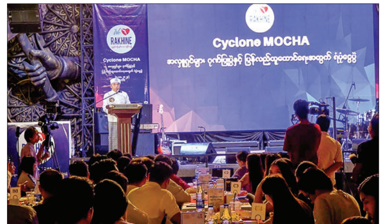
The donor honouring ceremony and rehabilitation fundraising event in progress on 5 November in Yangon.