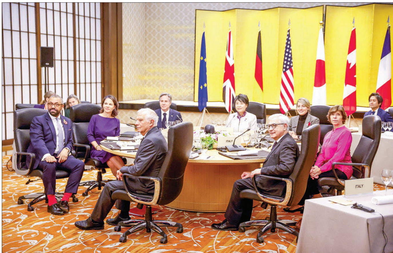
(Clockwise from front 2 nd L) High Representative of the European Union for Foreign Affairs and Security Policy Josep Borrell, British Foreign Secretary James Cleverly, German Foreign Minister Annalena Baerbock, US Secretary of State Antony Blinken, Japanese Foreign Minister Yoko Kamikawa, Canadian Foreign Minister Melanie Joly, France’s Foreign Minister Catherine Colonna and Italian Foreign Minister Antonio Tajani sit at a table at the start of a working dinner as part of their G7 foreign ministers’ meetings in Tokyo on 7 November 2023.

The pact was aimed at establishing a balance between the two military alliances by setting limits on the quantities of weapons and military equipment that all parties were allowed to amass. — Xinhua