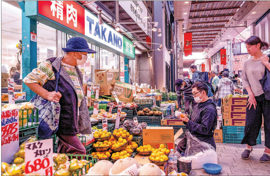
This photo taken on 7 October 2023 shows fruit and vegetables for sale at the entrance to a local supermarket in a shopping precinct in Tokyo

JAPAN'S household spending in September fell 2.8 per cent from a year earlier for the seventh consecutive monthly fall, as people cut back spending on