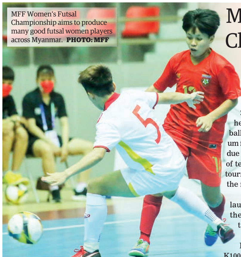
MFF Women's Futsal Championship aims to produce many good futsal women players across Myanmar.

"The session he had with us, you can see when he is with the boys he is fine, he is OK, but you could see he didn't sleep a lot. — AFP