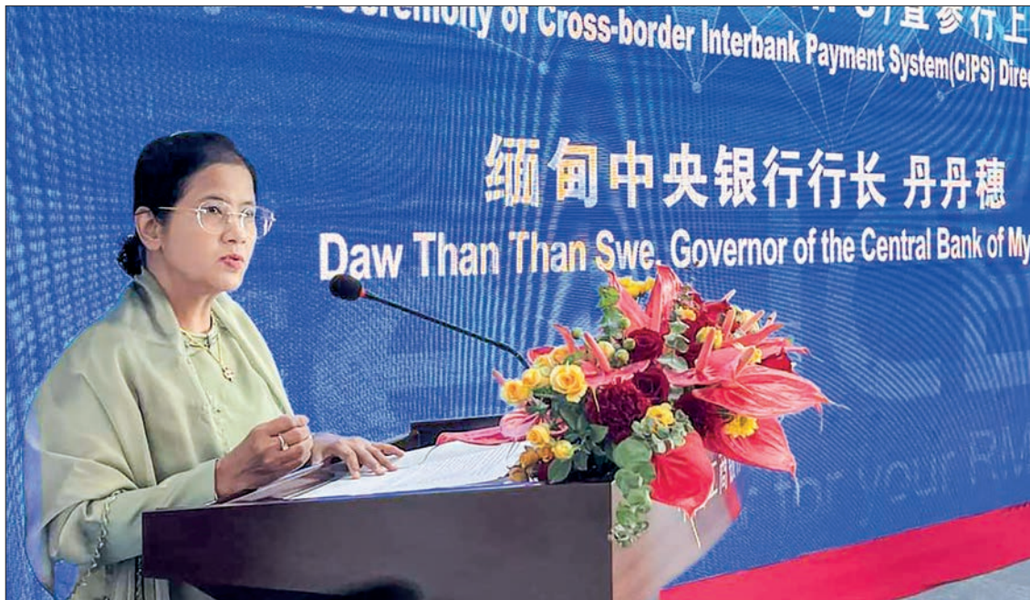
Central Bank of Myanmar Governor Daw Than Than Swe addresses the launching ceremony of the cross-border inter-bank yuan payment system (CIPS).

CENTRAL Bank of Myanmar Governor Daw Than Than Swe said that the connection of the RMB Cross-border Interbank Payment System (CIPS) will increase bilateral trade and investment between Myanmar and