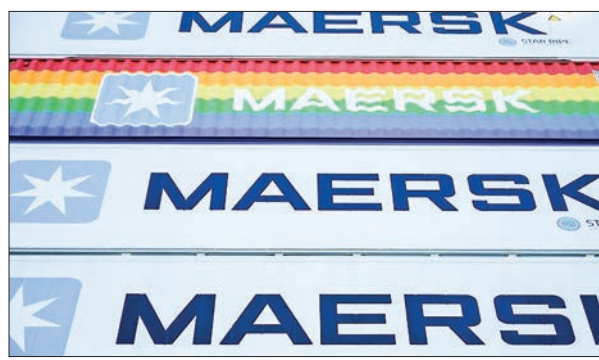
Maersk had already begun cutting costs and reducing staff levels. PHOTO: AFP/FILE

"Maersk is intensifying those measures and today introduce plans to further decrease the workforce by 3,500 positions, with up to 2,500 to be carried out in the coming months and the remaining to extend into 2024," the company said. — AFP