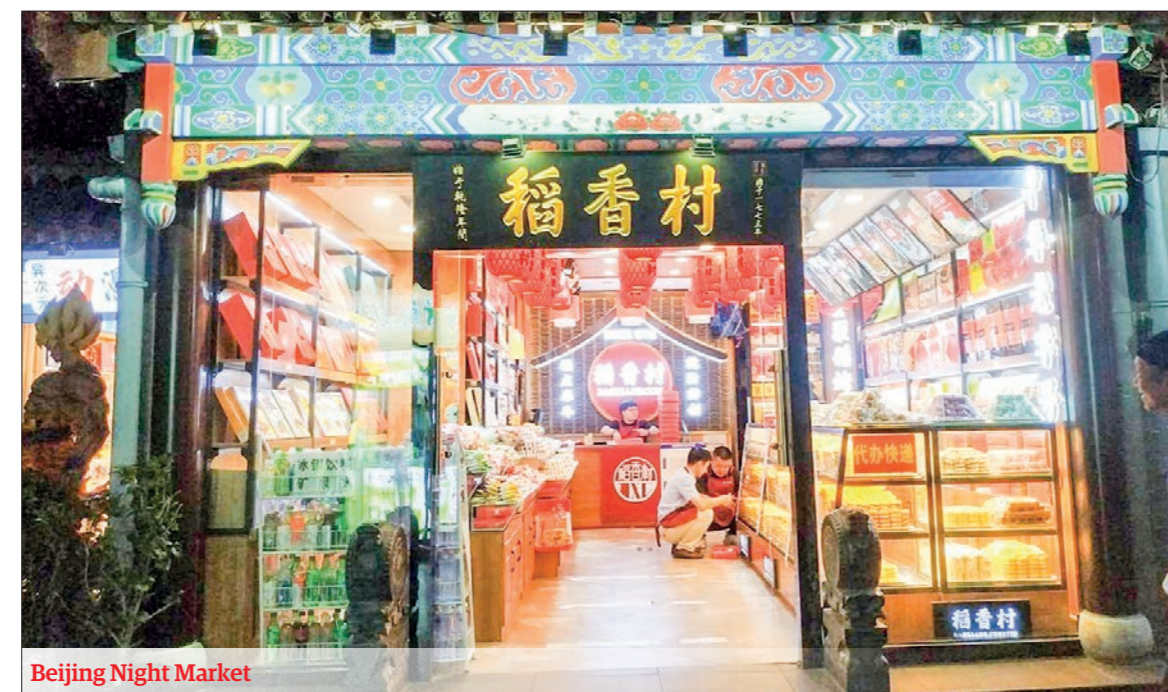
Beijing Night Market

We visited the ASEAN China Centre on the morning of 13 September. The officials explained the objectives, performances and future prospects of the ACC. The ACC is to promote investment, trade, education, culture, and tourism, and enhance exchanges and cooperation in information technology and media sectors between ASEAN and China. Afterwards, we left for People's Daily HQ and officials concerned showed news archives and Live broadcasting studios and also demonstrated how they broadcast Live, programmes through videos. People's Daily is the official newspaper run by the CCP, accumulating over two million copies daily. Although the rise in digital media and social media trends impacted the print media, the People's Daily can run with the largest million copies daily. This is a big inspiration to us.