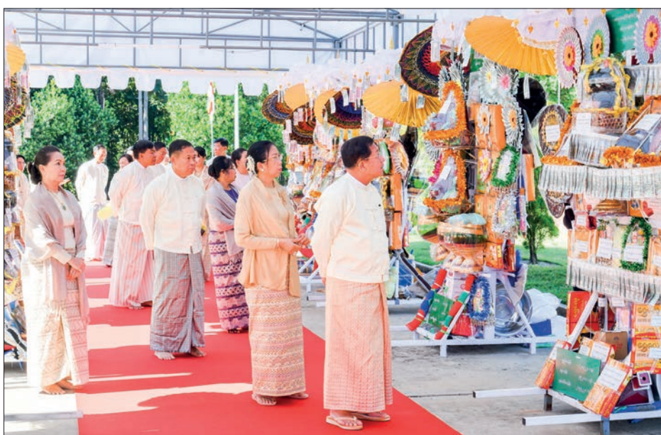
The Senior General and wife look into Kathina robes and alms exhibited for monasteries at the event yesterday.

mander-in-Chief of Defence Services Commander-in-Chief (Army) Vice-Senior General Soe Win and his wife Daw