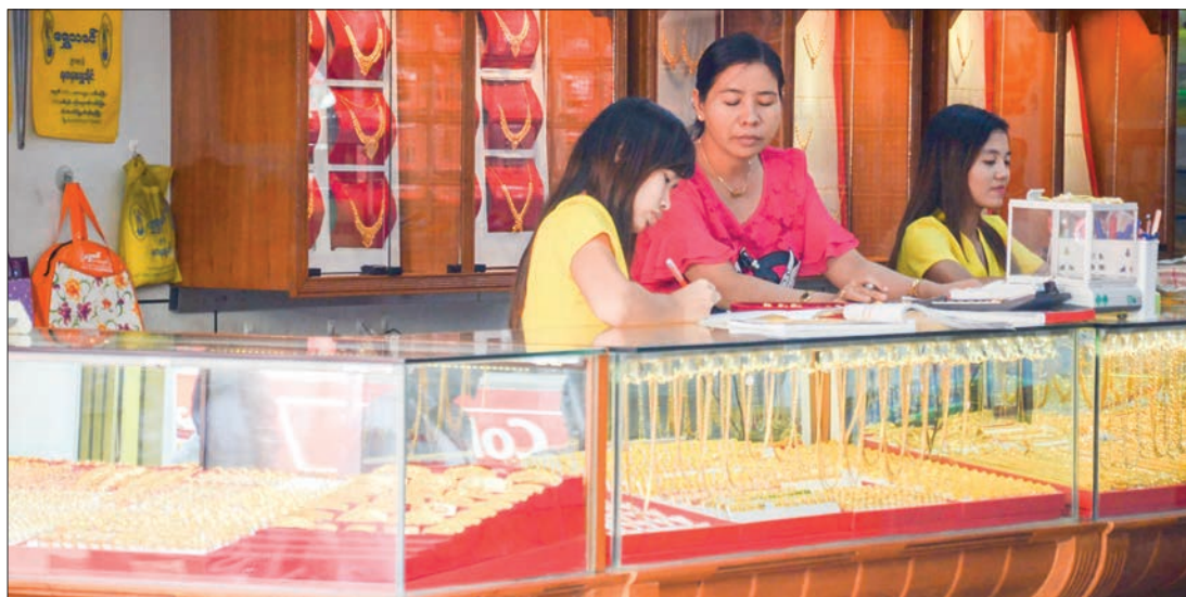
The picture shows a gold jewellery outlet in Yangon.

THE price of pure gold surged to K3.55 million per tical (0.578 ounce or 0.016 kilogramme) in the grey market tracking the rise in spot gold price to US$1,990 per ounce.