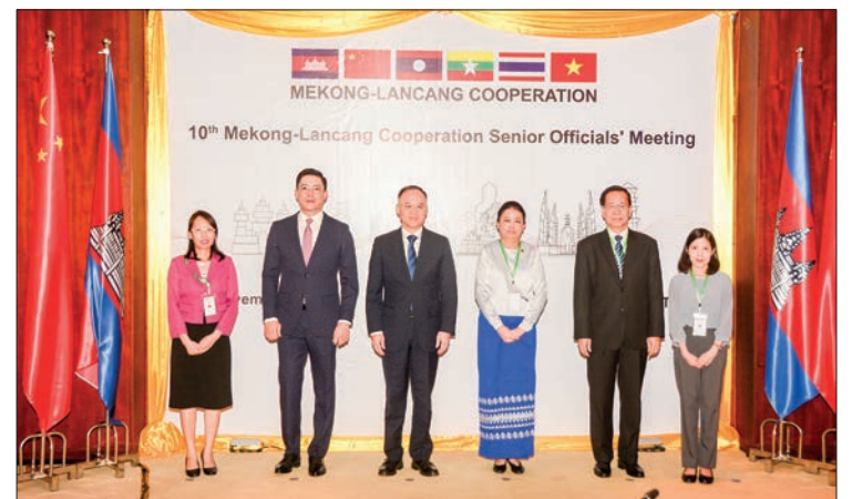
The documentary photo of the 10 th Mekong-Lancang Cooperation Senior Officials' Meeting held in Nay Pyi Taw yesterday.

The Meeting was successfully concluded after delivering the closing remarks by Heads of Delegation of Co-chairs, Myan-