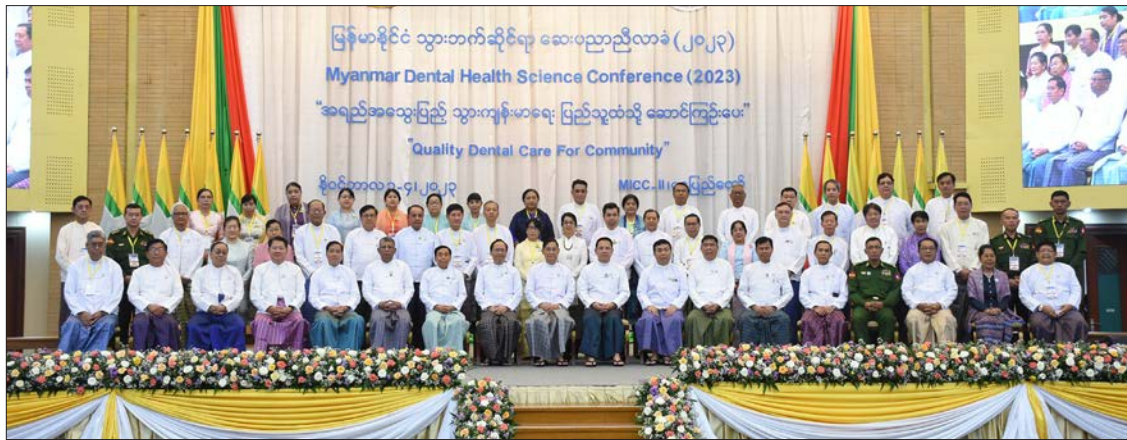
The group documentary photograph of the Myanmar Dental Health Conference 2023 held in Nay Pyi Taw yesterday.

He also stressed the instructions of the SAC Chairman Prime Minister to save the lives of people as nothing is more important than human life, saying