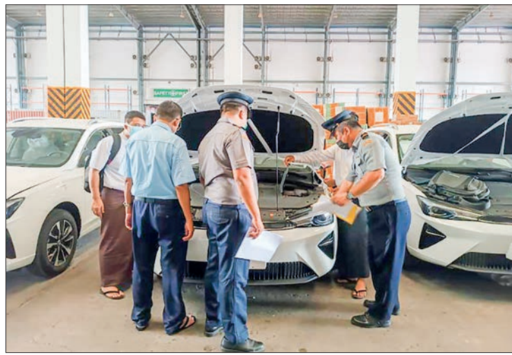
Officials checking new arrivals of battery electric vehicles at Yangon Port.

THE China-made Dayun Yuehu (VIP edition) EVs, the China-made MG, MG5 EVs and the China-made GAC Toyota BZ4X EVs arrived at the Yangon Port yesterday with the approval of the Steering Committee on National-Level Development of Electric Vehicles and Related Industries.