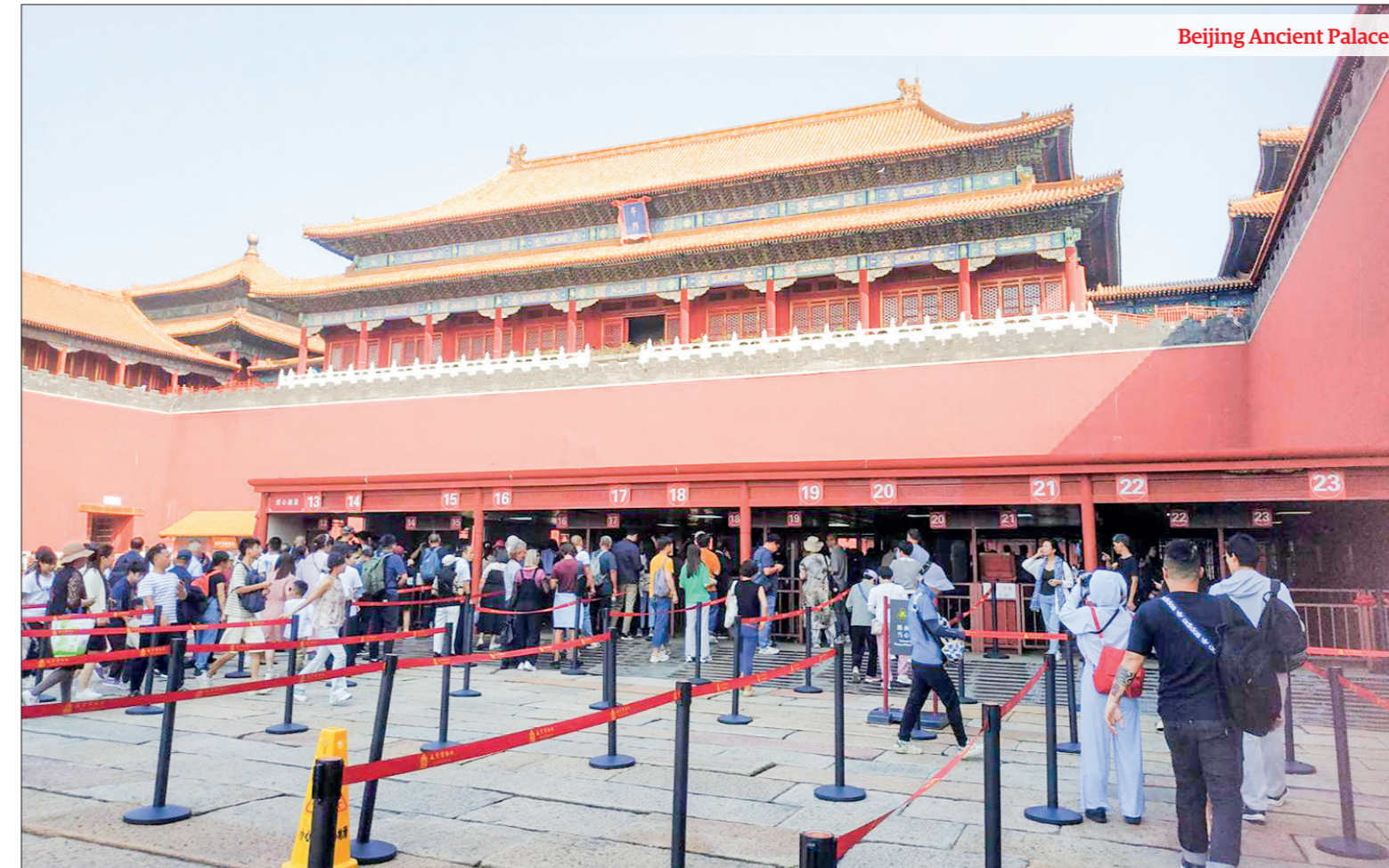
Beijing Ancient Palace