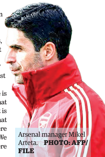
Arsenal manager Mikel Arteta.

"We've done it and there is nothing new to it, we know what we're expecting," he said. "It is very clear what they do, what their strengths are, and where the opportunities are for us. We will try to take the game where we want." — AFP