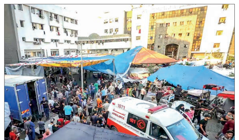
An ambulance arriving at al-Shifa hospital in Gaza City.

Israel on Friday sent back thousands of Gazans who had been working in Israel when the war erupted. — AFP