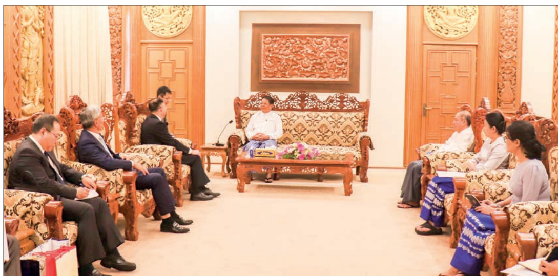
Chinese Assistant Minister for Foreign Affairs Mr Nong Rong calls on Union Minister U Than Swe yesterday in Nay Pyi Taw.

DEPUTY Prime Minister and Union Minister for Foreign Affairs U Than Swe received the Co-chair of Mekong-Lancang Cooperation and Head of Delegation of China, Mr Nong Rong, Assistant Minister for Foreign Affairs at the