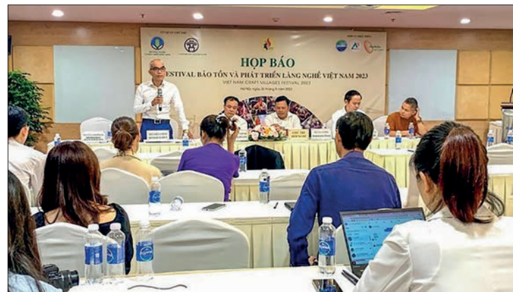
The festival is introduced at a press conference held in Hanoi on 26 September 2023.

Those who wish to join the festival can send information about participants to the trade development division of the Myanmar Trade Promotion Organization through the phone number 067 3408622 and email event.td.myantrade@gmail.com. — NN/EM