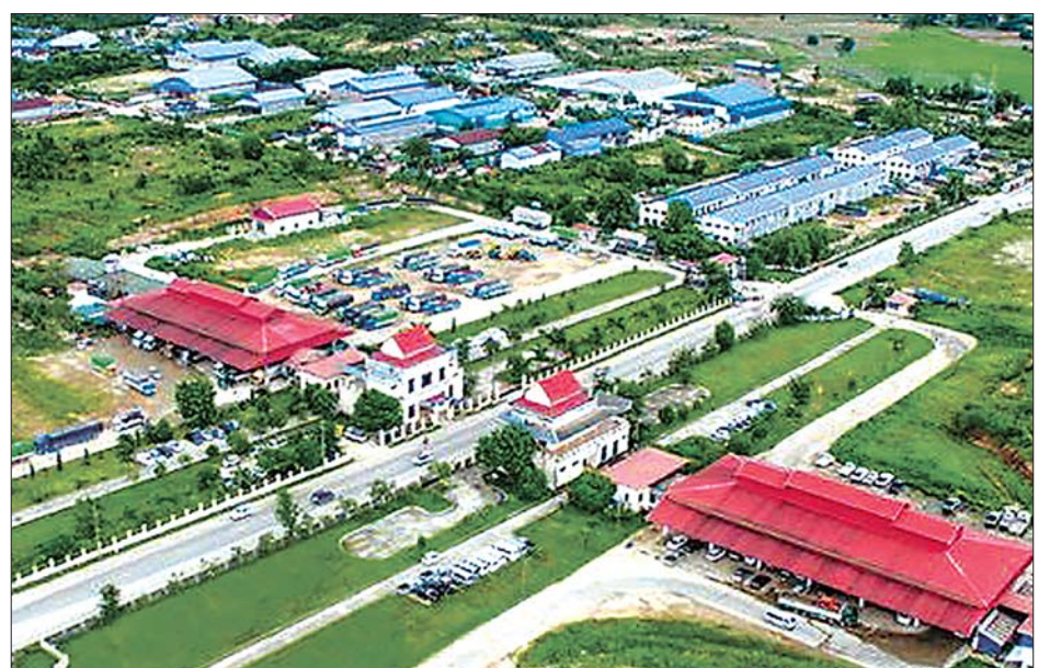
An aerial view of the Myawady Trade Zone in Kayin State.

Meanwhile, feedstuffs, bicycles, clothes, stationery, automobile parts, construction materials, machinery, bicycle parts, electronic devices, food products, cosmetics, CMP raw materials, pharmaceuti-