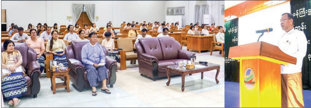
Union Minister Dr Kan Zaw addresses the 36 th Friday's Talk yesterday.

MINISTRY of Investment and Foreign Economic Relations (MIFER), aiming to develop human resources and to improve the capacity of staff, the 36 th ceremony of Friday's Talk of Knowledge Sharing Programme (KSP) was held in Nay Pyi Taw yesterday. Union Minister for Investment and Foreign Economic Relations Dr Kan Zaw attended and delivered the opening remarks.