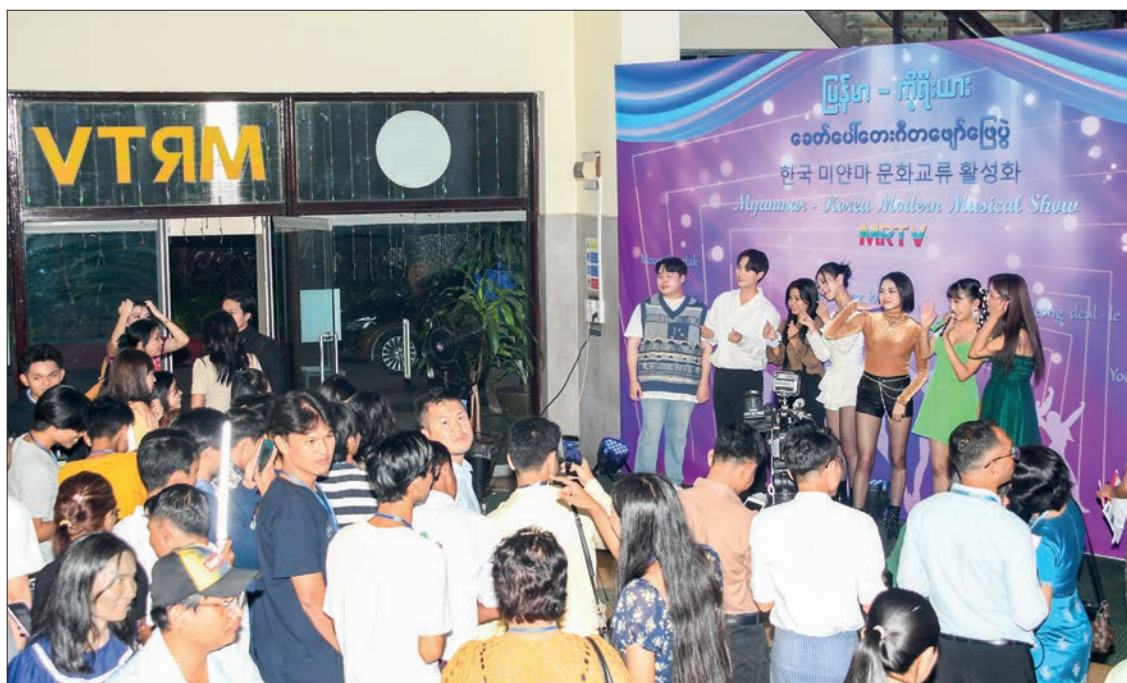
The Myanmar-Korea Musical Show in progress yesterday at MRTV in Yangon.

MRTV presents creative and active entertainment programmes like Friday Night Live Show to entertain the public every Friday, and the replay of this week will be at 10:30 am on 5 November, Sunday.