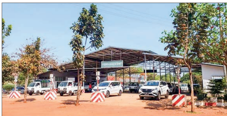
Vehicle inspection underway in the previous year.

The vehicle licence renewals are being processed without inspecting vehicles, as implemented since the outbreak of COVID-19, and licence renewals continue to be extended without vehicle inspections. — TWA/MKKS