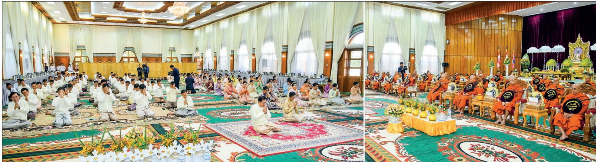
State Administration Council Chairman Commander-in-Chief of Defence Services Senior General Min Aung Hlaing and congregation observe Nine Precepts from the Paukmyaing Sayadaw and members of the Sangha on 3 November in Nay Pyi Taw.