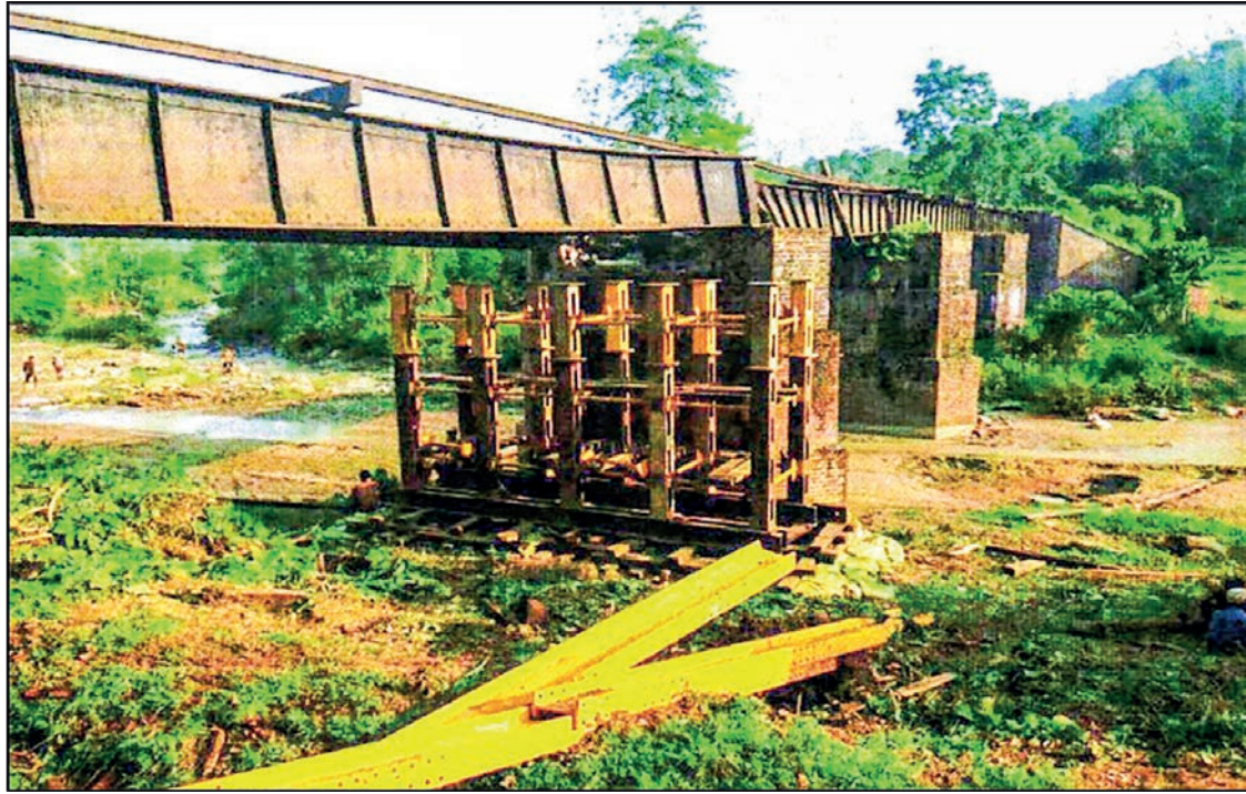
The damaged section of the Myitkyina-Mandalay railway is seen after the mine explosion by KIA.

In blowing up railways, the KIA blew up the 120-foot long Bridge No 555 on Myitkyina-Mandalay Railroad, two miles to the north of Morhan Village in Mohnyin Township on 17 April 2021, the 320-foot long Nanchwin Bailey Railroad Bridge about 800 metres to the north of Ngamile Village in Kyargyikwin Village-tract on 6 October 2023, the 80-foot long Yaypoutkyi railroad bridge