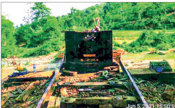
(Above & Right) The debris and damaged sections of roads and bridges in the aftermath of mine blasts by KIA.