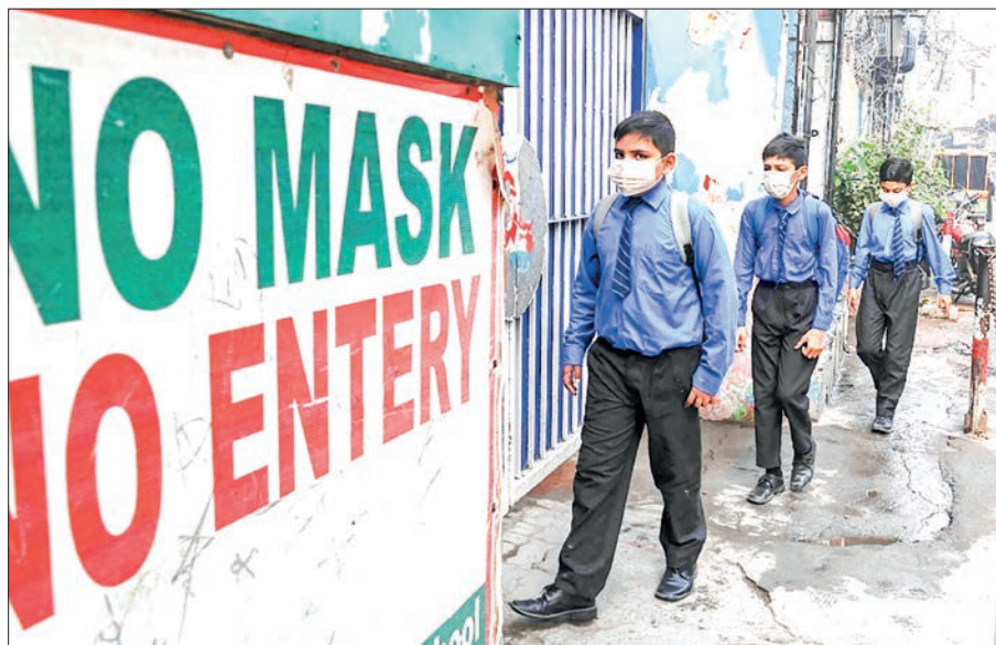
Students wearing facemasks arrive at a school in Lahore on 2 November 2023, following Punjab's government announcement to use facemasks due to severe smoggy conditions.

populous metropolis and close to the border with India, is consistently ranked in the top 10 cities globally with the worst air quality by monitoring firm IQAir. — AFP