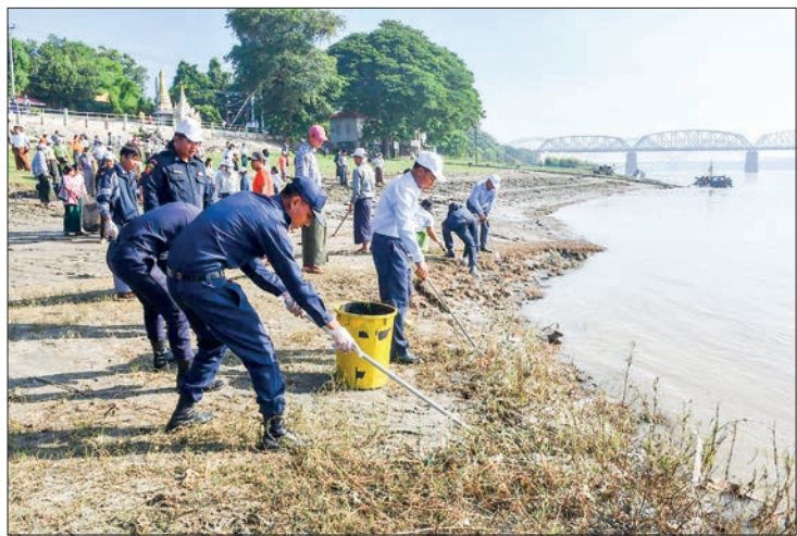
Locals and departmental personnel carrying out collective plastic garbage collection activities in Sagaing Region.

THE Sagaing Region Environmental Conservation Department under the Ministry of Natural Resources and Environmental Conservation is collaborating with the Sagaing Region Development Committee to remove plastic waste while restricting the disposal of plastic into the Ayeyawady