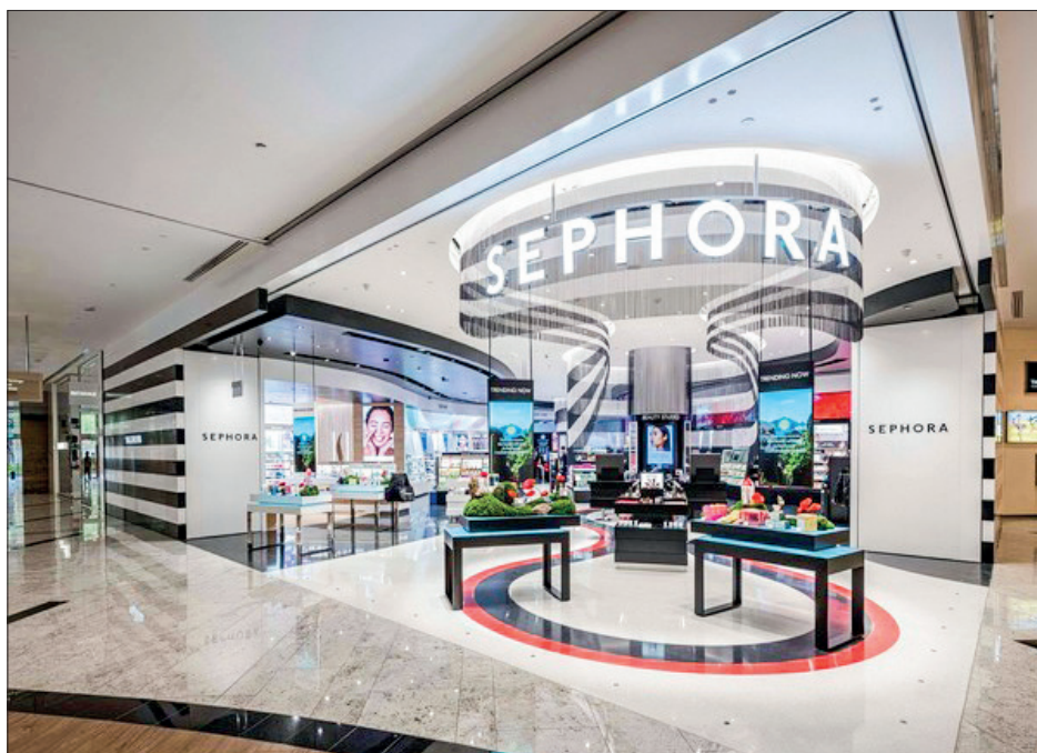
Sephora ties up with Reliance Retail Ventures to transform India's beauty retail segment.

"We are tremendously excited to partner with the largest retail group in India to step-change our business. Rising affluence, increasing urbanization and the proliferation of social media have driven greater awareness of self-care and beauty, unlocking major opportunities for prestige beauty. — ANI