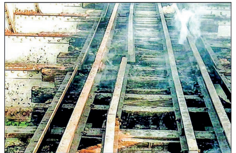
The debris of the 60-foot-long steel-frame Bailey bridge after the KIA's mine blast.

Similarly, they blew up the 50-foot long concrete Tawetchaung bridge on the Mohnyin-Hopin-Mogoung-Myitkyina between mile-posts 356-367 4,000 metres north Hopin and 20-foot long Tawetchaung Railroad Bridge on 27 April 2021, the 50-foot long Paungnet Chaung Bridge between ward 2 and ward 3 in Shwegu on 4 May, Kaukkyaw creek concrete bridge between Chaungwa Village in Katha Township and Minkyaunggon Village in Shwegu Township on 9 May 2021, and the 60-foot-long steel-frame Bailey bridge No 722 on the Myitkyina-Mandalay road near Naungpon Village in Nankway Village-tract in Myitkyina on 30