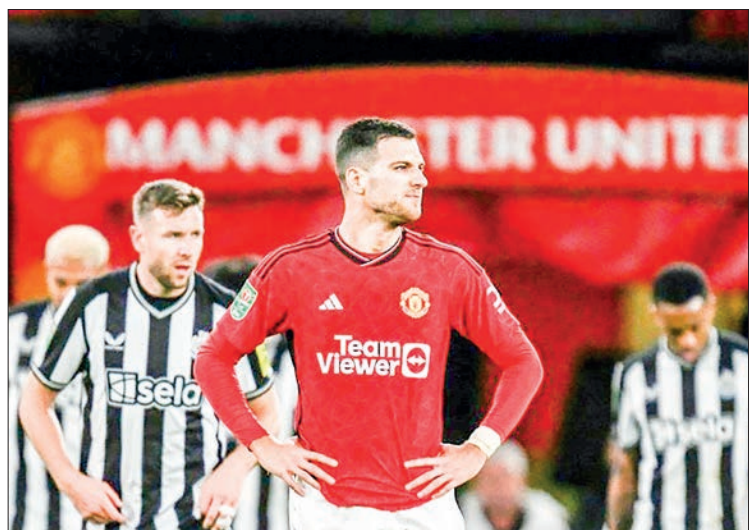
Manchester United defender Diogo Dalot during their loss to Newcastle.