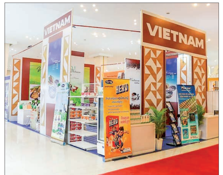
The exhibition booth displayed by Viet Nam seen at the 15 th Cambodia Import-Export Goods Exhibition held in 2022.

Two booths are provided free for Myanmar businesspersons. Yet, they have to bear flight tickets, accommodation costs, food, transport and other costs themselves. The information of those enthusiastic businesspersons who are willing to join the expo must be sent to the trade