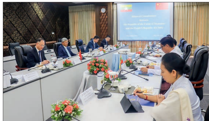
Myanmar-China bilateral consultations in progress yesterday.