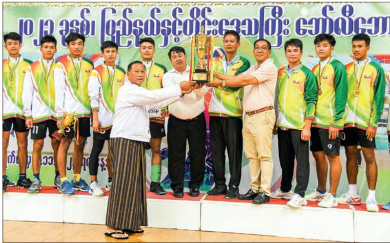
(L & R) : State Administration Council members present championship trophies to the Mandalay Region team (women's) and the Shan State team (men's) respectively yesterday in Nay Pyi Taw.

THE 2023 Inter-State and Region (Men's/Women's) Volleyball Tournament Final and Awarding Ceremony was held yesterday at Wunna Theikdi