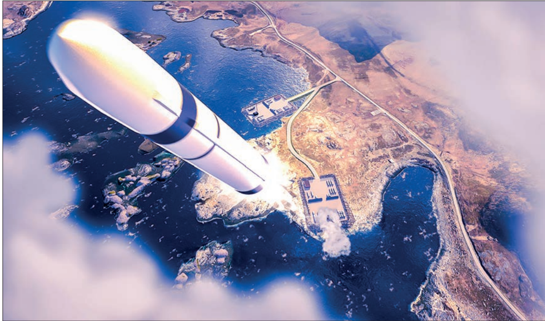
The date of the first launch is not yet known, but Isar Aerospace says it is targeting sending a first launcher to Andoya "within this year" with a first test flight "as soon as possible".

Isar Aerospace plans to complete Europe's first operational orbital spaceport at Andoya, north of the Arctic Circle.