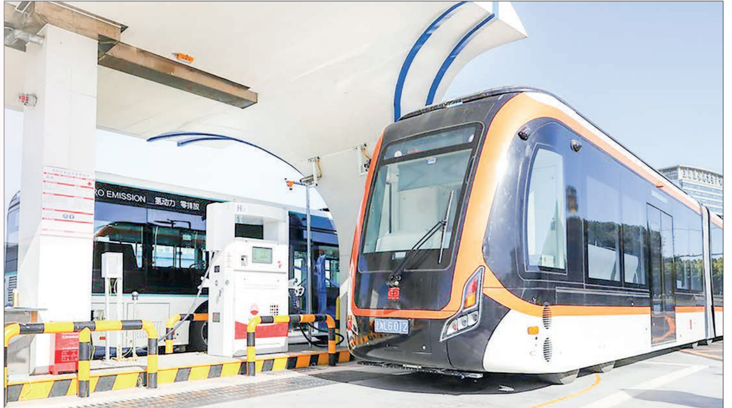
A medium-capacity hydrogen fuel cell-powered public bus (R) approaches a hydrogen refuelling station in Lingang new area of Pudong New Area in east China's Shanghai, 15 December 2022.

The two sides will exchange in-depth views on actions and cooperation against climate change, as well as support for the United Nations climate change conference in Dubai, said the ministry. — Xinhua