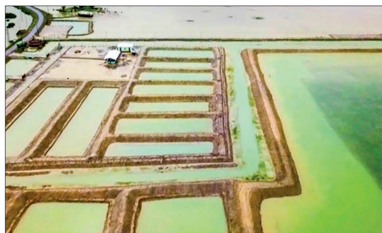
A fish farm near the Minbya-Pauktaw road in Rakhine State.

In addition to the hotel and tourism industry and the oil and gas industry, the future economy of Rakhine State offers good opportunities in maritime trade and cross-country trade. — ASH/MKKS