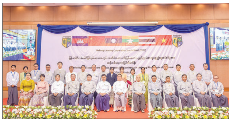
The group documentary photo of the MLC-Toxic Project's Final Completion Workshop yesterday.

The MLC-Toxic Project, which ran from April 2021 to September 2023, aimed to study toxic and non-degradable organic pollutants (POPs) originating from herbicides in the Mekong River Basin. Its primary goal was to establish safety standards