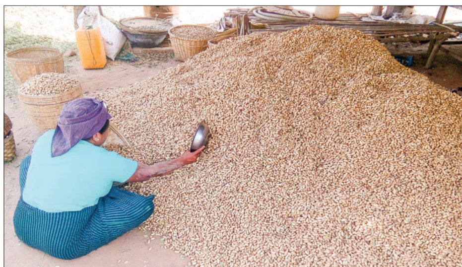
A worker prepares to scale the peanuts.

Despite the price fall in peanuts, the peanut oil price did not decline accordingly and it stayed strong at above K15,000 per viss.