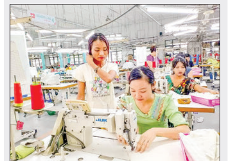
Dressmakers are seen in a garment factory workplace.

It aims to create job opportunities for locals. This being so, the training will also help find the jobs. Those who wish to attend the training can enrol through phone numbers 09 940858350, 09 450723262, 09 9403912570, 09 784085794 and 09 969865024. — NN/EM