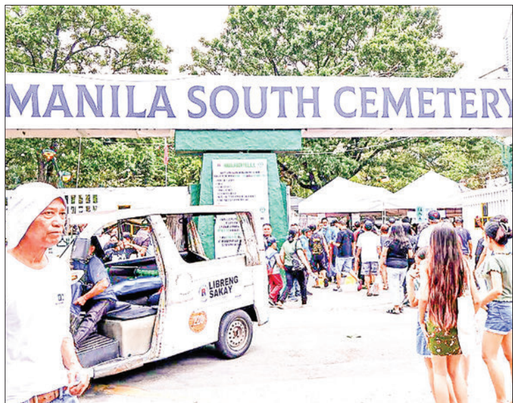
In Manila, many people visited graveyards, having picnics on tombstones or quietly praying at their loved ones' resting places.

On All Saints' Day in the Philippines, people brought flowers, candles, and food to cemeteries, including the Manila North Cemetery, to pay their respects to the deceased, with many holding picnics or offering prayers at their loved ones' graves.