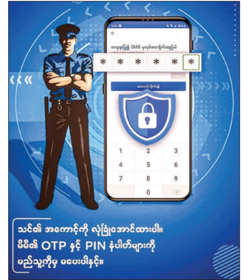
The photo shows a warning advertisement of online financial scams of a private bank.

For the Central Bank to take timely action, Section 132 of the Financial Institutions Law, in exercise of the powers