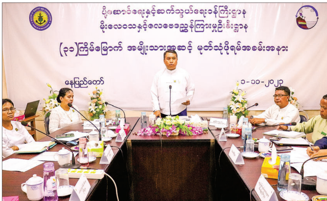
The 31 st Monsoon Forum 2023 of the Department of Meteorology and Hydrology in progress in Nay Pyi Taw yesterday.

THE opening ceremony of the 31 st Monsoon Forum 2023 of the Department of Meteorology and Hydrology (DMH) was held at the Multi-Hazard Early Warning Centre in Nay Pyi Taw yesterday. Dr Kyaw Moe Oo, Director-General of the Department of Meteorology and Hydrology delivered the opening remarks.