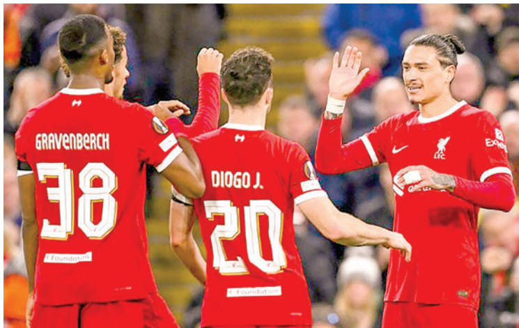
Liverpool have their sights set on a trophy clean-sweep. PHOTO: AFP/FILE

"They have dreams, and who am I to stop them believing that we can achieve, or achieve the impossible? — AFP