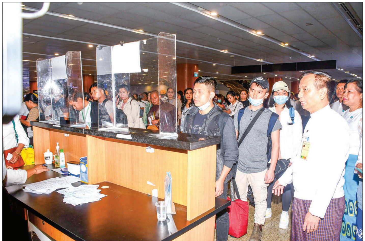
Myanmar returnees are queuing up for immigration process on their arrival at the Yangon International Airport yesterday.

T HE second batch of three Myanmar nationals stranded in Israel were safely evacuated yesterday.