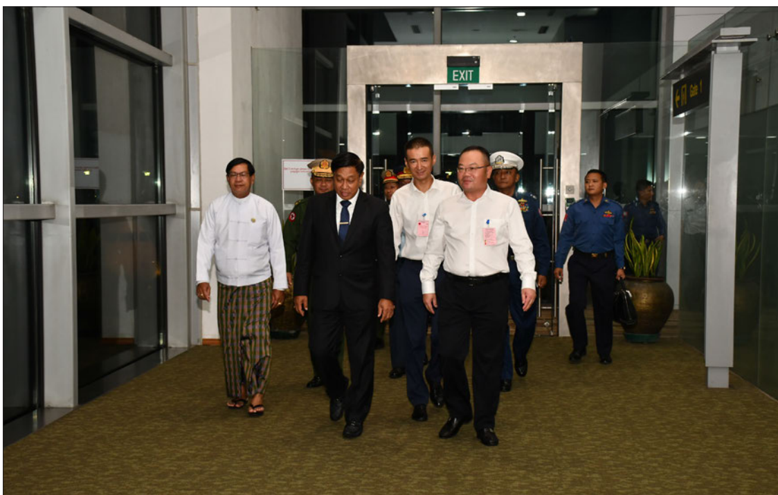
Union Minister for Defence Admiral Tin Aung San is seen being welcomed back on his arrival from China yesterday.

MYANMAR delegation led by State Administration Council Member Deputy Prime Minister Union Minister for Defence Admiral Tin Aung San arrived back in Myanmar yesterday