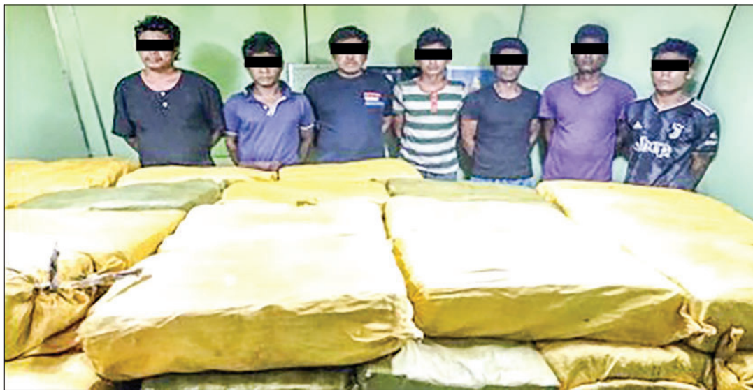
Seven offenders are seen along with confiscated ice (crystal methamphetamine).

ACCORDING to information that the transnational drug cartels will transport the drugs to Malaysia by sea, the Myanmar Navy conducted inspections about 157 miles from the southwest of Kawthoung on 30 October.