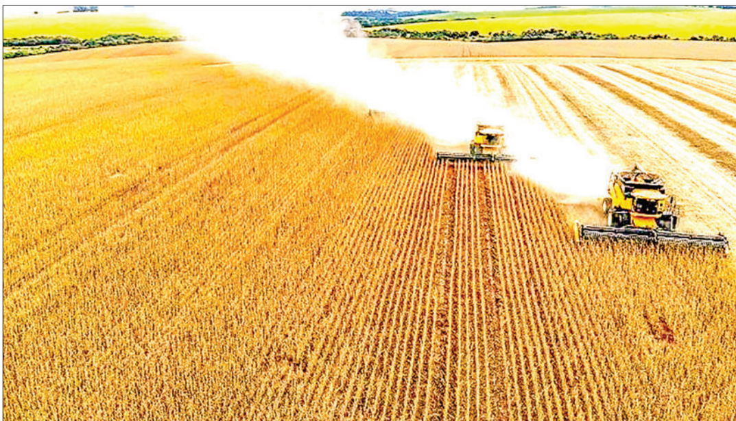
Brazil passed the United States as the world's biggest soy and beef exporter more than a decade ago.

Brazil's emergence as an agricultural giant goes back to Portuguese colonial times. Fortunes were made here on a succession of commodities: sugarcane, then cotton, rubber and finally coffee, which reigned supreme for more than a century. — AFP