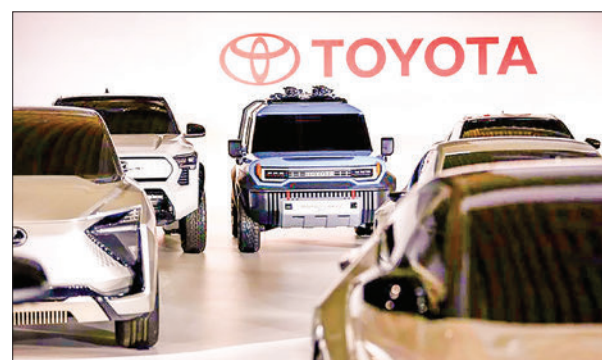
Toyota will become the first Japanese company with sales of over 40 trillion yen if the forecast is achieved.

The yen's weakening was a major driver for the