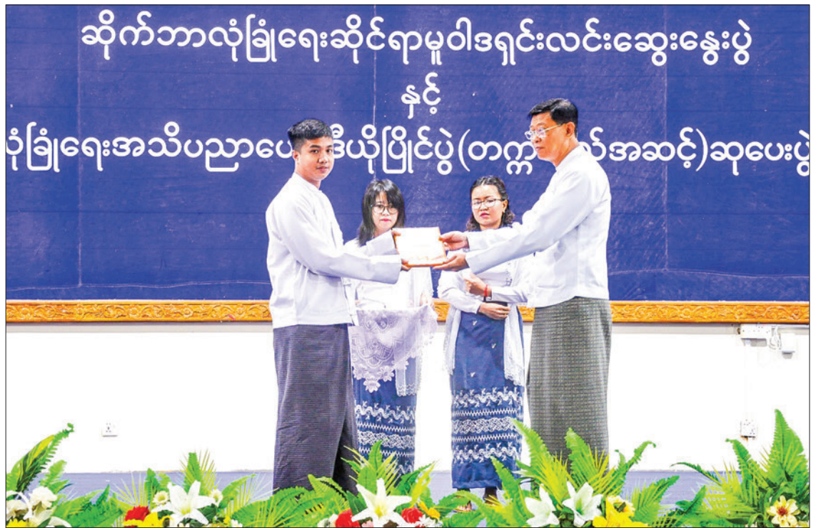
State Administration Council Member Deputy Prime Minister Union Minister for Transport and Communications General Mya Tun Oo awards a winner of the competition yesterday.

Next, the relevant official of the Information Technology and Cyber Security Department explained the work processes in cybersecurity policy and the Chief Information Officer (CIO) raised questions.