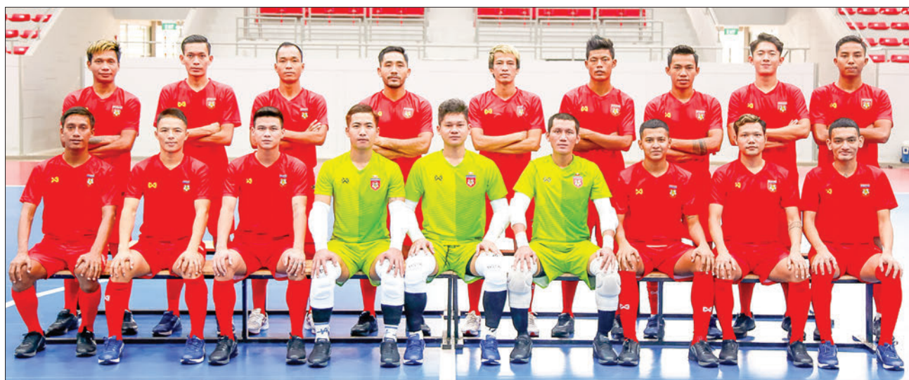
Myanmar national men's futsal team is seen posing for the group photo.

Myanmar advanced to the tourney after securing six points with two wins and one loss in the qualifiers held in Tajikistan last month. — Ko Nyi Lay/KZL