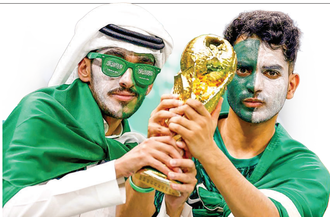
Saudi Arabia supporters holding a replica of the World Cup trophy at last year's tournament in Qatar.