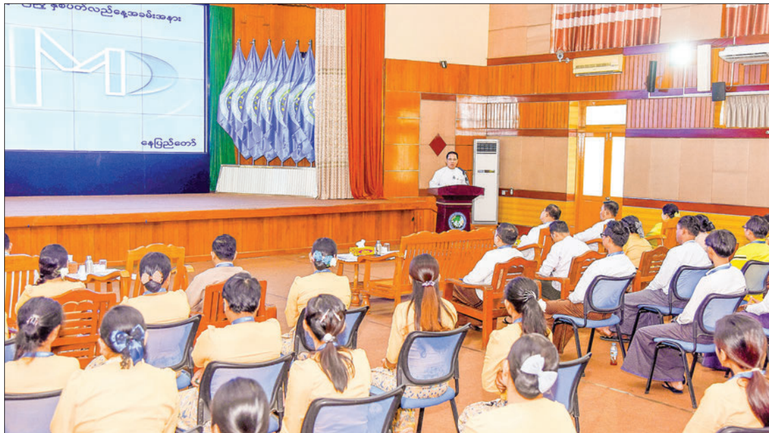
The anniversary ceremony of the Media Development Department of the Ministry of Information in progress at the assembly hall of the Ministry of Information in Nay Pyi Taw yesterday.

In his opening speech, the Union Minister mentioned that it has been a year since the establishment of the Media Development Department, which aims to support the growth of the private media sector in Myanmar and make it a significant player in the