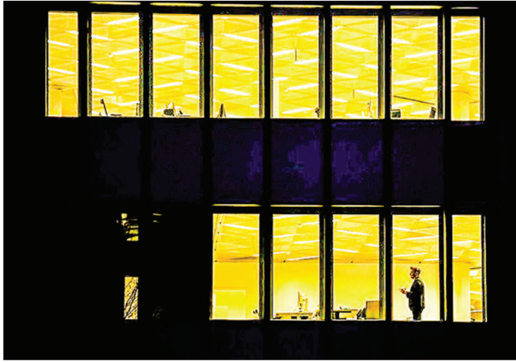
A study by the Hans-Boeckler foundation found more than 80 per cent of Germans would support a four-day week.

The four-day workweek is growing in popularity in Germany, aiming to address worker shortages and maintain competitiveness, but it faces skepticism from some economists and managers.