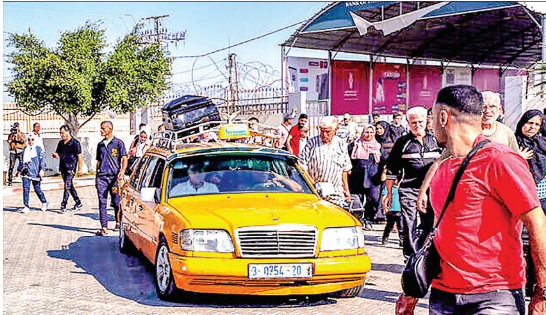
People enter the Rafah border crossing in the southern Gaza Strip before crossing into Egypt on 1 November 2023.

HERE are key developments from the past 24 hours: