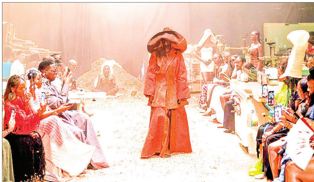
A model wearing clothes by Nigerian fashion designer Bubu Ogisi walks down the runway at her fashion show, Shadows, in Lagos on 29 October 2023.

WEARING one of her trademark large hats and dark glasses, Nigerian designer Bubu Ogisi puts a group of models through final fittings in preparation days for Lagos Fashion Week – one of the cultural highlights in Nigeria's economic capital.