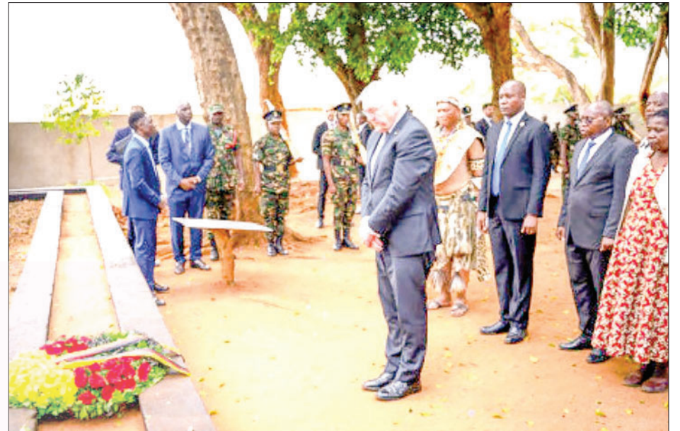
German President Frank-Walter Steinmeier lays a wreath at the monument in Songea's Memorial Park together with descendants of the heroes of the Maji Maji War on 1 November 2023.

Steinmeier said Germany was ready to work with Tanzania towards a "communal processing" of the past.