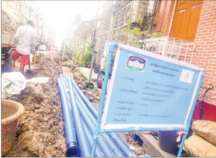
The replacement of old water pipelines in Lanmadaw Township is in progress.

RESIDENTS of Lanmadaw Township informed The Global New Light of Myanmar (GNLM) that the replacement of old water pipes and the installation of water meters in six townships in Yangon have made it easier for users to access piped water.