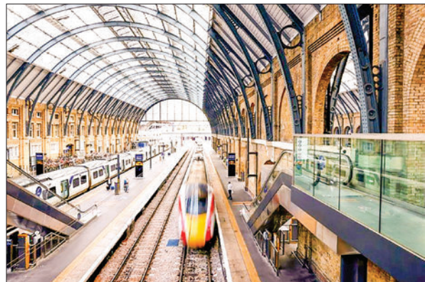
Train operators had proposed axing ticket offices.

"The government failed to come clean on the impact of these proposals for accessibility and job security (of ticket office staff) and now have been forced into a humiliating climbdown, disowning the very proposals ministers championed from the start," she said. — AFP