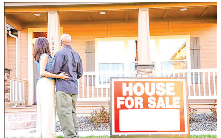
A government report revealed that in New York, Black and Hispanic households have a much lower rate of homeownership compared to white households across all regions of the state.

BLACK and Hispanic households in New York state — home to America's financial capital — own their homes at half the rate of white households, a government report said Tuesday.