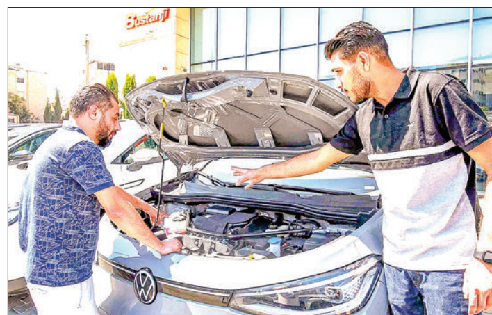
A salesman at a car dealership assists a customer inspecting an electric vehicle for sale at the premises in Amman on 21 September 2023. PHOTO: AFP

Zadari’s car is one of 60,000 EVs now registered in Jordan – still just a fraction of the total 2.2 million registered vehicles, but the fastest-growing segment. — AFP