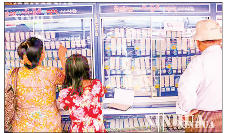
Some people are seen buying Aung Bar Lay lottery tickets in a lottery outlet.

The prizes include one K500 million prize, one K200 million prize, one K100 million prize, five K50 million prizes, six K20 million prizes, nine K10 million prizes, 12 K5 million prizes, 18 K2 million prizes, and 18 K1 million prizes. Additionally, prizes from Waiwai Sarsar Padetha will also be awarded. — TWA/CT