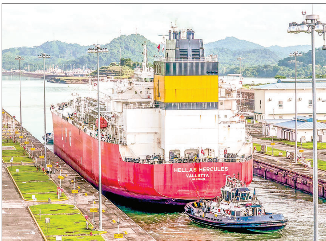
A cargo ship navigates through the Panama Canal in the area of the Cocoli Locks, in Panama City on Thursday, 25 August 2023.

Due to drought conditions, the Panama Canal Authority will progressively decrease the daily ship crossings from 29 to 25, and eventually to 18 ships per day by February.