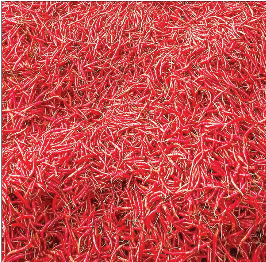
The picture shows dried Moehtaung chilli pepper from Shan State

There is less chance for a further price drop, a trader shared his opinion. In early October 2023, the prices