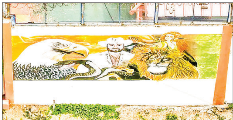
Images of these animals are graffitied on prisons and neighborhoods where the gangs dominate, and inked onto the bodies of their members. PHOTO: STRINGER/AFP

In the port of Guayaquil, which has borne the brunt of the drug violence and gang conflict in Ecuador, both criminals and police keep a sharp eye out for the markings. — AFP