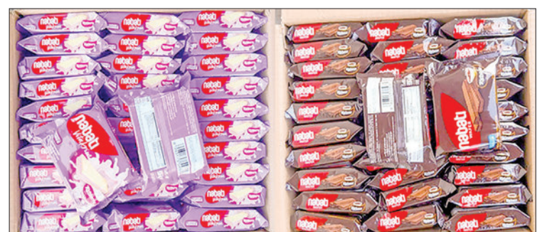
Confiscated illegal foodstuffs in Thilawa container inspection centre.

A total of 26 arrests were made on 18 and 31 October, with an estimated value of about K869.378 million, as reported by the Illegal Trade Eradication Steering Committee.