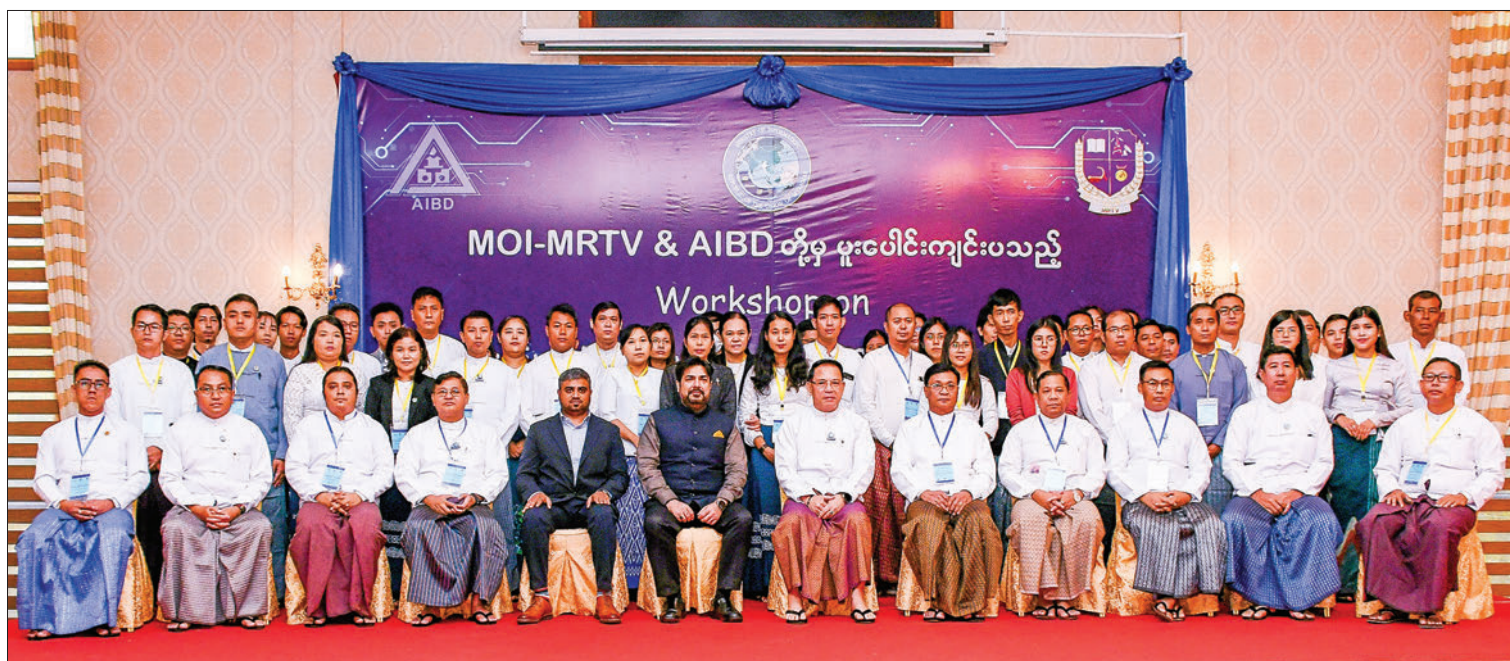
Union Minister U Maung Maung Ohn poses for the group documentary photograph at the Workshop on Streaming Technologies Content Strategy yesterday.

As such, he noted that TV broadcasters and content creators need to understand streaming technology and streaming monetary policy, management for the streaming process, feedback of audiences, and presentation of stream content to audiences.