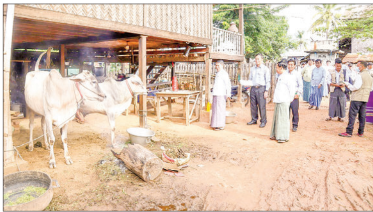
Officials from Livestock Breeding and Veterinary Department conduct a livestock census in Ayemyinthaya Village, Pobbathiri Township of Nay Pyi Taw yesterday.

Breeding and Veterinary under the Ministry of Agriculture, Livestock and Irrigation from 1979-1980 to 1993-1994, but from 1994 to 2017, the livestock census could not be collected on the ground, so it was only possible to record the estimated data by employing statistical methods. In 2018, the livestock census was carried out on a national scale to ensure the accuracy of the basic statistics, which are important for the development of the livestock sector and the prevention and control of animal diseases. To find out the changes in the animal population, an interim census was conducted every year, and a nationwide livestock census was collected every five years. This year's effort is the second nationwide livestock census. — MNA/TH