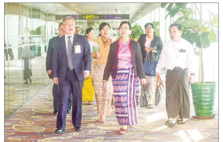
Myanmar delegation led by Deputy Minister Daw Nu Mra Zan leaves for China yesterday to attend the Maritime Silk Road Cultural Heritage Conservation Conference.

The Maritime Silk Road Cultural Heritage Conservation Conference will be held from 3 to 4 November in Nanning, Guanxi Zhuang Autonomous Region, China. — MNA/KZW