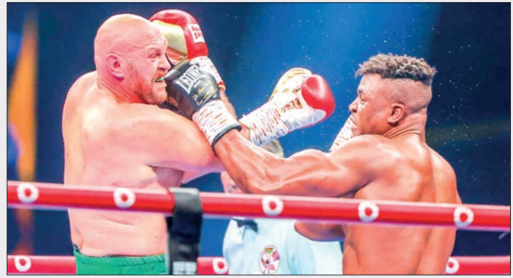
Fury, who earlier this week laughed off his opponent as a "big fat sausage", afterwards acknowledged that the 37-year-old Cameroonian had effectively kept him off-balance.

Shan United will take on Dagon Star FC at YUSC Complex today.