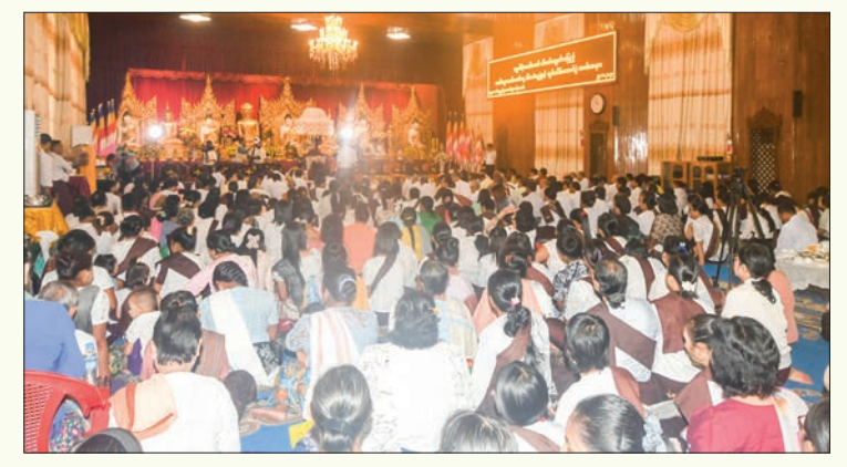
Congregation takes precepts at Shwedagon Pagoda.

venerable Sayadaws. At night, 6,500 oil lamps were lit by the worshipers in dedication to the Lord Buddha. The Botahtaung