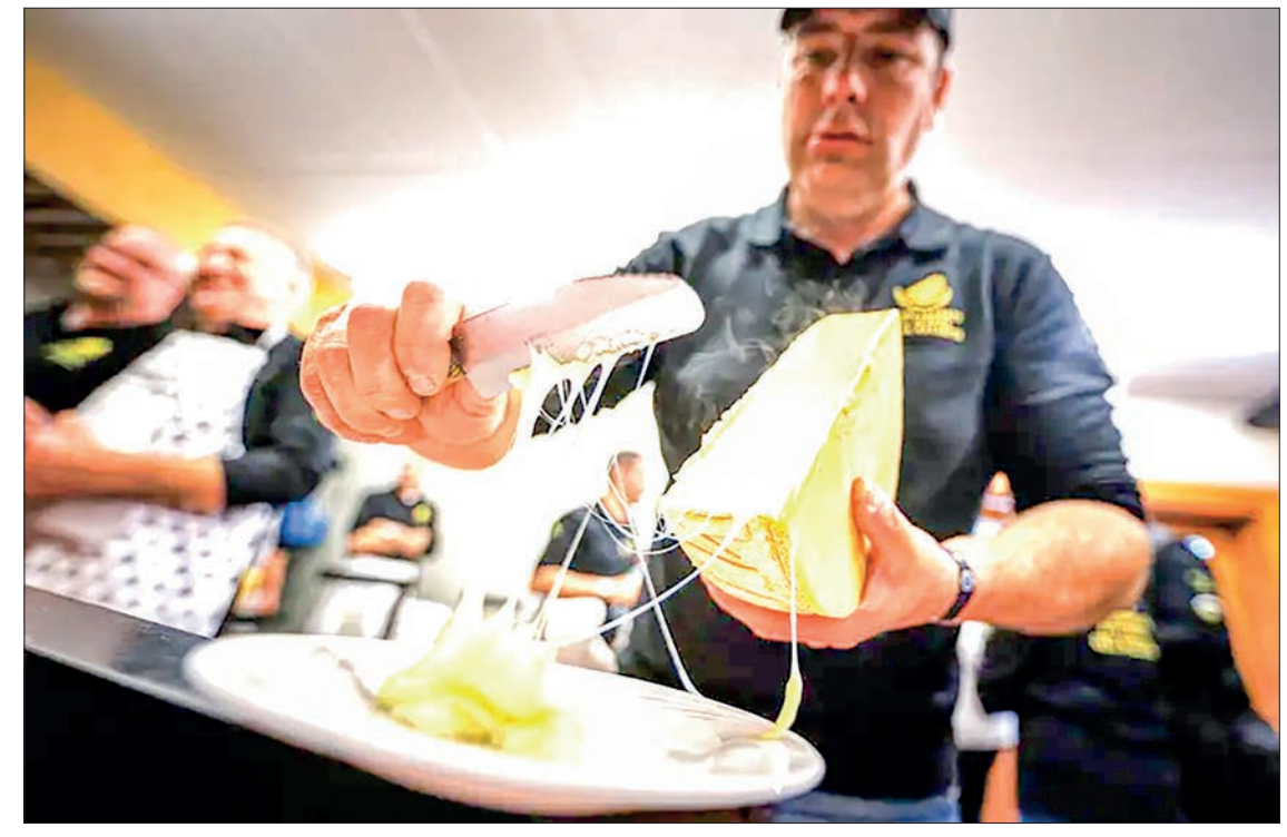
The Swiss native dish dates back centuries to a time when mountain herdsmen would heat their cheese on an open fire.

In the village hall's kitchen, cheese half-wheels are grilled under electric raclette heaters. The grilling can take from 30 sec-