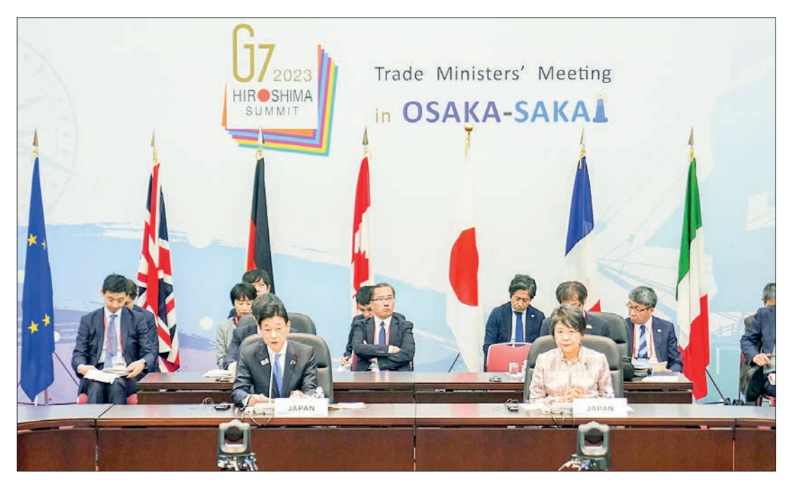
Japanese Economy, Trade and Industry Minister Yasutoshi Nishimura (front, L) and Japanese Foreign Minister Yoko Kamikawa (front, R) attend the first day of a two-day meeting of trade ministers of the Group of Seven countries in Osaka on 28 October 2023.

THE Group of Seven economies agreed Saturday to create resilient supply chains of crucial minerals such as rare earth elements used in electric vehicles with trusted partners, Japan's Economy, Trade and Industry Minister Yasutoshi Nishimura said.