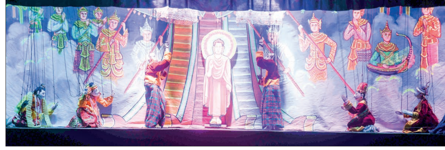
At the marionette troupe competition of Sagaing Region.

THE 24<sup>th</sup> Myanmar Traditional Cultural Performing Arts Competition continued for the sixth day at relevant venues in Nay Pyi Taw yesterday.