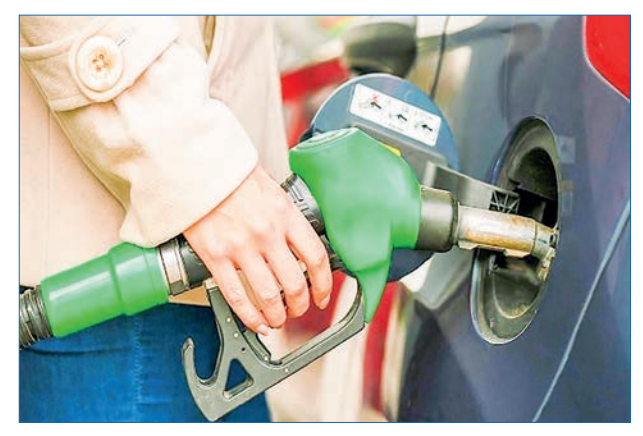
The photo shows the vehicle filling with fuel at one petrol station in Yangon.