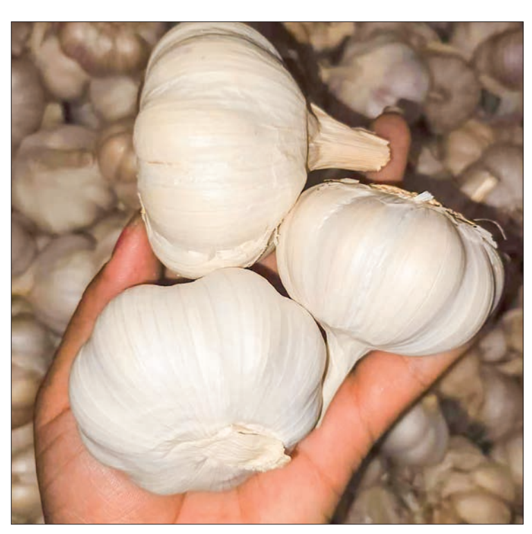
Kyukok garlic being sold in the domestic market.

The prices of rice, onions, and chilli peppers in 2022 and those of black gram, pigeon peas, half of the chickpeas, sugar, and jaggery in 2023 set new records as the highest prices in the market.