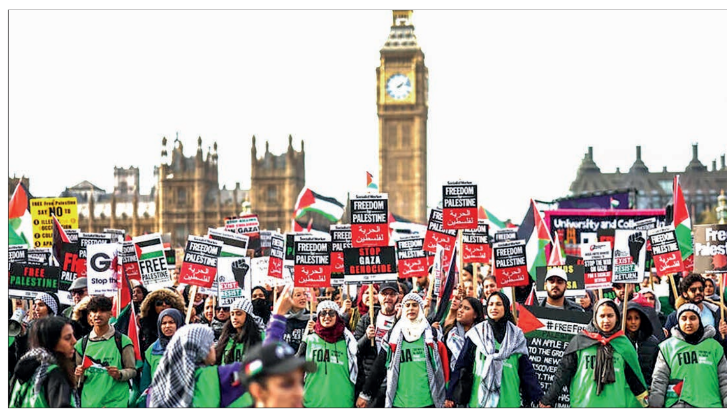
About 100,000 people joined the 'March for Palestine' in London according to British media.

In the UK, tens of thousands of pro-Palestinian protesters marched, urging a ceasefire, as Israel escalated its Gaza Strip assault.