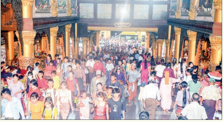
Pilgrims visit Shwedagon Pagoda on Abhidhamma Day yesterday.

also alive with pilgrims offering alms, water, flowers, oil lamps to the Buddha images and stupas as well as receiving