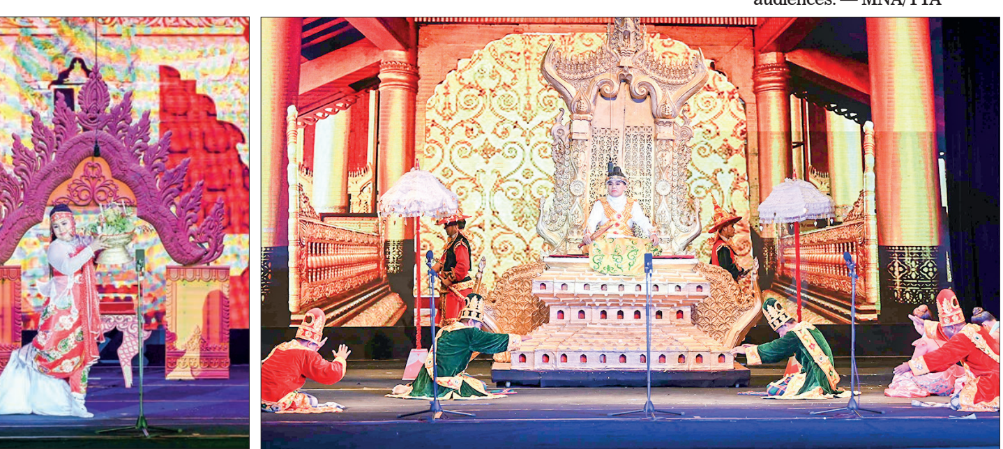
Bago Region team competes in Mahawthada drama at the training theatre of Ministry of Religious Affairs and Culture in Myanmar Traditional Cultural Performing Arts Competition in Nay Pyi Taw yesterday.

Moreover, contestants took part in the song-composing amateur level (second class), the men's and women's amateur level (first class), basic and higher education boys' and girls' Donmin