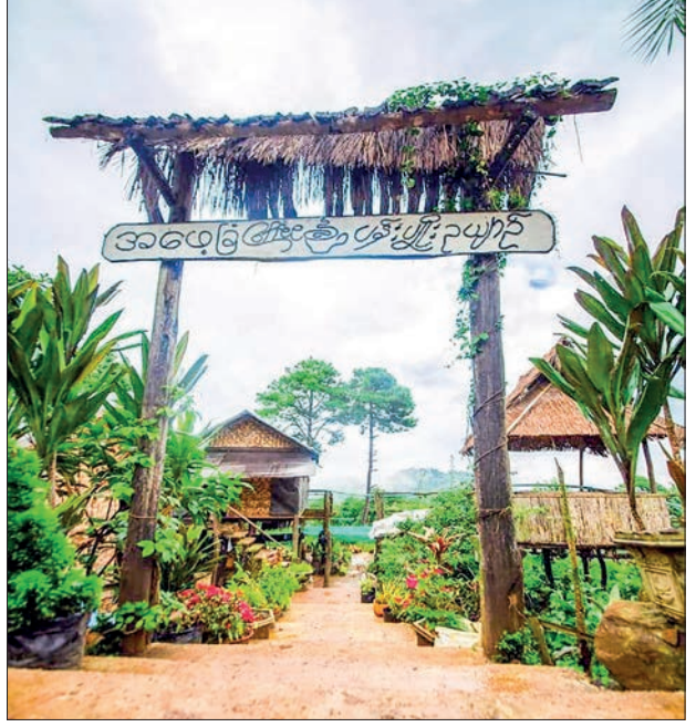
Aphaychan resort attracts travellers for enjoying scenic beauties in Kalaw Township.

according to the Digital & Learning Platform Committee.