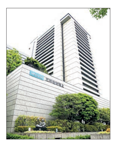
Photo taken on 1 August 2023, shows the headquarters of Mitsui Sumitomo Insurance Co in Tokyo.

an industry-first security service that pairs cameras and artificial intelligence to detect possible home intruders, according to people familiar with the matter.