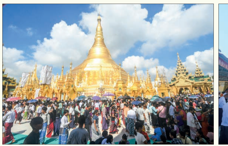
Shwedagon Pagoda.

Similarly, at the ceremony of the full moon day of Thadingyut and the Abhidhamma Day held by the Trustees of the Kaba Aye pagoda, the pilgrims received the nine precepts from