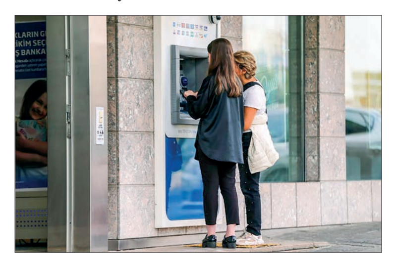
People withdraw money from an ATM machine in Ankara, Türkiye, on 26 October 2023.

Despite a U-turn in monetary policy following the general elections in May, Turkish inflation has seen a resurgence over the past three months, standing at 61.53 per cent in September. — Xinhua