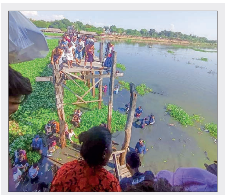
The photo shows those who fell into the water when U Bein Bridge collapsed.