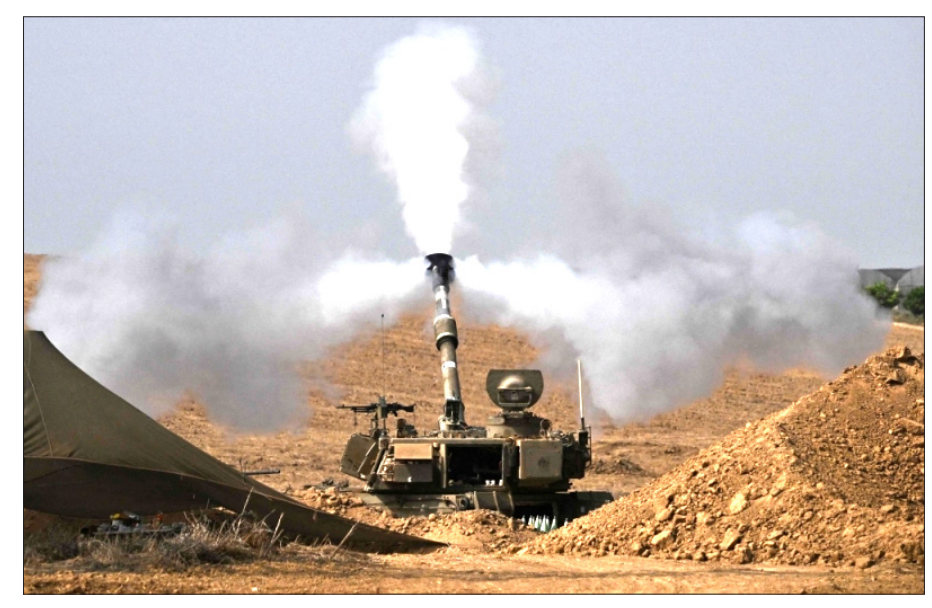
The Israeli military fires mortar shells toward the Gaza Strip on 28 October 2023.

These airstrikes are part of an intensified ground offensive in the Gaza Strip.