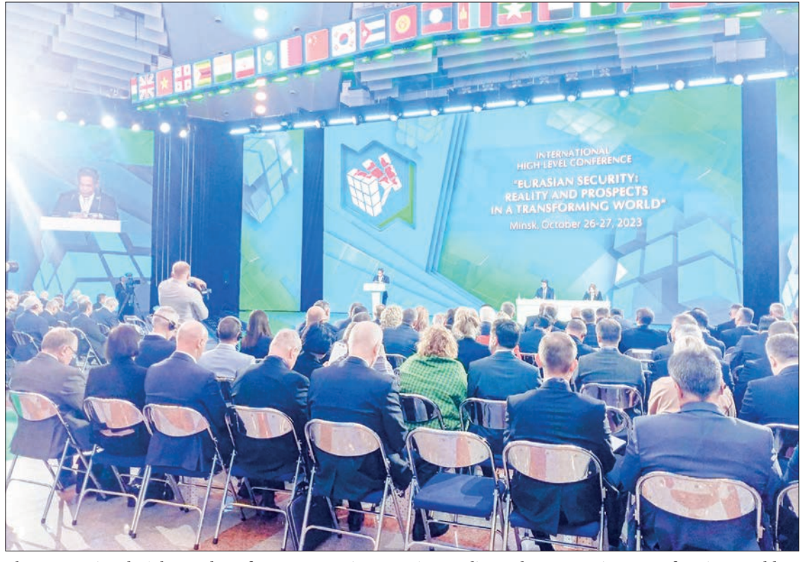
The International High-Level Conference "Eurasian Security: Reality and Prospects in a Transforming World" in progress in Minsk city of Belarus on 26 and 27 October 2023.

In the Union Minister's statement, the Union Minister emphasized the necessity of a global security framework anchored in multilateralism. Stressing Myanmar's unwavering dedication to peace and security, the Union Minister highlighted the transformative shifts characterizing today's international relations. Emphasizing the vital role of dialogue and collaboration between nations, he expressed concern over deepening global conflicts. Acknowledging the significance of organizations like the SCO and CSTO in crisis resolution, Myanmar reasserted its commitment to principles of sovereignty, non-interference, and mutual respect in international relations. The Union Minister underscored Myanmar's readiness to collaborate with regional and international partners to foster a secure, prosperous, and harmonious Eurasian region. Encouraging joint efforts for peace and prosperity, he urged the diverse Eurasian populace to unite in shaping a future defined by tranquility and