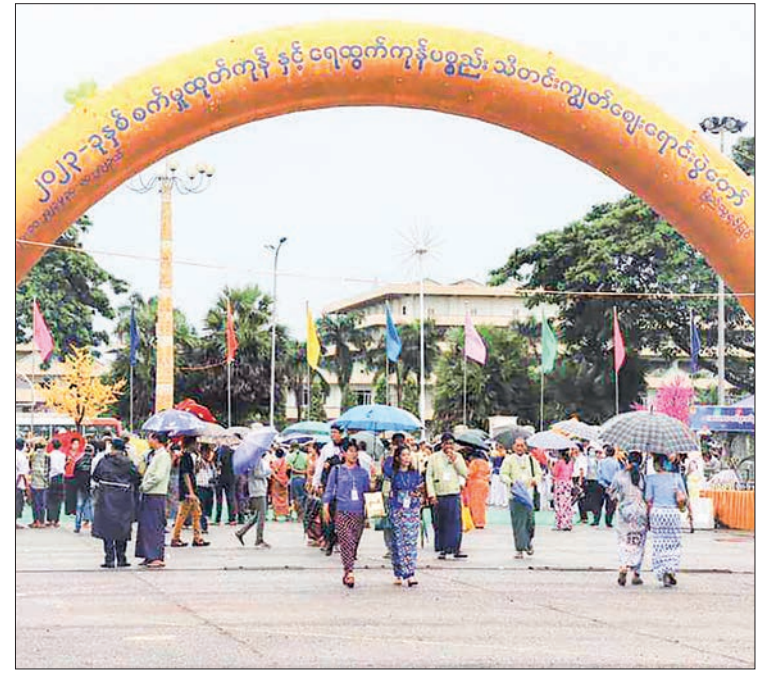
The opening ceremony of the Thadingyut Festival Expo is seen.

THE Yangon Region chief minister said that products produced by businesses in the region and state can be purchased in one place at a low price at the People's Square Thadingyut Festival Expo.