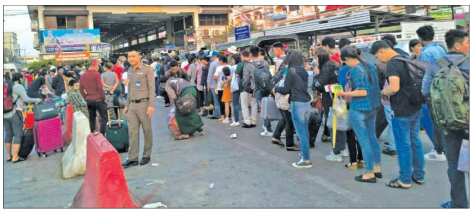
Myanmar nationals and workers are seen waiting to enter Thailand through the Myawady border.

According to the decisions made by the Thai government in early October, Myanmar migrant workers in Thailand have been allowed to live and work temporarily from 1 October 2023 to 13 February 2025.