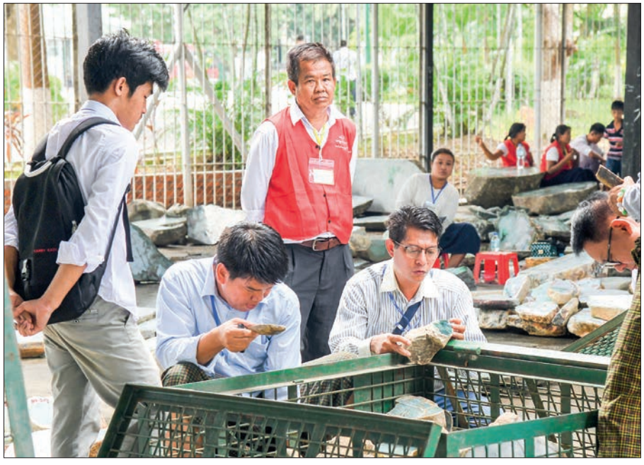
Gem merchants evaluating jade lots at the emporium yesterday.

The deputy minister, the director-general, senior officials and a total of 120 staff members joined this programme.— MIFER