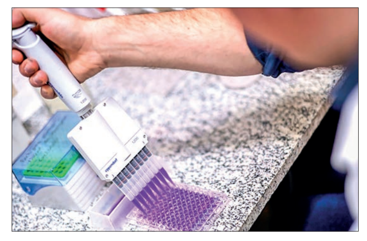
Scientists say the vaccine is aimed at recovering addicts who are off cocaine and want to stay that way.

The project won top prize last week—500,000 euros