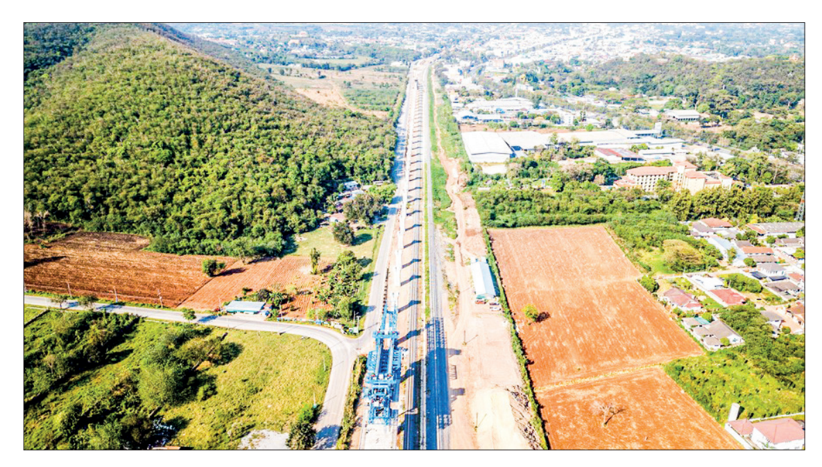
This aerial photo taken on 23 February 2023 shows a construction site of the China-Thailand railway in Nakhon Ratchasima province, Thailand.

Thailand plans to build a train system connecting Bangkok to Khon Kaen, Nong Khai, and reaching China, in support of the Belt and Road Initiative.