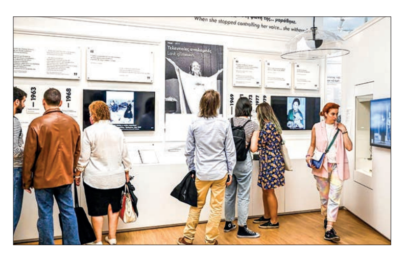
Visitors stand in one of the rooms of the Maria Callas Museum during its official opening. PHOTO: AFP

A listed four-storey building from the 1920s that previously housed a hotel, the custard-coloured museum near central Syntagma Square took over a decade to complete at a cost of 1.5 million euros ($1.6 million). — AFP