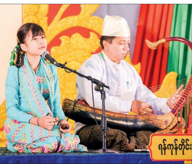
At the Maha Gita singing contest.

State Administration Council members, the chairman of the Constitutional Tribunal of the Union, Union-level officials, deputy ministers, ministers for Ethnic Affairs and Ministers for Social Affairs of regions and states, advocates-general, relevant officials, departmental staff At the dancing competition.