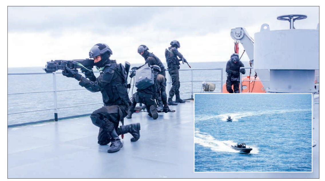
The photo shows the naval exercise named Sea Shield-2022 conducted on 5 July 2022.