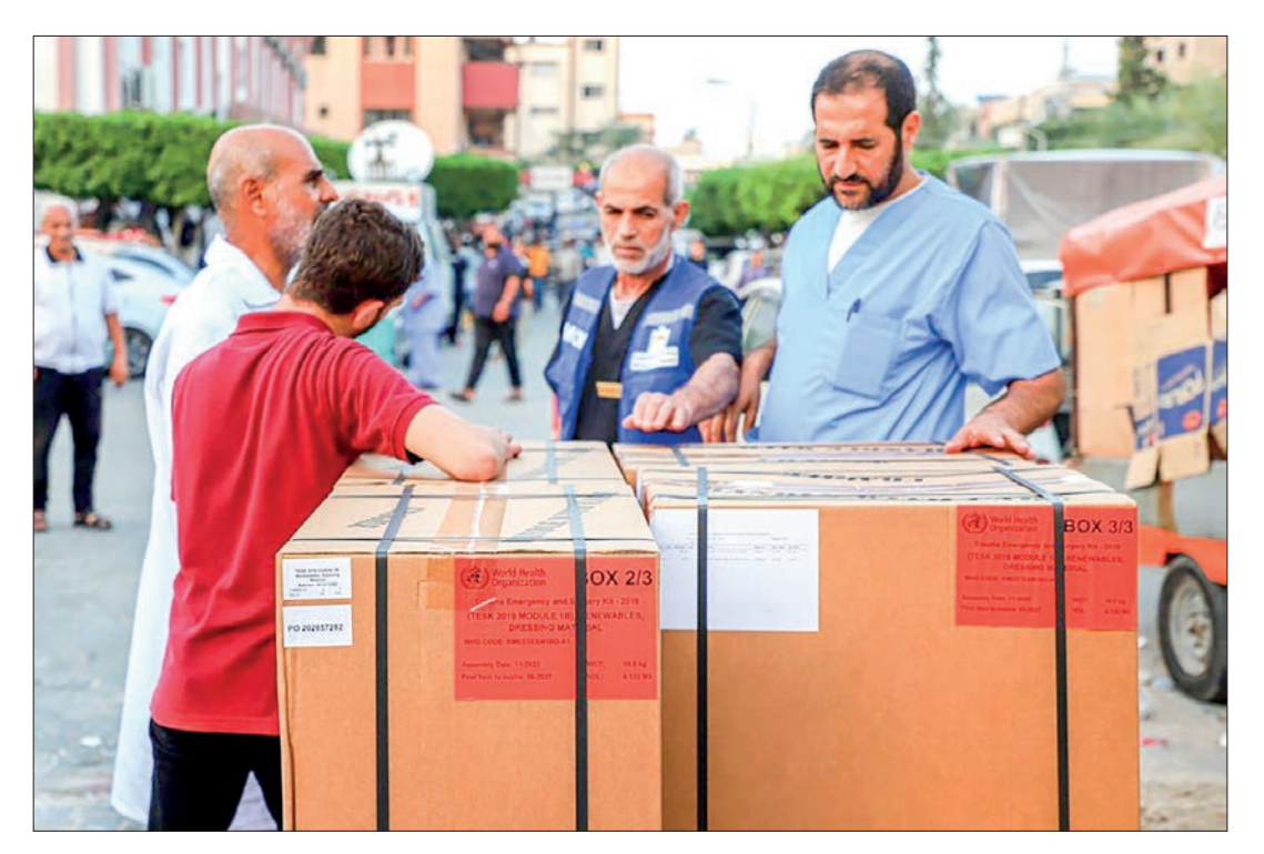
People receive a batch of humanitarian supplies that entered Gaza from the Rafah crossing in Khan Younis, southern Gaza Strip, on 23 October 2023.

HERE are key developments from the past 24 hours: