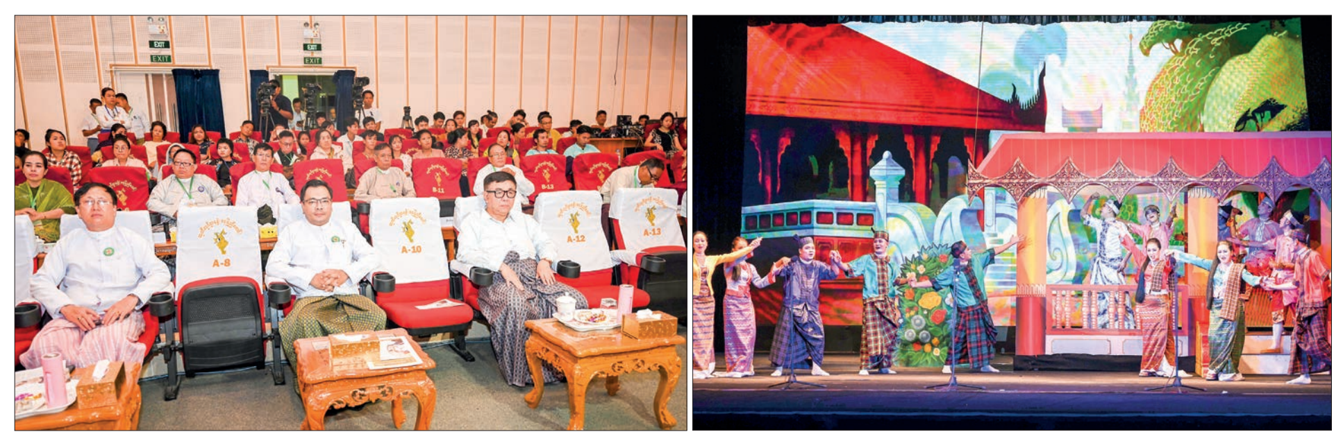
State Administration Council members and dignitaries watch the Mahawthahta drama competition performed by the Ayeyawady Region cultural troupe yesterday.

he 24<sup>th</sup> Myanmar Traditional Cultural Performing Arts Competition (Central Level) continued for the fourth day at designated venues in Nay Pyi Taw yesterday.