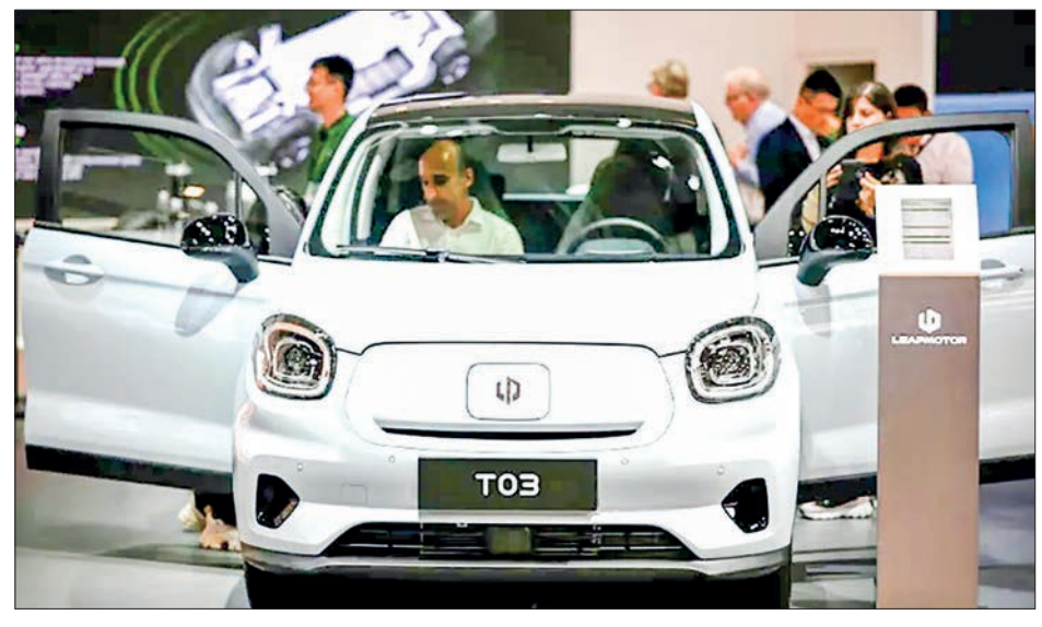
Stellantis will pay China's Leapmotor $1.6 billion for a 20 per cent stake.

The two firms will also establish a Stellantis-led joint venture, Leapmotor International, which will hold "exclusive rights for the export and sale, as well as manufacturing, of Leapmotor products outside Greater China", Stellantis said. — AFP