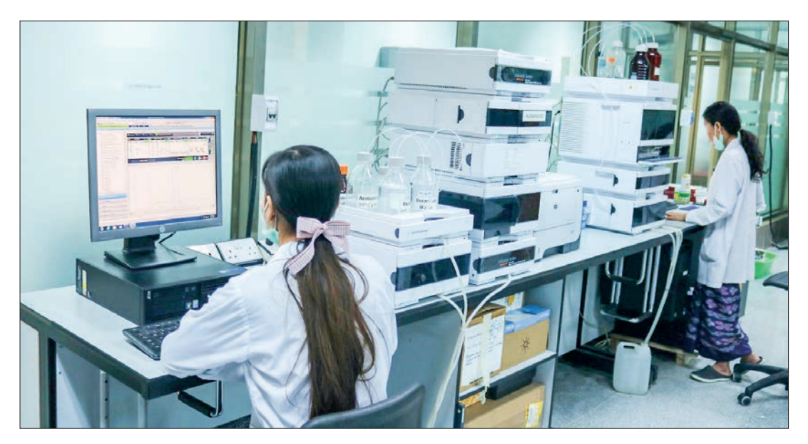
Food laboratory staff working at the food and Drug Administration Department (Nay Pyi Taw).

THE Department of Food and Drug Administration (FDA) under the Ministry of Health notified food importers of seeking a mandatory Import Health Certificate (IHC).