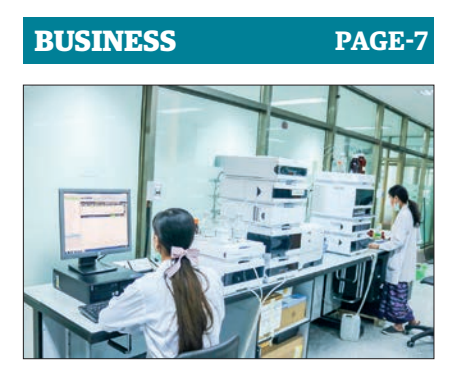
Import Health Certificate for imported food obligatory: FDA

77 elephant costume troupes parade Kyaukse Myoma Market in dummy elephant festival