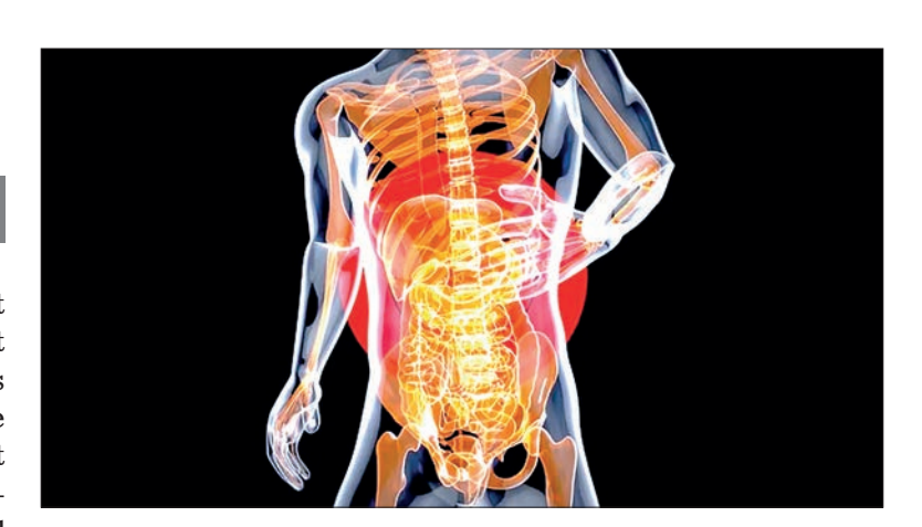
To date, very little is known about the diversity of foodborne yeasts and their potential effect on gut microbiota and gut health.