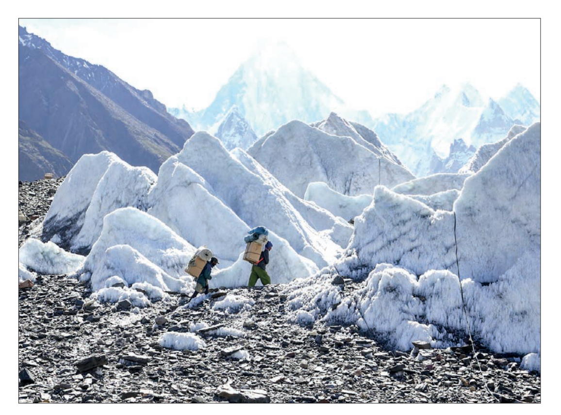
Pakistani porters hike the Baltoro Glacier, 14 July 2023.