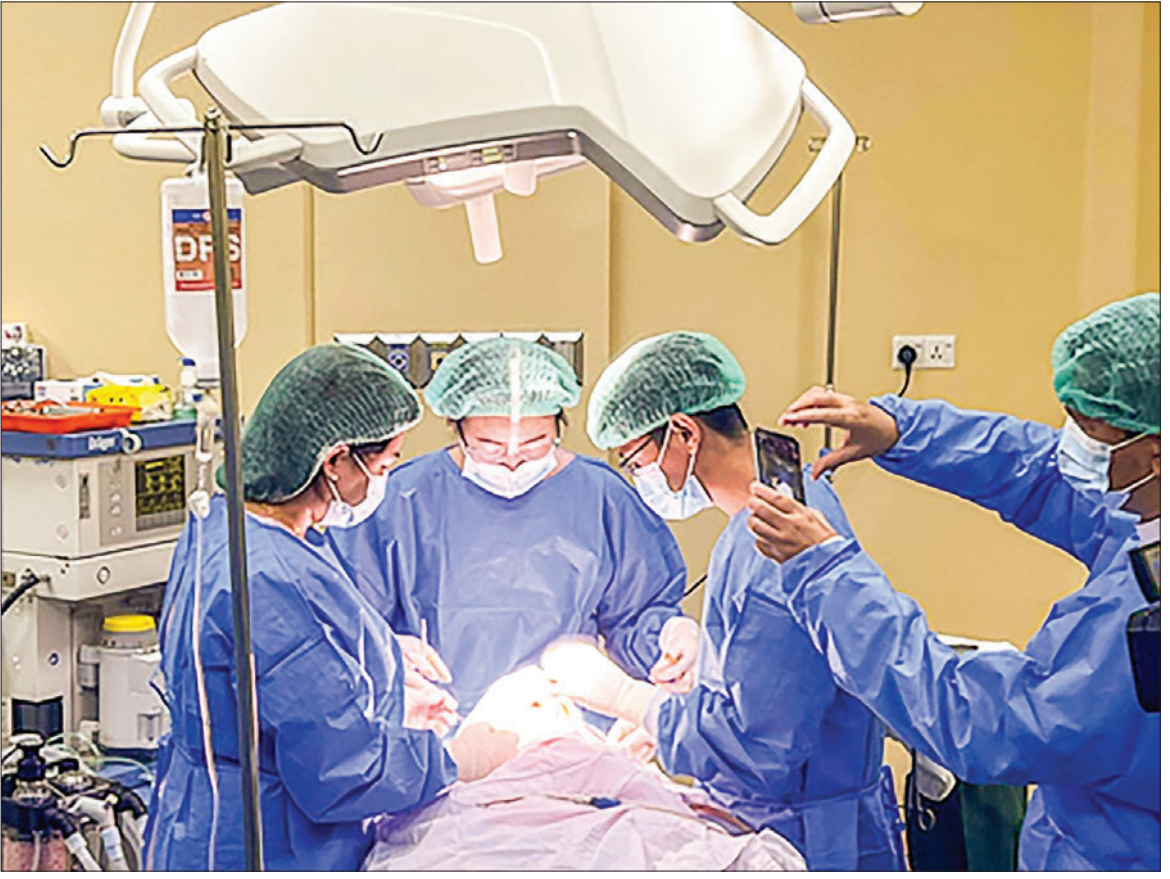
Performing Cleft Lip and Palate Surgery.