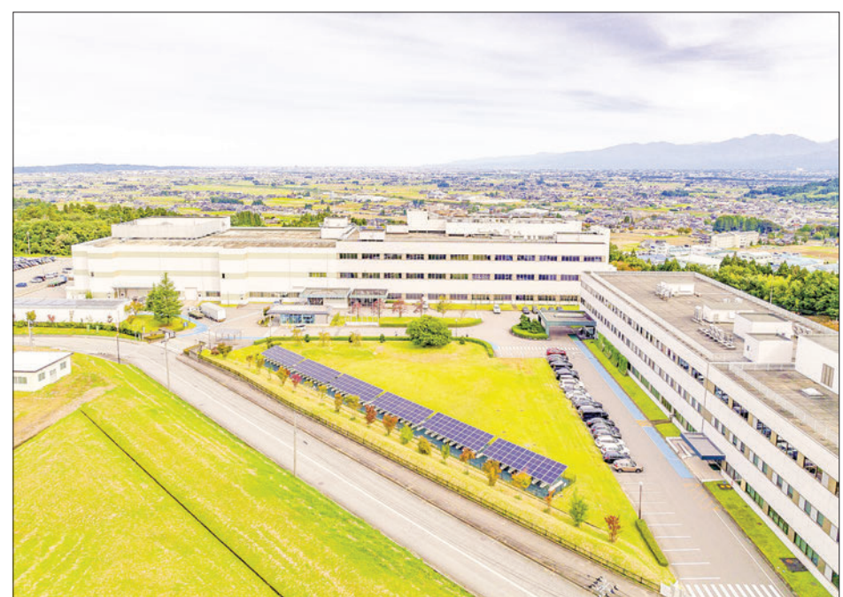
Undated photo shows Kokusai Electric Corp's manufacturing base in Toyoma, central Japan.

It has a manufacturing base in the central Japan prefecture of Toyama and is constructing another factory there. — Kyodo