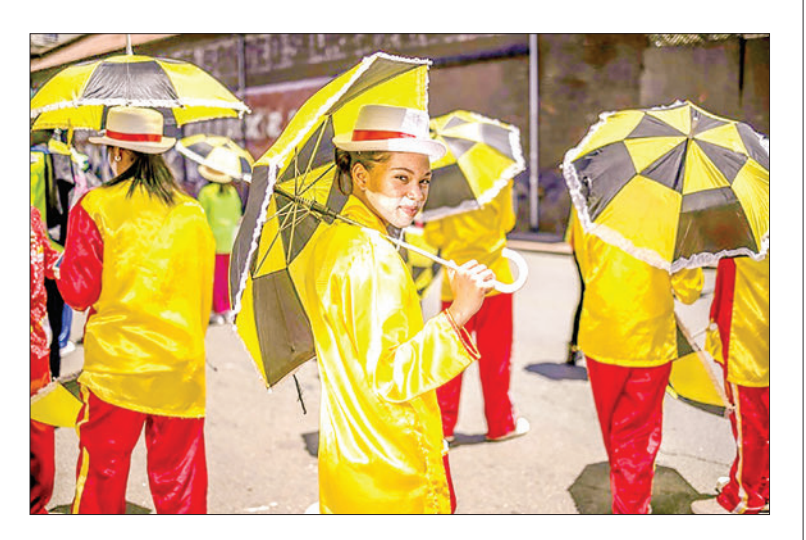
The "No Man's Land" procession was put together by South African artist William Kentridge.