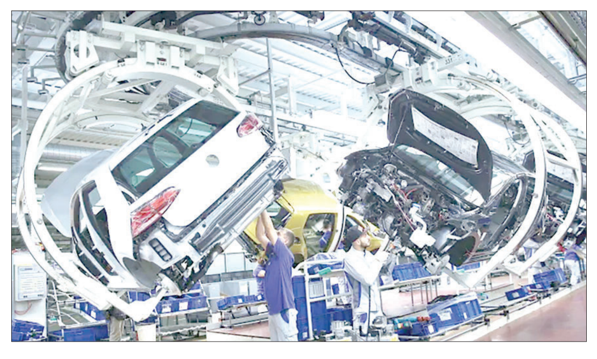
Volkswagen employees work on a Golf VII car at an assembly line at a VW plant in Wolfsburg, Germany, on 9 March 2017.

Analysts have cautioned that the Israel-Hamas conflict poses new risks to Germany's efforts to recover from an economic downturn.