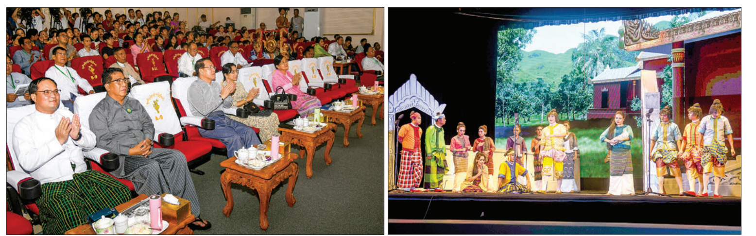
Union Minister U Maung Maung Ohn, his wife and dignitaries enjoin the Mahawthata play competition of the Yangon Region team at the Myanmar Traditional Cultural Performing Arts Competition yesterday in Nay Pyi Taw.

THE 24<sup>th</sup> Myanmar Traditional Cultural Performing Arts Competition (Central Level) continued its second day at designated venues in Nay Pyi Taw yesterday.