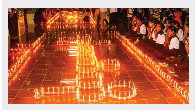
The oil lamp lighting festival in progress on Mandalay Hill in 2020.

The construction of Aung San Stadium commenced in 1906, originally known as BBA (Burma Athletic Association) Ground. It was later renamed Aung San Stadium on 17 October 1953. — TWA/ KZW