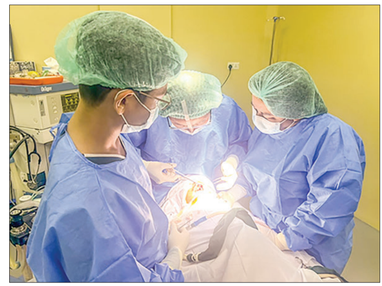
Pre-Conference Activities at Pathein General Hospital

* Global Perspective: The Myanmar Dental Health Science Conference brings together professionals from around the world. This diverse perspective can help attendees gain a broader understanding of dental