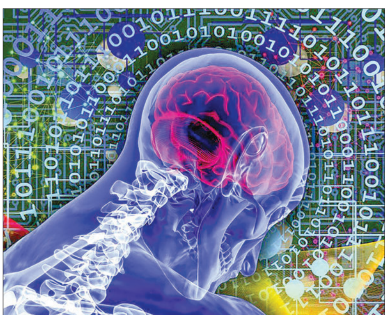
The WHO said AI could strengthen clinical trials, improve medical diagnosis and treatment and supplement medical knowledge and skills.

MDHSC 2023 will be held with the following objectives: To achieve warm friendship between dental health personnel in various States and Regions, To participate in learning updated information on clinical and dental