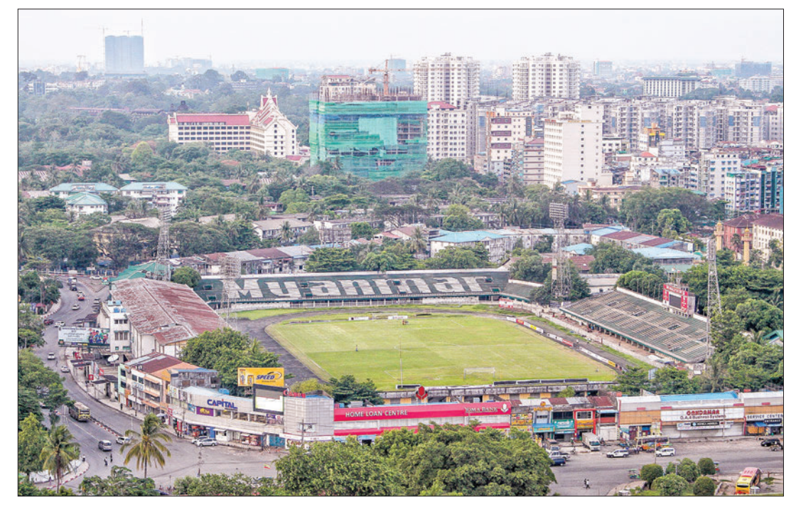
An aerial view of Aung San Stadium in the centre of Yangon City.

THE project team from China Architectural Design and Research Institute of Tongji University (Group) Co Ltd met officials from the Yangon City Development Committee to discuss the reconstruction of Aung San Stadium on 25 October.