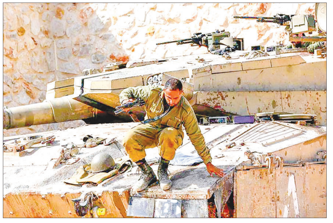
An Israeli soldier jumps off a Merkava tank at a position in an undisclosed location on the border with Lebanon, 22 October 2023.

Six Gaza hospitals have already shut down because of a lack of fuel, the World Health Organization has said. A small number of aid trucks have entered Gaza since the weekend, but they are only a fraction of the usual flow across the border.