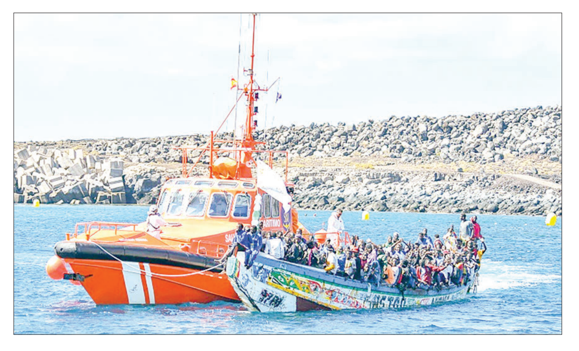
A Spanish maritime rescue vessel assists a boat carrying migrants on the island of El Hierro.

While the migrants were arriving and receiving assistance, tourists in the area were enjoying their meals at restaurant terraces located close by.