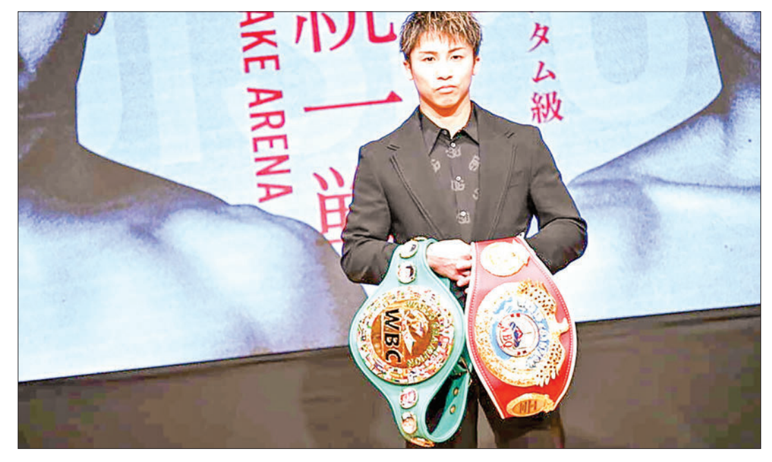
Japan's Naoya Inoue announces Marlon Tapales of the Philippines will be his next opponent in a superbantamweight world title unification bout on 26 December.