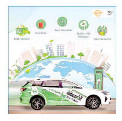
Grab launches new e-taxi service at Nay Pyi Taw and Yangon Airport.

Passengers who want to use the Grab EV Taxi service can