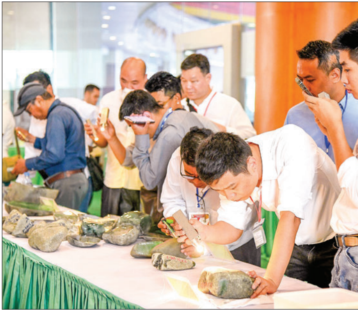
Gem traders evaluating jade lots at the emporium yesterday.

THE fourth day of the 2023 Mid-Year Gems Emporium was held at Maniyadana Jade Hall in Nay Pyi Taw on 23 October.