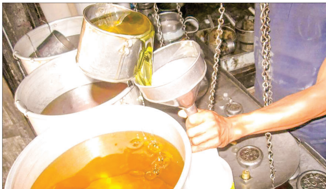
The domestic consumption of edible oil is estimated at one million tonnes per year.

To tackle the overcharging, the Consumer Affairs Department under the Ministry of Com-