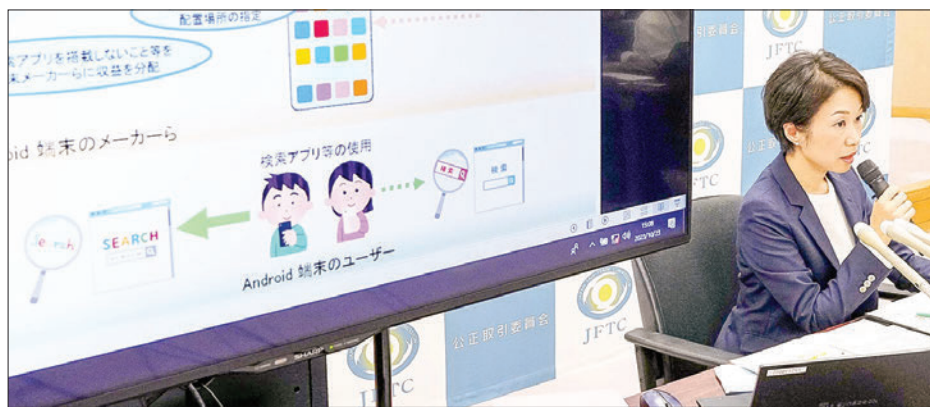
The Japan Fair Trade Commission holds a press conference in Tokyo on 23 October 2023.

JAPAN'S antitrust watchdog has begun an investigation into technology giant Google LLC for allegedly pushing smartphone makers to use its search platform by default on their devices, the fair trade body said Monday.