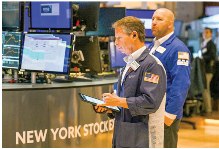
Traders work the floors at the New York Stock Exchange (NYSE) in New York on 11 October 2023.

"The rise in long-term yields is due in part to the resilience of the US economy and the fact the the Fed, even if it plays the prudence card, continues to emphasize the possible need of