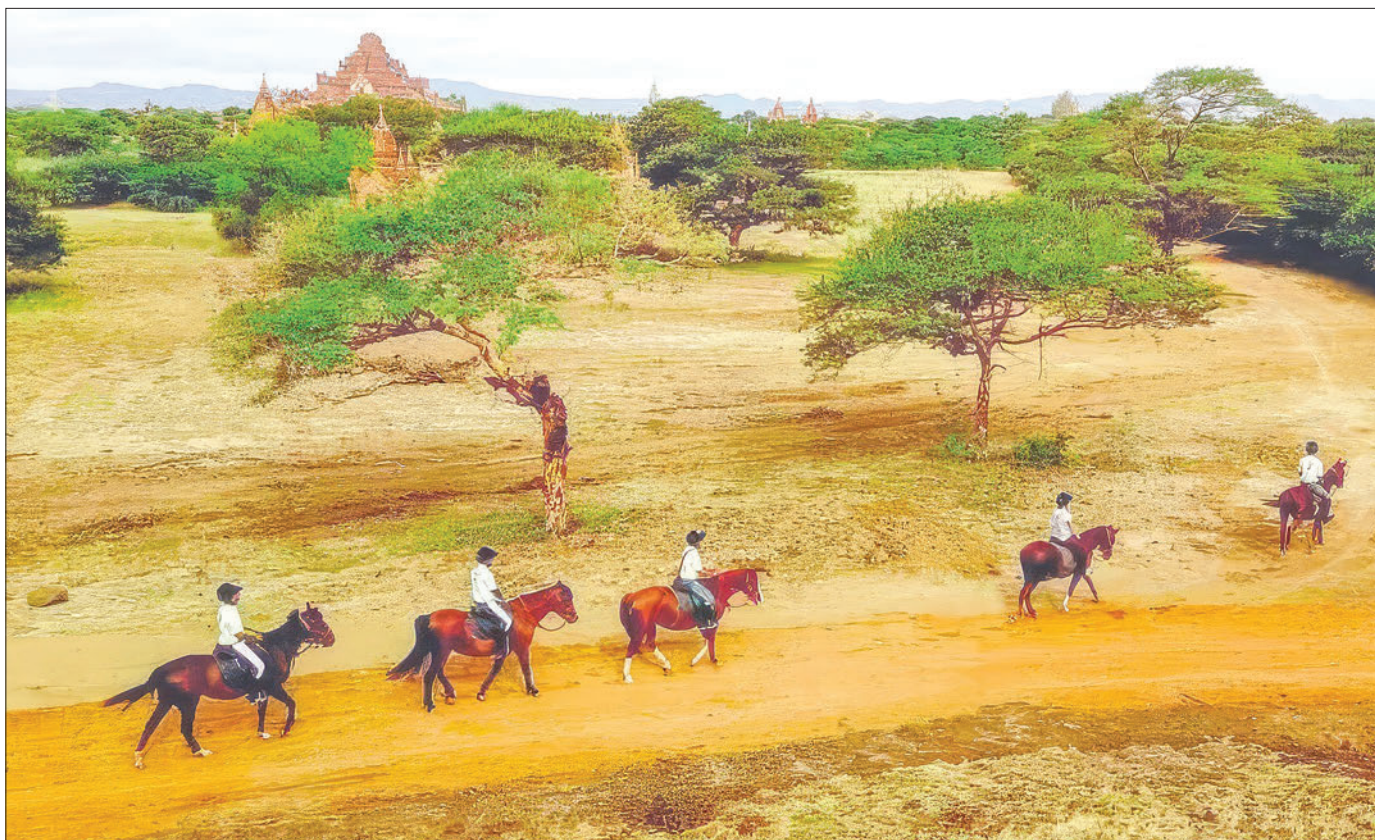
Debut of horse-riding enhances panoramic Bagan Ancient Cultural Zone.

Plans are underway to offer horse-riding tours for local and foreign travellers in the Bagan Ancient Cultural Zone.