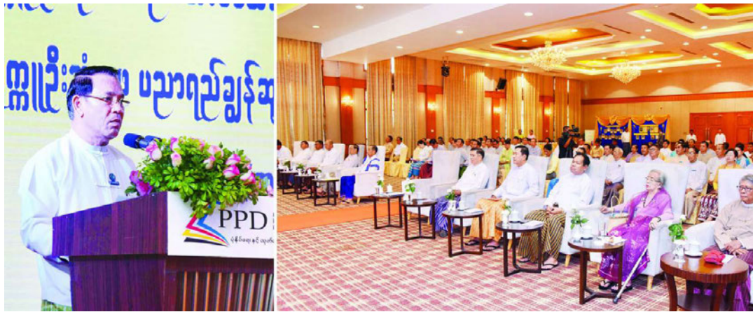
Union Information Minister U Maung Maung Ohn speaks on the awarding occasion of the 29 th Pakokku U Ohn Pe literary awards on 9 June 2023.

The Pakokku U Ohn Pe literary award offers a first prize of K700,000 a second prize of K500,000, and a third prize of