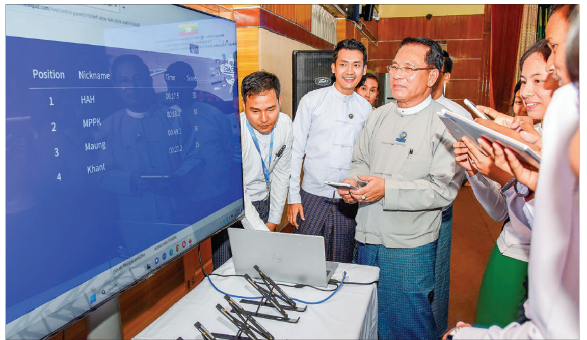
Union Minister U Maung Maung Ohn views round the display at the event yesterday in Nay Pyi Taw.

During the talk show on Global MIL Week, Deputy Di-