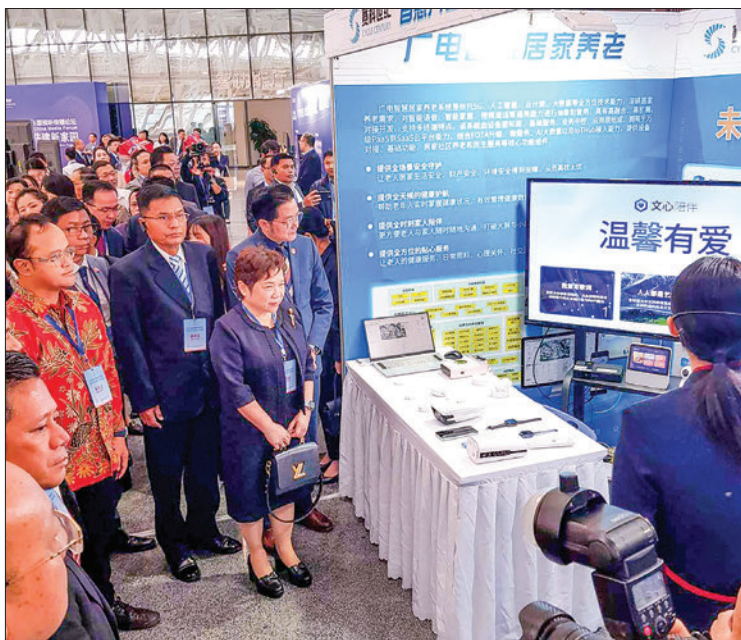
Deputy Minister U Ye Tint and delegation view the radio, television and Internet shows at Guangxi New Media Centre in China.

Then, Steering Committee Chair Lt-Gen Yar Pyae made supplementary remarks on discussions. — MNA/KTZH