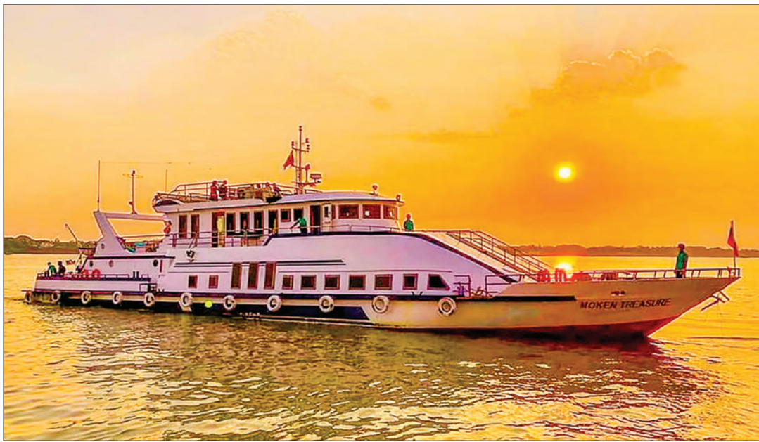
Upcoming craft for Yangon to Chaungtha route captured in the photograph.