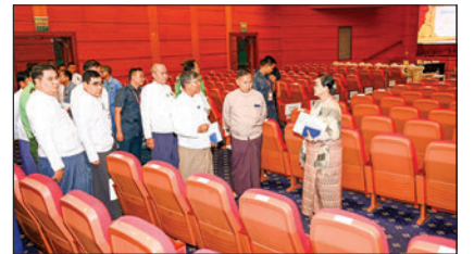
Vice-Senior General Soe Win inspects preparations for 24 th Myanmar Traditional Cultural Performing Arts Competition