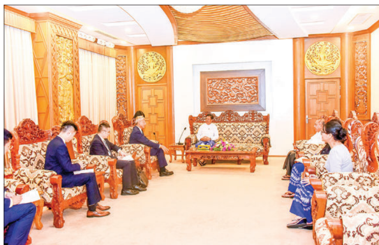
Chinese Ambassador Mr Chen Hai calls on Deputy Prime Minister MoFA Union Minister U Than Swe yesterday.

They cordially discussed matters pertaining to the advancement of "Comprehensive Strategic Cooperative Partnership Relations" based on the existing "Pauk-Phaw" friendship, acceleration of the ongoing Myanmar-China bilateral projects under the framework of Belt and Road Initiative on the basis of mutual benefit, the maintenance of peace, stability and rule of law along the border areas between Myanmar and China, repatria-