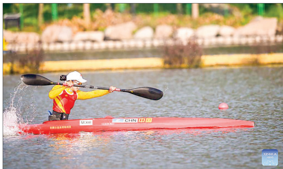
Xie Maosan of China competes during the Women's KL1 Final of Canoe during the 4 th Asian Para Games in Hangzhou, east China's Zhejiang Province, 23 October 2023.

KL1 is for paddlers with highly affected movement in the trunk and legs. VL3 is for paddlers with full function of their arms and trunk, and partial function in the legs. — Xinhua