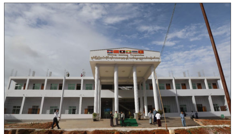
The original two-storey building of Shan State Ethnic Affairs and Vocational Training Centre.

Funded by the state in the 2023-2024 financial year, the training centre's expansion transformed it from a two-storey to a four-storey building. Upon completion, the centre will serve as a hub for vocational training and discussions on ethnic issues among the local population. — TWA/CT