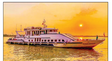
Cruise to islands and beaches of Ayeyawady planned in November