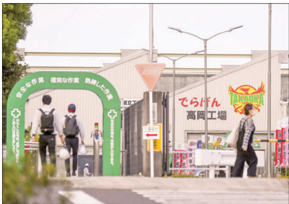
Photo taken on 23 October 2023 shows workers walking towards Toyota Motor Corp's Takaoka plant in Toyota, Aichi Prefecture.

"Together, we will continue to demonstrate commitment to the European markets in general, and to the Italian market in particular," he added. — AFP