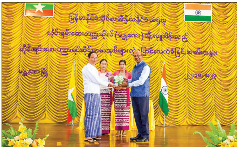
Union Minister Dr Thet Khaing Win accepts the donated books from the Indian Ambassador.

THE Indian Embassy to Myanmar donated 65 copies of books on Indian traditional herbal medicine and other 200 copies of books on India's culture, literature and history to University of Traditional Medicine (Mandalay) and they were received by Dr Thet Khaing Win, Union Minister for Health.