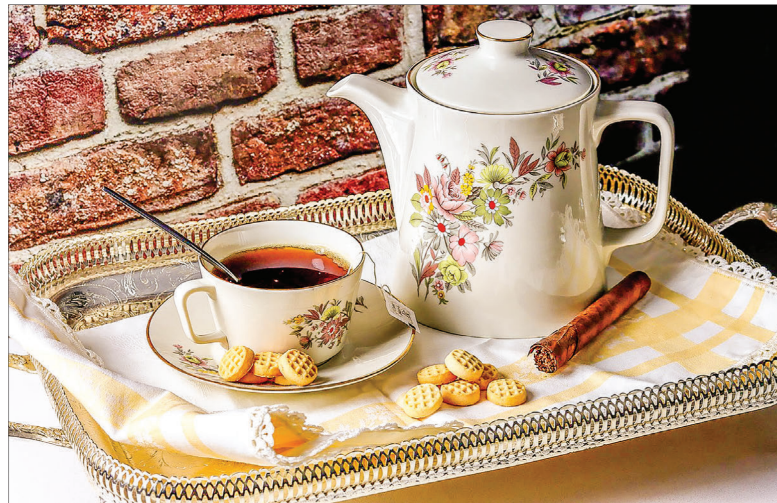
Tea and Myanmar share a rich history, it is believed that Myanmar's first tea was cultivated on the Shan Plateau, six thousand feet above sea level during the Bagan Era.

Preventing the distribution of unsafe goods and foods is a matter of national importance, requiring the cooperation of consumer awareness and the dedication of relevant government departments and ministries. Only when they work together harmoniously to combat the presence of unsafe foods will consumers be shielded from the potential dangers. It is imperative to raise public awareness regarding the importance of selecting safe foods for daily consumption. In doing so, everybody can safeguard their health and longevity.