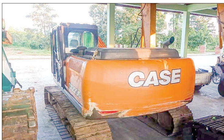
Confiscated unregistered excavators in Bhamo, Kachin State.

The combined team seized a Higer bus (approximately K30 million), travelling from Mawlamyine to Yangon, carrying 2,000 litres of vegetable oil worth K16.1 million without official documents at the Nyaungkhashay X-Ray station on 23 October. The action was taken under Customs procedures. A total of 17 arrests were made on four consecutive days from 20 to 23 October, with an estimated value of K507,609,450, as reported by the Illegal Trade Eradication Steering Committee. — MNA/MKKS