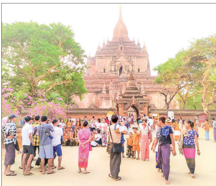
Travellers are seen in the previous Thadingyut holidays in Bagan.

Due to the high number of tourists during the peak season, guesthouses and hotels are fully booked, and monasteries, pagodas, and villages in the Bagan region become crowded.