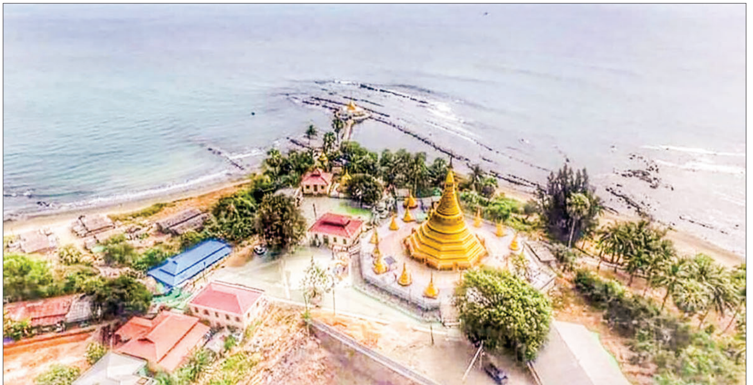
A bird's-eye view of the Mawtinsun Pagoda in Ngaputaw Township of Patheingyi District, Ayeyawady Region.