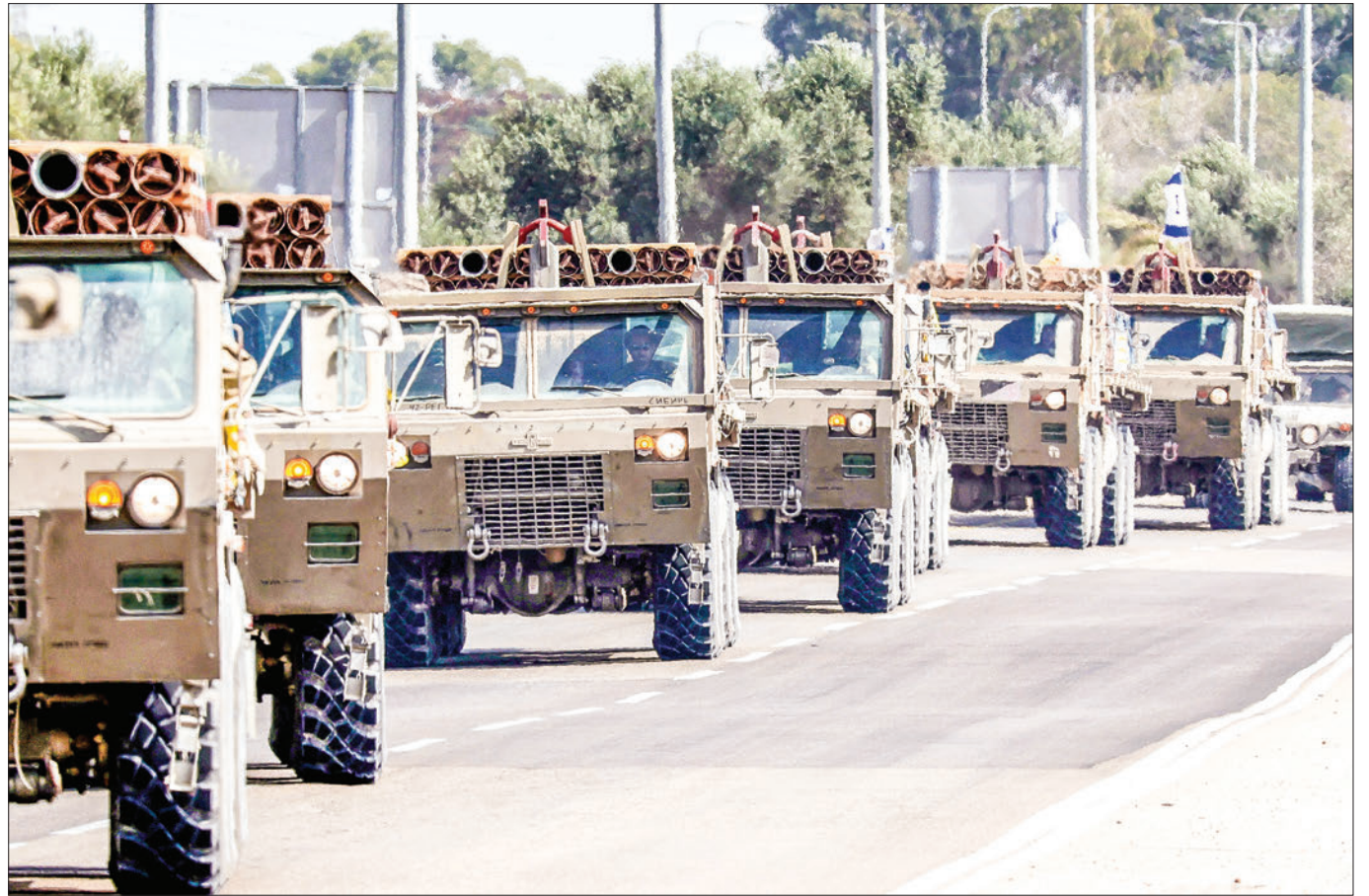
A convoy of Israeli army trucks carrying mortar shells advances on a road near the southern city of Sderot on 23 October 2023 amid ongoing battles between Israel and the Palestinian group Hamas.

People protest in front of the Diet building in Tokyo in June 2023 against a bill revising an immigration and refugee law to enable authorities to deport individuals who repeatedly apply for asylum status.