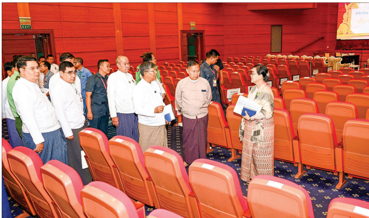
State Administration Council Vice-Chairman Deputy Prime Minister Vice-Senior General Soe Win views preparations for the successful holding of the 24 th Myanmar Traditional Cultural Performing Arts Competition yesterday in Nay Pyi Taw.

At the Nay Pyi Taw Transit Centre, the Vice-Senior General made inspections on hostels, mess halls, kitchens, canteens