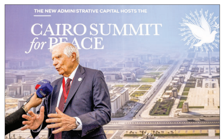
Josep Borrell, High Representative of the European Union for Foreign Affairs and Security Policy, speaks to the press after attending the International Peace Summit in the New Administrative Capital (NAC), about 45 kilometres east of Cairo, on 21 October 2023.

"Personally, I think that a humanitarian pause is needed