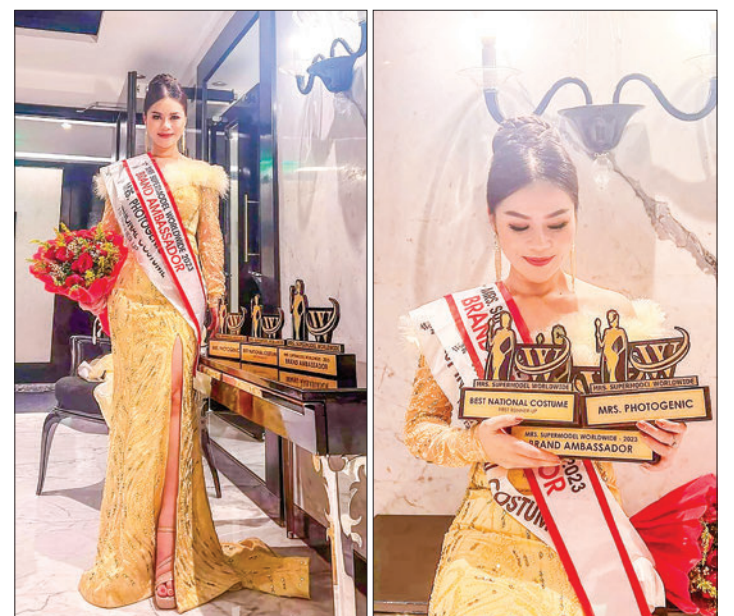
Mrs Myanmar is seen together with three awards in India.