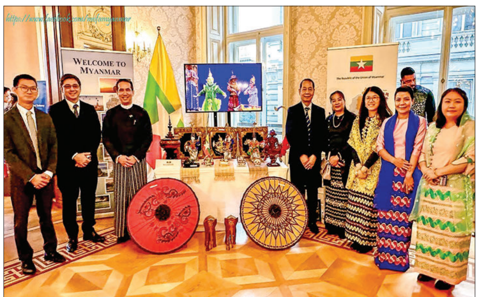
Myanmar displays its traditional handicrafts at the event on 19 October in Austria.

The Embassy of Malaysia demonstrated traditional Malaysian Silat (martial arts), while the embassies of the Philippines and Indonesia presented Ramayana performances. Traditional crafts were displayed, and traditional food was served, representing the diverse cultures of ASEAN countries. — ASH/KZW