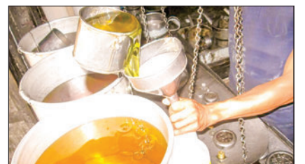
YGN palm oil wholesale reference price slightly rises for week ending 30 October