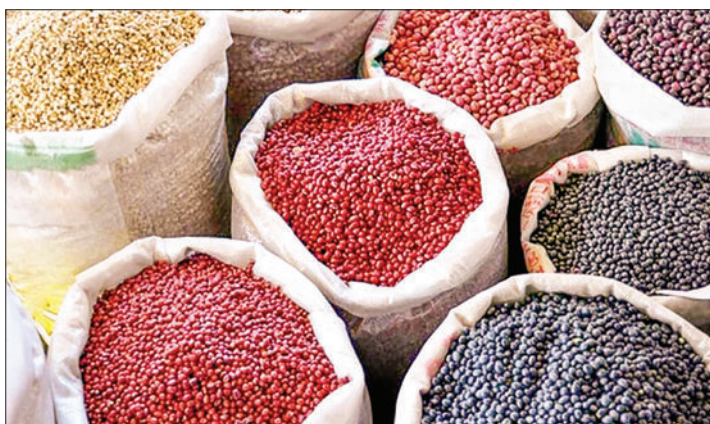
Various kinds of beans are organized for sale in the market.

Myanmar's various pulses export earnings were estimated at over $715 million from over 860,000 tonnes in the H1 of the current financial year