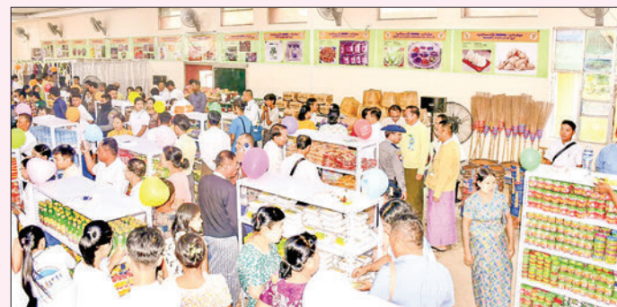
An MSME product sale centre is seen being thronged with shoppers.

It is also reported that more than 80 kinds of products from 28 townships in Bago Region, such as domestic food products, consumer goods, traditional medicines, kitchen equipment, and agricultural machinery are sold daily at the original prices in 37 shops at the Okthathiri Market in Bago District. — ASH/CT