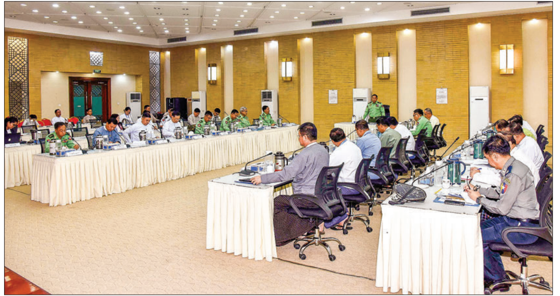
The coordination meeting to review the NCA's Eighth Anniversary Celebration in progress yesterday.

The Myanmar delegation also attended the meeting and signing ceremony of Chinese media outlets and ASEAN media organizations and visited radio, television and Internet shows at Guangxi New Media Centre. — ASH/KTZH