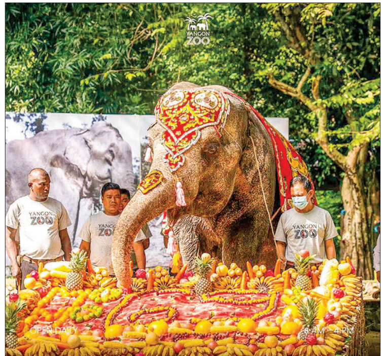
At Yangon Zoo, celebrating Elephant Momo's intelligent presence on her previous birthday.

an annual event, and this year, it will include fairs and festivals, magic shows and games for children. The celebration will also be broadcast on Vidya, M Channel, YTV and Yangon Thar Vlog channels. — ASH/KZW