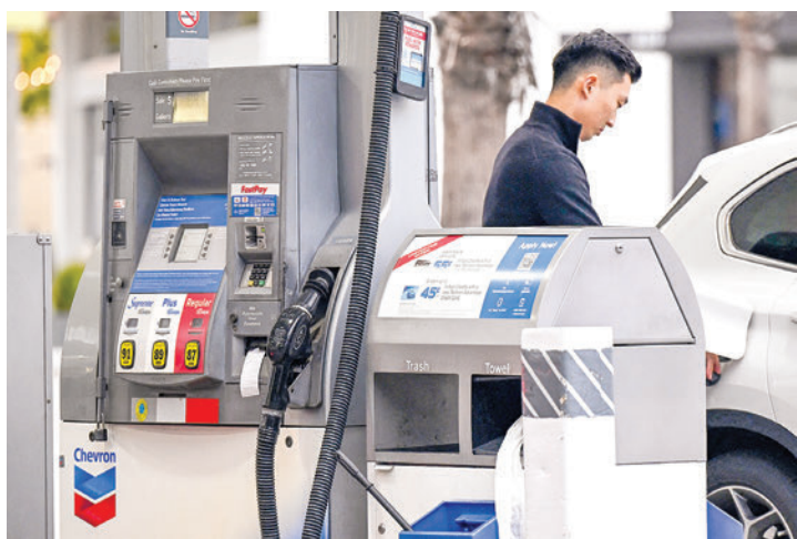
A customer pumps gasoline into a vehicle at a Chevron gas station in Santa Monica, California on 20 March 2023.

US energy giant Chevron will buy its rival Hess for $53 billion in an all-stock deal, the compa-