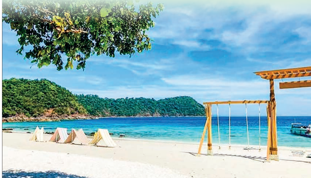
Photos show the beautiful beaches of Myeik Archipelago.

“Myeik District Tourism Association observed designated islands to promote domestic tourism in the previous days. Out of 20 tour companies engaged in the Myeik Archipelago, eight will start offering service from Thadingyut holidays,” said an official of the