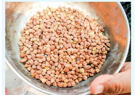
Sales of chickpeas have been good in the Yangon market after Thingyan.

The prices moved up slightly compared to that of the previous week. The prices touched the highest of K260,000-K280,000 per 56.25/57.25 viss on 21 October.