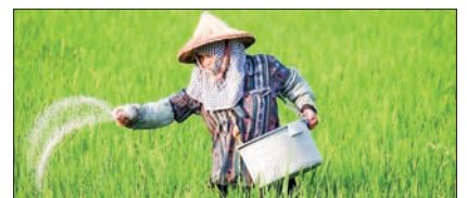
More than 1 million tonnes of fertilizer needed as input requirements in current financial year