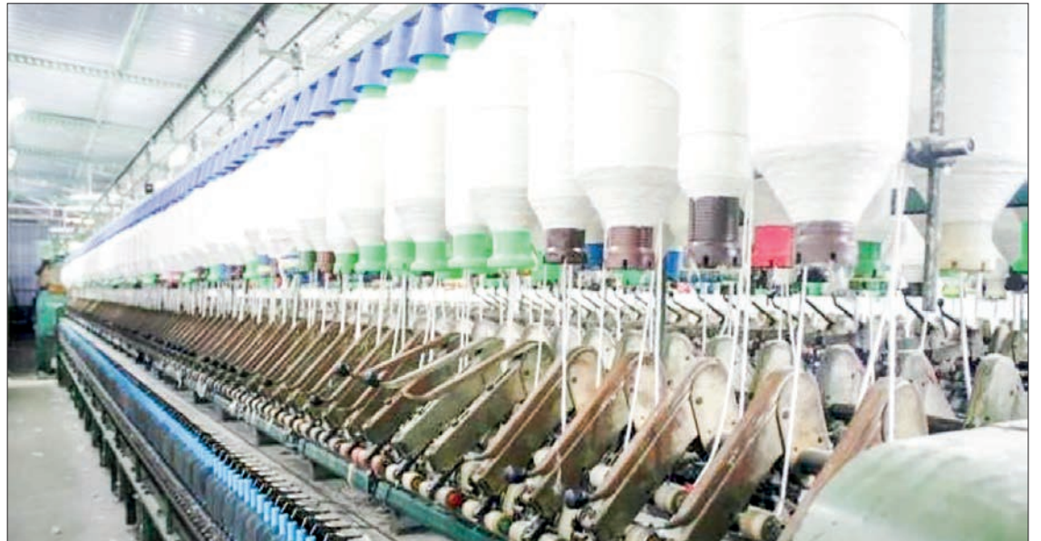
A cotton spinning mill.

Bharat Tex 2024 represents India's 5F vision, encompassing Farm to Fibre to Factory to Fashion to Foreign.