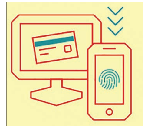
An illustration of a digital payment system that can be interconnected with various payment methods implemented by the Central Bank of Myanmar.

According to the National Payment System Strategy 2020-2025, the Digital Payment Switch (Myanmar Pay) is being implemented so that all mobile payment systems can be connected to each other to develop a digital payment system, she added. — TWA/KZL