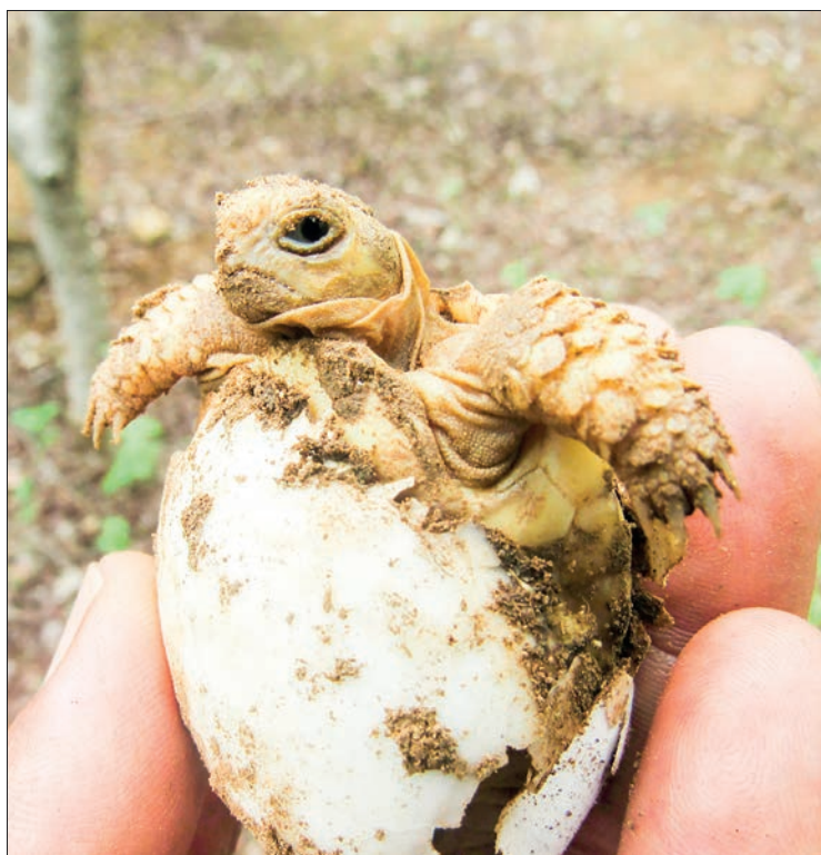
A baby star tortoise cracks egg shell at the nursery of Shwesettaw Wildlife Sanctuary in Magway Region.

ies, the Department of Forest ensures that the star tortoises have access to water and food, especially during the summer. Star tortoises, typically found in tropical regions, help promote plant growth by consuming seeds and later dispersing them, contributing to the growth of trees and forests.