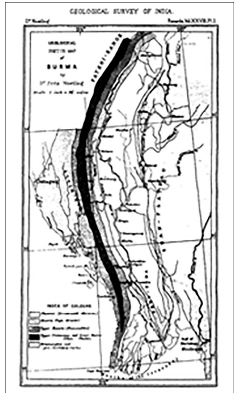
Geological sketch map of Burma by F Noetling

Starting southwards from Paralangdam one crosses the Nam Tamai at its junction with the Sheng Wang and thence follows up the bed of the Sheng Wang to the foot of Klangtung Razi. From this point, at which I camped for the night, it is a stiff climb up the steep mountain side, to approximately the 8,000 feet level, to the mine. The mine is in a vein of ferruginous material in siliceous limestone running approximately south 20° east, and cutting across a projecting spur of