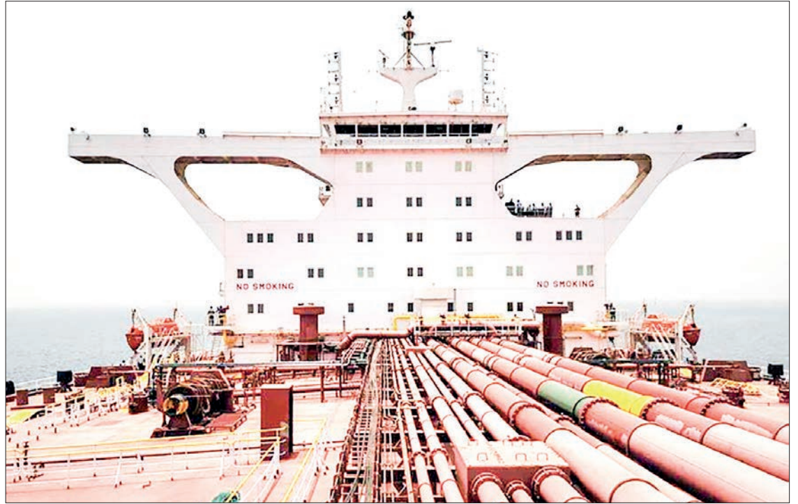
Oil tankers frequently pass through the Strait of Hormuz, carrying a significant portion of the world's oil supply.

The OPEC member has seen its production and exports damaged by years of international sanctions, but has nevertheless increased its production over the last year and is suspected of smuggling barrels onto the market. This has helped contain global prices despite rising demand and tight supply, leading the Biden administration in the