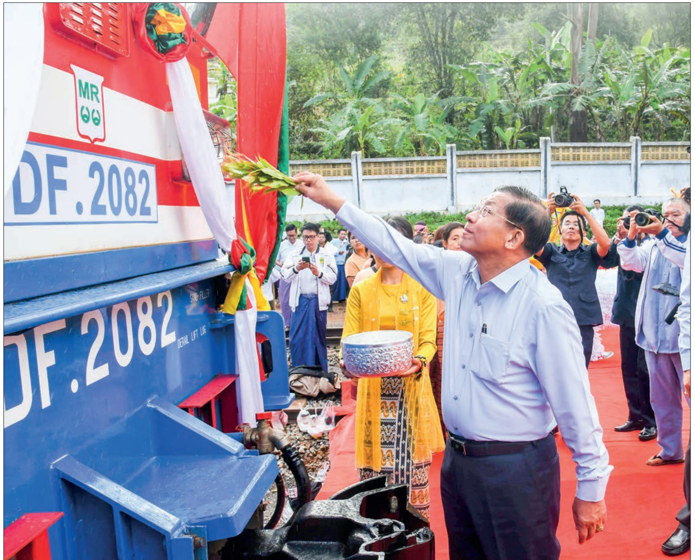
SAC Chairman Prime Minister Senior General Min Aung Hlaing sprinkles scented water on the locomotive of the train to run along Shwenyaung-Taunggyi-Naungkar junction-Pangpet railway section yesterday.