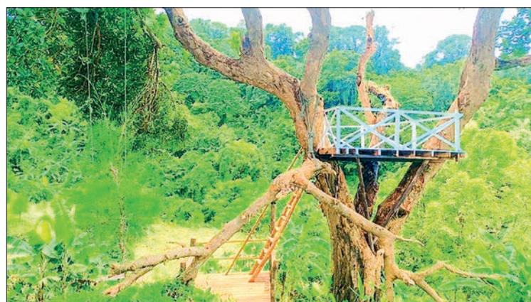
A watchtowers at the new camping site in Abe village on Ngapali beach in Rakhine state is seen.

Currently, there are about 50 hotels, motels, and guesthouses in the Ngapali Beach Hotel Zone. Foreign and domestic tourists mainly visit Blue Lagoon, Safari Beach, Floating Bridge, Paradise