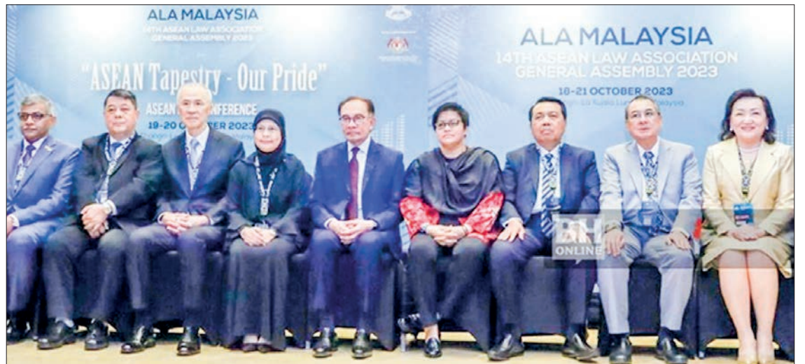
Chief Justice of the Union U Tha Htay poses for documentary photo together with chief justices at CACJ Retreat in Malaysia on 18-21 October.

The Union Chief Justice attended the CACJ Retreat at the Shangri-La Hotel in Kuala Lumpur on 20 October. At the meeting, Hon Tun Tengku Maimun binti Tuan Mat, Chief Justice of the Federal Court of Malaysia, made an opening remark before Union Chief