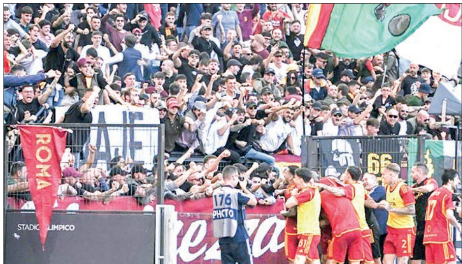
Roma's Italian forward Stephan El Shaarawy celebrates his late winner against Monza in Serie A.

Raffaele Palladino's Monza look set for another decent season in Italy's top flight after being promoted last year and weren't fazed by new signing Papu Gomez being hit with a two-year doping ban on Friday. — AFP