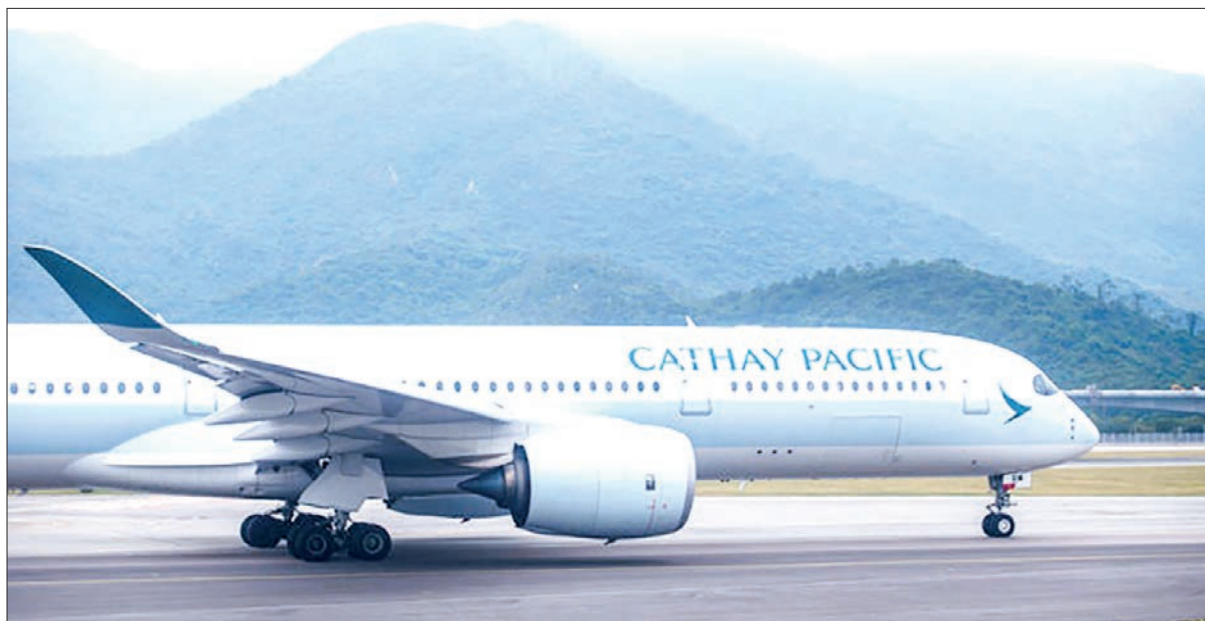
A Cathay Pacific airlines passenger plane prepares to take off from the international airport in Hong Kong.