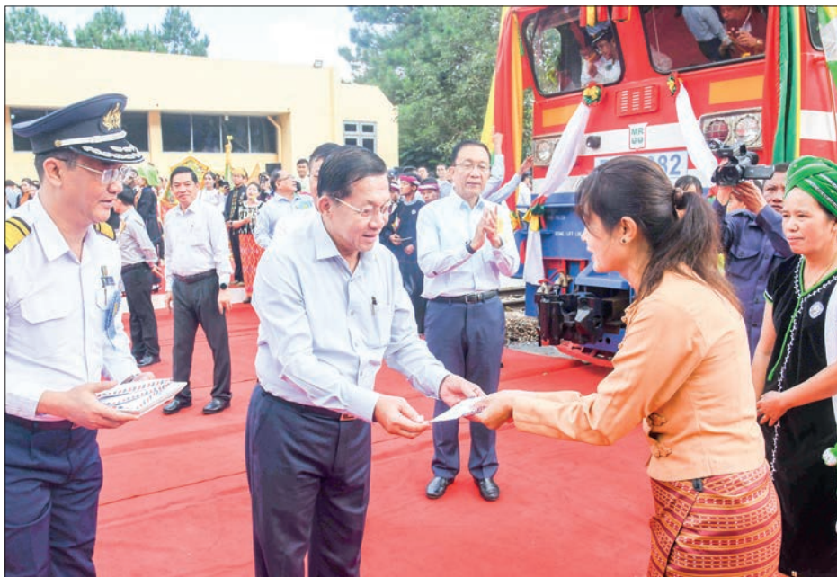
Senior General Min Aung Hlaing presents cash award for ethnic dance troupes and students through an official.