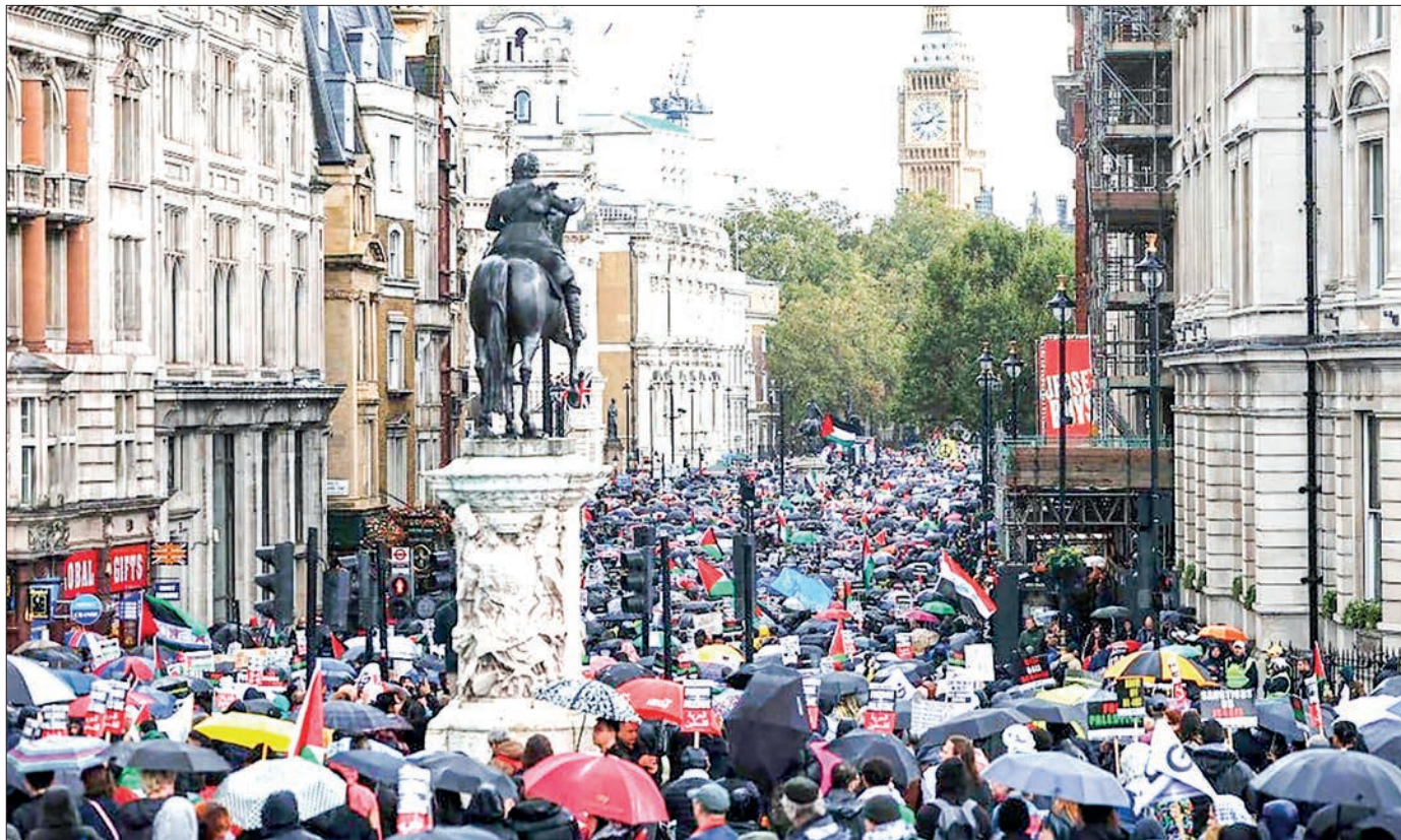
Around 100,000 people took part in a 'March For Palestine' in London on Saturday.