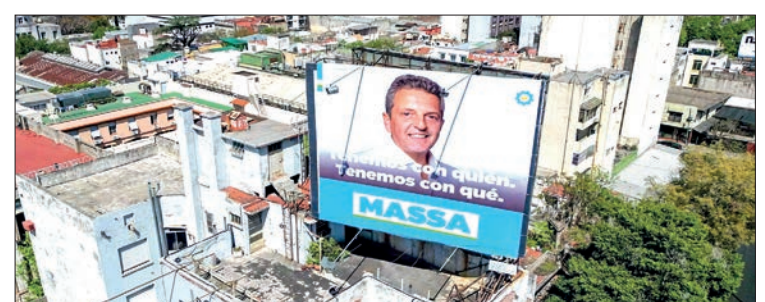
Charismatic Economy Minister Sergio Massa represents the center-left Peronist coalition, a populist movement heavy on state intervention and welfare programmes.

Total government outlays decreased slightly from the previous year, after the Supreme Court canceled Biden's student loan forgiveness program, noted a joint statement by the Treasury Department and the Office of Management and Budget (OMB). — AFP