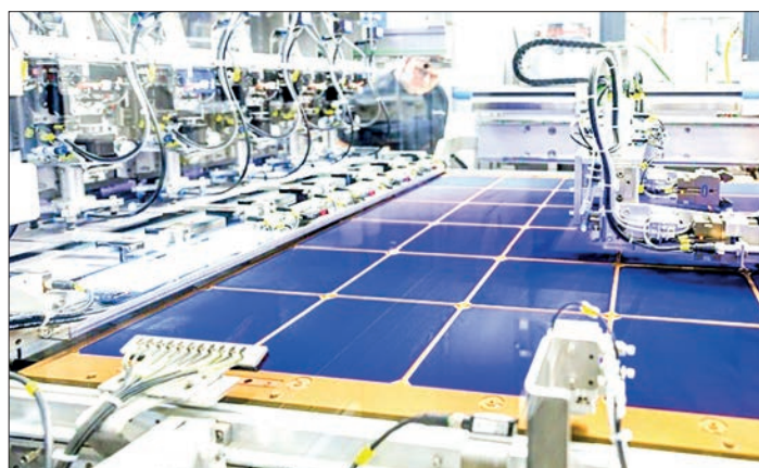
Germany's solar cell industry is hoping for a renaissance.