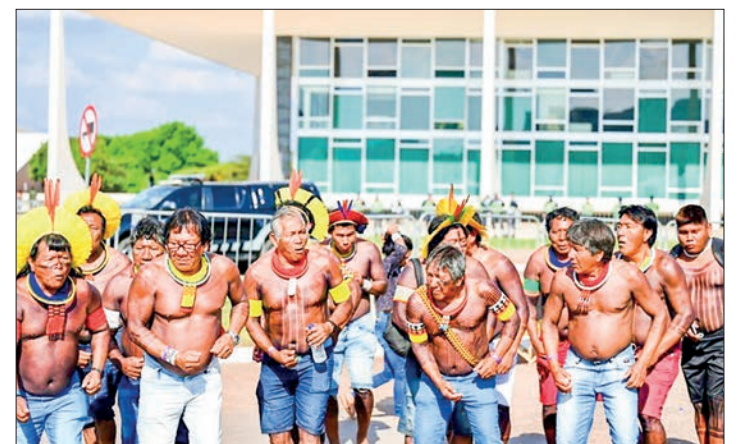
Brazilian Indigenous men outside the Supreme Court in Brasilia celebrate as the court rule against efforts to restrict native peoples' rights to reservations on their ancestral lands.

"Everything that attacked the rights of Indigenous peo-