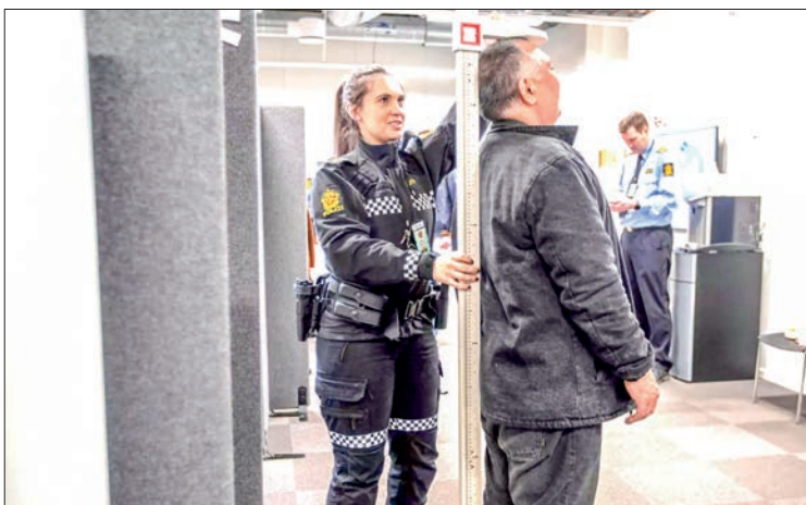
Ukrainian refugees are registering with the Norwegian police at the National Reception Centre in Råde, where the UDI (immigration administration) and several others are trying to take care of the many arrivals.

The scheme, whose details have appeared on the cabinet of ministers' website, promises 17,500 Norwegian krone (€1,495) to persons "granted collective protection or residence on the grounds of strong humanitarian considerations" who decide to return home. — SPUTNIK