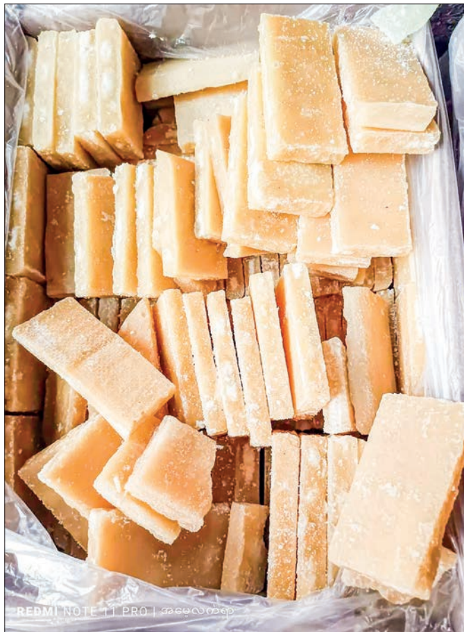
New brown slab-sugar seen in the market.

New brown slab-sugar arrived at the market this month, with wholesale prices of sugar and jaggery from Yesagyio set at K3,770 and K5,500-K5,600 per viss, respectively. The old brown slab-sugar is priced at K3,100-K3,200 per viss, while jaggery from NyaungU bleached by chemicals is valued at K4,100-K4,200 per viss. NyaungU jaggery mixed with sugar added with chemicals is available at K3,700 per viss, Mahlaing area jaggery at K3,600-K3,700 per viss, and raw jaggery from Pakokku