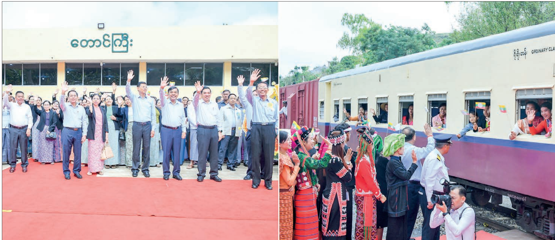
Senior General Min Aung Hlaing waves to ethnic people riding the train from Taunggyi to Pangpet railway section yesterday.