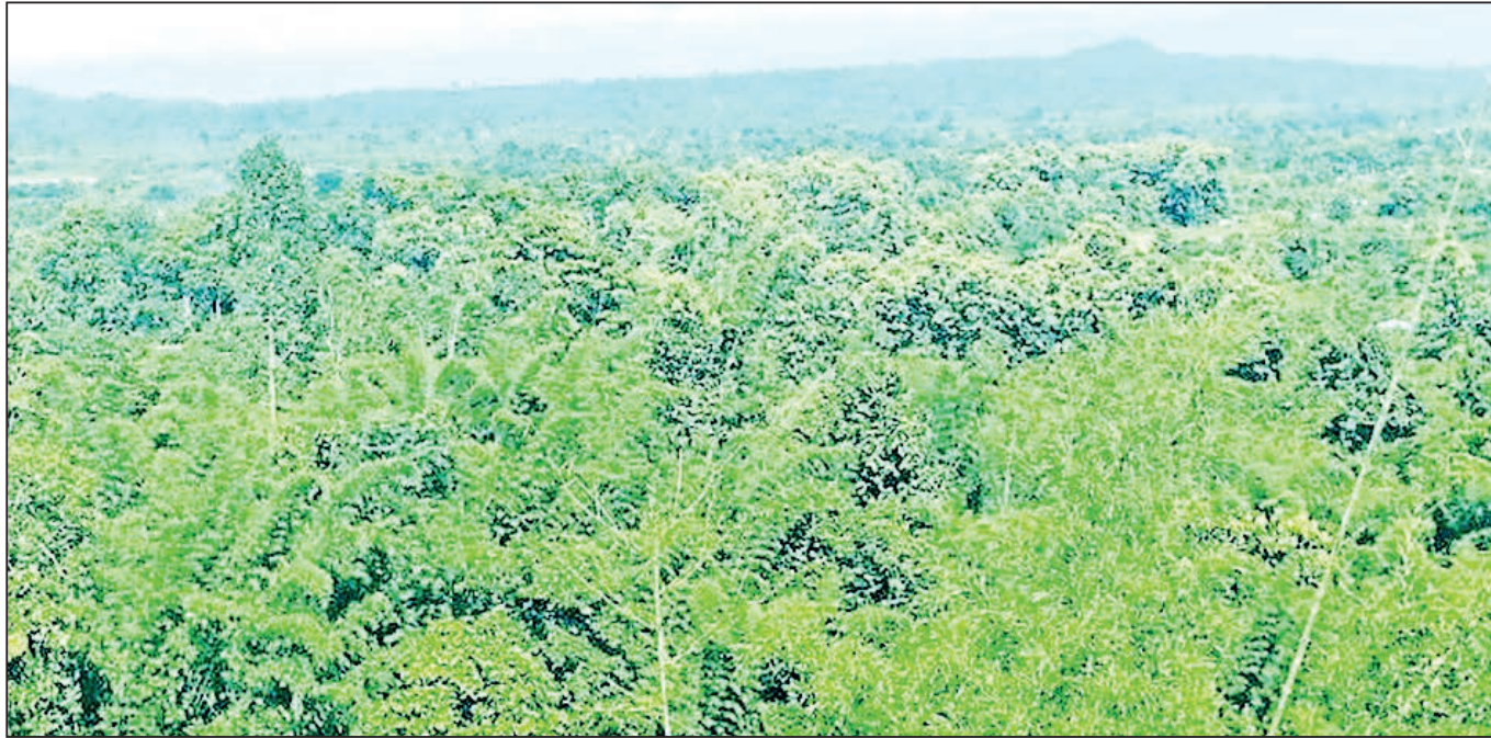
The photo shows panoramic scene of Monghein (expanded) protected public forest.