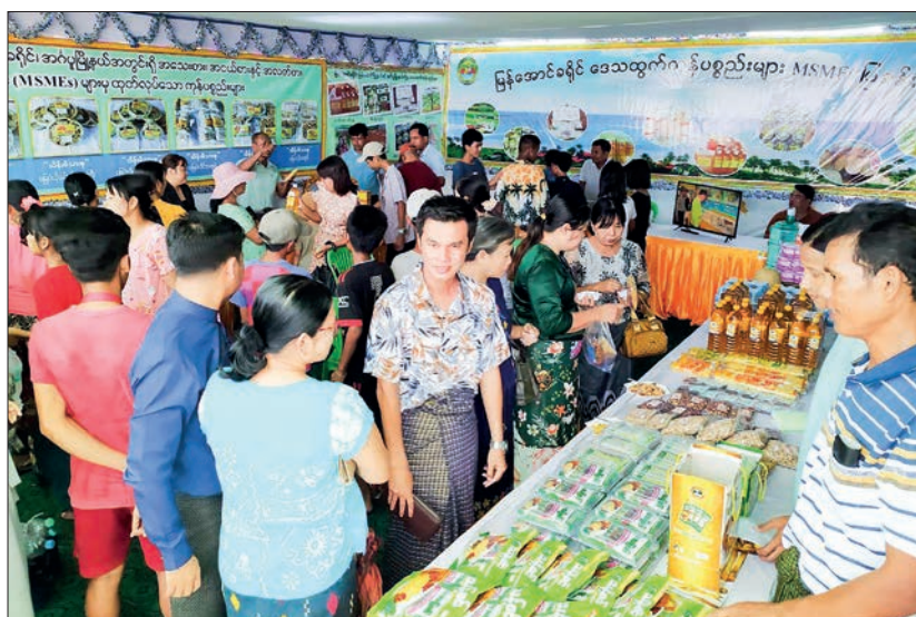
Products and foodstuffs are displayed at pre-Thadingyut festival at Chaungtha Beach.

The Ayeyawady Region's foodstuffs, commodities and handicrafts which are made of cane, water hyacinth and bamboo are sold at Chaungtha Beach as a pre-Thadingyut festival, according to the regional government.