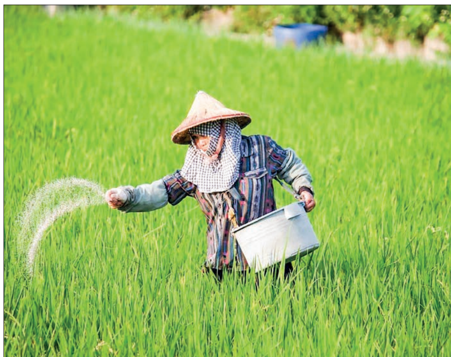
A farmer is seen broadcasting fertilizer in the paddy field.

To address the challenges faced by farmers and increase per-acre yield of crops, plans will be developed to distribute and sell fertilizers and pesticides that meet the standards required by farmers in their agricultural activities at affordable prices. — TWA/CT