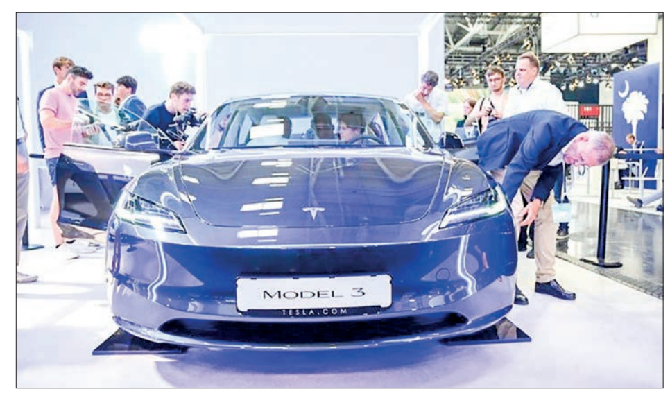
Visitors inspect a Tesla model 3 car on display at the International Motor Show held in Munich, southern Germany, on 4 September 2023.

The price cuts have made investors nervous