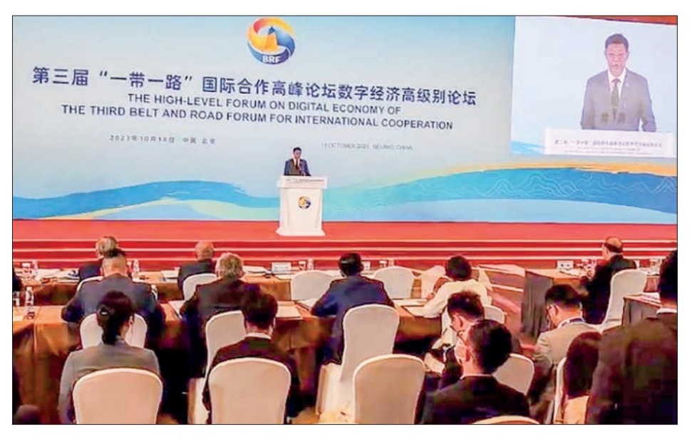
Deputy Prime Minister MoTC Union Minister General Mya Tun Oo speaks on the occasion of the High-Level Forum on Digital Economy in Beijing on 18 October.

tended the opening ceremony of the forum at China Great Hall and delivered a keynote speech on 18 October. At noon, the Myanmar delegation attended the High-Level Forum on Digital Economy held at the China National Convention Centre (CNCC).