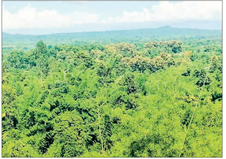
An aerial view of the Monghein Forest.

Best International Travel and Agency is a company that promotes tours for Thai tourists to Myanmar and tours to more than 30 countries around the world. It also records local television videos of Myanmar's trips and televises on Thai media such as Thai Channel 5, Thairath, Workpoint and Mono 29. — MNA/TS