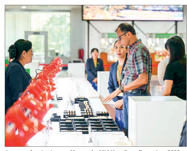
A gem trader viewing pearl lots at the Mid-Year Gems Emporium 2023 yesterday in Nay Pyi Taw.

At the emporium, 300 pearl lots, 160 gem lots, and 4,025 jade