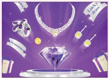
An advertisement for the jewellery festival to be held in Times City.

Shops will offer special discounts, ranging from 3 to 50 per cent, as part of their customer promotion efforts. Additionally, the festival organizers will include valuable lucky draw prizes to express their gratitude to the buyers who take part in the jewellery fair. — TWA/CT