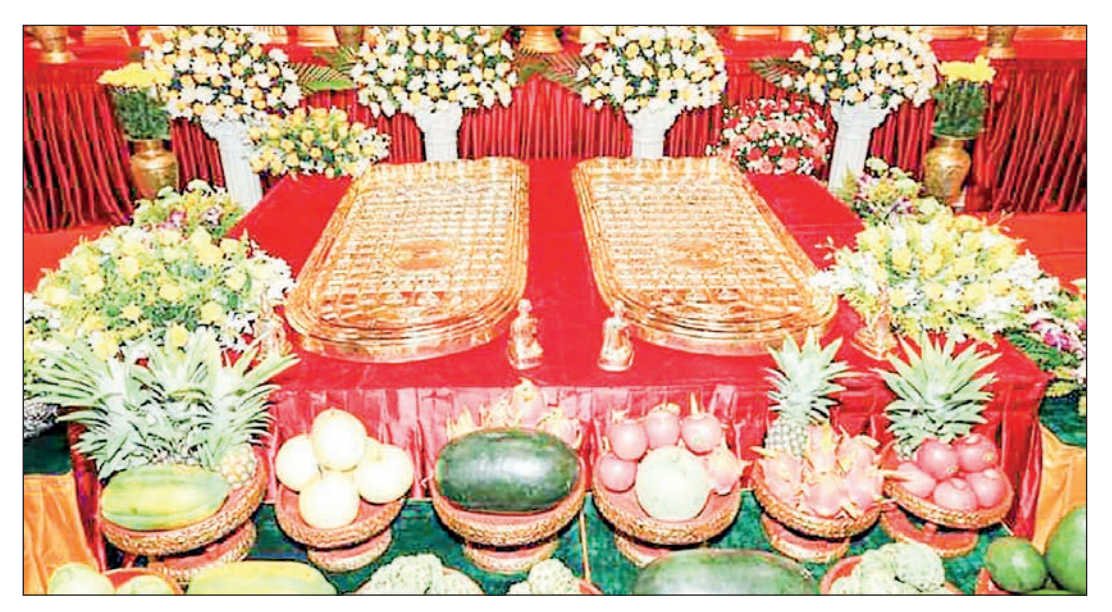
The two Nawalawha Yadanapada Buddha's Footprints.