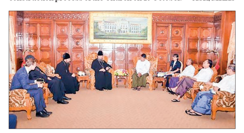
Discussions between Yangon Mayor U Bo Htay and the Russian Orthodox Christian Bishop for Southeast Asia underway on 19 October.

Yangon Mayor U Bo Htay and a team led by the Russian Orthodox Christian Bishop for Southeast Asia discussed the construction process of the Church on 19 October.