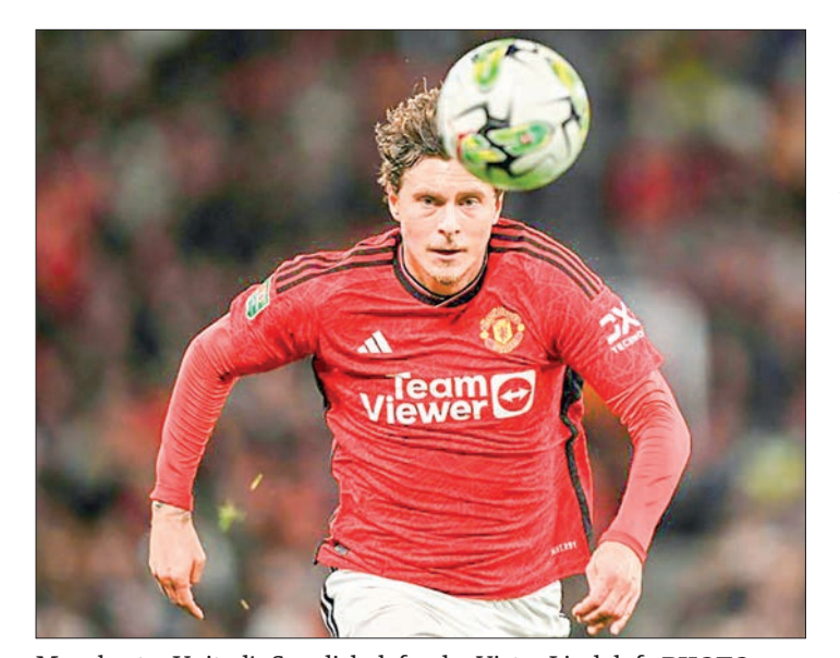
Manchester United's Swedish defender Victor Lindelof.

UEFA stated the match won't be replayed, and points will be shared.