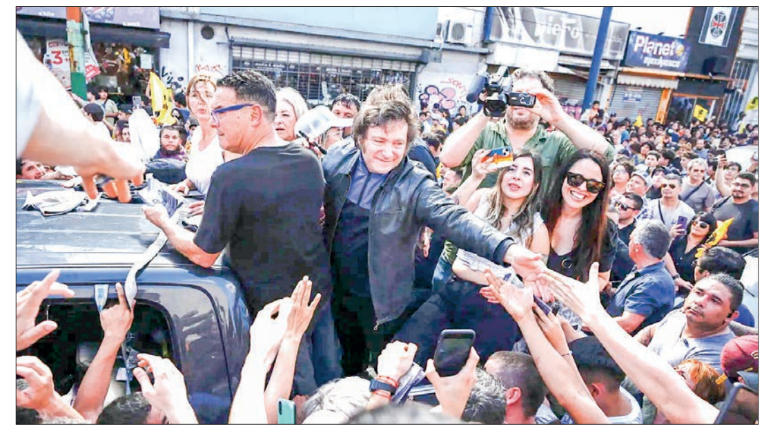
Javier Milei (center) greets supporters during a campaign rally on 16 October in Lomas de Zamora, Buenos Aires province, Argentina.

The presidential election on Sunday is happening while Latin America's third-largest economy is struggling with nearly 140% annual inflation and 40% of the population living in poverty.