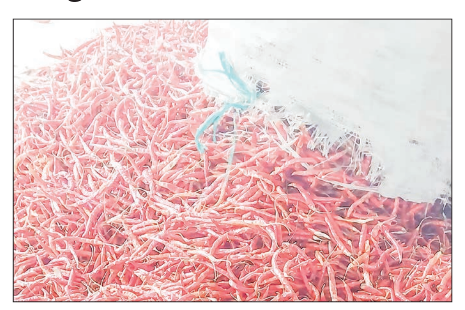
The photo shows a new supply of dried chilli pepper (Moehtaung variety).

THE prices of long dried chilli pepper (Moehtaung variety) and dried bell pepper are down by K5,000-10,000 per viss in Yangon's market in the third week of October compared to those registered in the year-ago period.