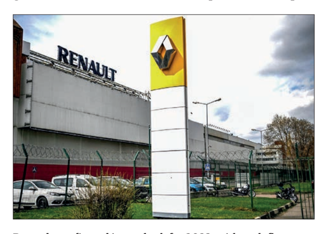
Renault confirmed its outlook for 2023, with cash flow equal or above 2.5 billion euros and an operating margin of between seven and eight per cent.

Thursday as the group's third-quarter sales per-