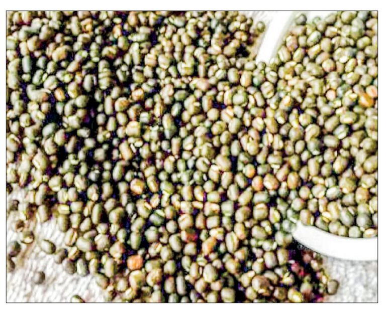
Black grams are seen for sale at the market.

Black grams that India primarily purchases are commonly found only in Myanmar, whereas pigeon pea, green gram and chickpeas are grown in African countries and Australia, Myanmar Pulses, Beans, Maize and Sesame Seeds Merchants Association said. — NN/EM