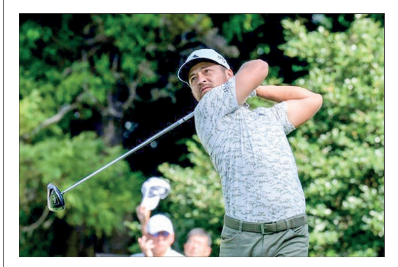
Xander Schauffele had three bogeys before hauling himself back in contention at 4-under.

Schauffele had three bogeys before hauling himself back in contention at 4-under, and the Tokyo Olympics champion said the conditions were "hard" to deal with. "It seemed to be a lot of crosswinds on most of the holes — made it hard to hit it close," he said. — AFP