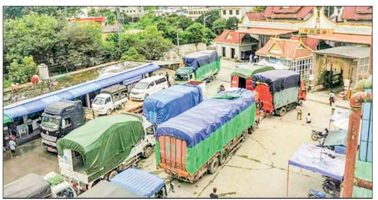
Export cargo loaded lorries are pictured on the Myanmar-China border.

The main export items are green gram, onion, cotton, eel, peanut, zinc mineral, gum karaya, corn, frozen crab, crab, broken rice, rice, cashew nut, sesame and plum. Meanwhile, vehicles and machinery, motorcycle parts under a Semi-knocked-down system, petrol, nickel, iron rods, batteries, battery cycle, footwear and carbon powder are primarily imported into the country. — NN/