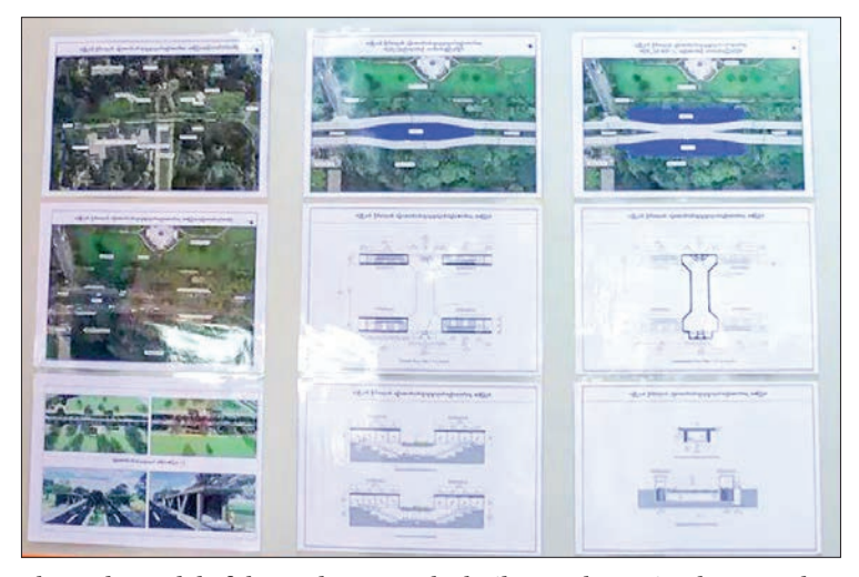
The scale model of the underpass to be built was shown in photographs at the groundbreaking ceremony held on 19 October.

According to the YCDC, the construction of the underground pedestrian tunnel (underpass) is aimed at making traffic safty and comfortable for people to travel to the Shwedagon Pagoda and the People's Square and to create a modern infrastructure. — TWA/CT