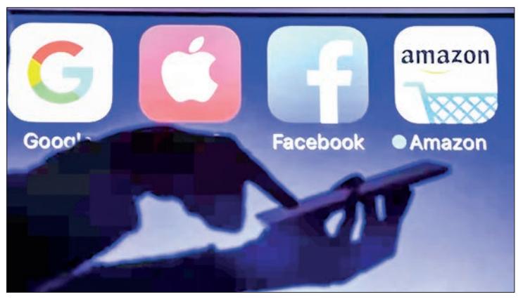
The DSA is a comprehensive law that compels digital platforms to proactively monitor and address content within the European Union, potentially leading to significant fines for non-compliance.