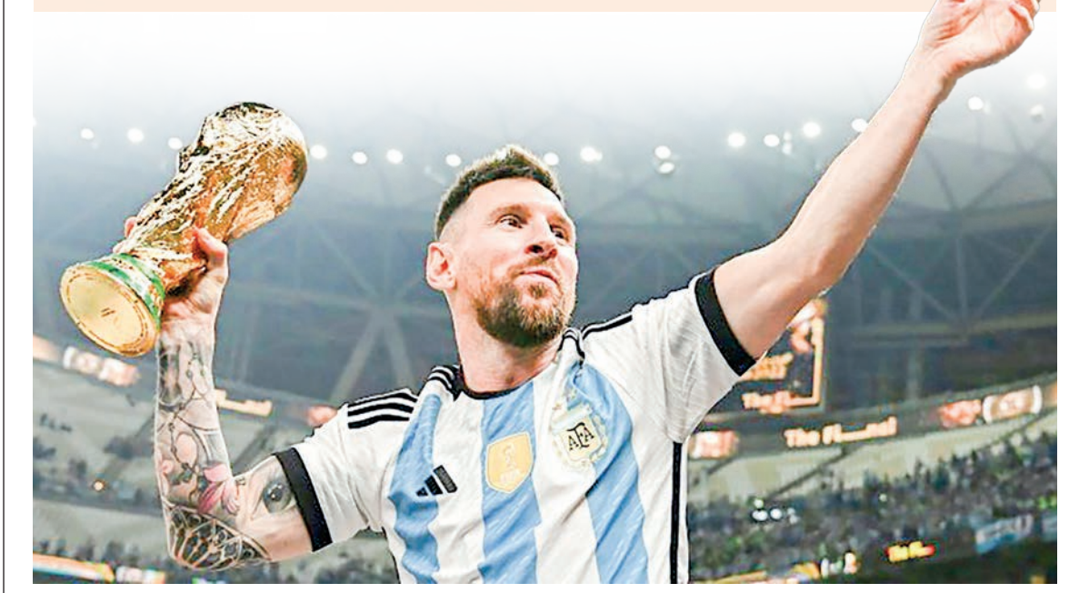
Lionel Messi poses with the World Cup trophy.

Messi, who moved from Paris Saint-Germain to Inter Miami, is the favourite to win the Ballon d'Or for an eighth time, having led Argentina to World Cup victory. Haaland is a strong contender, with 52 goals in 53 games for Manchester City's treble-winning season.