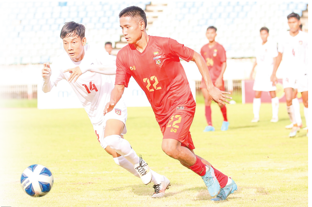
The Myanmar U-19 team player (red) attempts to pass the Inter-State & Region team player (white) during a friendly match played at Thuwunna Stadium in Yangon on 31 August 2022.