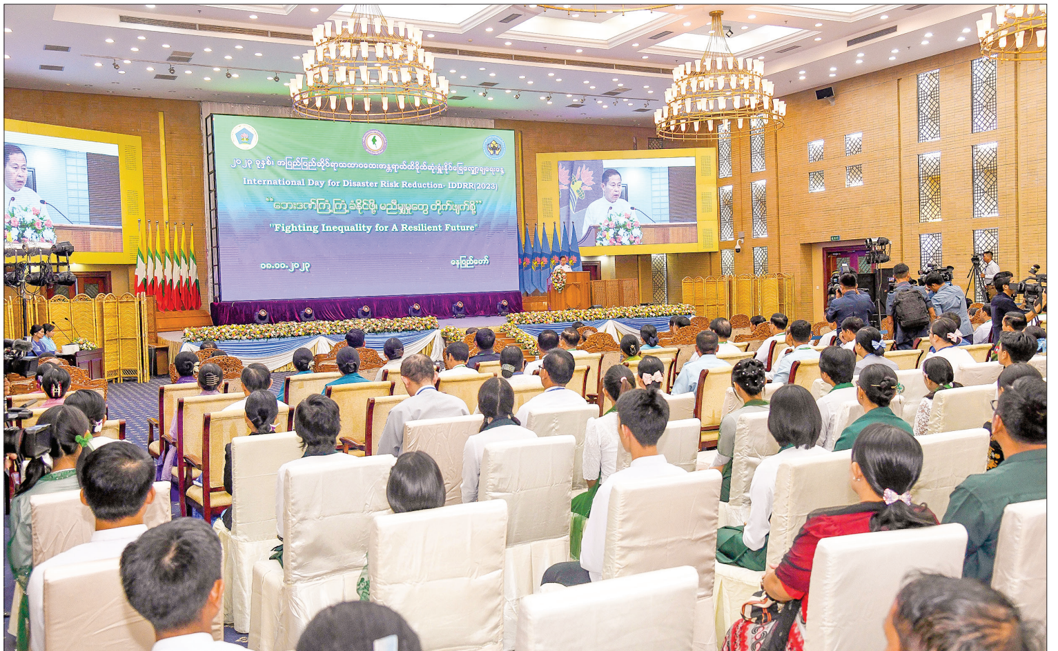
State Administration Council Vice-Chair Deputy Premier Vice-Senior General Soe Win speaks on the commemorative occasion of the International Day for Disaster Risk Reduction 2023 yesterday in Nay Pyi Taw.

In a clarification on rehabilitation at storm-hit areas, the Vice-Senior General recounted that these areas could return to normal in a short time thanks to the guidance of the SAC Chairman, the leadership of the Na-