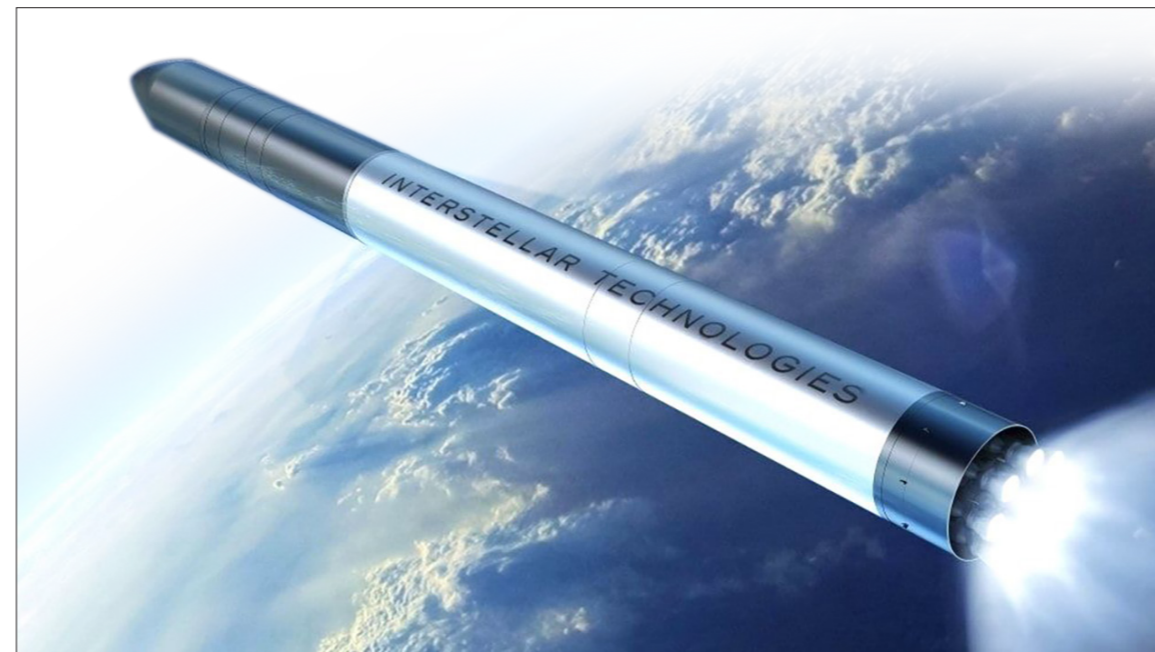
A rendering of Interstellar Technologies' rocket, Zero, is expected to be fuelled by liquefied biomethane produced by Air Water.

This revelation heralds a sustainable future by turning waste into fuel, revolutionizing space propulsion with broad-reaching potential through a fusion of science, technology, and sustainability.