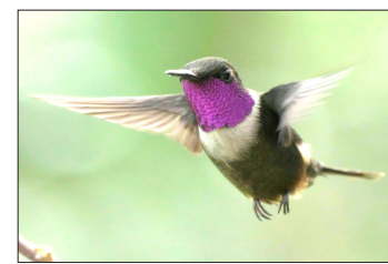
The tool has some limitations, including the relatively few bird calls available with which to train the computer model.

The recording from the forest in Ecuador is part of new research looking at how artificial intelligence could track animal life in recovering habitats.