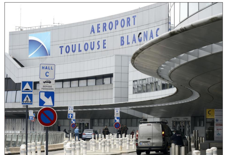
Authorities reportedly evacuated the airports of Lille (LIL), Lyon (LYN), Nantes (NTE), Nice (NCE), Paris-Beauvais (BVA), and Toulouse (TLS) due to bomb threats on the morning of 18 October.

In Lille, an airport spokeswoman said three flights had been diverted, while a post on its X account said security forces were on the scene. — AFP