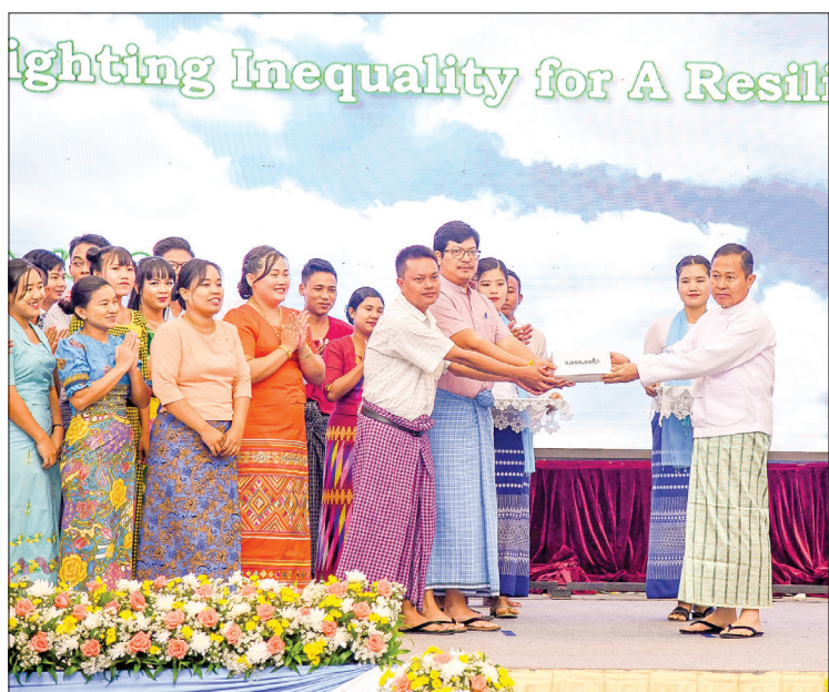
The Vice-Senior General presents cash awards to the personnel of the Disaster Management Department yesterday.

tional Disaster Management Committee and relevant governments in addition to local and foreign well-wishers.