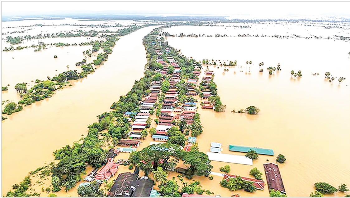
A flooded farm and houses are pictured in Bago Region recently. MRF earmarks K50 million financial support for flood-torn farmers in Bago Region.

THE Myanmar Rice Federation (MRF) has earmarked about K50 million to help the farmers whose paddy fields in the eastern part of Bago Region have been flooded, according to the central executive committee of the federation.