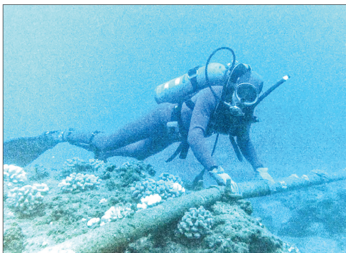
Diver checking underwater protection of cable.

THE communication cable connecting Sweden and Estonia sustained damages in the Baltic Sea, Swedish Minister for Civil Defence Carl-Oskar Bohlin said on Tuesday. “So far we are not exactly sure what damaged the cable,” a Finnish news agency quoted the minister as saying at a news conference. Bohlin indicated the details regarding the damage to the Swedish-Estonian cable are similar to damages identified last week that affected the Balticconnector gas pipeline, which connects Estonia and Finland. However, the government official noted the cable remained