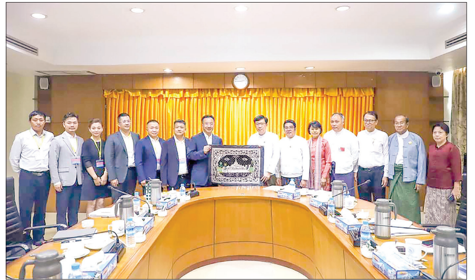
Officials from UMFCCI and YPGCC exchange gifts at the bilateral economic cooperation and trade meeting in Yangon on 17 October 2023.

Additionally, a Memorandum of Understanding to implement the Myanmar-China Economic Corridor (CMEC)