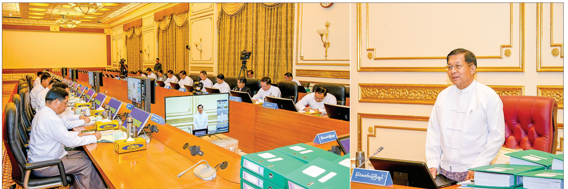
State Administration Council Chairman Prime Minister Senior General Min Aung Hlaing addresses the Economic Committee Meeting 8/2023 in Nay Pyi Taw on 18 October 2023.

Senior General Min Aung Hlaing gave guidance at the Economic Committee Meeting 8/2023 of the Republic of the Union of Myanmar.