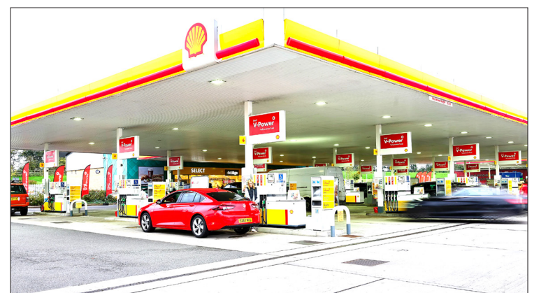
Fuel prices rose by 7.6 per cent between August and September, with the cost of 95-octane petrol in some areas reaching a 13-month high.

Fuel prices rose by 7.6 per cent between August and September, with the cost of 95-octane petrol in some areas reaching a 13-month high.