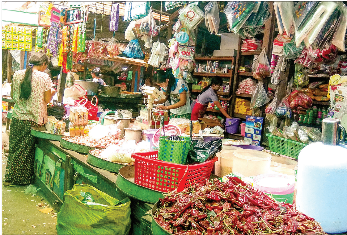
The photo shows shoppers and vendors at a kitchen grocery retail outlet in Yangon.

The Yangon potato market only published the price of Chinese potatoes on 18 October, with