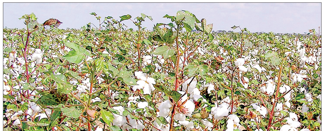
The photo shows a thriving cotton field in Myanmar.

directly to the Department of Human Resources for Health by 16 November. For more information, applicants should visit the Ministry of Health website at www.moh.gov.mm and the Department of Human Resources for Health website at www.hrh.gov.mm . — TWA/KZW