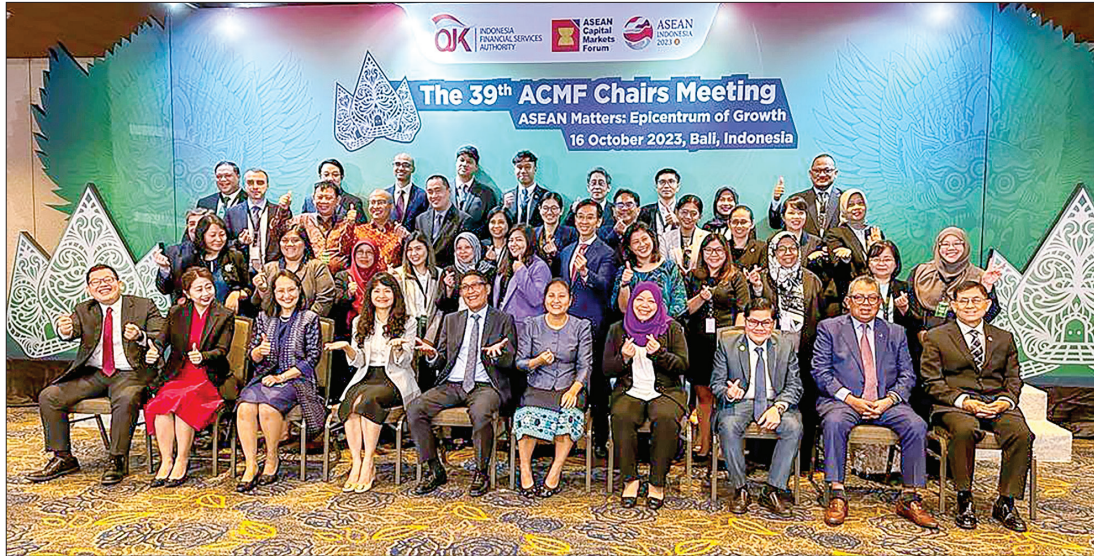
The group documentary photograph of the 39 th ACMF Chairs Meeting held in Indonesia on 16-18 October 2023.