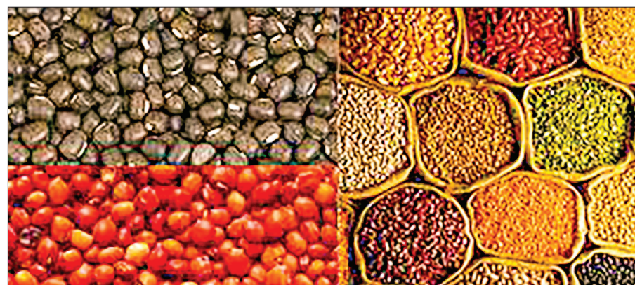
Various kinds of beans are seen at a market.

THE black gram price was moving upwards, reaching a record high of around K2.7 million per tonne.