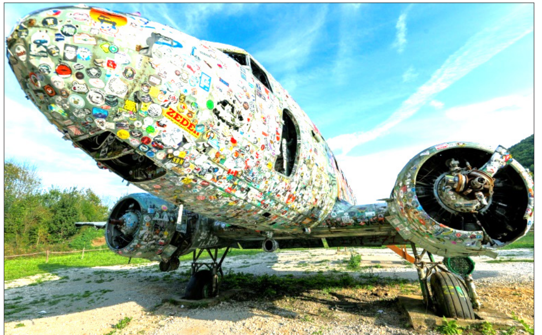
An old DC-7 Dakota covered with stickers at the abandoned Zeljava underground airbase on Croatia’s border with Bosnia.

“It was the then best military and civilian technology.” — AFP