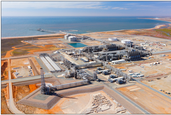
The Wheatstone facility operated by Chevron in Pilbara Coast, Western Australia, is one of the largest gas liquefaction plants in the world.

The alliance said it had cancelled its notification of industrial action after members endorsed three new enterprise