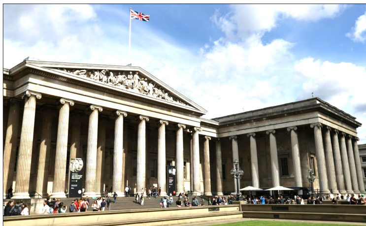
The museum plans to put the recovered items on display in a previously unplanned exhibition.

THE British Museum in London has recovered 350 of approximately 2,000 artefacts believed to have been stolen from its collection by an ex-employee, chairman George Osborne said Wednesday.