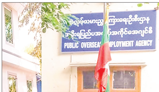
The office sign of the Public Overseas Employment Agency.

ACCORDING to the Public Overseas Employment Agency of the Ministry of Labour, seasonal workers, including female workers, will be sent to South Korea in October under the G-to-G Programme as part of the Myanmar-Korea inter-governmental agreement.