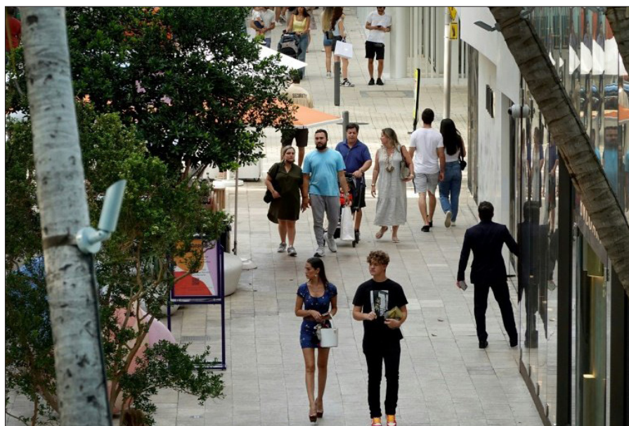
US retail sales was much stronger than expected in September, likely supported by a still resilient job market.

The Federal Reserve lifted the benchmark lending rate rapidly, increasing the cost of borrowing and lowering demand by making it pricier to get funds for big-ticket purchases or business expansion. — AFP