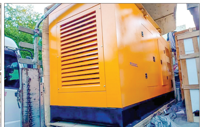
Confiscated illegal items are seen in Mandalay Region.