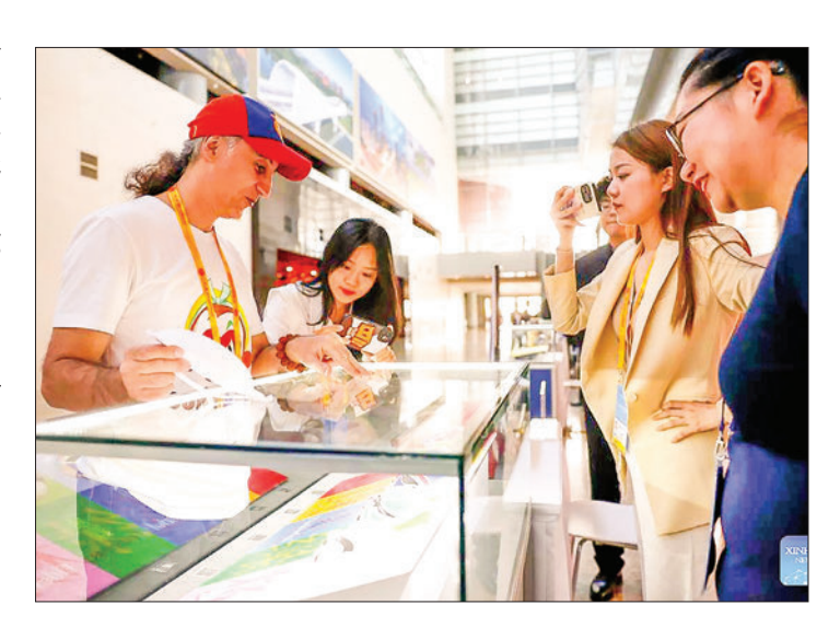
Journalists look at exhibits of Chinese intangible cultural heritage at the Media Centre of the third Belt and Road Forum for International Cooperation in Beijing, capital of China, 16 October 2023.

Energy storage, energy conservation and recovery, and clean energy were the top three sectors in terms of the number of filed patent ap-