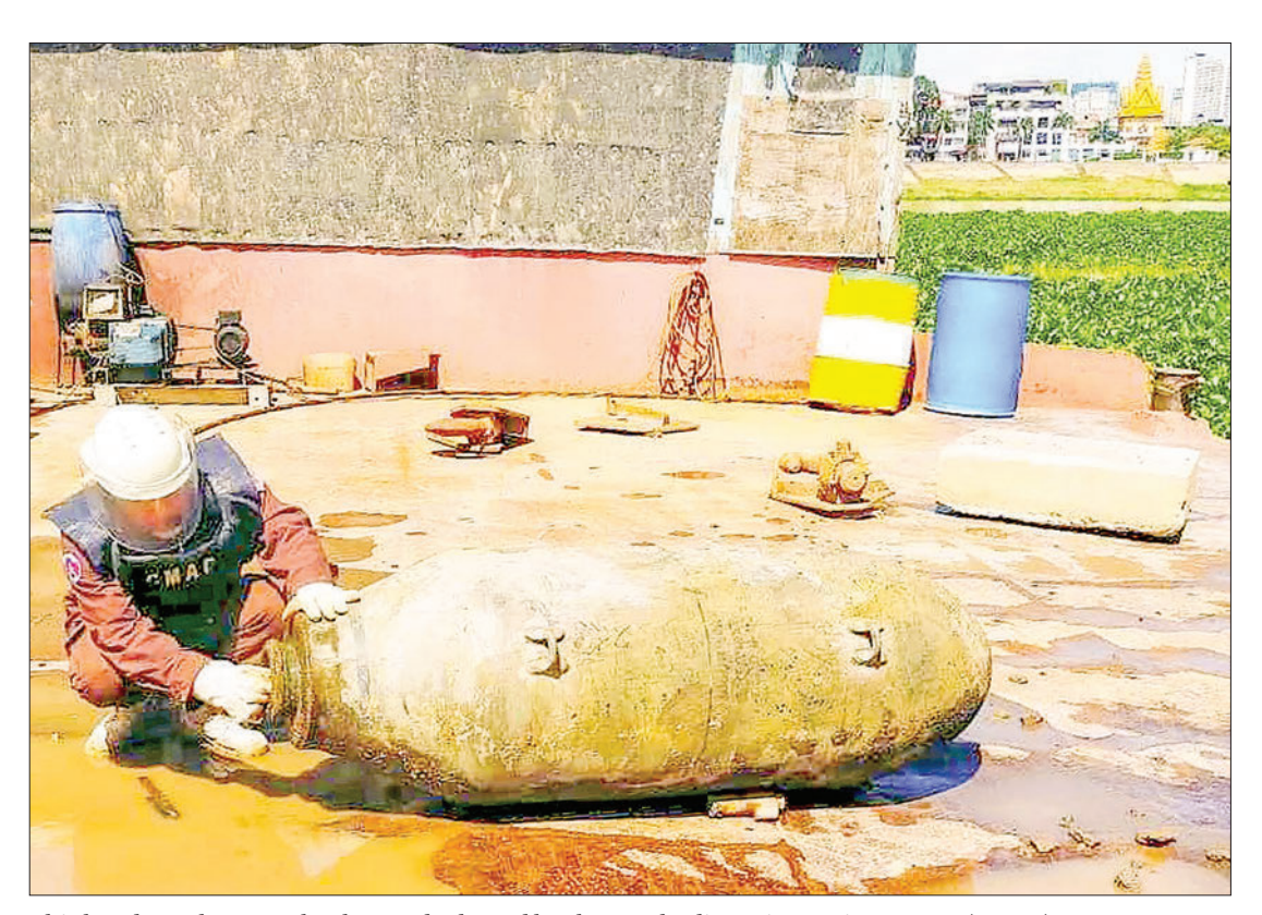
This handout photograph taken and released by the Cambodian Mine Action Centre (CMAC) on 5 May 2022 shows a CMAC staff examining a 2000-pound US-made bomb after it was uncovered from a river bed opposite to the Royal Palace in capital Phnom Penh.

CAMBODIA hosted the third global conference on assistance to the victims of mines and other explosive ordnance here on Tuesday.