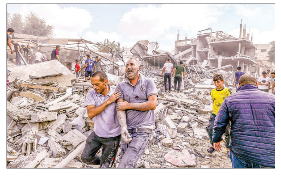
A Palestinian reacts as he is helped across the rubble following an Israeli airstrike on buildings in Rafah, in the southern Gaza Strip on 17 October 2023 amid the ongoing battles between Israel and the Palestinian group Hamas.

Gaza-based Hamas fighters broke through Israel's heavily fortified border on 7 October, killing more than 1,400 people, most of them civilians. - AFP