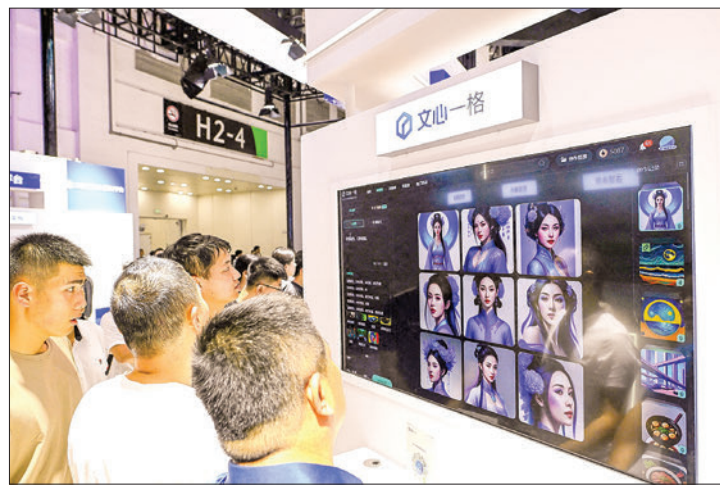
People examine an AI product of Baidu during the World Artificial Intelligence Conference (WAIC) in Shanghai on 6 July 2023.

CHINESE internet giant Baidu unveiled the newest version of its AI chatbot ERNIE on Tuesday, claiming it rivals the capabilities of OpenAI's latest ChatGPT.