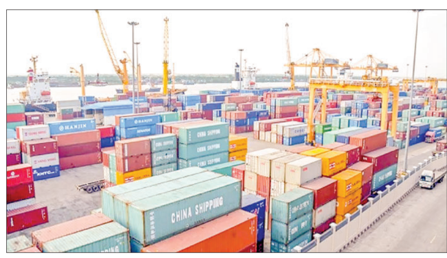
A general view of the container yard at Yangon Port.

The drop in exports was attributed to weak foreign demand in finished garment products, rice, broken rice, green gram, sesame and rubber, US dollar appreciation against the Kyat and illegitimate trade, the Union minister highlighted.