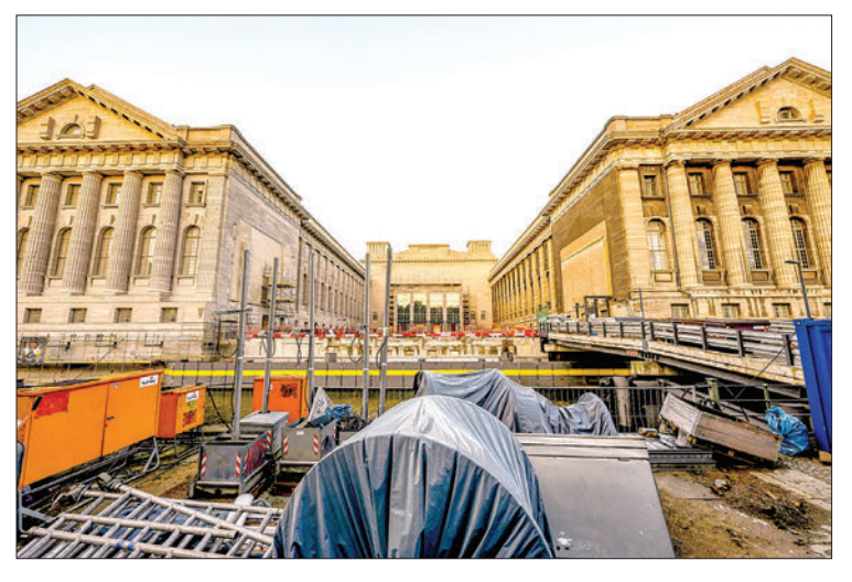
A general view shows the main entrance to The Pergamon Museum in Berlin on 5 October 2023 as renovation work progresses

The museum, which opened in 1930 and was named for the Ancient Greek masterpiece, attracts more than one million visitors a year when all its exhibits