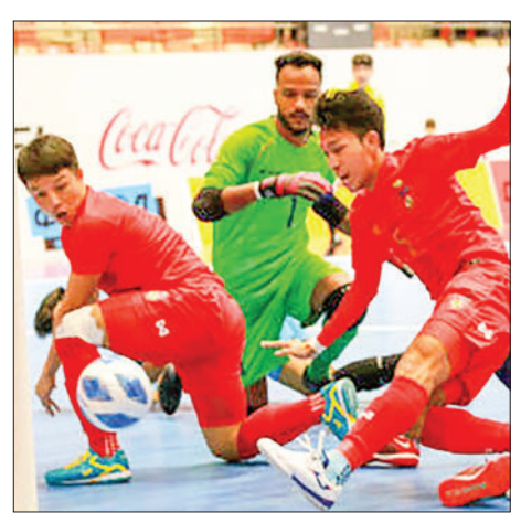
Team Myanmar (red) competed in the previous AFC Futsal Asian Cup 2024 Qualifiers against India.

Futsal and Beach Committee will hold the MFF Futsal Women Cup 2023 on 3 November, MFF Futsal League I on 24 December, MFF Futsal Championship 2023 on 18 November and MFF Futsal League II on 24 December respectively. — TWA/KZL