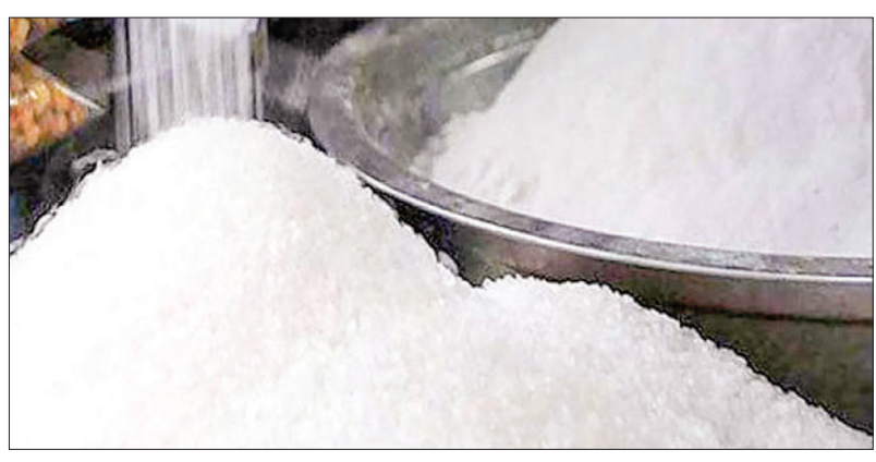
The photo shows old sugar stocks at a retail outlet in Yangon.

"Some warehouses no longer cut the price. The prices stayed the