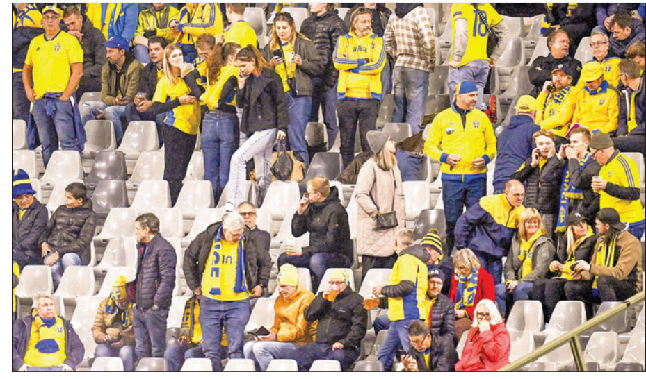
Swedish supporters wait in the stand during the Euro 2024 qualifying football match between Belgium and Sweden at the King Baudouin Stadium in Brussels on 16 October 2023 after an 'attack' that targeted Swedish citizens in a street of Brussels.

"Our thoughts go out to all the relatives of those affected in Brussels," a