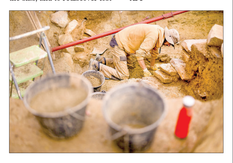
An archaeology student excavates a burial mound in Leuhan, western France, on 11 October 2023. This burial mound dating from ancient Bronze age was discovered in 1900 by French archeologist Paul du Chatellier. On this site du Chatellier also found a carved granite slab that could be the oldest map in Europe. The actual searchs are conducted to understand the architecture of the tumulus and the way it was built. A new piece of the old slab was also found during these searchs.

Ancient sites are more commonly uncovered by sophisticated radar equipment, aerial photography or by accident in cities when the foundations for new buildings are being dug.