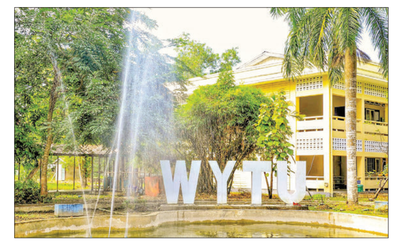
A view of West Yangon Technological University.

Application forms can be downloaded from the website of the Department of Technical, Vocational Education, and Training or obtained from the nearest government technical college and school starting from the date of the announcement. All applications must be submitted to the nearest government technical colleges, institutes, and high schools by 11 November. — TWA/KZW