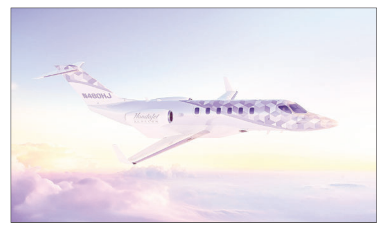
A rendered image shows a HondaJet Echelon business aircraft. (Courtesy of Honda Aircraft Co). PHOTO: KYODO

Honda Aircraft, which entered the business jet market in 2015 and sells its products globally including in Japan, announced in June a plan to offer a small business jet. — Kyodo