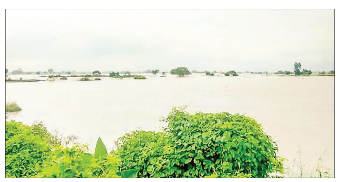
Paddy fields are seen being submerged due to floods in Bago Region.

Ripe paddy fields are usually damaged by being submerged in water for one day. At the begin-