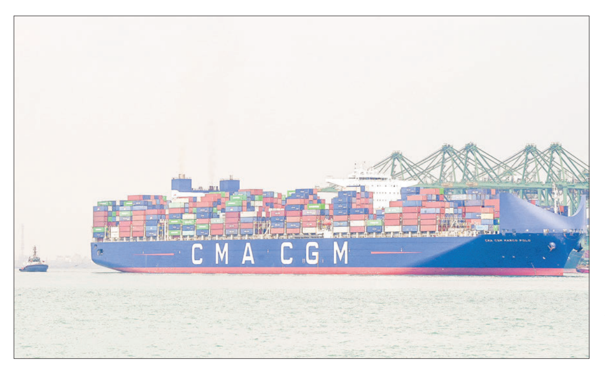
A pilot boat (L) guides a container vessel to dock at the Pasir Panjang port terminal in Singapore on 30 August 2023.