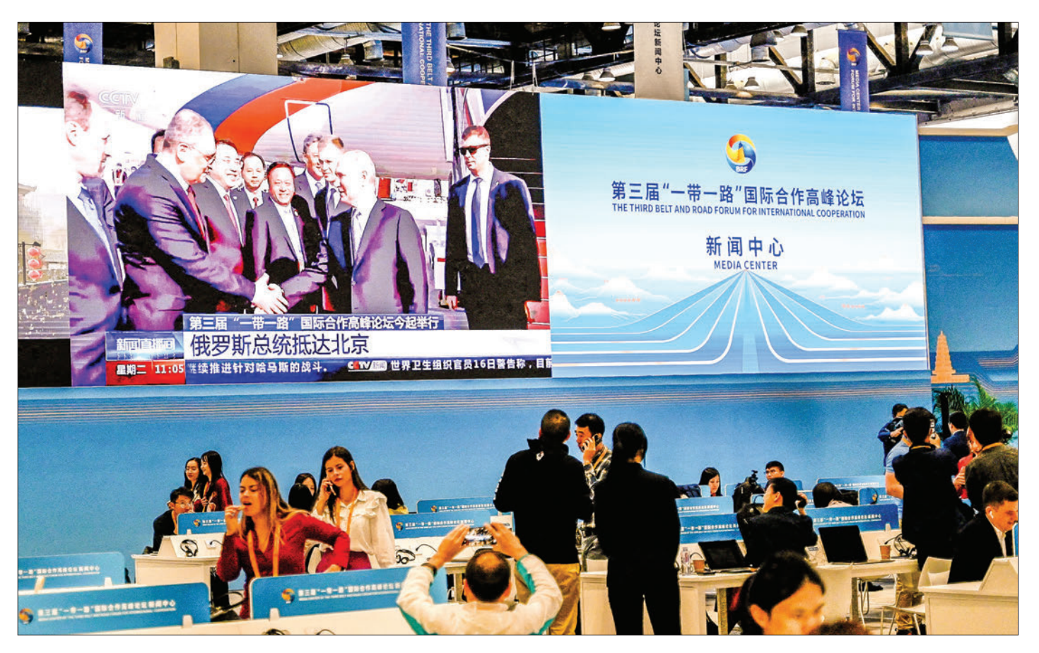
A screen in the media centre for the Belt and Road Forum shows news coverage of Russia's President Vladimir Putin arriving at Beijing Capital International Airport are seen on 17 October 2023.