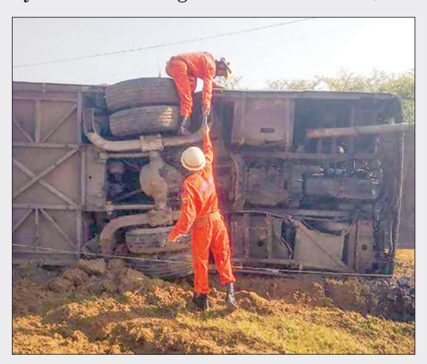
An express vehicle was seen overturned due to rain between mileposts 352/1 and 352/2 on the Yangon-Mandalay Expressway on 15 October.

Compared to the same period last year, the number of deaths due to traffic accidents in regions, states, and the Yangon-Mandalay Expressway was higher in Magway Region, Shan State, and the Yangon-Mandalay Expressway, while it decreased in Nay Pyi Taw and other regions and states. — TWA/CT