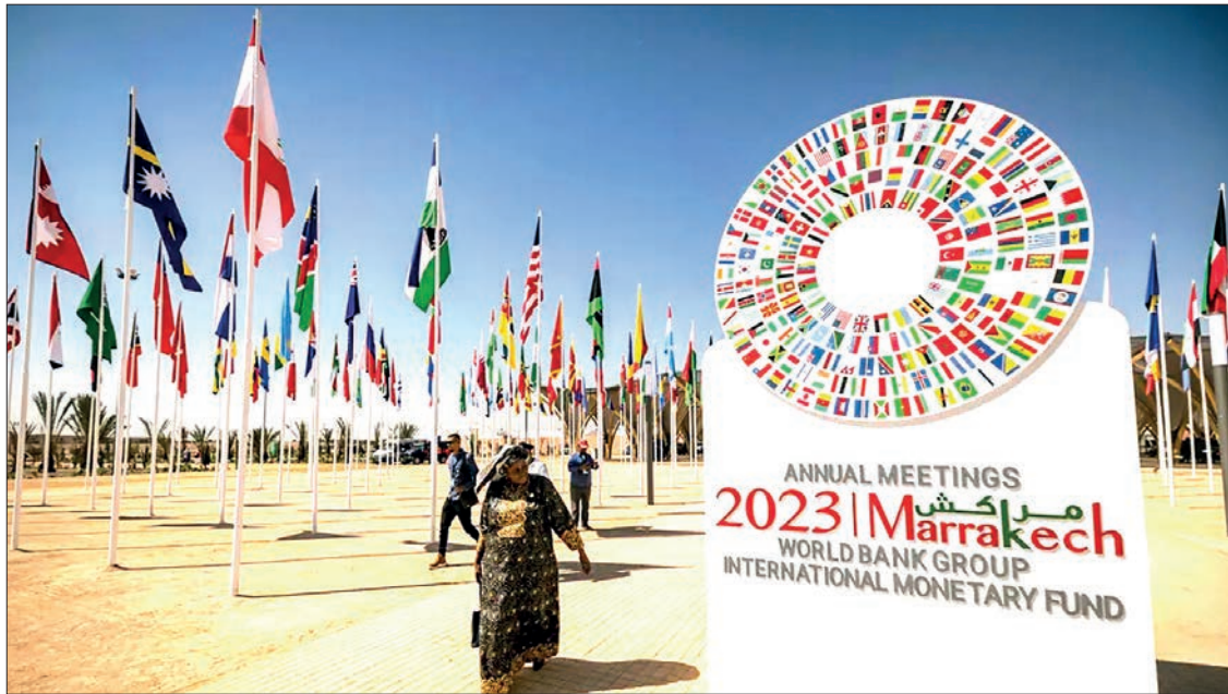
A woman walks past the emblem of the 2023 IMF and World Bank annual meetings situated at the entrance of the venue in Marrakech on 8 October 2023.

THE war between Israel and Hamas has cast a shadow over the IMF-World Bank annual meetings in Morocco, with warnings Thursday that it has darkened the outlook for an already sluggish