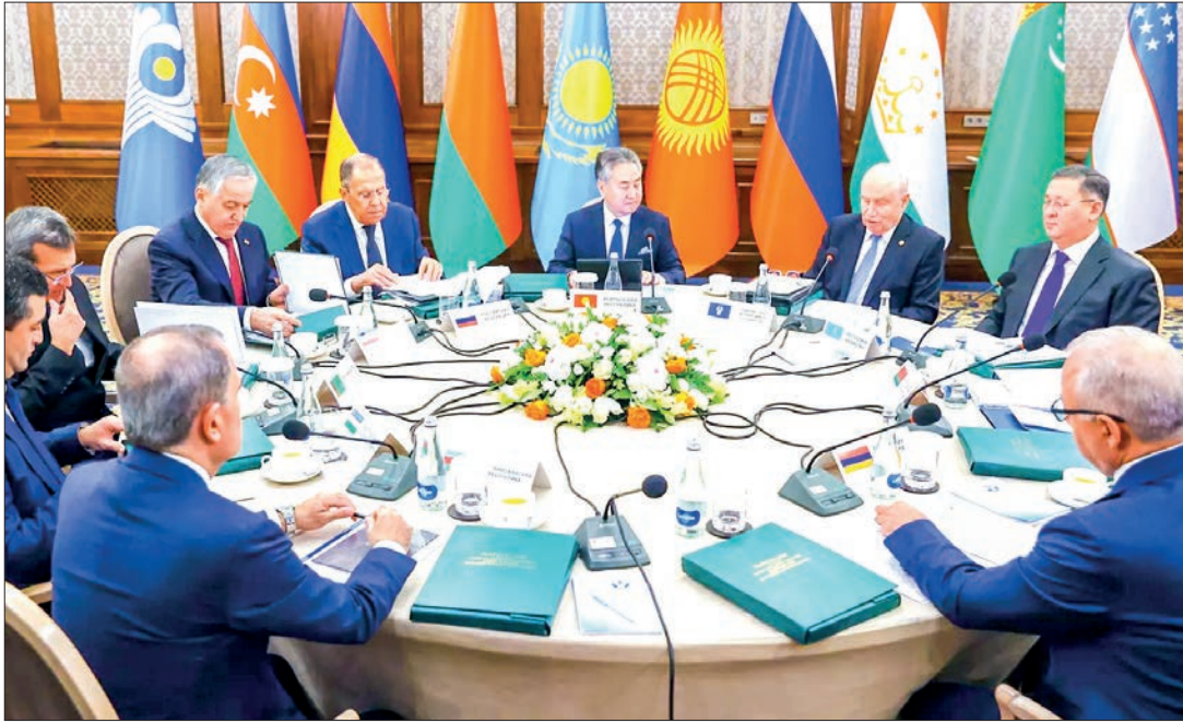
In this handout photo released by the Russian Foreign Ministry, participants attend a meeting of the Commonwealth of Independent States (CIS) Foreign Ministers Council, in Bishkek, Kyrgyzstan.