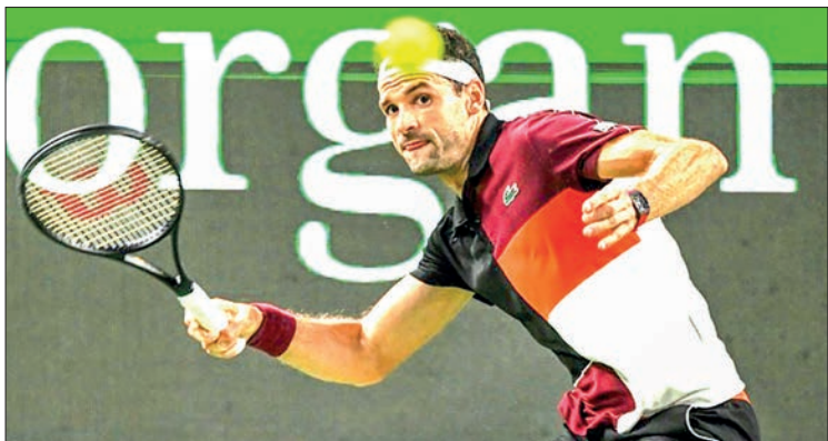
Grigor Dimitrov is into the semi-finals in Shanghai.

Dimitrov, who stunned top seed Carlos Alcaraz in the last 16, broke Jarry in the seventh game of the second set before requiring brief treatment on his right shoulder.