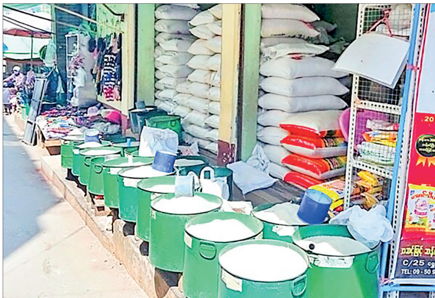
Market showcase: Diverse rice selection at Yangon's rice retail outlet.