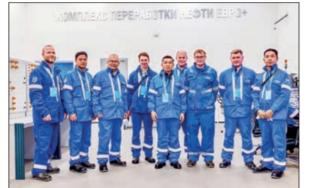
Energy UM leads delegation to Gazprom's Moscow Oil Refinery