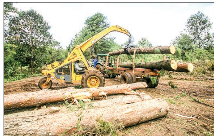
Forestry and logging contributed 1.6 per cent to Kenya's economy last year.