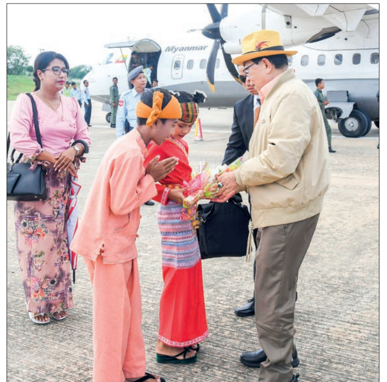
(Top & above photos) : Snapshots of EAO leaders and representatives arriving in Nay Pyi Taw to commemorate the 8 th NCA Anniversary.

Representatives of various ethnic armed organizations have come to Nay Pyi Taw from various regions and states to attend the NCA eighth anniversary celebration.