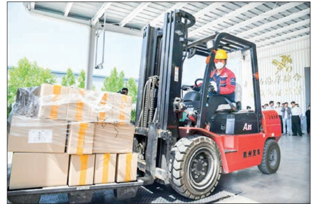
Commodities from South Korea are transported to a warehouse under full-time tracking at a cross-border e-commerce supervision center in Qingdao, east China's Shandong Province, 3 June 2020.

The sub-index tracking total business volume last month stood at 123.9 points, marking an increase of 2.5 points from August, the organization said. The satisfaction rate sub-index stood at 101.5 points in September, up 0.2 points from August, continuing an upward trend for the fourth con-