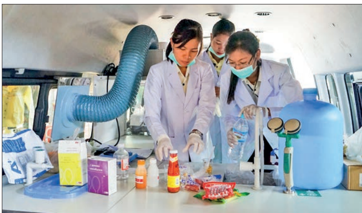
FDA examines food at four markets in Magway on its mobile lab vehicle in 2019.

If they fail to follow the instructions, they will face legal action under Section 28 (a) of the National Food Law. — TWA/KTZH