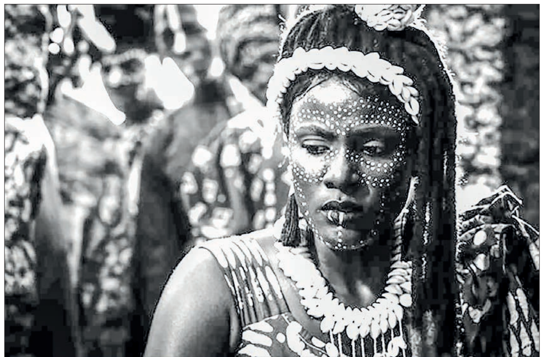
The film is like art: actors in white paint, shells in their hair, and patterns on loincloths, all for a black and white effect.

A Nigerian black-and-white art-house movie that won a Sundance award is quietly gaining an audience in a country better known for glitzy Nollywood blockbusters.