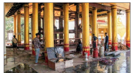
Mahamuni Buddha Image's affiliated building renovated with K8,000 mln cost