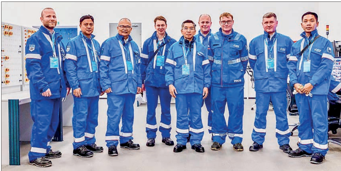
Union Minister U Ko Ko Lwin (C) is pictured during his observation tours in Moscow.

UNION Minister for Energy U Ko Ko Lwin and his delegation travelled to Moscow, Russia, to attend the 6 th Russian Energy Week International Forum (REW). During their visit, they explored Gazprom's Moscow Oil Refinery in the Russian Federation.