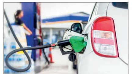
Diesel price slashes K120/litre as Octane 92 falls below K2,000 mark