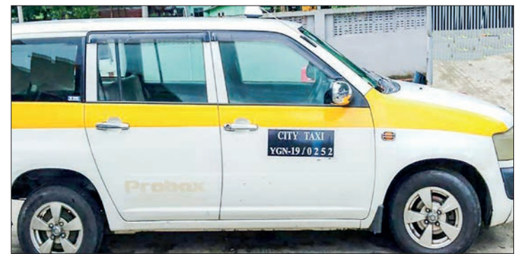
The sample of the yellow sticker line that must be drawn or attached to the sides of city taxis.

tor Vehicle Management Law, fines will be applied to vehicles that do not attach side sticker lines within the specified period. — TWA/CT