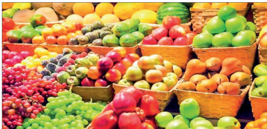
The display of fruits at the previous festival.