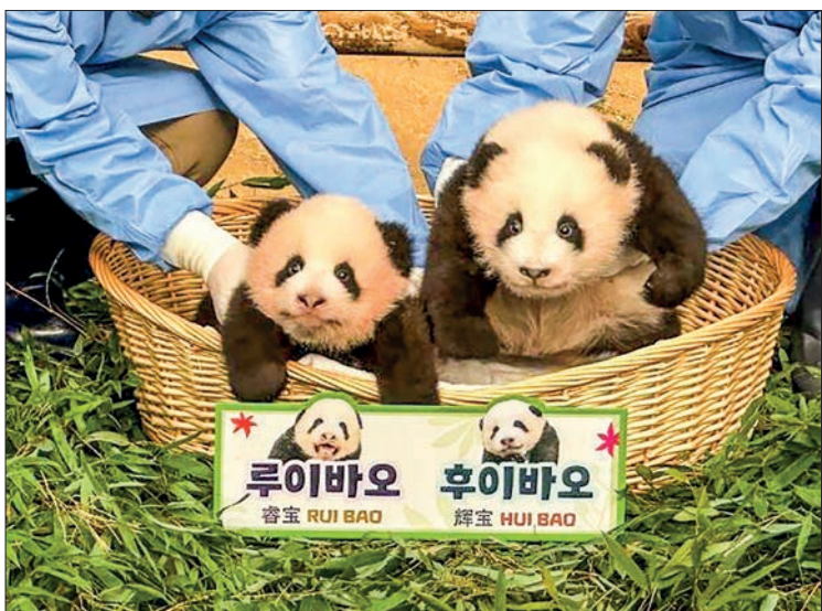
Panda cubs Rui Bao (left) and Hui Bao (right) at Everland Amusement and Animal Park in Yongin on 12 October 2023.