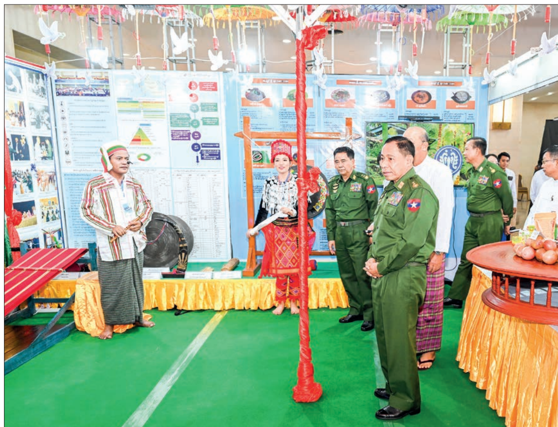
SAC Member Union Minister Lt-Gen Yar Pyae greets the ethnic traditional cultural troupes at the full-dress rehearsal yesterday in Nay Pyi Taw.

The grand celebration of the eighth anniversary of the National Ceasefire Agreement (NCA) is scheduled for 15 October at the Myanmar International Convention Centre-II (MICC-II) in Nay Pyi Taw. It promises to be a noteworthy occasion filled with political essence. — MNA/TS