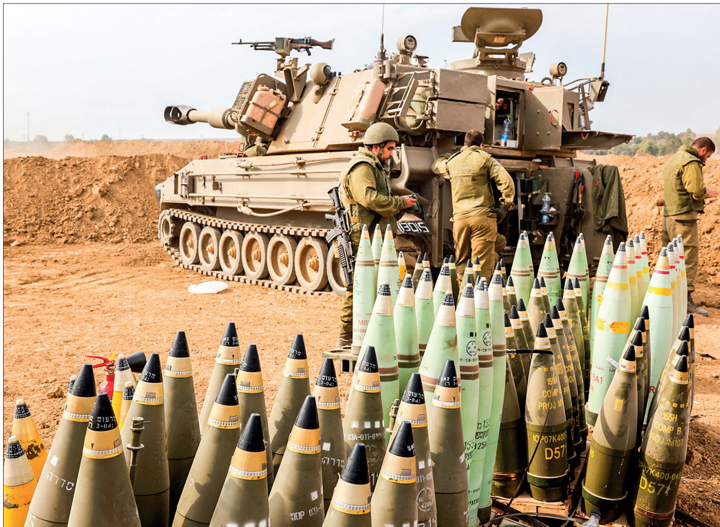
Artillery shells are lined up next to an armoured vehicle as Israeli soldiers take positions near the border with Gaza in southern Israel on 9 October.

The aggravation of the situation in the Middle East is the result of the failed policy of the United States, which was not concerned with finding a compromise in the Palestinian-Israeli conflict, the Russian leader said.