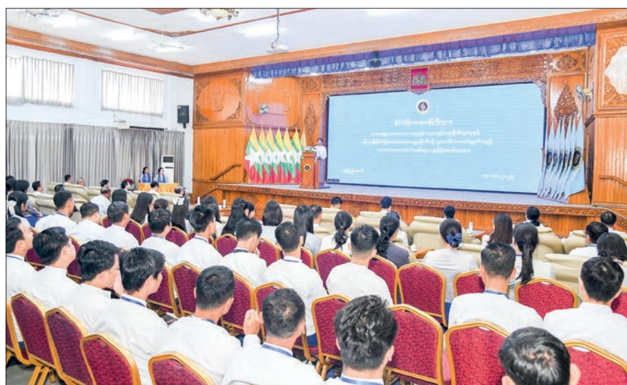
The inaugural event of the language courses for MoFA staff members in progress yesterday in Nay Pyi Taw.