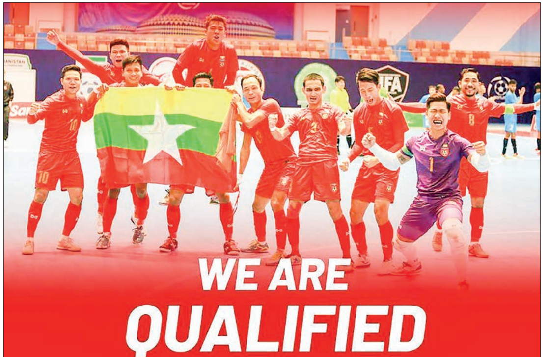
Team Myanmar is seen celebrating for the victory.