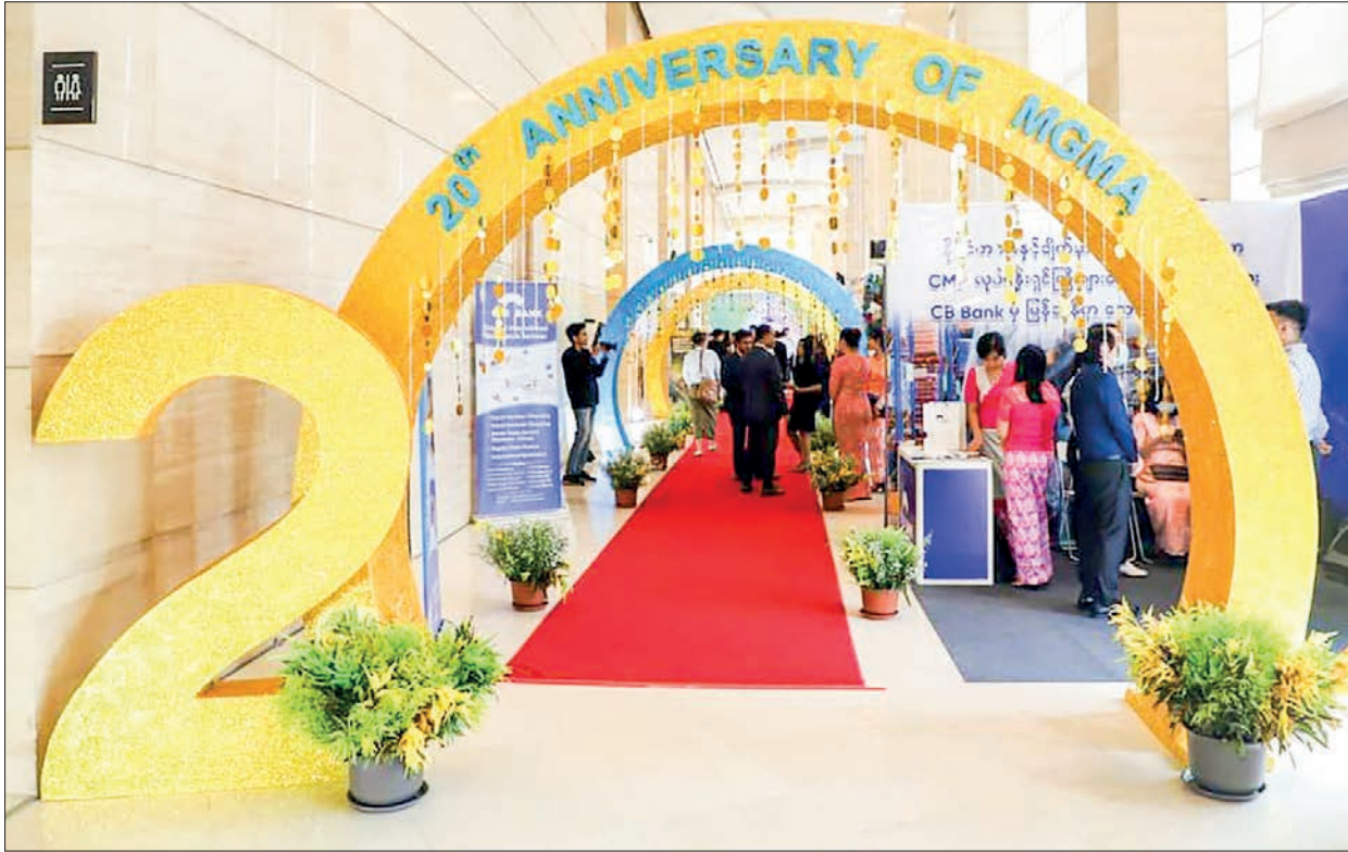
The picture captures the entrance to the 20 th anniversary of the Myanmar Garment Manufacturers Association held in May 2023.

THE Myanmar Garment Manufacturers Association has issued a notice that 254 members who failed to pay their annual dues have been terminated.