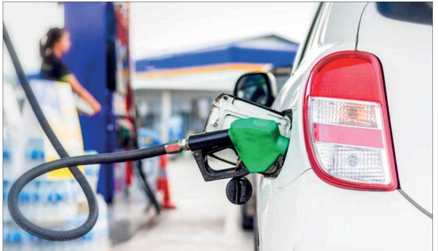
A car is seen refuelling at a petrol station in Yangon.

ON 12 October in the Yangon retail fuel market, the price of diesel dropped by K120 per litre compared to the price on 10 October, and Octane 92 fell below K2,000 per litre, according to fuel prices.