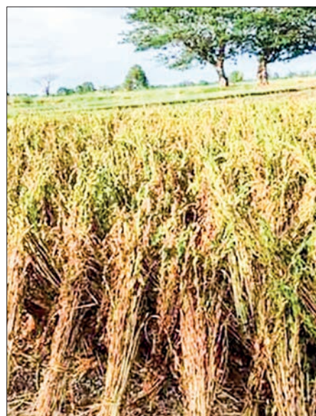
Myanmar's sesame seeds are also exported to China through land borders. Snapshot of thriving sesame plantation above.

THE sesame seed prices are moving up in the Mandalay market on the back of strong foreign demand.