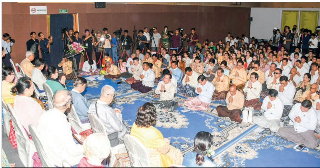
The 46 th obeisance-paying ceremony to honour elderly film artistes takes place at the Myanmar Motion Picture Organization in Yangon yesterday.

During the event, the patrons and executive committee members of the organization received K35.7 million donated by the State Administration Council, Ministry of Information, Yangon Region government and donors, Forever Group Co Ltd and the film industry, and K16.3 million worth a six-month package of