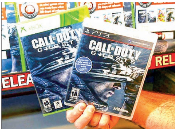
Microsoft will finally get its hands on Activision, the publisher of popular video game Call of Duty.

Activision Blizzard chief executive Bobby Kotick said the two companies had "all regulatory approvals necessary to close (the deal) and... look forward to bringing joy and connection to even more players around the world". — AFP