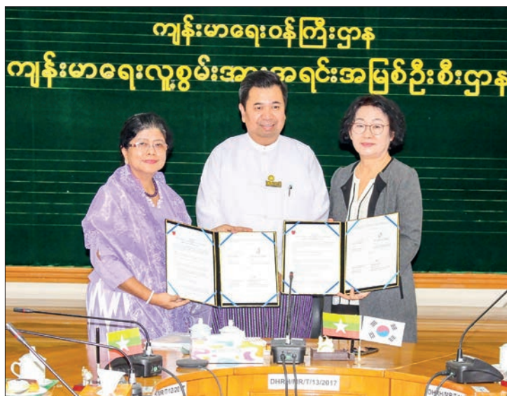
The exchange of LOIs underway yesterday in Nay Pyi Taw.

THE Letter of Intent ceremony took place at the Department of Human Resources for Health in Nay Pyi Taw yesterday, signifying a five-year collaboration between the University of Medicine