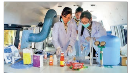
FDA announces 19 kinds of unsuitable food for public