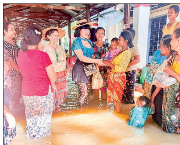
Donations in action for Bago's flood victims.

“I think they (victims) might have enough food as there are many donors. When I donate cash, they can use it for their needs. If they get K10,000, they can have meals the next day. I comforted the victims at the