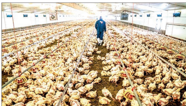
The avian flu outbreak in South Africa has led to government to look into creating a temporary rebate on poultry meat import duties.

Last month, South Africa faced both H5N1 and a new strain, H7N6, of the virus, according to the South African Poultry Association.