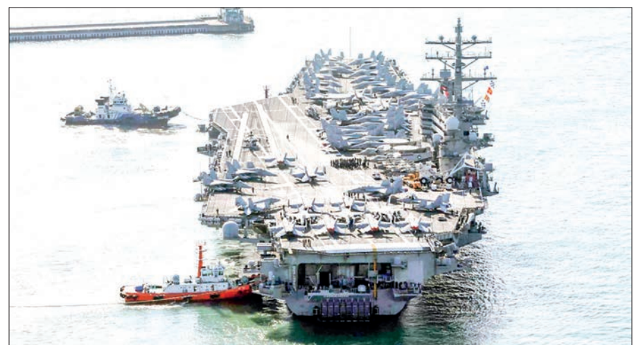
This picture taken on 12 October 2023 shows the US Navy aircraft carrier USS Ronald Reagan arriving at a South Korean naval base in the southern port city of

State media outlet KCNA called the drills, which simulated the interception of North Korean smuggling vessels, an “undisguised military provocation”. — AFP