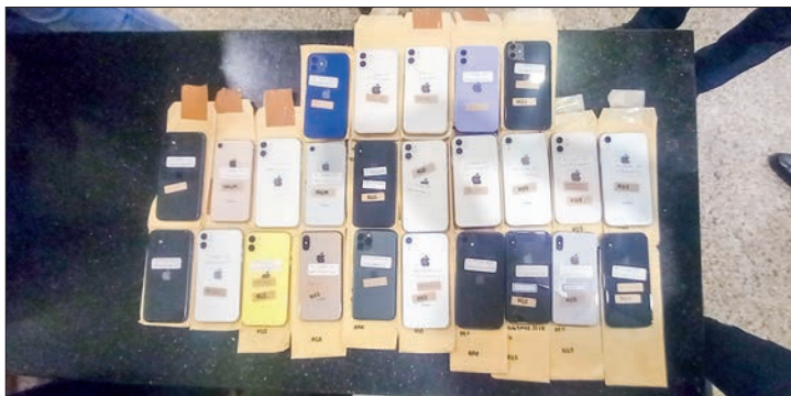
Seized illegal goods (above and below photos).