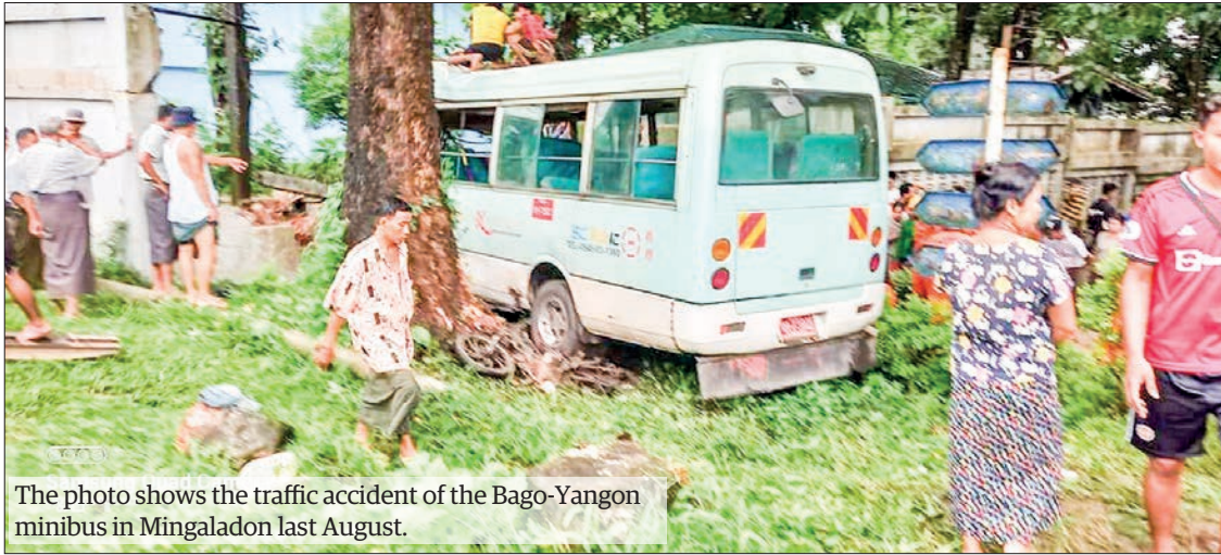
The photo shows the traffic accident of the Bago-Yangon minibus in Mingaladon last August.

THE Bago-based passenger buses with right steering and left door will not be allowed to enter the Yangon Region starting from 19 October as non-compliance with the right-hand drive system, according to the Yangon Region Public Transport Committee (YRTC).