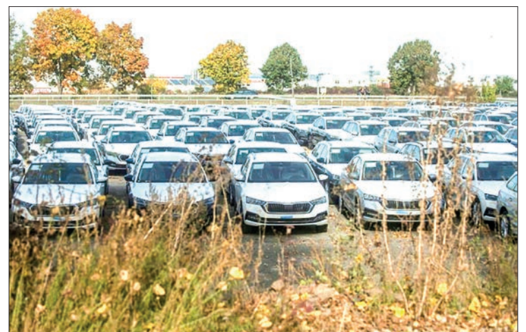
The Czech Republic has a significant car production industry. PHOTO: AFP/FILE

The legislation, which has yet to be approved by the senate and signed by the president, is expected to take effect on 1 January next year. — AFP