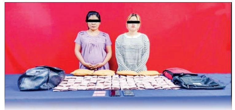
Two offenders are pictured alongside seized drugs.

The traffickers persuaded the victims by saying that they had to work as maids and had been sent to Dubai. After that, the traffickers planned to exploit the victim's wages by confining them in the room. — MNA/MKKS