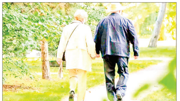
Across Europe, longer life expectancy is often synonymous with declining health.

Across Europe, longer life expectancy is often synonymous with declining health.