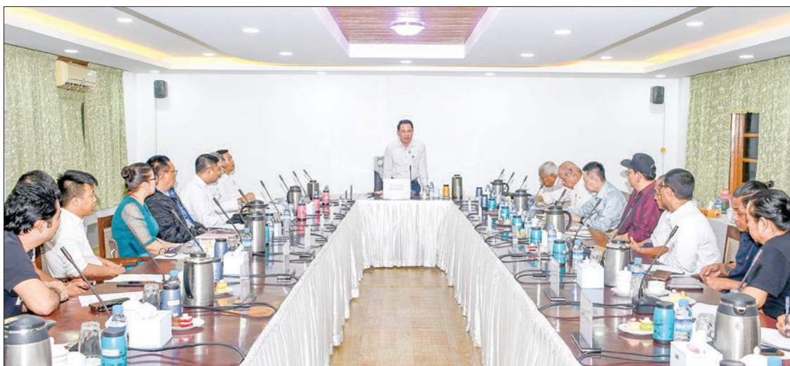
A coordination meeting to rejuvenate the film industry in progress yesterday in Yangon, attended by Union Information Minister U Maung Maung Ohn.

Union Minister U Maung Maung Ohn noted the significant progress in restoring the film industry to normalcy following the disruptions caused by the COVID-19 pandemic. He emphasized the need for discussions on overcoming current challenges in releasing completed films and how to facilitate their distribution.