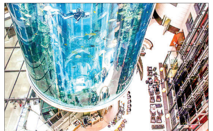
In this file photo taken on 10 May 2011 divers clean the "AquaDom" a lobby aquarium in the Radisson Blu hotel in central Berlin.

The head of the investigation, Christian Bonten, said he had narrowed the likely cause down to three possible theories but admitted the true trigger of the disaster may never be known. "It's frustrating," he told reporters as he presented his 66-page appraisal. The 14-metre (46-foot) high, cylindrical AquaDom aquarium — the largest of its kind — exploded in the early morning on December 16 last