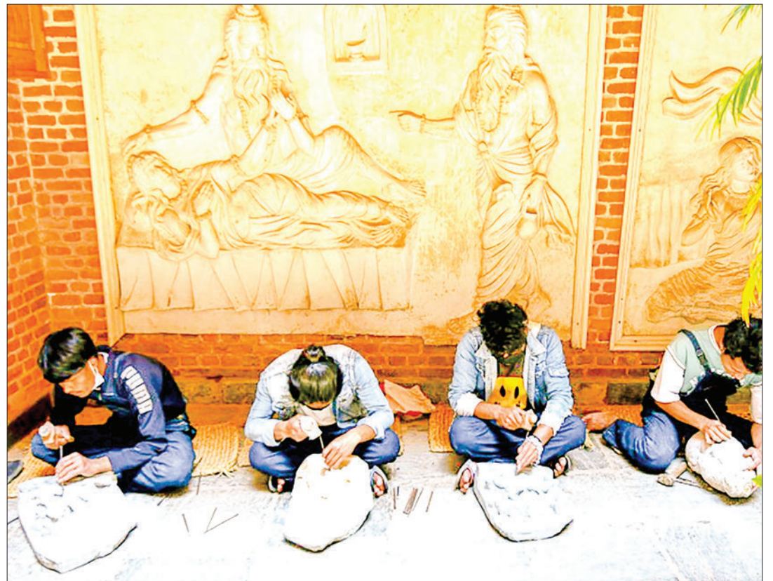
Artisans carve stone sculptures at the Nepal Vocational Academy in Bhaktapur on the outskirts of Kathmandu.