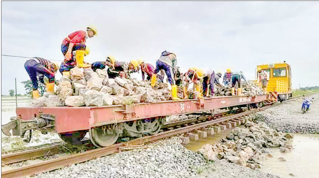
MR staff members engage in repairs on flood-affected rail tracks.