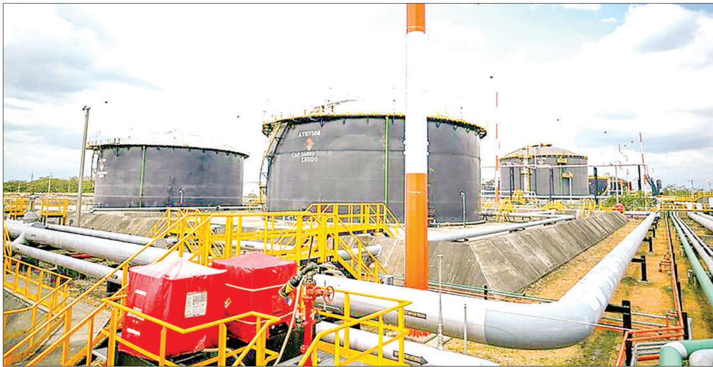
Crude oil storage tanks stand at the plant of Colombian petroleum company Ecopetrol in Acacias, Meta Department, south of Bogota on 10 February 2023.

The Israel-Hamas conflict has caused concerns in oil markets, as the Middle East accounts for a significant portion of global oil shipments.