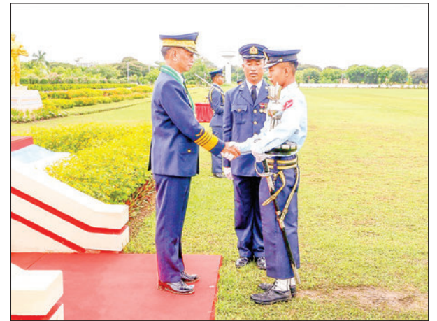
(From L to R) : The Chief of the Air Force presents the best pilot cadet award and outstanding awards to recipients in Meiktila yesterday.