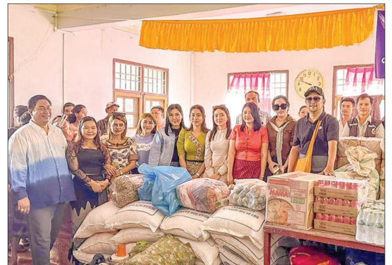
Donations of relief goods are presented to the flood victims in Hlegu yesterday.