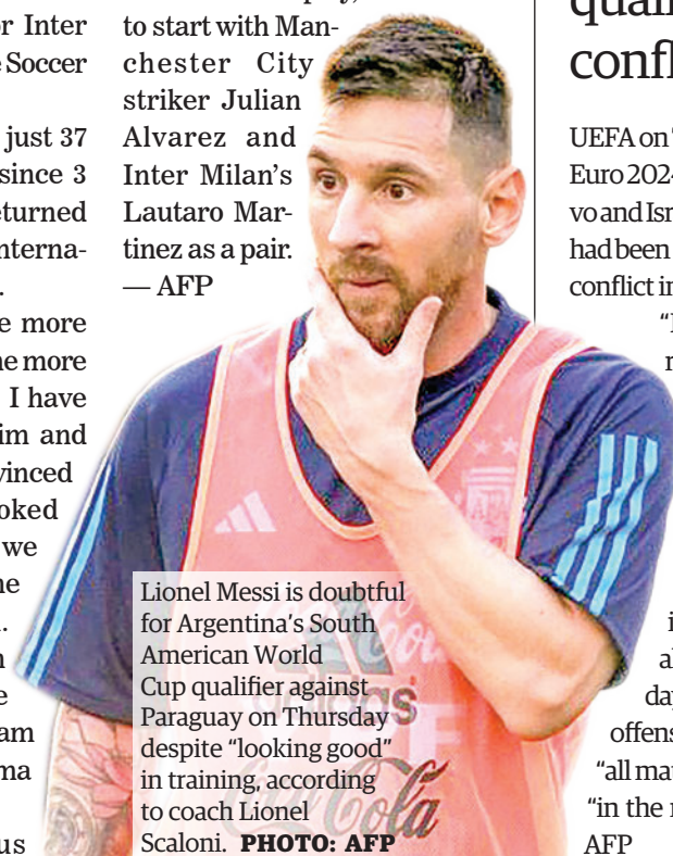
Lionel Messi is doubtful for Argentina's South American World Cup qualifier against Paraguay on Thursday despite "looking good" in training, according to coach Lionel Scaloni.

Argentina have won both their qualifiers so far and are level on six points at the top of the table with Brazil. One option for Scaloni, should Messi not be fit to play, would be to start with Manchester City striker Julian Alvarez and Inter Milan's Lautaro Martinez as a pair. — AFP