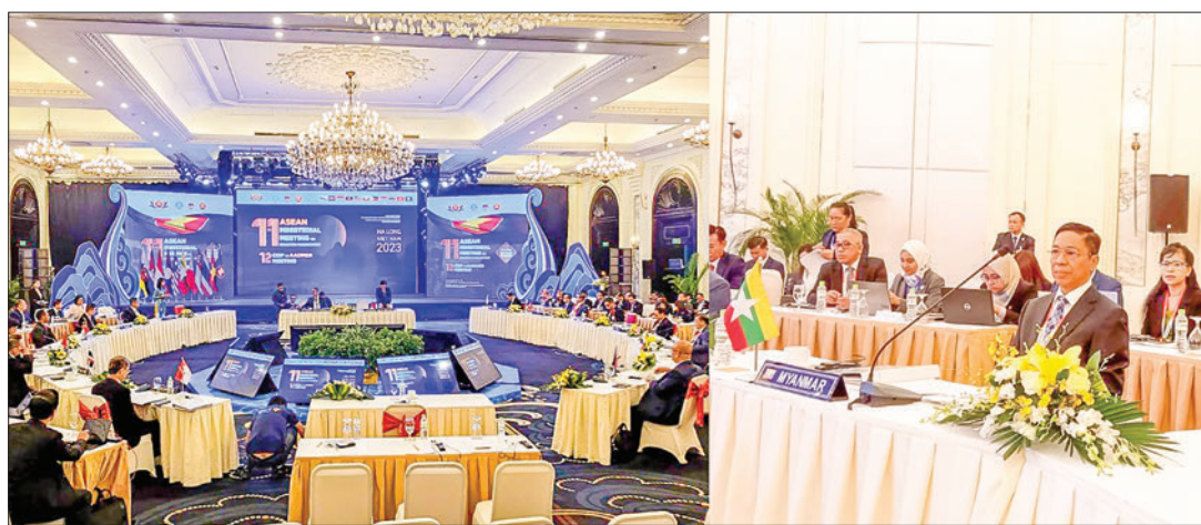
Union Minister Dr Soe Win participates in the 11 th ASEAN Ministerial Meeting on Disaster Management in Viet Nam.

A Myanmar delegation led by Union Minister for Social Welfare, Relief and Resettlement Dr Soe Win is attending the 11 th ASEAN Ministerial Meeting on Disaster Management (AMMDM) and related meetings in Ha Long, Viet Nam from 9 to 13 October.