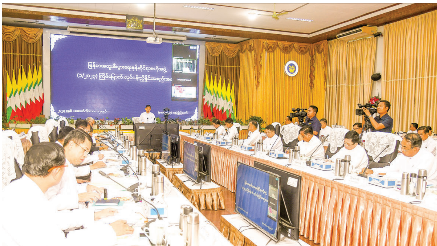
State Administration Council Vice-Chair Deputy Premier Vice-Senior General Soe Win presides over the work coordination meeting 1/2023 of the Myanmar SEZ Central Committee in Nay Pyi Taw yesterday.

The Vice-Senior General stressed that thanks to the Kyaukpyu Deep Sea Port project, the Myanmar-China economic corridor cooperation project can be implemented to enhance cooperation between the two countries. Ar-