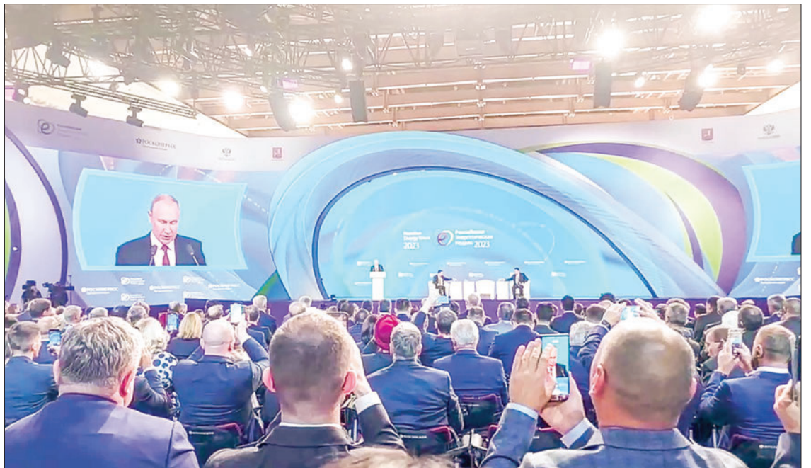
The Sixth Russian Energy Week International Forum 2023 (REW 2023) in progress in Moscow on 11 October 2023.

The Union Energy Minister in his turn said that Myanmar is striving to ensure energy sufficiency for long-term economic development. So, Myanmar hopes for investment and technological assistance through the cooperation of friendly countries. Myanmar manages the use of solar energy and wind power energy as renewable energy to fulfil the energy requirements in conventional ways. He ex-