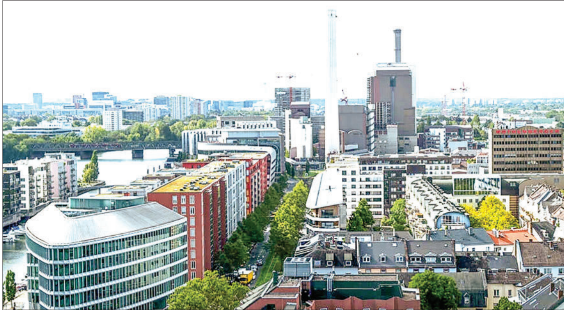
Facing high energy prices, the German economy will shrink in 2023, the government predicts.

THE German government slashed its growth forecast Wednesday, predicting Europe's top economy will shrink this year as it battles high inflation, elevated energy prices and a manufacturing slump. Output will shrink 0.4 per cent, the economy ministry said