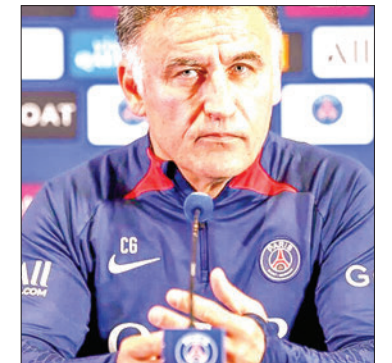
Christophe Galtier was replaced by Luis Enrique as PSG coach in July.

Galtier, 57, won the Ligue 1 title with PSG but lasted just one season at the club after a poor second half of the campaign. The final weeks of his reign were marred by accusations of racism during his previous job at Nice. He has vehemently denied the accusations but will stand trial in December. At Al Duhail he will inherit a squad including former Liverpool and Barcelona playmaker Philippe Coutinho. — AFP