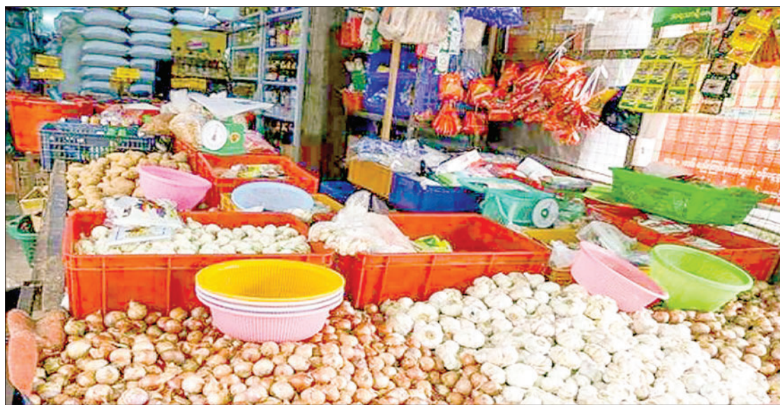
An undated picture shows a kitchen grocery outlet in Yangon.

Although the opening prices of Seikphyu and Pyawbwe brokerage houses for onions were K2,300–K3,400 per viss and K2,400–K3,400 per viss, respectively, on 10 October, the prices of Seikphyu and Myingyan onions decreased to K2,200–K3,300 per viss and K1,800–K3,000 per viss on 11 October.