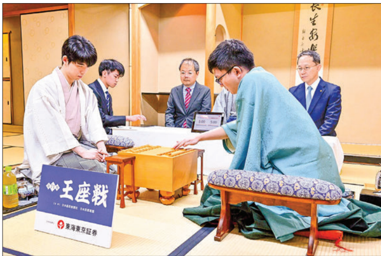
Shogi players Takuya Nagase (front R) and Sota Fujii meet in Game 4 of the Oza championship series on 11 October 2023, in Kyoto.

Before the era of eight titles began in 2017 with the addition of Eio, only three players swept all available titles — three were held by Kozo Masuda, three, four and five by Yasuharu Oyama and seven by Yoshiharu Habu. — Kyodo