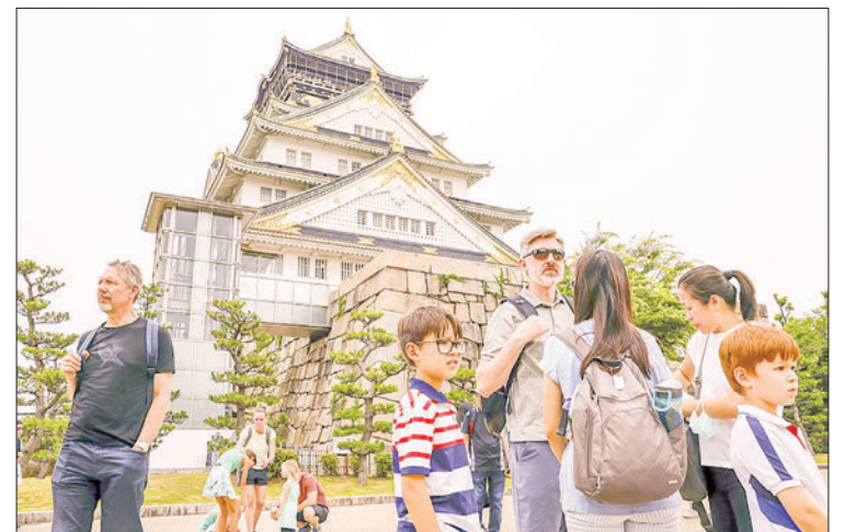
Tourists walk near Osaka Castle in the western Japan city of Osaka on 10 June 2023.

ing accommodative monetary policies. After being hit hard by supply chain disruptions during the COVID-19 pandemic, Japan's auto and other export-oriented manufacturing industries have been recovering. The number of foreign visitors, which this summer returned to about 85 per cent of the level in 2019 before the outbreak of the coronavirus, is expected to increase further, given that there are some favorable developments such as China's removal of restrictions on Japan-bound group travel for its citizens in August. — Kyodo