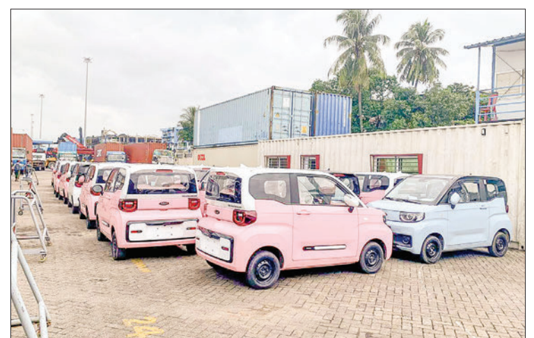
Fresh arrivals of battery electric vehicles dock at Yangon Port.

The import of these EVs and EV chargers is exempted from Customs duties.