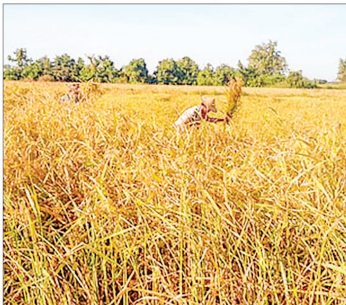
Farmers harvesting rice in the paddy field.

erting concerted efforts to attain 10 per cent growth in rice exports. To raise foreign income, it has been prioritizing the exportation of high-grade rice and boosting export volume, MRF stated. — NN/EM