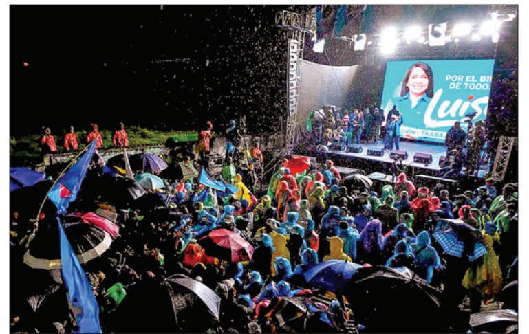
Ecuador's presidential candidate for the Revolucion Ciudadana party, Luisa Gonzalez, delivers a speech during a campaign rally in Quito, on 11 October 2023.

In August, Fernando Villavicencio — a journalist-turned-presidential candidate with a history of speaking out against the cartels — was assassinated in broad daylight while on the campaign trail.