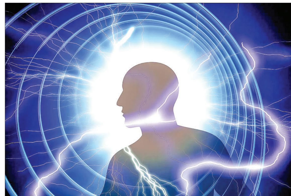
Our mental processes and cognitive patterns play a significant role in shaping our emotions.

ways. The way you feel also influence the types of thoughts that can pop into your head, making you more vulnerable to experiencing thoughts that are negative and