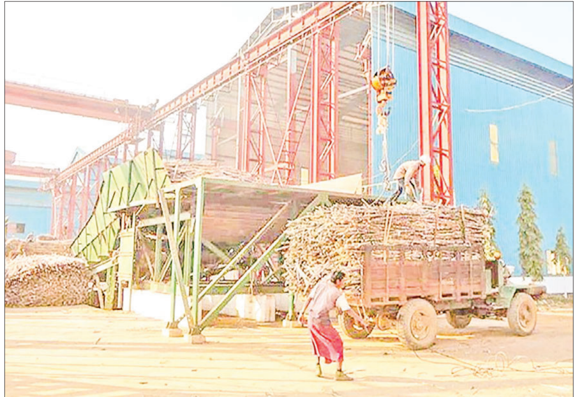
The sugarcane is grown in December-January. It can be harvested from November to February of the following years. The picture captures workers unloading sugarcane at the mill.

Sugarcane is commonly found in the upper Sagaing Re-