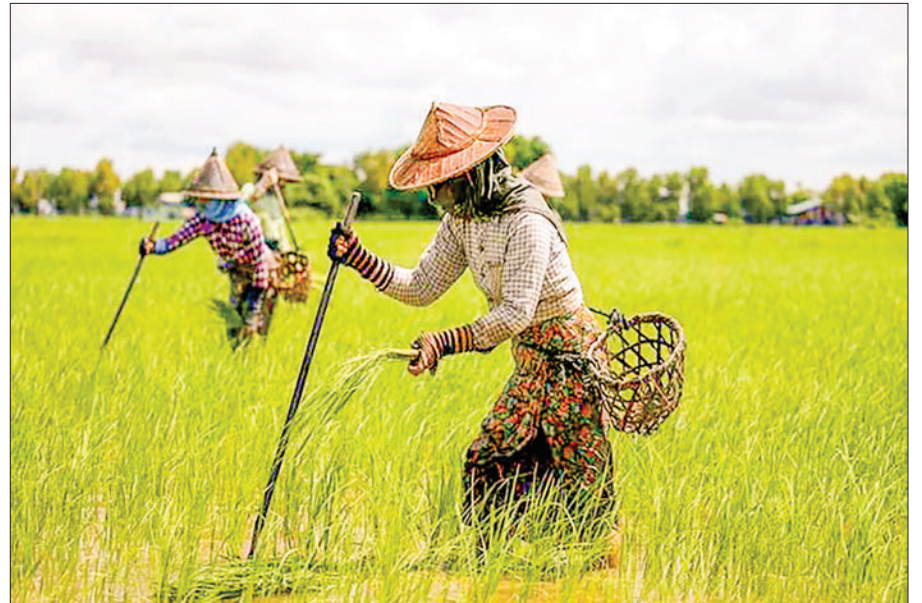
The photo shows rice seedlings being planted by female farmers.

As long as the development of the agriculture sector is the main factor to focus on with a total of nearly 700,000 people in Myanmar living in rural areas and depending on agricultural work, the Ministry of Agriculture, Livestock and Irrigation implements a total of 35 projects including 18 projects in the crop sector, three in the livestock sector, two in the fisheries sector, eight in agricultural education capacity-building and research, two in improving the