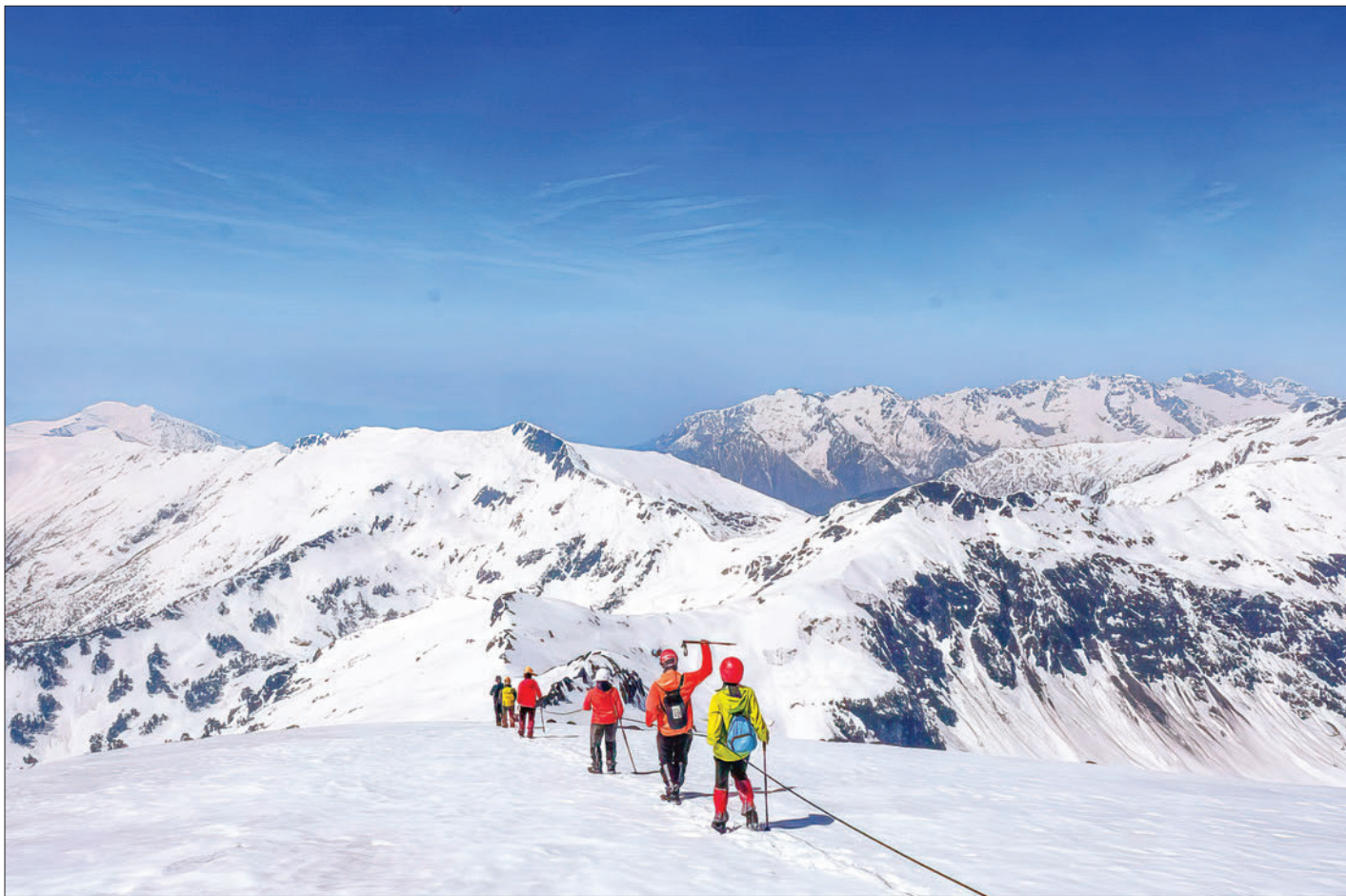
Adventurous travellers conquer the 14,000-foot high Mount Phonkanrazi in PutaO.