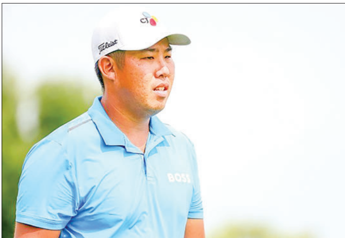
An Byeong-hun of South Korea was issued a three-month ban by the PGA Tour on Wednesday for an anti-doping violation involving a banned substance found in an over-the-counter cough medicine available in his homeland.

SOUTH Korea's An Byeong-hun was suspended for three months by the PGA Tour on Wednesday for violating its anti-doping policy with a cough medicine available over the counter in his homeland. The 32-year-old from Seoul was issued a ban retroactive to 31 August so An will be able to return to competition on 1 December. An tested positive, the tour said, for a substance banned