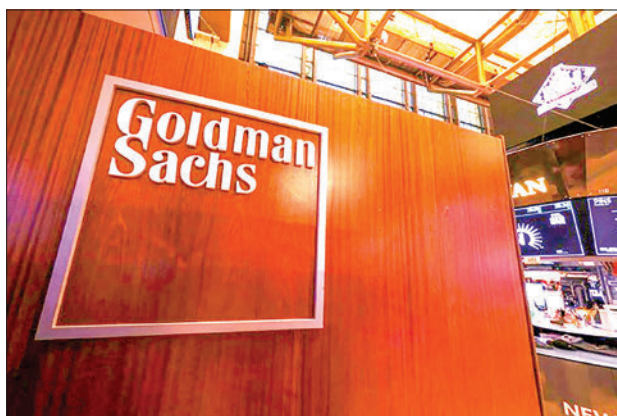
Goldman Sachs has sued Malaysia in a British court.

The bank said in a statement on Thursday that it had "filed for arbitration against the Government of Malaysia for violating its obligations to appropriately credit assets against the guarantee provided by Goldman Sachs in our settlement agreement and to recover other assets". — AFP