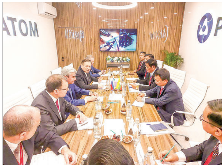
The discussion between Union Minister U Ko Ko Lwin and Russian Minister of Energy Mr Nikolay Shulginov in progress on 11 October in Moscow.

pressed his hope for cooperation with Russia in nurturing human resources for the improvement of the energy sector.