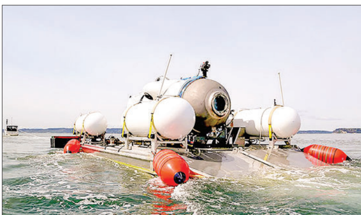
This undated image courtesy of OceanGate Expeditions, shows their Titan submersible being towed to a dive location in Everett, Washington.