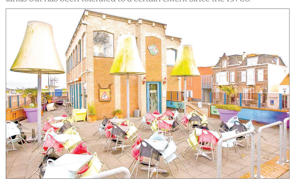
Coffee shops may not stock more than 500 grammes (just over one pound) of cannabis, nor sell more than five grammes per day to the same customer. Checkpoint cafe in Terneuzen.

Despite common perception, marijuana is not fully legal in the Netherlands but has been tolerated to a certain extent since the 1970s.