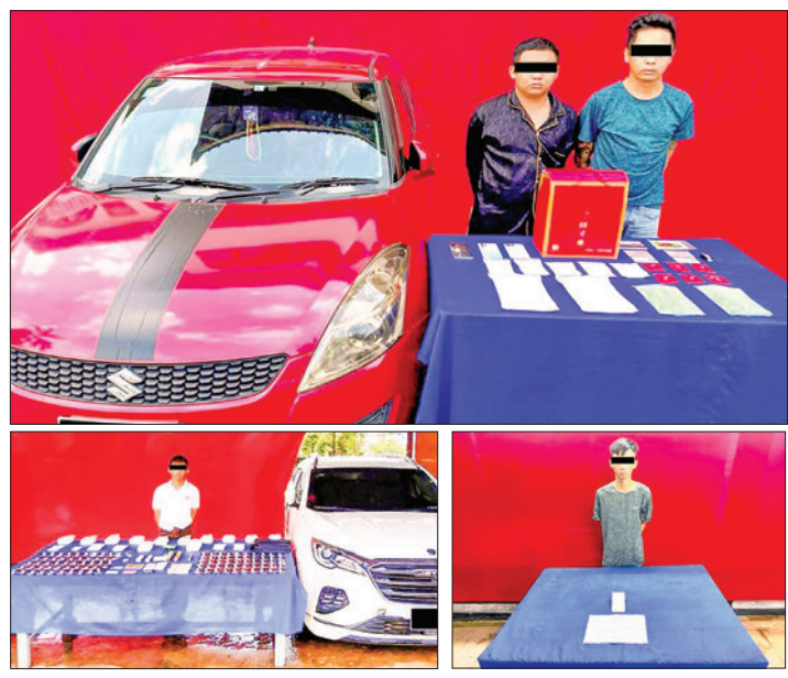
Arrestees and seized vehicles, narcotic drugs and weapon are seen in the pictures.

Legal action has been taken against the offenders, and an investigation is underway to identify others involved in the criminal chain.