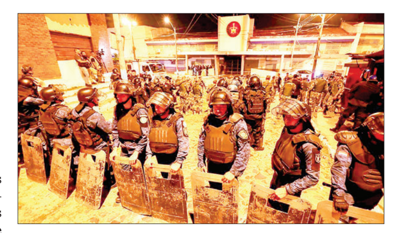
Tacumbu prison houses around 3,000 inmates, or 607 per cent of its theoretical capacity.

According to AFP journalists and images broadcast by television channels, many detainees took up positions on the roof of the main prison building, throwing stones at the police. — AFP