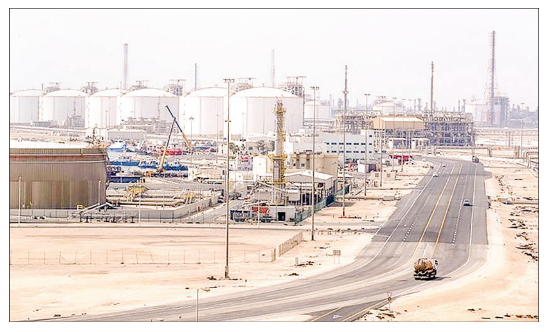
Qatar will supply 3.5 million tonnes of gas a year under the deal, following two agreements with Total last year.