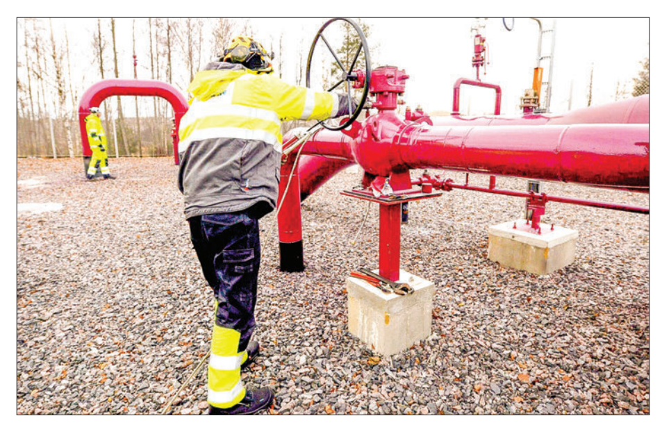
An employee operates a valve at a compression station of the Balticconnector gas pipeline between Finland and Estonia in Inkoo in 2019.

Russia considers it alarming and references previous pipeline explosions, particularly the Nord Stream pipelines in the Baltic region.