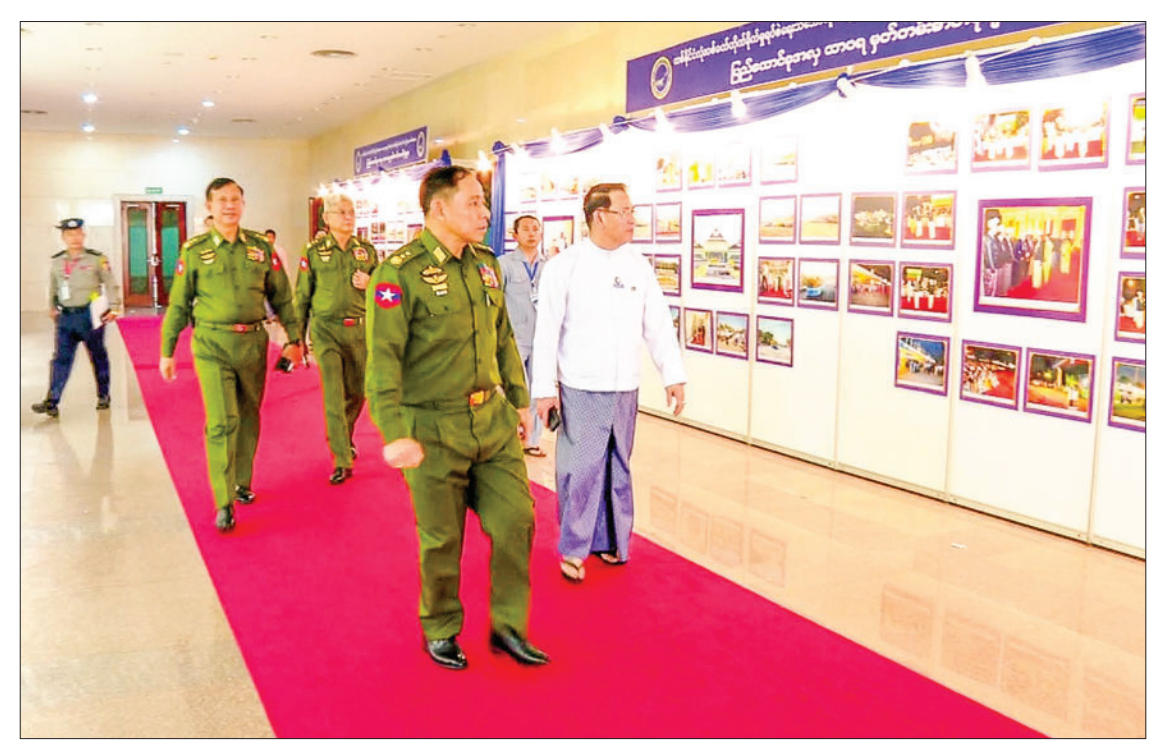
Member of the State Administration Council, Union Minister for Home Affairs Lt-Gen Yar Pyae and Union Minister for Information U Maung Maung Ohn inspect the preparations for the ceremony of the Eighth Anniversary of the Nationwide Ceasefire Agreement at MICC II yesterday.

THE Eighth Anniversary of the Nationwide Ceasefire Agreement (NCA) is set to be celebrated on 15 October at the Myanmar International Convention Centre II (MICC II) in Nay Pyi Taw.