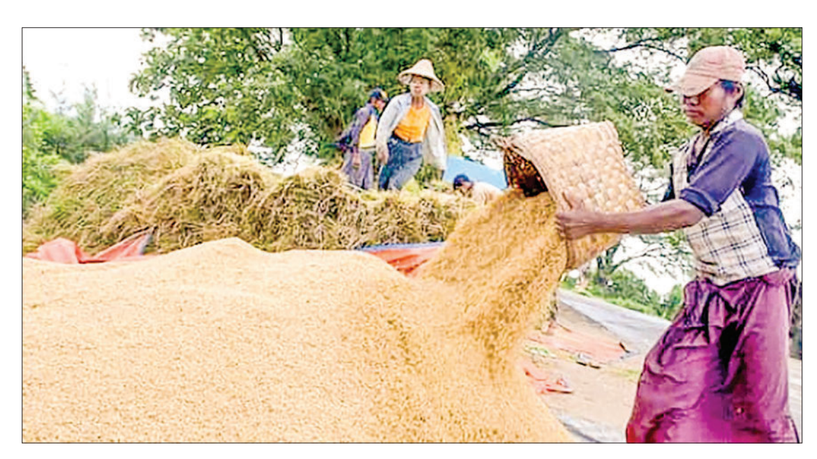
A farmer is seen piling up the harvested paddy in the field in Ayeyawady Region.

The market price of low-grade monsoon paddy was below K300,000 per 100 baskets in 2011. Under the rice reserve scheme of the State, the floor price of paddy (46 pounds per basket) was set at K330,000 for monsoon paddy and K320,000 for summer