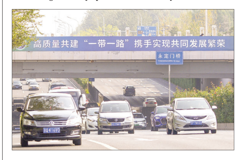
A sign bearing a "Belt and Road" slogan in Chinese is pictured in Beijing on 11 October, 2023.

Major achievements include railway projects in Indonesia and Laos, but the initiative has also brought criticism for drawing recipient nations into a Chinese debt trap, with developing nations saddled with huge debts that allow Beijing to leverage control over them. - Xinhua/Kyodo