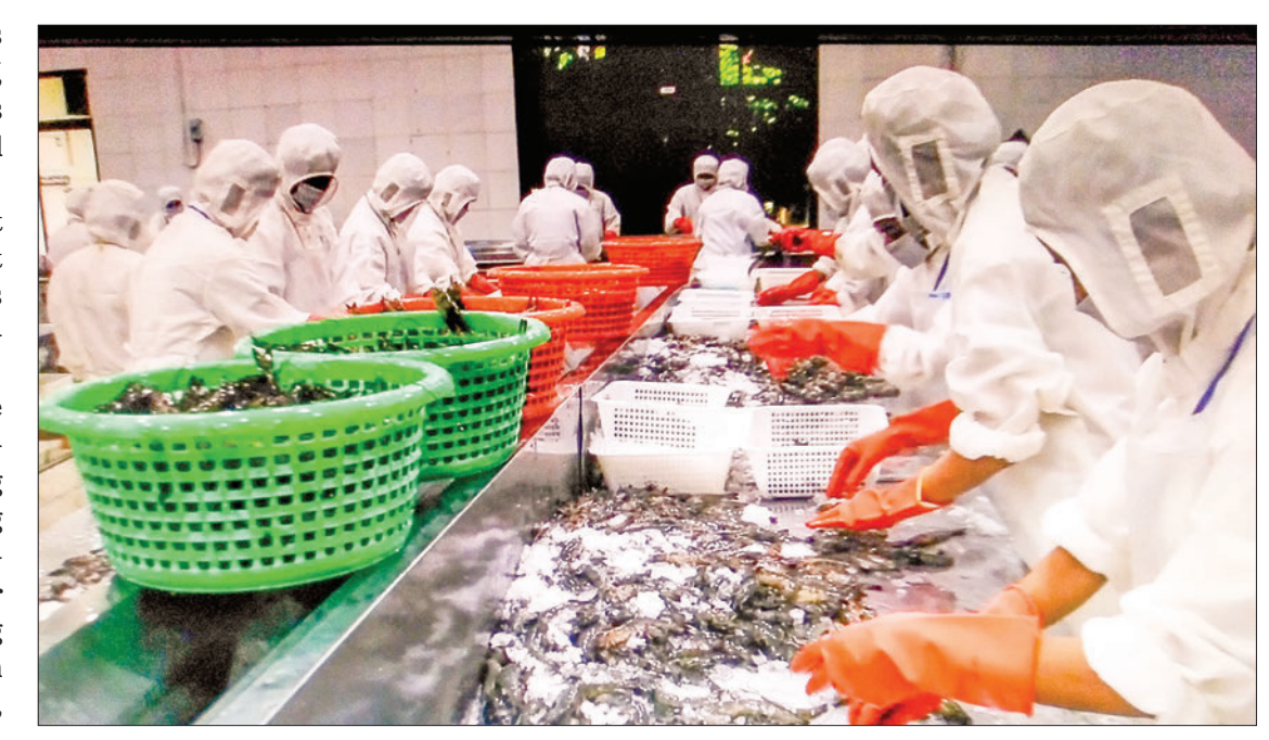
Myanmar's shrimp to be exported are seen being processed at a cold storage factory.

In addition to maritime trade to global markets, Myanmar delivers fishery products including fish and shrimps to neighbouring countries via border posts. Myanmar exports shrimp to over 40 foreign countries including China, Thailand, Bangladesh and Japan, mostly to Thailand, followed by China. — NN/EM