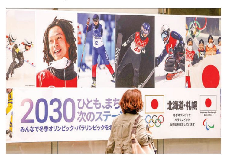
Posters to promote Sapporo's bid to host the 2030 Winter Olympics and Paralympics are pictured in the northern Japan city in Hokkaido on 6 October, 2023.

their bid to host the 2030 Winter Olympics and decided to aim for 2034 or later.