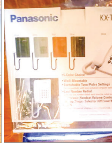
Photos show the confiscated Aromatic Collagen Mask and Panasonic telephone set from Thilawa container port.

Similarly, the Muse Township Illegal Trade Eradication Task Force seized 13 kinds of goods worth K10.431 million including 90 warm clothes that were smuggled by the side of the road over the Asia World Tollgate in Muse Township on 10 October. The action was taken under Customs procedures.