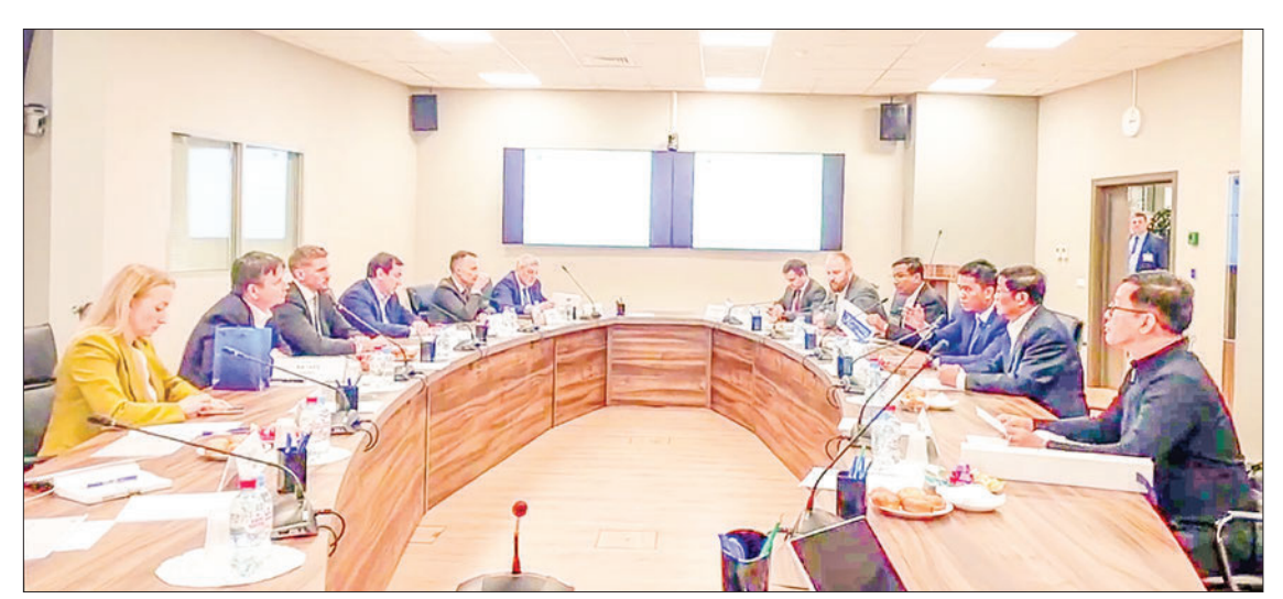
Union Minister for Electric Power U Nyan Tun discusses with officials from Russian Power System Operator for cooperation on electric power generation yesterday.

Russia has a single synchronous electrical grid covering many countries, with a total length of 490,000 kilometres (more than 300,000 miles) of 110-750 kV power lines and a total of more than 10,000 substations. In the production of electricity, 60.7 per cent of the electricity is pro-