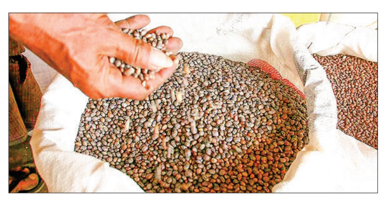
A customer checks the quality of black gram at a market.

THE black gram price hit a record high of K2.65 million per tonne although the pigeon pea price is quite stable in the domestic pulses market.