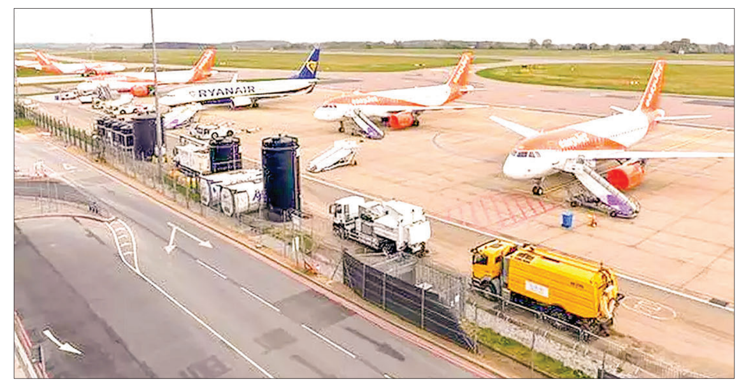
The airport says works are ongoing to get the airport operational again.

The fire resulted in significant structural damage. Approximately 1,200 vehicles in the car park were potentially affected by the fire.