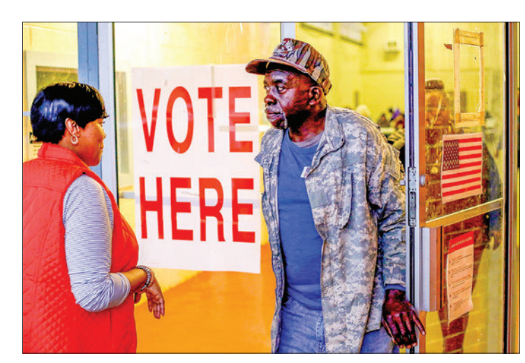
Black voters represent around a quarter of registered voters in Alabama but are in a majority in only one of the state's seven US House districts.

It is one of several legal battles involving racial gerrymandering — the manipulation of electoral maps to minimize the voting power of