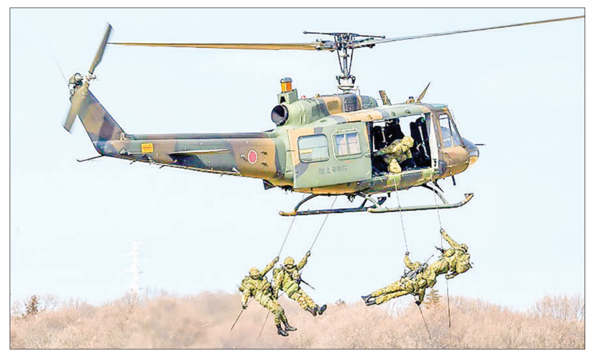
Many join the armed forces hoping to help during natural disasters, but are dismayed to find themselves doing military tasks.

In July, experts warned that there is an extremely high risk of the military becoming weaker due to not having enough personnel.