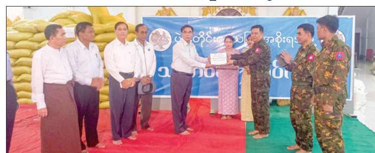
The Bago Region chief minister receives 100 rice sacks donated by the Eastern Command for flood victims in Bago.

Bago Region and the regional government relocated 27,302 vulnerable flood victims to 47 temporary shelters as of the evening of 10 October by providing accommodation, health care service and food supply.