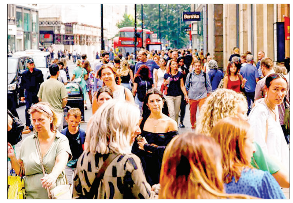
At 6.7 per cent, annual inflation in Britain remains the highest in the G7, after energy and food prices surged.

"We are writing to ask you to take action to support our colleagues who continue to face unacceptable levels of violence and abuse, amid a rise in theft, much of it organized crime, and