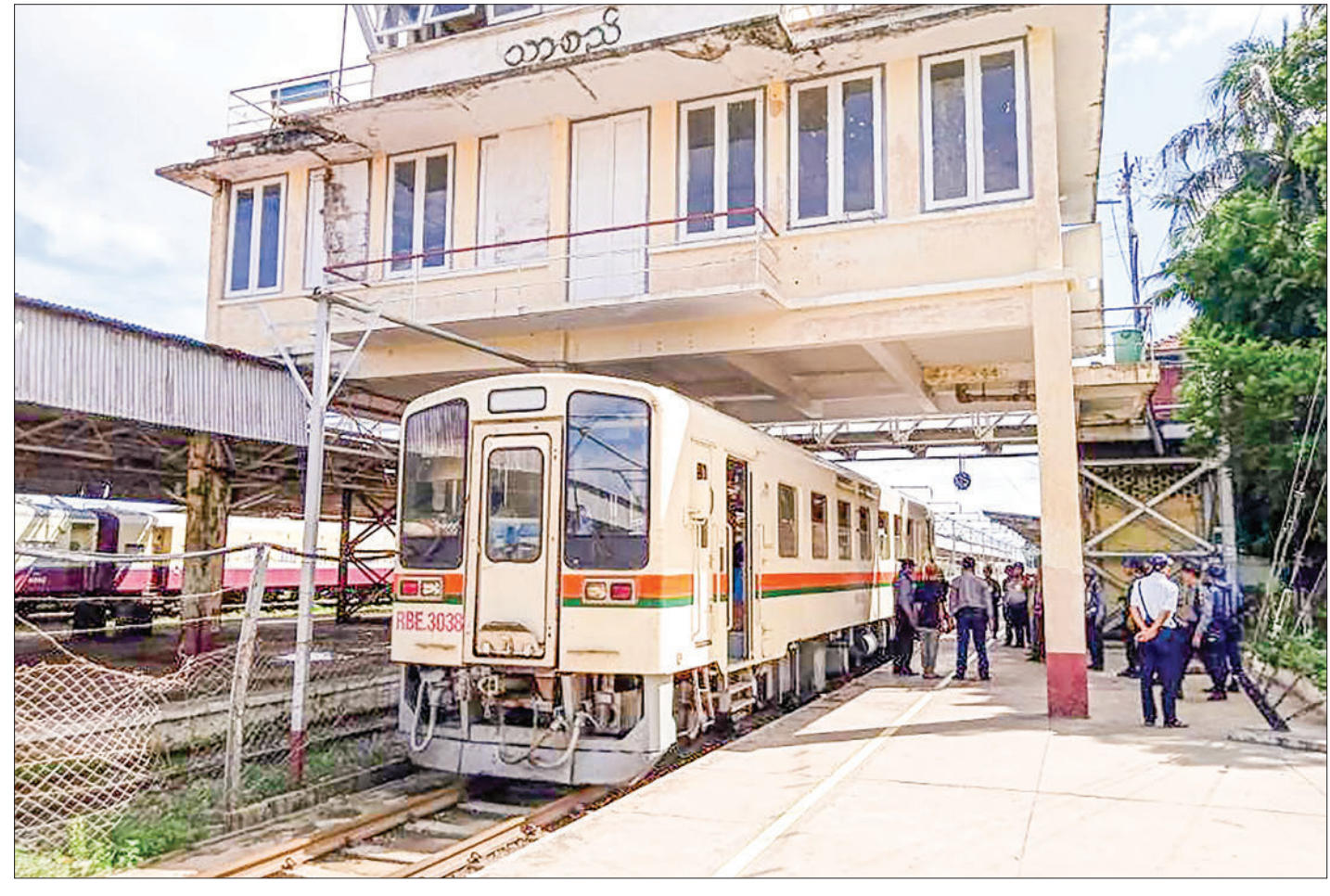
RBE trains stand ready at Thazi Station for temporary operation on the Mandalay-Thazi rail. PHOTO: MAUNG AYE CHAN

The public will be notified of the resumption of the trip after the post-flood necessary preparations. — Maung Aye Chan/KK