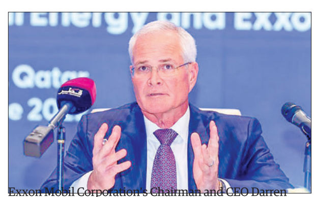
Woods unveiled a takeover of Pioneer Natural Resources for about $60 billion in the petroleum giant's biggest deal since the late 1990s merger between Exxon and Mobil.

Under the all-stock transaction, ExxonMobil will buy Texas-based Pioneer for $59.5 billion based on ExxonMobil's closing price on 5 October. The overall transaction, including debt, is valued at around $64.5