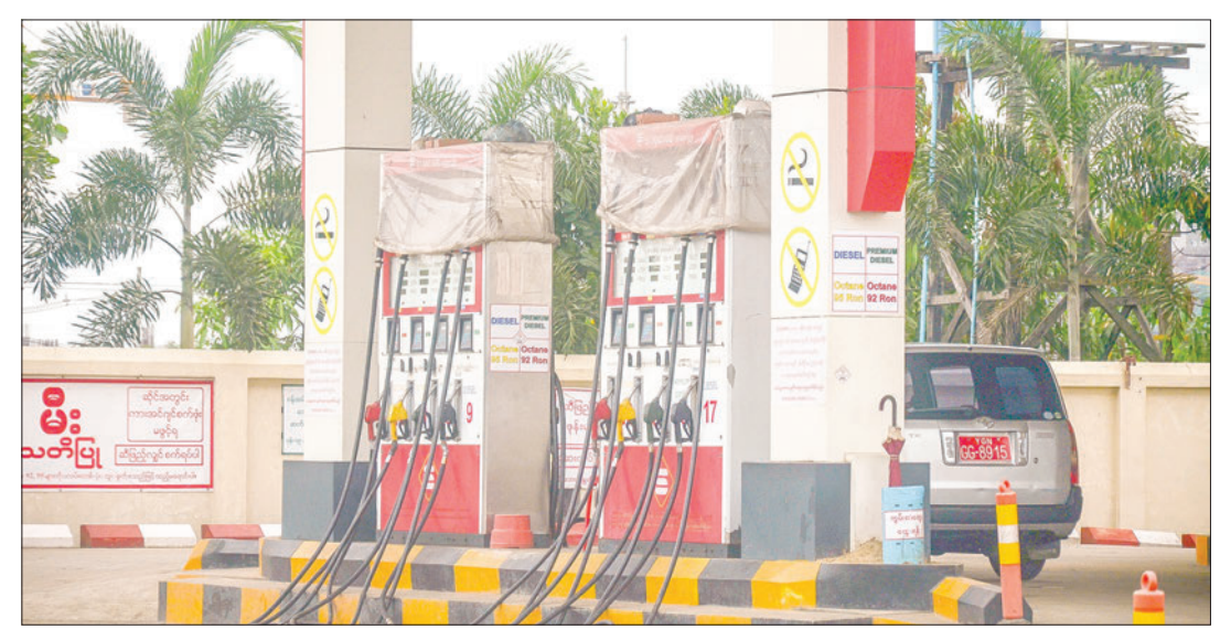
The Octane 92 price was below K2,000 per litre from 5 October. The prices gained to K2,015 per litre of Octane 92, K2,115 for Octane 95, K2,310 for diesel and K2,350 for premium diesel on 10 October. The picture shows the petrol station in Yangon.

OCTANE 92 price bounced back to K2,015 per litre in the domestic market on 10 October after a five-day fall.