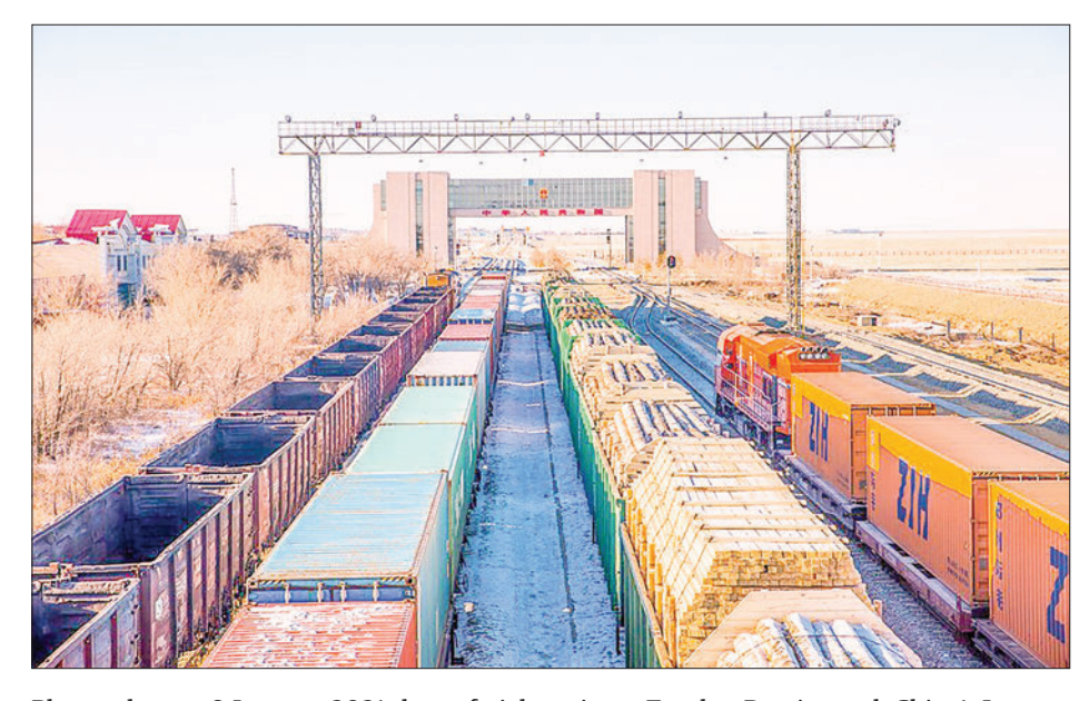
Photo taken on 8 January 2021 shows freight trains at Erenhot Port in north China's Inner Mongolia Autonomous Region.

Erenhot Port is the largest land port between China and Mongolia. Currently, 69 China-Europe freight train routes run through the port, mainly exporting products with high added value such as new energy vehicles, machinery and household appliances. — Xinhua