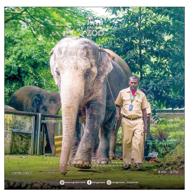
The picture captures Momo, the well-known elephant of the Yangon Zoo, and his mahout.

Every year, Momo the elephant's birthday is celebrated, and last year's celebration included fairs and festivals, along with fun game programmes for children.