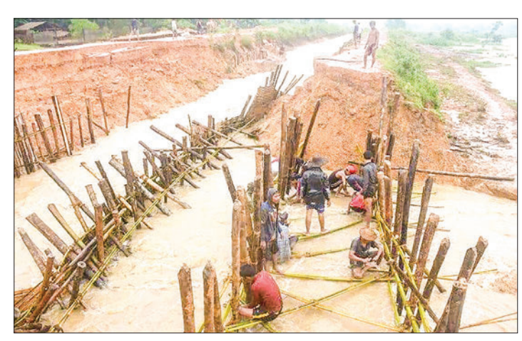
The water is overflowing at the Kalihtaw canal near Innkantlant Village, east of Kyarinn Village.

DUE to heavy rains on 7 October, the main canal of Kalihtaw Dam in Hlegu Township suffered a breach, and about 40 acres of agricultural land and homes from nearby villages, including the Kyarinn (East) Village, were flooded.