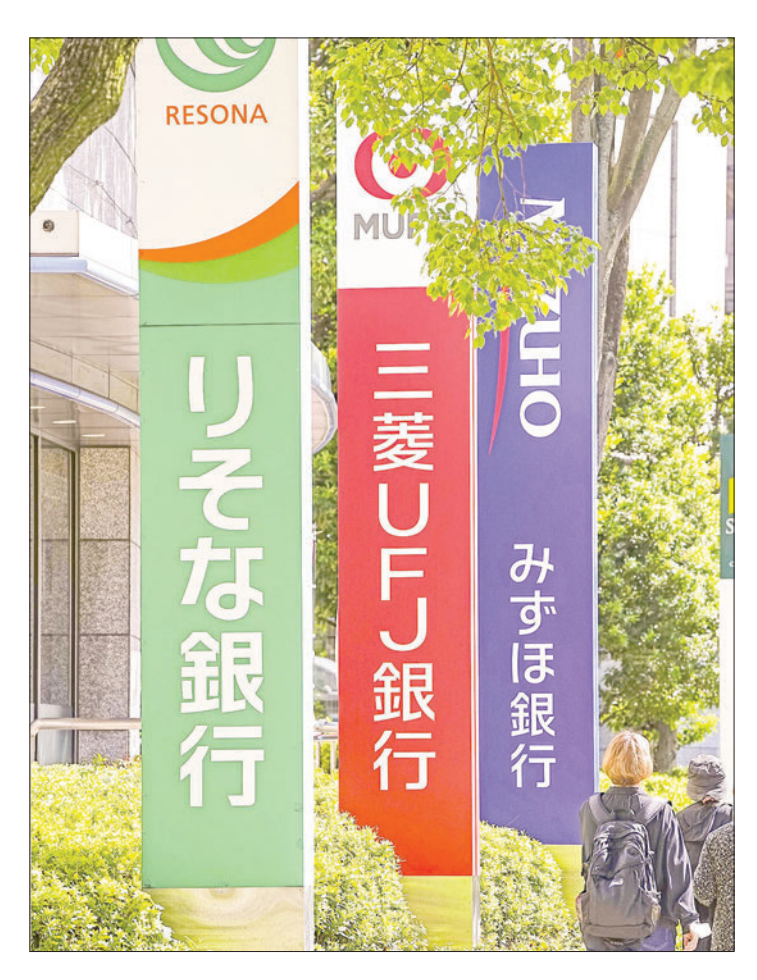
Photo taken on 10 October 2023 shows signs of (from L) Resona Bank, MUFG Bank and Mizuho Bank in Tokyo.

However, the report also noted that "growth remains slow and uneven, with growing global divergences". — AFP