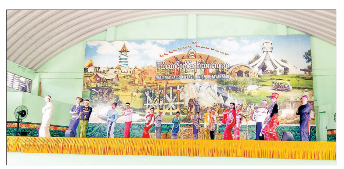
File photo shows that some ethnic troupes perform at the entertainment programme at the Union National Races Village (Yangon) in Thakayta Township, Yangon.