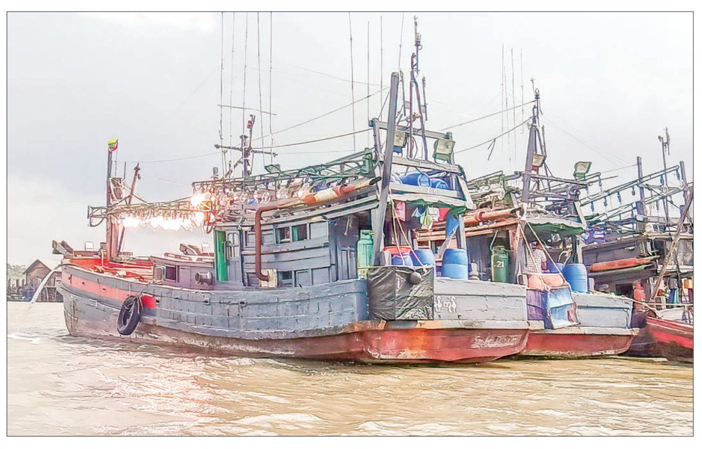
Squid fishing boats prepared for business in the upcoming open season, in Myeik, Taninthayi Region.