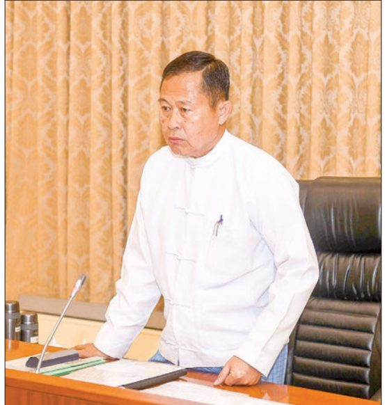
State Administration Council Vice-Chair Deputy Premier Vice-Senior General Soe Win addresses the first coordination meeting of the 76<sup>th</sup> Anniversary of Independence Day Organizing Central Committee yesterday.

ty — dubbed as the national interests and national politics, to enhance the comprehensive education sector which can turn out well-versed human resources in building the Union based on modern, developed democratic system and federalism, to make efforts for holding a free and fair