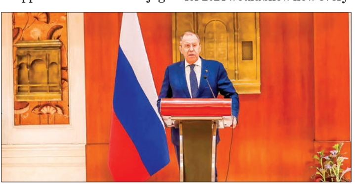
In this handout photo released by the Russian Foreign Ministry, Russian Foreign Minister Sergey Lavrov talks to the media after the G20 Foreign Ministers' Meeting (G20 FMM), in New Delhi, India. PHOTO: SPUTNIK

Only if international law is observed, "will humanity have a chance to overcome the harmful legacy of the unipolar era," the Russian foreign minister stated, adding that preparations for the UN Summit of the Future planned for 2024 would show how every-