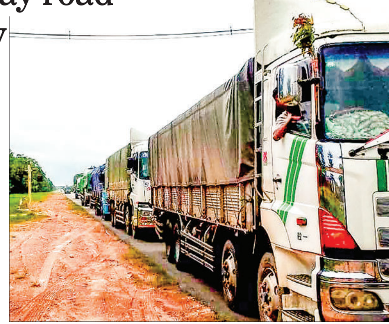
This photo shows a queue of trucks loaded with perishable goods stranded on the former Yangon-Mandalay Road.

Currently, floods have occurred due to the rise of the Bago River, and large trucks and small cars have been parked on the former Yangon-Mandalay Road (39 miles) Phayagyi Road to DaikU Road intersection. — ASH/KZL