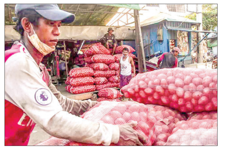
The photo shows a worker unloading onion sacks from a hand-driven cart at a warehouse in the Bayintnaung area.

tatoes rose to K23,000 per viss on 9 October from K2,000 on 7 October. Similarly, a decrease in onion supply also drove the prices up, Ko Aung, a trader from Nyaungpinlay market who daily buys onions and potatoes at Bayintnaung market, told the Global New Light of Myanmar.