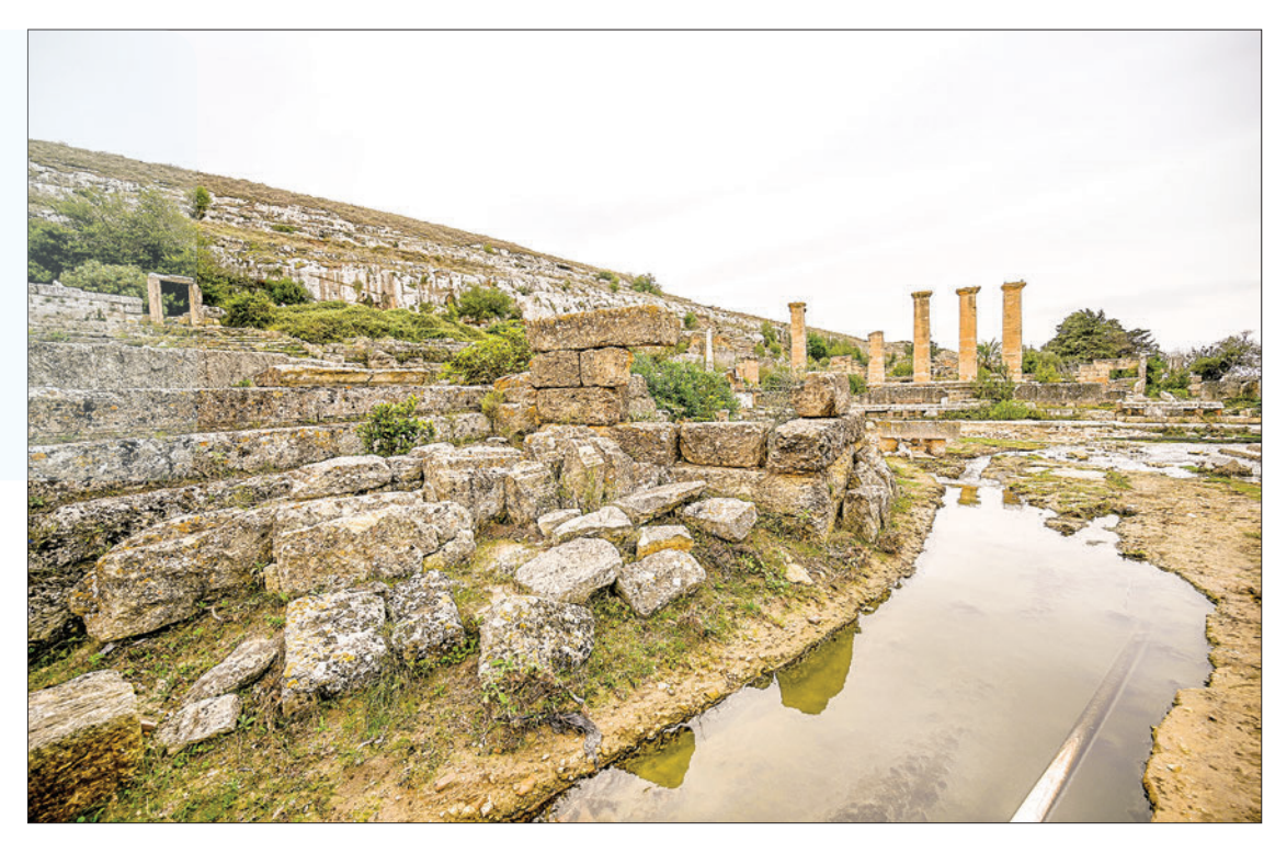
Water flows through the ruins at the site of the ancient Greco-Roman city of Cyrene (Shahhat) in eastern Libya, about 60 kilometres (37 miles) west of Derna on 21 September 2023 in the aftermath of a devastating flood. The immediate damage to the monuments of Cyrene, which include the second century AD Temple of Zeus, bigger than the Parthenon in Athens, is relatively minor but the water circulating around their foundations threatens future collapses, the head of the French archaeological mission in Libya, Vincent Michel, told AFP.

Storm Daniel caused serious damage and created a high risk of collapse in Cyrene, one of the five cities of the Hellenic period which gave its name to Libya's eastern