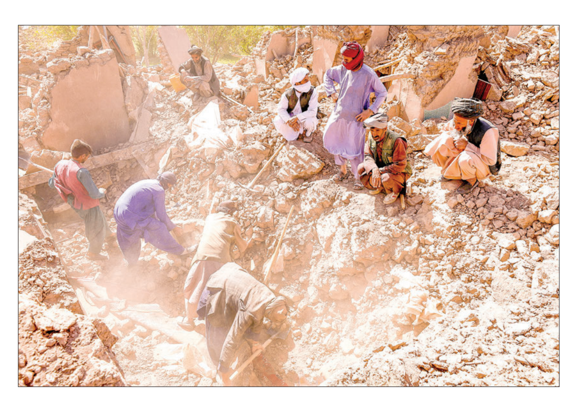
Afghan residents clear debris as they look for victims' bodies in the rubble of damaged houses after the earthquakes in Kashkak village, Zendeh Jan district of Herat province on 8 October 2023.