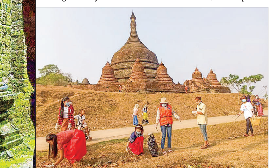
Some buddha images in MraukU cultural area are seen (left photo) and volunteers collect garbage in the MraukU cultural area in Rakhine State (right photo).

Some of the ancient buildings in the MraukU cultural area that were damaged by the Mocha storm have been restored changing original designs. Most of them were minor damage, so they were repaired with funds approved for the current financial year. — ASH/KZL