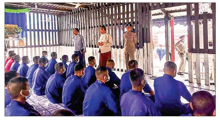
Commissioner U Kyaw Soe from the Myanmar National Human Rights Commission meets prisoners and detainees in the Maubin Prison in Maubin Township, Ayeyawady Region during his inspection tour on 10 October 2023.

Besides, MNHRC donated 50 books for the prisoners. MNHRC will send recommendations to relevant departments for the necessary action based on the findings during the inspection. — MNHRC