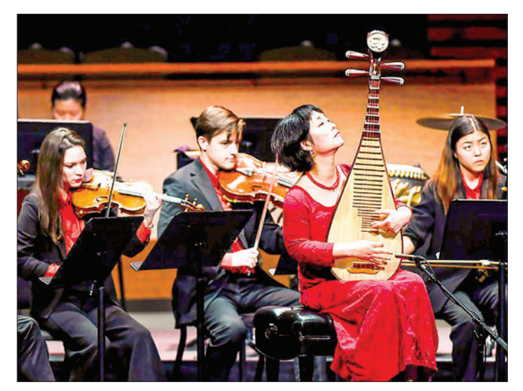
Prominent pipa virtuoso Wu Man (R, Front) performs with members of the Bard East/West Ensemble during the opening concert of the sixth annual China Now Music Festival at Rose Theater at Jazz at Lincoln Centre in New York, the United States, on 4 October 2023.

THE sixth season of the China Now Music Festival culminated in a grand finale on Sunday in a spellbinding concert at Jazz at Lincoln Centre in New York City, paying homage to three generations of composers bridging the United States