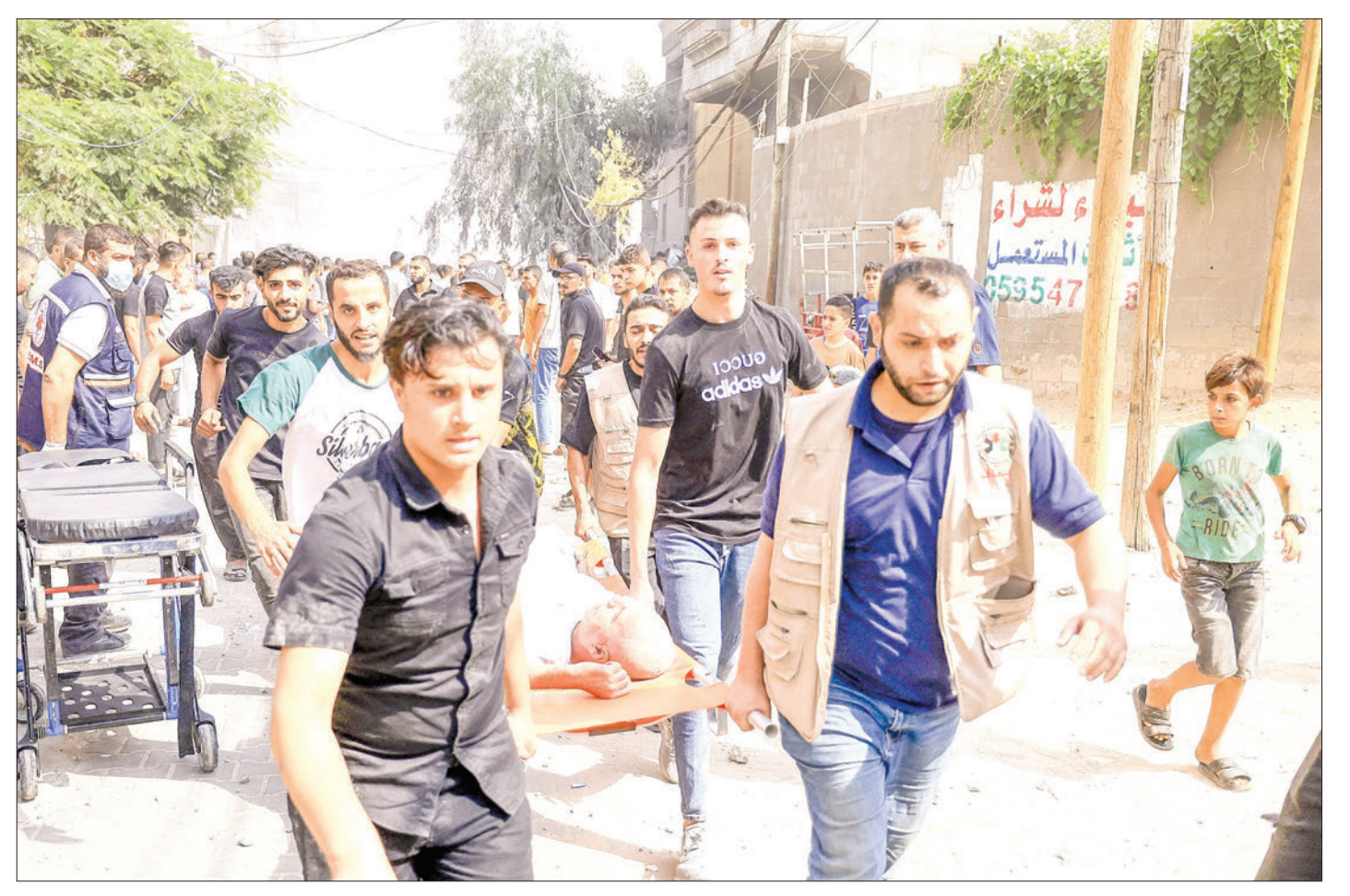
Palestinians evacuate a wounded man following an Israeli airstrike on the Sousi mosque in Gaza City on 9 October 2023.

HE World Health Organization called Tuesday for a humanitarian corridor to be established into and out of the Gaza Strip, which has been placed under total siege by Israel.