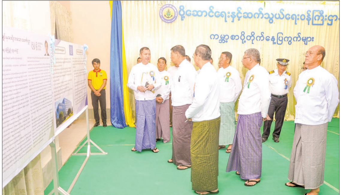
SAC Member Deputy Prime Minister Union Minister for Transport and Communications General Mya Tun Oo views the display marking the 149 th World Post Day yesterday.

Next, the Union minister presented awards to winners of the 52 nd international letter-writing competition for youth (local level, under 15). After the prize-giving ceremony, the Union minister had a documentary photo taken together with Union Minister for Commerce U Tun Ohn, deputy ministers, officials and winners. — MNA/KTZH