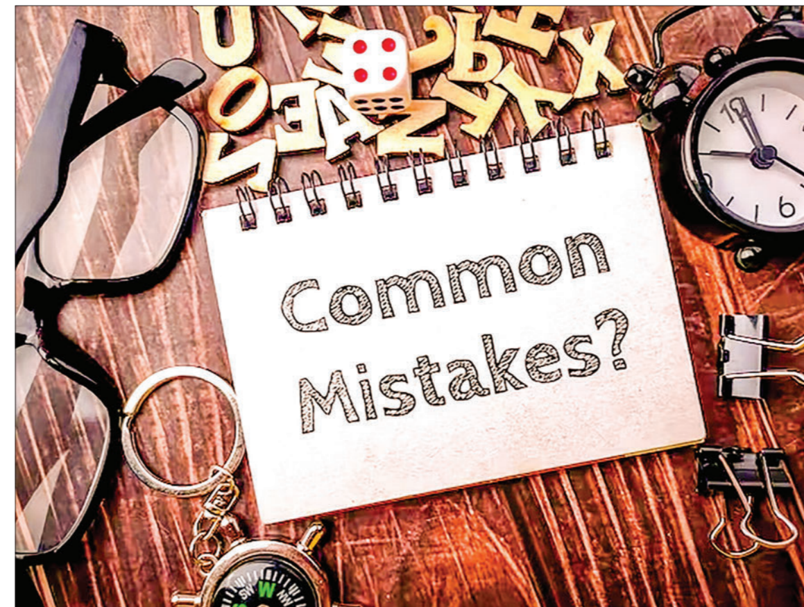
English is noted as an international language that is learned by many non-native speakers worldwide. It emphasizes the diversity of teaching materials and the possibility of self-study.

The following list includes the words which most often give trouble.