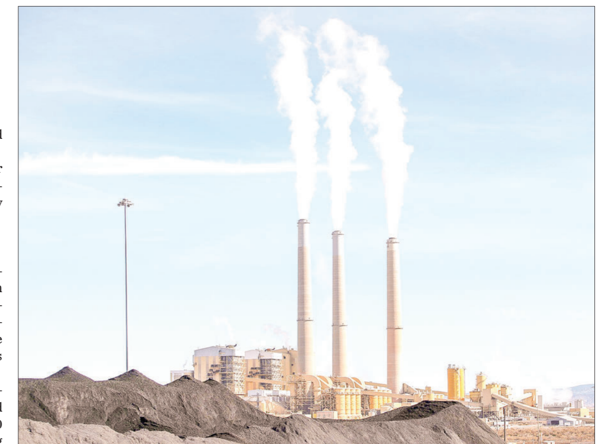
During the COP26 climate conference in Glasgow in 2021, countries reached an agreement to phase down "unabated coal."