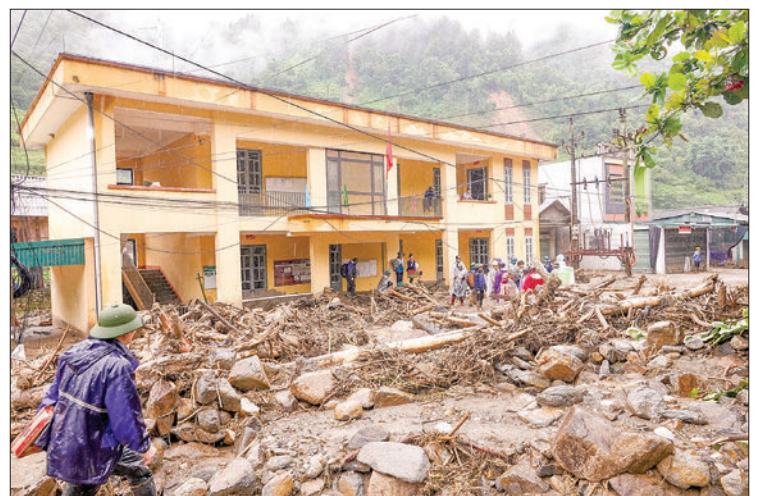
Residents remove debris after heavy rains caused flash floods and landslides in Mu Cang Chai district, Yen Bai province on 7 August 2023. PHOTO: AFP

To prove it, he has teamed up with a brewery to create Epic OneWater Brew, a drink inspired by German Kolsch beers. — AFP