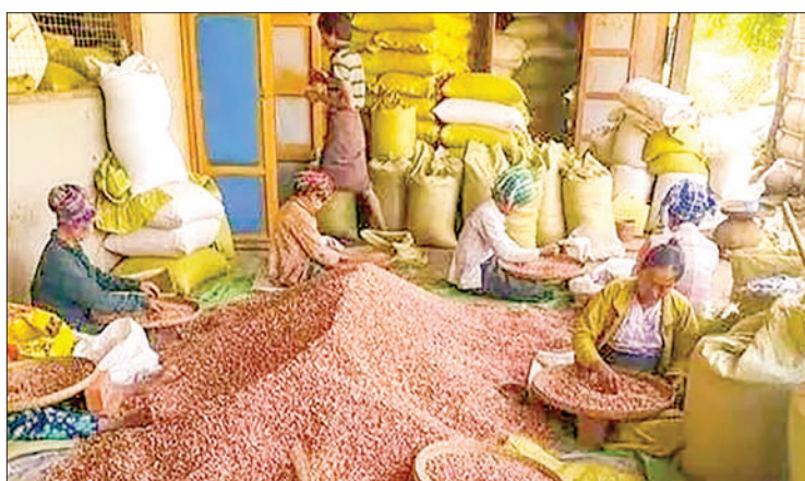
Workers are sorting pigeon peas at a depot in Monywa.

In the same period last year, the export price of pigeon peas was only $835–855 per tonne. On 9 October of this year, the price increased by $515 compared to the same period last year, which is a half of the previous year's price (61 per cent). However, the domestic price of a tonne of pigeon peas in the Yangon market is more than double that of the same period last year. On 7 and 11 October of last year, the price