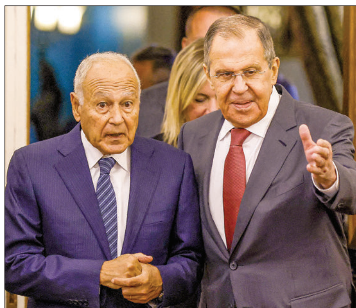
Russian Foreign Minister Sergey Lavrov (R) welcomes Arab League Secretary-General Ahmed Aboul Gheit during their meeting in Moscow on 9 October 2023.

Lavrov also said that Russia is ready to evacuate its citizens from the conflict region. — Sputnik