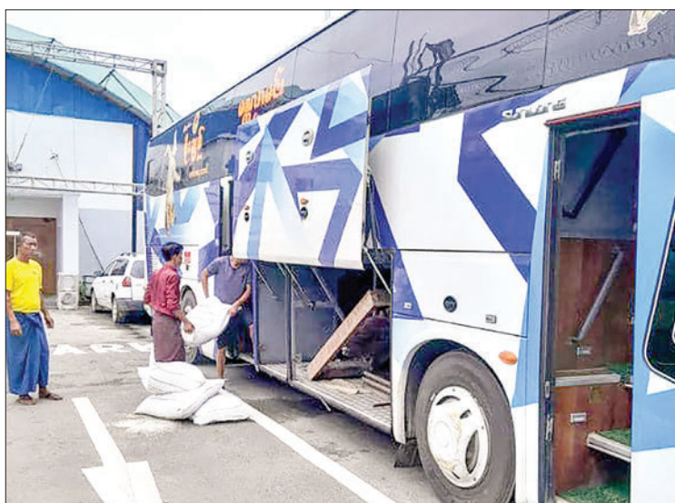
Relief donations of food and household items are loaded onto the vehicle yesterday.

Currently, due to the increasing number of travellers, the Shwedagon Pagoda is open from 5 am to 8 pm. — ASH/KZW