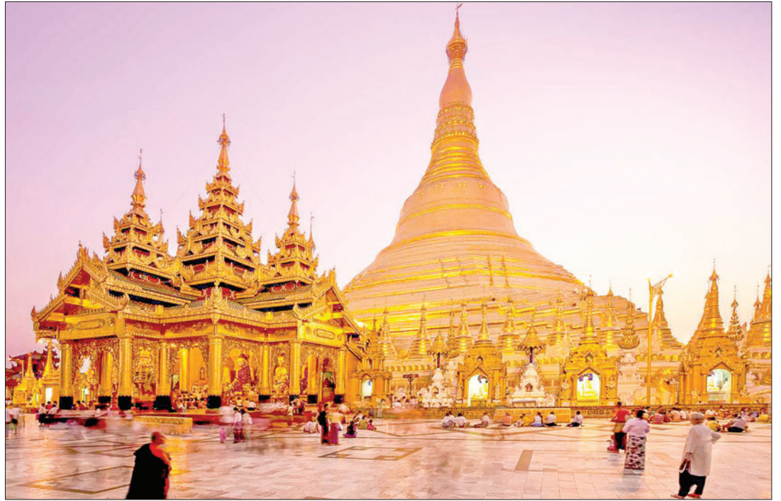
Serenity and tranquility reign at Shwedagon Pagoda as pilgrims gather on its sacred platform.

THE Chairman of the State Administration Council, Prime Minister of the Republic of the Union of Myanmar has appointed U Tin Maung Swe, Ambassador Extraordinary and Plenipotentiary of the Republic of the Union of Myanmar to the People's Republic of China, concurrently as Ambassador Extraordinary and Plenipotentiary of the Republic of the Union of Myanmar to Mongolia. — MNA