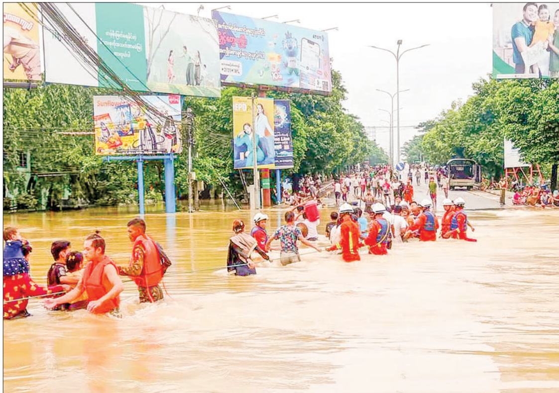
The photo shows the river overflowing Bago township and the relief task forces carrying out the evacuation operations.

With the rising of the river, water is entering residences and inundating the roads as the road segments are collapsed by inundation detour of Bago township