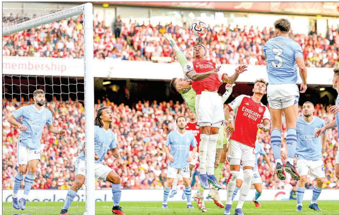
Manchester City's Brazilian goalkeeper (31) Ederson tries to clear the ball under pressure from Arsenal's Brazilian defender (06) Gabriel Magalhaes during the English Premier League football match between Arsenal and Manchester City at the Emirates Stadium in London on 8 October 2023.

GABRIEL Martinelli says Arsenal's inherent belief will be boosted by beating champions Manchester City as Mikel Arteta's men seek to go one step further than last season.