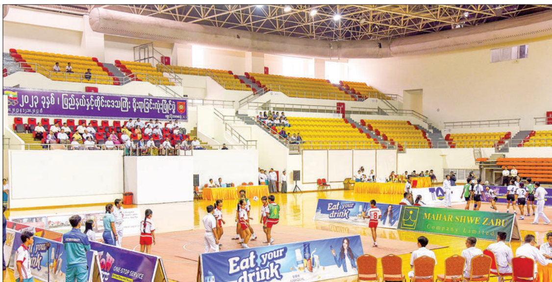
The opening matches of the 2023 Inter-Region/State Traditional Chinlone Competition in action yesterday in Nay Pyi Taw.

THE opening ceremony of the 2023 Inter-Region/State Traditional Chinlone Competition was held at Wunna Theikdi Gymnasium A in Nay Pyi Taw yesterday, attended by State Administration Council Members Daw Dwe Bu, Porel Aung Thein, Dr Hmu Thang, Dr Ba Shwe, Khun San Lwin, U Shwe Kyein and U Yan Kyaw, Union ministers, deputy ministers, and officials among others.