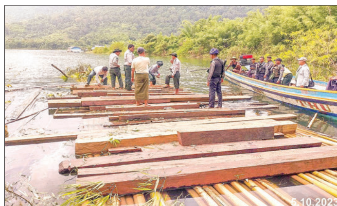
Officials inspect the illegal items.

As a result, a total of 19 arrests were made on 7 and 8 October, with an estimated value of K889,681,996, as reported by the Illegal Trade Eradication Steering Committee. — MNA/MKKS