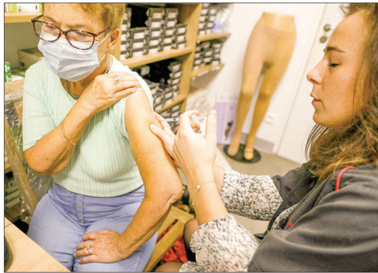
A woman receives a dose of Comirnaty Omicron XBB 1.5 Pfizer vaccine for COVID-19 at a pharmacy in Ajaccio, on 5 October 2023, during a new COVID-19 vaccination campaign on the French Mediterranean island of Corsica.

The call comes as the number of COVID-19 deaths and people admitted to intensive care units continues to fall significantly compared to the peak of the pandemic, according to the press release, but "hospital admissions are beginning to creep up again in some WHO Europe member