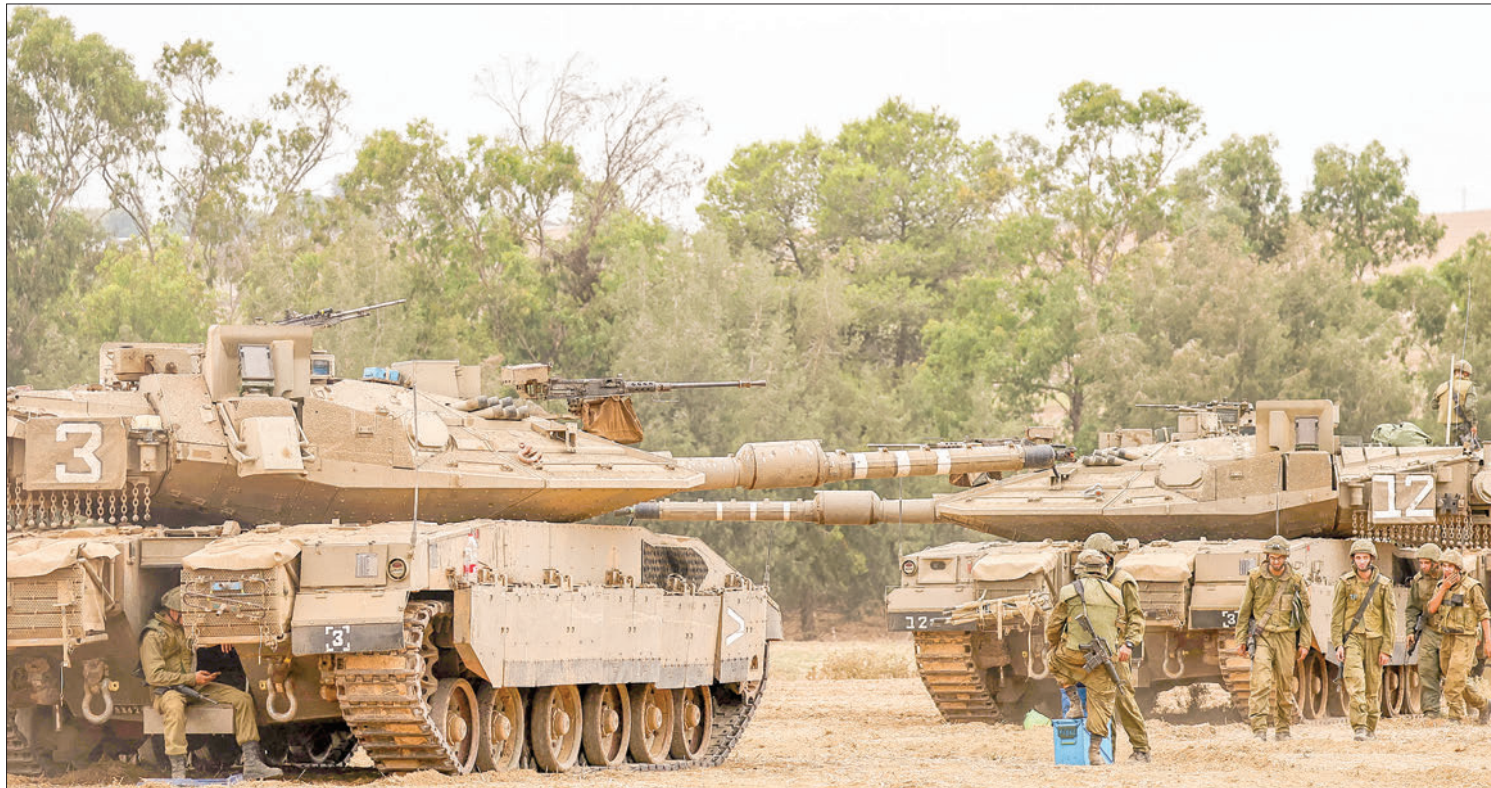
Israeli army soldiers are positioned with their Merkava tanks near the border with the Gaza Strip in southern Israel on 9 October 2023.