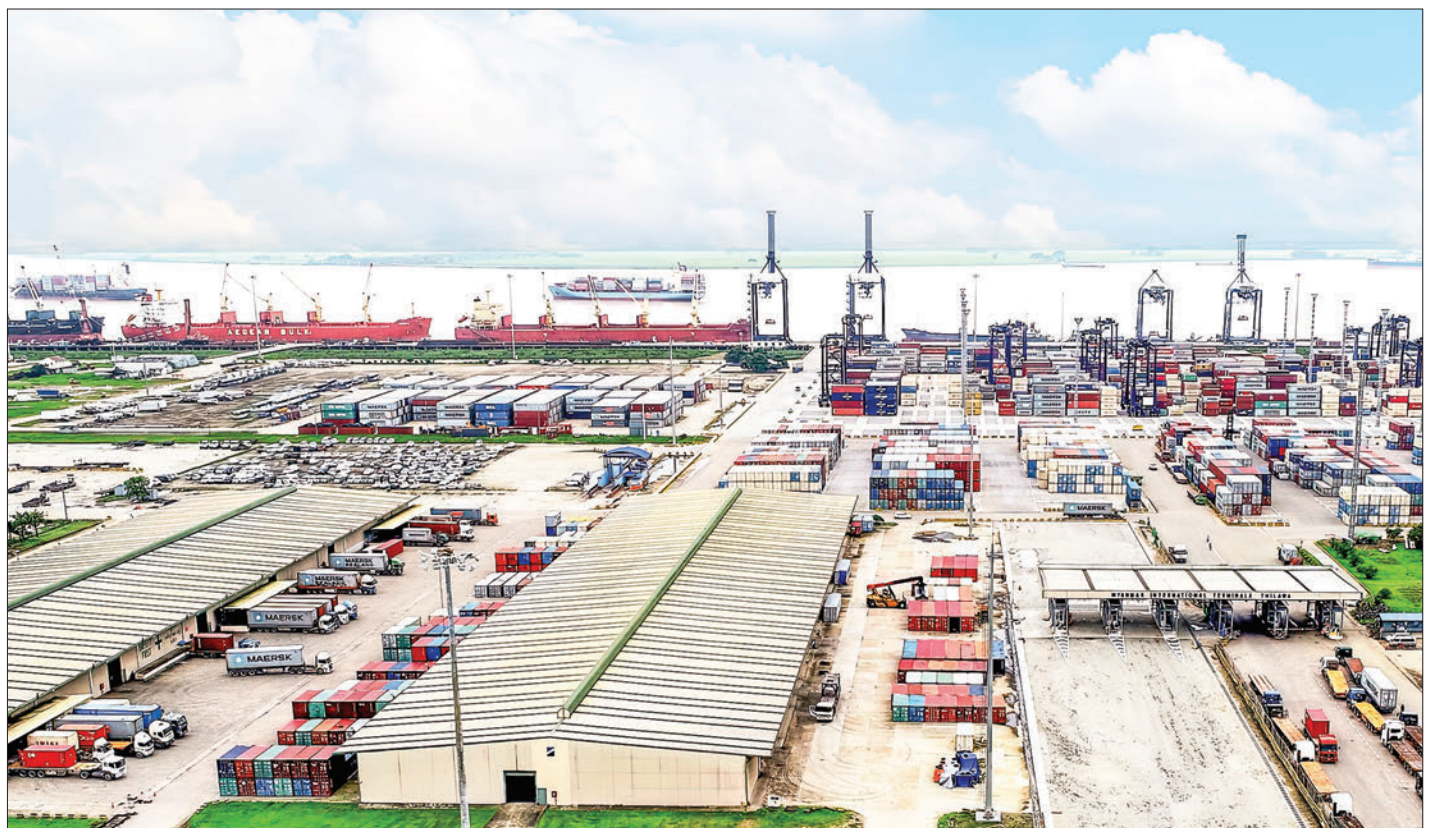
The panoramic view of the Yangon Port's container yard and terminal cranes on the Yangon River.

Commerce Ministry paving way for exporters with special privileges