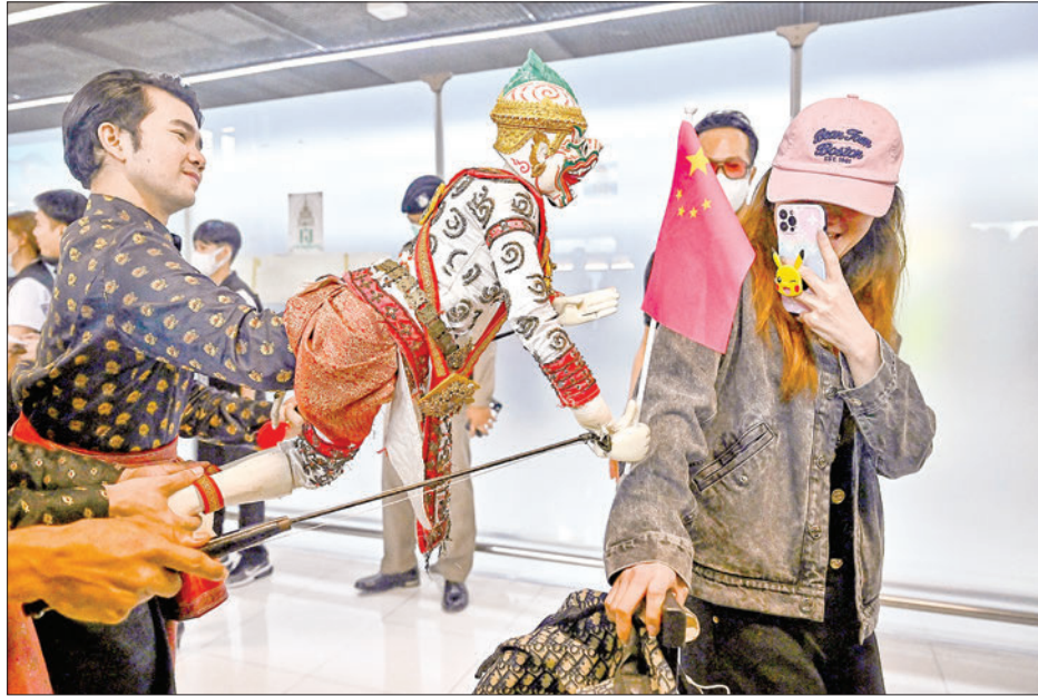
Chinese tourists are greeted by Thai dancers at the arrivals gate at Suvarnabhumi International Airport in Bangkok on 25 September 2023.

The September figure was mainly attributed to lower living costs as a result of the government's energy and gasoline price cuts and increased domestic consumption on the back of tourism recovery