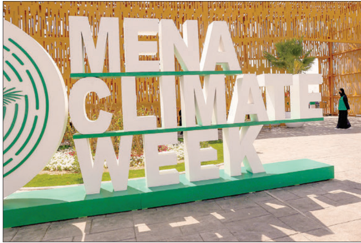
A woman walks past the entrance of the convention centre before the opening session of the Middle East and North Africa (MENA) Climate Week, a UN-organized conference hosted in the Saudi capital Riyadh, on 8 October 2023.

The initiative was announced at the Middle East and