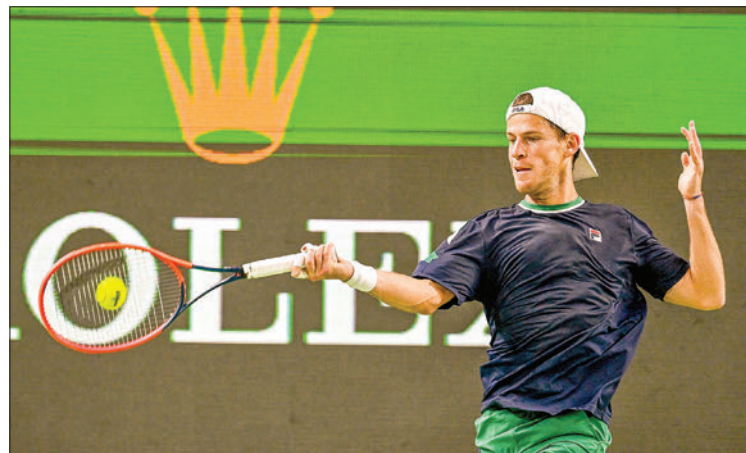
Diego Schwartzman of Argentina hits a return to Taylor Fritz of the US during their men's singles match at the Shanghai Masters tennis tournament in Shanghai on 9 October 2023.

When he hit the ball into the net to seal his defeat, Schwartzman threw both arms in the air and screamed for joy. — AFP