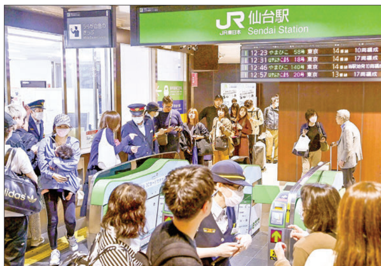
The photo shows JR Sendai Station in Sendai, Miyagi Prefecture, after a suspected chemical leak in a Tohoku Shinkansen Line bullet train on 9 October 2023.

As he headed with his bag to the deck, a five-year-old boy