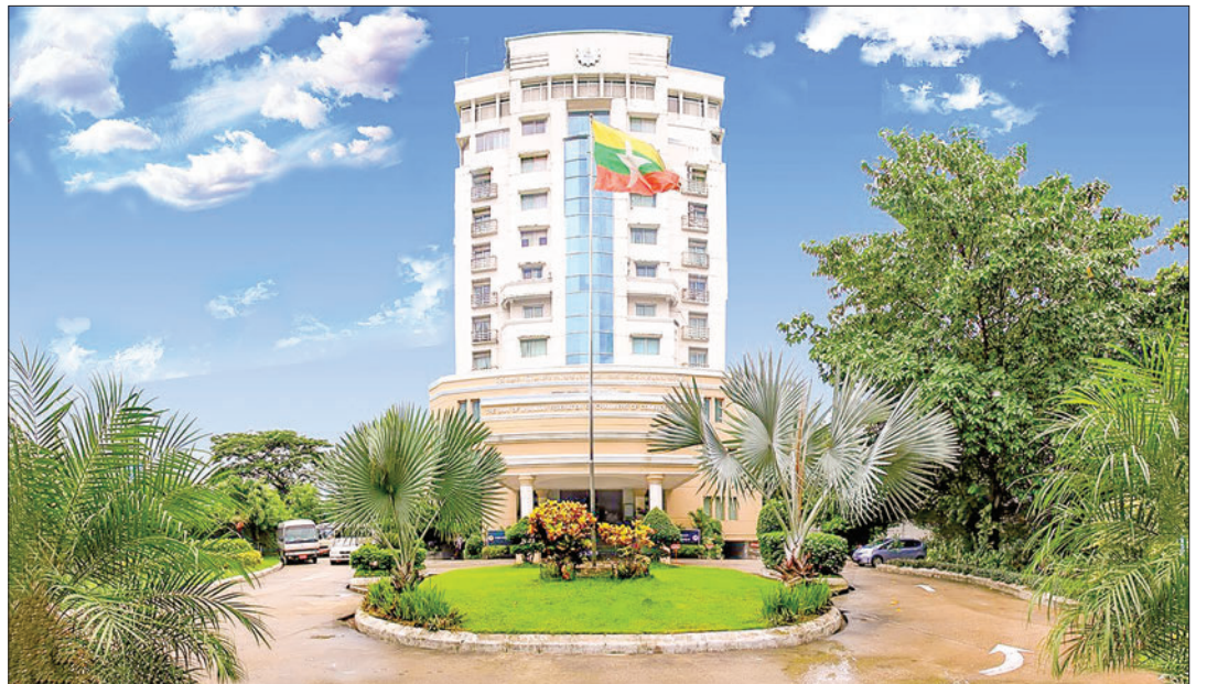
The general view of the office building of UMFCCI.