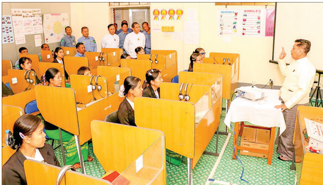
Union Minister Lt-Gen Tun Tun Naung observes the English proficiency course for staff members yesterday in Nay Pyi Taw.

The Union minister emphasized the significance of the English Proficient Progress