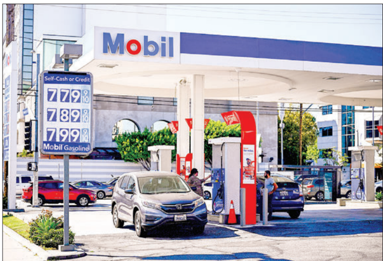
A customer uses a credit card to pump gas as a sign shows gasoline fuel prices above average at over seven and approaching eight dollars a gallon at a Mobil gas station in Los Angeles, California, on 5 October 2023. PHOTO: AFP

Meanwhile, it sees oil demand in the OECD club of advanced economies declining from 2025. In order to meet this demand OPEC says additional investment in fossil fuel production will be needed, putting the figure at $14 trillion by 2045, or roughly $610 billion per year. — AFP