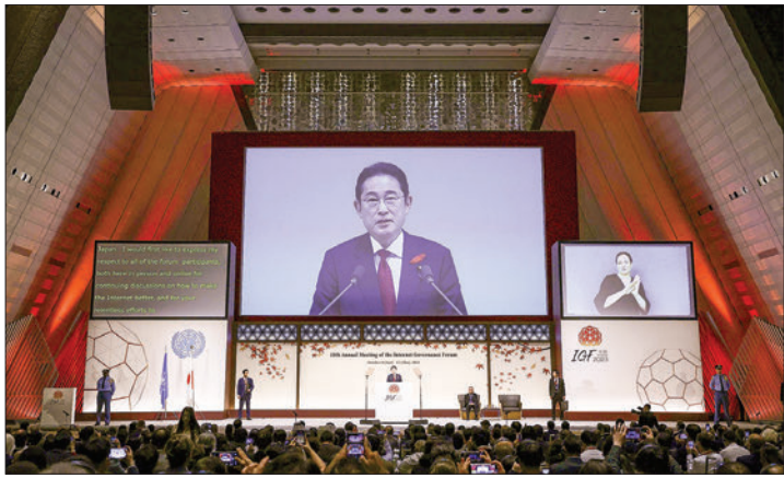
Japanese Prime Minister Fumio Kishida addresses the UN-hosted Internet Governance Forum in Kyoto, western Japan, on 9 October 2023.

PRIME Minister Fumio Kishida pledged on Monday that a part of an upcoming economic package, to be drawn up possibly by the end of the month, will include measures to boost the development of artificial intelligence.