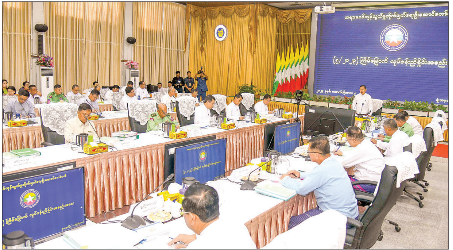
State Administration Council Vice-Chair Deputy Prime Minister Vice-Senior General Soe Win chairs the coordination meeting 5/2023 of the Steering Committee on Illegal Trade Eradication yesterday in Nay Pyi Taw.

The Vice-Senior General underlined that relevant ministries need to arrange a stick-