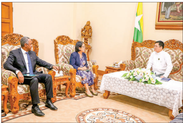
The UNHCR Resident Representative calls on Union Minister U Myint Kyaing yesterday.

UNION Minister for Immigration and Population U Myint Kyaing received United Nations High Commissioner for Refugees (UNHCR) Resident Representative to Myanmar Ms Noriko Takagi in Nay Pyi Taw yesterday.