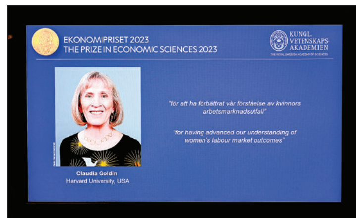
The winner of the 2023 Prize in Economic Sciences in Memory of Alfred Nobel American economist Claudia Goldin is seen on a display during a press conference at the Royal Swedish Academy of Sciences in Stockholm, Sweden, on 9 October 2023.

Last year, the honour went to US economists Douglas Diamond and Philip Dybvig together with former Federal Reserve chief Ben Bernanke for research on banks in times