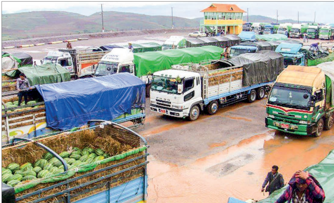
Export cargo-laden lorries queue up at Myanmar-China land border crossing.

Lorry drivers are granted direct access with temporary border passes at Kyinsankyawt crossing.