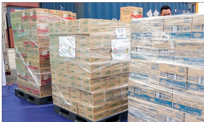
The picture depicts the arrival of foodstuffs at Asia World Port Terminal on 5 October.

The Yangon Region government will arrange the transportation of food to Rakhine storm victims and the Rakhine State government will organize food donation events. Over 416 tonnes of rehabilitation items including construction materials, electronic devices, medications and health equipment, consumer goods and foodstuffs provided by the government and international countries were transported to Rakhine State by 96 flights and about 50,000 tonnes by 35 voyages of vessels. — ASH/KTZH