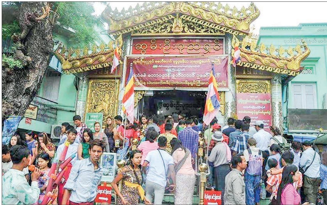
Devotees are seen at the SoonU Ponnyashin Pagoda.