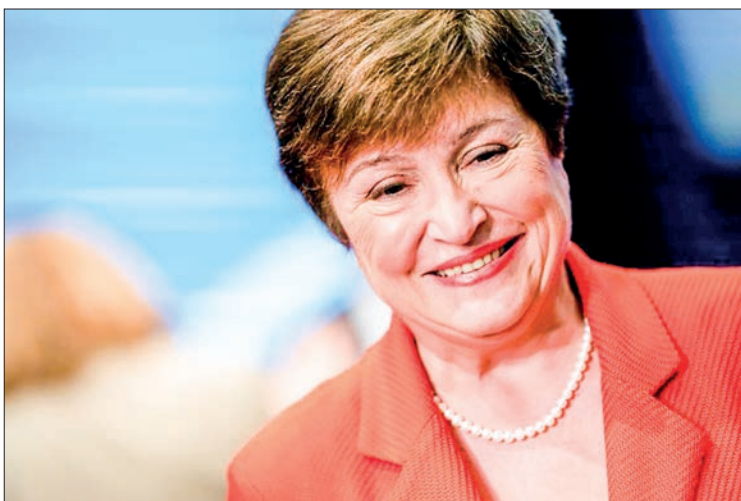
The IMF and World Bank's annual meetings take place in Marrakesh next week.

THE World Bank and International Monetary Fund will tackle the thorny issue of institutional reform at their upcoming annual meetings in Morocco next week.