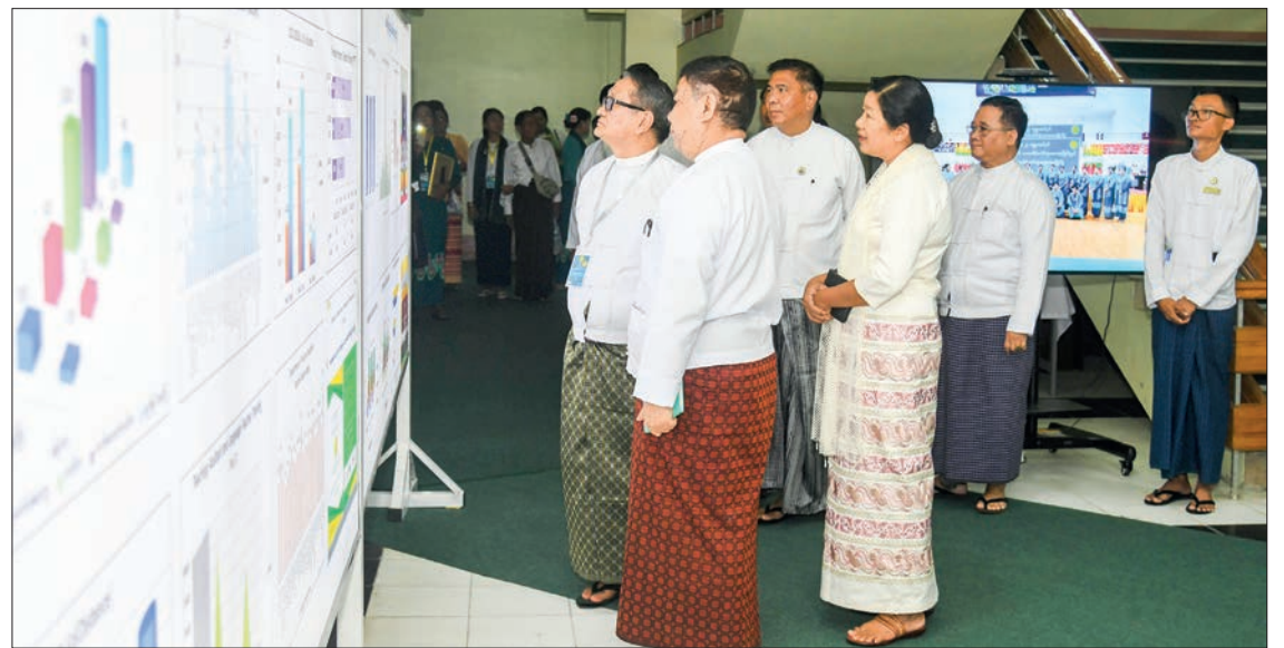
SAC Members, Union Ministers and party view the display at the event yesterday.

A ceremony to mark the World Teachers' Day took place at the Ministry of Education yesterday morning.