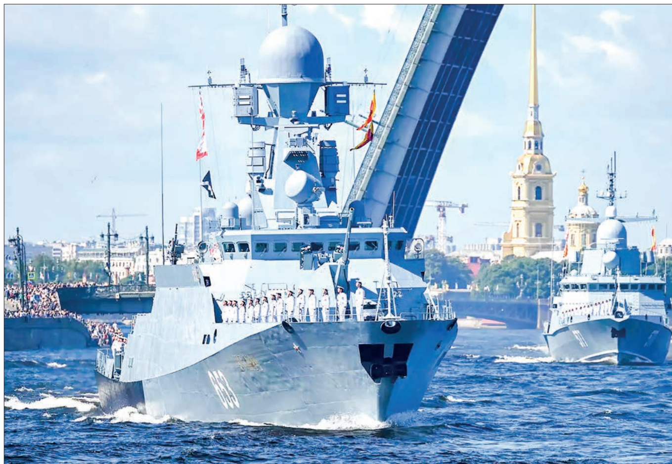
Forty-five ships, submarines and other vessels took part in Russia's annual Navy Day event, a traditional show of military might which takes place in the Gulf of Finland and on the River Neva in St Petersburg on 30 July.