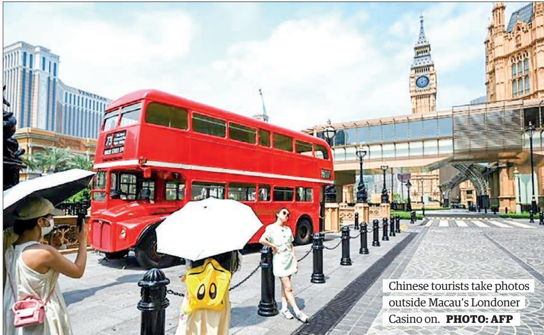
Chinese tourists take photos outside Macau's Londoner Casino on. PHOTO: AFP

A state-backed tourism think tank predicted that Chinese tourists would make more than 100 million daily trips during this annual national holiday, making it the busiest Golden Week ever.