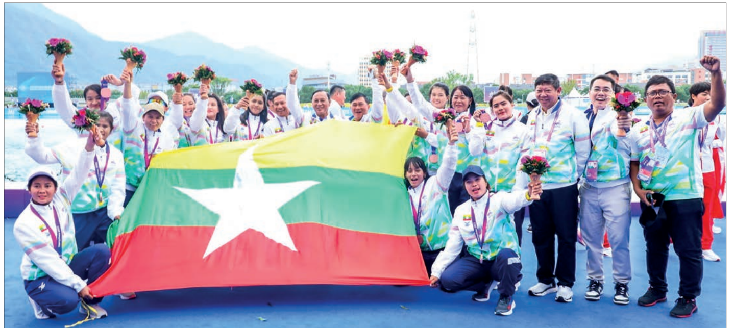
Myanmar women's Sepak Takraw team is seen holding the bronze medals at the XIX Asian Games.

North Korean weightlifters have so far won six golds, five silvers and two bronze on their return to international competition after almost four years away. They have also set six world records in Hangzhou, prompting some competitors to remark that they were "shocked" at the performances after a long absence because of Covid.