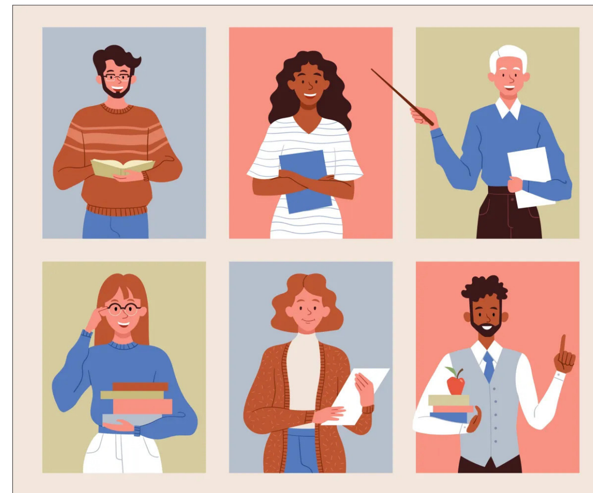
Teacher performance appraisal is crucial for improving teachers' skills at all levels of education and raising student achievement standards.

Before TPA, the qualities and qualifications of a teacher will need to be described, I think. The teacher's personal good attributes can bring about the educational product development, that is, qualified students. The teacher qualities include 1) enthusiasm and optimism – interest in work, alertness, humour, cheerfulness and affability, 2) initiative and resourcefulness – the ability to originate, adapt ideas and carry them out with the subject to teach, 3) interest in and sympathy with students – a sympathetic understanding and interest in pupils, extending beyond the subject to teach, 4) personal habits – being morally obliged to set a worthy example, 5) sincerity and integrity – being measured in terms of a teacher's