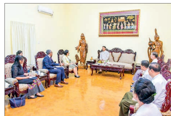
The UNHCR Representative calls on Union Minister Dr Soe Win yesterday in Nay Pyi Taw.

They openly talked about permits for travel of foreign employees in Myanmar, arrival visa measures, the need for UN agencies to coordinate with the ministry in releasing the data on those who need humanitarian aid and the number of displaced persons to conform with the ground situation, sharing of information, and further cooperation between them. — MNA/TTA