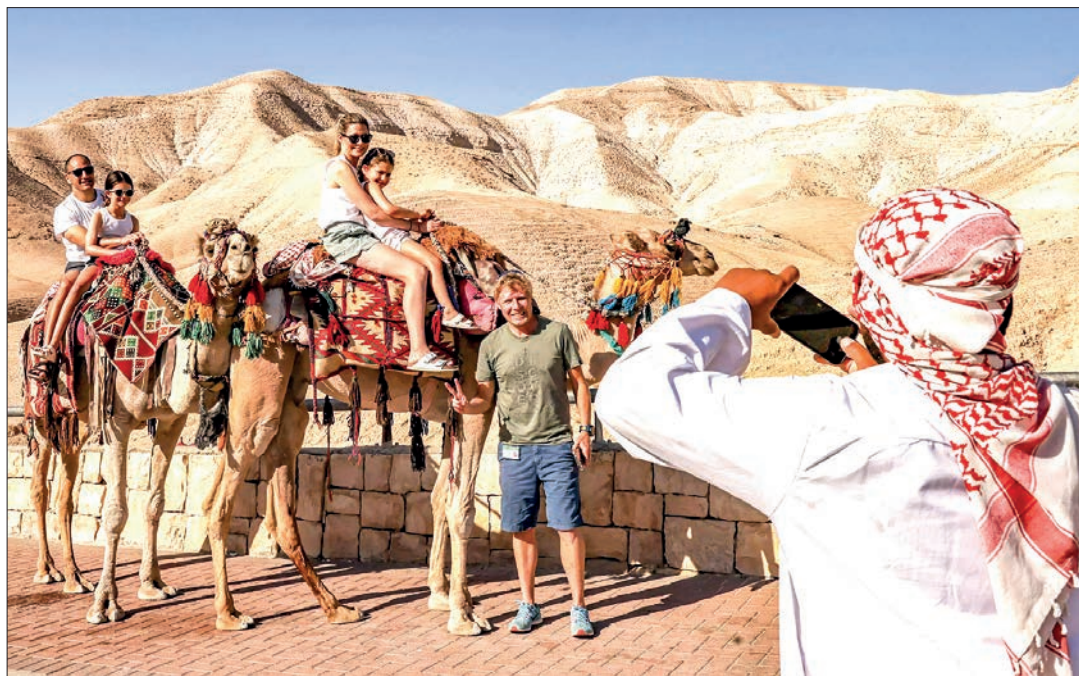
Tourists get their picture taken while riding camels near the sign marking mean sea level, along the road between Jerusalem and the Dead Sea south of Jericho.

IN the ancient city of Jericho in the occupied West Bank, a prehistoric site has raised Palestinian hopes of a tourism boom after UNESCO declared it a World Heritage site.