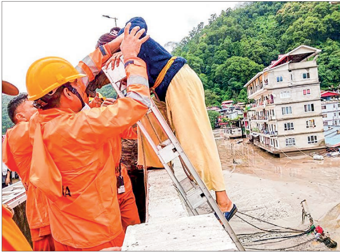
The disaster, which has affected the lives of 22,000 people, authorities said, is the latest in a series of deadly weather events in South Asia's mountains blamed on climate change.

Intense rainfall led to a Himalayan glacial lake overflowing in northeast India. Rescuers are facing challenges due to damaged bridges and swift rivers.