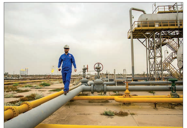
Crude prices have eased in more recent days, however, as markets worry over a slowing economy and interest rates remaining high for longer in the United States and Europe.

Both Riyadh and Moscow stressed that they would review their cuts next month to decide whether to deepen them or increase production. — AFP