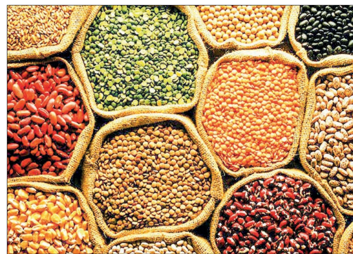
The photo shows pulses being organized for sale at the market.

The pigeon pea (tur) prices remain unchanged at K4.075 million per tonne from 29 September to 3 October 2023 owing to the low stocks. Black gram prices continued down-