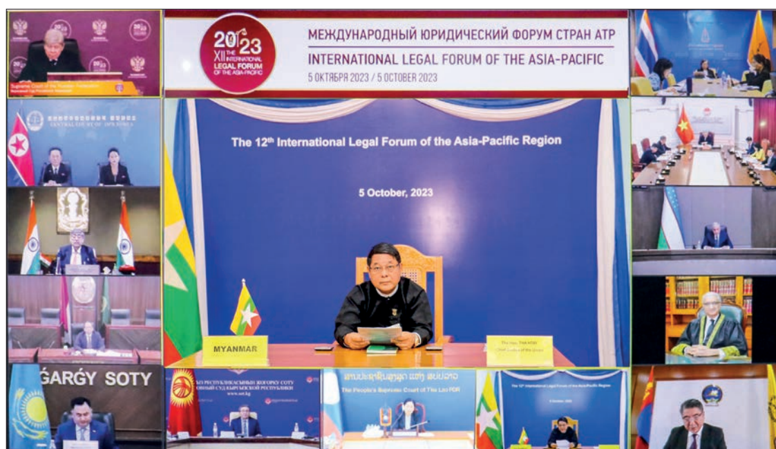
The 12 th International Legal Forum of the Asia-Pacific Region in progress online, joined by Union Chief Justice U Thar Htay yesterday alongside Chief Justices of APR countries.

framework for the economic development of businesses of investors in Myanmar. Myanmar Constitution guarantees that the Union shall protect and prevent acts that jeopardize public interests through monopolization or manipulation of prices by an individual or group with intent to endanger fair competition in economic activities. An effective judicial system is essential in Myanmar for protecting the rights of businesses. As such, Myanmar adopted the judicial strategy in conformity with the Myanmar Sustainable Development Plan (MSDP) as part of initiating the partial reform of the judicial system. According to the State-owned enterprises law, businesses invested together with State-owned enterprises have the specific legal rights for prosecution and liability of