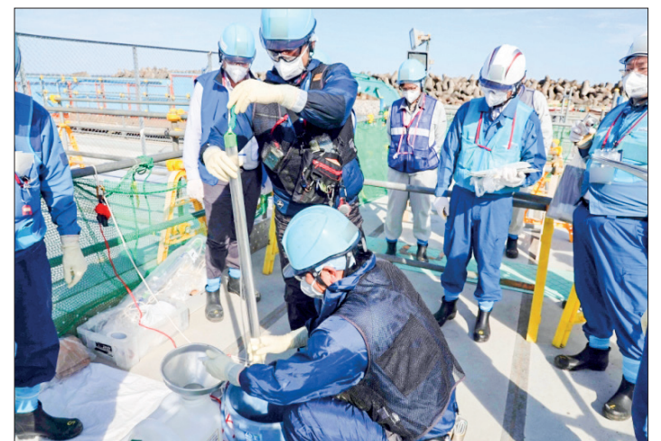
About 7,800 tonnes will be discharged in this phase, with the water filtered of radioactive elements except tritium, deemed safe.

"continue to communicate, both domestically and internationally, results of monitoring data in a highly transparent manner," Matsuno said. Japan will also urge China to "immediately scrap import bans on Japanese food, and act based on scientific justifications", he added. — AFP