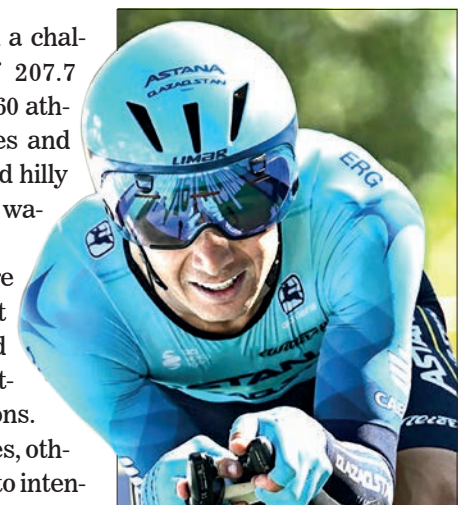
Kazakh defending champion Alexey Lutsenko came second in the Asian Games road race.