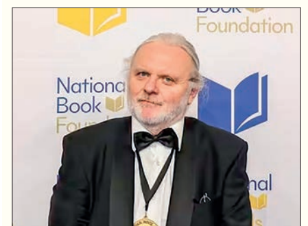
Norwegian writer Jon Fosse.

The Swedish Academy said the 64-year-old was honoured "for his innovative plays and prose which give voice to the unsayable".