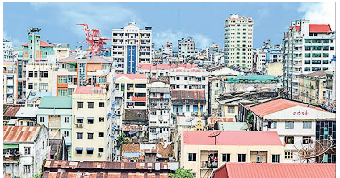
An aerial view of residential apartments in Yangon.

The bell pepper price hit a record high of K31,000 per viss on 17 November 2022.