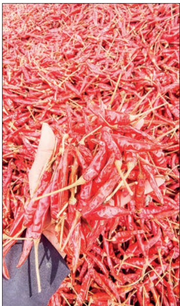
A seller is seen showing the quality of new chilli pepper from Pyawbwe town.

Similarly, Moehtaung chilli pepper price plummeted to K10,000 per viss on 4 October from K15,000-16,000 per viss in the second week of August