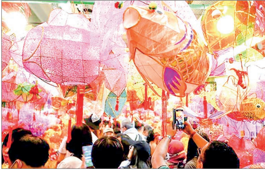
The three-day holiday is expected to generate around 1.2 billion Hong Kong dollars (about 150 million US dollars) in revenue for the food and beverage industry.

HONG Kong witnessed a vibrant and record-setting consumer market as the city moved to unlock its spending potential during the Mid-Autumn Festival and National Day holiday from 30 September to 2 October.