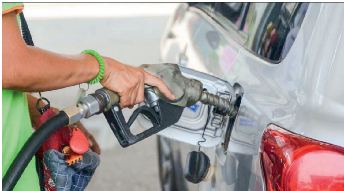
Fuel prices were K1,990 per litre of Octane 92, K2,085 for Octane 95, K2,405 for diesel and K2,445 for premium diesel on 5 October. The picture depicts fuel being pumped into the vehicle at the petrol station in Yangon.

The committee is therefore steering the fuel oil storage and distribution sector effectively so