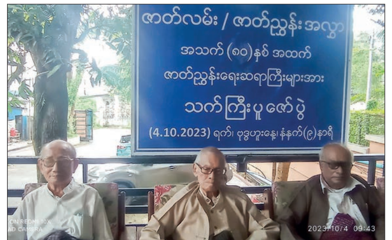
Veteran scriptwriters are pictured receiving obeisance yesterday in Yangon.

The same kinds of events were also held in 2019 and 2022. — ASH/KZL