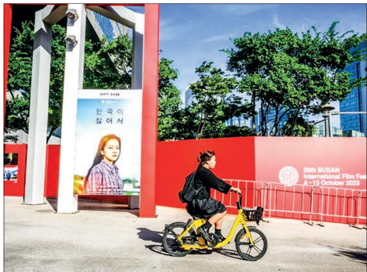
A woman cycles past a poster of South Korean actress Go Ah-sung for the film 'Because I Hate Korea' at the Busan Cinema Center before the opening of the 28th Busan International Film Festival (BIFF) in Busan.

BIFF will be held from the opening day until 13 October, featuring a total of 209 official entries from 69 different countries. Among these, 80 films will have their world premieres at the festival in Busan.