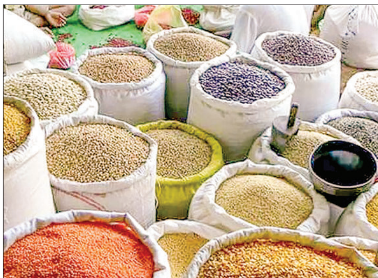
The photo shows a store displaying various pulses and beans for sale.

The prices touched the highest of K2.499 per tonne of black gram and K1.38 million per tonne of pigeon pea on 31