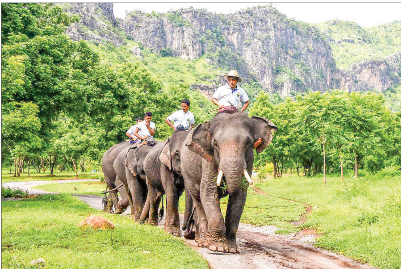
Intelligent elephants and their mahouts grace the Wahnet Elephant Camp, set amidst breathtaking mountain ranges.