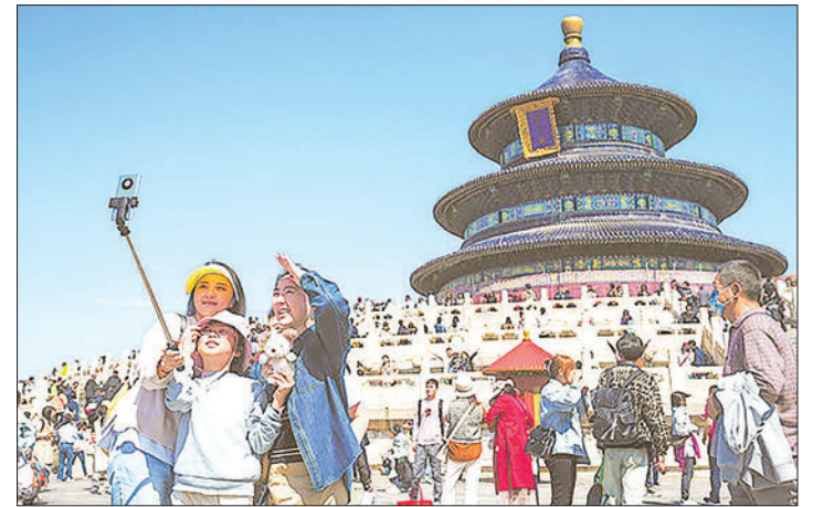
The Temple of Heaven is a famous historic site located in Beijing, China. It is a UNESCO World Heritage Site and is known for its stunning architecture and cultural significance.

The city will organize more than 2,000 cultural activities for holiday visitors, including sever-