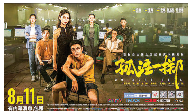
A poster of the film 'No More Bets'.

The Guanxi regional government emphasized the relationship and cooperation with ASEAN countries, including Myanmar, and reiterated that it will cooperate with the Guanxi Department of Education to sign a memorandum of understanding on education cooperation. — ASH/KZL