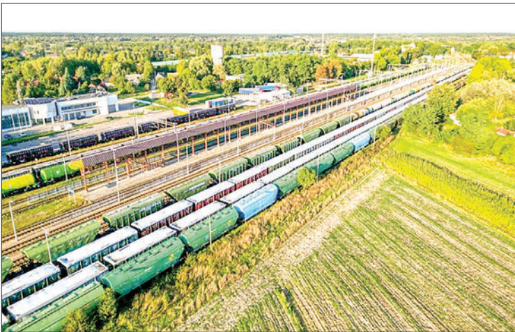
Train cars filled with Ukrainian grain at the Dorhusk station on the Polish-Ukrainian border. PHOTO: AFP

Along with Hungary and Slovakia, Poland said on 15 September that it would extend its embargo, going against a European Commission decision to end the restrictions. — AFP