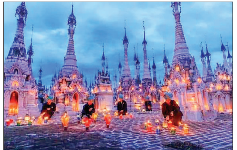
The Winning photography—Lights on Pagodas in Myanmar.

The contest received more than 6,700 young participants worldwide.