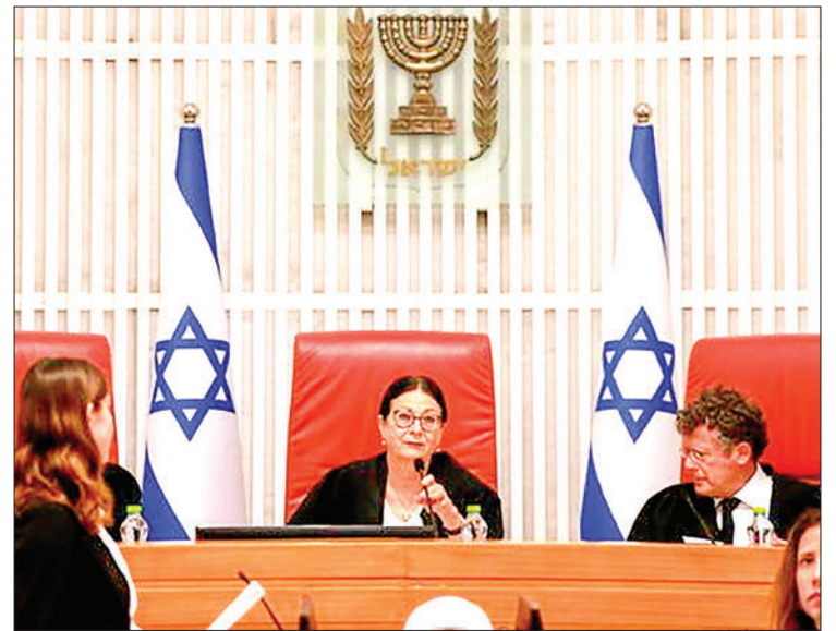
Israel's Supreme Court president Esther Hayut and judges hear petitions against a law restricting how a prime minister can be removed from office.

He sits in cabinet alongside extreme-right and ultra-Orthodox allies who were elected in November. — AFP