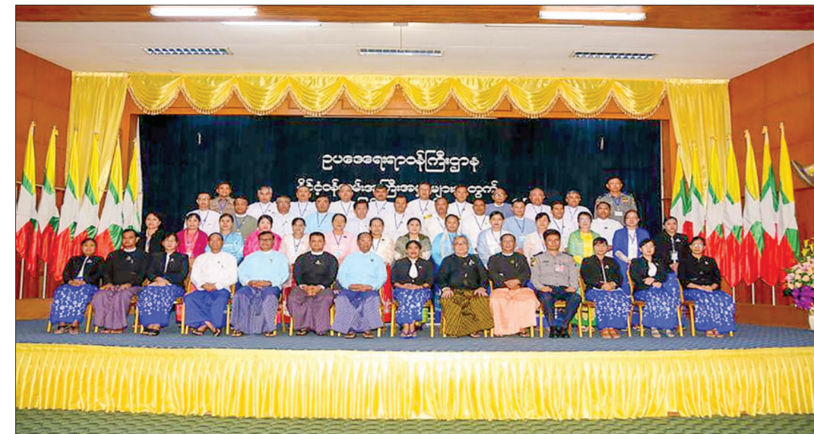
Fig: The trainers and trainees at the closing ceremony of Legal Advocacy Training No 3.

ance programmes. Identify areas where improvements or updates are necessary to enhance legal effectiveness.