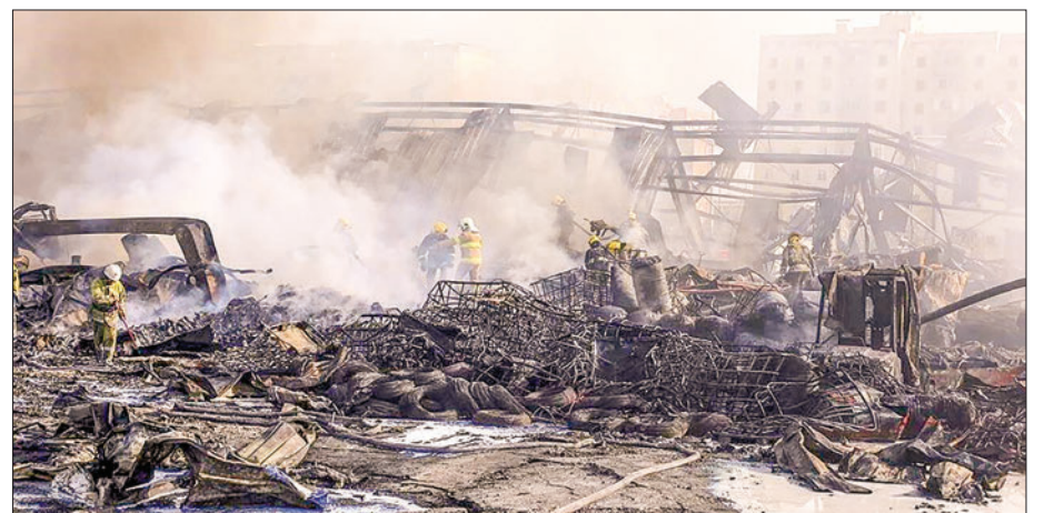
In this photo released by Uzbekistan's Emergency Ministry Press Service on Thursday, 28 September 2023, firefighters work to extinguish a fire at a site of a warehouse in Tashkent, Uzbekistan.

The emergency situations ministry reported that the explosion was triggered by powerful lightning.