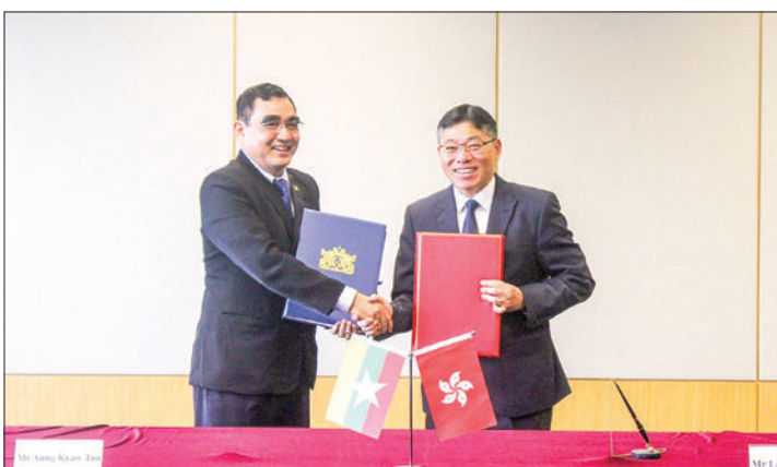
The signing event between Myanmar and Hong Kong underway yesterday in Hong Kong.