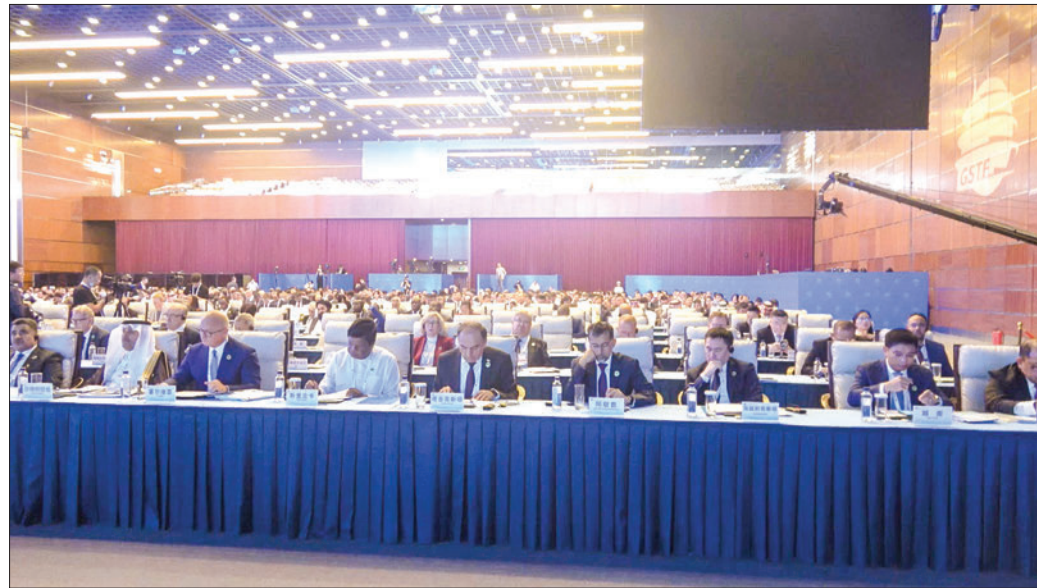
The Global Sustainable Transport Forum in progress on 25-26 September in China, addressed by Deputy Prime Minister and Union Minister for Transport and Communications General Mya Tun Oo.

MYANMAR and China are discussing establishment a new Muse-Mandalay railway and Mandalay-Kyaukphyu railway section under the Myanmar-China railway cooperation project, according to the Ministry of Transport and Communications.