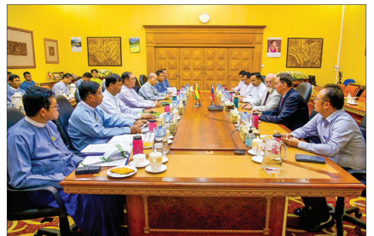
Union Minister U Khin Maung Yi holds talks with the RMAFC president yesterday.

They discussed the development of mining and pearl sectors between Myanmar and the Russian Federation. — MNA/MKKS