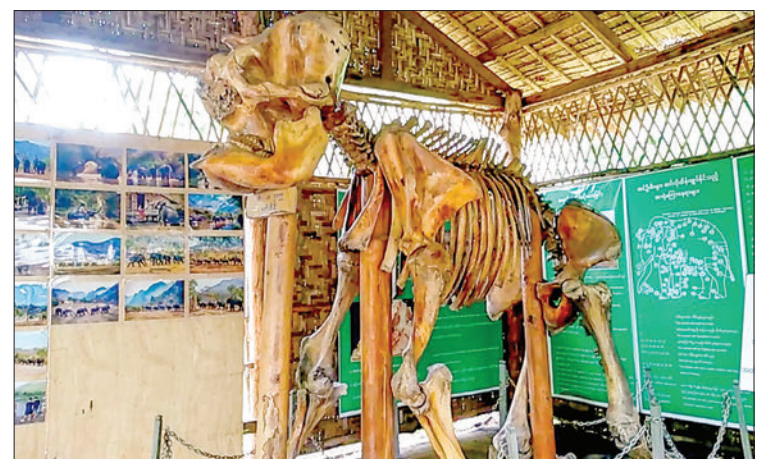
One of the fascinating exhibits: An elephant skeleton at the Elephant Museum.