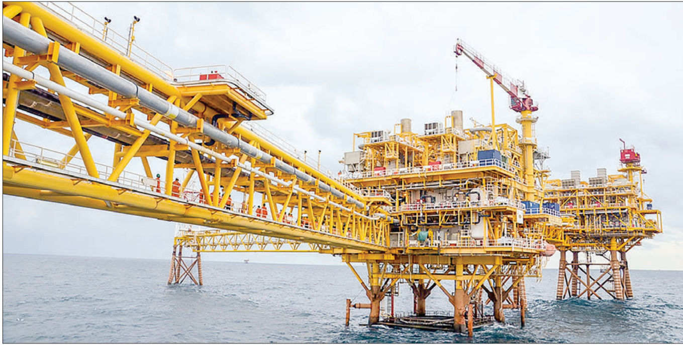
The picture depicts the Yadana Offshore Gas Platform.