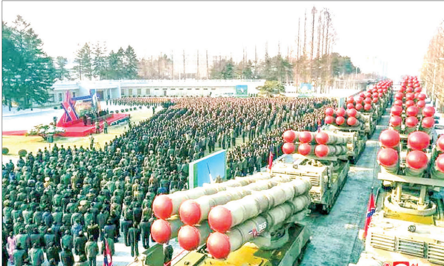
North Korea announced in February 2023 successful testing of a multiple rocket launcher system potentially armed with 'tactical' nuclear weapons, following the launch of two ICBMs into waters near Japan. North Korea's "super-large" 600 mm rocket launchers are displayed in Pyongyang in December.

North Korean leader Kim Jong Un emphasized the importance of maintaining the country's status as a nuclear weapons state.