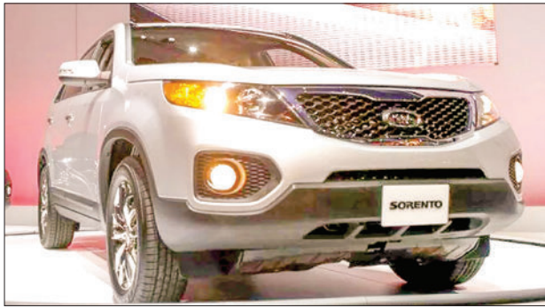
South Korean car manufacturers Hyundai and Kia are issuing recalls for 3.3 million vehicles in the United States due to their risk of suddenly catching fire, regulators announced Wednesday. PHOTO: AFP

Hyundai has recorded 21 vehicle fires linked to the default in the United States, as well as “22 thermal incidents,” including visible smoke, burning and melting. — AFP