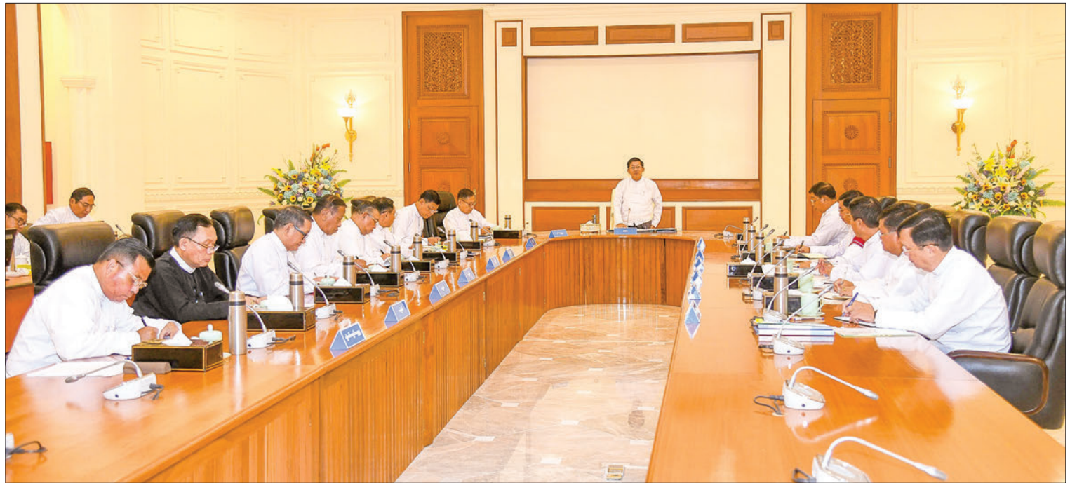
State Administration Council Chair Prime Minister Senior General Min Aung Hlaing presides over the SAC meeting 4/2023 in Nay Pyi Taw yesterday.

With regard to regional situations, the Senior General expressed his wish to know the