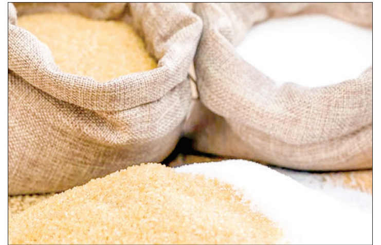
Sugar is seen being displayed for sale at the market.

Myanmar's annual sugar production is estimated at 450,000 tonnes. Myanmar earlier sent sugar to China and Viet Nam beyond self-sufficiency.