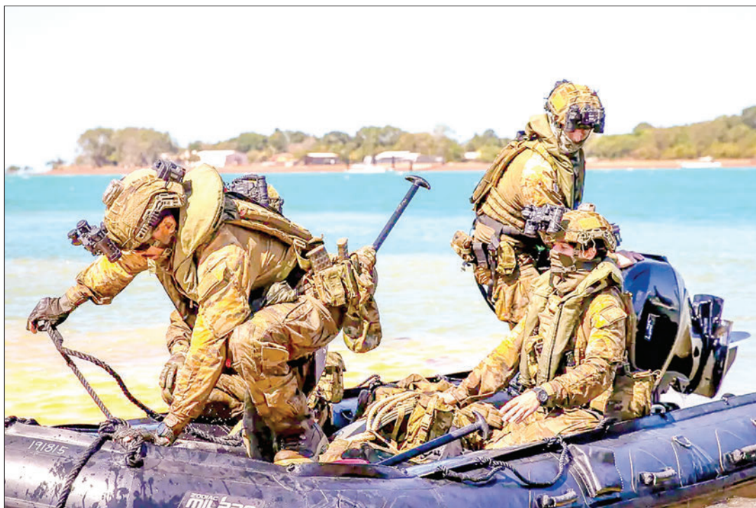
Australian Army soldiers arrive at Melville Island, Northern Territory, by Zodiac after a patrolling around the waters of Darwin as part of Exercise Predators Run 23.

"This will be the cutting edge of army technology," the minister said. — AFP