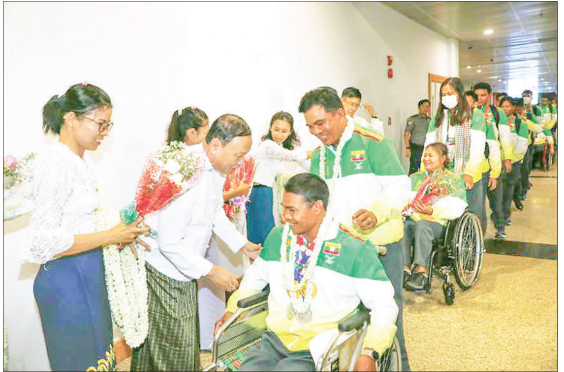
The victorious sports team representing Myanmar in the 12 th ASEAN Para Games held in Phnom Penh, Cambodia, returned to Yangon by air on 10 June 2023.

By conducting disability assessments and registering individuals with disabilities, it becomes feasible to provide targeted assistance to disabled individuals in various regions