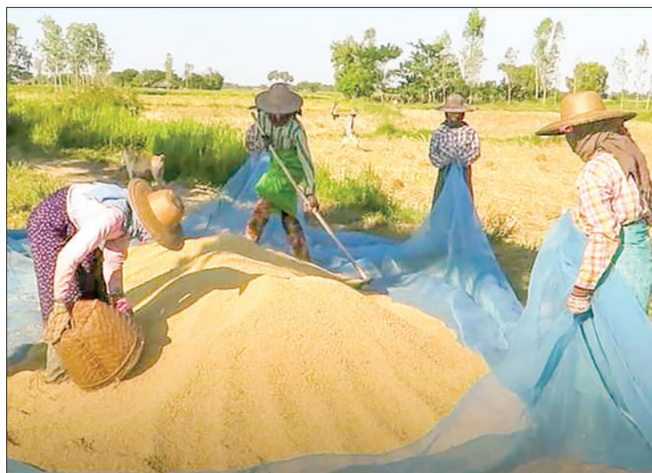
The photo shows some farmers collecting the harvested rice at a farm in Shwebo District.

The price of Pawsan rice in Monywa decreased to K125,000 per sack in the third week of September from K150,000 in the first week of September. Similarly, the paddy prices also dropped to K3.2 million per 100 baskets from K3.7 million in the past three weeks in