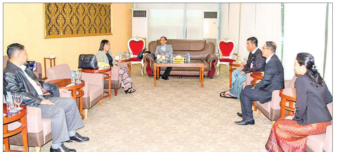
The Myanmar delegation meets the president of the International Court of Justice (ICJ) on 26 September 2023 in The Hague.

left for The Hague, the Netherlands, on the morning on 24 September 2023 and arrived at The Hague on the morning on 25 September 2023.