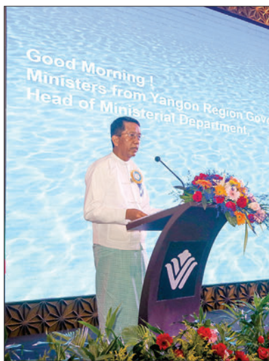
The World Maritime Day 2023 in progress yesterday in Yangon, addressed by Deputy Minister for Transport and Communications U Aung Myaing.