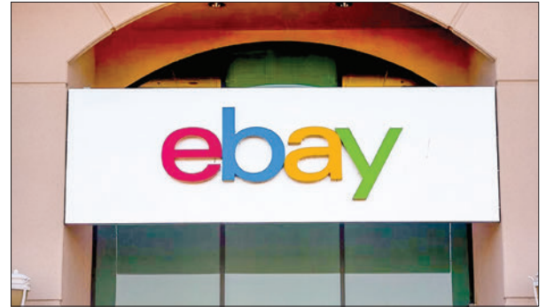
The DoJ has accused eBay of selling hundreds of thousands of products in violation of the Clean Air Act and other environmental protections.

“The complaint filed today demonstrates that EPA will hold online retailers responsible for the unlawful sale of products on their websites that can