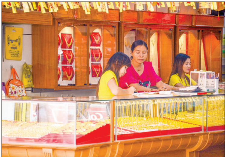
The picture depicts the gold jewellery outlet in Yangon.

The US dollar exchange rate influences domestic gold prices. The soaring dollar exchanging at over K4,500 hiked up the gold price to a record-high of K3.7 million per tical in late August 2022. — NN/EM