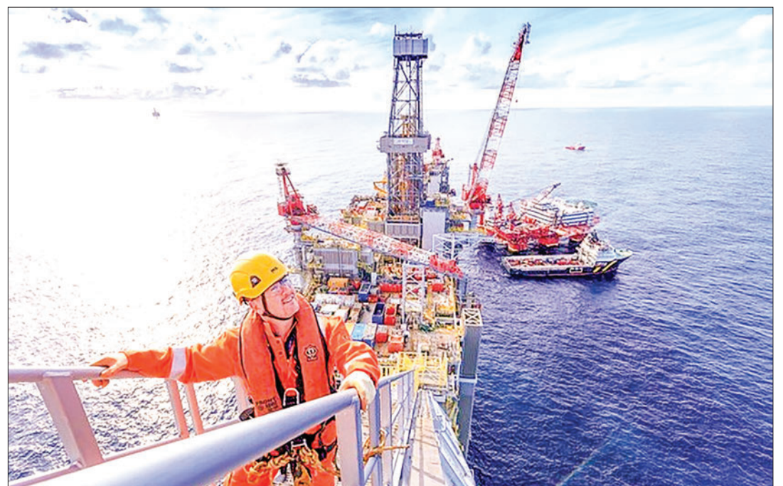
A workman on board an oil platform in the Clair Ridge oilfield in the North Sea, 45 miles off the coast of Scotland.

Equinor has an 80 per cent interest in the project and Ithaca the remainder. — AFP