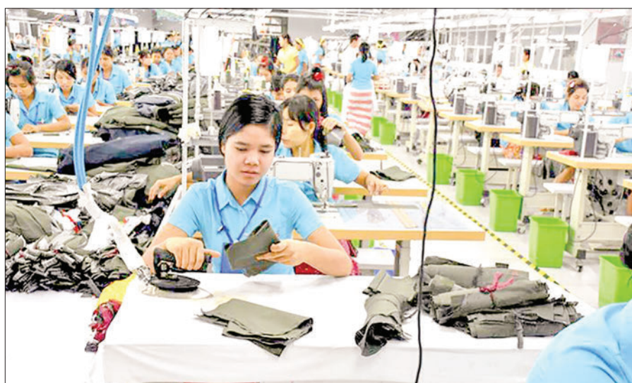
Female workers are pictured on the CMP manufacturing line at the workplace.

Investment Committee increased investment amounts for existing businesses, including new investment projects, in July. This expansion allowed for an increase in the number of employees in the work-