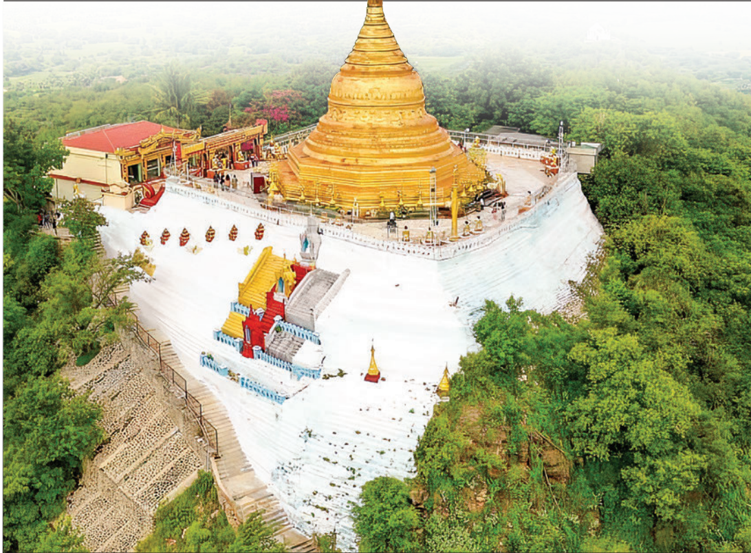
An aerial view of the Tuyintaung Pagoda in NyaungU Township.