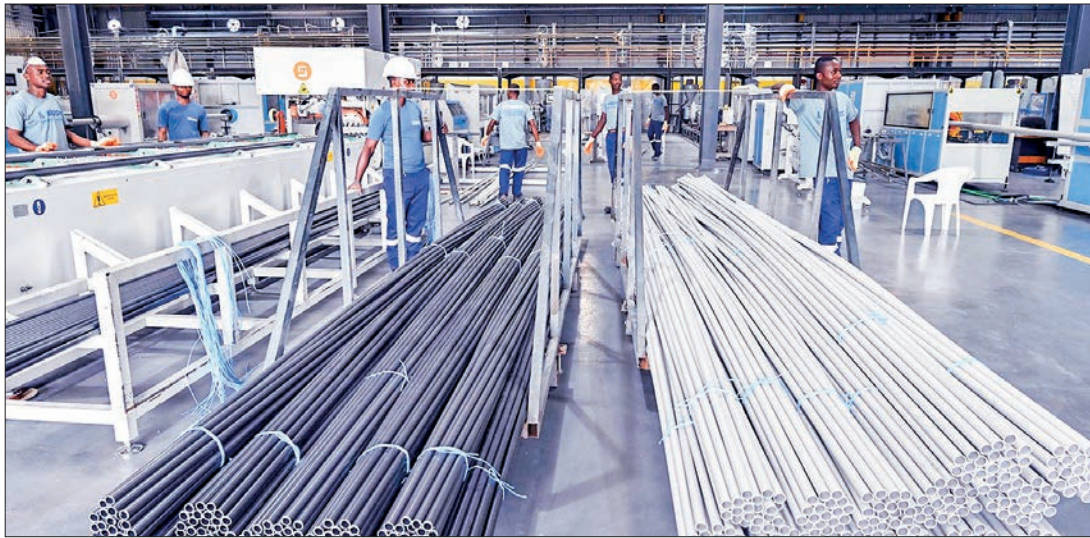
PVC (Polyvinyl Chloride) pipes can be produced from recycled plastic material. Workers stand in a PVC pipe and construction equipment manufacturing plant in an industrial area of Abidjan.

The treaty reveals varying levels of ambition among nations, particularly concerning the reduction of raw polymer production versus the promotion of reuse and recycling.