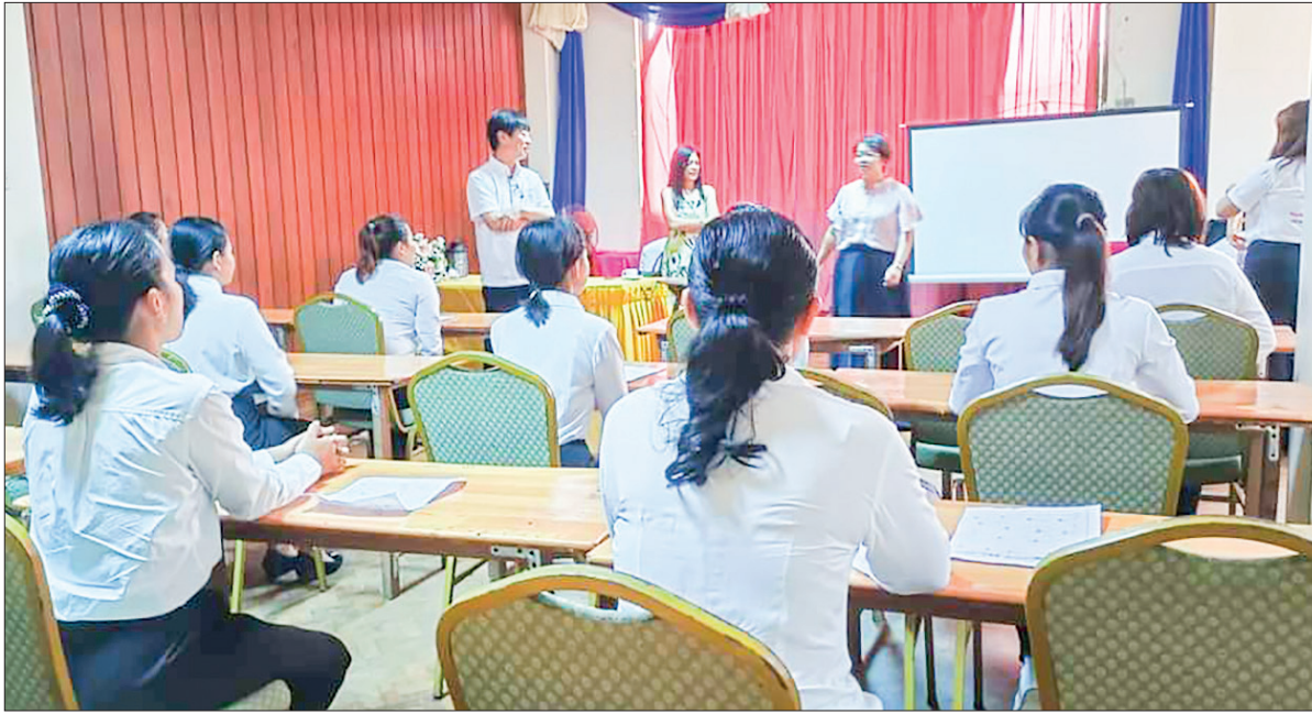
Grand Asia Force Co Ltd, a licensed employment agency, holds personal interviews with trainees intended to work abroad.