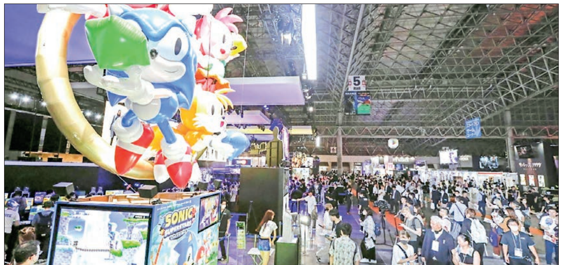
Alongside Germany's Gamescom, Tokyo Game Show is one of the last remaining major gaming conventions in the world.

The event organized by the Computer Entertainment Supplier's Association boasts an impressive participation of 787 exhibitors from more than 40 countries and regions.