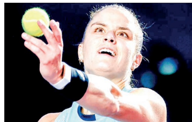
Greece’s Sakkari, ranked ninth in the world, had come up empty in six finals since her breakthrough victory in Rabat in 2019.

Sakkari had said at Flushing Meadows she was “suffering on the court” and was “uncertain” about what to do about it. — AFP