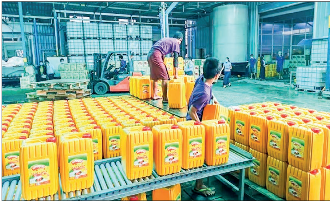
Containers of cooking oil are seen in production belt of an oil mill.

At present, the prices of peanut oil for domestic consumption are falling again in the market. The price decrease is due to the release of peanuts from all over Myanmar. In the past few days, peanut and oil prices rose. Red peanut went from K10,000 to K7,900 per viss.