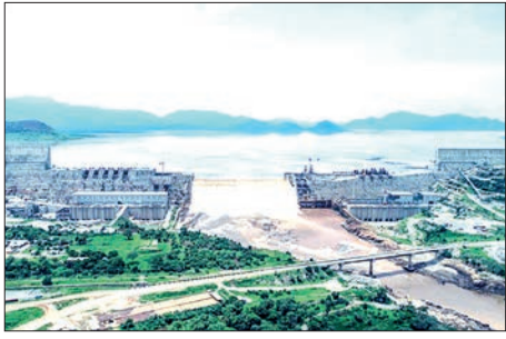
Ethiopia, Egypt and Sudan have long been at loggerheads over the dam.