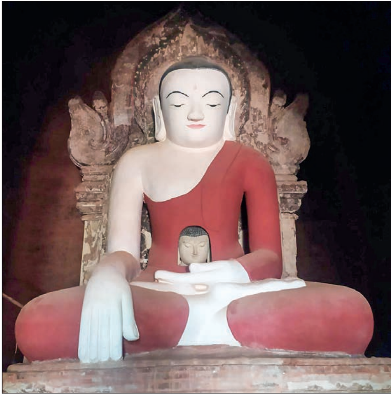
A double Buddha image seen in the cave of Thagyapone temple in Bagan.