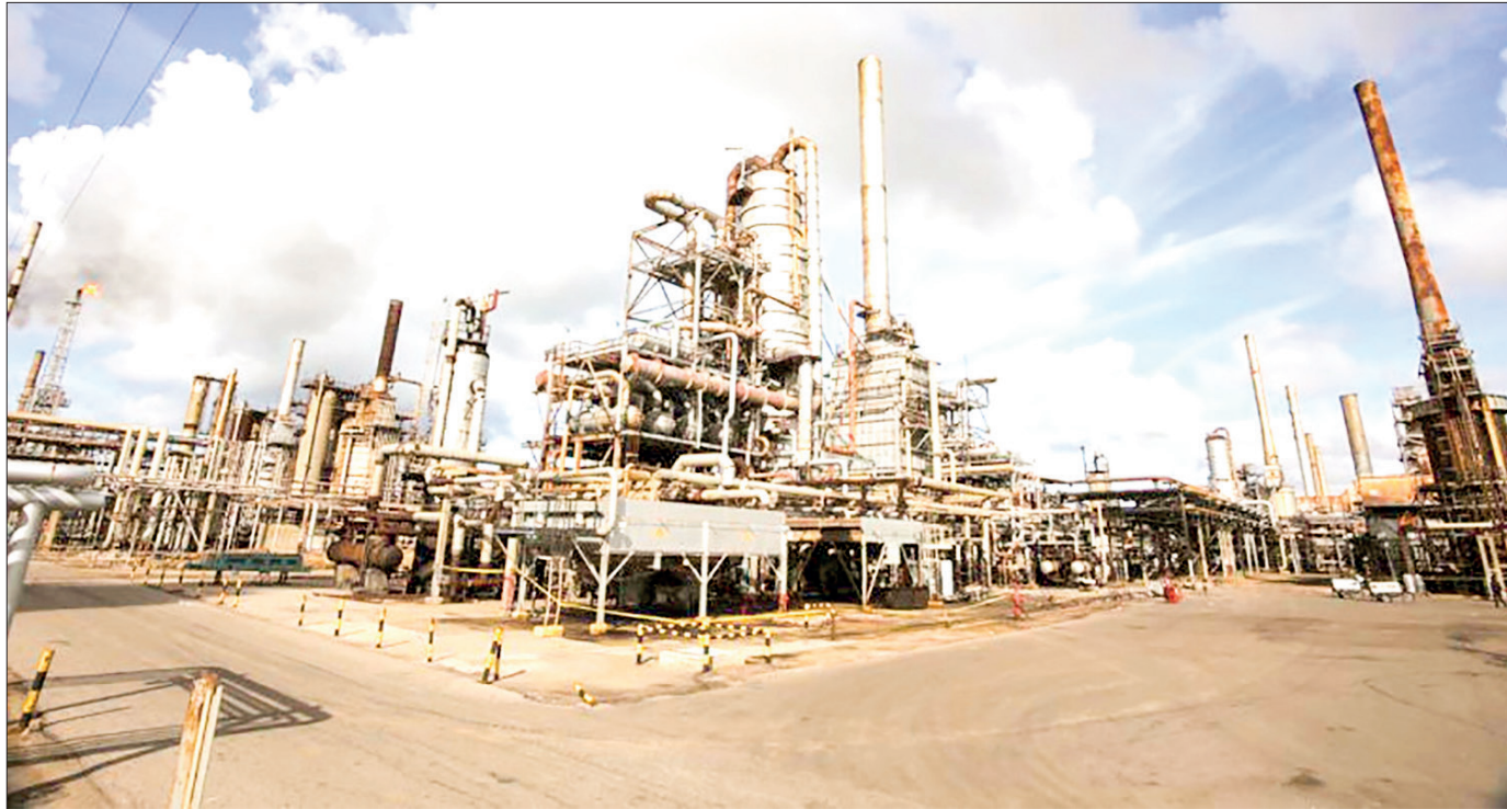
Venezuelan President Nicolas Maduro said his country is prepared to supply the global oil and gas market.