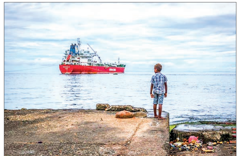
A boy watches a distant cargo ship in Honiara, Solomon Islands.

But China, which has longstanding tensions with Japan, accused Tokyo of treating the ocean as a “sewer”. China banned all Japanese seafood imports and Chinese citizens have thrown bricks and eggs at Japanese schools and consulates. — AFP