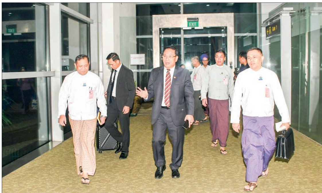
Union Minister U Maung Maung Ohn is seen on his arrival back at Yangon International Airport yesterday.

The 16 th Conference of ASEAN Ministers Responsible for Information-AMRI, the 20 th ASEAN Senior Officials Meeting Responsible for Information-SOMRI and related meetings were attended by Information and Communication