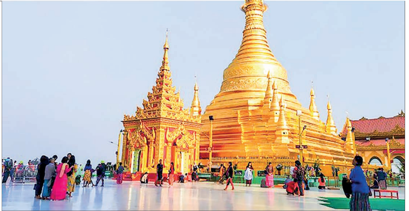
Pilgrims are seen on the platform of the Myathalun Pagoda in Magway.

The 24 th Japanese Language Spoken Competition is scheduled to be held from 9 am to 12 pm on 11 November 2023 at the office of the Myanmar Association for Japan Alumni (MAJA) in the Yangon Region. — ASH/KZW