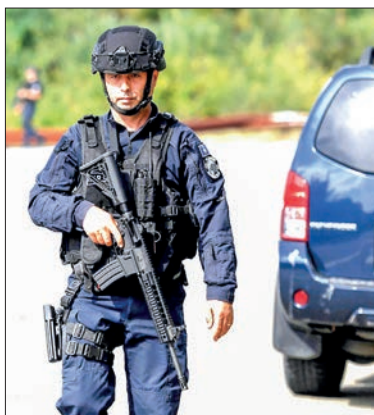
The Serbia Orthodox Church confirmed that gunmen had stormed a monastery in Banjska, where pilgrims from the northern Serbian city of Novi Sad were staying.

"There are at least 30 professional, military or police armed people who are surrounded by our police forces and whom I invite to surrender to our security