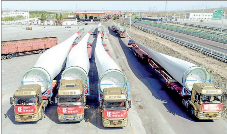
This aerial photo taken in April 2020 shows the vehicles carrying a batch of components from Chinese green power developer Universal Energy for the 50 MW wind power project in Kostanay of Kazakhstan.