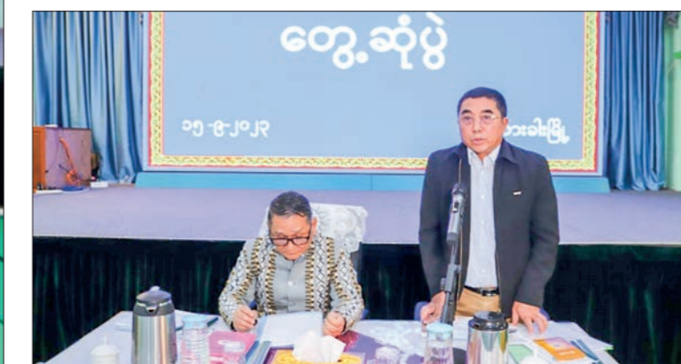
Chin State Chief Minister Dr Wong Hsum Thang delivered a supportive speech to departmental officials and local people.

and ensuring access to justice for all. Regional Collaborations can play a significant role in supporting the peace and development of Chin land. Engaging with government, international organizations and local organizations can provide opportunities for knowledge exchange, technical assistance and financial resources.