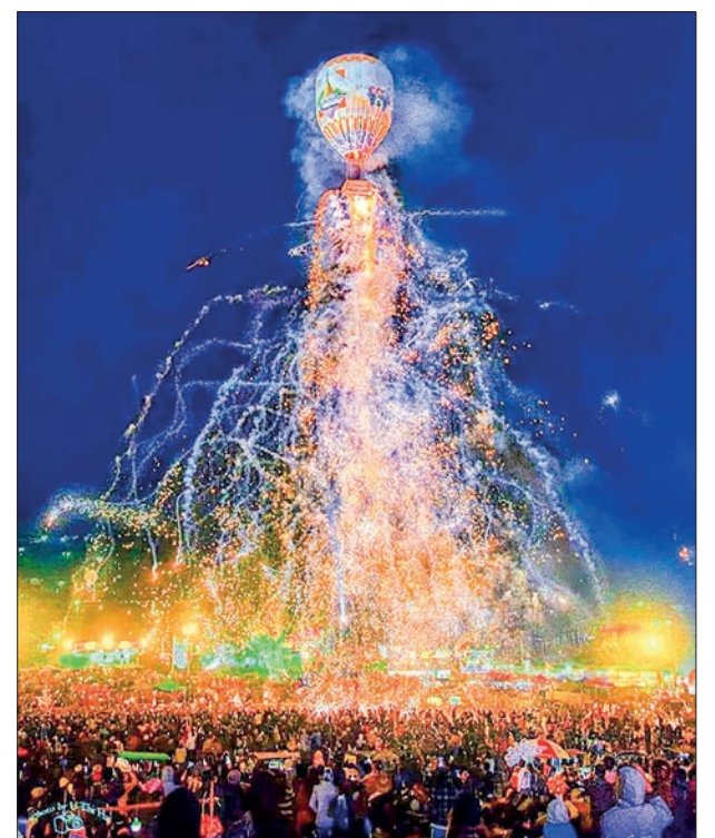
An impressive scene of the 2019 Taunggyi Tazaungdaing Festival.

The professionals launched 281 balloons at day time