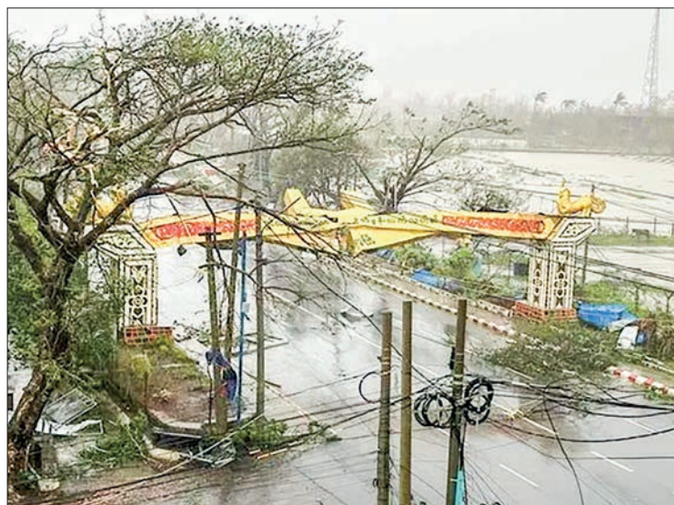
The photo shows the debris of archway hit by cyclonic storm Mocha in Sittway of Rakhine State.

rich cultural heritage of the Rakhine State and its diverse ethnic communities. Their designs must also adhere to essential architectural principles and align seamlessly with the current landscape. Beyond aesthetics, these entries are expected to enhance the prestige of the Rakhine State while offering practical features such as accommodating the passage of cargo trucks, resilience against earthquakes and natural disasters, and an integration with the surrounding environment. It is worth noting that the winning design