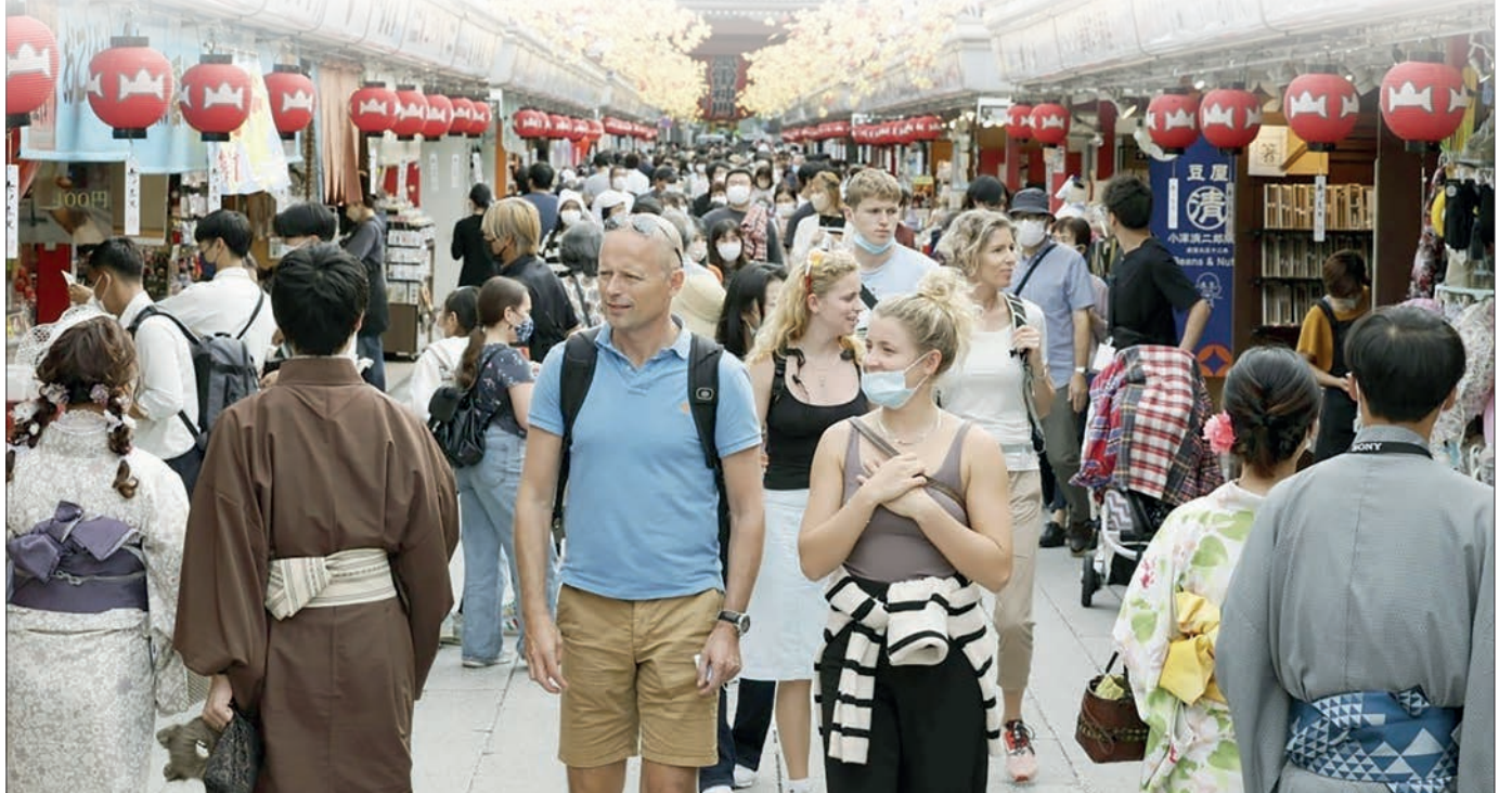
In the first eight months of this year, Japan welcomed 15.19 million foreign tourists.

"Inbound tourist numbers are on an upward trend, meaning we could at some point become unable to respond with the current workforce. I hope we can progress further with bringing the system online," the official said. — Kyodo