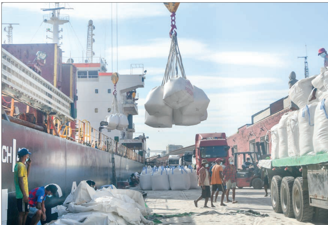
Exported rice bags being loaded onto the overseas merchant vessel at Yangon Port.