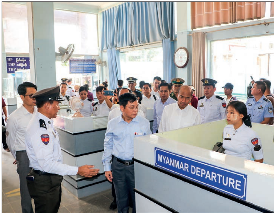
Union Minister U Myint Kyiaing looks into the process of immigration at Shwe Nan Taw immigration checkpoint in Muse yesterday.