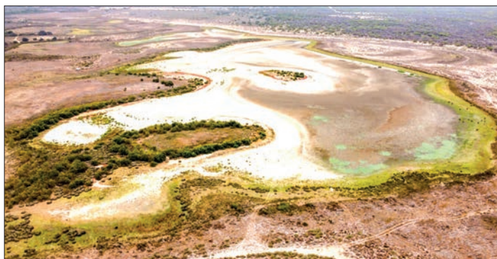
A dried-up lagoon in the Donana National Park last month.

The five farmers — four men and a woman — were found guilty of crimes against the environment and causing damage for “putting the ecosystem at serious risk” through the “systematic and extensive extraction” of water supplying Donana National Park, said the