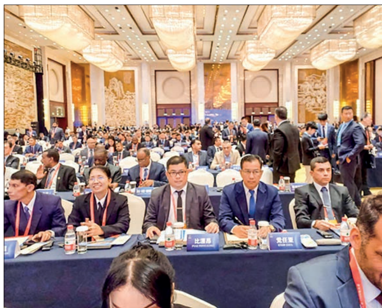
The Second Global Security Cooperation Conference (2023) (Lianyungang Forum) in progress in Lianyungang, the People's Republic of China.

nologies like Artificial Intelligence and ChatGPT are being employed in online scam centres. There is a pressing need for close cooperation and comprehensive information sharing among law enforcement organizations, non-governmental organizations dealing with online scams, financial intelligence agencies, and relevant private companies.