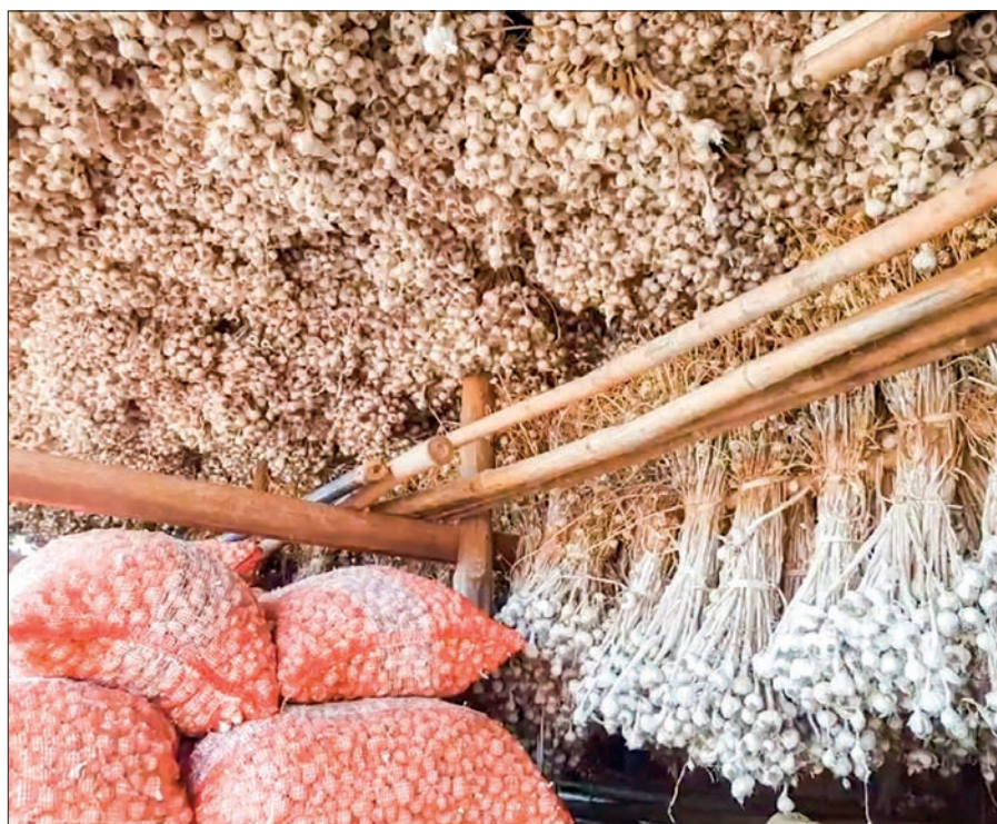
Garlic from Aungban area before shipping to a brokerage house.

sale price of Kyukok garlic was K3,850 per viss, and that of Shan Aungban garlic ranged from K2,800 to K3,900 per viss. Therefore, in the last week of September this year, garlic prices were around double the prices of the same period last year.