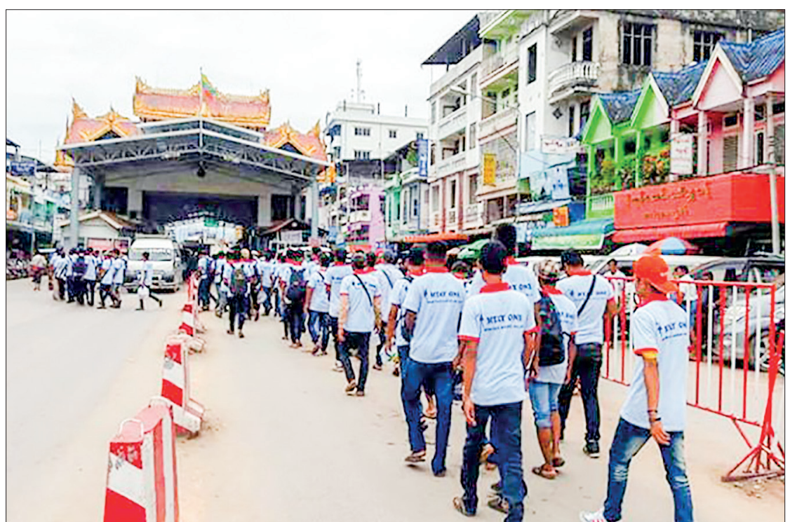
Myanmar workers going to work in Thailand.

According to the statement, the Union Tax Law 2023, which has been amended, will be effective from 1 October until 31 March 2024. — TWA/CT