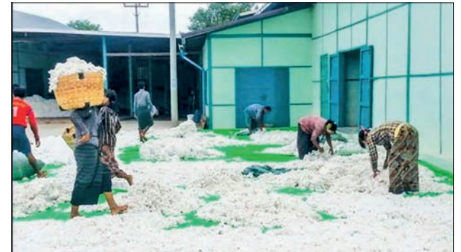
Cotton wool is being sun-dried in a factory.

The tender will be closed by 29 September and local entrepreneurs can contact the production department of No 3 Heavy Industries Enterprise, the Ministry of Industry, for detailed information. — TWA/CT