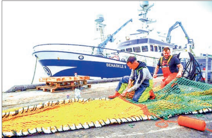
Fishing became a key negotiating issue in the UK's new trade deal with the EU.

In Peterhead, once touted as a place of abundant opportunities following Brexit, locals have instead faced a series of challenges and increased financial burdens, even prior to the effects of rising inflation.