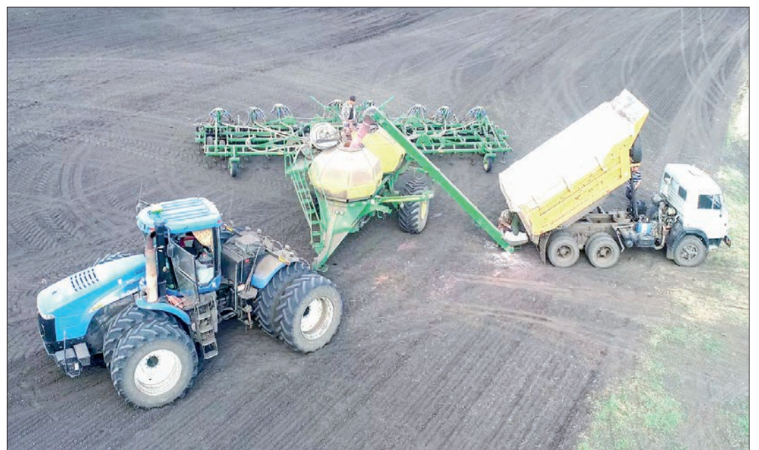
Russian farmers load fertilizer into a sowing machine in Krasnoyarsk region, Russia.

“Certainly we’re very also concerned, for example, over the grain deal, which has been suspended,” Manalo said on the sidelines of the UN General Assembly. — SPUTNIK