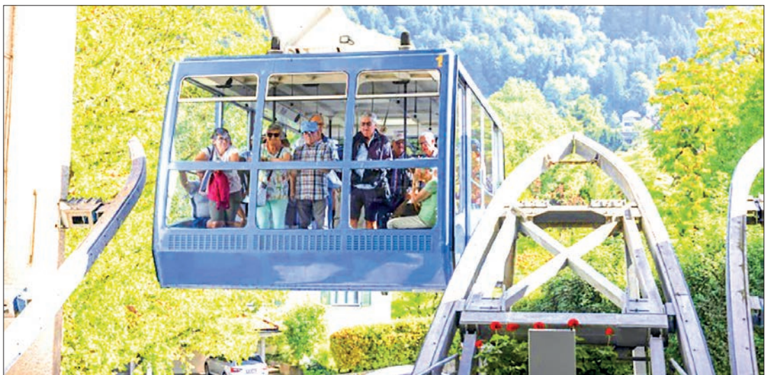
A growing number of urban areas are adopting the cleaner, space-saving mode of transportation.

AUSTRIAN company Doppelmayr is well known for making gondolas for ski resorts, but its workshop is increasingly building cable cars for congested cities as climate change has opened up new markets.