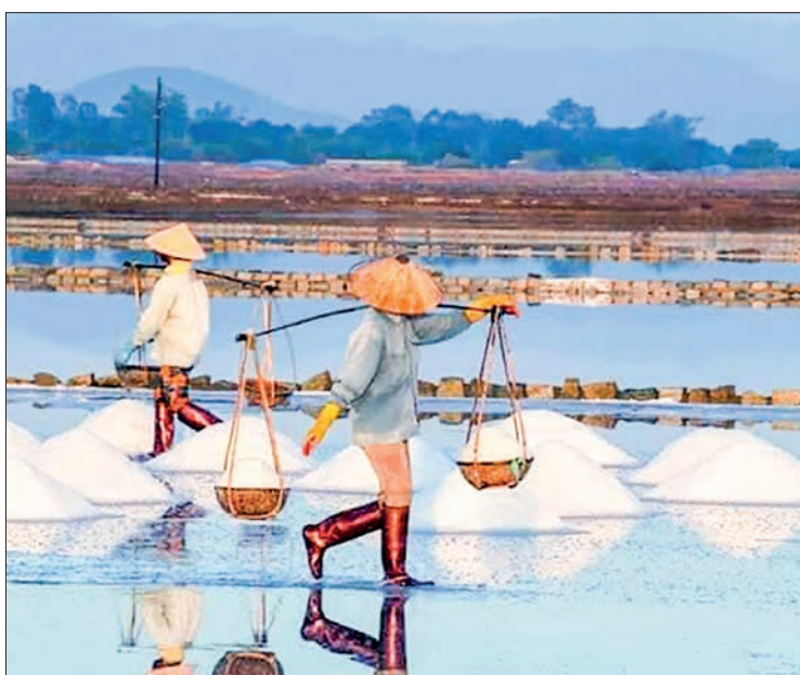
Workers are pictured harvesting dried salt at the salt farm.

"In Mon State, we can say that the salt yield has reached 100 per cent in 2023. Each salt field can produce about 500 tonnes of salt per year. It is not more than that. The size of the salt field may be large or small. This year, the season for salt production is not bad, and because the price is good, the salt