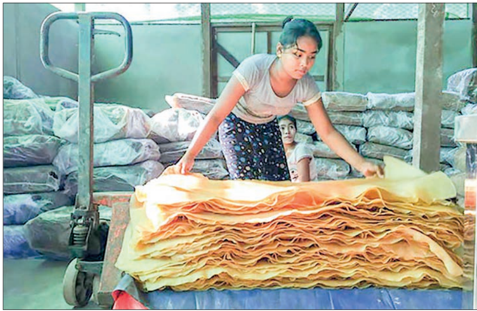
The photo shows weighing sundried rubber for packaging.

Myanmar Sustainable Natural Rubber Association pointed out that Myanmar's rubber production needs to strictly adhere to the Sustainable Natural Rubber (SNR) guideline to grasp a firm market share in the competitive international market.