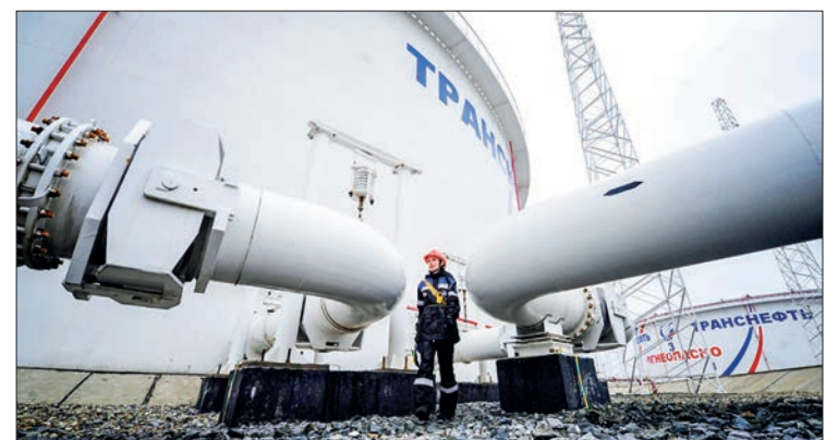
Oil port in Russia.

ports until the end of the year in a coordinated move with Saudi Arabia aimed at propping up global crude prices. "The government introduced a temporary restriction on exports of motor gasoline and diesel fuel to stabilise the domestic market," the government said Thursday. "The decision was made to stabilize fuel prices on the domestic market," it said, without specifying what kind of measures would be introduced. — AFP