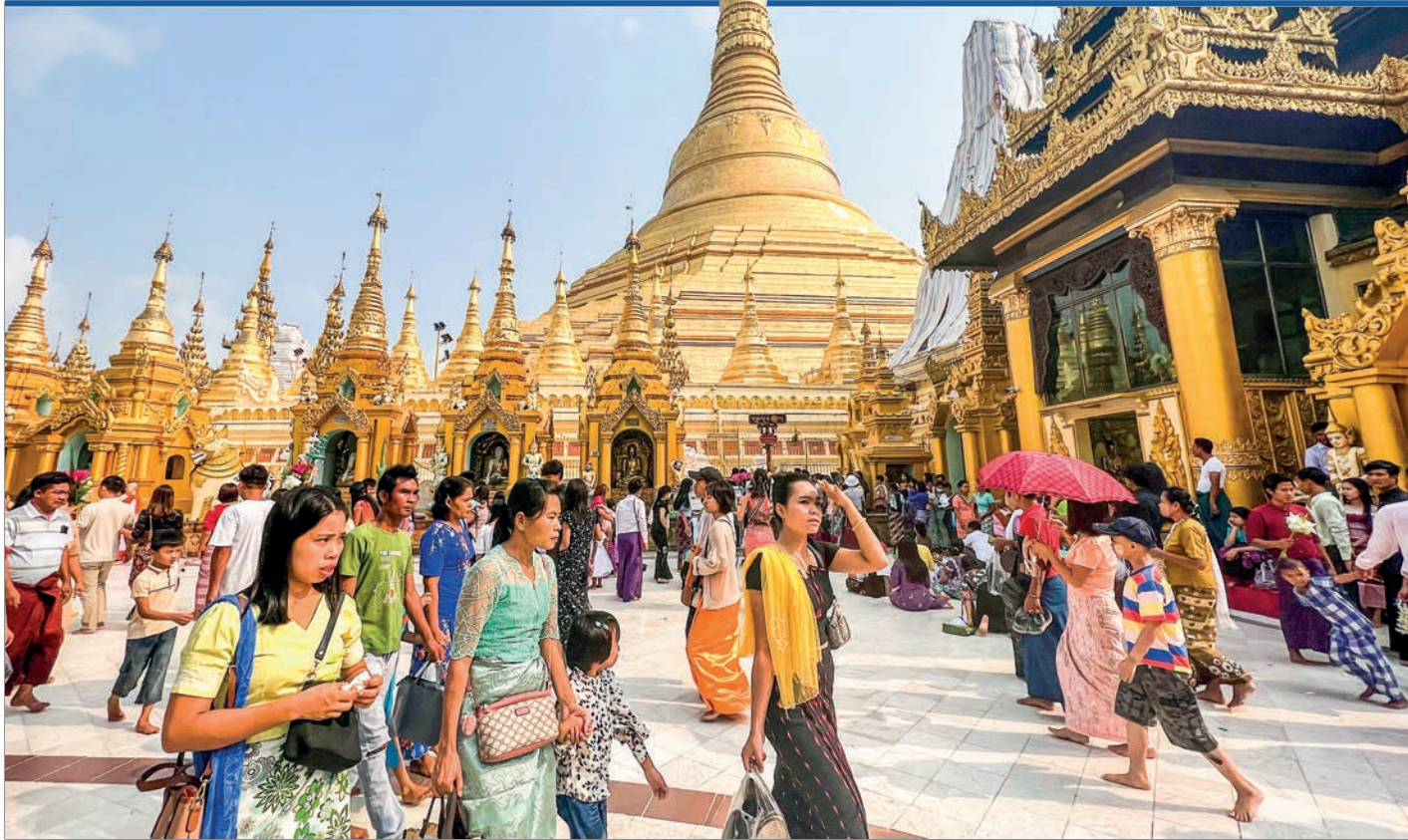
Devotees throng on the majestic platform of the Shwedagon Pagoda.