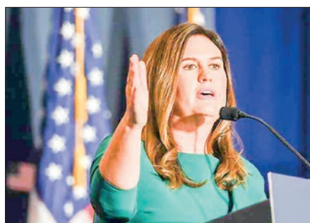
Arkansas Governor Sarah Huckabee Sanders has defended her state's loosening of child labour laws.

India has rejected the allegations by the Trudeau administration, terming them "absurd" and "motivated". — ANI