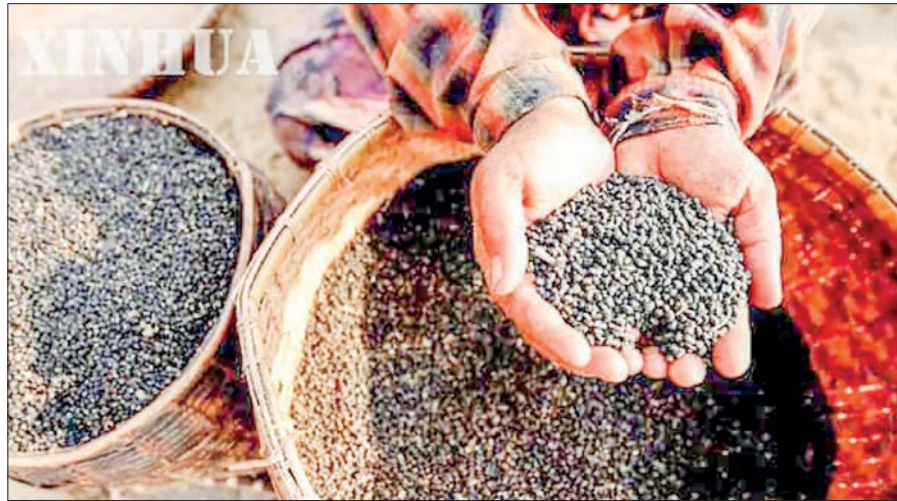
The picture shows the quality of black grams before being delivered to the market.

ON 22 September, the price of black gram rose in the Yangon bean market, and a tonne of black gram RC began to reach above K2.6 million.