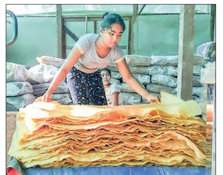
Rubber market resumes with high opening price