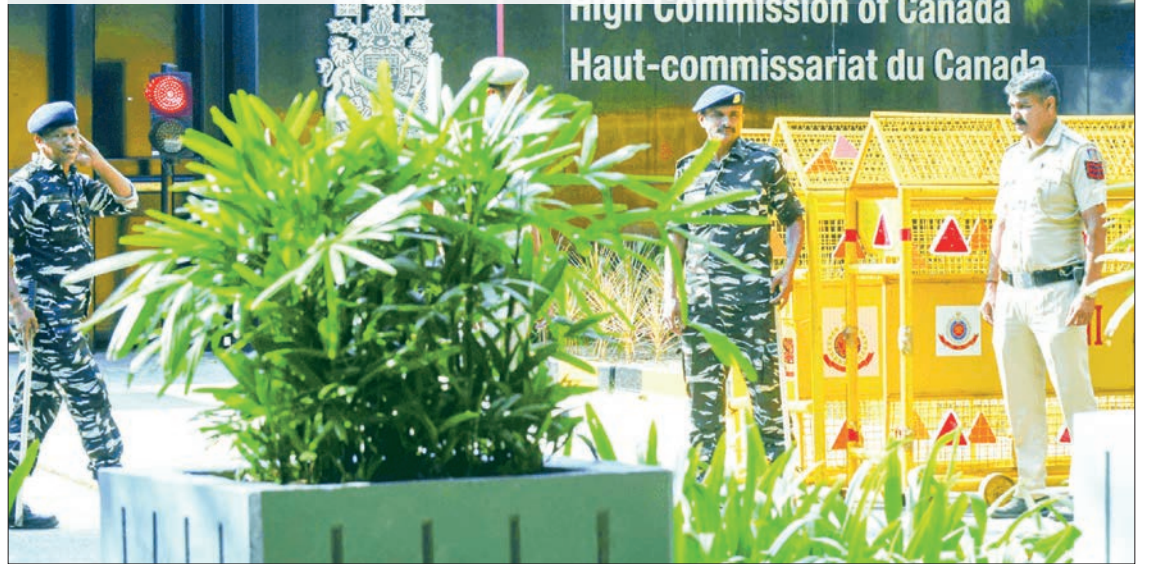
A man checks his mobile as he sits outside an Air Canada regional office in New Delhi on 20 September, 2023.

Referring to terrorism, Bachi said it is funded and supported by Pakistan. He also spoke of the issue of safe havens.