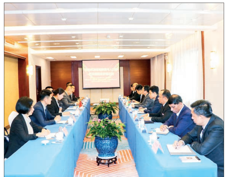
Union Minister U Myint Kyaing holds talks with Chinese officials in Kunming, Yunnan Province of China.

The Union minister and officials from Yunnan State explored ways to enhance immigration management activities along the extensive Myanmar-China border. — MNA/TS