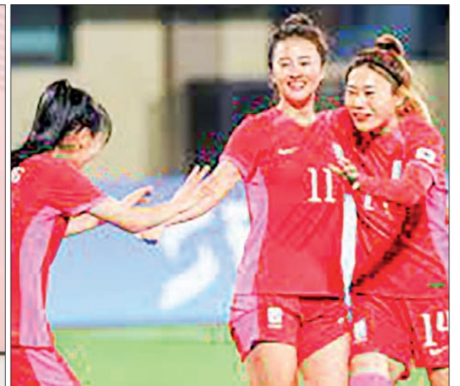
South Korean players are seen celebrating their triumph at the match yesterday.