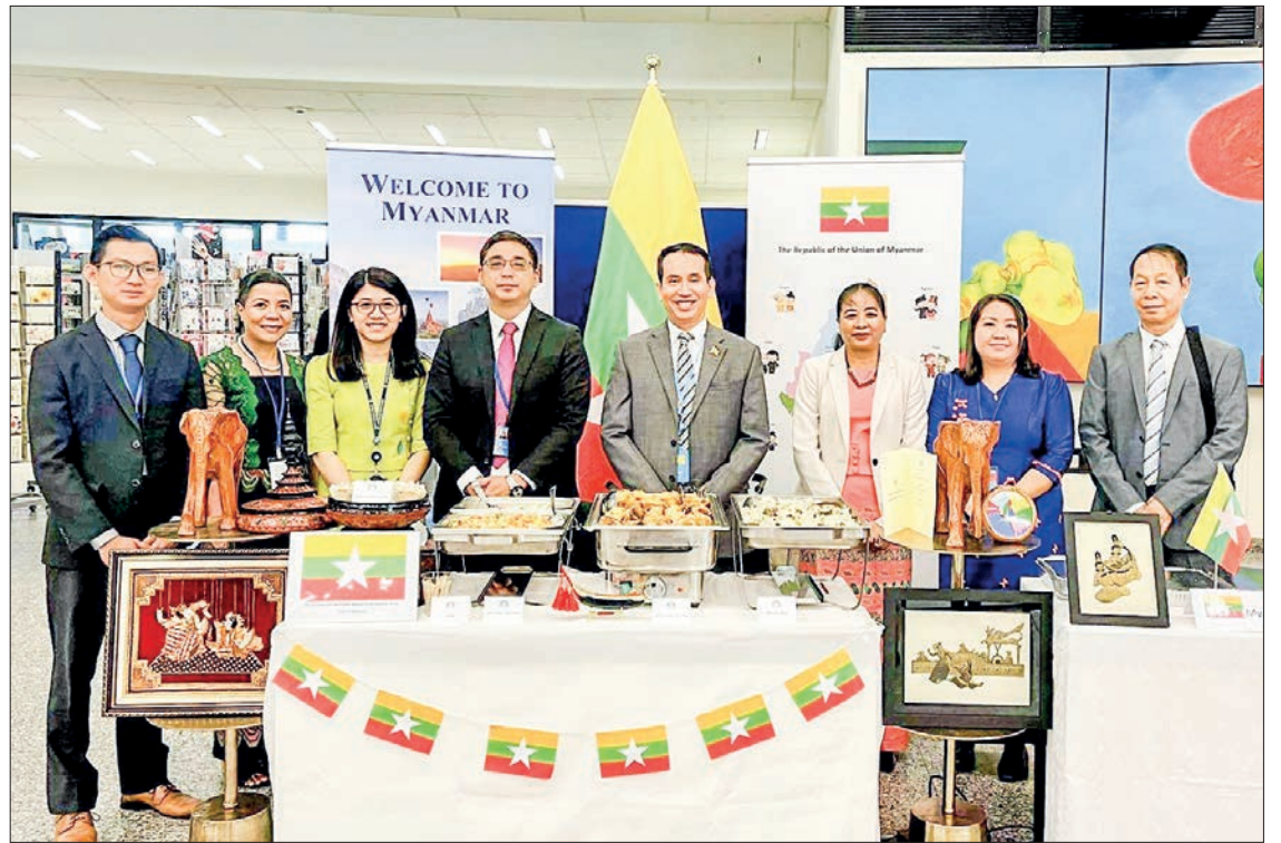
The group documentary picture of the UNWG Charity International Luncheon held in Vienna, Austria, on 20 September 2023.

The United Nations Women's Guild of Vienna was founded in 1967 as a charitable organization. The purpose of the Guild is to assist children in need and/or mother-childcare programmes throughout the world. Membership in the UNWG is open to any woman who is a staff member or the spouse of a staff member of the United Nations and International and International Organizations or Permanent Missions to these organizations in Vienna. The approximately 500 members come from over 100 countries, and all are volunteers for charitable activities. — ASH/KTZH