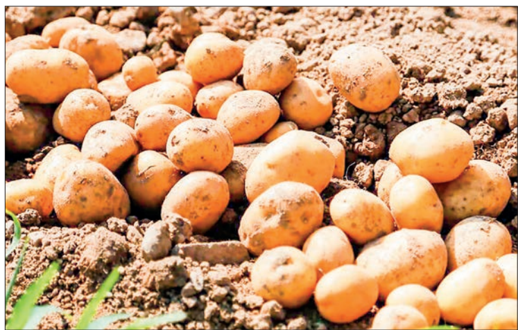
The photo shows some potatoes harvested on a farm.

Agriculturists and companies had better assistance in accessing quality seeds of potato and growing methods.