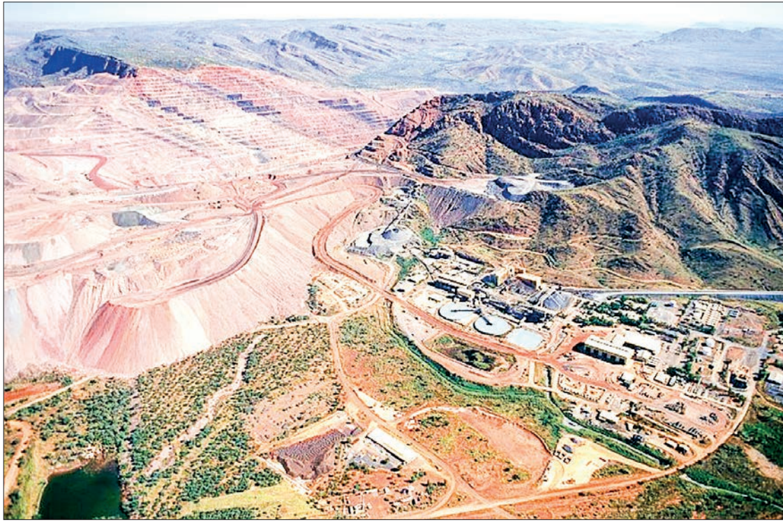
More than 90 per cent of the world’s pink diamonds have been found at the Argyle mine, in the remote northwest of Australia.

Scientists have made a significant discovery related to pink diamonds, known for their extreme rarity and beauty.