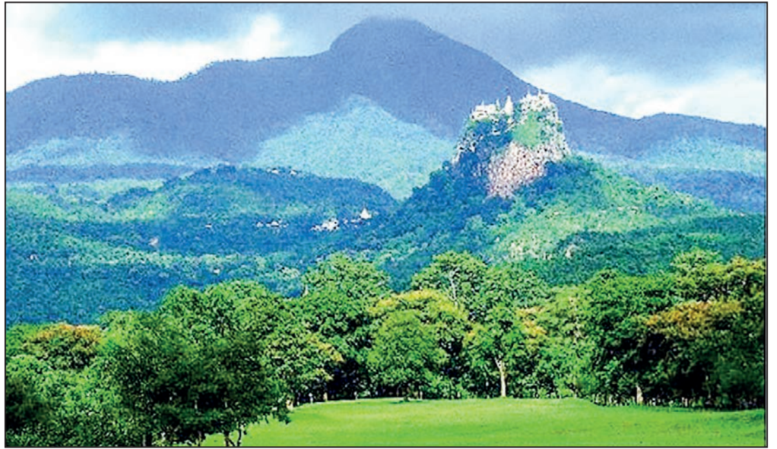
Captivating panorama : Mount Popa and its enchanting mountain landscape.

Tax shall be levied under the provision of rule 8 of the income tax rules. Without subtracting the amount of exemption, a two per cent tax shall be levied over the incomes under Section 6 and Section 6-a of the law. Moreover, the taxpayer shall have the right to subtract the amount paid as tax abroad from the calculated amount of tax under this law. — GNLM/TTA