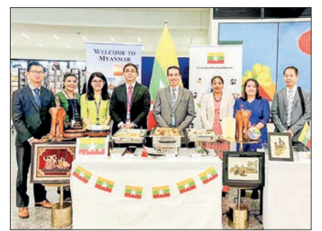
Myanmar participates in UNWG Charity International Luncheon