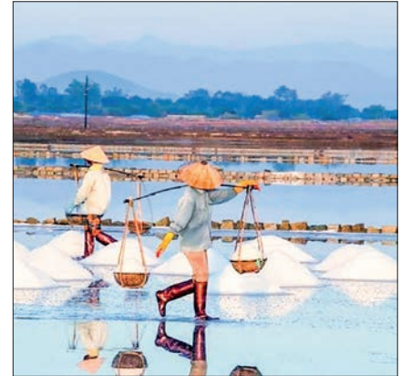
Salt produced in Mon State fetches good price in 2023