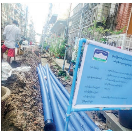
Iron pipes are being replaced with blue HDPE pipes.

It is known that from the 2023 financial year on, instead of paying K5,400 in water usage fees to the municipality every three months, the rate will change to K9,000. — TWA/CT