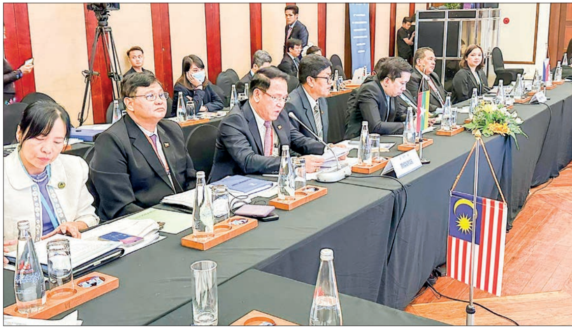
Union Minister U Maung Maung Ohn (3L) addresses the 16 th ASEAN Ministers' Responsible Information yesterday in Viet Nam.

He continued that Myanmar agrees with the fact that the collaboration of ASEAN countries plays a key role in establishing a digital media community that can strengthen the resistance and response of human beings and trust among the people. It also stands with the theme of the 16 th AMRI "Media: From Information to Knowledge for a Resilient and Responsive ASEAN".