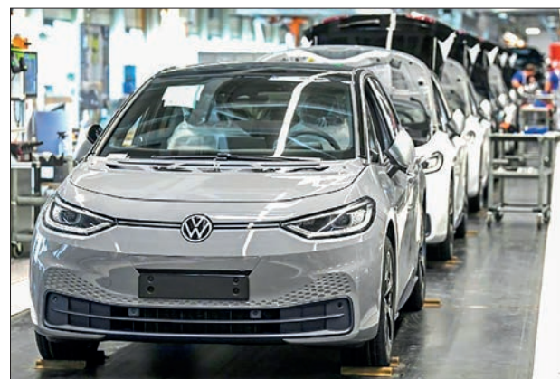
Around 35 Volkswagen electric cars are finished every day at the “Transparent Factory” in Dresden.

Volkswagen is pouring tens of billions of euros into its pivot to electric vehicles. But with the economic outlook less than rosy, chief executive Oliver Blume has pledged to “work hard” on cutting costs to boost performance. — AFP