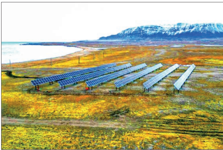
Neatly lined up in six rows in a field, 360 solar panels will on Thursday begin providing electricity to an old shipping radio station, Isfjord Radio, now converted into a base camp for tourists.

NORWAY has installed solar panels in its Svalbard archipelago, a region plunged in round-the-clock darkness all winter, in a pilot project that could help remote Arctic communities transition to green energy.