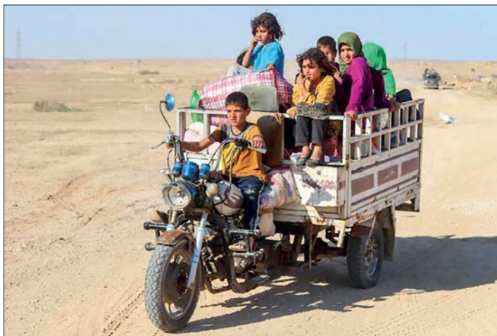
About half of the funding will go to the UN Population Fund (UNFPA) Supplies Partnership to ensure accessible and affordable contraceptives for more women in need in LMICs.

About half of the funding will go to the UN Population Fund (UNFPA) Supplies Partnership to ensure accessible and affordable contraceptives for more women in need in LMICs. The other half will go to Unitaids, an organization saving lives by making new health