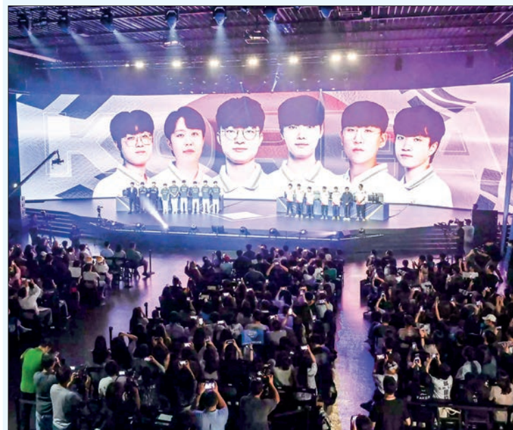
South Korea will be among the favourites to win gold in the eSports events.

K-POP powerhouse BTS didn't get one, star footballer Son Heung-min did: South Korea grants limited exemptions from military service and for the first time eSports players can earn one.