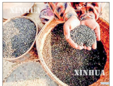
Black gram price rises to more than K2.6 million per tonne