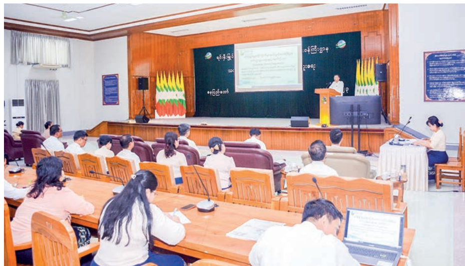
Union Minister Dr Kan Zaw delivers the opening address at the event yesterday in Nay Pyi Taw.

and Industry (UMFCCI) since 2023, March. He pointed out the importance of commercial activities between two countries not only the export and import but also the investment promotion and, the necessary to improve investment promotion and protection and facilitation and, reciprocal protection not only