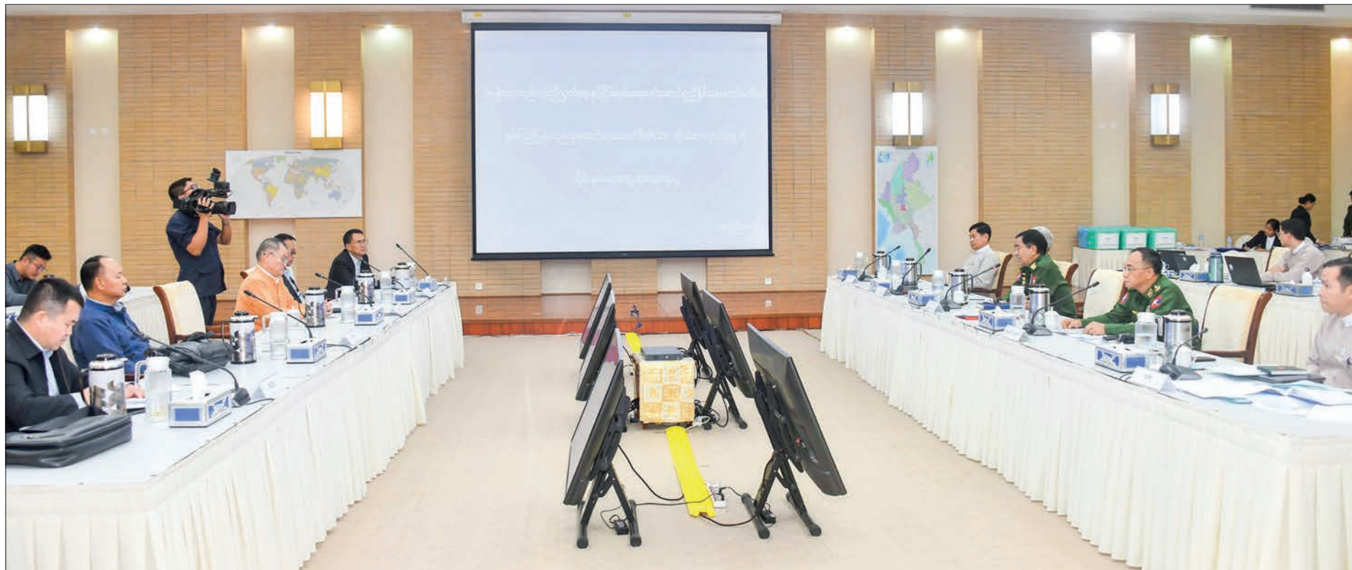
The second and concluding day of the peace talk between the National Solidarity and Peacemaking Negotiation Committee and the Restoration Council of Shan State in progress yesterday in Nay Pyi Taw.