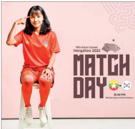
A Myanmar women's team player acts for a match day advert.

Myanmar is placed in Group E together with South Korea, the Philippines and Hong Kong. Team Myanmar will take on Hong Kong in the second group match on 25 September.