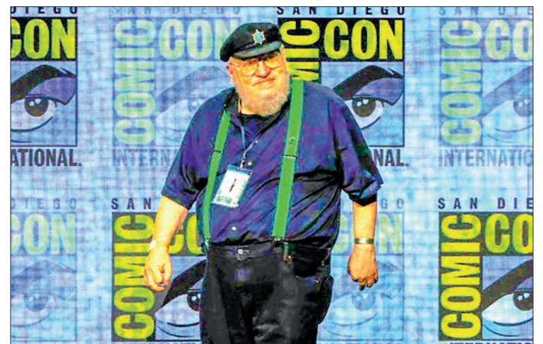
George RR Martin speaks onstage at the “House of the Dragon” panel during 2022 Comic Con International: San Diego at San Diego Convention Center on 23 July 2022 in San Diego, California.

“And at the heart of these algorithms is systematic theft on a massive scale,” said the complaint, filed Tuesday in a New York federal court. — AFP