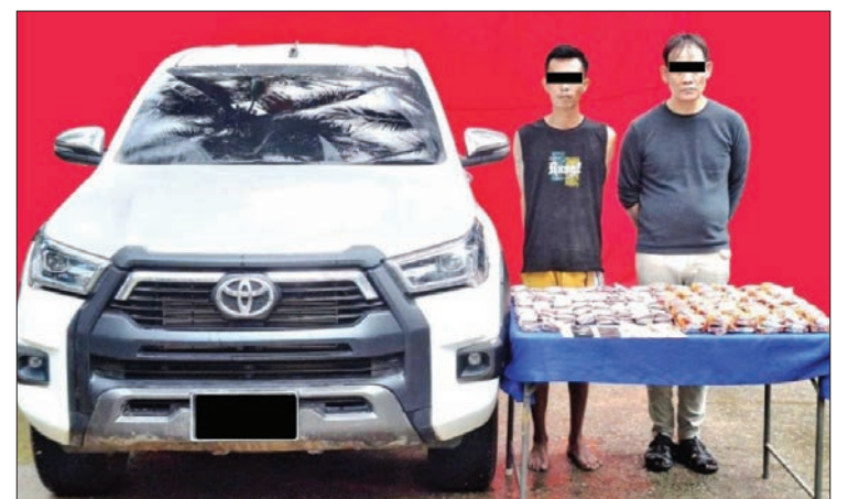
Two offenders are pictured alongside seized drugs and a car.

Police have taken legal action against offenders and an investigation is underway to identify perpetrators of the crime chain.