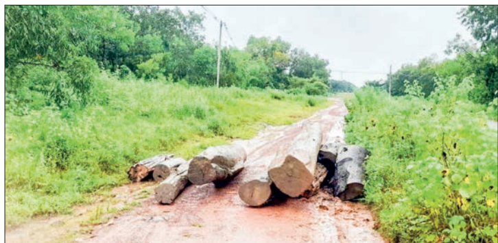
Confiscated illegal teak.

THE combined on-duty teams under the supervision of Mandalay Region Illegal Trade Eradication Task Force captured a Toyota Caldina wagon, three Nissan AD vans and a Toyota Ipsum (approximately K102 million), headed to Lashio from Mandalay, carrying 13 kinds of goods worth K13 million carrying two-deck closet and two dressing tables at the Milepost 15 on Mandalay-PyinOoLwin road and 22 bags of black-sesame with ownerless worth K5.5 million by the side of Shwesayan-Kabyu-Yeywa-Thandaung-Pyinsa road at the 16 th Mile Kyaukchaw checkpoint on 19 September. The action was taken under Customs procedures.