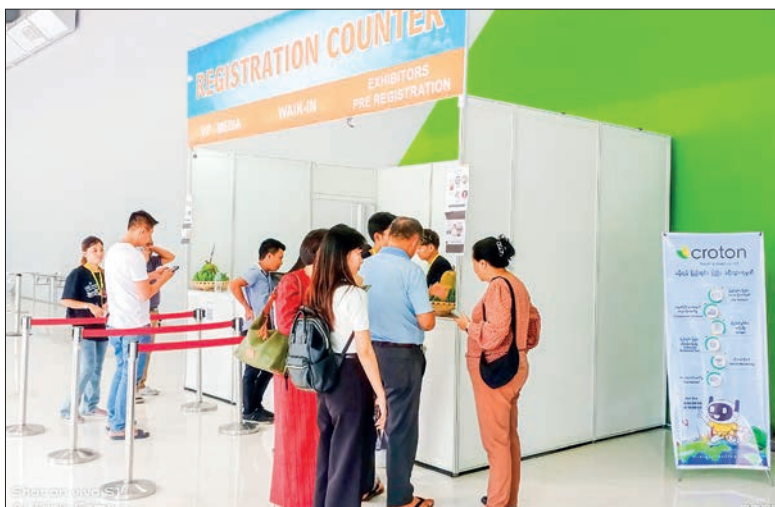
Visitors register for Yangon Travel Fair 2023 held yesterday in hailing World Tourism Day (27 September 2023).

The Let's Go VACS Yangon Travel Fair 2023 will take place at the Yangon Convention Centre in Mayangon Township, Yangon Region, in 2023 to celebrate World Tourism Day. On the morning of 22 September, the Myanmar Trade Fair kicked off, as reported by the Myanmar Exhibitions, Events and Convention Association.