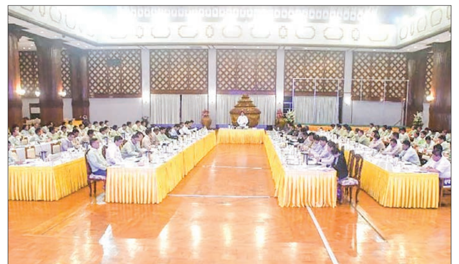
The 4/2023 meeting of Yangon Region Working Committee in progress at Mingala Hall of the Yangon Region government office.

Therefore, the methods to be taken to prevent it from happening again in the future under laws and rules before and after 2012, as mentioned in the 23 tasks, will have to be drafted, and the SOP must be submitted along with the recommendations based on the principles and a review of all the verification results for the current