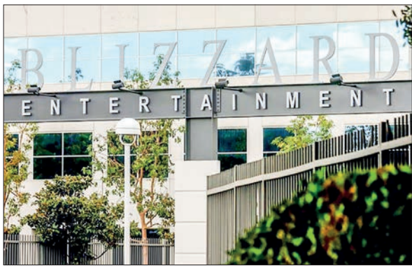
Microsoft's bid for Activision Blizzard has faced intense scrutiny from regulator.

“We presented solutions that we believe fully address the CMA's remaining concerns related to cloud game streaming, and we will continue to work towards earning approval to close” the deal by 18 October. — AFP