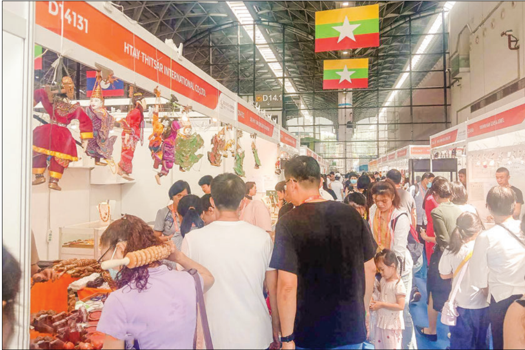
Visitors are seen thronging Myanmar's booths at the 20 th China-ASEAN Expo in Nanning, China.

MYANMAR continues to display its products on the third day of the 20 th China-ASEAN Expo commencing on 16 September in Nanning, the capital of Guangxi Zhuang Autonomous Region, China.