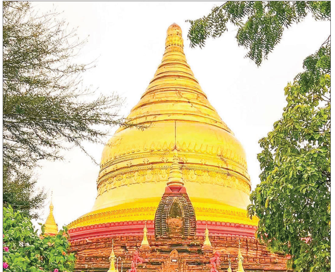
The general view of the Dhammarazake Pagoda in the Bagan Cultural Heritage Zone.