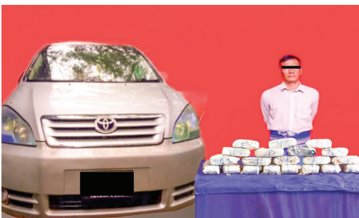
An offender is seen alongside seized stimulant tablets and a vehicle.

Police have taken legal action against offenders and an investigation is underway to identify perpetrators of the crime chain.