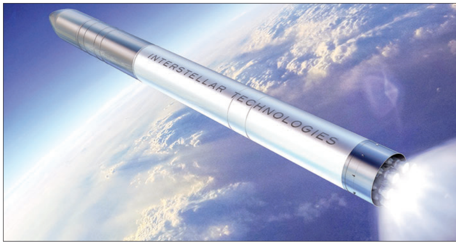
Photo shows an image of Interstellar Technologies Inc rocket "Zero", expected to be fuelled by liquefied biomethane produced by Air Water Inc.

Air Water has been manufacturing liquid biomethane in Hokkaido since 2021. It ferments the dung and urine in a plant constructed on a dairy farm in the town of Taiki before transporting