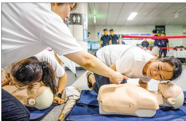
A woman receives CPR training as she practices on a dummy during a civil defence drill against possible artillery attacks by North Korea, in a subway station in Seoul on 23 August 2023.

In research to be presented at a medical conference in Spain this week, but which has not yet been peer-reviewed, a team of Canadian doctors sought to