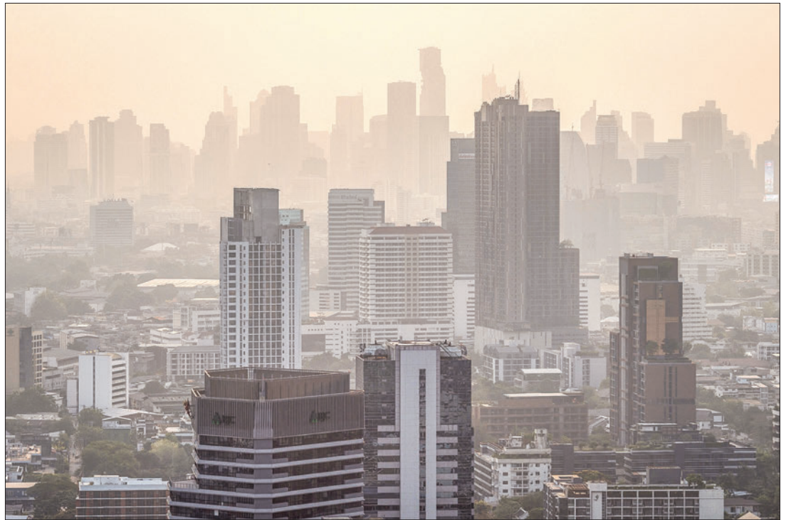
(FILES) This picture shows buildings amid air pollution in Bangkok on 17 April 2023. Thailand must ban stubble burning by farmers to improve air quality, the head of a leading agricultural body said Monday, after a spike in dangerous pollution left millions needing medical treatment.

"The government should ban crop-burning — the method widely used among farm-