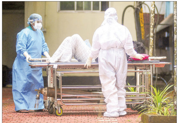
Health workers wearing protective gears shift a man with symptoms of Nipah virus to an isolation ward at a government hospital in Kozhikode in south Indian state of Kerala on 16 September 2023.

This was said to be the fourth outbreak of the deadly virus in Kerala in the past few years. The Indian Council of Medical Research and the World Health Organization found that nine states in India had the probability of Nipah occurrence, the minister added. — Xinhua