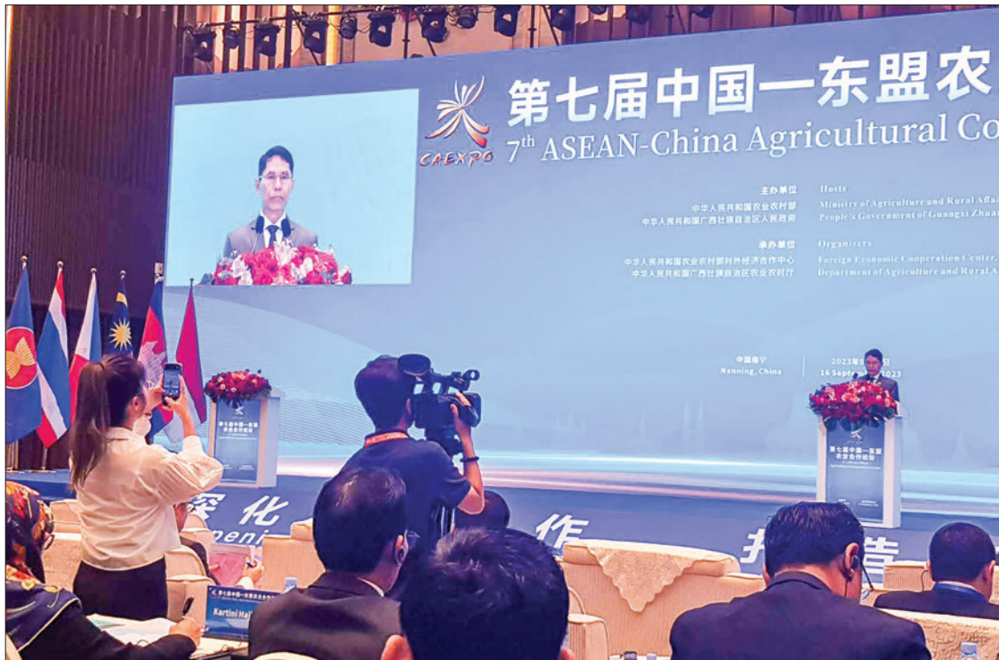
Union Minister U Min Naung delivers the opening address at the seventh ASEAN-China Agricultural Cooperation Forum held in Nanning, China on 16 September 2023.

In his opening speech, the Union minister said that it is a good time for the forum that bring good intentions as it will focus on the prioritized agricultural sectors between the ASEAN and China depending on the challenges and chances after the COVID-19 period. The ASEAN Comprehensive Recovery Framework (ACRF) to address COVID-19 was adopted at the 37 th ASEAN Summit. Of the five broad strategies mentioned in the framework, it should em-