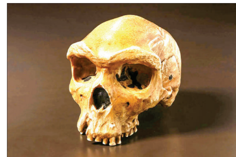
Neanderthals (model pictured here) and modern humans could have spilled from a shared ancestor, a study suggests.

The study, published in the journal Science earlier this month, looked at the genomes of more than 3,150 modern-day humans.