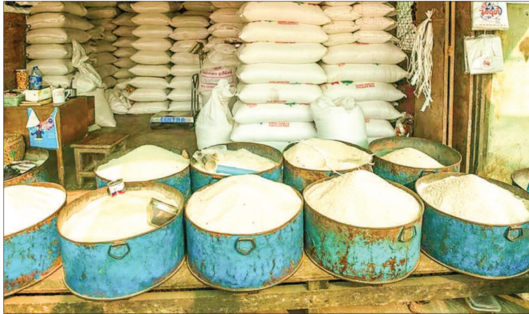
The photo shows a pile of rice sacks and a variety of rice for sale at a rice depot.

Stringent market regulations prevent price increases