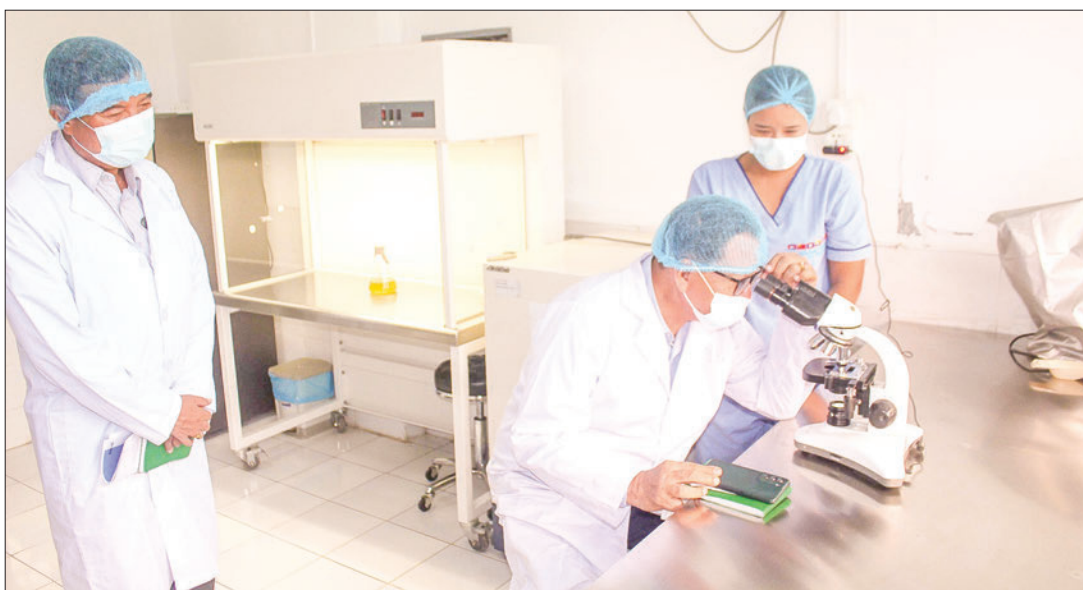
Medical staff are seen working diligently to ensure that animal vaccines meet the required quality standards and are delivered to designated disease control zones.

EFFORTS are being made to maintain the quality of animal vaccines and distribute them based on disease control zones, as per the Ministry of Agriculture, Livestock and Ir-