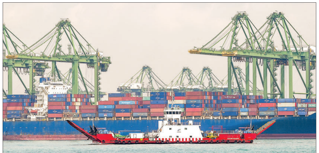
A container vessel prepares to dock at the Pasir Panjang port terminal in Singapore on 30 August 2023.

Singapore's total trade contracted in August 2023, both in exports and imports. On a year-on-year basis, the total trade declined by 15.2 per cent during this period, following the 20.9 per cent contraction in the preceding month. — Xinhua