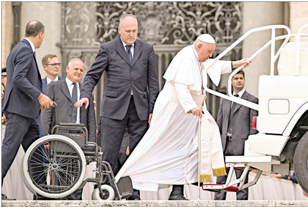
Pope Francis steps into the popemobile at the end of a private audience with Carabinieri's officers at the Vatican on 16 September 2023.

CALLS for compassion for migrants suffering in North Africa and those attempting to reach Europe or die trying will be at the heart of Pope Francis's visit to Marseille this week.