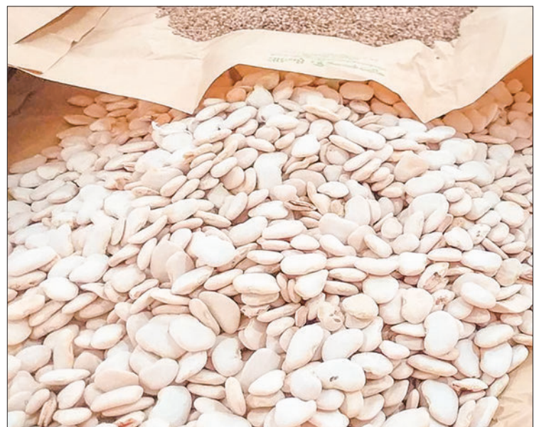
The photo shows a sample of butter beans in the market.

They are commonly grown in the central regions of Myanmar; Minbu, Sinphyukyun and Salin areas in the Magway Region, Mahlaing, Taungtha and Natogyi areas in the Mandalay Region and Gangaw, Kalay, Kallewa, Shwebo and Kabaw Valley in Sagaing Region. — TWA/EM