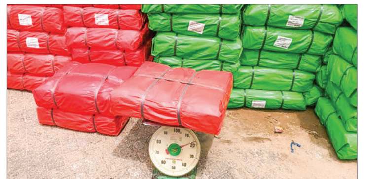
Seizure of illegal items at Asia World Port Terminal container checkpoint.

The Customs on-duty teams conducted inspections on 15 September and nabbed 135 Verage suitcases worth K4,252,500 that exceeded the quantity mentioned in the Import Declaration (ID) from a container at the Myanmar Industrial Port Terminal container checkpoint, 19,000 kilograms of HDPE plastic sheets worth K42.294 million that exceeded the quantity mentioned in the ID from two containers at the Asia World Port Terminal container checkpoint, 1.096 kilograms of spare parts of SIDEL compressor worth K1,131,094 that