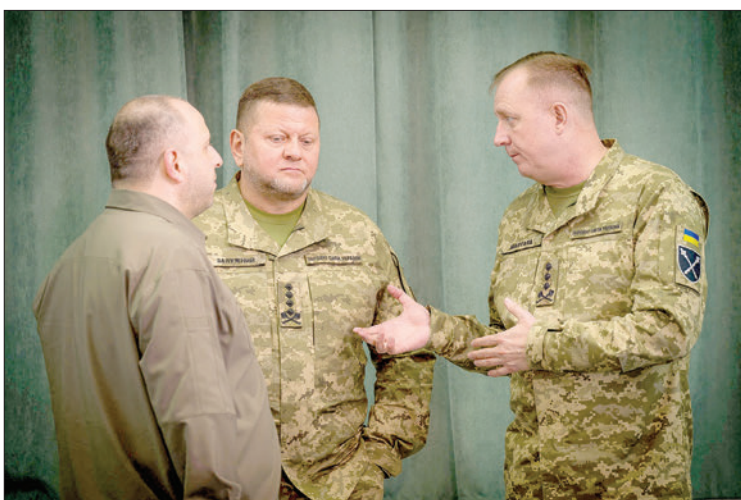
This handout photograph taken and released by the Ukrainian Presidential press service on 7 September 2023 shows Commander-in-Chief of the Armed Forces of Ukraine Valerii Zaluzhnyi (C), Chief of General Staff of the Armed Forces of Ukraine Sergiy Shapoval (R) and Ukraine's new Defence Minister Rustem Umerov (L) during Umerov's official introducing to the leadership of the Ministry of Defence of Ukraine, the General Staff of the Armed Forces of Ukraine and the heads of relevant units.

THE Ukrainian government dismissed all six deputy defence ministers and the state secretary of the Defence Ministry, said Taras Melnychuk, the cabinet's representative in the parliament, on Monday.