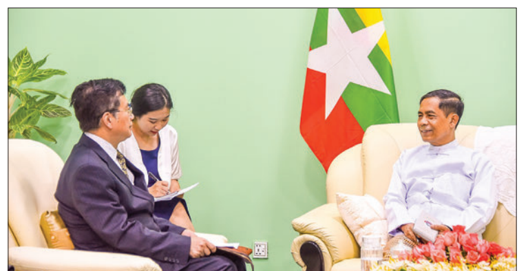
Union Minister U Ko Ko Hlaing receives the Chinese Special Envoy for Asian Affairs yesterday in Nay Pyi Taw.

they cordially discussed and exchanged views on the enhancement of friendly relations and bilateral cooperation between the two countries, repatriation of the displaced people from Rakhine State, the progress of peace implementation including the 8 th anniversary of signing the NCA and the humanitarian assistance in Myanmar. — MNA