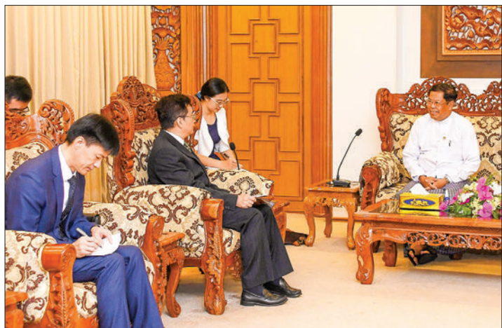
PRC Special Envoy for Asian Affairs Mr Deng Xijun calls on Union Minister U Than SWE yesterday in Nay Pyi Taw.

DEPUTY Prime Minister and Union Minister for Foreign Affairs U Than SWE received Mr Deng Xijun, Special Envoy for Asian Affairs of the Ministry of Foreign Affairs of the People's Republic of China, in Nay Pyi Taw yesterday.