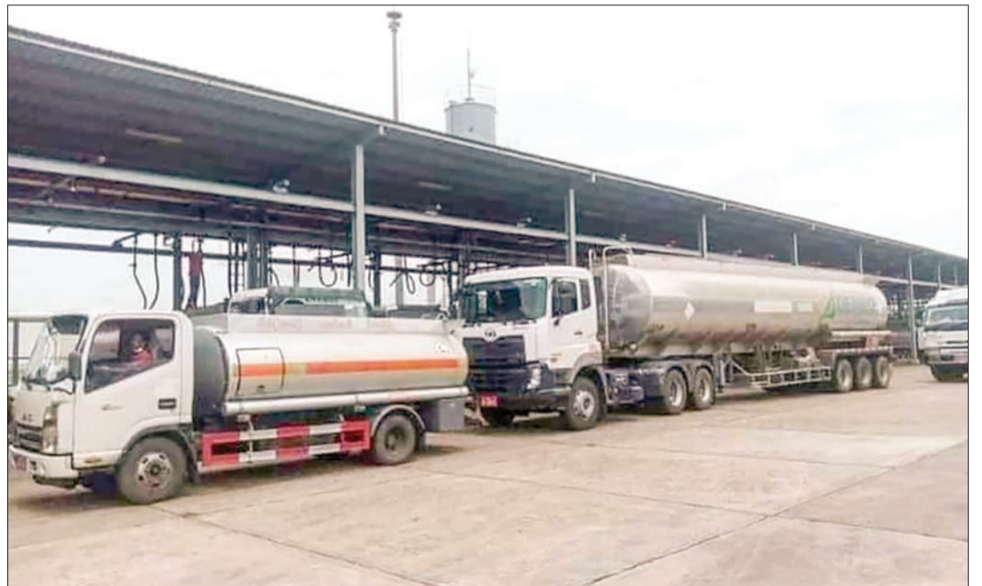
Bowsers are seen for fuel distribution in the market.

Truck owner profits and diesel prices display an inverse relationship.