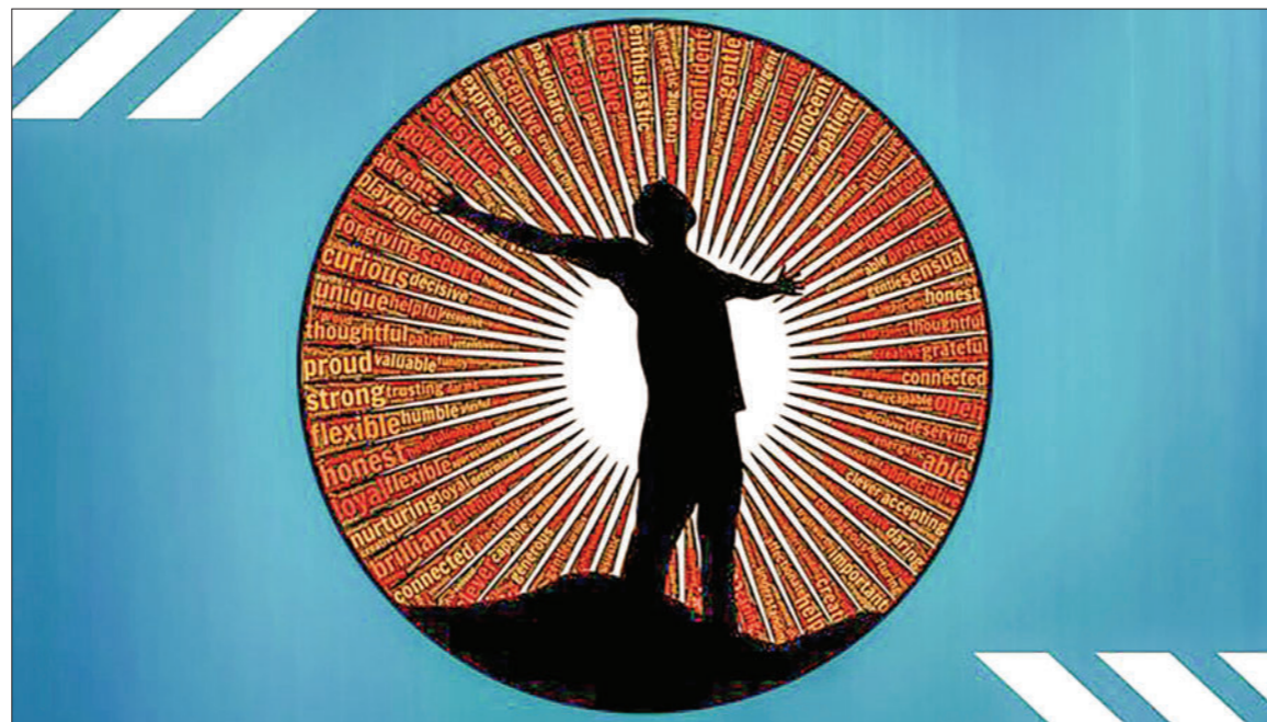
Personal management involves creating a life plan with clear short-term and long-term goals.

Personal management means using time tools to plan your day, stay organized, and reduce stress. Old ways of managing stress will still help us in personal growth.