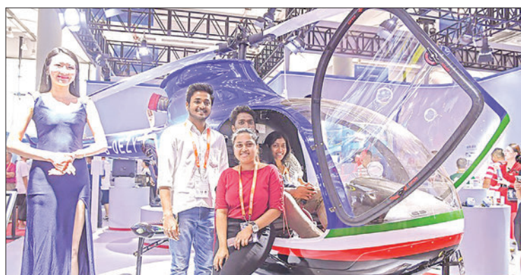
A helicopter is displayed during the 20 th China-ASEAN Expo at Nanning International Convention and Exhibition Centre in Nanning, capital of south China's Guangxi Zhuang Autonomous Region, 17 September 2023.

"The RCEP will promote a stronger tourism economic cycle, and its member countries will develop into important international tourist destinations with more than one-third of international tourist flows and consumption," Jin said. — Xinhua