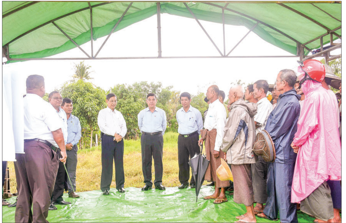
One of the SAC members views development measures and meets locals in Thandwe, Rakhine State yesterday.