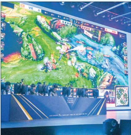
This picture taken on 11 September 2023 shows eSports League of Legends South Korean (L) and Vietnamese (R) national teams playing a friendly match ahead of the upcoming Asian Games in Gwangmyeong.

He recalled how his father would beat him for sneaking off to play video games.