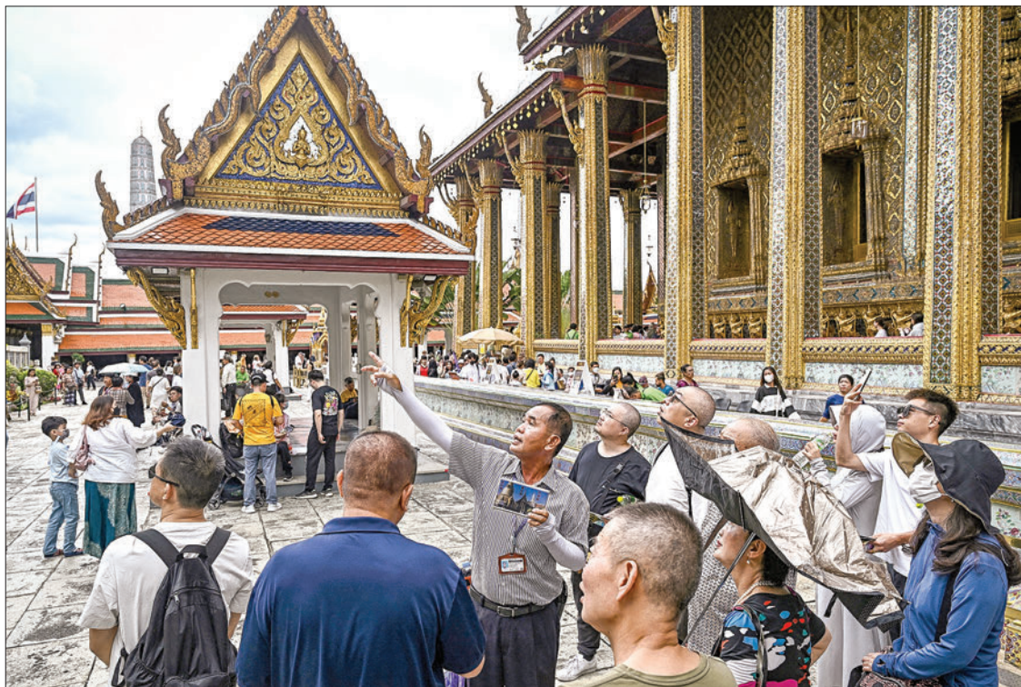
This picture taken on 10 September 2023 shows a Thai tour guide (C) along with a group of Chinese tourists inside the Grand Palace in Bangkok.

According to Jin Zhun, secretary general of the CASS tourism research centre, open and sound international economic