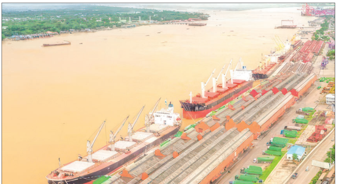
Cargo ships are seen berthing alongside the port terminals in Yangon River.

Thailand has been Myanmar's largest trade partner among regional countries, with trade valued at over $2.38 billion, followed by Singapore ($1.35 billion), Malaysia (over $495.889 million) and Indonesia ($457.866 million). Viet Nam has emerged