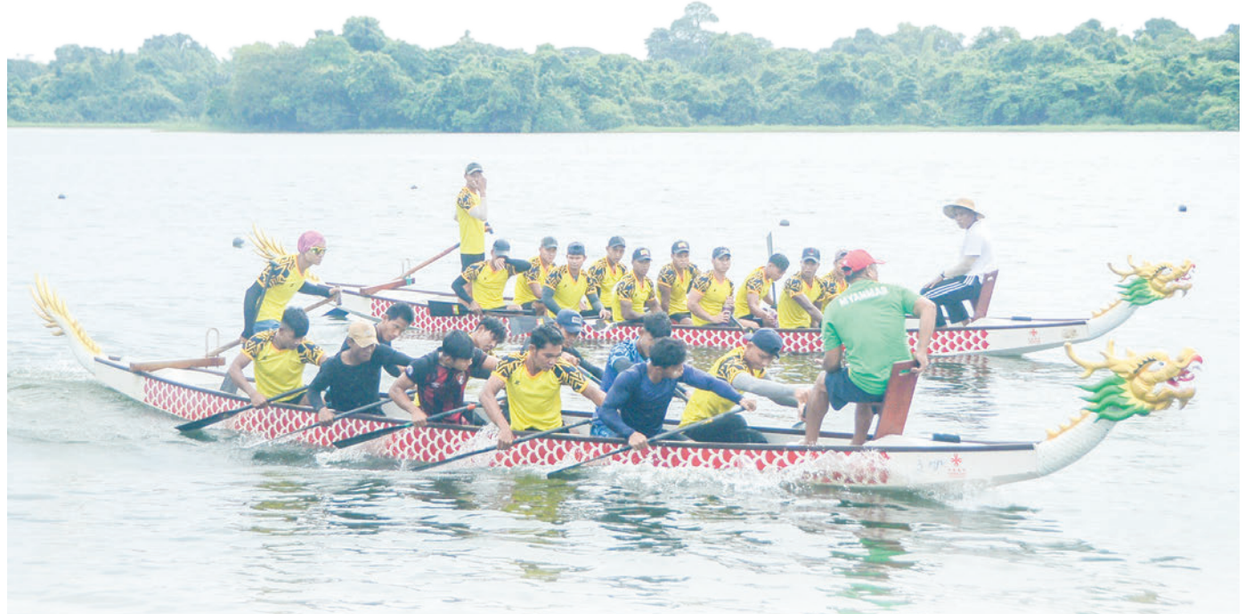
Myanmar rowing teams undergo training for XIX Asian Games.

Prajapati's tale is a familiar one among gamers from different countries. — AFP