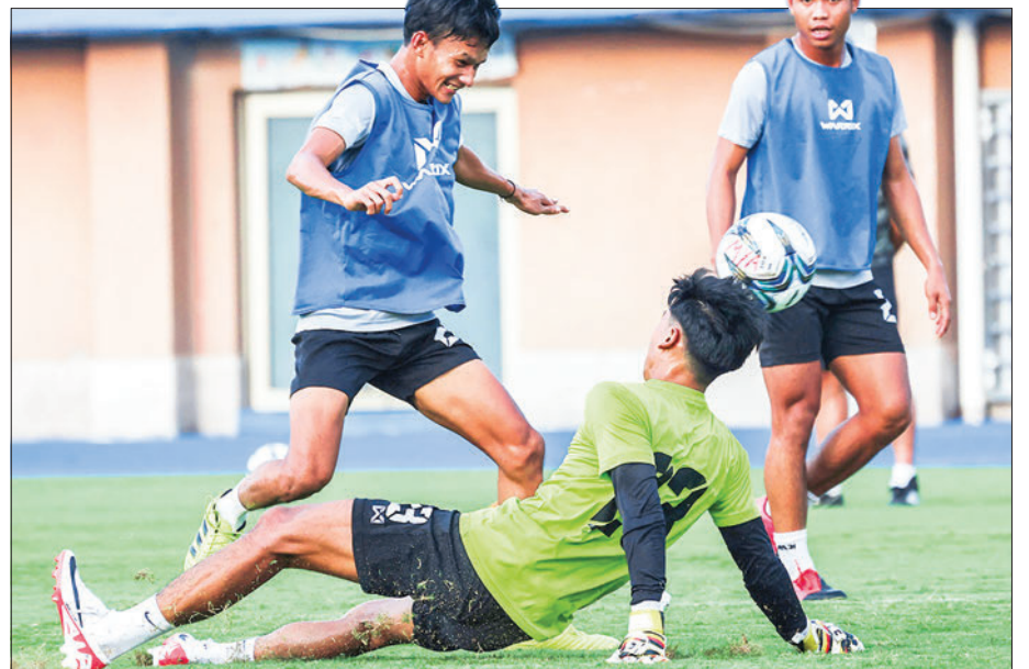
Players of Myanmar men's national football team are seen at the training camp.

two top teams from each group and four best third-placed teams, totalling 16 will have the chance to sail into the knockout stage. — Ko Nyi Lay/TTA