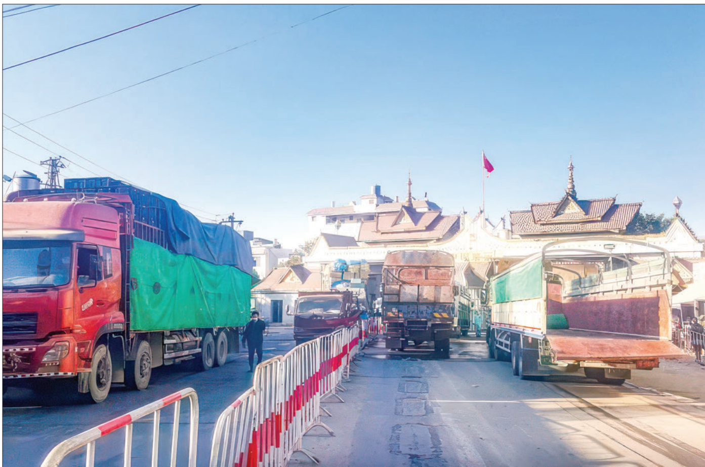
The photo shows the Mang Wein border post in Muse which is the major point for the Sino-Myanmar border trade.

The figure indicated a sharp increase of US$698 million this FY compared to that registered in the year-ago period.