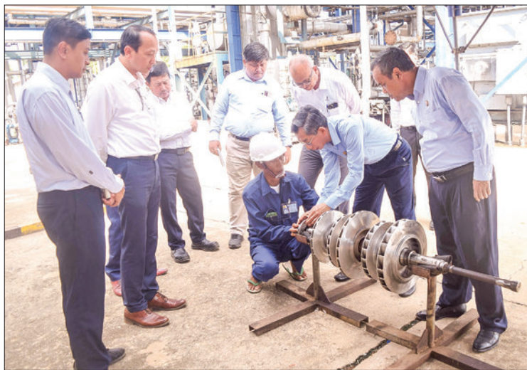
Union Minister U Ko Ko Lwin inspects the preparatory work for increasing production of oil and gas at No 1 LNG Plant (Minbu).

Bagan. There was a significant amount of water, although the rainfall duration was not long. One-fourth of the moat was filled with water. The water flowed directly into the tanks without pooling on the floors of the Ananda Temple and the Shwezigon Temple. The walls of the Culamani Temple were not waterlogged as the water flowed into the drains through the original water outlets,” said U Kyaw Myo Win. — ASH/MKKS