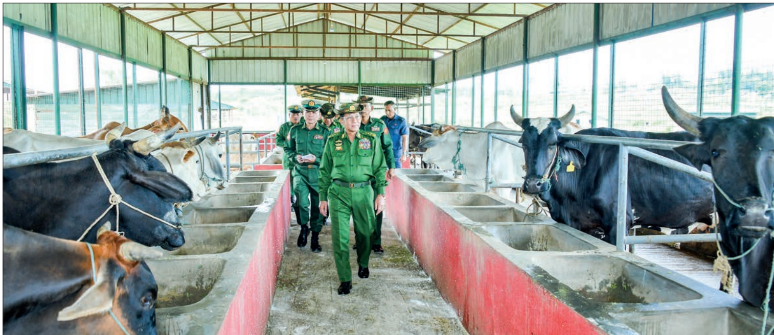
Chairman of the State Administration Council Commander-in-Chief of Defence Services Senior General Min Aung Hlaing observes functions of No 1 Highland Agriculture and Livestock Camp of North-East Command yesterday.

The Senior General notified that Shan State (North) which is sharing border with neighbour China, managing the trade of export and import measures