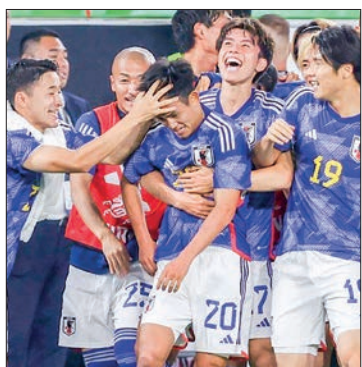
Japan players celebrate scoring in their victory against Germany.

JAPAN coach Hajime Moriyasu watched his side achieve a stunning 4-1 win over Germany on Saturday and then said they "still need to improve" before the Asian Cup next year.