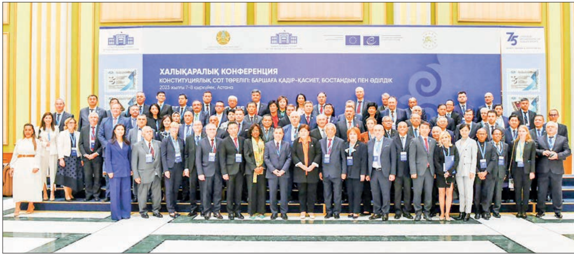
Participants including Constitutional Tribunal of the Union member U Kyaw San of Myanmar pose for documentary photo during the international conference in Astana, Kazakhstan.

AT the invitation of Ms Elvira Azimova, President of the Constitutional Court of the Republic of Kazakhstan, a delegation led by U Kyaw San, a member of the Constitutional Tribunal of the Union, attended the international conference on “Constitutional Justice: Dig-