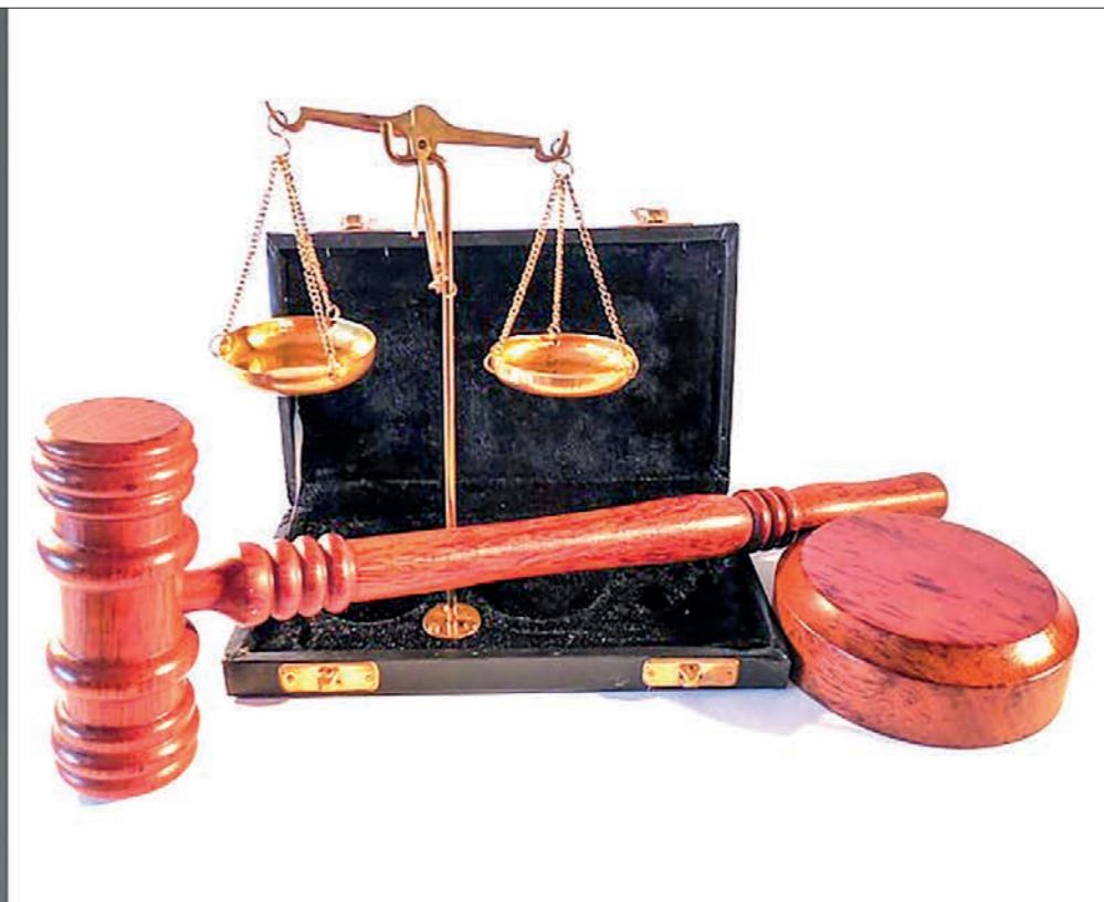
Trump can run for president even if he is convicted because the US Constitution imposes minimal eligibility requirements, and there are no limitations on candidacy based on character or criminal records for federal offices.

immune from prosecution because the payments were made while he was president. "Reimbursing Cohen for advancing hush money to Stephanie Clifford cannot be considered the performance of a constitutional duty". "Falsifying business records to hide such reimbursement, and to transform the reimbursement into a business expense for Trump and income to Cohen, likewise does not relate to a presidential duty."