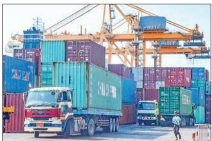
Myanmar's foreign trade soars past US$13 bln in last five months