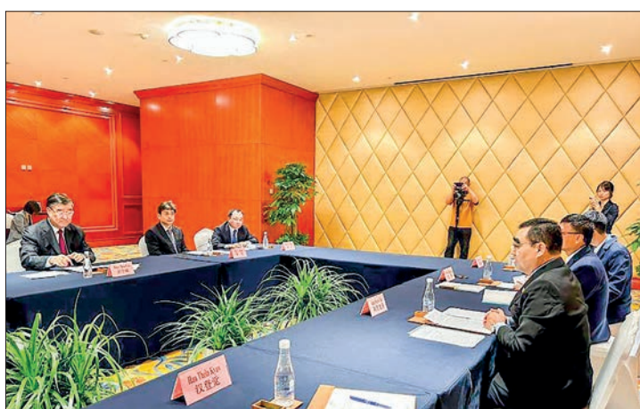
Deputy Minister U Aung Kyaw Tun meets Vice Minister of the Ministry of Water Resources of China Mr Tian Xuebin yesterday on the sidelines of the 3 rd Mekong-Lancang Water Resources Cooperation Forum in Beijing, China.

The Deputy Minister delivered an address at the forum. The members of Myanmar delegation also participated in the discussions of the two Thematic Sessions. The Recommendations of the 3 rd Mekong-Lancang Water Resources