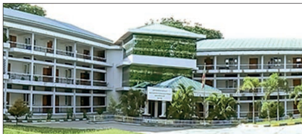
Mandalay Electricity Supply Corporation Office.

The awareness activities of the Zero-Burn, Zero-Waste programme will help reduce carbon dioxide emissions and air pollution, increase crop yields, and create land for long-term cultivation. — TWA/CT