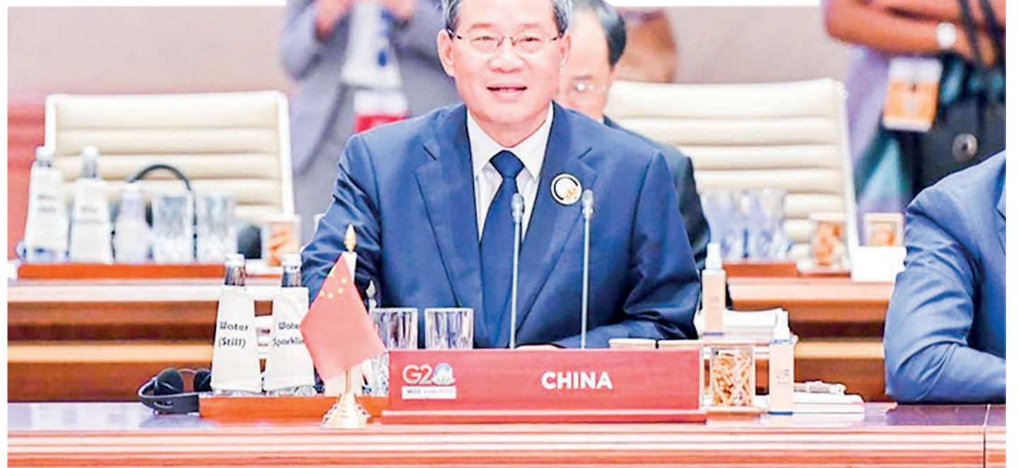
Chinese Premier Li Qiang addresses the third session of the 18 th G20 Summit in New Delhi, India, 10 September 2023.

lenges to long-term growth,” the group warned, stressing that G20 cooperation is essential in determining the course the world takes.