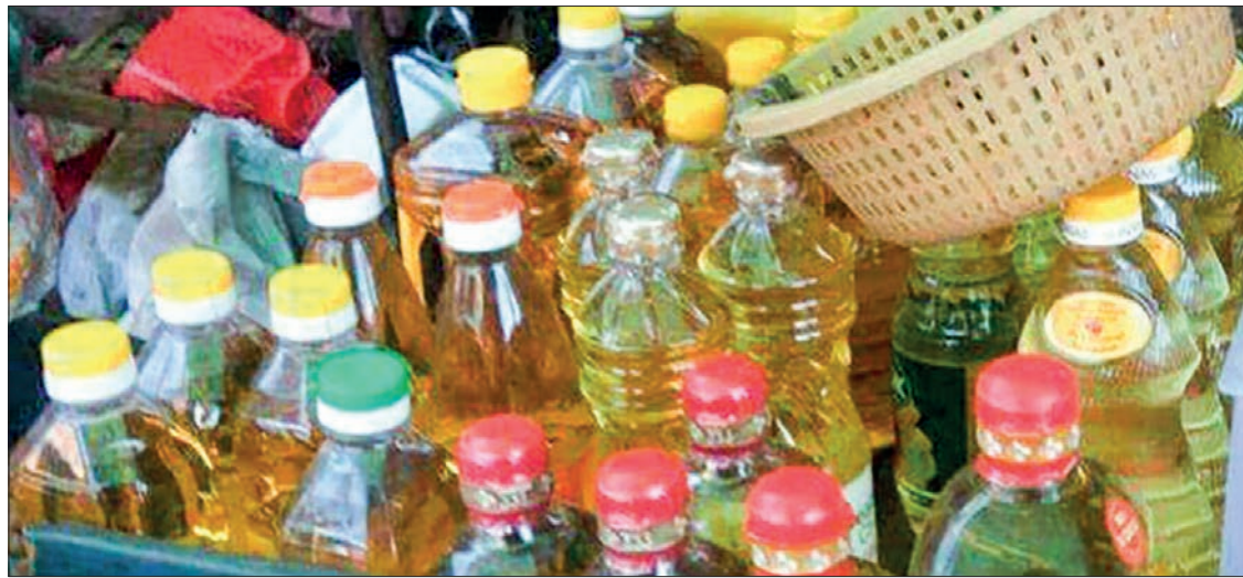
Some adulterated oils that cannot be identified are found in the market.

at K4,500 per viss for palm oil and K16,000 per viss for peanut oil in the Yangon market.