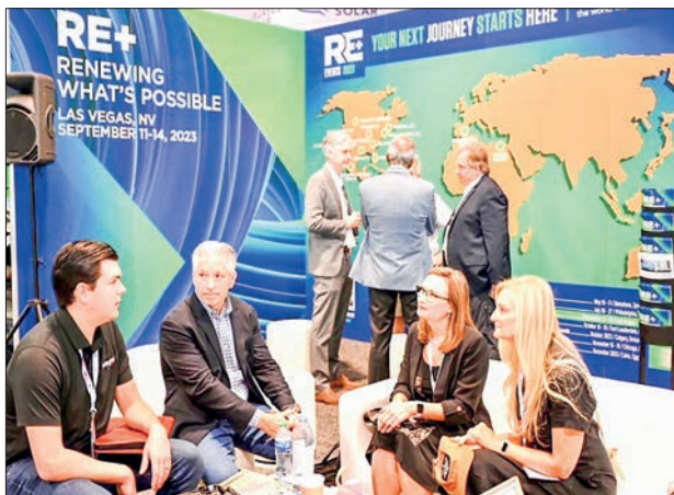
This photo is exhibited on the official website of RE+ 2023 to illustrate the theme and scope of the leading clean energy show in North America.

One proposed project would link railway and port facilities across the Middle East — including the United Arab Emirates, Saudi Arabia, Jordan and Israel — potentially speeding trade between India and Europe by up to 40 per cent. — AFP