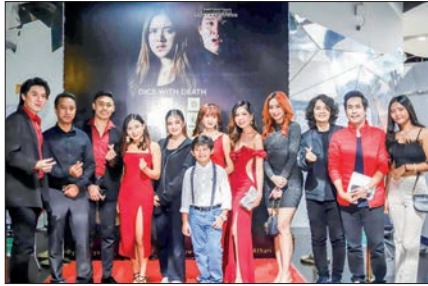
Premiere of 'Dice with Death' film captivates audiences