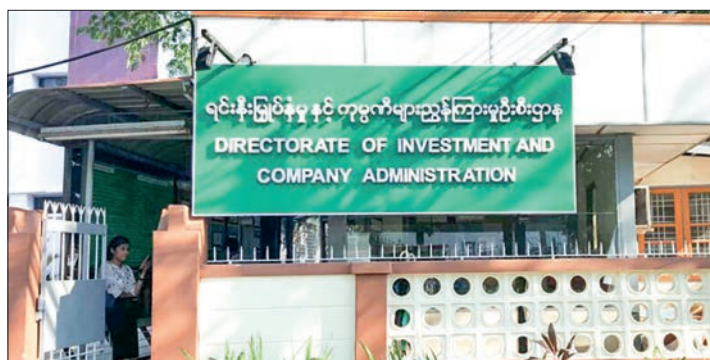
The office of the Directorate of Investment and Company Administration-DICA in Yangon.

If a company fails to restore its status within six months of suspension, the registrar will strike its name off the register, according to the DICA notice. — NN/EM