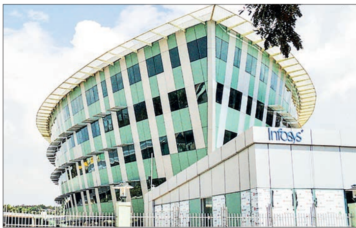
Infosys is an Indian multinational information technology and consulting company, often referred to as an “IT giant”.

“THERE is a lot of hard work” to do before the UK strikes a trade deal with India, Prime Minister Rishi Sunak said