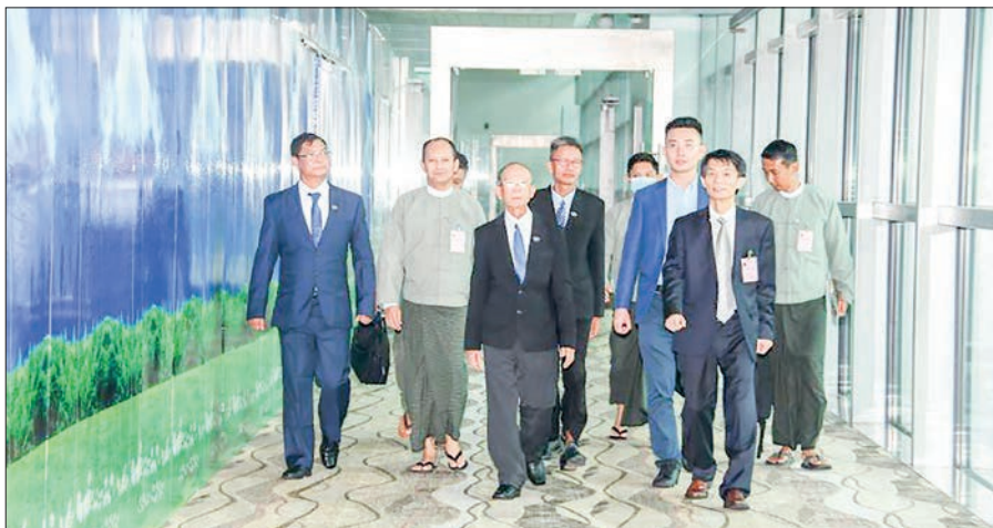
The delegation of Union Election Commission is seen at Yangon International Airport before departing Yangon for the People’s Republic of China yesterday.

Moreover, both sides will have the chance to exchange views on development undertakings of CPC and ways of development process, and establishment of the party. The study tour will last from 10 to 16 September. — MNA/KZL