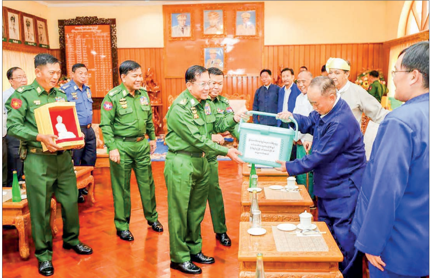
Chairman of the State Administration Council Commander-in-Chief of Defence Services Senior General Min Aung Hlaing presents foodstuffs to a people's militia leader on 10 September 2023.