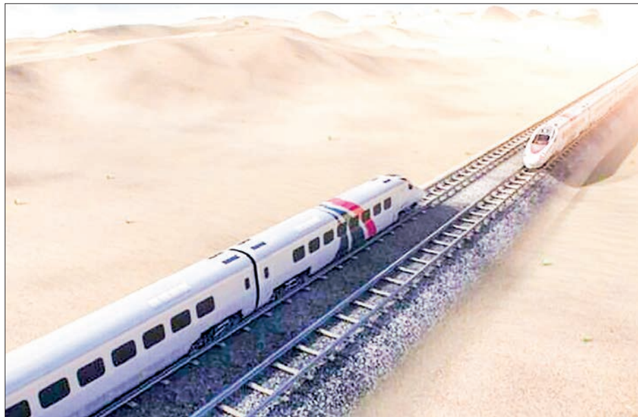
Etihaad Rail trains chug across the United Arab Emirates.

EUROPE, the Middle East and India will on Saturday unveil plans to create a modern-day Spice Route, boosting trade ties with potentially wide-ranging geopolitical implications.