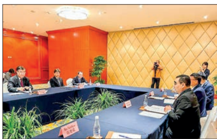
Deputy T&C Minister joins 3 rd Mekong-Lancang Water Resources Cooperation Forum in China