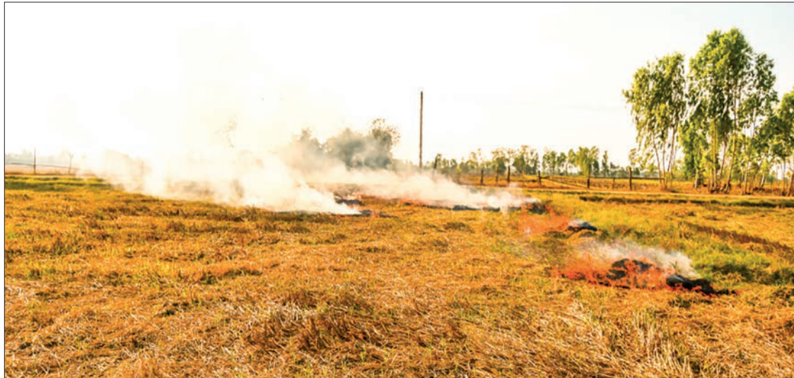
The stubble left after harvesting summer paddy is seen burning in the fields.

As Myanmar relies on agricultural sector, it needs to educate the people not to burn