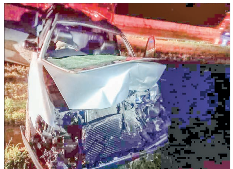
An accident occurred between 110/2 and 110/3 mileposts on Yangon-Mandalay Expressway on 9 September.

In January, eight people were killed and 13 wounded in 13 accidents, while 11 were killed and 15 injured in 12 accidents in February, 11 were killed and 15 injured in 15 accidents in March, 14 people were killed and 36 wounded in 20 accidents in April, six people died with 29 being injured in 16 accidents in May, three people were killed and eight were wounded in seven accidents in June, seven people were dead and 16 injured in 14