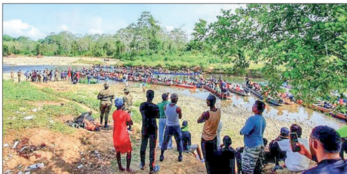
In 2023, over 348,000 migrants, primarily Venezuelans, have crossed the perilous Darien jungle, surpassing the total recorded for the entire year of 2022, which was 248,000.

Last month, between 2,500 and 3,000 migrants per day entered Panama from Colombia on average, compelling the