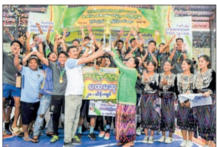
Cooperation needed for economic development of country in addition to restoring stability, peace, and rule of law