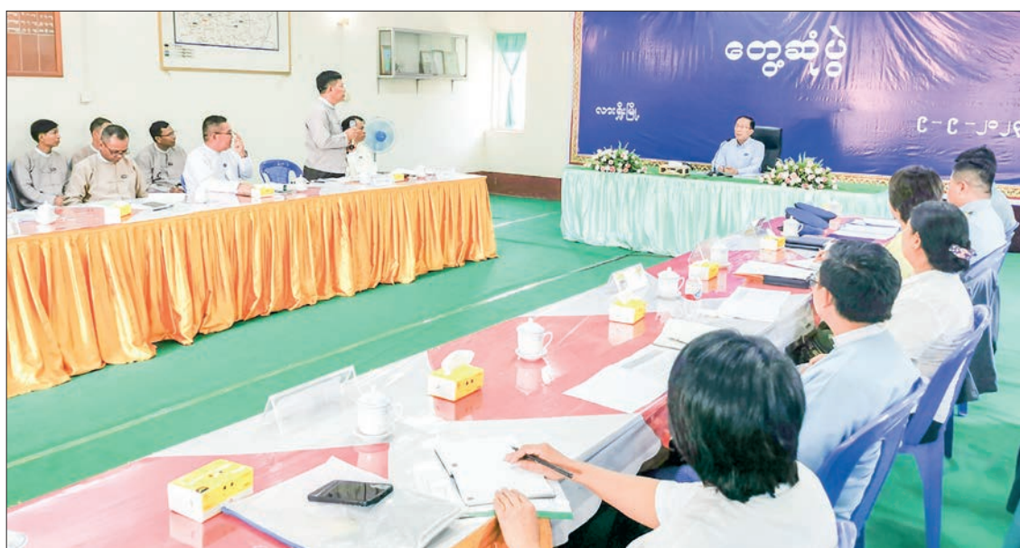
Deputy Prime Minister Union Planning and Finance Minister U Win Shein hosts the meeting with employees of departments under the Ministry from Shan State (North) on 9 September.

Later, the Deputy Prime Minister coordinated the employees' submissions. — MNA/CT