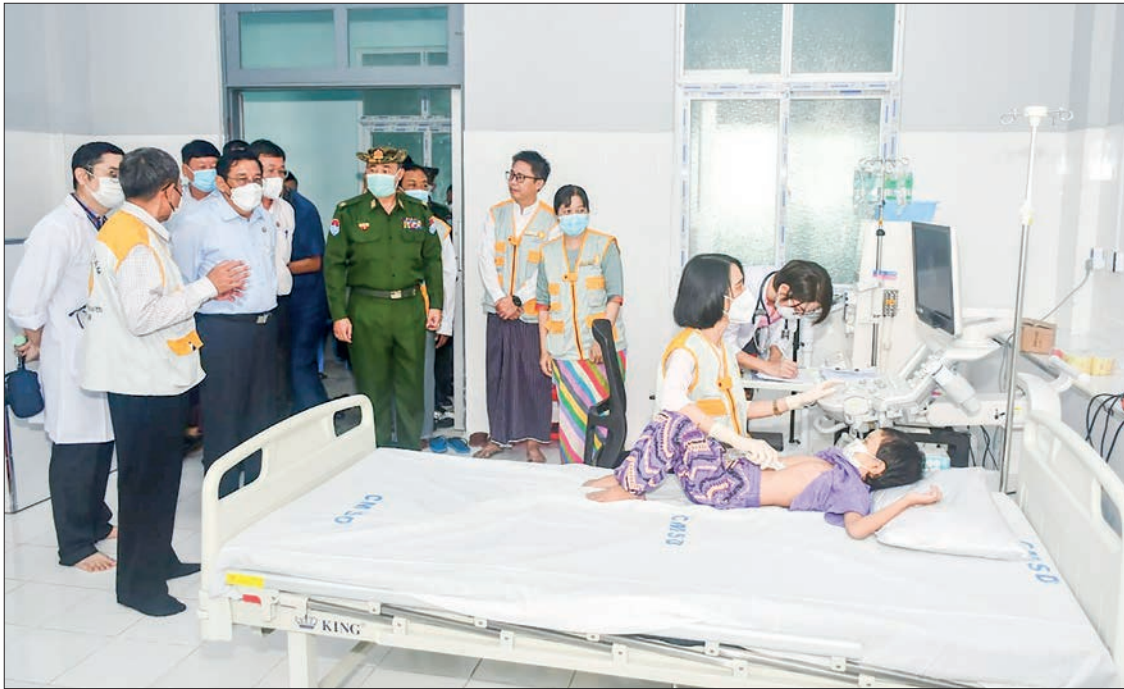
A child receives treatment by specialist medical team with echocardiography in Myeik, Taninthayi Region.

A medical team consisting of specialists from general hospitals in Yangon went to Myeik, Taninthayi Region on 9 and 10 September under the arrangements of the Ministry of Health and provided medical treatment to local residents together with specialists from Myeik General Hospital.