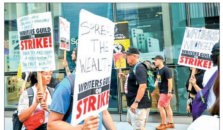
An ongoing strike by actors and writers gripping Hollywood is being credited with increased interest in unionizing by behind-the-scenes workers at film and video game studios.

long-standing dispute and opens a new chapter of bilateral cooperation that will deepen the trade relationship between the United States and India,” said the US Trade Representative’s (USTR) office. — AFP