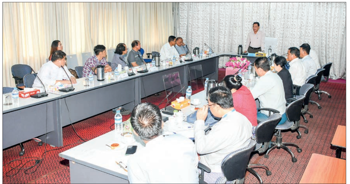
Union Minister for Information U Maung Maung Ohn meets officials of Myanmar Music Association (Central) at Myanmar Radio and Television on Pyay Road, Yangon, yesterday.

Temporary chairman U Lwin Myint and the attendees reported on preparations for forming the association with new generation artistes, raising the fund and property rights of artistes.