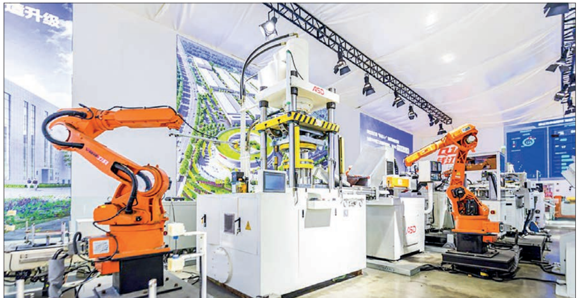
This photo taken on 27 April 2023 shows an automatic production line at a factory of Zhejiang Aishida Co., Ltd. in Wenling, east China’s Zhejiang Province.

summit in place of President Xi Jinping, also held talks Satur-