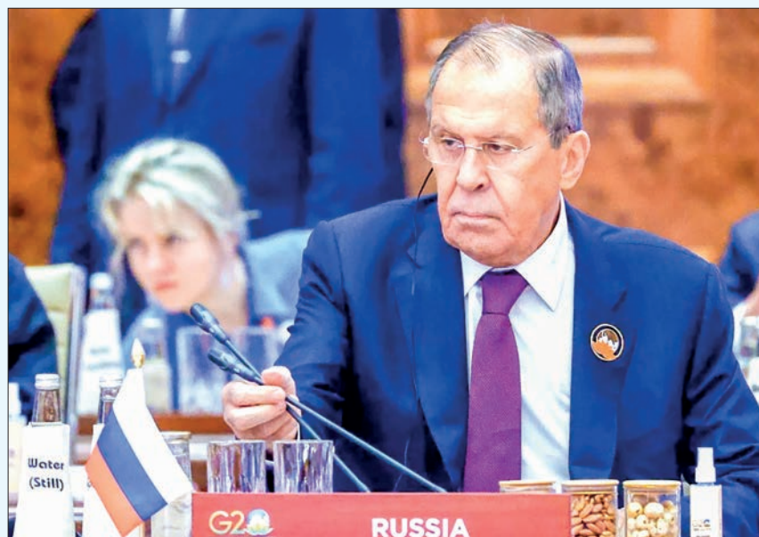
Russian Foreign Minister Sergey Lavrov said that Western countries failed to “Ukrainianize” the agenda of the G20 summit.

The G20 leaders’ summit in New Delhi has become a success, while the Group is undergoing an internal reform, Russian Foreign Minister Sergey Lavrov said on Sunday.