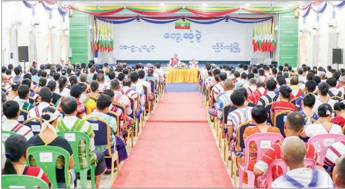
State Administration Council Member Mahn Nyein Maung meets local people, political parties and organizations at Aung San Hall, Hlaingbwe Township, Kayin State to explain the arrangements for free and fair multiparty general elections, aspirations for peace and changes in political landscape, on 10 September.