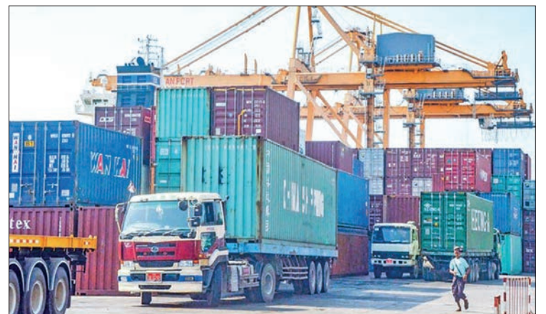
Containers to be exported to foreign markets are seen at the Port.