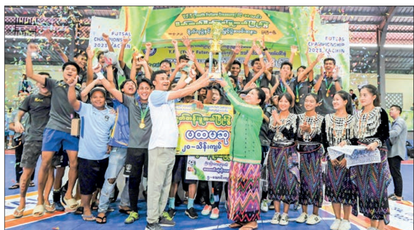
The awarding event of Men's Futsal Championship in the state in progress in Myitkyina, Kachin State yesterday.

STATE Administration Council Member Daw Dwe Bu, on her inspection tour, said that it is necessary to work together for the development of the economic sector in addition to restoring the country's stability, peace, and rule of law, and that religious needs are being met as best as possible at the meeting with priests and teaching pastors from various Christian churches at the St Columban's Cathedral in Aungnan Ward, Myitkyina, on 10 September.