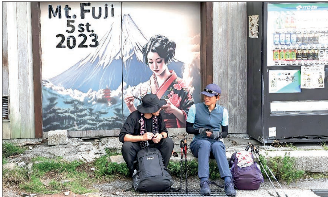
In 2013 UNESCO added the "internationally recognized icon of Japan" to its World Heritage List.

Visitor numbers more than doubled between 2012 and 2019