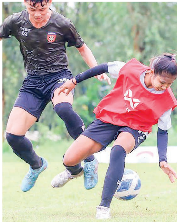
Myanmar women player (red) vies for the ball against men player during a previous domestic friendly match.