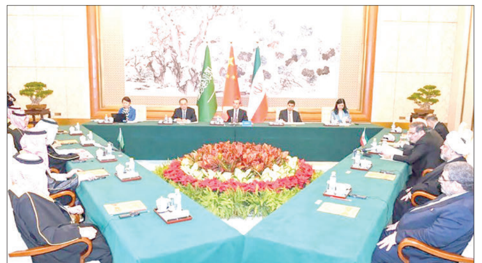
Wang Yi, a member of the Political Bureau of the Communist Party of China (CPC) Central Committee and director of the Office of the Foreign Affairs Commission of the CPC Central Committee, presides over the closing meeting of the talks between a Saudi delegation and an Iranian delegation in Beijing, capital of China, 10 March 2023.

The regional powers reached a China-brokered agreement in March to reopen their embassies. The move blindsided Israel, which has been seeking a normalization pact of its own with Saudi Arabia in an effort to isolate its arch-rival Iran. — SPUTNIK