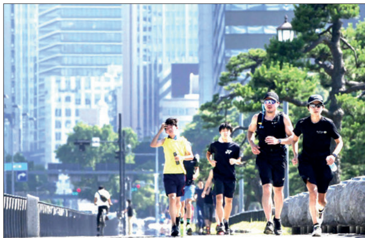
File photo taken in June 2022 shows people jogging around the Imperial Palace in Tokyo.

Among them, 85.1 per cent said they are continuing to exercise, with the most popular sports being walking, jogging and running, followed by cycling and golf.