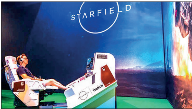
The Starfield game being played at the Xbox booth at the Gamescom conference in Cologne last month.

“STARFIELD”, one of the most-anticipated video games in years, launches worldwide on Wednesday with the hype — and production standards — of a Hollywood blockbuster.