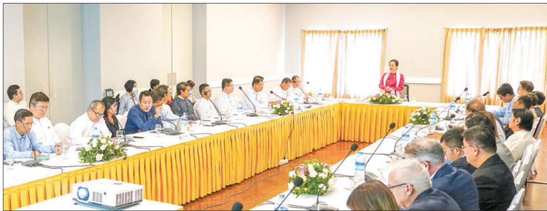
The meeting between Union Minister for Hotels and Tourism Dr Thet Thet Khine and officials from hotel and tourism associations and the Foreign Investment Hotel Operators Association in progress at Inya Lake Hotel in Yangon yesterday.