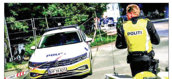
In Christiania, soft drugs are officially illegal but tolerated, which has led to problems with criminal gangs.

in 1971, have said they want to close down the drug dealing there and have appealed to the Danish authorities for help. — AFP