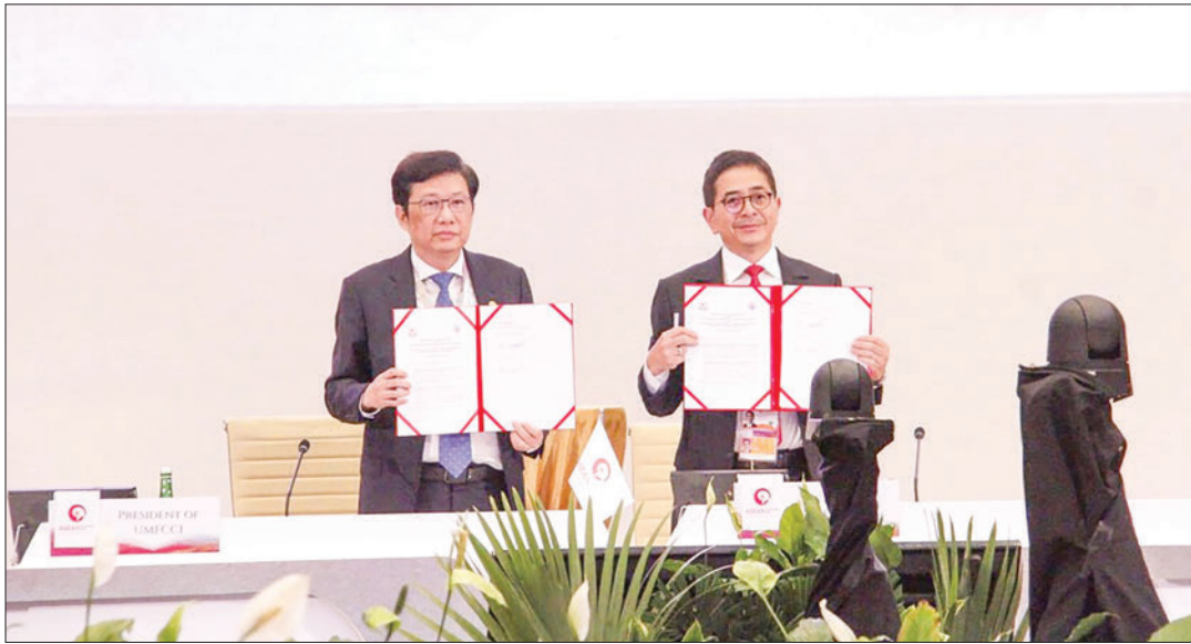
The Memorandum of Understanding Signing Event between the Union of Myanmar Federation of Chambers of Commerce and Industry (UMFCCI) and the Indonesian Chamber of Commerce and Industry (KADIN) in progress in Jakarta, Indonesia, on 5 September.