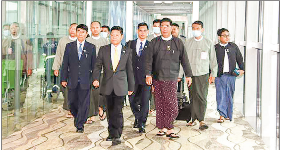
Union Election Commission Chairman U Thein Soe leaves for the Russian Federation on 6 September 2023.

The delegation will also aim to promote cooperation in electoral activities between the two countries, election procedures, the voting process and the counting process during their study tours from 6 to 12 September. — MNA/TS