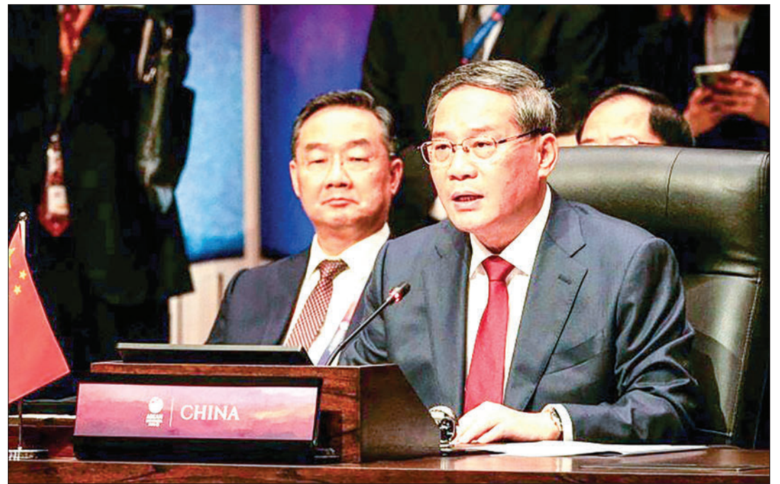
China's Premier Li Qiang (R) said it was essential 'to oppose a new Cold War'.

Emphasizing that facing problems head-on is essential for finding solutions and that avoiding or ignoring issues will only exacerbate the situation.