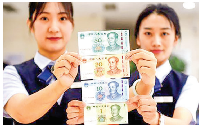
Girls show notes of Chinese currency – yuan. Only yuan is allowed for border trade between Myanmar and China.

Currently, only yuan is allowed for border trade between Myanmar and China. It must submit the bank statement for buying yuan whether it is from export earnings or local banks when applying for the import licences. — ASH/KTZH