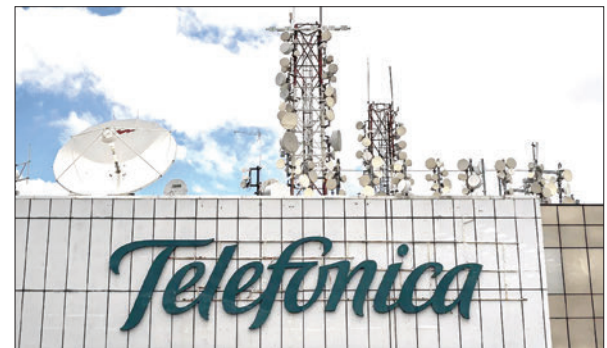
Telefonica, SA is a Spanish multinational telecommunications company headquartered in Madrid, Spain.

executives. The new model has fully reclining rear seats, an improved audio system and rear doors that open 75 degrees to ensure ease of entry and exit, according to Toyota. — Kyodo