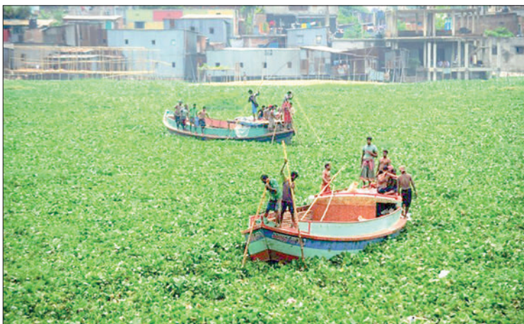
Water hyacinths have clogged waterways across the world. PHOTO: AFP/FILE

That number is trending sharply upward, along with the bill for the damage multiplying fourfold per decade, on average, since 1970. — AFP