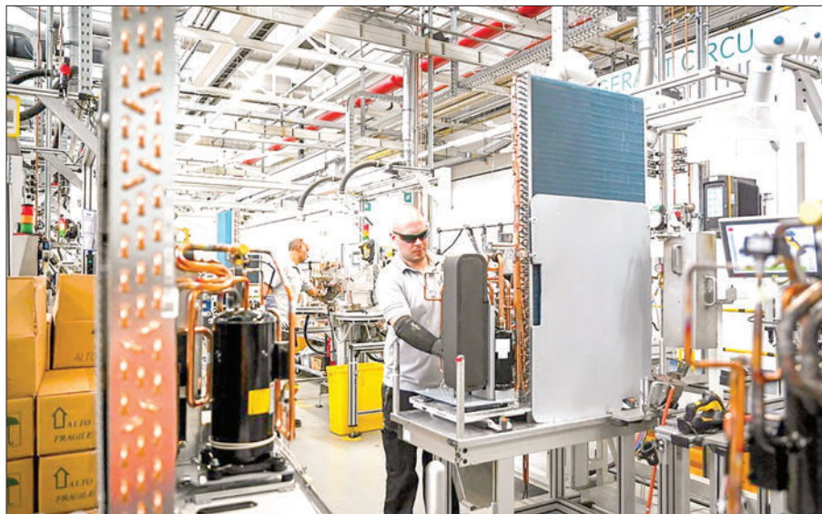
Employees manufacture the cooling unit for an air-to-water heat pump at the headquarters of the heating technology company Vaillant Group in Remscheid, Germany, on 20 July 2023.

GERMAN factory orders fell more than expected in July, official data showed Wednesday, in the latest setback for Europe's largest economy as it grapples with