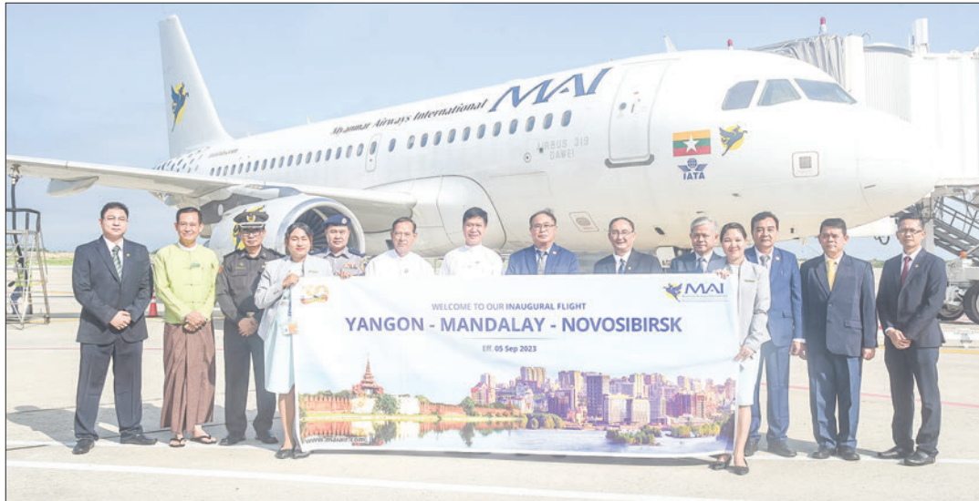
Officials of Mandalay Region cordially meet flight passengers from Myanmar Airways International and pose for commemorative photos with them at Mandalay International Airport.

THE MAI launched the Yangon-Mandalay-Novosibirsk-Mandalay-Yangon flight on 5 September ensuring the essential connectivity between the Russian Federation and Myanmar, and the flight landed in Yangon successfully yesterday morning.