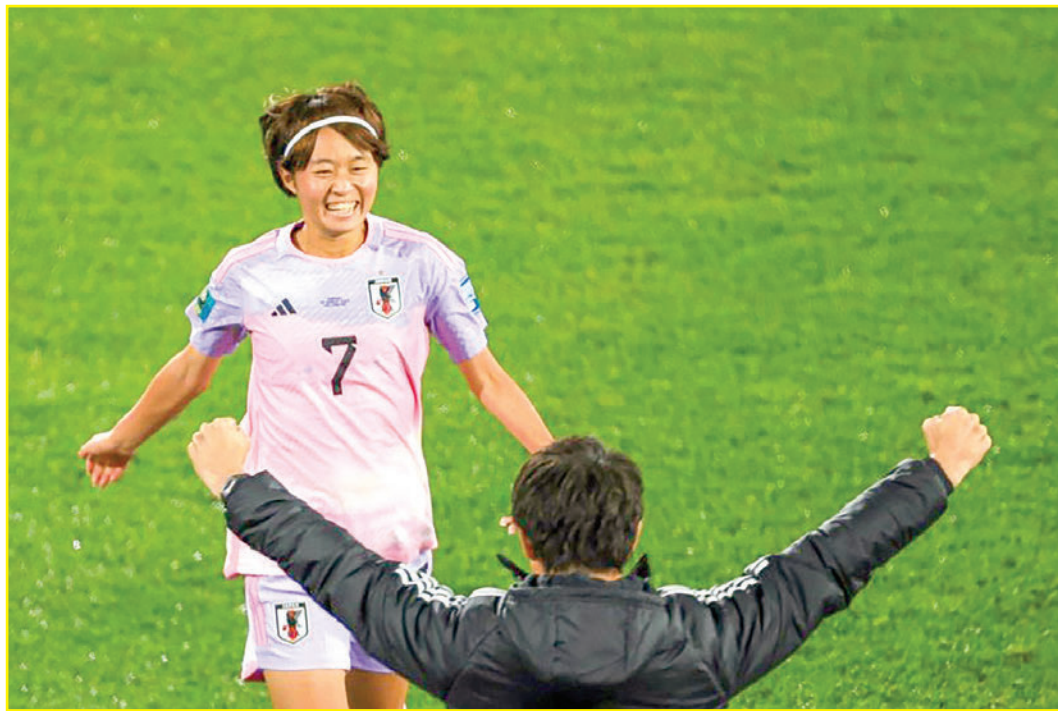
Japanese midfielder Miyazawa scored five goals in Australia and New Zealand as her team reached the quarter-finals.

"I think the big thing for me was the first day I came in, him just putting an arm around me and showing me that he respects me as a person and also a player," he said of the Argentinian. — AFP