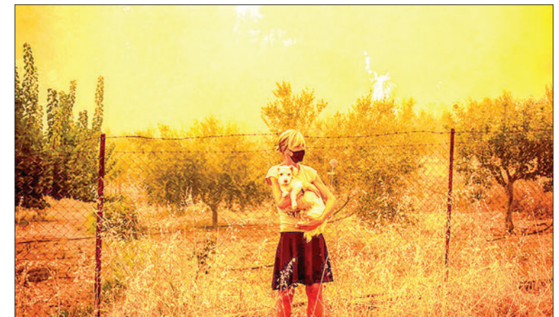
A woman holds a dog in her arms as forest fires approach the village of Pefki on Evia (Euboea) island, Greece's second-largest island, on 8 August 2021.

The EU climate monitor warns that 2023 may become the hottest year ever recorded, with severe heatwaves, droughts, wildfires, and detrimental impacts on economies, ecosystems, and human well-being.