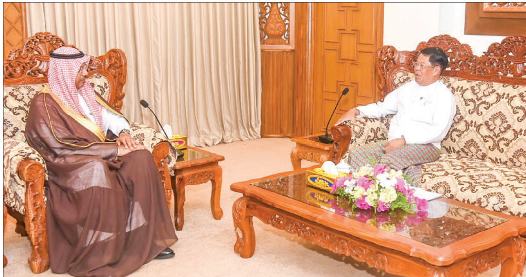
Deputy Prime Minister and Union Minister for Foreign Affairs U Than Swe meets Ambassador of Saudi Arabia to Myanmar Mr. Saud bin Abdullah Alsubaie in Nay Pyi Taw on 6 September 2023.

DEPUTY Prime Minister and Union Minister for Foreign Affairs U Than Swe received Mr Saud bin Abdullah Alsubaie, Ambassador Extraordinary and Plenipotentiary of the Kingdom of Saudi Arabia to the Republic of the Union of Myanmar, yesterday in Nay Pyi Taw.