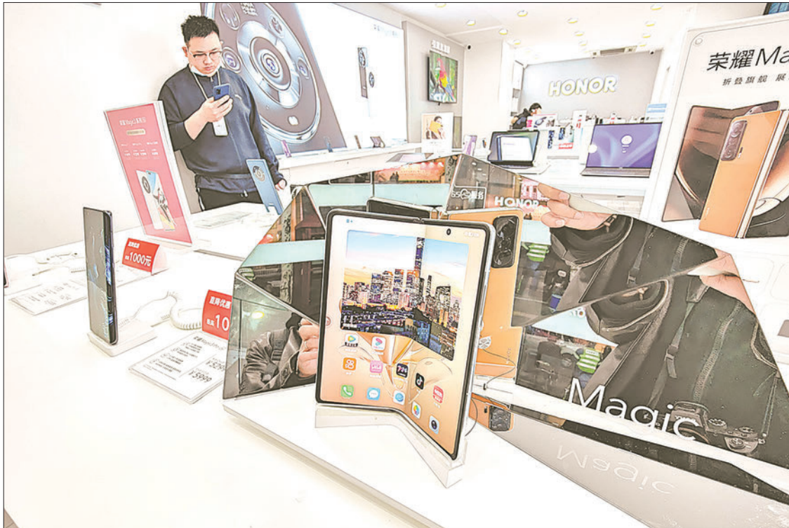
Honor's first foldable smartphone Magic V on display at a shop in Shanghai.