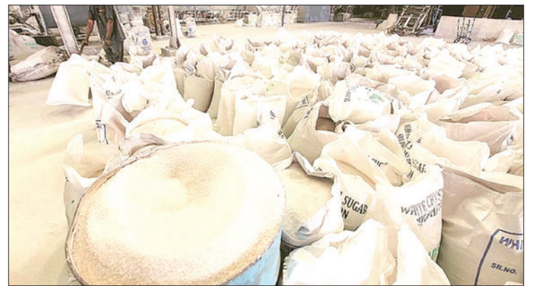
Bags of sugar are seen for being delivered to markets.

Myanmar ships sugar to Viet Nam and the Philippines through maritime trade annually beyond self-sufficiency. Moreover, the country conveyed sugar to China via the border as well. —ASH/EM