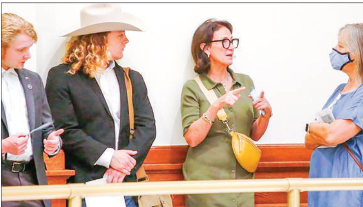
People talk as they wait for an impeachment trial of suspended state Attorney-General Ken Paxton over yearslong charges in Austin, Texas, the United States, on 5 September 2023.

The trial has become a political spectacle drawing attention nationwide and is widely expected to shake Texas politics, especially among the hard-right leadership of the state's Republican Party. — Xinhua