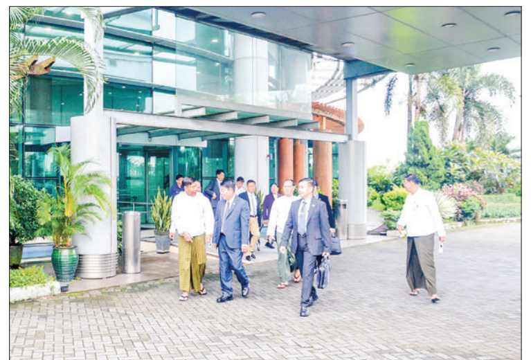
Myanmar delegation leaves for the 17 th International Travel Expo of Ho Chi Minh City 2023, in Ho Chi Minh, Viet Nam, yesterday.

THE Myanmar delegation led by Deputy Minister for Hotels and Tourism U Phyo Zaw Soe and Yangon Mayor U Bo Htay and party left for Viet Nam to attend the 17 th International Travel Expo of Ho Chi Minh City 2023 to be held in Ho Chi Minh City, from Yangon by air yesterday. — MNA/MKKS