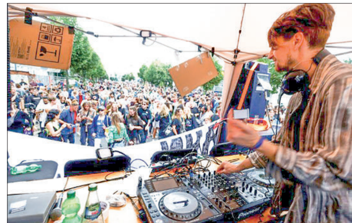
Temporary stages along the planned A100 route blasted out techno as several thousand people held up placards and danced. PHOTO: AFP

The Club Commission helped organise a protest rave in early September in a bid to whip up opposition to the plans. — AFP