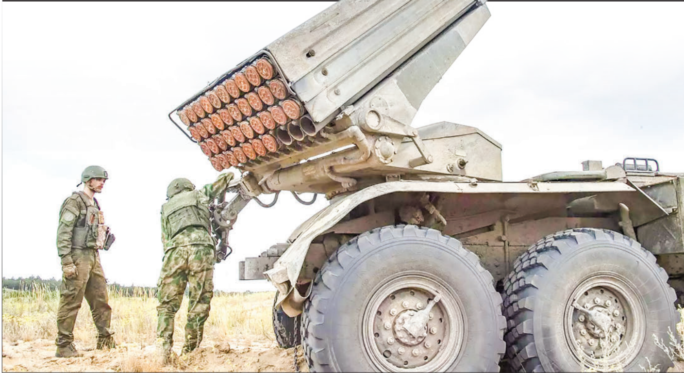
Russian servicemen prepare a BM-21 Grad multiple rocket launcher before firing in the course of Russia's military operation in Ukraine, in Kherson region territory, that has accessed Russia.