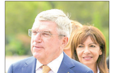
IOC president Thomas Bach (L) and Paris Mayor Anne Hidalgo on the quays of the Seine River in Paris on 25 July, 2023.

OLYMPIC chief Thomas Bach said Wednesday he was "confident" and "optimistic" swimming events in Paris's Seine River will go ahead at the 2024 Games despite recent cancellations due to pollution.