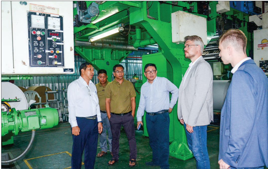
The delegation of the Sputnik Information Agency observes the printing press of The Global New Light of Myanmar yesterday in Yangon.

THE delegation of the Sputnik Information Agency visited the press office of The Global New Light of Myanmar, which is under the News and Periodicals Enterprise of the Ministry of Information, yesterday afternoon in Yangon.