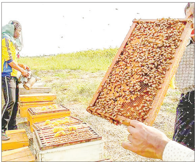
Beekeepers harvest honey from beehives at a farm.

Various types of honey, such as sesame honey, palm honey, Niger honey, sunflower honey, rubber honey, and lychee honey, are being produced in Myanmar, and sesame honey has been produced since last July. — ASH/CT