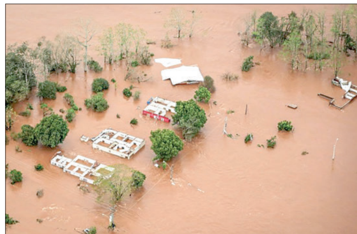
Aerial view of the town of Mucum, Rio Grande do Sul State, Brazil, in the aftermath of a devastating cyclone.

TORRENTIAL rain and winds caused by an extratropical cyclone have left at least 21 people dead in southern Brazil, officials said Tuesday, warning more