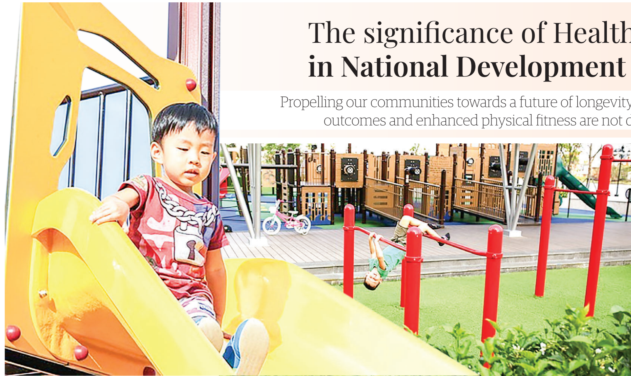
Developing and promoting recreational spaces in both urban and rural areas, coupled with collaboration with schools, workplaces, and communities, is a powerful strategy to encourage physical activity.

By investing in the education and holistic development of the younger generation, we are not only securing their future but also ensuring a brighter and more prosperous future for our society as a whole. It is the collective responsibility of government, educators, and families to empower our youth with the skills and knowledge they need to succeed in their roles as the builders of our nation's future.