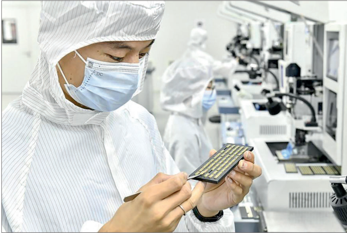
A staff member makes surface acoustic wave filters at an industrial park in Rizhao Hi-Tech Industrial Development Zone of Rizhao City, east China's Shandong Province, 29 June 2023.