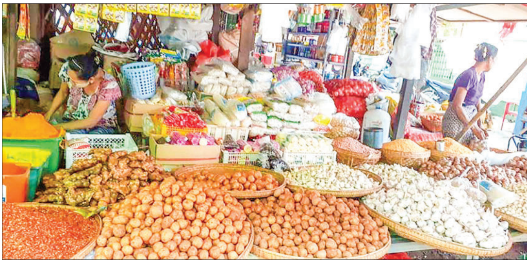
File photo shows a retail outlet of kitchen goods.

ONION prices reached the downside again in the Yangon market from 30 August to 6 September. The price of potatoes rose, and the trade of palm oil at the reference price increased. A tonne of black gram RC skyrocketed to around K2.6 million and that of pigeon pea (red gram) to about K4 million.