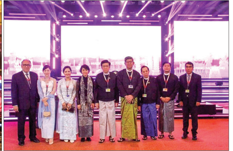
Awardees from Myanmar pose for the group up documentary photos at the ASEAN Business Awards Ceremony 2023.

Business Advisory Council (ASEAN-BAC) since 2007 and is a great traditional ceremony.