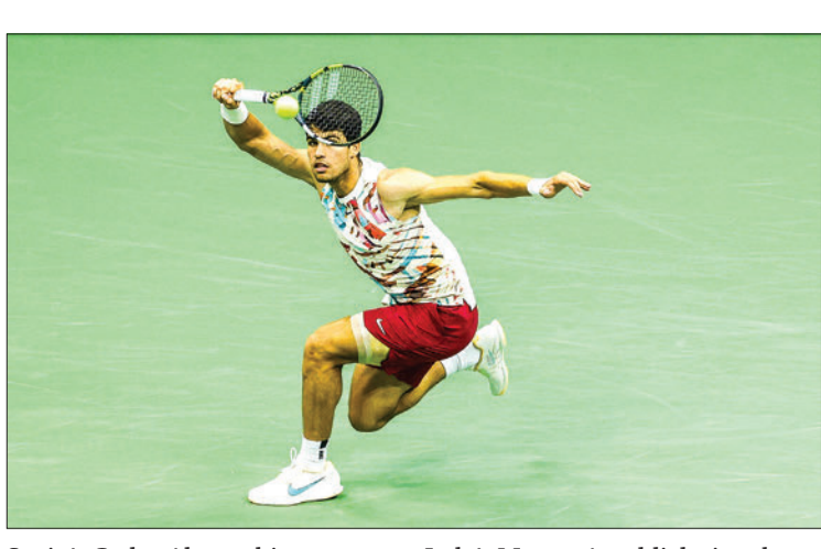
Spain's Carlos Alcaraz hits a return to Italy's Matteo Arnaldi during the US Open tennis tournament men's singles round of 16 match at the USTA Billie Jean King National Tennis Centre in New York City, on 4 September 2023.

A male fan was subsequently identified as the alleged culprit and ejected from the arena