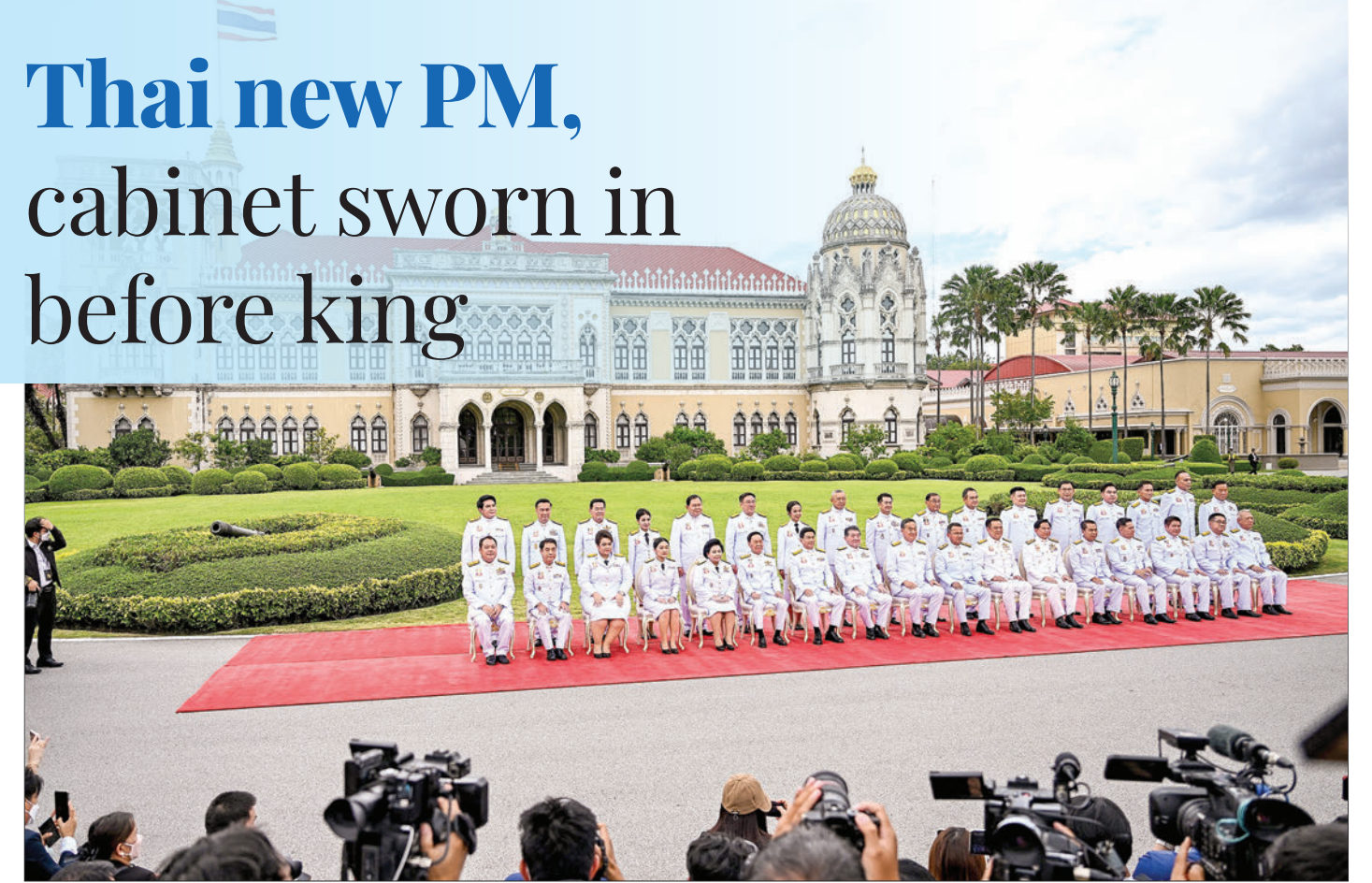
Thailand's Prime Minister Srettha Thavisin poses for a group photo with members of the new cabinet at Government House in Bangkok on 5 September 2023

HAI Prime Minister Srettha Thavisin and his cabinet ministers on Tuesday were sworn in before King Maha Vajiralongkorn, following the royal endorsement of the new portfolios