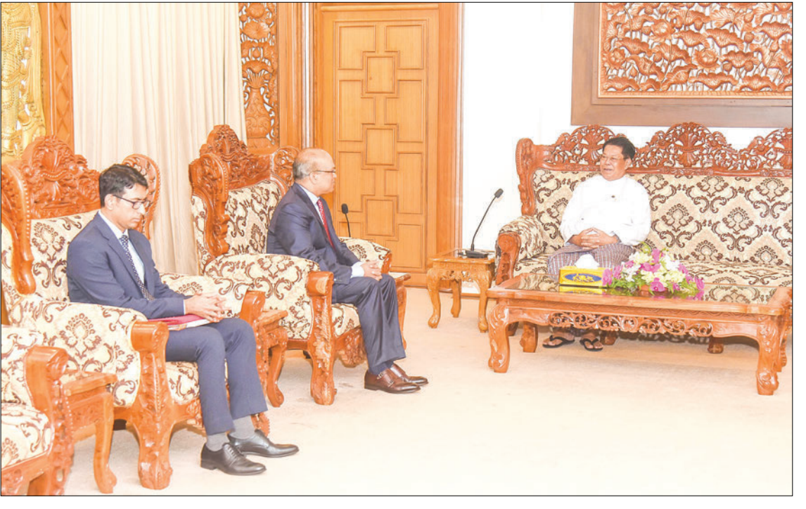
DPM Union Minister for Foreign Affairs U Than Swe receives Dr Md Monwar Hossain, Ambassador-designate of the People's Republic of Bangladesh to the Republic of the Union of Myanmar on 5 September.

During the meeting, they discussed on ways and means of further cooperation between the Government of Myanmar and the United Nations and its related agencies, following the visit of Mr Martin Griffiths, Under-Secretary-General for Humanitarian Affairs and Emergency Relief