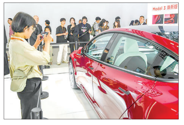
Visitors learn about a new vehicle of Tesla during the 2023 China International Fair for Trade in Services (CIFTIS) at China National Convention Centre in Beijing, capital of China, 3 September 2023.

"Now, when automobile manufacturers talk about their development strategies for the future, they almost focus on new energy sections. If we don't keep up with that pace, we will be left behind," he noted. — Xinhua