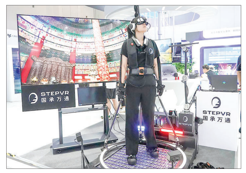
A staff member displays a set of VR-powered omnidirectional treadmill at an exhibition during the Global Digital Economy Conference 2023 at the China National Convention Center in Beijing, capital of China, on 4 July 2023.

GIANT DC, a data technology company established in north China's Tianjin Municipality three years ago, was previously a leading Chinese heavy machinery manufacturer with decades of expertise.