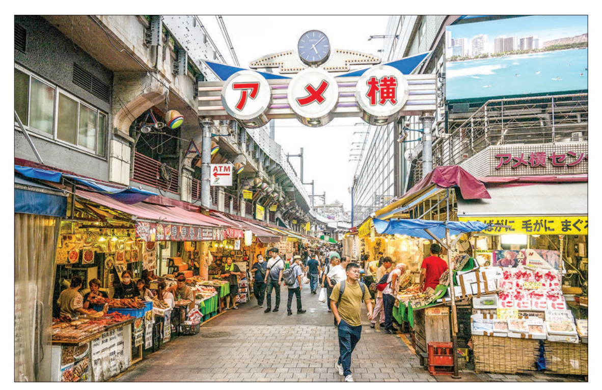
People visit the Ameya-Yokocho shopping promenade, one of the open-air markets in Tokyo on 4 September 2023.

JAPAN'S household spending in July fell 5.0 per cent from a year earlier, the biggest drop in more than two years, government data showed Tuesday, as higher prices hit consumption.