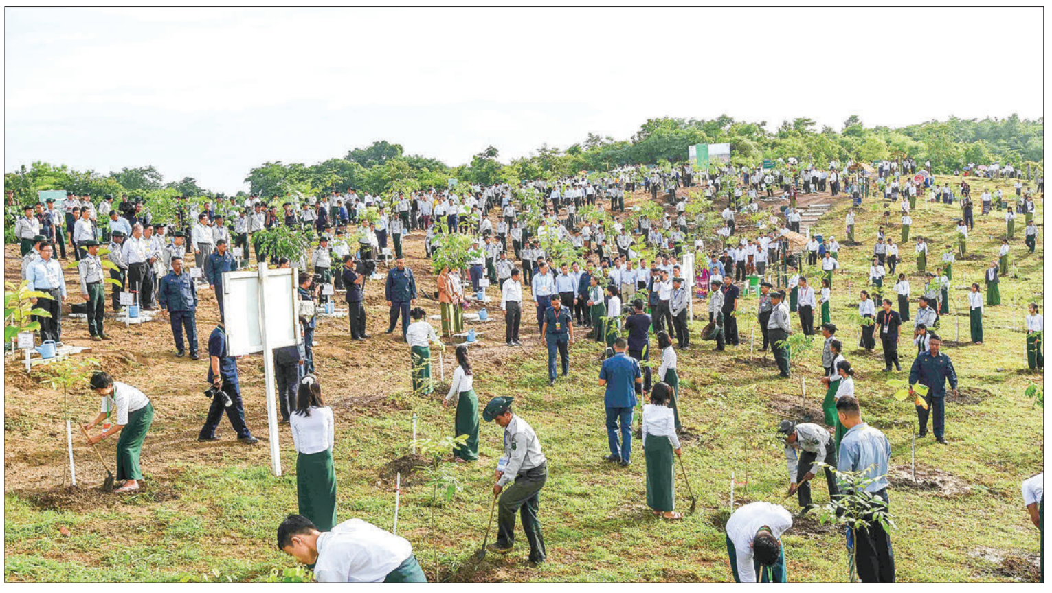
Departmental personnel and students participate in growing saplings at third monsoon tree-growing ceremony in Nay Pyi Taw yesterday.

In conclusion, he gave guidance on establishment of firewood plantations in rural areas,