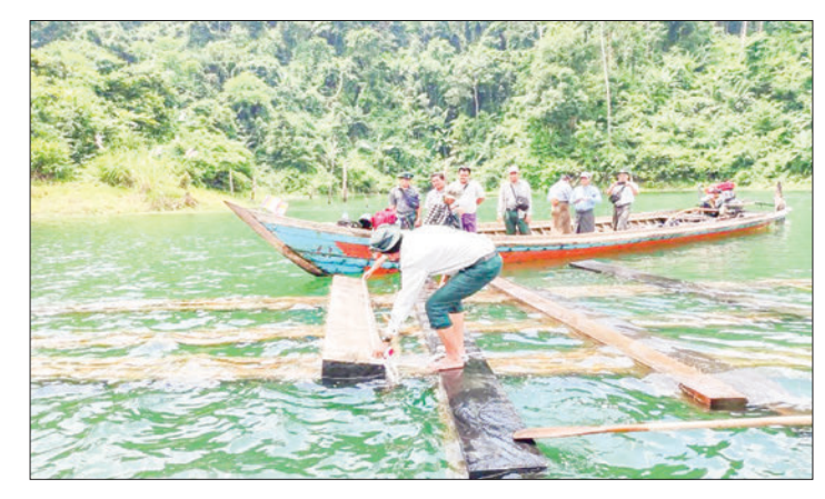
Timbers seized in Bago Region on 4 September.

An on-duty team under the supervision of the Kachin State Illegal Trade Eradication Task Force captured a Doosan excavator, a Komatsu excavator, a Volvo excavator and a cat-320C excavator (estimated value of K120 million) on 1 September and action was taken under the Export and Import Law. The combined teams on 2 September confiscated a Yutong bus (approximately K20 million) carrying 3,960 litres of RBD palm Olein worth K10.78 million without official documents at the Thanlwin Bridge (Mawlamyine) combined checkpoint and a Nissan diesel tractor head with