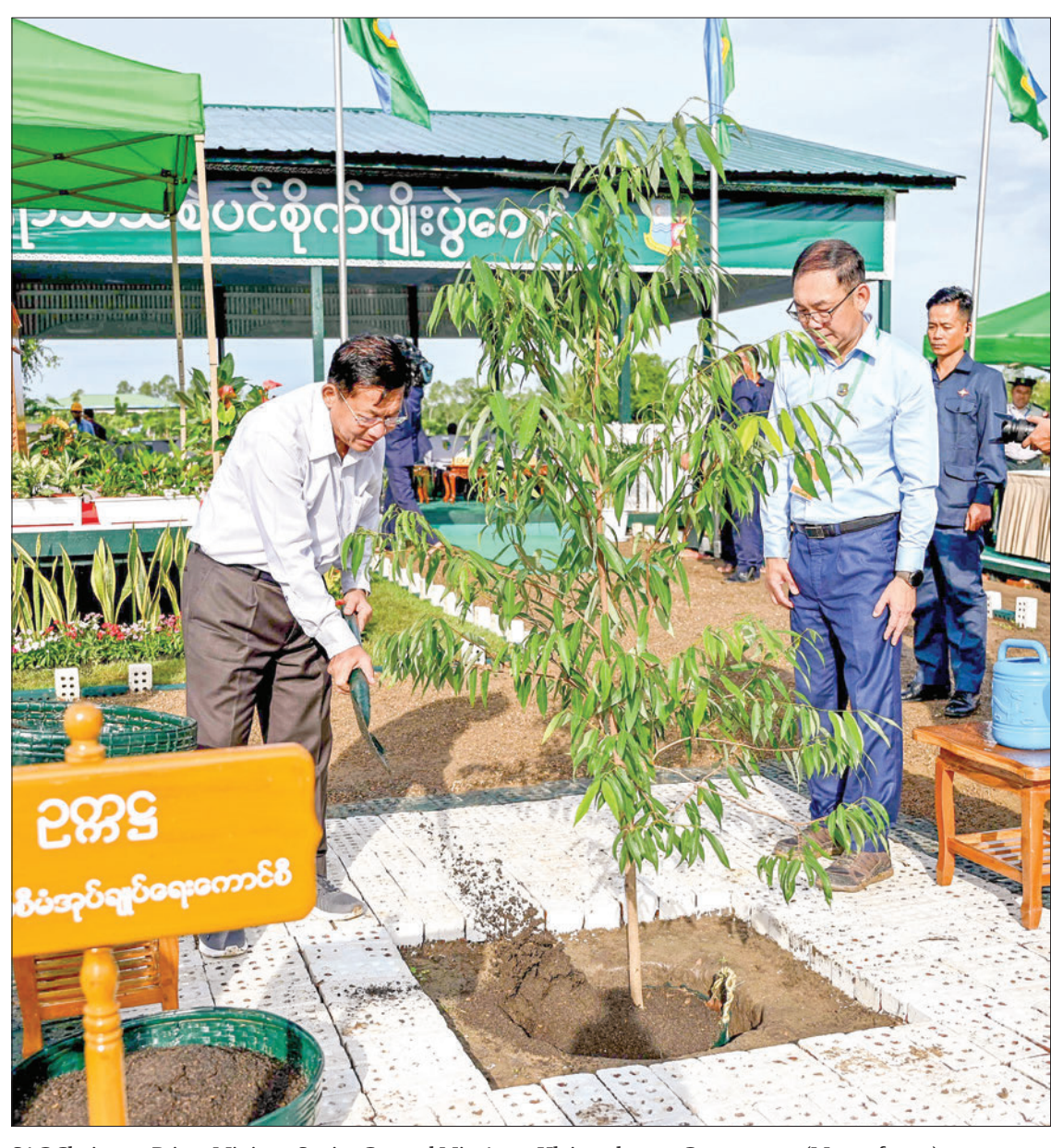
SAC Chairman Prime Minister Senior General Min Aung Hlaing plants a Gangaw tree (Mesua ferrea) at monsoon tree-growing ceremony in Nay Pyi Taw yesterday.