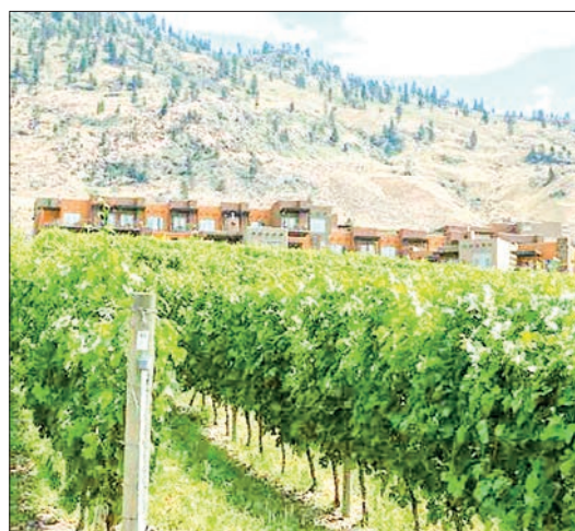
222 wineries in Canada's Okanagan Valley region are facing a "devastating season" as wildfires have kept tourists away.