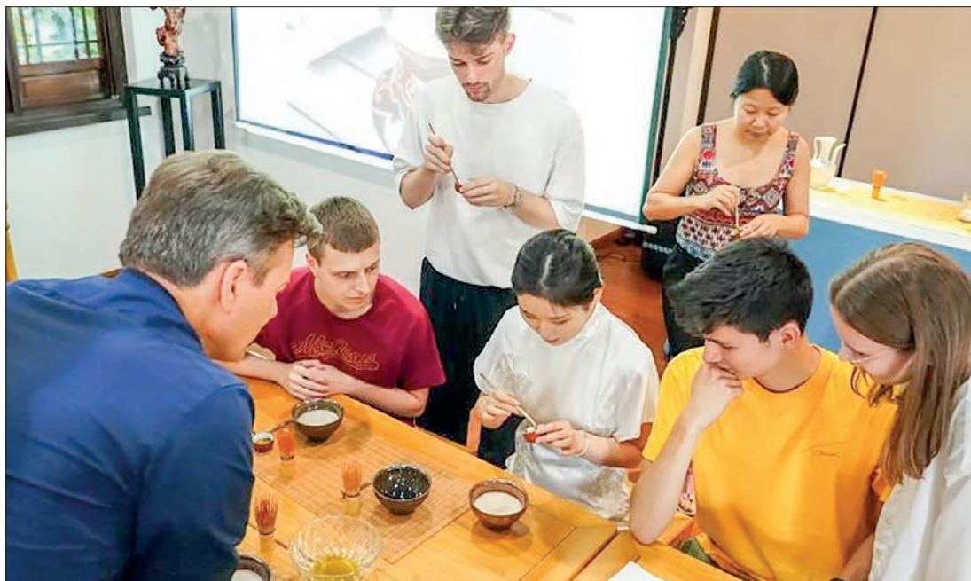
A group of German students learn about Chinese tea culture in Hangzhou, east China's Zhejiang Province, 27 August 2023.

The tea ceremony in China has evolved over centuries, shaped by various dynasties and regions. The Song Dynasty's tea ceremony stands out as a significant milestone in this evolution, playing a pivotal role in shaping the diverse and vibrant Chinese tea culture we appreciate today.