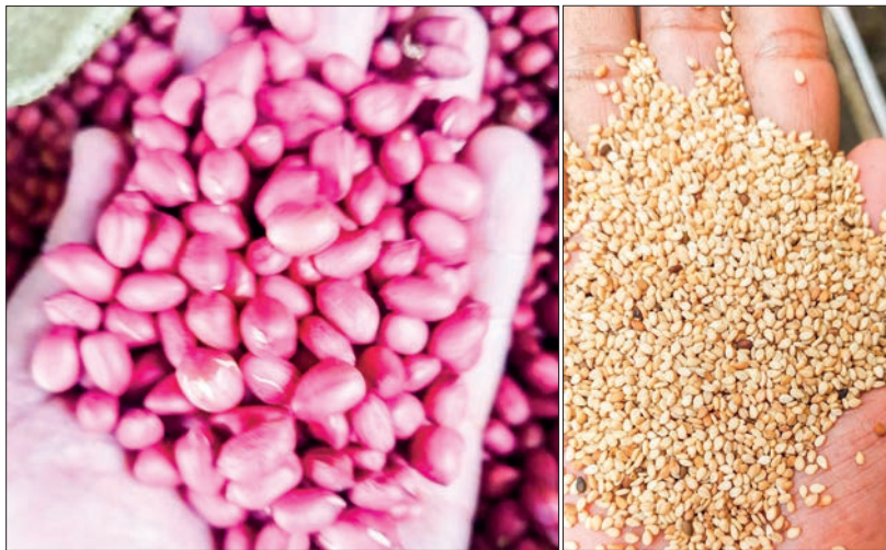
Peanut and sesame are on sale in the market.

The prices of various sesame seeds rose by K50,000 or K90,000 per bag on 26 August. On 3 September, the prices dropped back to the range of K290,000 to K400,000 per