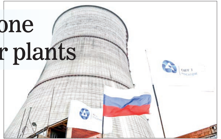
The Kursk Nuclear Power Plant is located in the Kurchatov, Kursk Oblast, Russia.

The Department of Defense's (DOD) intelligence, sur-