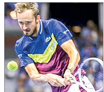
Daniil Medvedev climbs into a backhand in his US Open third round match.

DANIIL Medvedev progressed to the fourth round of the US Open with a 6-2, 6-2, 7-6 (8/6) victory over Sebastian Baez which snapped the Argentine’s 12-match winning streak. Third seed and 2021 champion Medvedev is through to the second week in New York for the fifth year in a row and will play Australian 13 th seed Alex de Minaur for a spot in the quarter-finals. Medvedev closed out the victory with an ace on his fourth match point in the tie-break as he finished well past 1am for the second straight match. — AFP