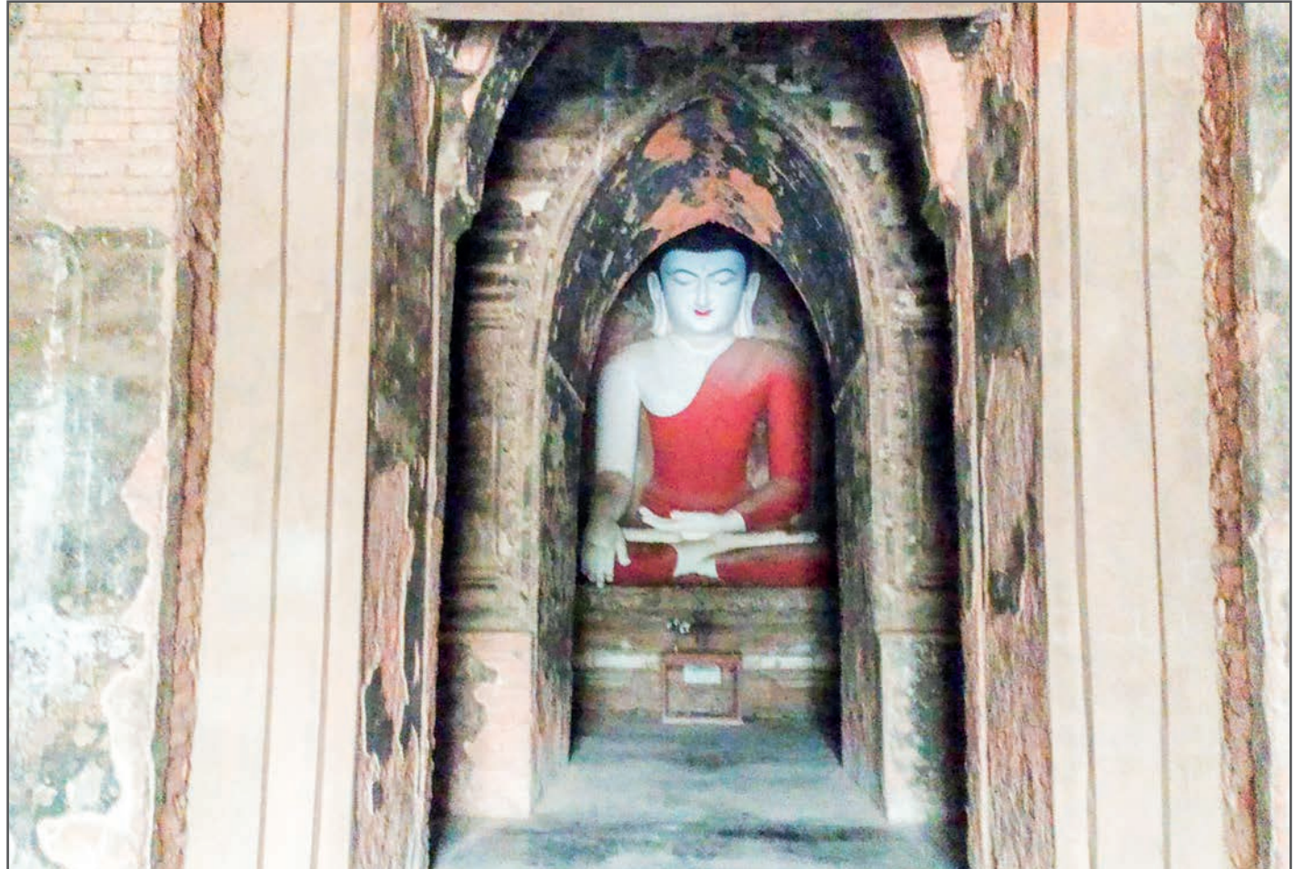
Discovering the enchanting tranquility and reverent allure of the Buddha image at the Pahtothamya Temple.