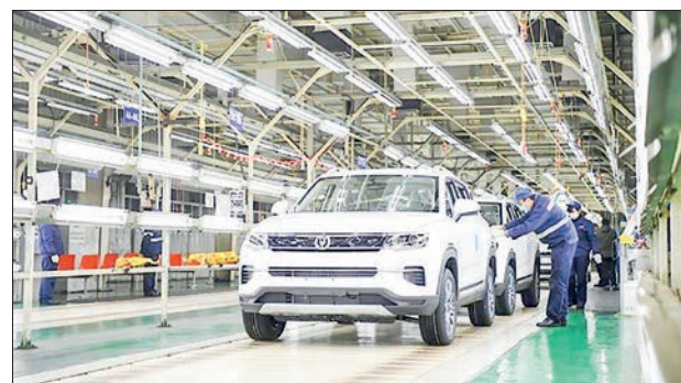
Staff members work at a production line of Yubei plant of Chongqing Changan Automobile Co., Ltd. in Chongqing, southwest China, 18 February 2020.

The combined operating revenue of companies in this sector also surged 13.1 per cent year on year to 4.49 trillion yuan (about 625.45 billion US dollars), according to the association. — Xinhua