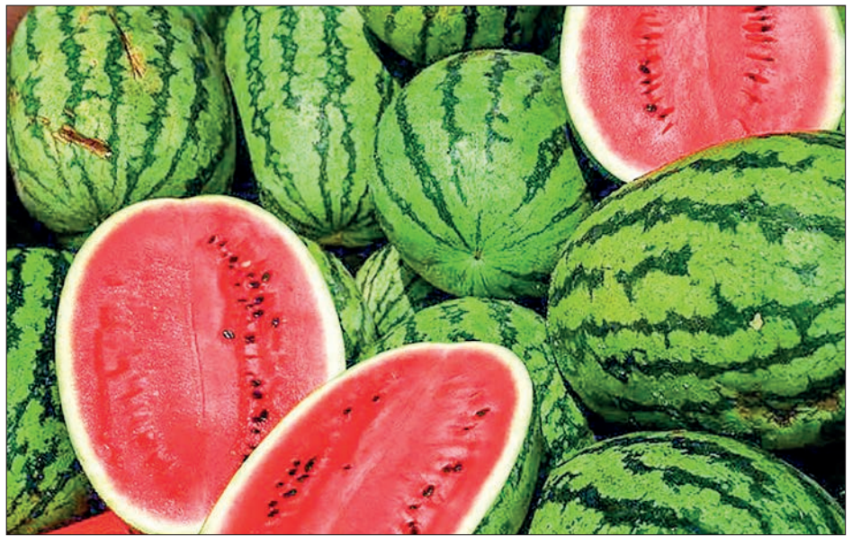
Fleshy quality watermelon.

“At present, the export of watermelons from Myanmar to China has decreased quite a bit. During the seven months from January to July this year, more than 40,000 tonnes of watermelons worth 28.697 million Chinese yuan were exported through the