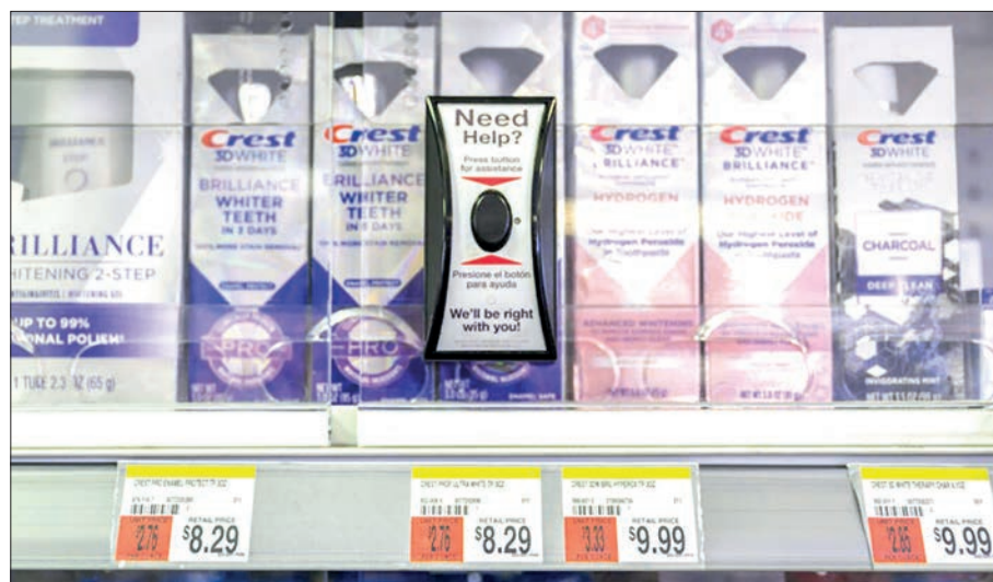
Even toothpaste is kept locked up at some drugstores in New York City.

the fact that these people can go into stores without fear and choose to rob these stores and get away with it," she said.