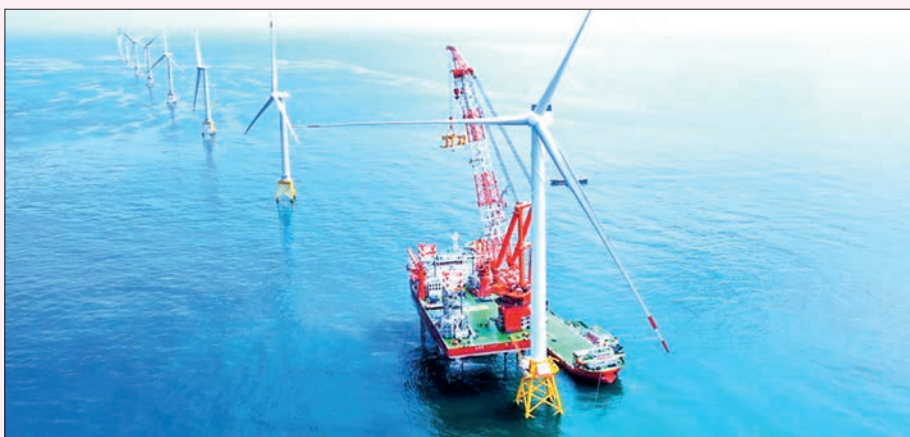
This aerial photo taken on 28 June 2023, shows a 16-megawatt wind turbine installed at the Fujian offshore wind farm operated by the China Three Gorges Corporation off the coast of southeast China's Fujian Province.

The impressive performance and capabilities of China's 16-megawatt offshore wind turbine, setting a new record in clean energy generation