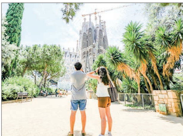
Tourists take pictures of the Sagrada Familia basilica in Barcelona, Spain, 27 June 2021.

The United Kingdom continues to be Spain's biggest source market, with 9.8 million Britons visiting the country in the first seven months of the year, followed