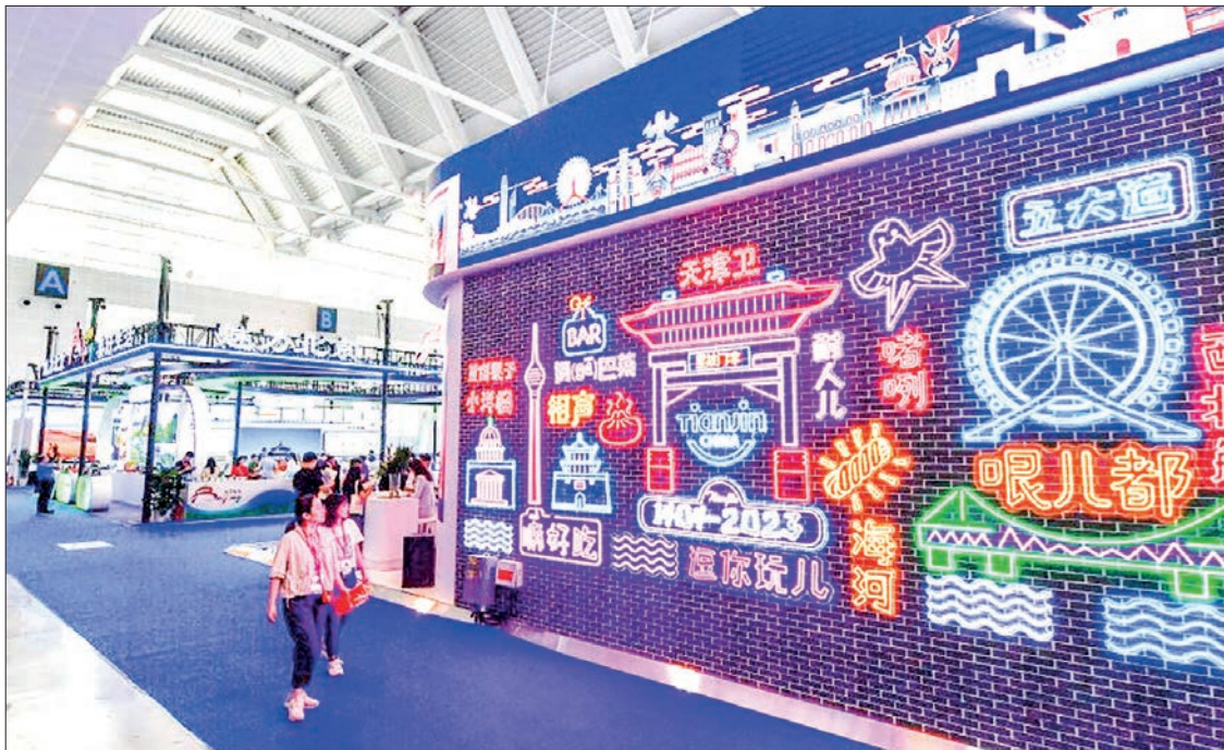
People visit the 13 th China Tourism Industry Exposition in north China's Tianjin Municipality, 1 September 2023.

THE 13 th China Tourism Industry Exposition kicked off in north China's Tianjin Municipality on Friday, highlighting international cooperation and industrial innovation in the culture and tourism sector.