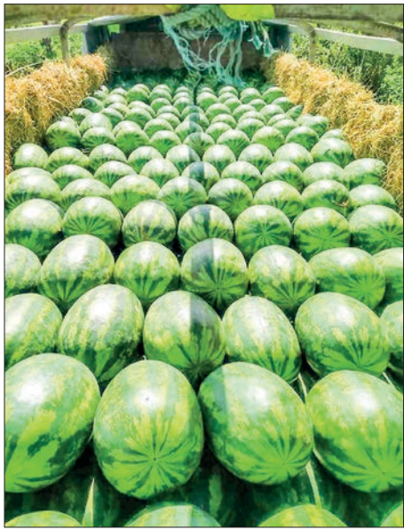
Watermelons seen in cargo truck.