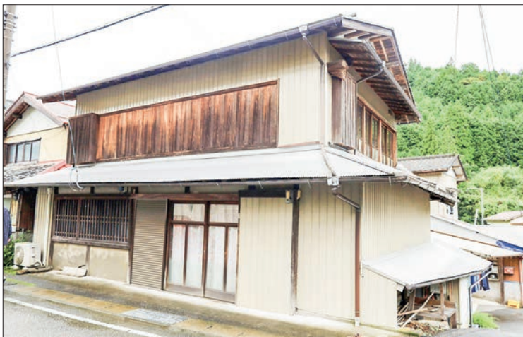
Photo taken in September 2022 shows an empty house that was built about 70 years ago in Tsuno, Kochi Prefecture.

The loan can also be used for renovation, which lowers hurdles for potential homebuyers to purchase such houses, the company said. — Kyodo