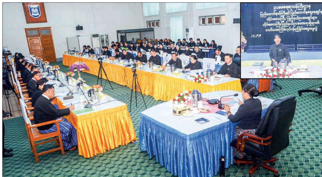
The third coordination meeting of the Ministry of Legal Affairs in progress in Nay Pyi Taw yesterday.

Ministry of Legal Affairs cooperates with foreign organizations in legal matters and is working to obtain technical and legal assistance