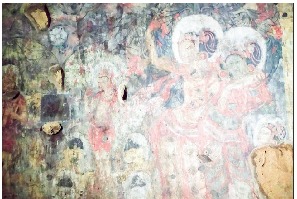
Exquisite mural paintings are seen adorning the interiors of Bagan’s temples as spectacular temple treasures.

“We’ll assess how badly the mural-adorned pagodas have been damaged, and which factors for example termites, bats or human damage them. We will find out the root causes before arranging for the preservation measures,” U Kyaw Myo Win explained.