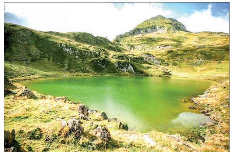
Lake Areau in the French Pyrenees has taken on a strange green hue. PHOTO: AFP

But some say the greening of the lakes is not necessarily alarming. — AFP