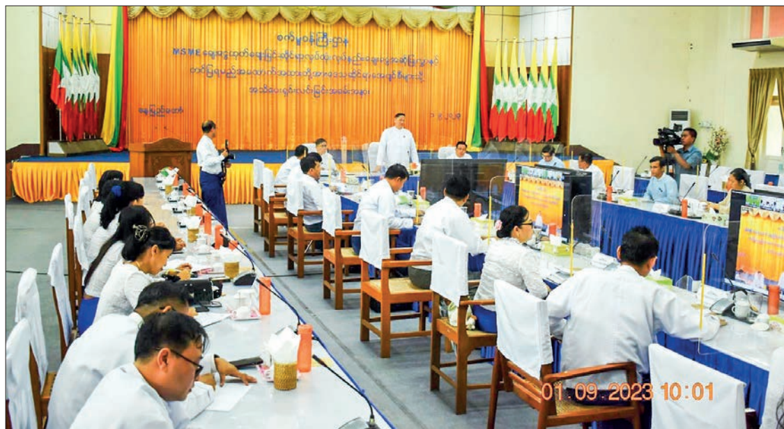
A briefing session on loan grant to MSMEs, loan approvals and requirements for loan applications for the regional MSME development agencies in progress in Nay Pyi Taw on 1 September 2023.

Loans will be disbursed to prioritized groups that do not take any MSME loans from State-owned banks and private banks