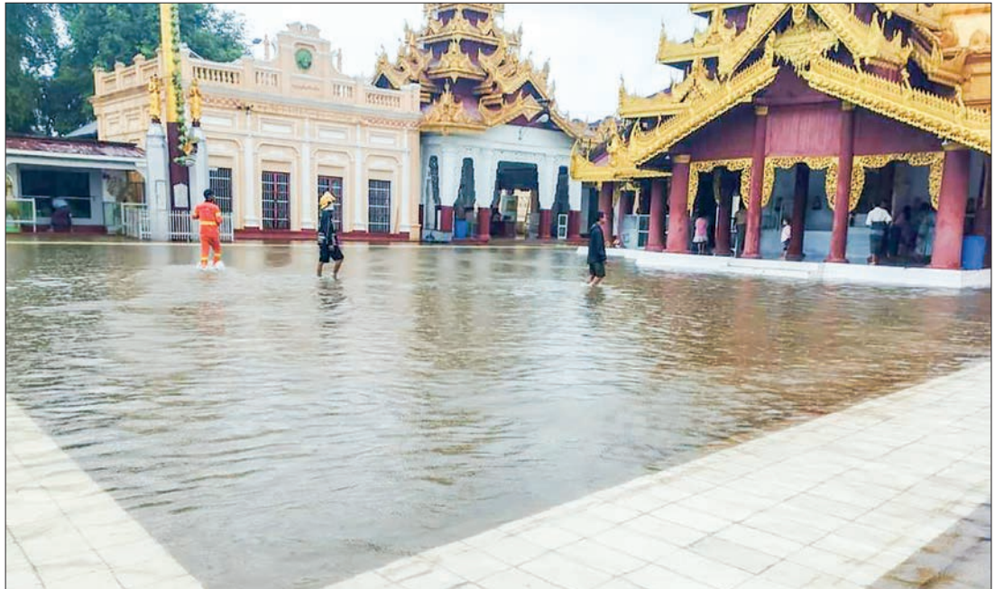
The photo shows inundated platform of Shwezigon Pagoda in Bagan.

IN NyaungU Township, Mandalay Region, heavy rainfall caused inundation at the platforms of Ananda Temple and Shwezigon Pagoda, according to the Myanmar Fire Brigade.