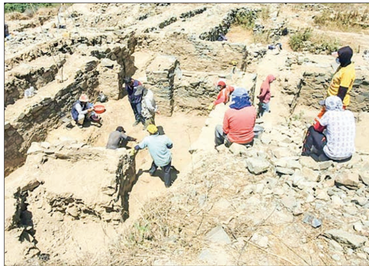
Peruvian and Japanese archaeologists discovered a pre-Hispanic site dedicated to ancestor worship in northern Peru.

A team of Peruvian and Japanese archaeologists has unearthed a pre-Hispanic archaeological site in northern Peru dedicated to ancestor worship, with burial chambers, human remains and ceramic offerings.