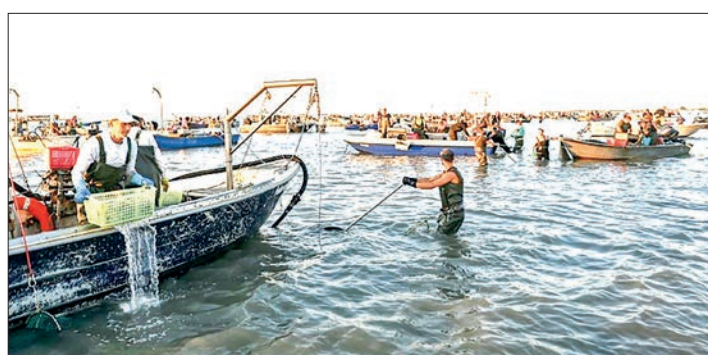
The blue crab risks putting Italian clam and mussel farmers out of business.

He is the third generation of his family to have a boat on the "Sacca degli Scardovari",