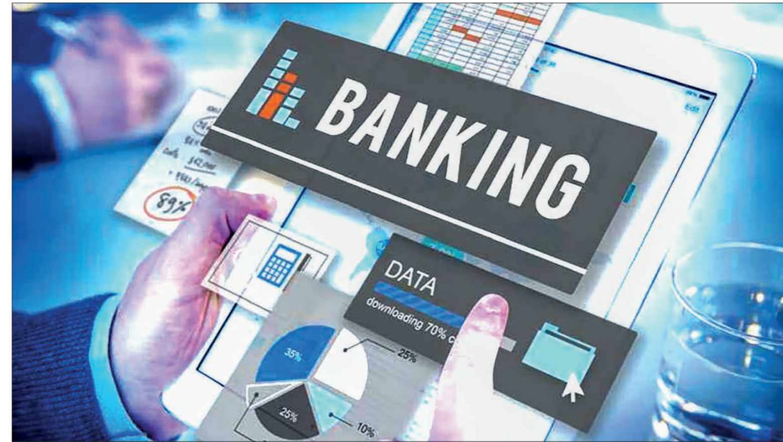
The stability of the banking sector is critical for the overall economic well-being of a nation.

tomers' withdrawals of most kinds. Some only allow accrued interest to be withdrawn. Some