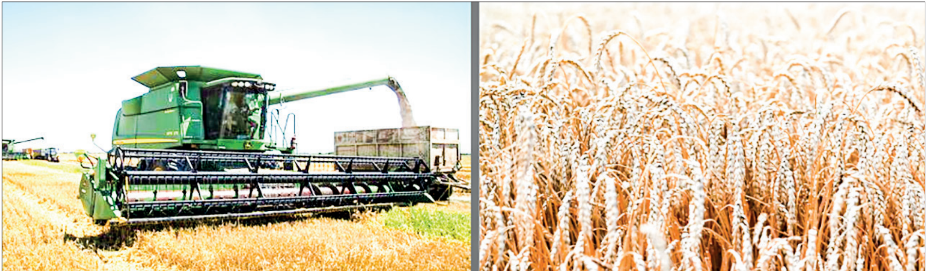
Russia, for the first time ever, has become one of the top five sources of grain for Brazil.