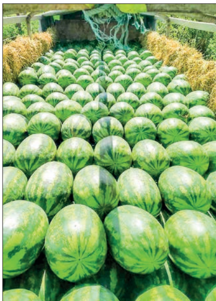
Export income of Myanmar watermelons reaches 28.697 mln Chinese yuan as of July 2023