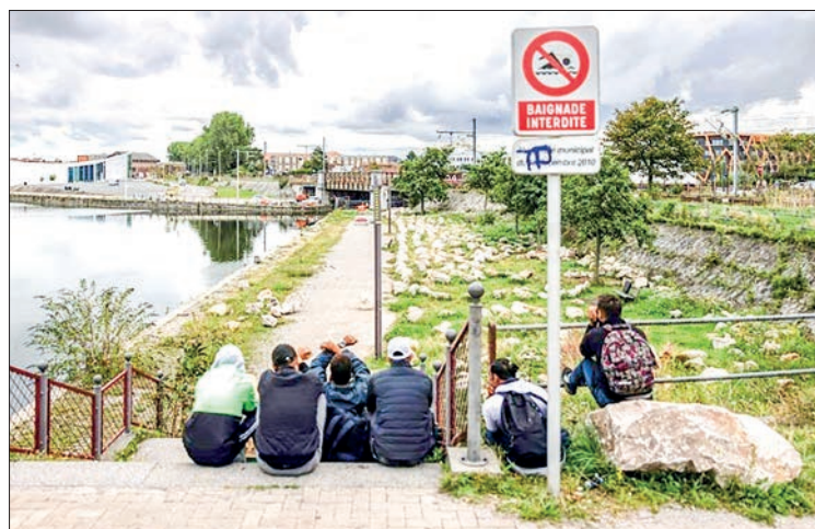
Security has been tightened at the port of Calais and the Channel tunnel linking France with southeast England.

Surveillance cameras have been installed in 12 communes and four ports, with the scheme set to be widened in 2024, according to the local authorities. — AFP