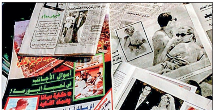
Dodi's death in the tragedy was largely eclipsed by Diana's.

His gift for self-invention — he added the "Al-" prefix to his surname and a 1988 UK government report described his claims of wealthy ancestry as "completely bogus" — led segments of the British press to dub him the "Phoney Pharaoh."