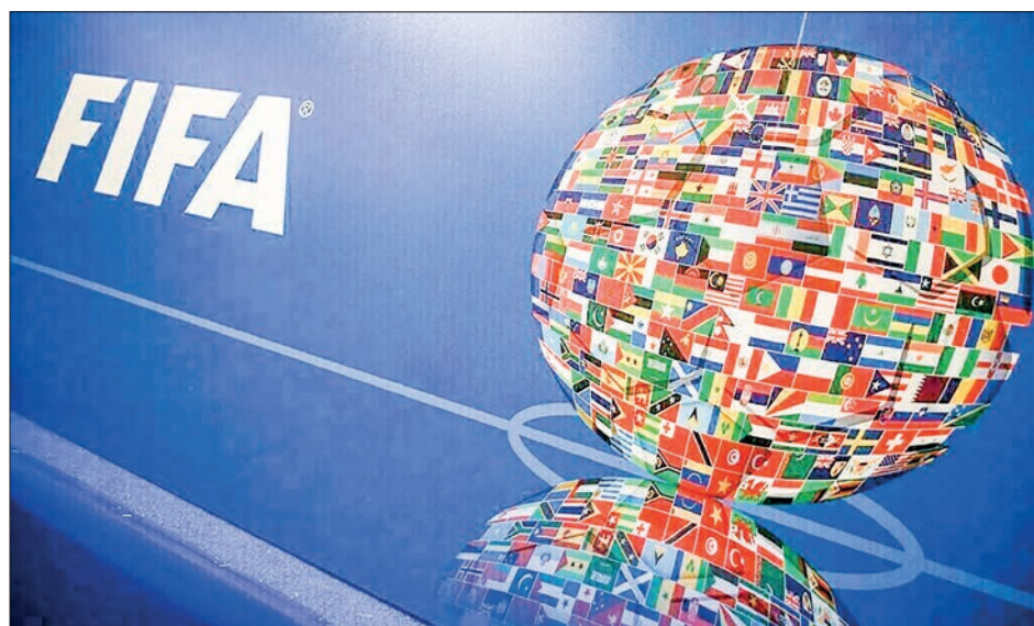
Two convictions arising from the FIFA corruption scandal have been quashed following a US Supreme Court ruling.

TWO convictions in the FIFA corruption case have been overturned by a US federal judge citing a recent Supreme Court ruling.