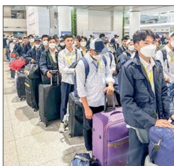
Some Myanmar workers bound for South Korea seen at the airport in 2022.

ACCORDING to the Public Overseas Employment Agency Employment Permit System (POEA-EPS), the special CBT for Myanmar workers who have legally worked in South Korea