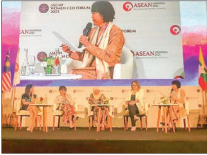
Myanmar acts moderator in ASEAN Women CEO Forum in Jakarta