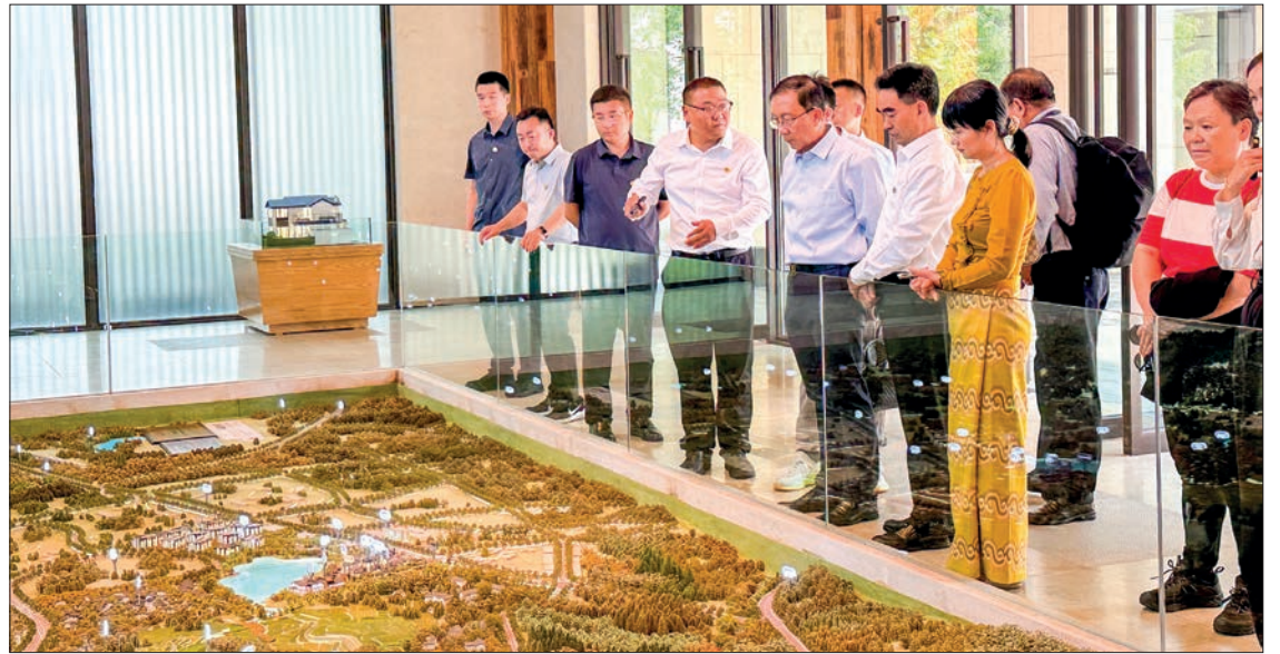
Deputy Prime Minister Union Minister for Planning and Finance U Win Shein visits the Gaoqiao-li Rural Revitalization Project.