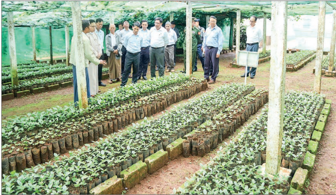
A coffee nursery in the Coffee Technology Development Farm (Ywangan) is being inspected by the officials.

UNION Minister for Agriculture, Livestock and Irrigation U Min Naung invited discussions from those from coffee-based businesses to enhance coffee produc-