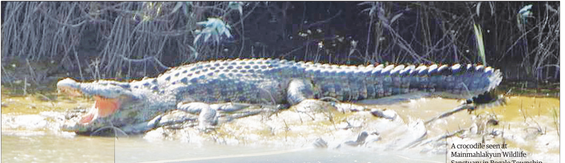
A crocodile seen at Mainmahlakyun Wildlife Sanctuary in Bogale Township.

A plain sight of a tiny coffin made from hardwood resting on a boat, a ritual offering blue plastic bowl placed on the coffin, offering the dead a steel bowl of rice and curry and a cup of water, the condolence frame of the deceased loved one who is a young man wearing a blue plaid shirt and a coffin plate containing inscriptions like the name and the age of the deceased (29 years old) are showing grief and loss.