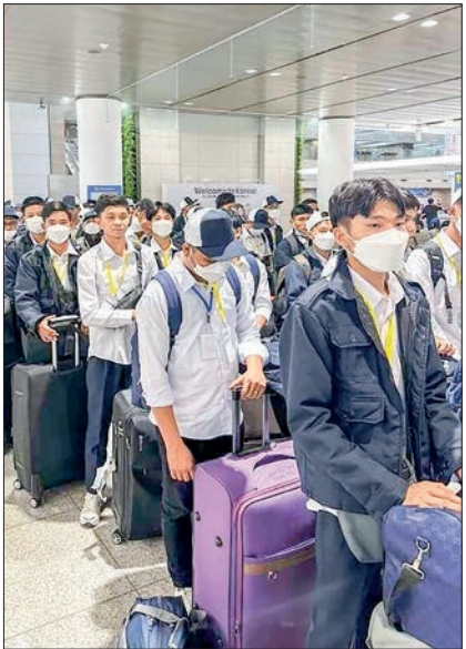
Plan to hold Computer-Based Test for legal Myanmar workers who worked in over three years in South Korea on 4 October