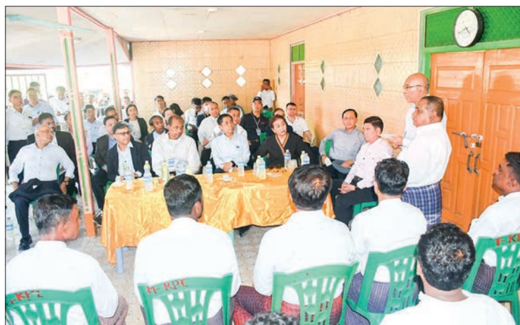
At the Thetkaepyin IDP camp.

They also inspected the completed rehabilitation works at Sittway University, and other places in Thaechaung and Dapaing villages by car. Moreover, they met with the displaced persons at Thetkaepyin IDP camp and the head of the camp and observed the health-care services at Thetkaepyin station hospital. The diplomats had dinner hosted by the Rakhine State chief minister at the Sittway Hotel on the same evening. — MNA/KTZH