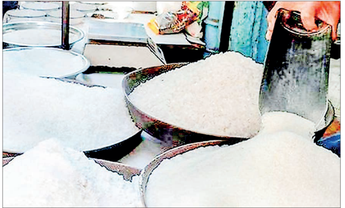
Jaggery balls and sugar are seen in the market.

Sugar export to China via the land border was conducted under the provincial-level Memorandum of Understanding. However, it came to an abrupt stop due to the COVID-19 policy of China. Therefore, the sugar industry called for a government-to-government agree-