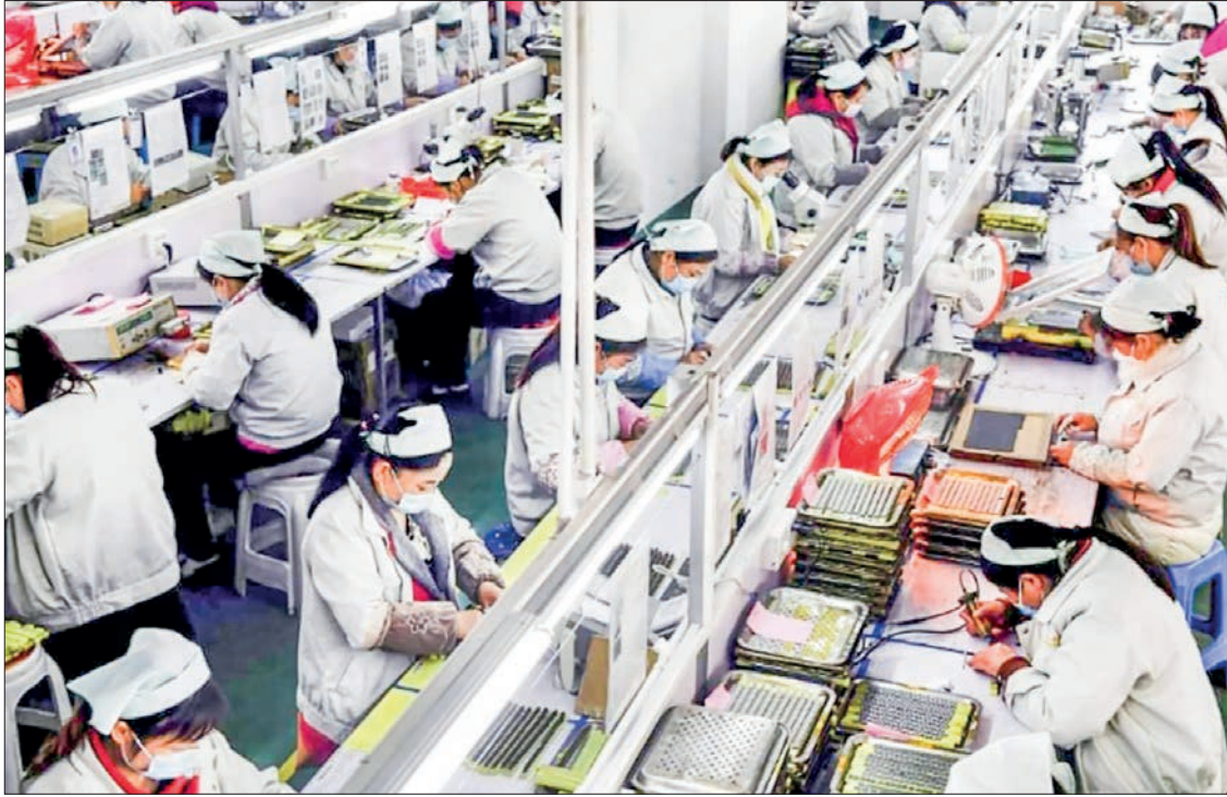
The photo shows the workers including Myanmar nationals at the electronic factory in Japan.

THE Myanmar Embassy to Japan in Tokyo announced on 31 August that a total of 1,200 Myanmar workers will be recruited again for companies in Japan.