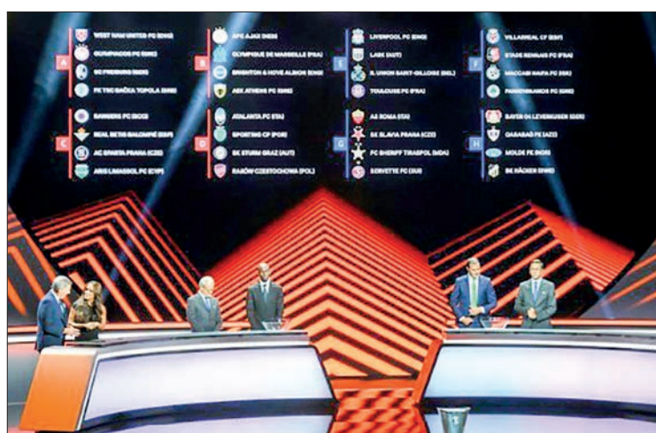
The Europa League group-stage draw was held in Monaco on Friday.

Brighton finished sixth domestically last season to qualify