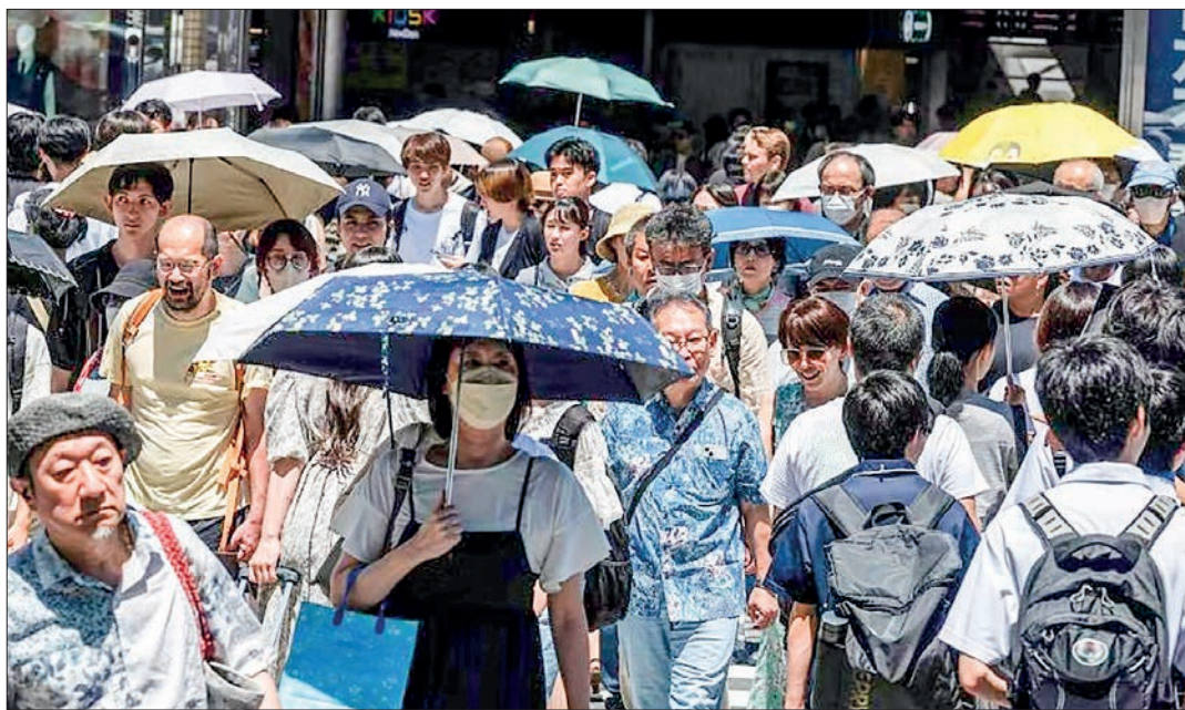
People outside Shinjuku station in Tokyo using umbrellas to seek relief from the blistering heat.

TEMPERATURE records are being toppled across Asia, from India's summer to Australia's winter, authorities said Friday, in fresh evidence of the impact of climate change.