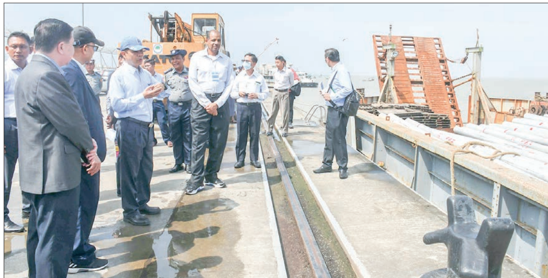
The diplomatic mission views round the Multi-purpose Port in Sittway.