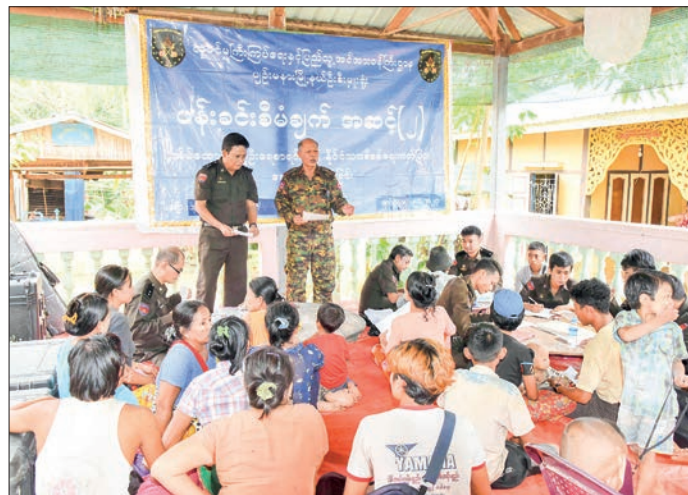
Household registration certificates and CSCs are provided to locals in Bangbar village-tract.

A collaborative team led by Nay Pyi Taw Council member Col Min Naung made a field study trip yesterday to Bangbar and Seikphutaung villages in Pyinmana township by motorcade in order to ensure regional stability and peace, security, the rule of law, education, health and local development.