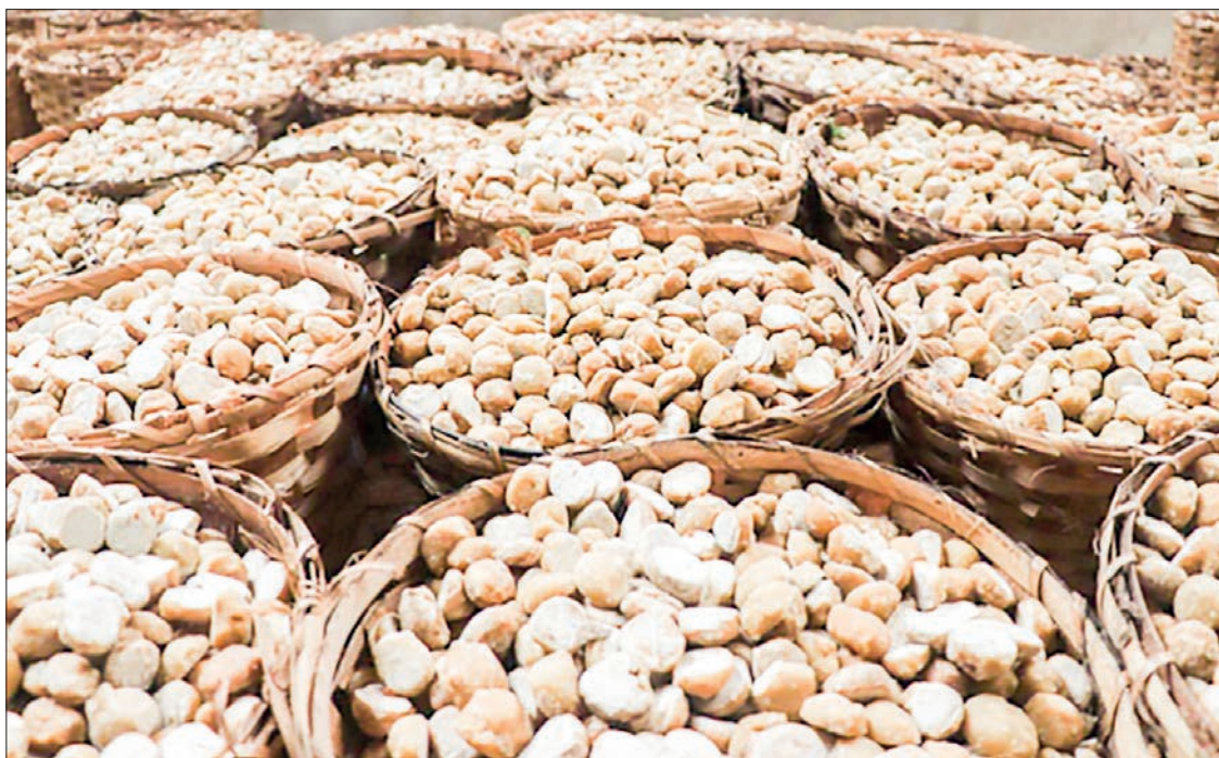
The photo shows jaggery baskets to be distributed in the market.

The leading sugar exporting country India can produce 150 tonnes per acre, while the maximum production rate in