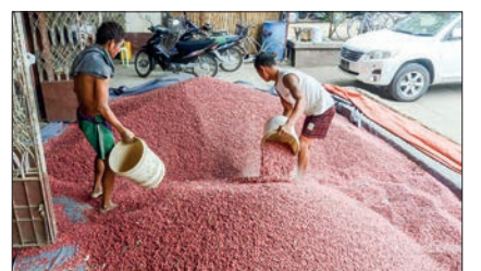
Surplus supply and weak demand drive peanut prices lower