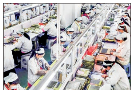
Companies in Japan to recruit around 1,200 Myanmar workers