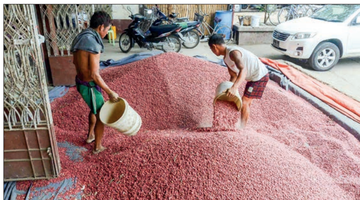
The peanut prices jumped to K11,000 per viss last 18 August on the back of strong foreign and domestic demand.

The country shipped about 90,000 kilogrammes worth US$13.851 million to foreign markets through seaborne and border trade channels over the past four months of the current financial year 2023-2024. — NN/EM