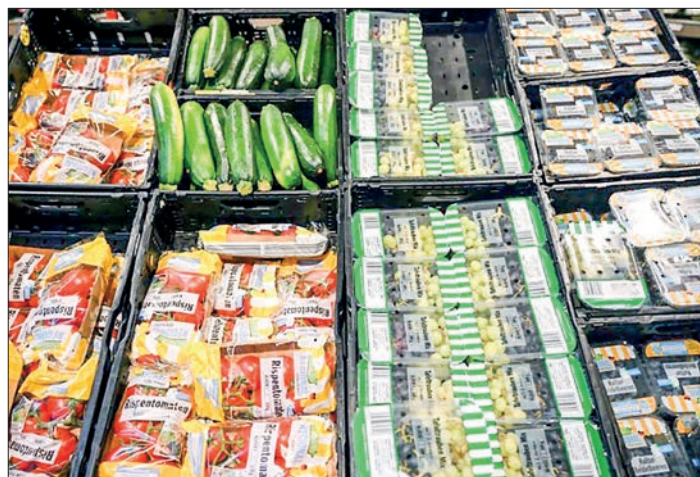
Some analysts said the inflation data would not dramatically change the ECB's trajectory on 14 September. PHOTO: AFP

The figure is far higher than the ECB's two-per-cent target. — AFP