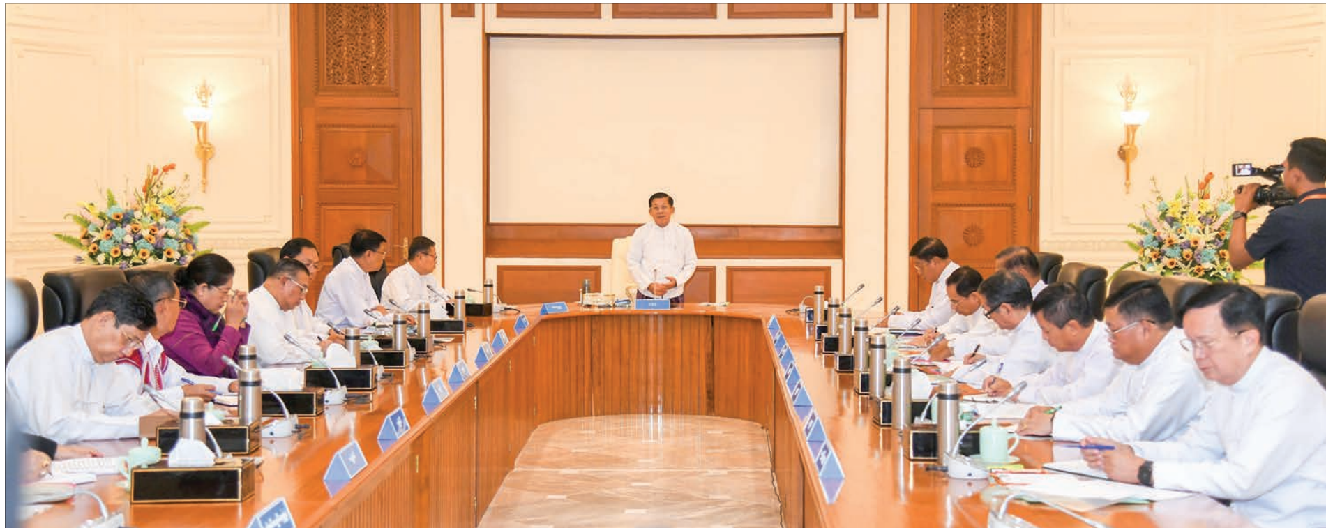
State Administration Council Chair Prime Minister Senior General Min Aung Hlaing presides over the SAC Meeting 3/2023 in Nay Pyi Taw on 1 September 2023.