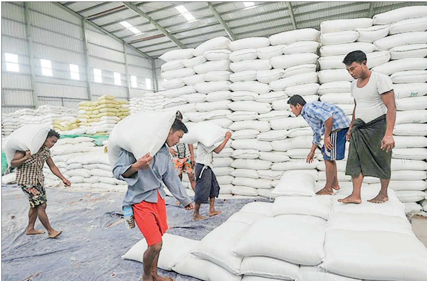
Workers busy organizing rice bags for sale and distribution at the Yangon warehouse.