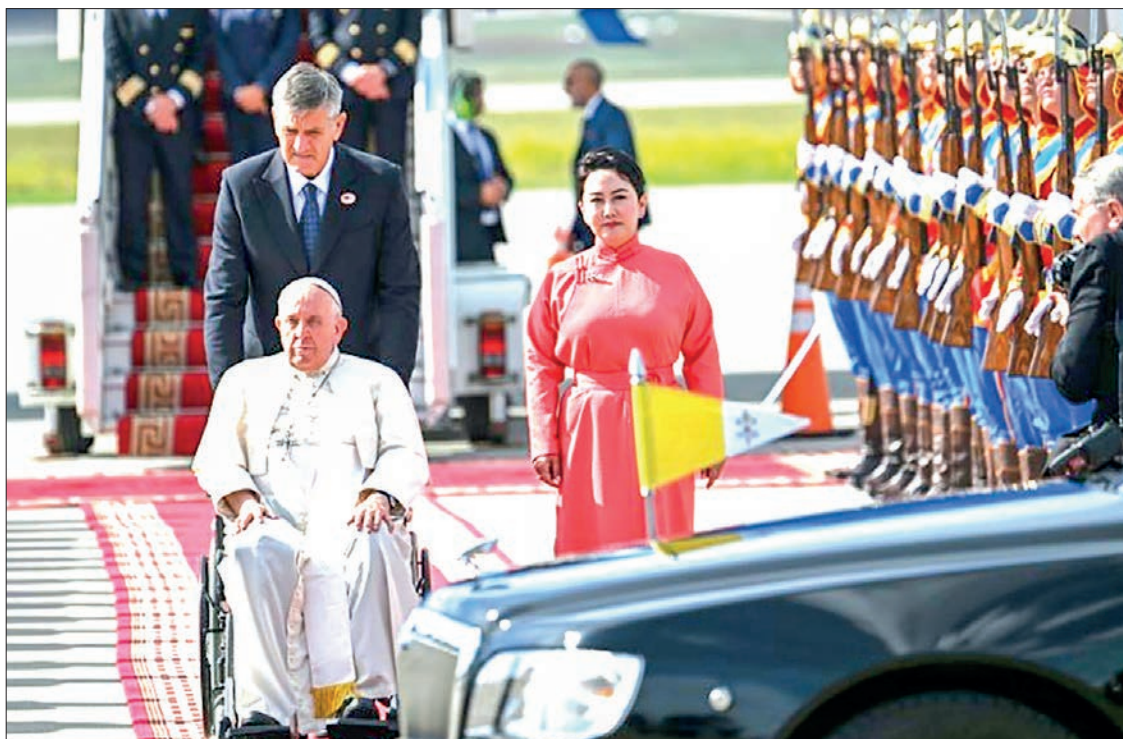
Pope Francis was received by Mongolia's Minister of Foreign Affairs Batmunkh Battsetseg (R, in red) during his arrival in Ulaanbaatar.

The papal visit is a strategic move to enhance Vatican ties not only with China but also with Russia, as Mongolia shares borders with both nations.