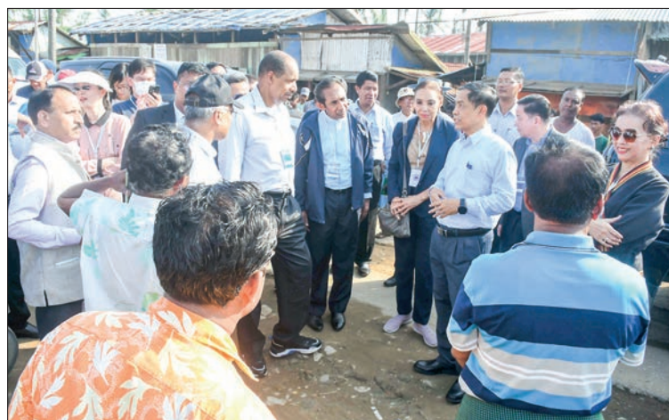
At the Thaechaung village.