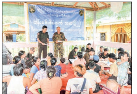
NPT council member inspects local development work in Pyinmana