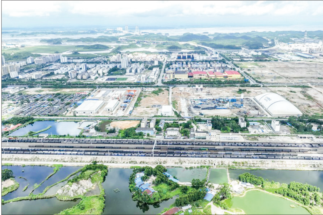
This aerial photo taken on 22 July 2023 shows Qinzhou Port Station and a nearby industrial park in Qinzhou, south China's Guangxi Zhuang Autonomous Region.

The canal will have locks that can accommodate large vessels of up to 5,000 tonnes. Technicians in Nanning, the regional capital, monitor the project using a digital replica created through twinning technology. The canal is expected to be operational by the end of 2026.