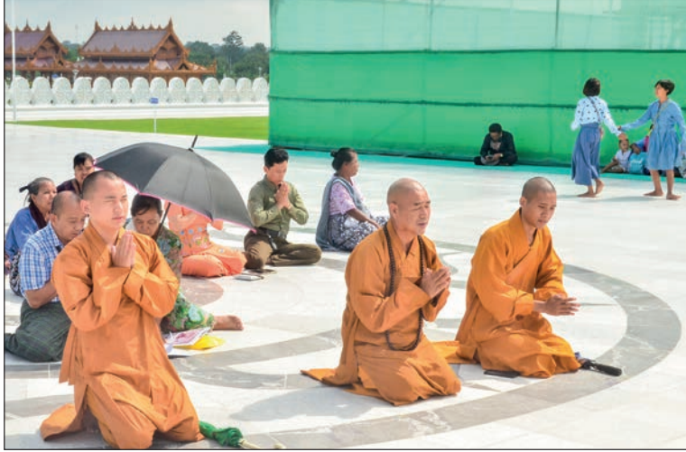
Devotees, including monks and nuns, pay homage to the Maravijaya Buddha Image at the Buddha Park in Nay Pyi Taw yesterday.