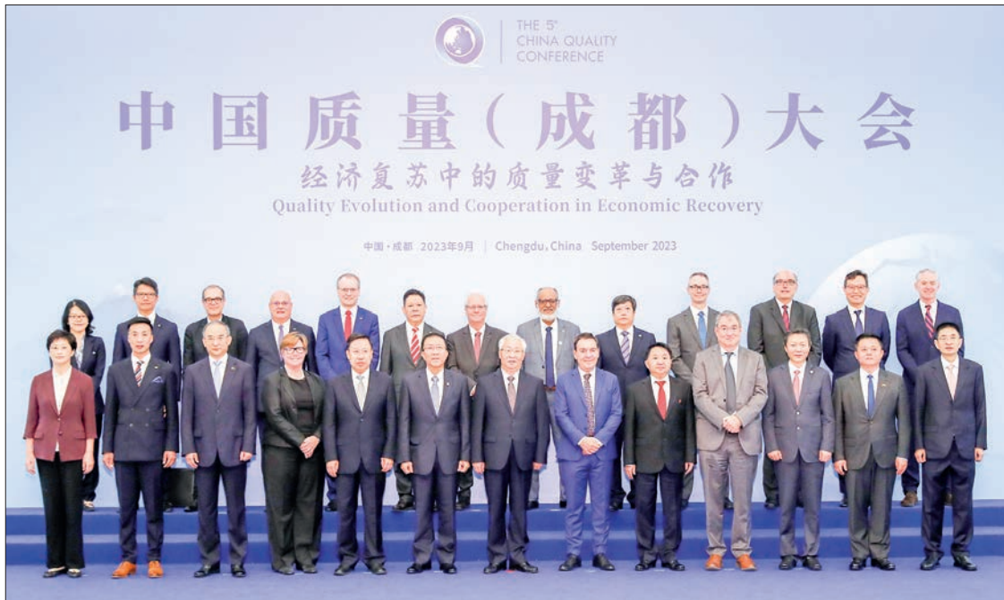
Deputy Prime Minister Union Planning & Finance Minister U Win Shein poses for the group documentary photo at the 5 th China Quality Conference yesterday.

MYANMAR is stepping up its digital system in the financial sector and encouraging green business development while setting electric car import as