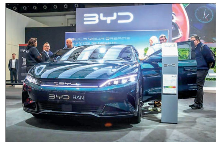
The number of Chinese automakers exhibiting at IAA will double compared to 2021, when Munich last hosted the show. People experience a BYD Han electric car during a media preview of the 100th Brussels Motor Show in Brussels, Belgium, 13 January 2023.

Although sales in the European Union have steadily improved over the last 12 months, they remain around 20 per cent below their pre-coronavirus levels as inflation and higher interest rates dampen appetite for new vehicles.