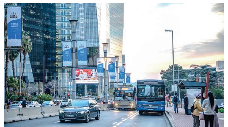
Signboards of the 15th BRICS summit are seen on a street of Johannesburg, South Africa, 17 August 2023.

Last week, the BRICS group of major emerging economies - Brazil, Russia, India, China and South Africa - announced that its membership is more than doubling. Argentina, Egypt, Ethiopia, Iran, the United Arab Emirates (UAE), and Saudi Arabia were invited to join the group. Their membership will take effect on 1 January 2024. — SPUTNIK