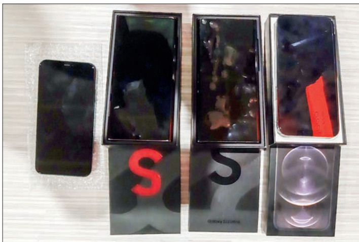
Seized illegal goods.

THE combined on-duty team under the supervision of Mandalay Region Illegal Trade Eradication Task Force captured an Isuzu tractor head and a trailer (approximately K63 million), headed to Mandalay from Muse, carrying 41 kinds of goods worth K191,171,459 including 690 sets of fuel pump assembly and 3,790 kilogrammes of cleaning liquid for carburetor that were not declared in the Import Declaration (ID) at the Milepost 25/6 on Muse-Man-