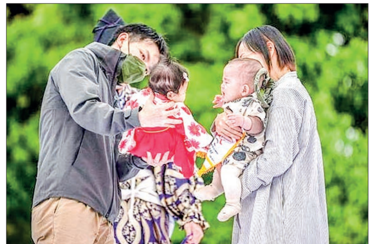
Kishida has vowed to double childcare spending over the next three years in a bid to help reverse the country's dwindling birth rate.

Despite its goal of reining in spending that has swelled in recent years amid the COVID-19 pandemic and a cost-of-living crisis, the government faces a high