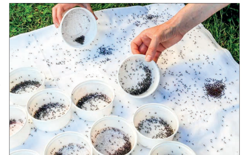
A photograph taken on 29 June 2023 shows plastic containers with sterile male Tiger mosquitoes that will be released, in Zagreb, Croatia. The purpose of releasing sterile male mosquitoes is to disrupt the natural reproductive cycle of the Tiger mosquito population.