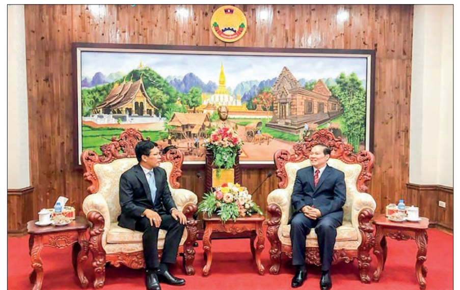
Ongoing discussions on Myanmar-Laos cooperation unfold in Laos.

THERE will be cooperation between Myanmar and Laos for the spread of Buddhism and they are working together to open border liaison offices as soon as possible according to the Ministry of Foreign Affairs.