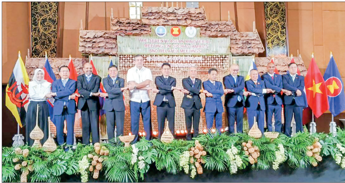
Union Minister U Min Thein Zan poses for the group documentary photo at the event in Chiang Mai, Thailand.

The representatives of the ASEAN member countries discussed the sports status plus issues related to prohibited