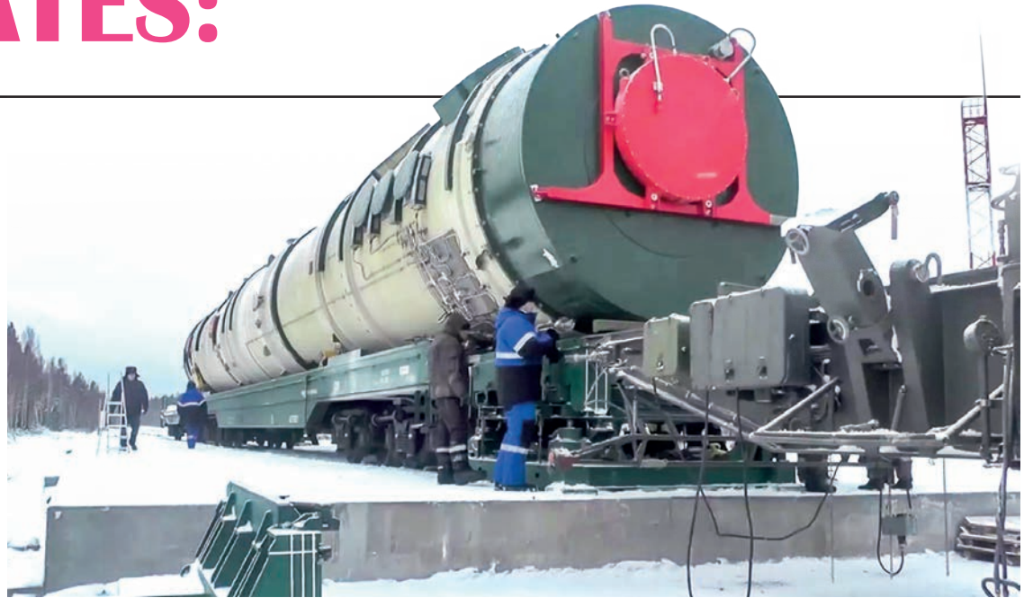
The Sarmat system is meant to replace RS-20 Voevoda missile systems. The new missile is capable of striking targets at long ranges using various flight trajectories

Russian President Vladimir Putin has emphasized the importance of maintaining combat readiness and improving Russia's nuclear triad, which includes land-based intercontinental ballistic missiles like the Sarmat system.