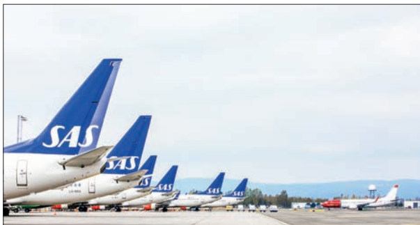
Scandinavian Airlines (SAS) on Friday reported its first quarterly profit since 2019, marking a significant turnaround from its filing for bankruptcy protection in July 2022.

kronor. Following the quarterly report, share prices of SAS rose 14 per cent to 0.42 kronor. — Xinhua