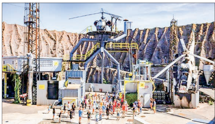
Seventy-five children between the ages of six and 16 are allowed to take part in each workshop.

While the actors' and writers' strikes in Hollywood freeze up film production around the world, stunt performers in Germany are biding their time putting on "adrenaline-packed" workshops for kids. — AFP