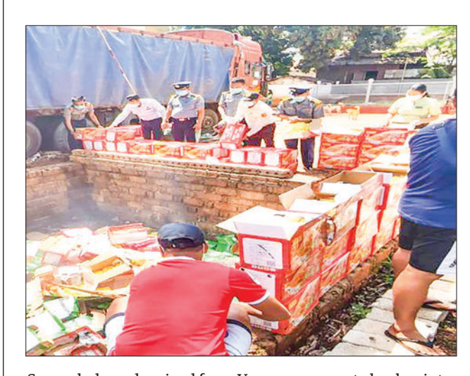
Smuggled goods seized from Yepu permanent checkpoint in Shan State (North) were being prepared for incineration.

In June, the Customs Department made 253 arrests and seized illegal goods worth K5,927.14 million at the Yangon International Airport, the Yangon port, the special customs posts, the Yangon General Post Office, and various customs areas. — TWA/CT