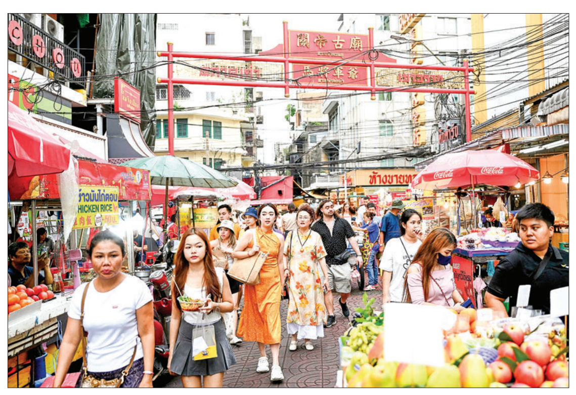
This photo taken on 4 July 2023 shows tourists walking along a street in the Chinatown area of Bangkok.

THAILAND'S employment growth slowed in the second quarter of this year as droughts affected farming despite improvements in the vital tourism sector with an inflow of foreign visitors, official data showed on Monday.