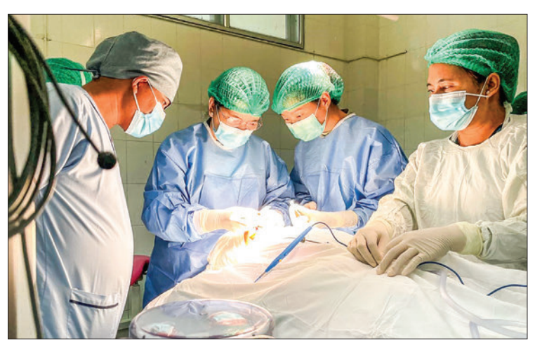
Oral and dental specialists performing the cleft lip surgery.

Moreover, the surgeons will continue free surgical care at Shwebo Township Hospital and Myeik General Hospital soon. Therefore, patients with cleft lips and palates across the nation can get free treatment at the outpatient departments of these general hospitals in addition to Yangon, Nay Pyi Taw and Mandalay General Hospitals.—MNA/KTZH