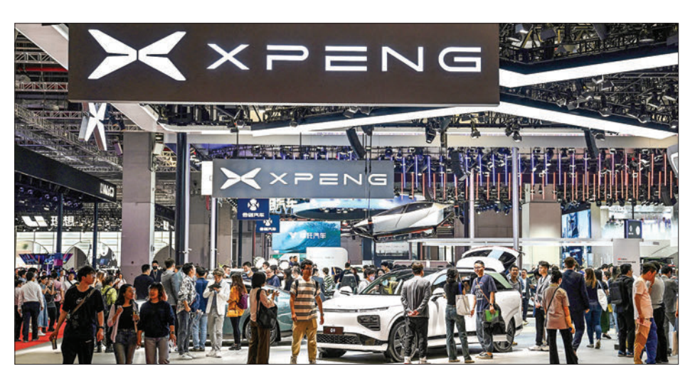
(FILES) People visit the Xpeng booth during the 20<sup>th</sup> Shanghai International Automobile Industry Exhibition in Shanghai on 19 April 2023.

XPeng will also partner with Didi to launch a new brand of electric vehicles next year. — AFP