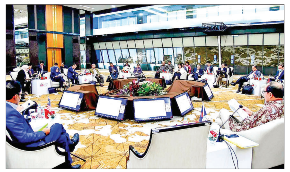
The tenth HLTF-ACV held in Jakarta on 26-27 August and attended by MIFER Deputy Minister Dr Wah Wah Maung-led Myanmar delegation.

MYANMAR delegation led by Dr Wah Wah Maung, an Eminent Person (EP) of Myanmar and Deputy Minister for Investment and Foreign Economic Relations attended the 10<sup>th</sup> Meeting of the High-Level Task Force on ASE-AN Community's Post-2025 Vision (HLTF-ACV), which was held