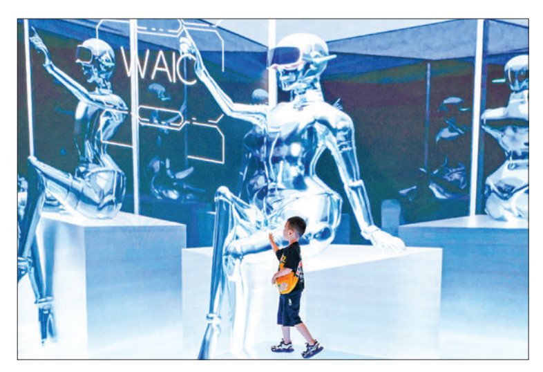
A child visits the World Artificial Intelligence Conference (WAIC) in Shanghai on 6 July 2023.

Yet the movement and linked ideologies like transhu-