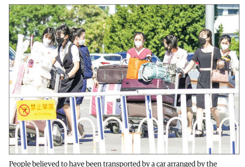
North Korean Embassy in Beijing are seen heading to Beijing Capital International Airport on 22 August 2023.

NORTH Korea's citizens abroad will be allowed to re-enter the country with one week of quarantine, state media said Sunday, as Pyongyang eased its strict COVID-19 border controls in place since early 2020.