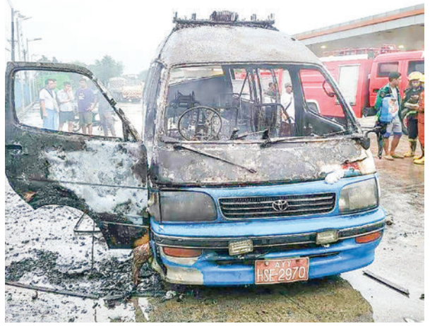
A burned ambulance.

A fire broke out in an patient. The fire started ambulance of the Social when the patient's de-Assistance Association pleted oxygen tank was while it was transporting being replaced outside the station, resulting in one member of the association being injured. Fortunately, the patient remained unharmed. to help transport a patient The car was completely burned down, and the injured member was transported to Sanpya Hospital, as stated by the person in charge of the Ayechan Phyusin Myiting station in Hlinethaya tashin social assistance association.