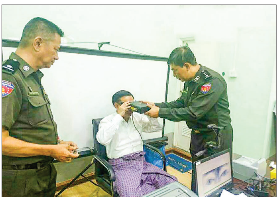
Efficient collection of biometric data using state-of-the-art machines.

The computer will generate 10 digits for every single person. The UID digit grant will not be concerned with the citizens/ non-citizens but it will be granted to all residents living in the country including citizens aged 10 years and above residing in the country, associate citizens, naturalized citizens, permanent residents (PRs) and permanent