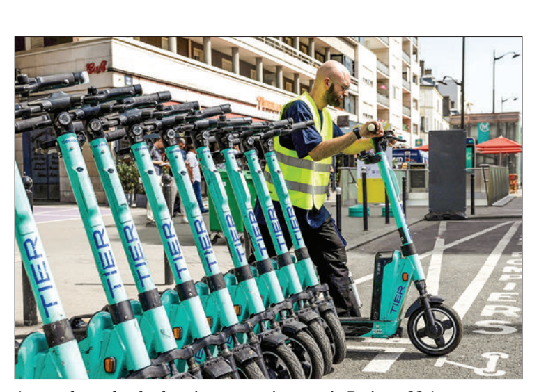
An employee loads electric scooters in a van in Paris on 23 August 2023. On 1 September, Paris will become the first European capital to ban publicly shared scooters from its streets, following a referendum in April, which showed that the residents considered them a nuisance.

But "so many people were sad" at the decision, said Paris-based American influencer