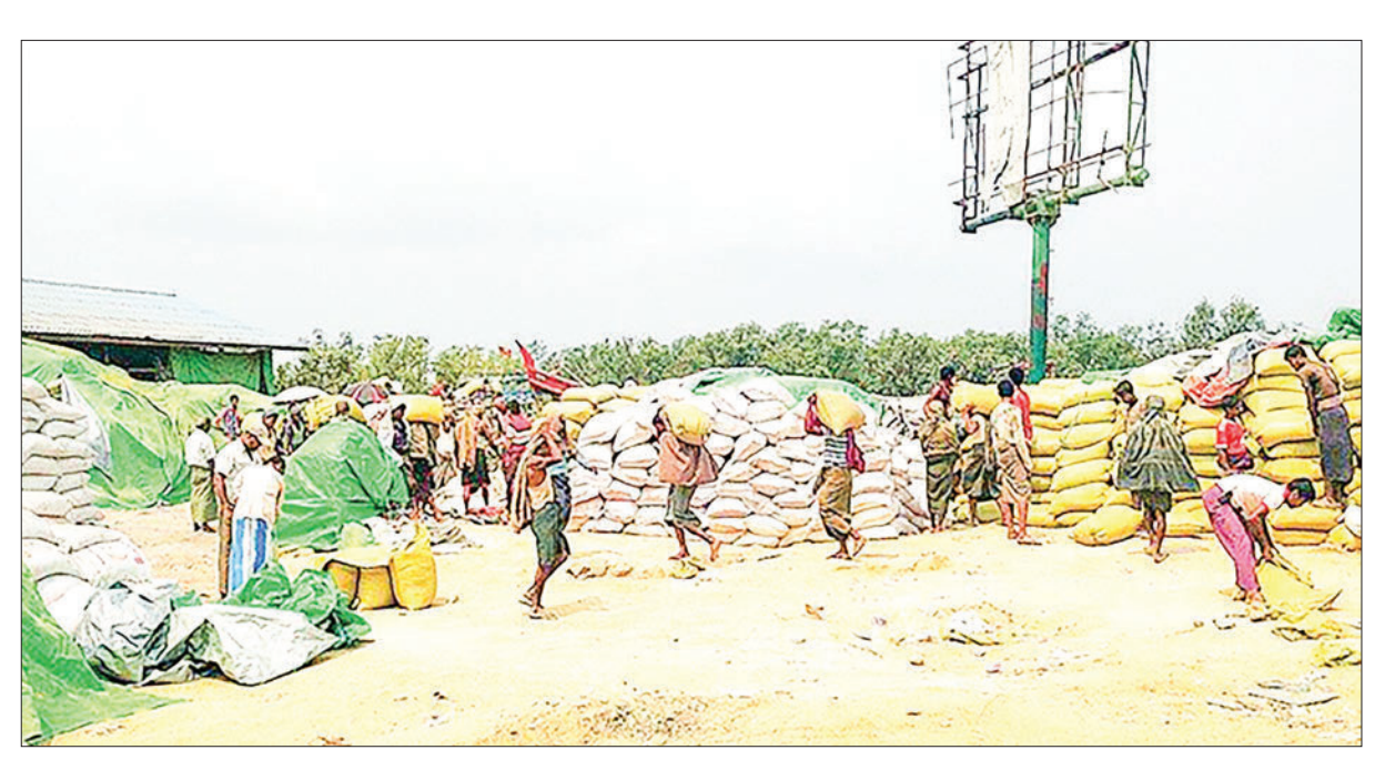
The photo shows cargo loading and unloading at the Maungtaw border.