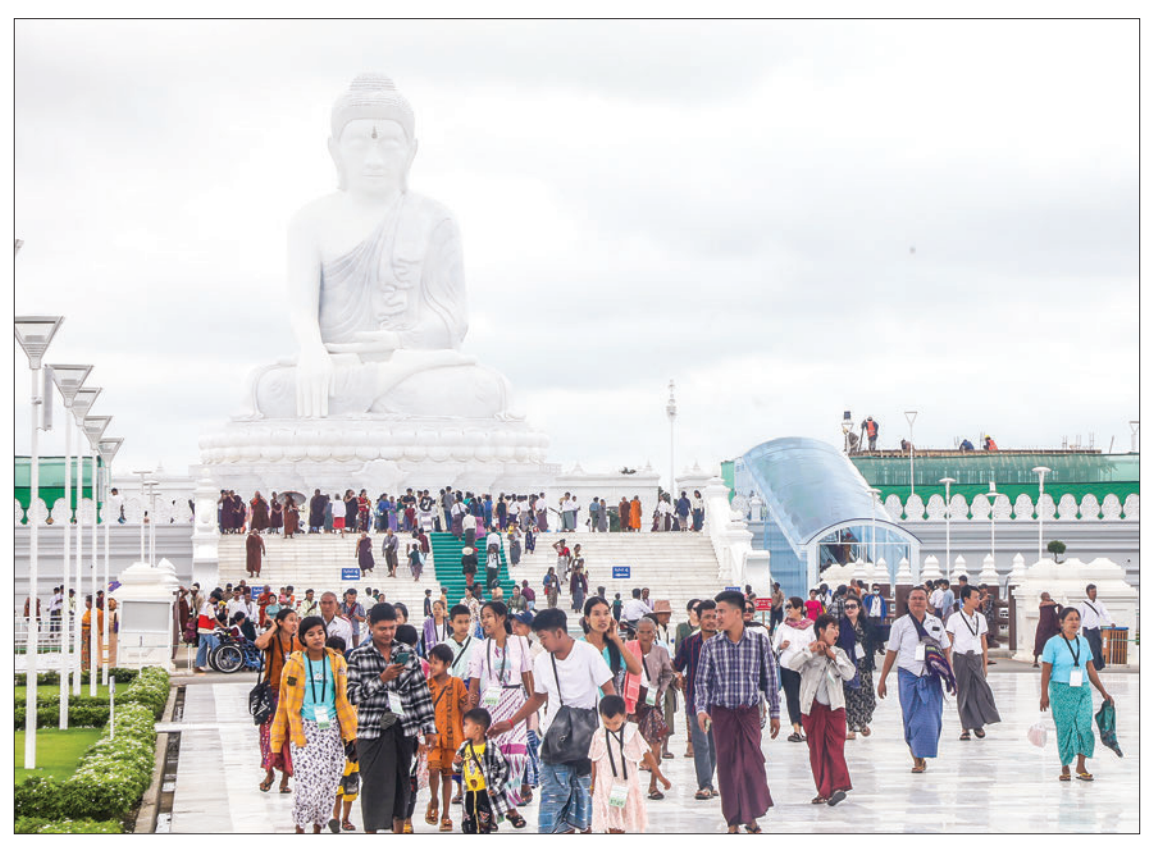
Devotees throng to the Maravijaya Buddha Image in Nay Pyi Taw yesterday.