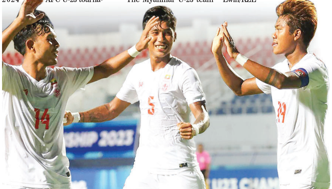
Myanmar players are seen celebrating during an international match.