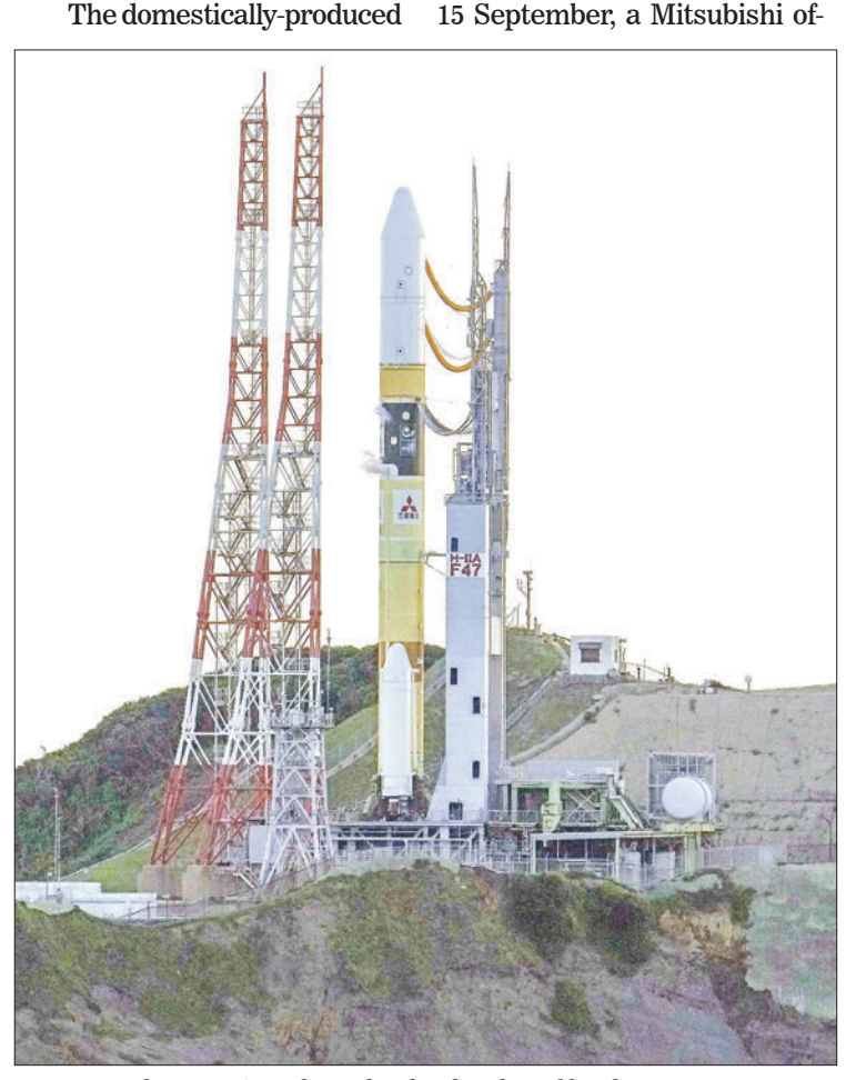
An H2A rocket carrying a lunar lander developed by the Japan Aerospace Exploration Agency is seen at Tanegashima Space Centre in Kagoshima Prefecture, on 28 August 2023.

The crew lifted off Saturday on the SpaceX Dragon space capsule, called Endurance, atop the Falcon 9 rocket from Kennedy Space Centre of the National Aeronautics and Space Administration in Florida. — Kyodo