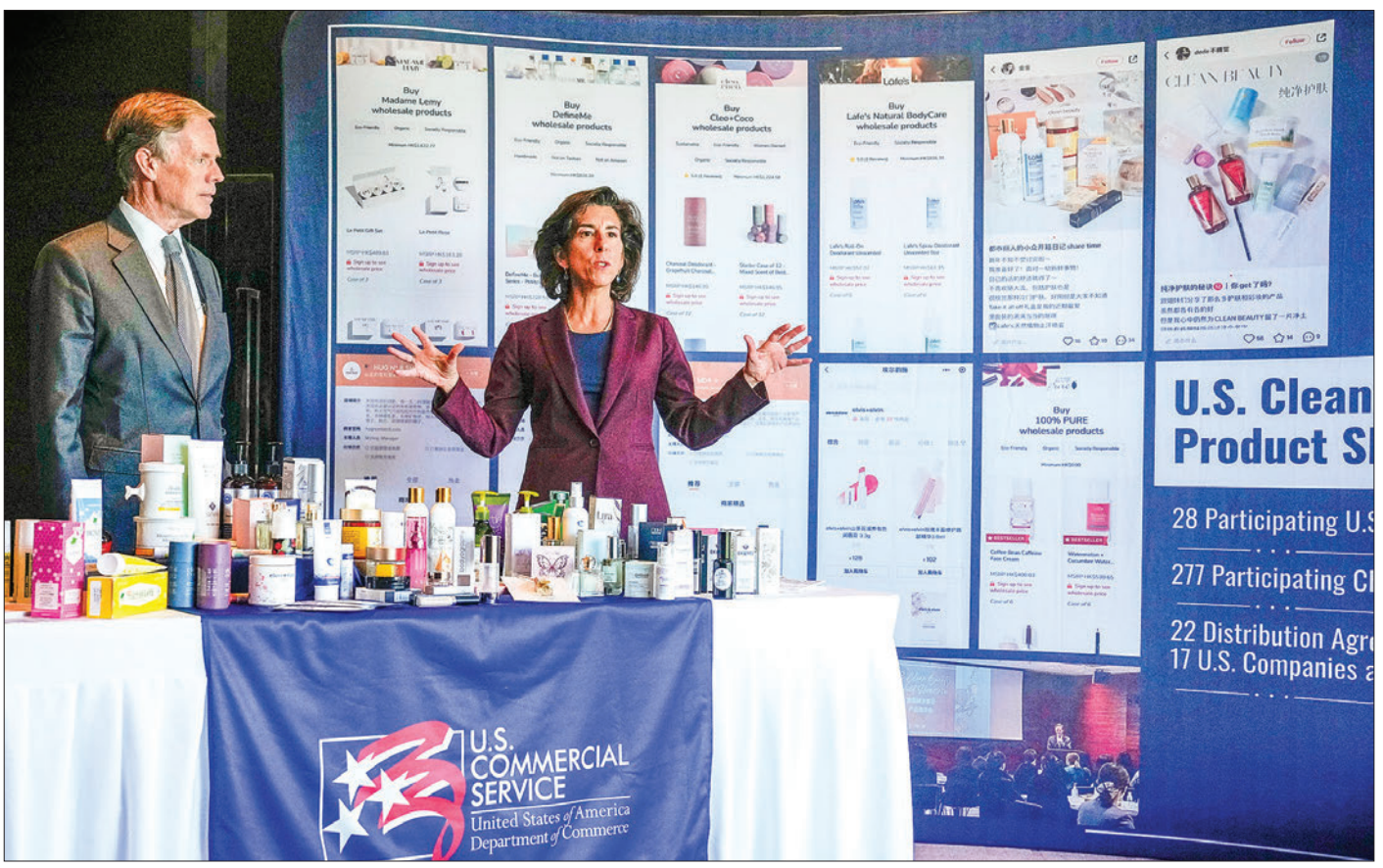
US Commerce Secretary Gina Raimondo (R) speaks next to US Ambassador to China Nick Burns as they visit a US beauty healthcare products showcase for the Chinese market, at a hotel in Beijing on 28 August 2023.