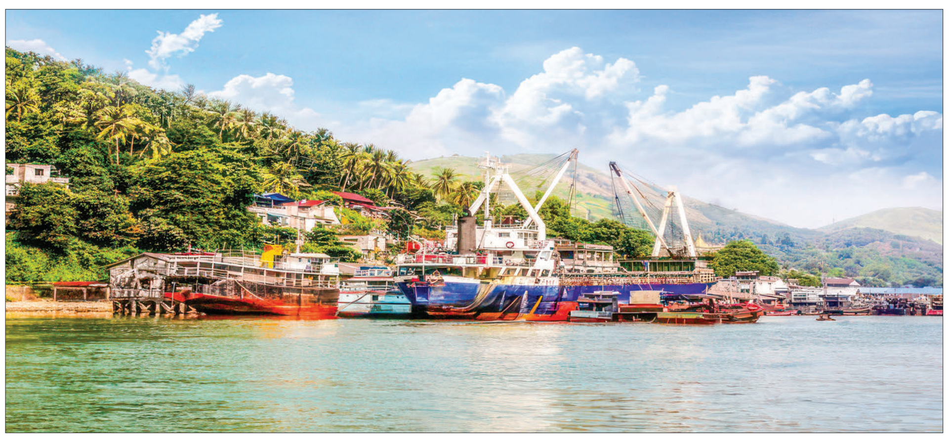
Captivating\ Panorama:\ Kawthoung\ Port,\ a\ key\ border\ trade\ post\ with\ Thailand,\ amidst\ Mawtaung,\ Hteekhee,\ Myawady\ and\ Tachilek\ borders.