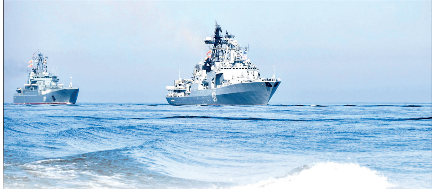
On 16 February 2021, Iran and Russia's armed forces started a joint naval exercise in the northern Indian Ocean to improve the security of maritime trade.

Iran aims to enhance maritime cooperation between itself, Russia, and China as a means to overcome the impact of Western sanctions. The strategy involves boosting maritime capabilities, trade, and military presence, using international corridors and networks.