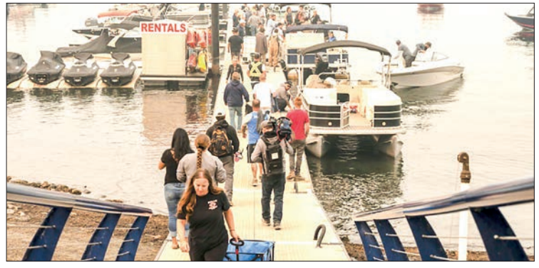
Community members load supplies onto to boats to move across Shuswap Lake for high alert and evacuated community areas that don't have road access as the Bush Creek East fire continues to burn in Blind Bay, British Columbia, 21 August 2023.

The company has been in a virtual showdown with Ottawa over the bill passed in June, but which only takes effect next year. — AFP