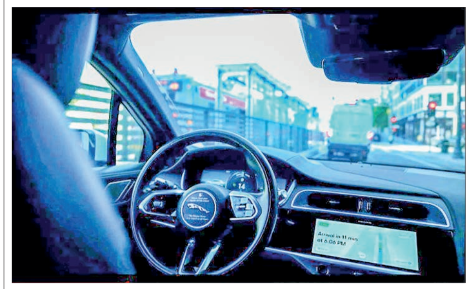
This 25 August 2023, screen grab shows a Waymo car in San Francisco, one of the driverless vehicles residents in the US city are starting to use get around town.

THIS California summer, passersby on the streets of San Francisco can be divided into two camps: blase locals who are used to a parade of moving cars with no drivers or gobsmacked tourists fumbling for their smart-