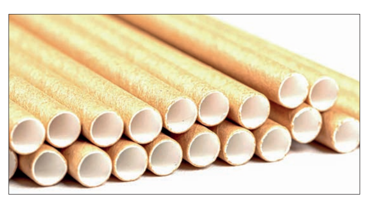
Paper straws were the worst offenders, with PFAS being found in 90 per cent of the straws tested during the study.

The Thursday-published study examined straws made from different materials from 39 different brands and found that PFAS [Per- and Polyfluorinated Substances] chemicals, com-