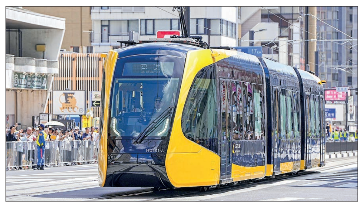
A Haga Utsunomiya Light Rail Transit train runs in Utsunomiya on 26 August 2023.

The tram system has been designed with features that cater to the needs of the elderly and wheelchair users, keeping in mind Japan's aging society.