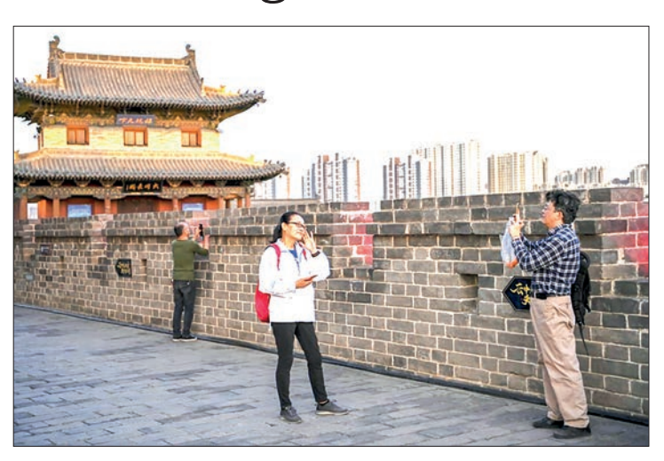
Visitors take photos on the ancient city wall in Datong, north China's Shanxi Province, 8 June 2023.

"It carries cultural connotations like blessings, protecting the house and wealth crea-