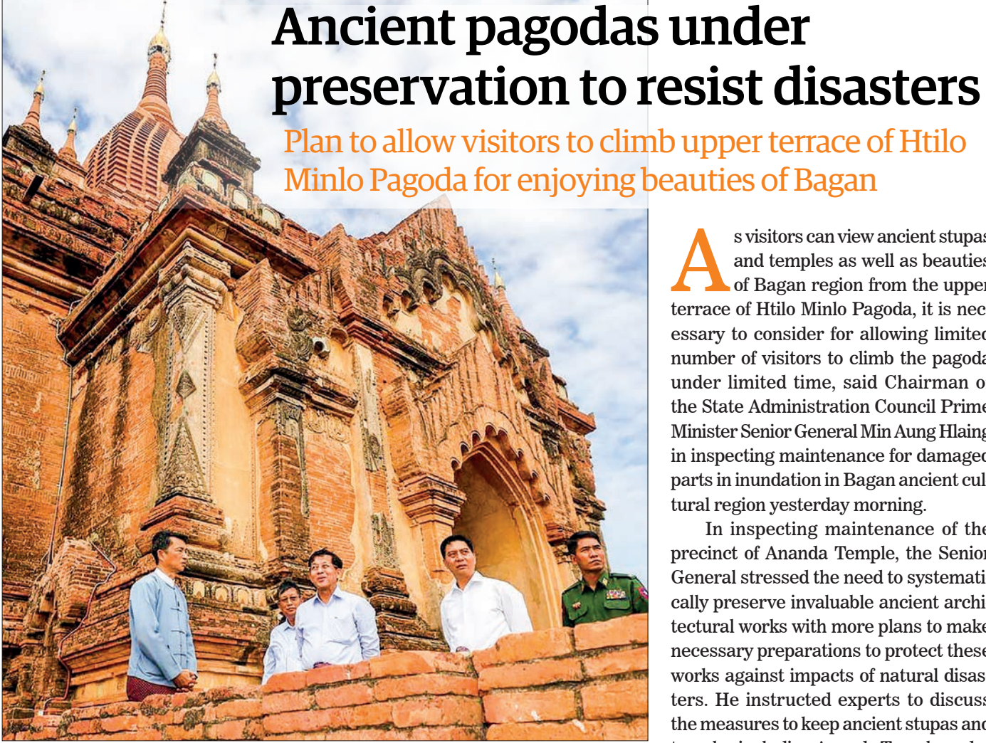
Chairman of the State Administration Council Prime Minister Senior General Min Aung Hlaing inspects maintenance works of Htilo Minlo Pagoda in Bagan on 27 August 2023.

s visitors can view ancient stupas and temples as well as beauties of Bagan region from the upper terrace of Htilo Minlo Pagoda, it is necessary to consider for allowing limited number of visitors to climb the pagoda under limited time, said Chairman of the State Administration Council Prime Minister Senior General Min Aung Hlaing in inspecting maintenance for damaged parts in inundation in Bagan ancient cul-