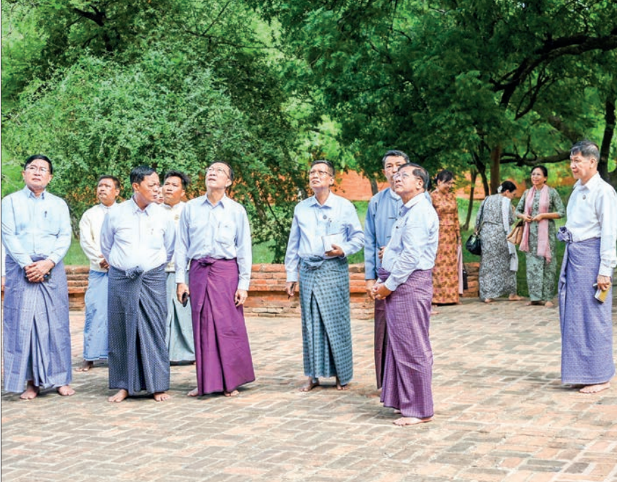
Chairman of the State Administration Council Prime Minister Senior General Min Aung Hlaing views round maintenance of Culamani Temple in Bagan ancient cultural region on 27 August 2023.