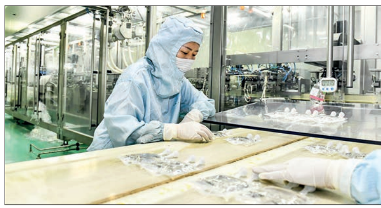
A staff member works on the production line of medical injections at a pharmaceutical company in Rizhao Hi-Tech Industrial Development Zone.

plans on promoting high-quality development of the pharmaceutical and medical equipment