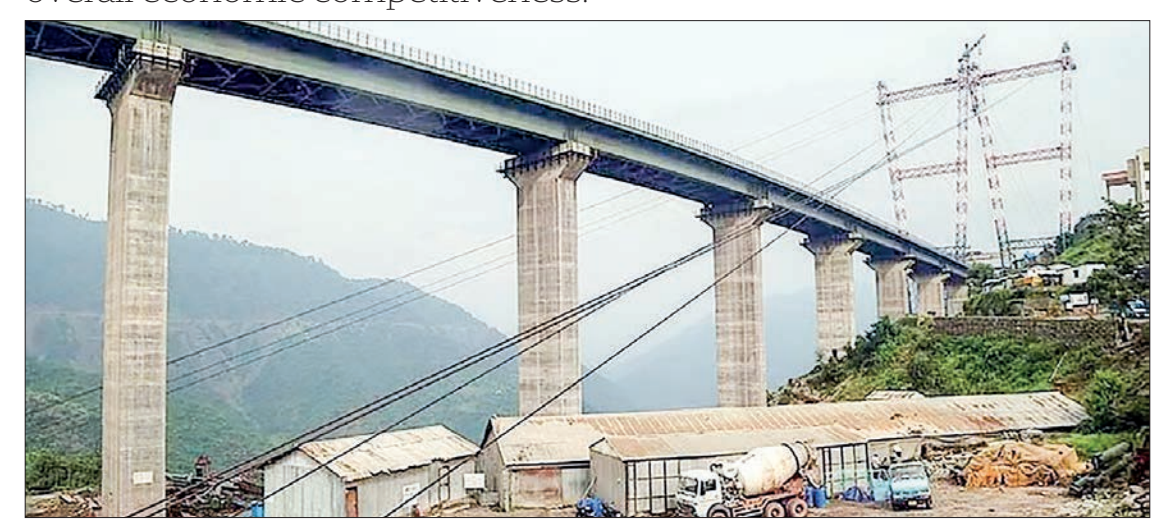
India has been actively focusing on infrastructure development to support its rapidly growing economy, improve connectivity, and enhance the quality of life for its citizens.

Brende emphasized the importance of India's ongoing commitment to economic reforms. These reforms play a critical role in creating a business-friendly environment, attracting investments, and enhancing overall economic competitiveness.