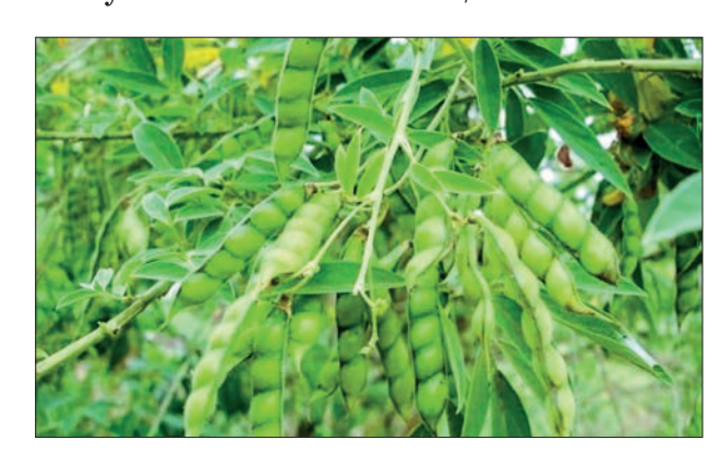
A pigeon pea plantation thriving in dry region of Myanmar.

India mainly imports black gram from Myanmar and pigeon peas from Myanmar and Africa. Due to such demand in the Indian market, black gram and pigeon peas reached new record prices in 2023 in the history of the Myanmar bean market. — TWA/CT