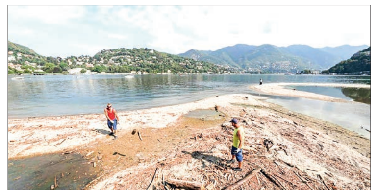
Photo taken on 13 July 2022 shows a low level of Lake Como in Como, Lombardy region, Italy.

The total area impacted by fires is more than three times the size of the city of Milan in northern Italy. Even though the summer of 2022 was affected by drought and heatwaves, the weather this year has been even more extreme with record high temperatures in many parts of the country. The back-to-back heatwaves have also had a cumulative effect, leaving forests more vulnerable. –