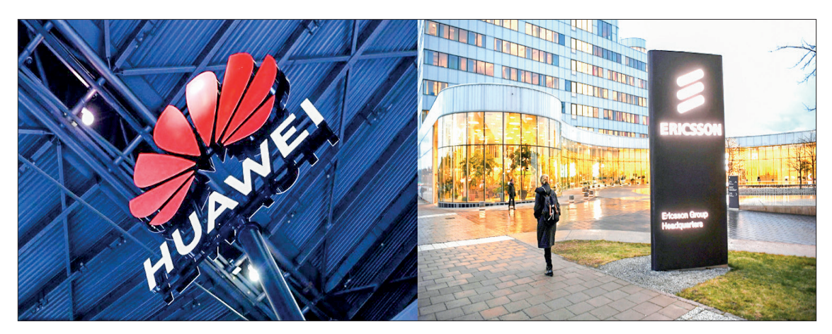
Huawei, a major Chinese telecoms company, has announced the renewal of a licensing agreement with Ericsson, a leading global telecommunications technology provider.

The agreement enables both companies to continue utilizing each other's technologies, fostering collaboration and innovation in the telecom sector.