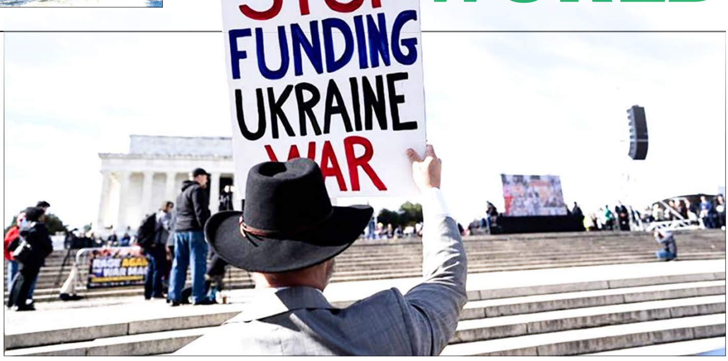
A demonstrator holds a slogan during the anti-war rally in Washington, DC, the United States, 19 February 2023.