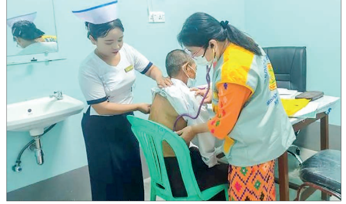
The specialist and health staff make medical checkup for the patient.