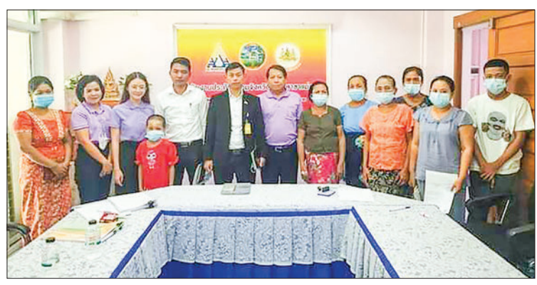
Families of Myanmar seamen are seen receiving compensation.

ACCORDING to the labour attache's office, compensation has been granted to four out of the seven families of Myanmar seamen affected by the oil tanker explosion during maintenance in a Mekong River tributary in Samut Sakhon Province, Thailand.