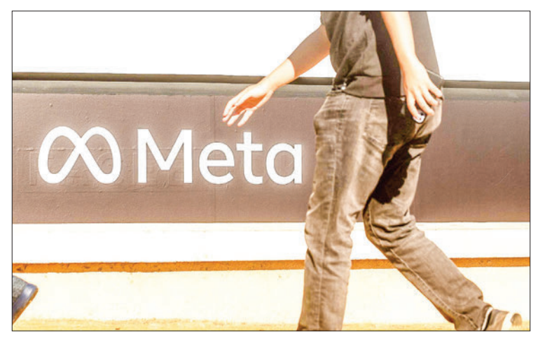
US tech heavyweight Meta formally requested a Norwegian court to postpone the implementation of a ban on behavioural marketing reliant on users' personal data.

On 1 August, the social media giant said it would ask users in the European Union, Norway, Iceland, Liechtenstein and Switzerland to give their consent before allowing targeted advertising on its networks. — AFP