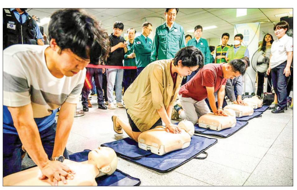
People receive CPR training, practicing on dummies, during a civil defence drill against possible attacks by North Korea, in an underground train station in Seoul on Wednesday.

cars and ordered people to head to underground shelters in South Korea's first civil