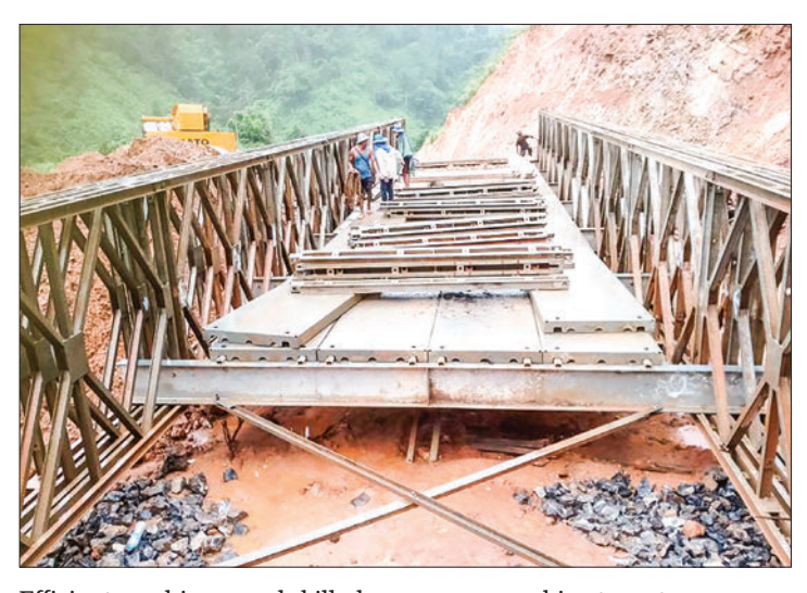
Efficient machinery and skilled manpower combine to restore Myawady-Kawkareik Road's damaged section.

AFTER heavy rains triggered a landslide on the Myawady-Kawkareik section on Asian Highway in Kayin State on 7 August, disrupting traffic, swift action was taken. The Kayin State government and the State Highways Department initiated the construction of a temporary Bailey bridge on 10 August. Currently, the bridge is 70 per cent complete.