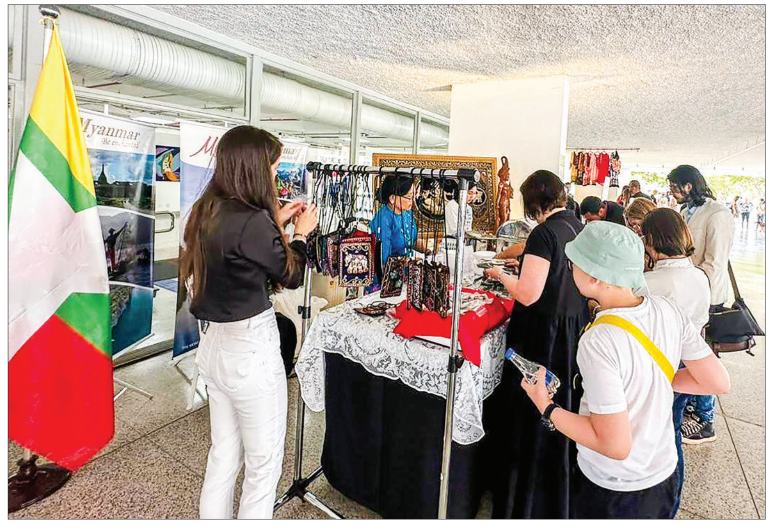
Enthusiastic visitors are seen exploring Myanmar's traditional food and handcrafted treasures at the Asian Food and Culture Bazaar in Brazil in the third week of August.

The AOLA will donate the funds to orphanages, nursing homes for elderly citizens, the disabled and poor communities in Brazil via the philanthropic organizations. — ASH/KTZH