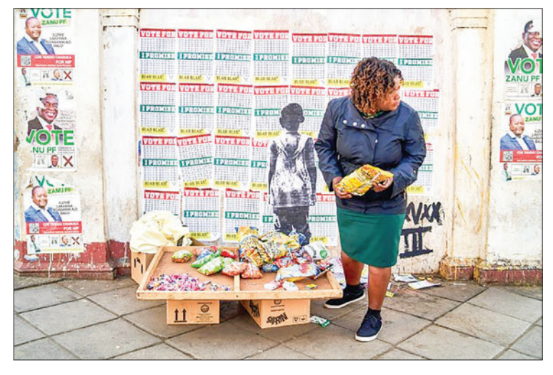
The opposition has party has complained about being unfairly targeted by authorities. PHOTO: AFP

The opposition is hoping to ride a wave of discontent over the southern African country's economic woes that include high inflation, unemployment and widespread poverty. — AFP