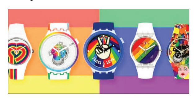
Swatch is a Swiss watchmaker known for its colourful and innovative designs.

In May, authorities raided Swatch stores at 11 malls across Malaysia, confiscating 172 watches they described as having "LGBT elements". -AFP