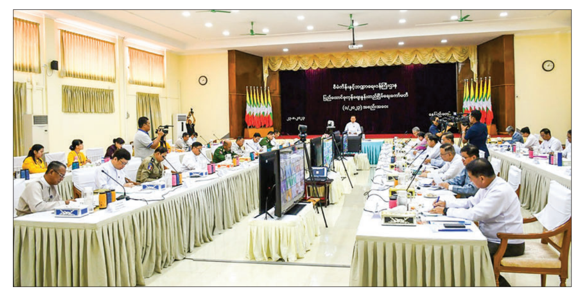
Deputy Premier and Union Planning & Finance Minister U Win Shein chairs Union Price Stability Committee's 1/2023 meeting yesterday.

He then urged the relevant committees and organizations to provide the farming and livestock sectors, support the manageable scale industry and work together with region/state departmental organizations to ensure price stability. — MNA/KTZH