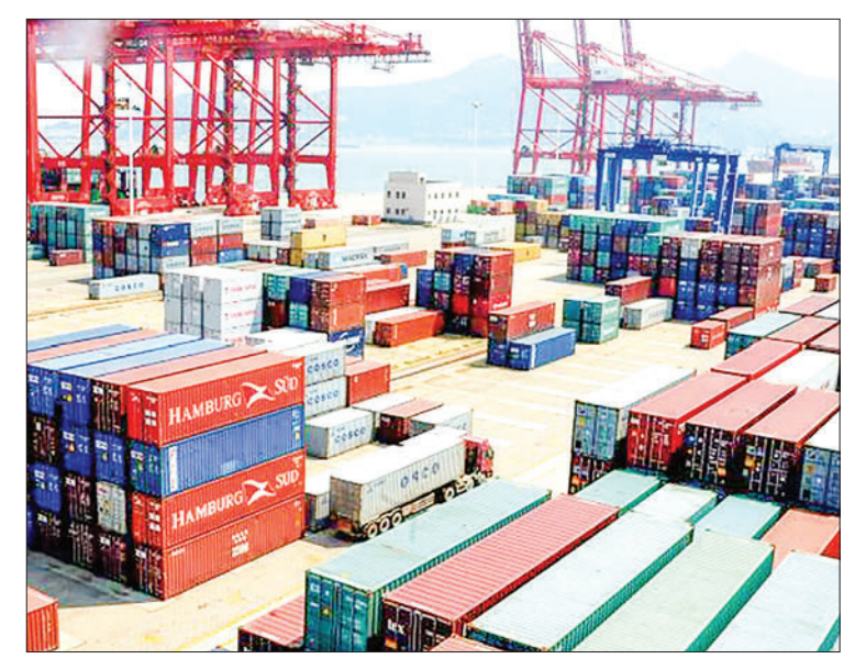
Containers at a cargo port.

For the 2019-2020 financial year, initial projections placed the budget deficit and GDP