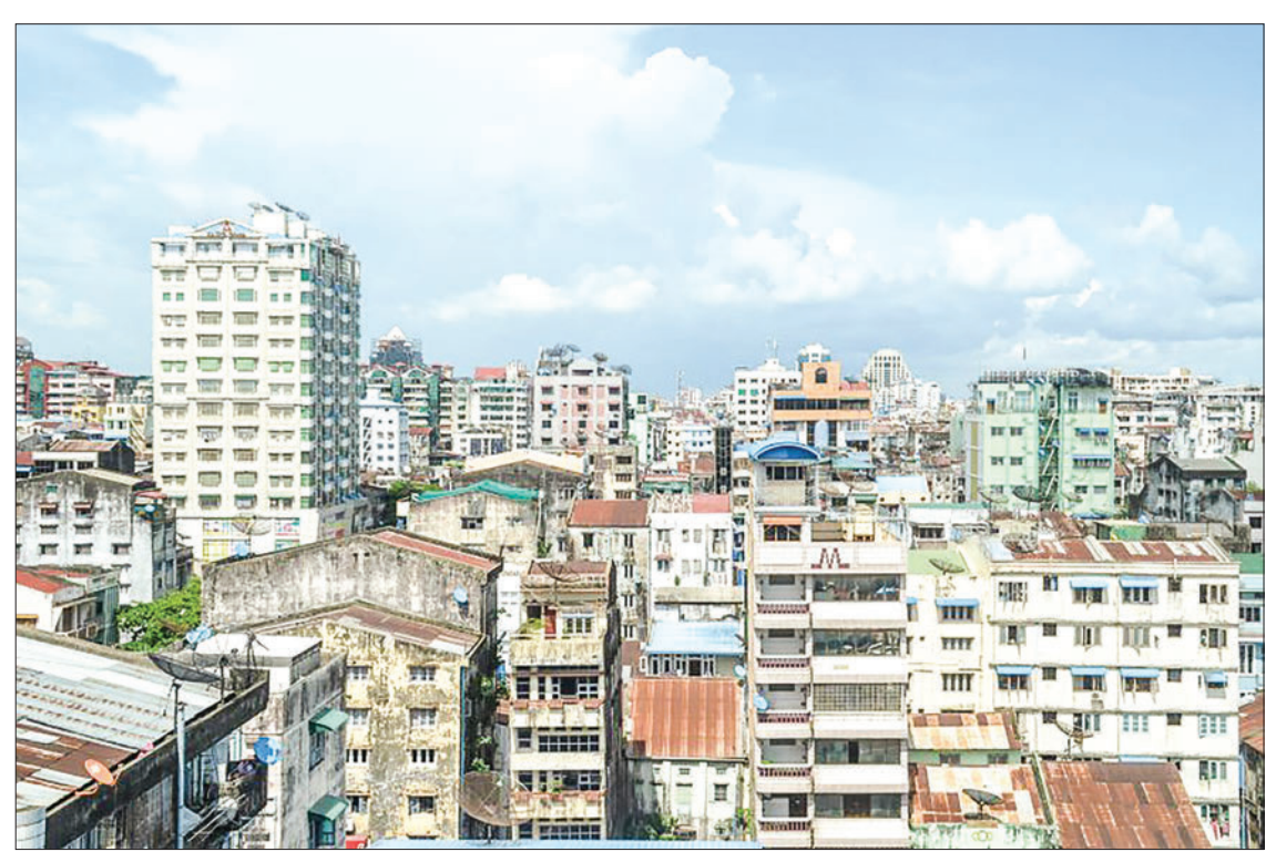
Capturing Yangon City's Urban Landscape: A glimpse of towering high-rise structures

"First, the opening price was K55 million. Then, the price jumped to 60 million. The owner of the apartment seems to de-