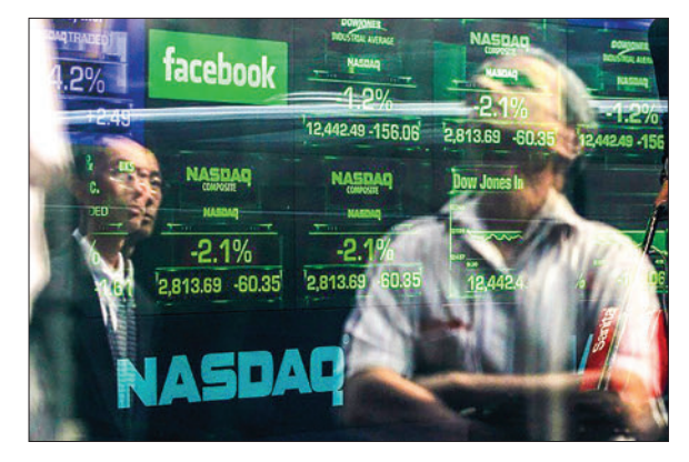
Arm will soon get its moment in the IPO spotlight.

That would be the largest listing on the tech-oriented Nasdaq since electric vehicle manufacturer Rivian went public in 2021 with a market value of $68 billion. — AFP