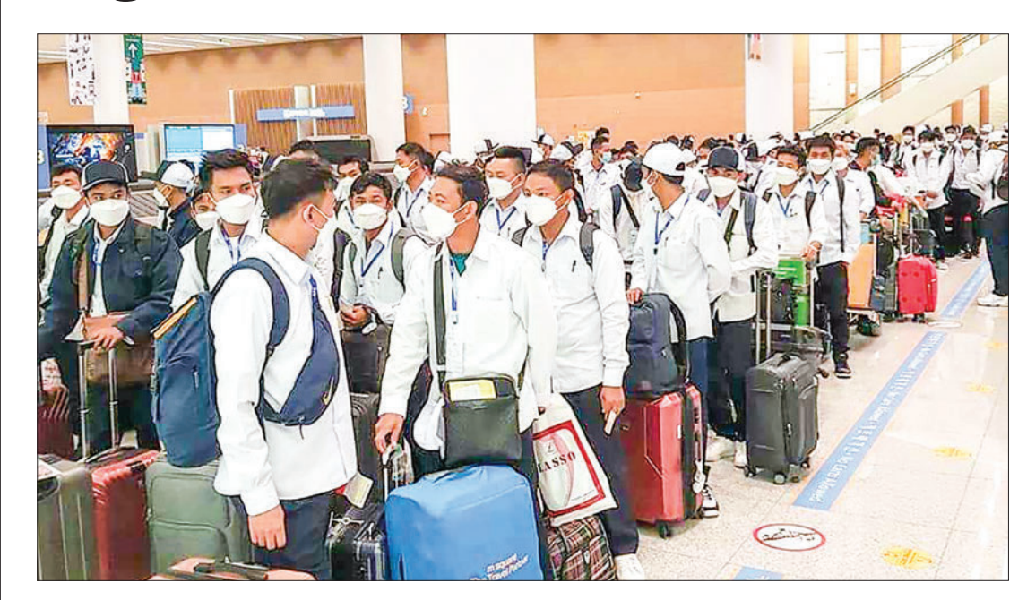
Myanmar migrant workers are seen going for work abroad at the airport.

THE Ministry of Labour plans to reduce the duration of a course on regional knowledge of a certain country being provided to locals who are about to work abroad, according to the ministry.