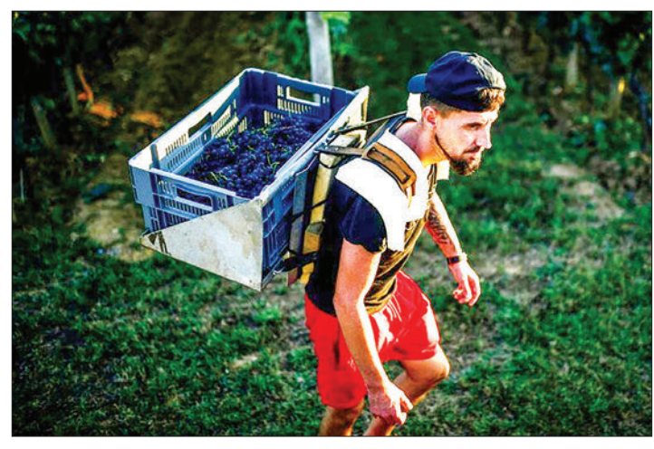
Some grape pickers have suffered health problems as a result of the heat.

GRAPE-PICKERS were out in French vineyards Tuesday bringing in this year's harvest in "torrid" conditions as temperatures shot past 40C in some areas of the country during a "heat