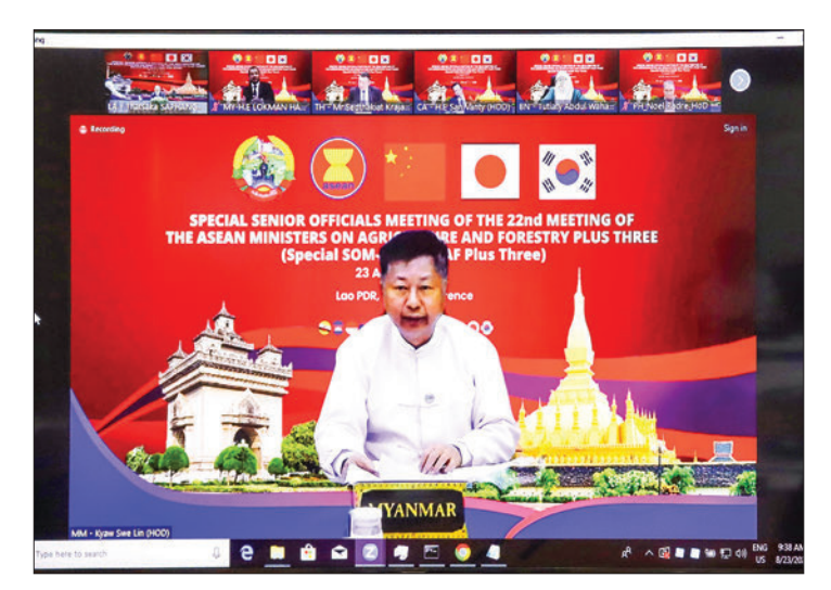
The 22<sup>nd</sup> Special Senior Officials Meeting of the 44<sup>th</sup> Meeting of the ASEAN Ministers on Agriculture and Forestry Plus Three in progress through videoconferencing.

THE 22<sup>nd</sup> Special Senior Officials Meeting of the 44th Meeting of the ASEAN Ministers on Agriculture and Forestry Plus Three took place through videoconferencing on 22-23 August. The event was hosted by the Laos People's Democratic Republic.