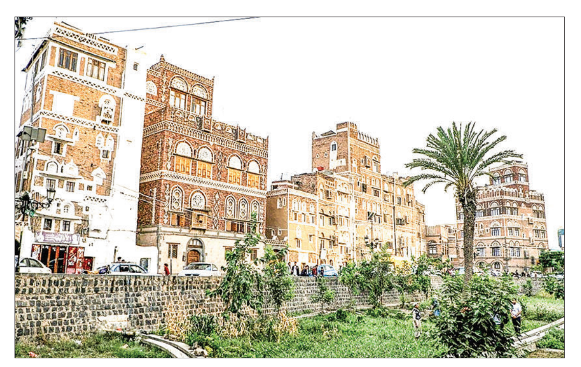
A picture shows a view of Unesco-listed buildings in the old city of the Yemeni capital Sanaa 12 July 2023.

DOAA al-Waseai spent many happy years working as a tour guide in the Old City of Yemen's capital Sanaa, showing foreigners its hidden hammams and markets teeming with silver and spices.