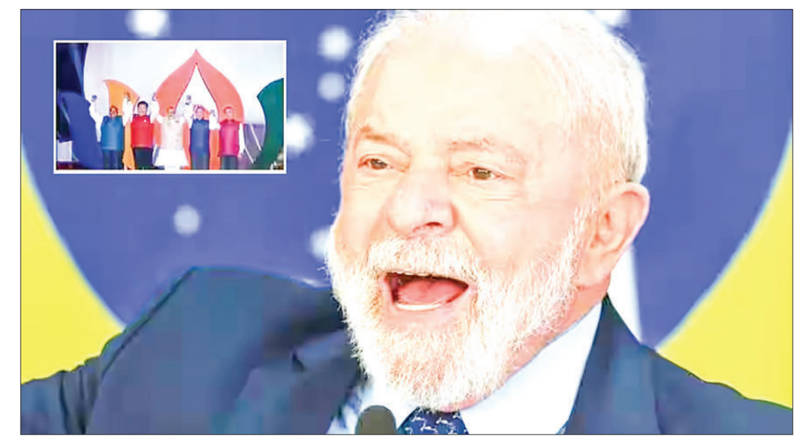
Brazilian President Luiz Inacio Lula da Silva has called for the creation of a shared trading currency among BRICS countries as a countermeasure to the dominance of the US dollar.

In April, he proposed possibly creating a common regional