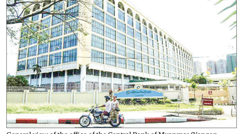
General view of the office of the Central Bank of Myanmar (Yangon branch).