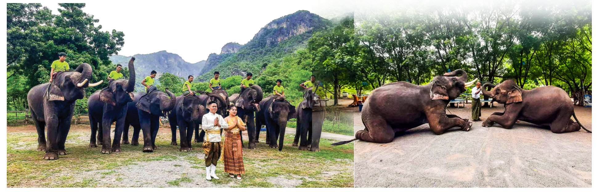
Wahnet elephant camp completes its preparations to welcome visitors who come to have joyful and relaxing experience during the upcoming domestic tourism season (top and above photos).

The entrance fee to the elephant camp is set at K1,000 per person, K3,000 for the short journey, K5,000 for the long journey, K10,000 for foreigners and K10,000 for short and long journey for elephant riding service. Free entry is set for children, monks and nuns.