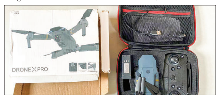
Smuggled Drone X Pro (drone with battery) worth K300,000 without official documents seized at the EMS international express on -22 August 2023.

A total of six arrests were made on 22 August, with an estimated value of K250,383,603, as reported by the Illegal Trade Eradication Steering Committee. — MNA/MKKS