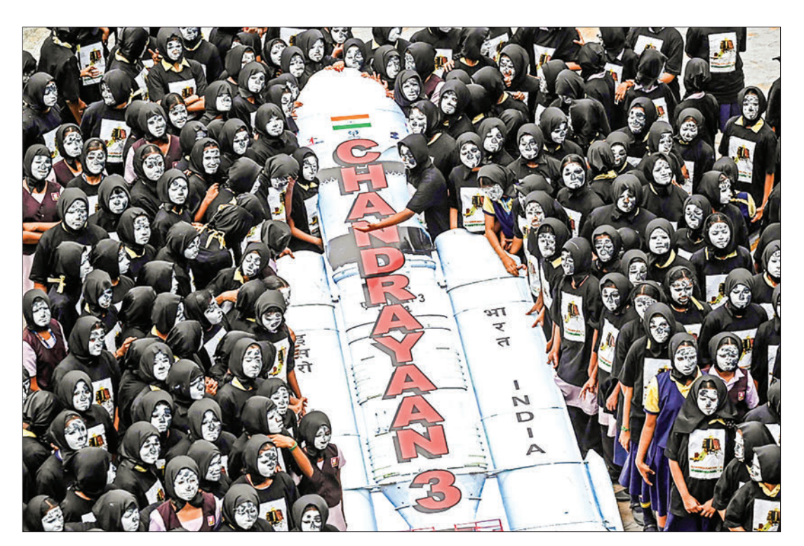
Students with painted faces surround a replica of the Chandrayaan-3 spacecraft in Chennai on 22 August 2023.