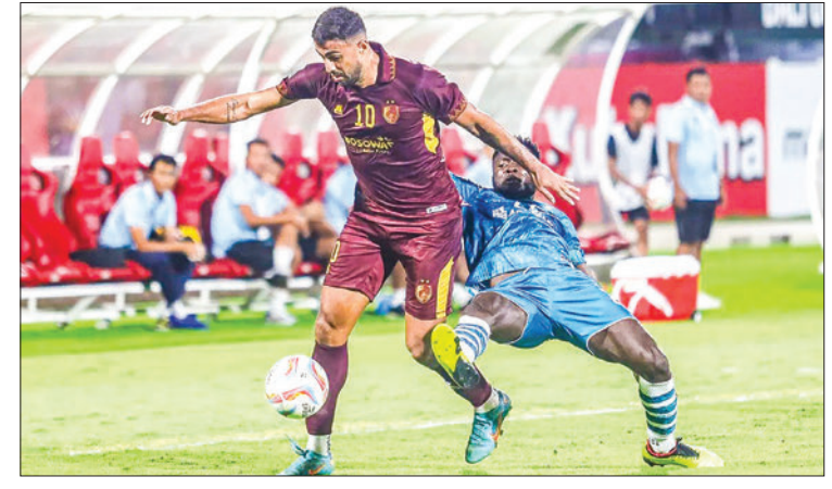
A PSM Makassar player (red) blocks Yangon United player during the AFC Cup ASEAN Zone Qualifier Play-off match played on 23 August 2023.

The Yangon team previously qualified for the play-off stage by defeating Brunei club DPMM at home by 2-1, but lost to the Makassar team and failed to advance to the final round of the tournament.