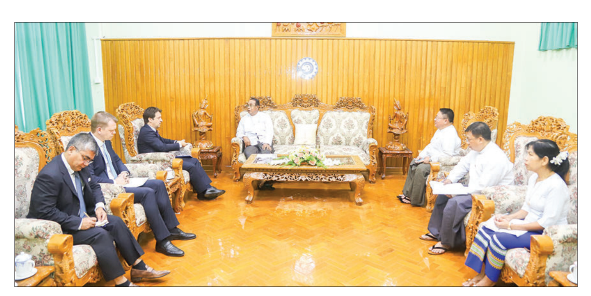
Union Minister for Labour U Myint Naung receives Chief of Mission of the International Organization for Migration (IOM) Myanmar Mr Dragan Aleksoski at the Ministry of Labour, Nay Pyi Taw on 23 August 2023.

ing processes under the MoU between the Department of Labour and IOM as well as MoU between the ministry and the IOM. Their discussion also included opportunities to cooperate between them and the support of the IOM to the people of Myanmar in the field of migration and cooperation between the two sides.