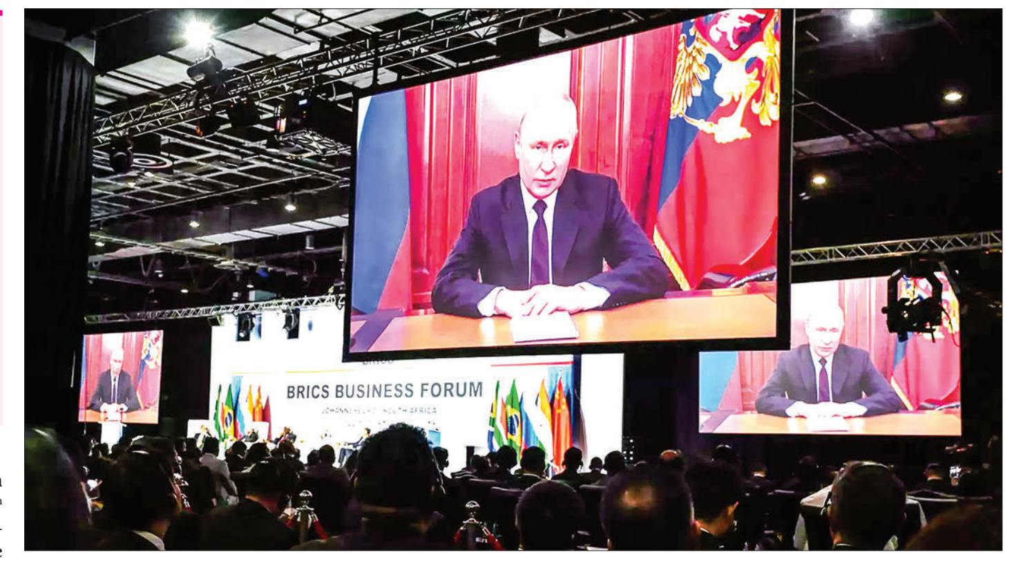
Russian President Vladimir Putin advocated for the establishment of a permanent transport commission within the BRICS framework, focused on advancing logistics.

Putin says it is high time to establish permanent commission on transport