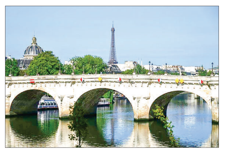
Downturns in the European Union's biggest economies, France and Germany, have led to an overall decline in activity in the eurozone.

ures in our GDP nowcast leads us to the conclusion that the eurozone will shrink by 0.2 per cent in the third quarter," said Cyrus de la Rubia, chief economist at Hamburg Commercial Bank.