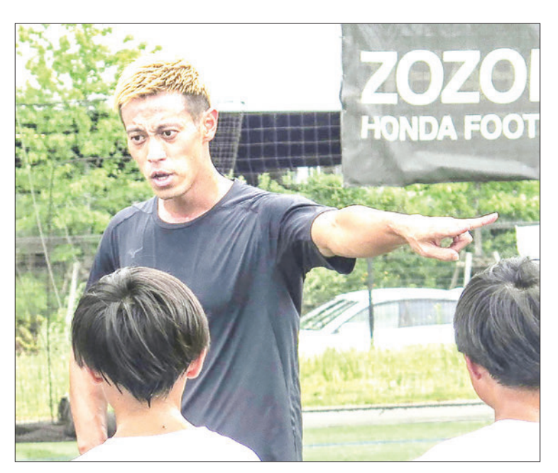
Former Japan international Keisuke Honda instructs young football players in the eastern Japan city of Chiba on 1 August 2023, after announcing the organization of a national competition for the Under-10 age group.

As Honda aims to "support challengers," losing teams get to enter other tournaments as many times as they want.