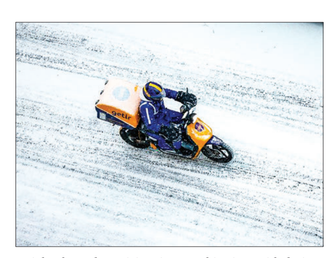
Getir has been downsizing since reaching its zenith during the coronavirus pandemic.

The layoffs will come in five countries where Getir intends to maintain operations — Türkiye, Britain, Germany,