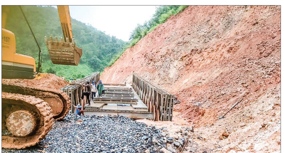
Progress\ underway: Construction\ of\ Bailey\ bridge\ in\ full\ swing.

goods vehicles to resume passage as construction advances. Concurrently, the efficient construction of the bridge approach and the temporary Bailey bridge's pavement on the Myawady-Kawkareik section on Asian Highway is ongoing. To ensure smooth operations, a security team led by a lieutenant-colonel from the Kawkareik station is providing tight security. — IPRD/KZW