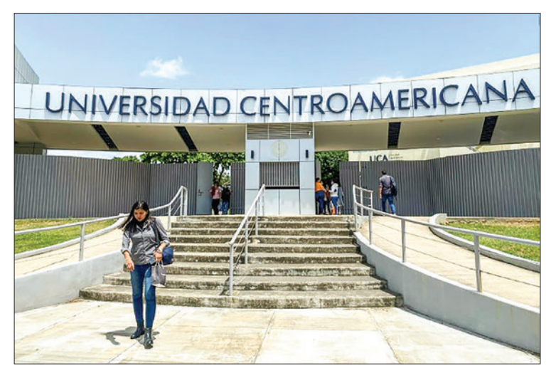
The Jesuit Central American University (UCA) of Nicaragua announced the suspension of all its activities after a court ordered the confiscation of its assets and funds after accusing it of being a "centre of terrorism".