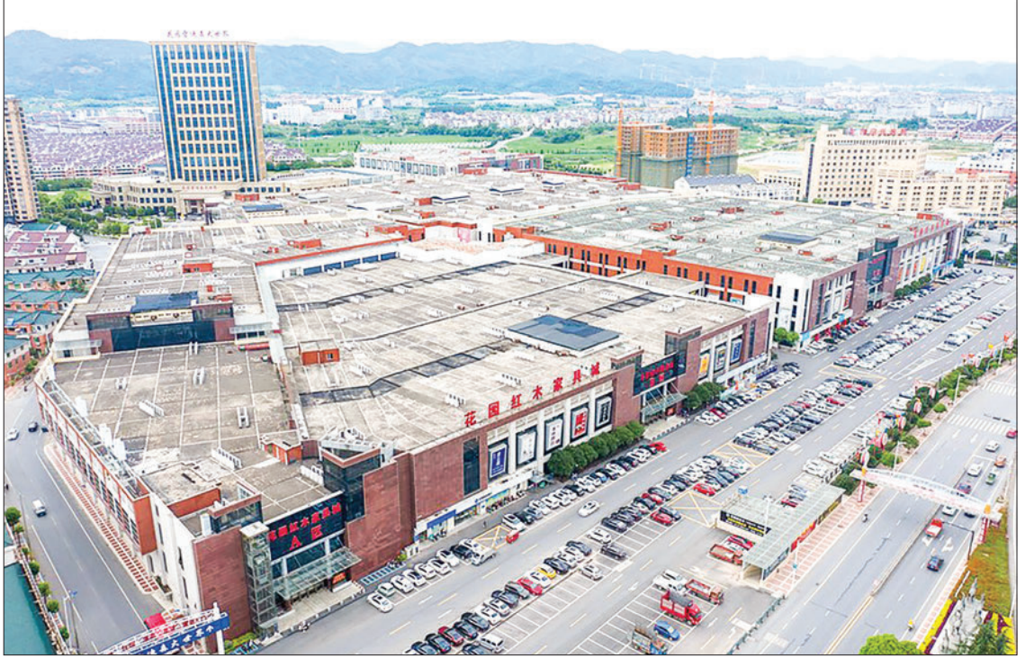
This aerial photo taken on 19 June 2023 shows a mahogany furniture market in Huayuan Village of Nanma Town, Dongyang City, east China's Zhejiang Province.

funding will also support digitalby rural business entities and ization and chain-store venture encourage qualified rural areas