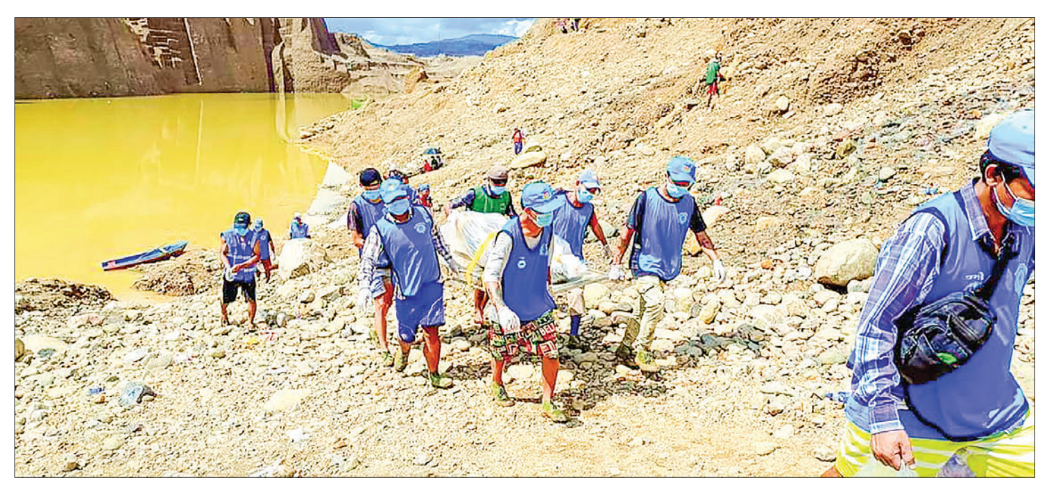
Members of the rescue teams are seen carrying the discovered bodies while onlookers involving family members of missing jade miners and local people watch the scene at the incident site in Phakant's jadeland area.

RESCUE teams stopped their search after the bodies of 33 jade scavengers had been discovered from a landslide, according to the civil society organizations that are involved in rescue efforts.