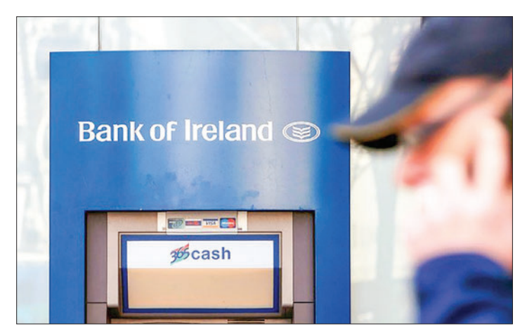
The bank warned customers that withdrawals and transfers, including those over normal limit.