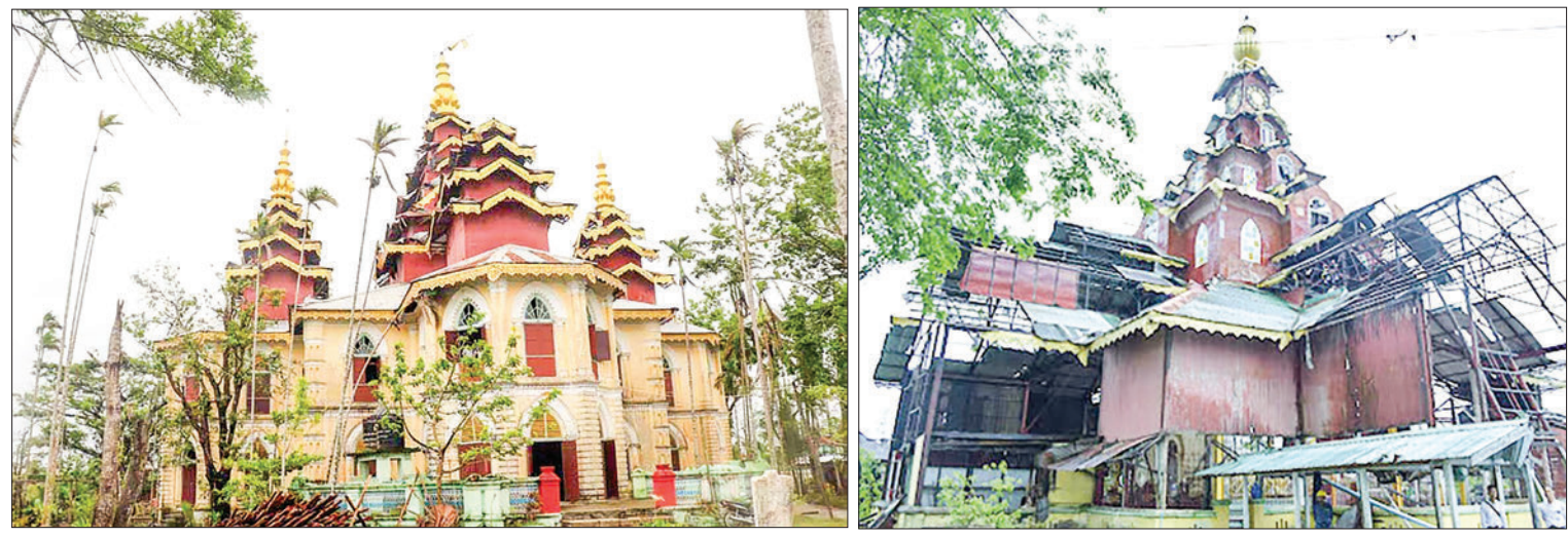
Photos show the 106-year-old U Ye Kyaw Thu Monastery – locally called "Than Kyaung" as it was constructed largely of iron.

"It has begun the repair works on Mocha-hit U Ye Kyaw Thu monastery and Thakyamuni ordinaiton hall since