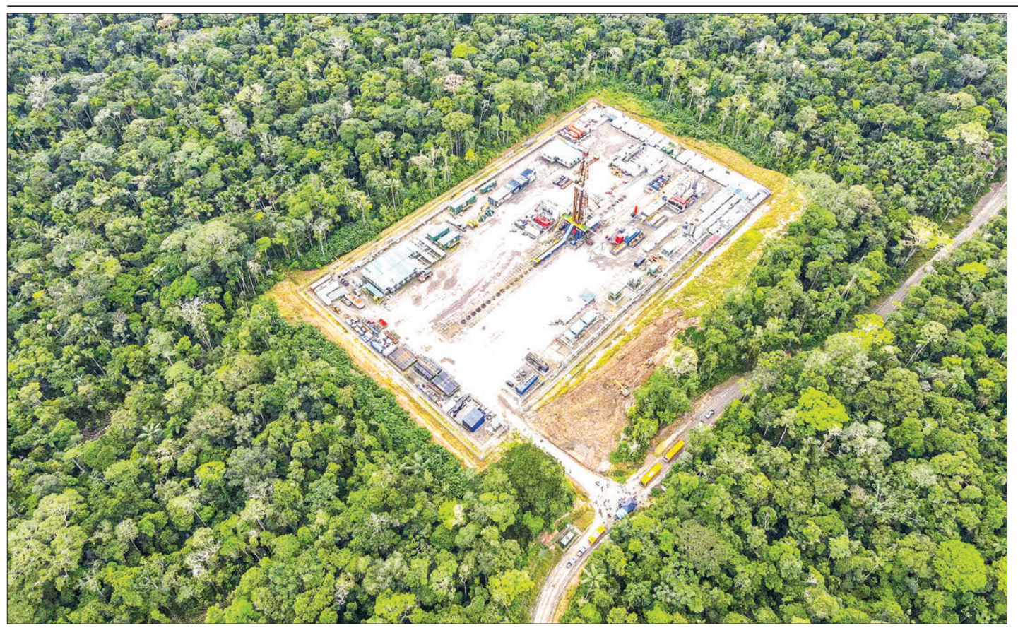
A Petroecuador oil platform is seen in Yasuni National Park in June 2023.