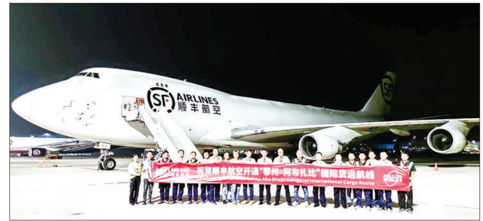
This photo taken at wee hours of 16 August 2023 shows the launch ceremony for SF Airlines's first cargo route connecting Ezhou Huahu Airport with the Middle East at Ezhou Huahu Airport in Ezhou City, central China's Hubei Province.

A weekly round-trip air cargo service is scheduled for this route, with a total of around 200 tonnes