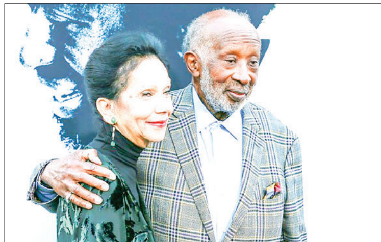
Music executive Clarence Avant and his wife Jacqueline Avant in 2019, attending the premiere of Netflix’s documentary on his life, ‘The Black Godfather’.

“Through his revolutionary business leadership, Clarence became affectionately known as ‘The Black Godfather’ in the worlds of music, entertainment, politics, and sports,” the statement said. — AFP