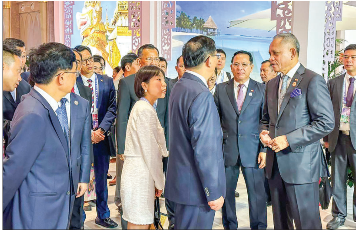
Union Ministers Dr Kan Zaw, U Maung Maung Ohn and U Aung Naing Oo from Myanmar join the launching of the 7 th China-South East Asia Exposition, the 27 th China Kunming Export and Import Fair in Kunming of Yunnan Province in China on 16 August 2023.

Union Ministers joined the launching of 7 th China-South East Asia Exposition, 27 th China Kunming Export and Import Fair.