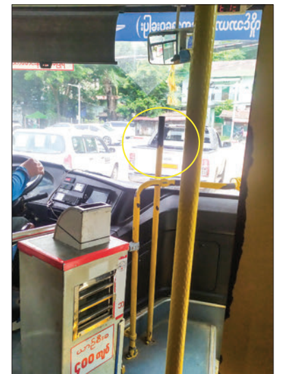
The photo shows a YBS vehicle disconnecting the POSS machine on 16 August.

Yangon Payment Service (YPS) Company, facilitating seamless payments through over 200,000 cards, has encouraged reporting license plate and bus line numbers for action against vehicles with inactive or disconnected POSS machines.