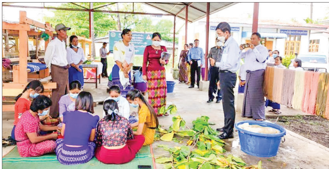
Officials are seen meticulously inspecting the pioneering smart village development project.

Myanmar boasts over 64,000 villages spanning Nay Pyi Taw and all its regions and states. The smart villages established through this project stand as exemplars, illuminating the path of development for every village across the nation. — TWA/KZL