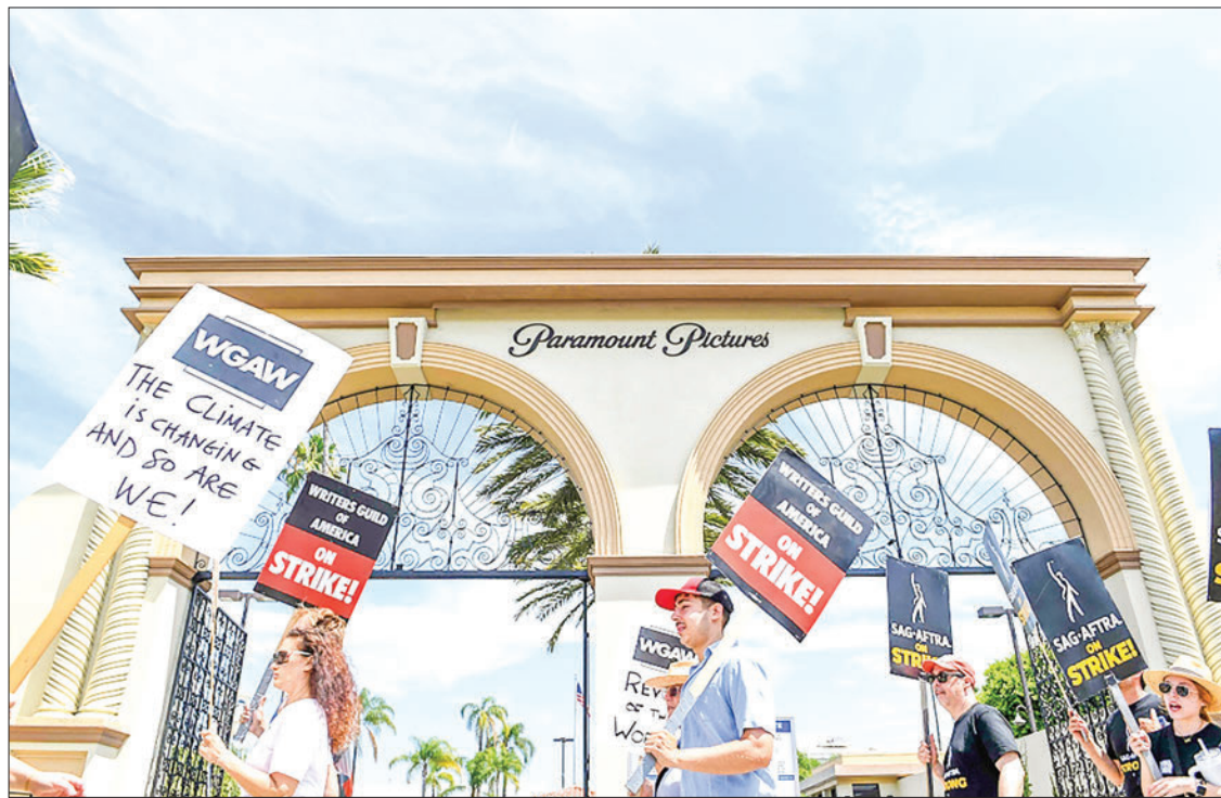
Members of the Writers Guild of America and the Screen Actors Guild walk a picket line outside of Paramount Pictures, in Los Angeles, California, on 21 July 2023.

Although their cause is seen by many as justified, its economic repercussions reached well beyond the glitz and glamor of the entertainment capital to all