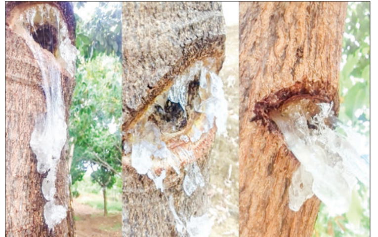
The photo shows collecting sap from a plant.

It is pertinent to note that the exclusive avenue for individuals seeking employment in Korea through the EPS system is facilitated by the government's overseas employment agency. — TWA/CT