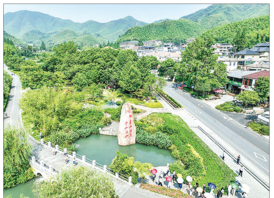
This aerial photo taken on 11 August 2023 shows tourists visiting Yucun Village of Anji County, east China's Zhejiang Province.

Xi proposed the concept on 15 August 2005, when he was visiting Yucun Village in east China's Zhejiang Province, where he praised the villagers' decision to shut down limestone mines and cement factories after the industry caused severe damage to the local environment. Xi was then the Party chief of Zhejiang. — Xinhua