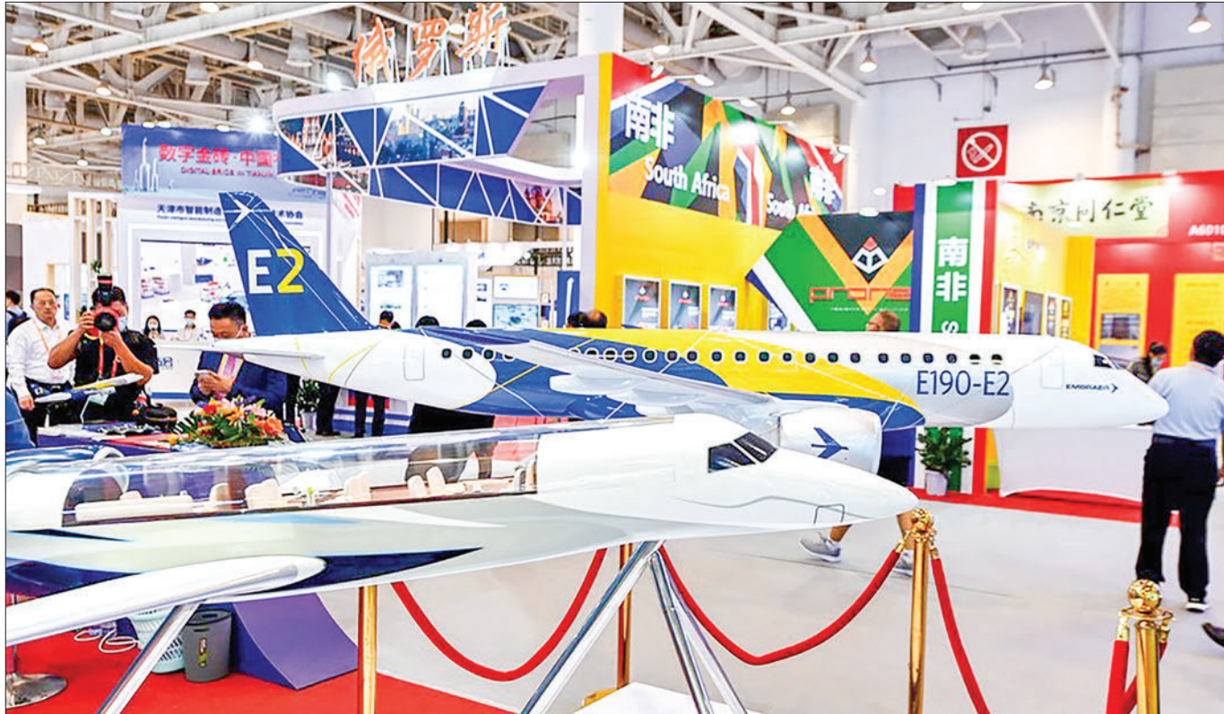
Photo taken on 8 September 2021 shows models of jets during an exhibition on BRICS New Industrial Revolution held in Xiamen, southeast China's Fujian Province.