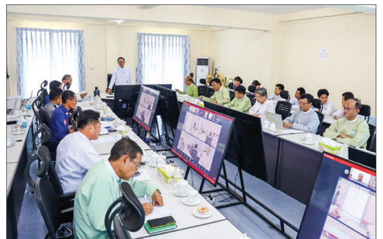
A coordination meeting on tuna fishing vessels to be allowed in progress in Nay Pyi Taw.