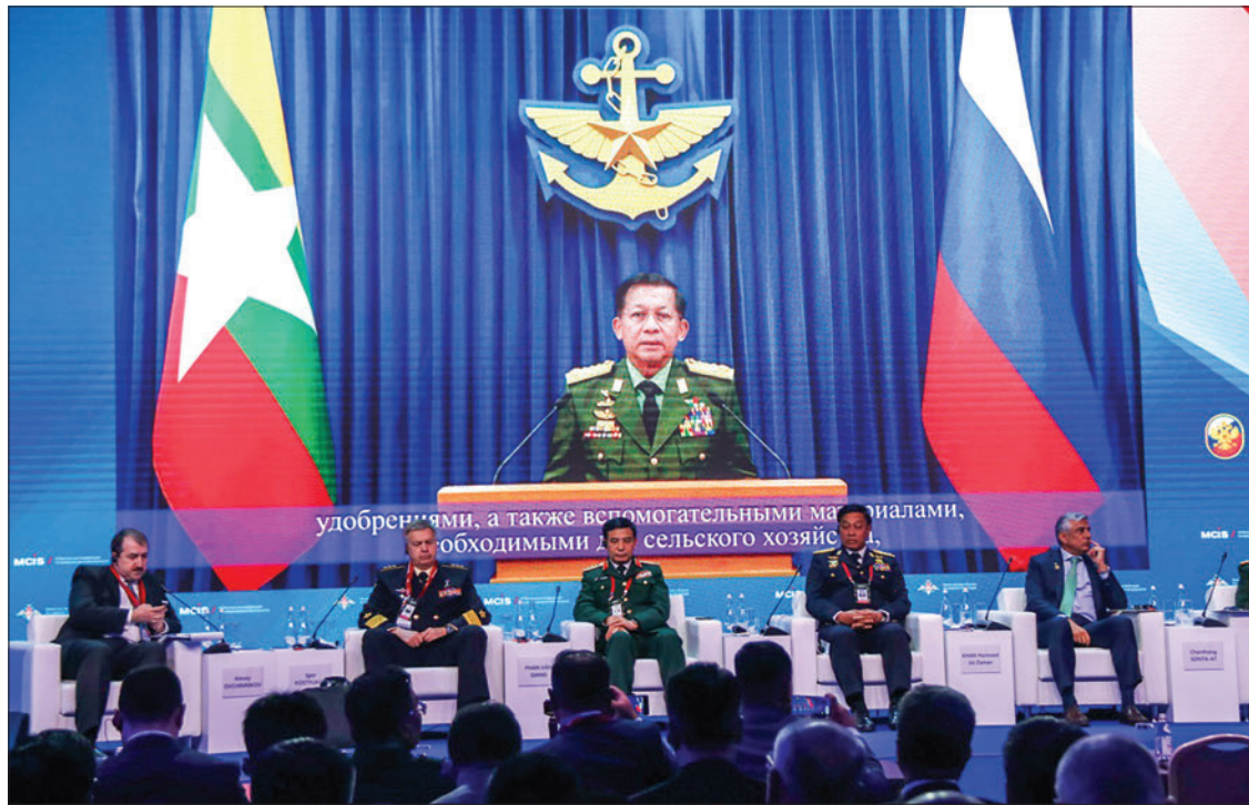
Senior General Min Aung Hlaing, Chairman of the State Administration Council and Commander-in-Chief of Defence Services, participates in the 11 th Moscow Conference on International Security (MCIS) 2023 through the video message sent yesterday.

He continued to say that the Asia-Pacific region produced 8.3 per cent of the global oil production in 2022 and used 38 per cent of the global oil production to meet the local demand. According to the IEA statistics, the region demands 30.8 million barrels