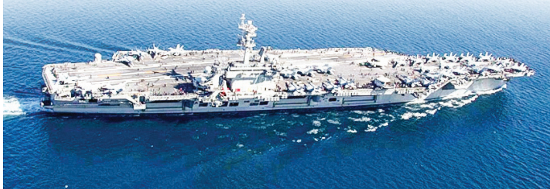
As Iranian seizures threaten oil tankers plying the Gulf, the United States is raising its military presence — a move long demanded by Gulf Arab states who accused Washington of retreating from the region.