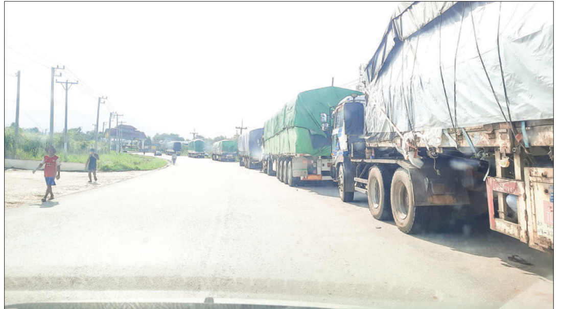
Lorries are seen waiting to pass the Myawady Trade Zone on the Myanmar-Thai border.