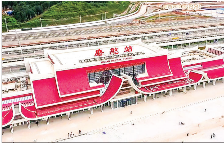
The photo shows Mohan Railway Station in Mengla County, Xishuangbanna Dai Autonomous Prefecture, Yunnan, China.

Thailand's fruit exports to China have increased considerably since the China-Laos Railway began operation in December 2021, Auramon said, noting that shipments through the Southeast Asian country's Northeast dry port of Nong Khai bordering Laos were recorded at 1.96 billion baht (55 million U.S. dollars) in 2022, jumping from 90.41 million baht (2.55 million dollars) in the previous year.