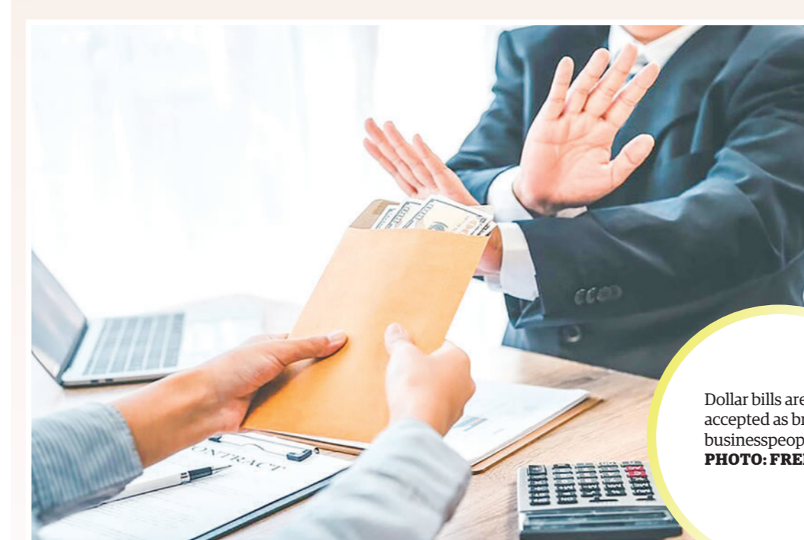
Dollar bills are accepted as bribes by businesspeople.