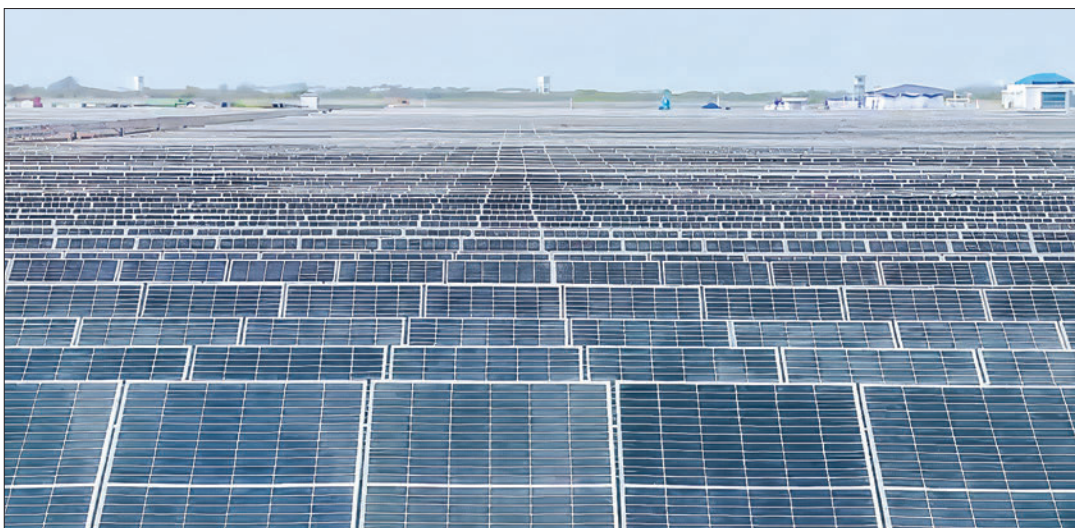
The photo shows a solar power plant located in Minbu Township, Magway Region.

livestock and fisheries sector as well. There are a total of 2,404 permitted foreign projects from 52 countries under the Myanmar Investment Law and the Special Economic Zone Law as of the end of July 2023 and Singapore, China and Thailand are the leading investors in the country. — ASH/KK