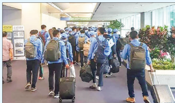
Myanmar workers depart for work at Japanese companies in 2022.

In the post-Covid period, Japan's demand for Myanmar workers is rising and those who are interested in working officially in Japan can make inquiries at the Region/State, township and district offices of the labour department and will have to follow the required procedures. — TWA/MKKS