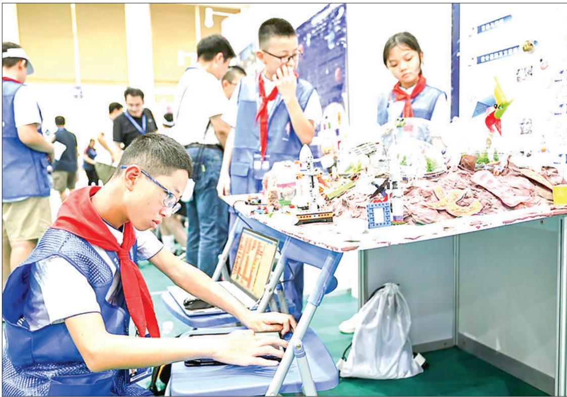
2023 National Youth Space Innovation Competition in Wenchang City of South China's Hainan Province, 14 August 2023.