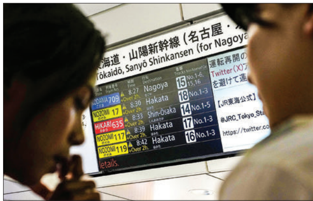
A departure board at JR Tokyo Station shows delays to shinkansen bullet train services on 16 August 2023.

DIRECT shinkansen bullet train services between Tokyo and Hakata stations were suspended on