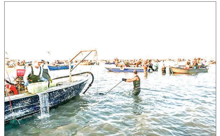
The blue crab risks putting Italian clam and mussel farmers out of business.

IN the shallow waters of the Scardovari lagoon, fishermen catch clams for Italy's beloved spaghetti alle vongole, alongside mussels and oysters. But an invader risks putting them out of business.