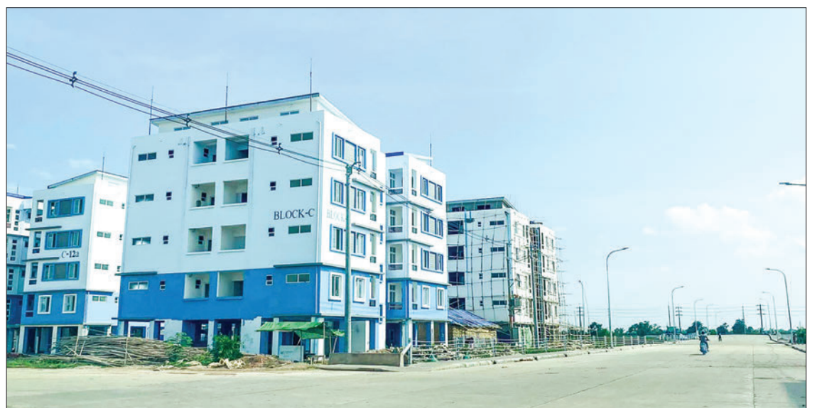
Thukha Dagon public rental housing was implemented at the corner of No 2 Highway and No 7 Outer Ring Road in Dagon Myothit (South) Township.

For any inconveniences related to the upcoming YBS bus services to Thukha Dagon public rental housing, individuals are encouraged to report them to YRTC. — TWA/CT