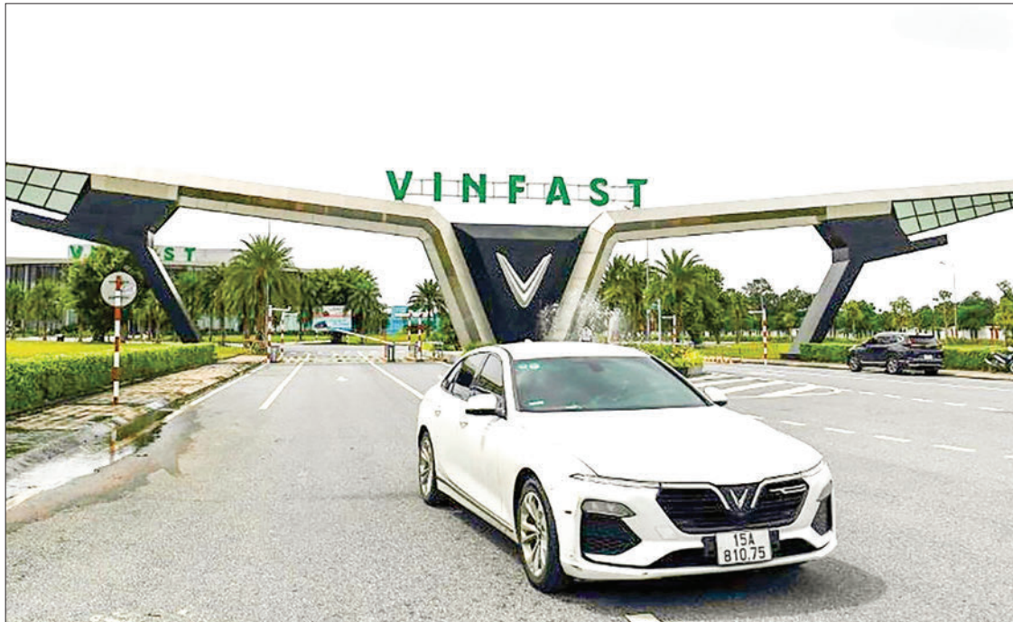
After launching its electric vehicles in Viet Nam, VinFast is now eyeing the US market.

VIETNAMESE electric vehicle maker VinFast has made its debut on the Nasdaq, and its shares soared to push its stock market valuation past Ford and General Motors on its opening day of trading.