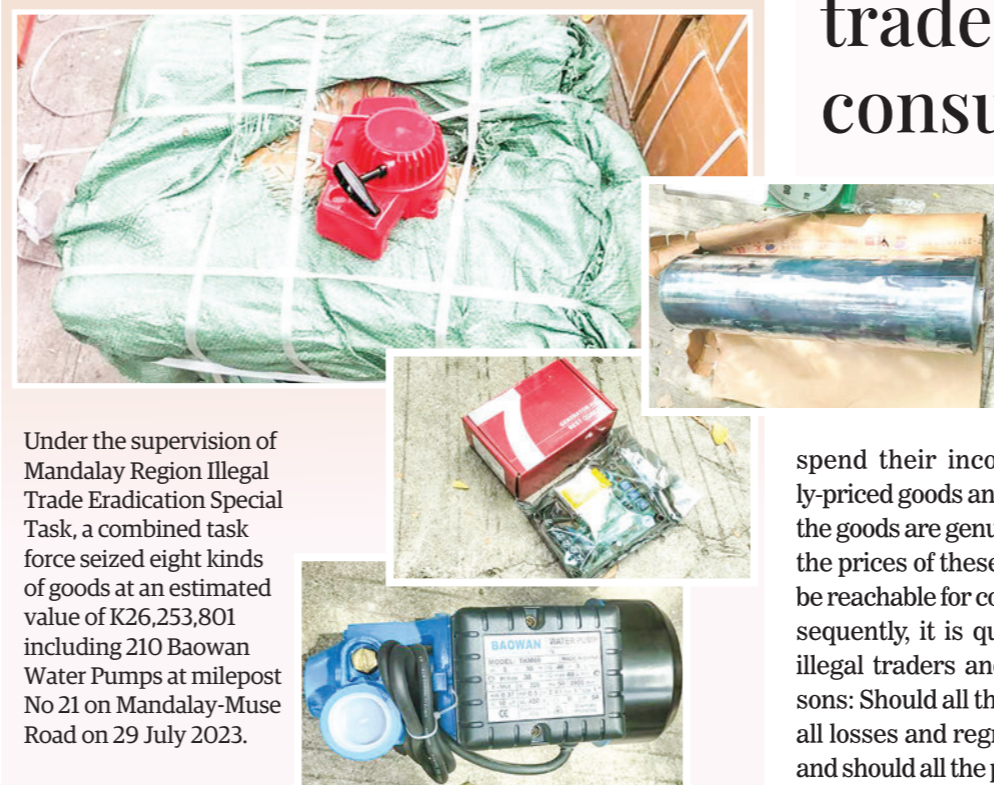
Under the supervision of Mandalay Region Illegal Trade Eradication Special Task, a combined task force seized eight kinds of goods at an estimated value of K26,253,801 including 210 Baowan Water Pumps at milepost No 21 on Mandalay-Muse Road on 29 July 2023.

With regard to the last type of trade, some businesspersons always do to have happiness and pleasure by committing the illegal trade process and achieving an upper hand over their opponents in doing business. They never consider who suffers loss in businesses and how the number of people face difficulties in daily life whenever they commit so. Actually, all the people are consumers in the domestic market supplied by businesspersons and traders. As a division of labour, consumers never do the trade process. They are engaging in relevant workplaces to manufacture various kinds of goods and products. As such, those consumers never avoid the market to buy some foodstuffs and other goods to be used in daily routines. If they see greedy acts of traders and businesspersons in the market, they unavoidably face loss and regrettable as they will