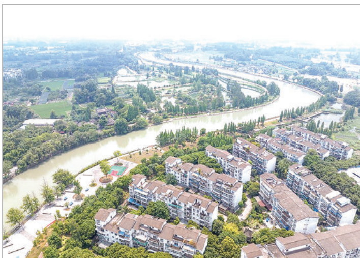
This aerial photo taken on 23 June 2023 shows residential buildings along the Xuyan River, a tributary of Jinjiang River, in Chengdu, capital of southwest China's Sichuan Province.

FEWER Chinese cities reported month-on-month increases in home prices in July, official data showed Wednesday.