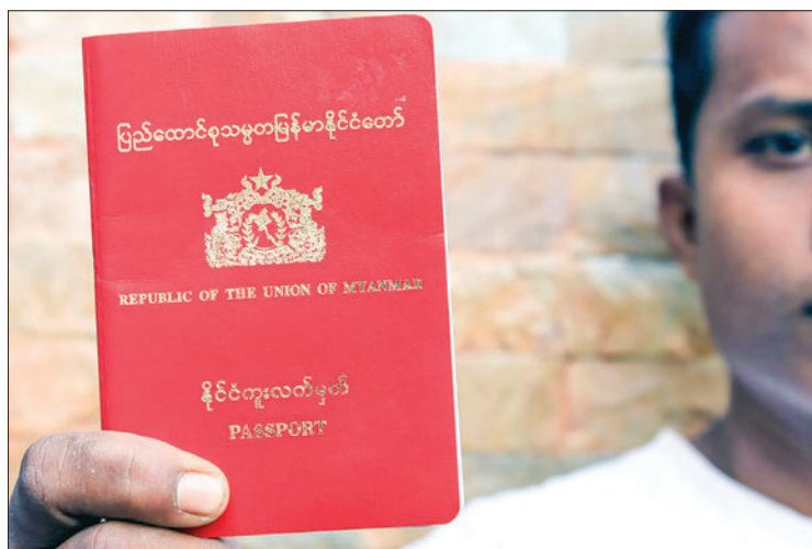
Photo shows a Myanmar passport.

THOSE who want a passport urgently can apply through the green channel by submitting the required documents, according to the Myanmar Passport Office.