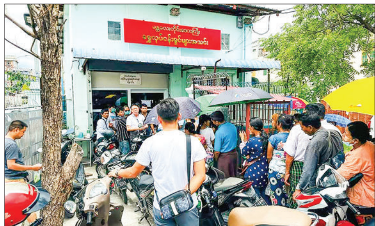
Buyers seen in a queue to purchase gold at Mandalay Region Gold Entrepreneurs Association.

With an aim at reducing gold prices, the YGEA and Mandalay Region Gold Entrepreneurs Association sold gold bullion supplied by the executive members and the members as well.