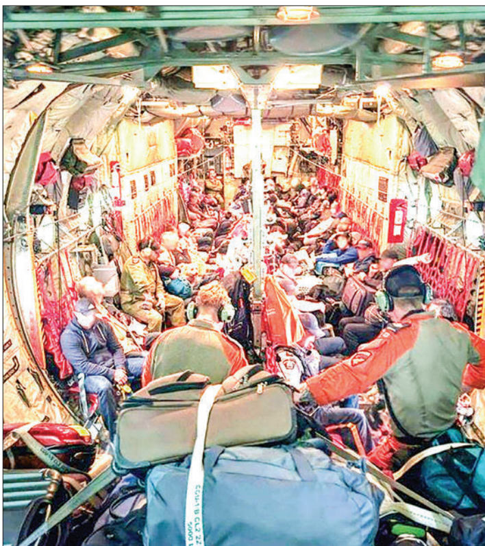
This handout photo provided by the Canadian Armed Forces shows residents of the Northwest Territories being airlifted to safety aboard a military aircraft as wildfires swept the Northwest Territories.

Eventually he made his way back to Hay River and caught a military flight to Fort McMurray, Alberta. — AFP