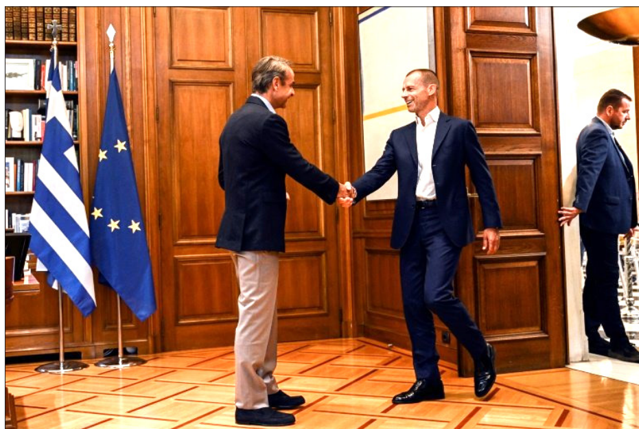
Greek Prime Minister Kyriakos Mitsotakis (left) welcomes UEFA President Aleksander Ceferin in Athens on Wednesday.

Last Tuesday's match was then postponed by UEFA until 19 August.