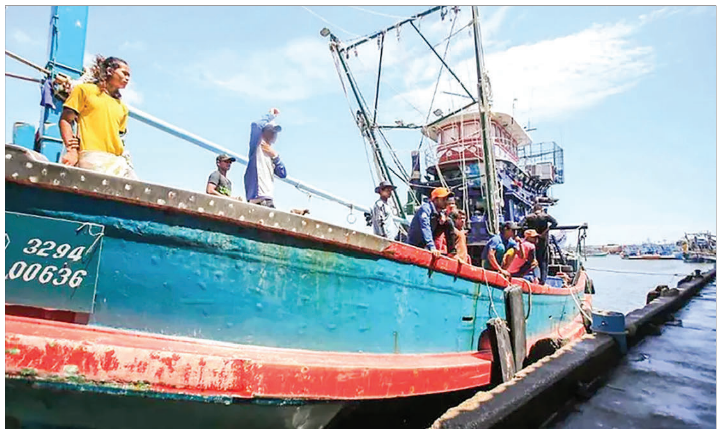
AFP File Photo depicting Thai fishing vessel with Myanmar fishers aboard at the port.

MoALI is exerting efforts to develop the fishery sector crucial for the people's socioeconomic life, food security and nutrition