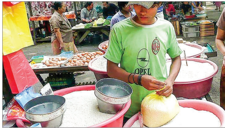
A consumer is seen buying rice from a small shop at a quarter.

Before the harvest season of new paddy, some traders keeping the rice stocks in hand are at-