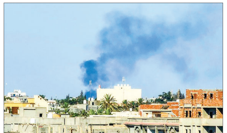
Smoke billows over the Libyan capital amid heavy fighting between the two main armed groups linked to the Tripoli-based government.