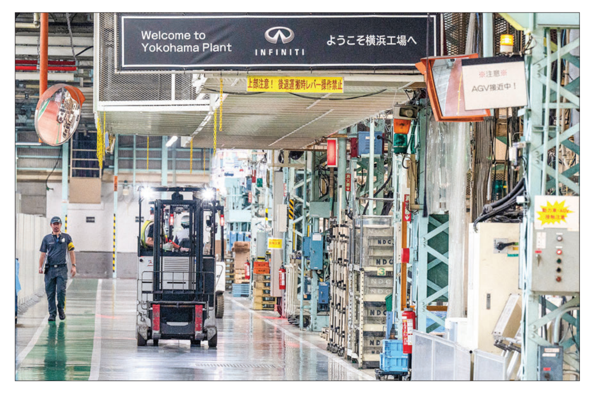
Employees (C) operate vehicles during a media tour of Japanese automaker Nissan's engine plant in Yokohama, Kanagawa prefecture on 19 July 2023, after the company marked in June the production of its 40 millionth engine since commencing operations in 1935.

On an annualized basis, growth was 6.0 per cent, more than double the market expectation of 2.9 per cent, and giving Japan three-straight quarters of growth.