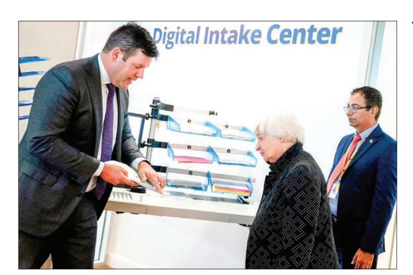
US Treasury Secretary Janet Yellen (C) looks on during a demonstration of a new Internal Revenue Service (IRS)( paperless processing initiative in McLean, Virginia, on 2 August 2023.

The two countries will also explore potential collaboration opportunities in carbon markets with third countries. — Xinhua