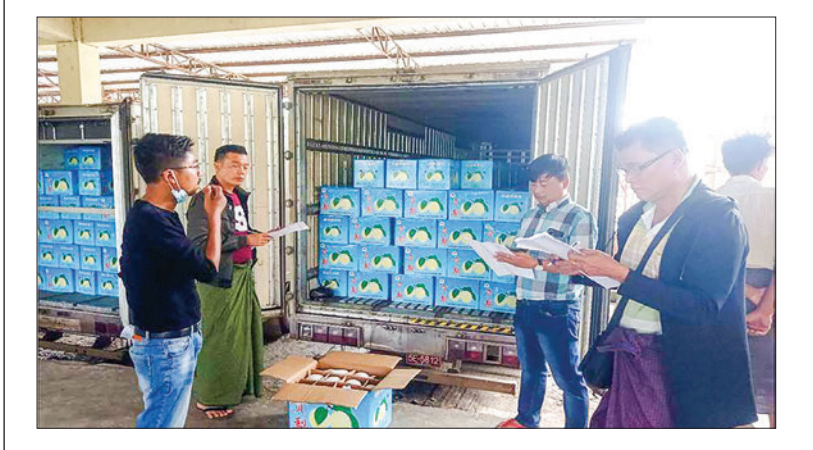
Export and import cargoes are seen on the Myanmar-China border.

According to the MACCS system, as of the second week of August, the exchange rate stood at K293.0825 per Chinese yuan, and the current status of the trade route remains favourable. — ASH/CT