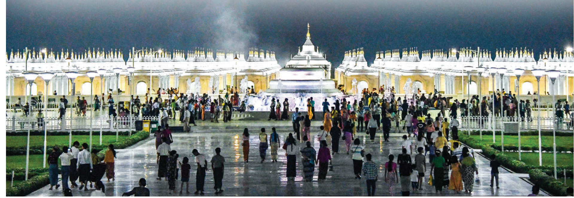
Devotees are seen gathering to pay homage to and worship the Maravijaya Buddha Image yesterday in Nay Pyi Taw.

For additional information, please visit the Maravijaya Buddha Image's official website at mbiw.myannet.com, as well as their Twitter account and Telegram channel.