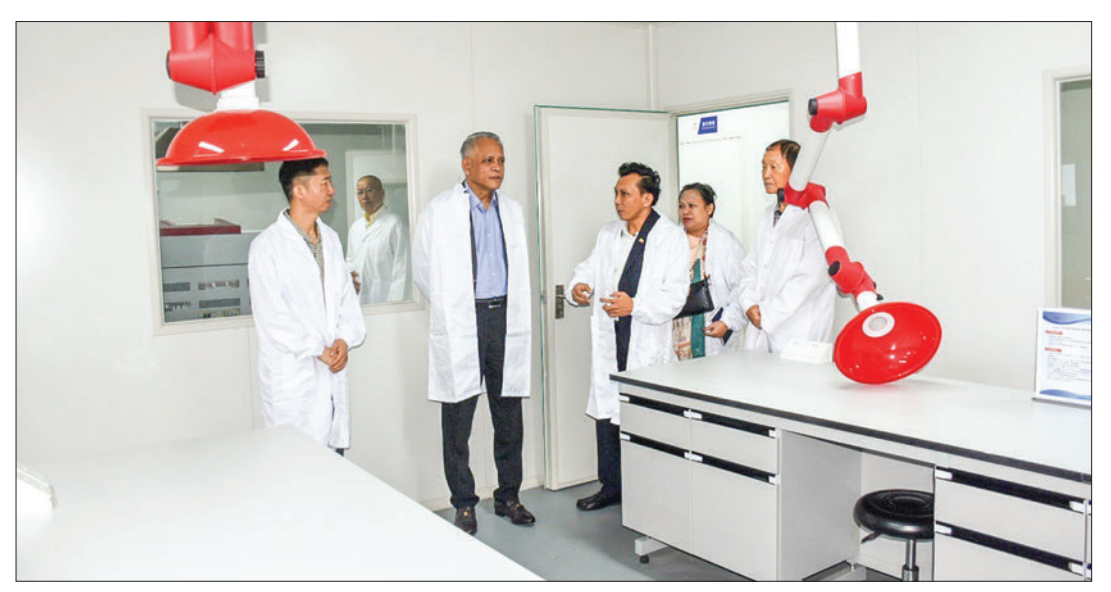
Union Minister U Aung Naing Oo (C) is pictured during his observation tour in Kunming, China.

In the evening, U Aung Naing Oo joined a dinner hosted by the Governor of Yunnan State, an event held to honour leaders of delegations from South and Southeast Asian nations.