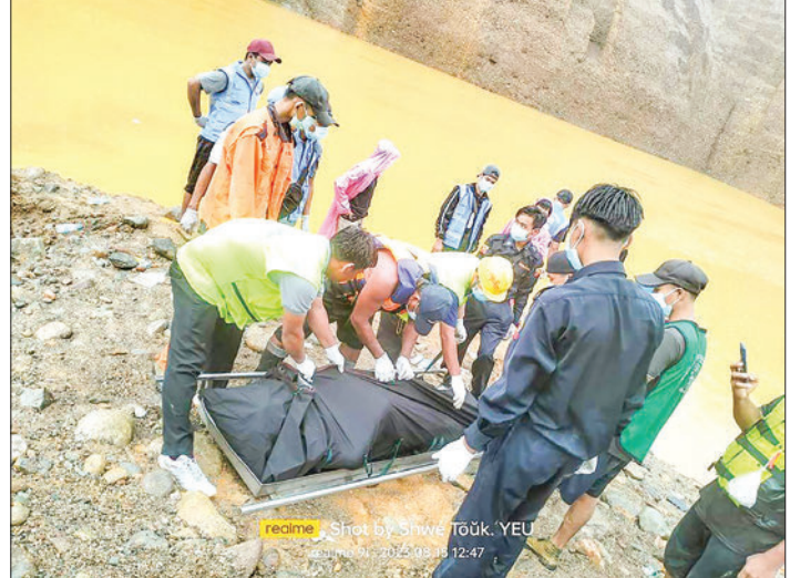
Members of the Parahita teams are seen carefully packing the recovered bodies at the incident site in Phakant's jadeland area.