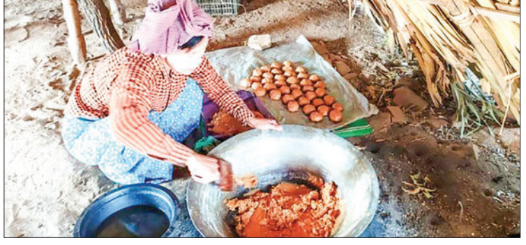
The photo shows a woman making palm sugar.

The domestic consumption of edible oil is estimated at 1 million tonnes per year. The local cooking oil production is just about 400,000 tonnes. To meet the oil sufficiency in the domestic market, about 700,000 tonnes of cooking oil are yearly imported through Malaysia and Indonesia. — NN/EM