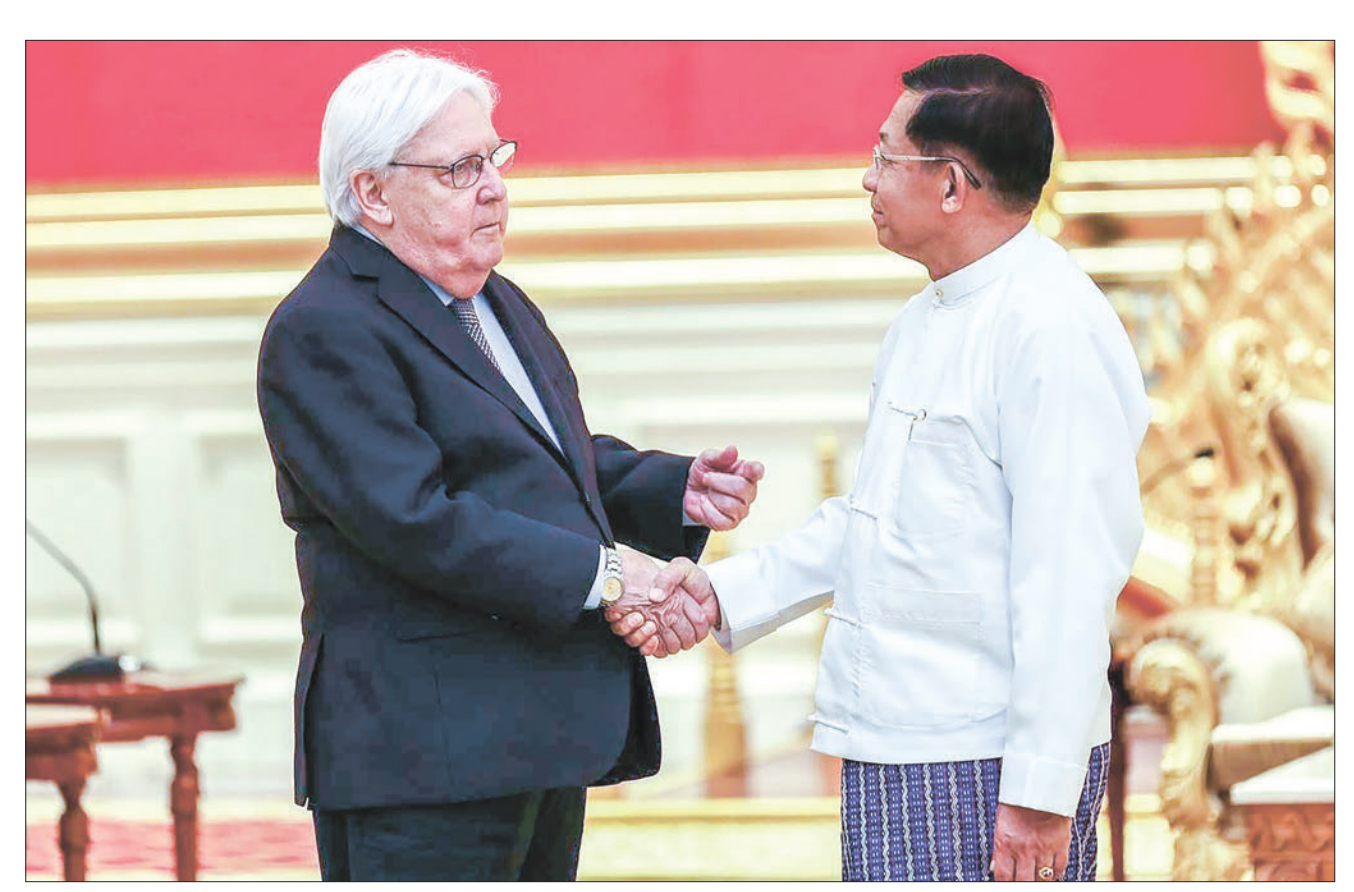
SAC Chair Premier Senior General Min Aung Hlaing extends a warm welcome to UN Humanitarian Chief Mr Martin Griffiths during the latter's courtesy call yesterday in Nay Pyi Taw.

They frankly exchanged views on political progress in Myanmar, State responsibilities being taken by the Tatmadaw under the Constitution (2008) for occurrences of voting fraud in the 2020 multiparty democratic general elections, endeavours of the State Administration Council to continue strengthening the multiparty democratic system the people aspire to, restoration of internal peace, requirements for undertaking the development of ethnic areas, spreading misinformation on various situations of Myanmar in the international community, the need for the international community to know actual conditions in Myanmar, lesser aid of international organizations including the United Nations for Myanmar in the period when the Covid-19 broke out and storm Mocha hit, and further cooperation in humanitarian aid. — MNA/TTA