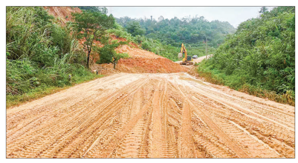
The photo captures the ongoing repair work on the Myawady-Kawkareik road section.

HE clean-up activities were completed after the landslide on the Myawady-Kawkareik section of Asia Highway and the stranded vehicles passed using a single-lane road on 15 August, according to the Road Department under the Ministry of Construction.