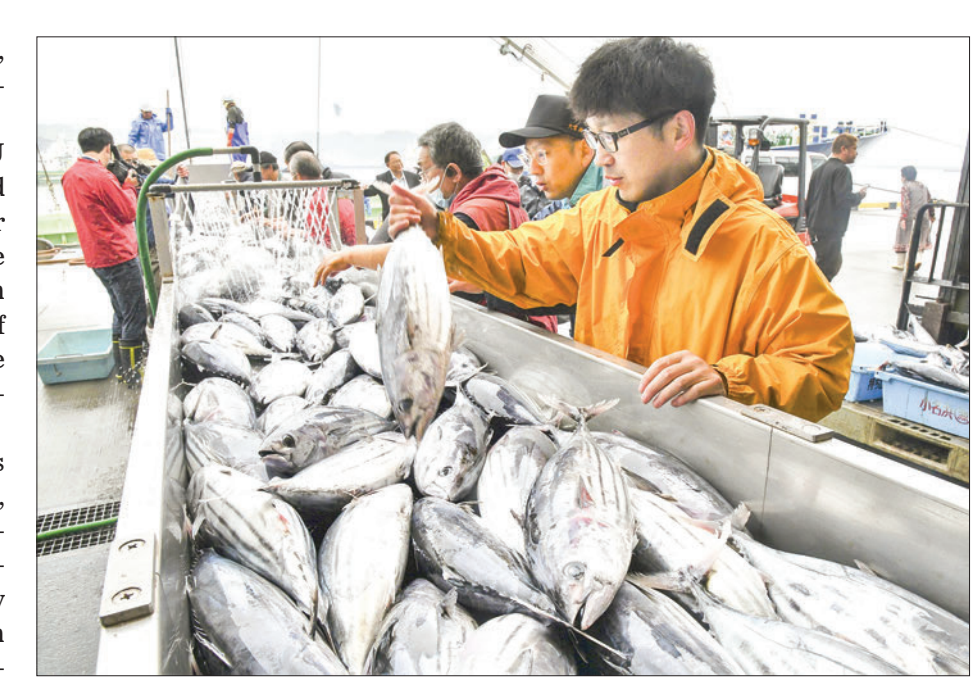
The season's first catch of bonito at Onahama port in Fukushima Prefecture, northeastern Japan, is landed on 29 May 2023.

Following the moves by European countries, Japan's Agriculture, Forestry and Fisheries Ministry plans to set up a new export support platform in Brussels to provide information to producers. — Kyodo