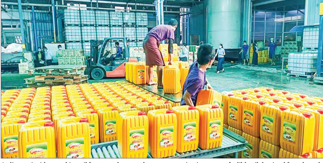
A glimpse inside a cooking oil factory, where workers are arranging jerrycans of edible oil destined for sale and distribution.

The Supervisory Committee on Edible Oil Import and Distribution under the Ministry of Commerce has been closely observing the FOB prices in Malaysia and Indonesia including transportation cost, tariff and banking service, and issuing the wholesale market reference