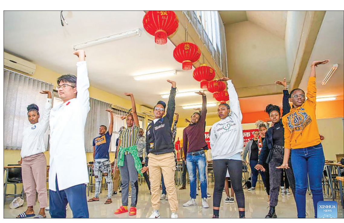
Students practice Baduanjin Qigong during a traditional Chinese medicine lecture at the University of Namibia in Windhoek, Namibia, on 14 August 2023.

During the lecture, the students had the opportunity to experience some of the techniques which included acupuncture,