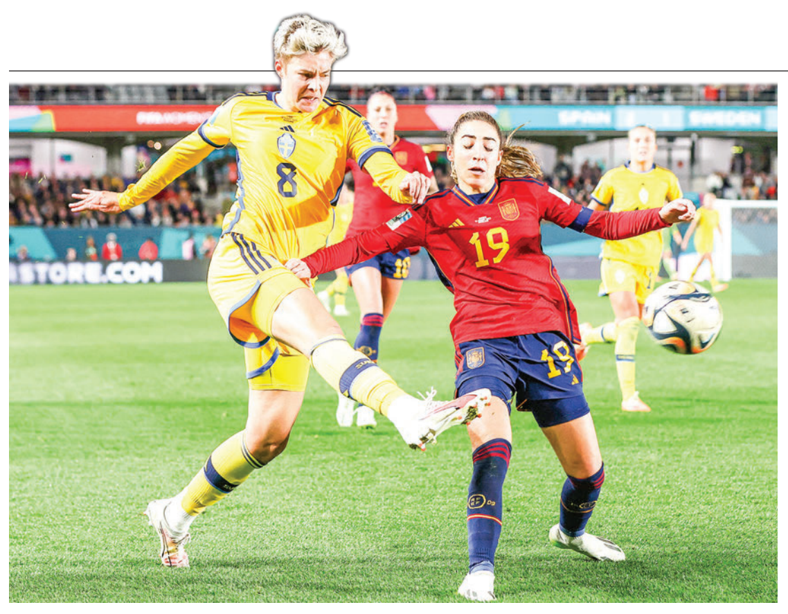
Spain's defender (19) Olga Carmona and Sweden's forward (8) Lina Hurtig fight for the ball during the Australia and New Zealand 2023 Women's World Cup semi-final football match between Spain and Sweden at Eden Park in Auckland on 15 August 2023.