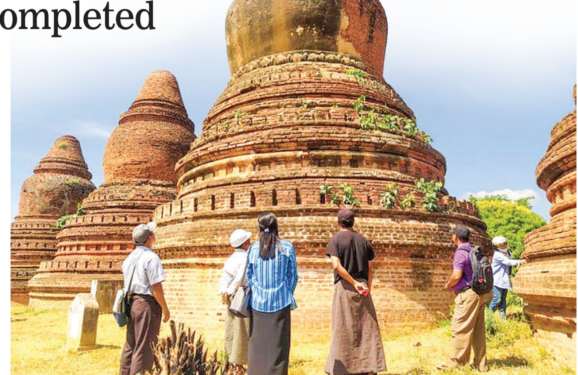
Personnel from the Department of Archaeology and National Museum (Bagan branch) are captured in the midst of their maintenance efforts within the Bagan Archaeological Zone.

"Maintenance works are carried out yearly and the scope of work each year is subjected to budget allotment. Bagan Archaeological Zone, which has more than 3,000 ancient buildings, has been divided into 11 sections and is being cleaned and beautified. The weeds clinging to the pagodas are removed using chemicals. In addition to normal maintenance schedules, the pagodas and temples affected by the Mocha storm in May has been repaired following UNESCO guidelines," Dr Min Swe said. — ASH/ TH