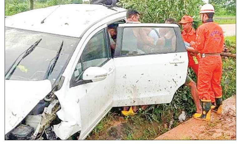
Fire brigade members are seen conducting rescue operations at the scene of an accident.

To ensure strict adherence to the expressway's speed limitations and traffic regulations, the Nay Pyi Taw Expressway Police Commander's Office has strategically deployed speed-measuring apparatus and is conducting vehicle inspections to bolster compliance with traffic norms. — TWA/KZW