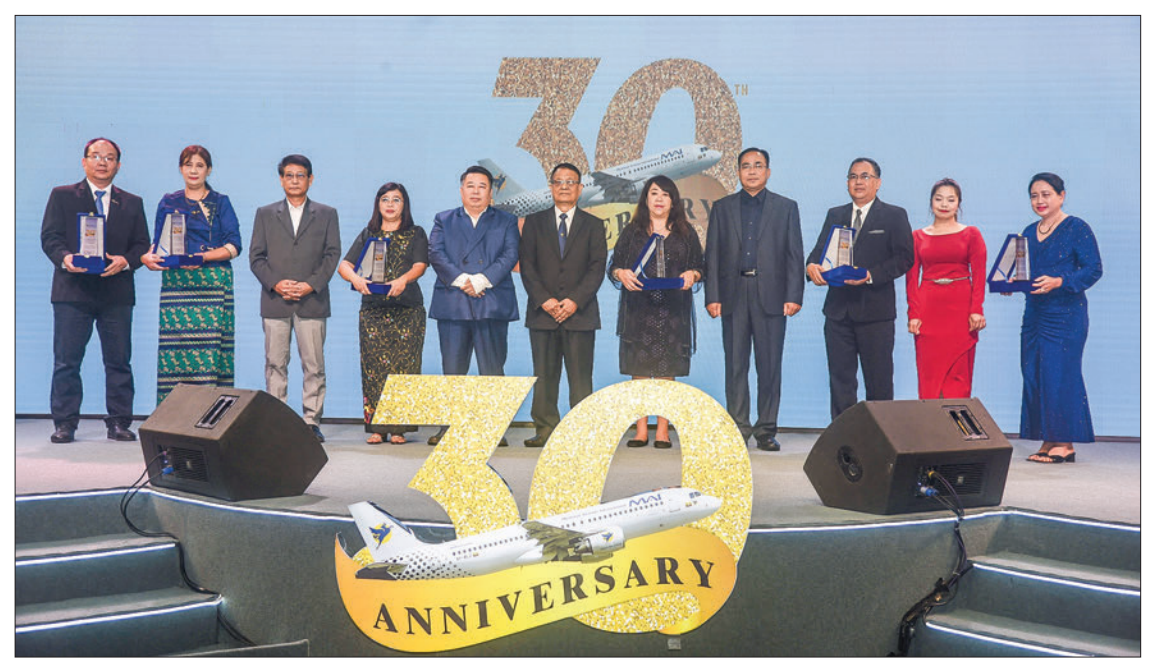
A commemorative group photograph captures the essence of the documentary celebrating \overline{MAI} 's 30^{th} anniversary, taken yesterday in Yangon.

MAI is a Myanmar national-owned private company and the safety and comfort of our passengers are the airline's priority regardless of the profits of the airline. The MAI has never suspended flights while the