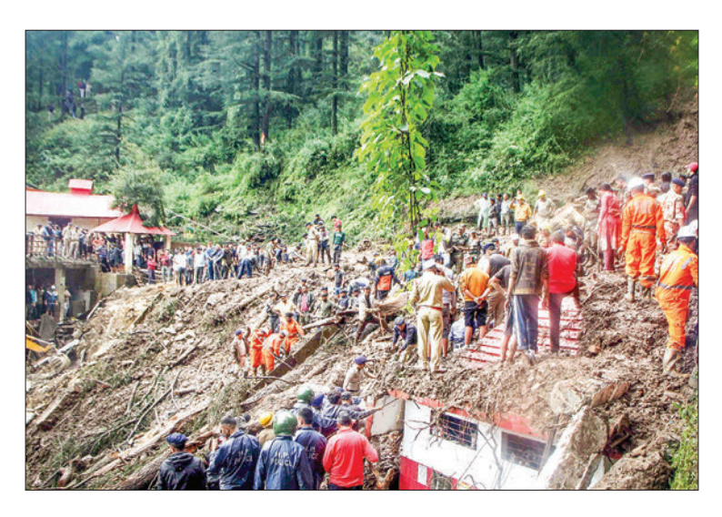
National Disaster Response Force (NDRF) personnel search for victims at the site of a landslide after a temple collapsed due to heavy rains in Shimla on 14 August 2023. PHOTO: AFP

Sukhu said earlier that up to 20 others were feared trapped under rubble after landslides, and appealed to residents to stay indoors and avoid going near rivers. — AFP