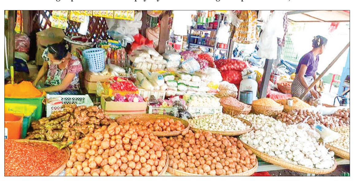
Vendors are seen organizing kitchen groceries for sale at the retail outlet in Yangon.

In the second week of August, black gram fetched K2,399,000 per tonne for RC and K2,589,000 per tonne for SQ/RC. Green gram (Kayan Shwewah variety) stood at K3,500 per viss, Pakokku variety ranged from K3,665 to K3,750 per viss, and half of chickpeas commanded prices between K5,800 and K6,200 per viss. — TWA/CT