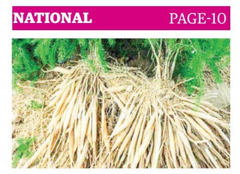
Myanmar exports 650 visses of Shatavari root to Korea this FY