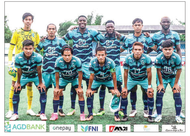
The Yangon United Football Club is seen posing for a group photo.

If Yangon gets past the Bruneian club DPMM FC, they will have to compete against the Indonesian club PSM Makassar in the next round to qualify for the group stage. — TWA/KZL