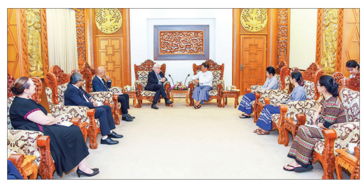
Mr Martin Griffiths UN Humanitarian Chief and his delegation calls on Deputy Prime Minister MoFA Union Minister U Than Swe yesterday in Nay Pyi Taw.

During the meeting, they exchanged views on the current cooperation between Myanmar and the United Nations and facilitation for the provision of humanitarian assistance to the needy population. — MNA