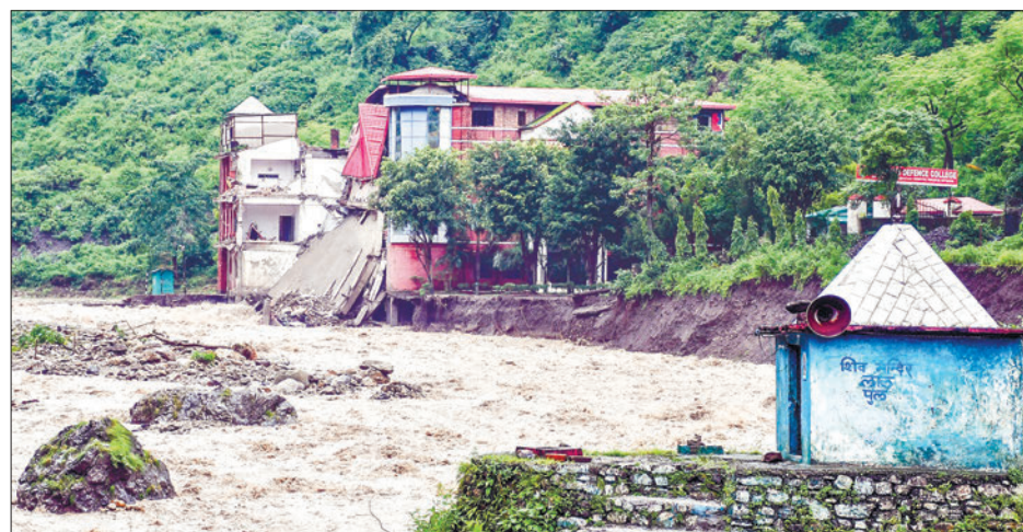
A portion of college building is seen collapsed along the river Maldevta after heavy rains in Dehradun on 14 August 2023. PHOTO: AFP

At least 13 others were missing, it said. — AFP