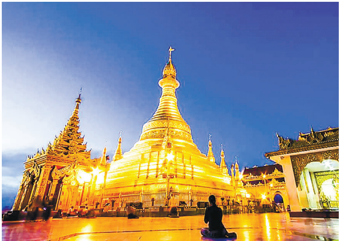
The picture shows devotees worshipping reverently the Magway Myathalun Pagoda.