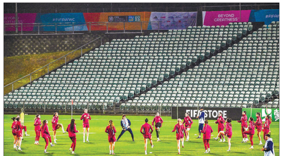
Spain’s players attend a training session at the North Harbour Stadium in Auckland on 14 August 2023, ahead of the Australia and New Zealand 2023 Women’s World Cup semi-final football match against Sweden.

Spain and Sweden drew 1-1 in a friendly last October, just after 15 Spanish players told their federation they no longer wished to be considered for selection in protest at coach Jorge Vilda. — AFP