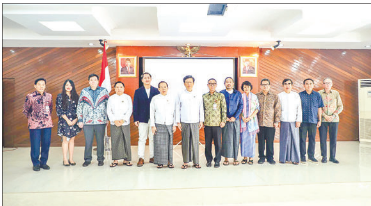
The documentary group photo is taken after the discussion at the Indonesian Embassy in Yangon.

ACCORDING to the Union of Myanmar Federation of Chambers of Commerce and Industry (UMFCCI), cooperation will be increased in the renewable energy, electric vehicles, edible oil, and mining sectors between Myanmar and Indonesia.