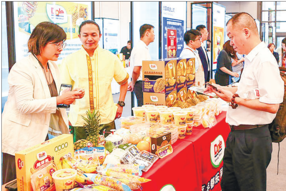
People visit a match-making event of the 6th China International Import Expo (CIIE) at the National Exhibition and Convention Centre (Shanghai) in east China's Shanghai, 26 July 2023. The 6th CIIE is scheduled to be held in Shanghai from 5 to 10 November.

CHINA'S State Council has recently issued a statement outlining its guidelines regarding further optimizing the foreign investment environment and intensifying efforts to attract foreign investments.