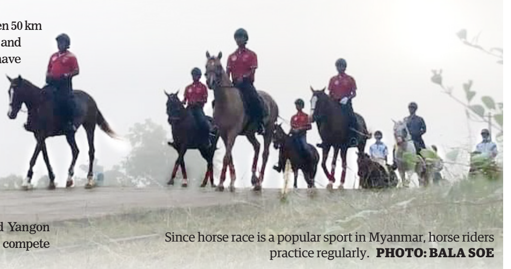
Since horse race is a popular sport in Myanmar, horse riders practice regularly.