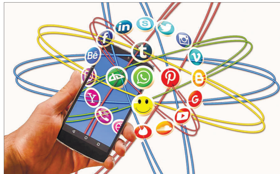
the research highlights that interventions targeting social media use can alleviate mental health issues in adults grappling with its adverse impact on their daily life.