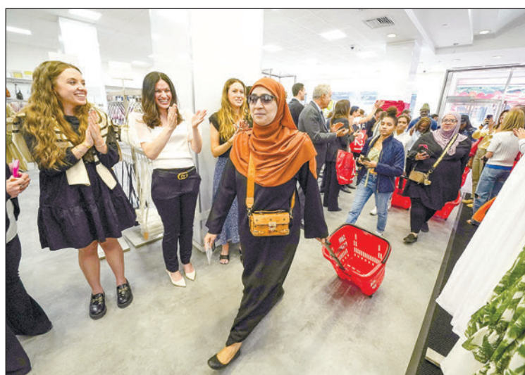
Customers arrive for the re-opening of the Century 21 flagship department store in New York City on 16 May 2023.