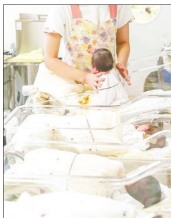
File photo taken on 15 December 2022, shows babies in a room for newborns in Kumamoto, Japan.

The online survey conducted from late May to early June