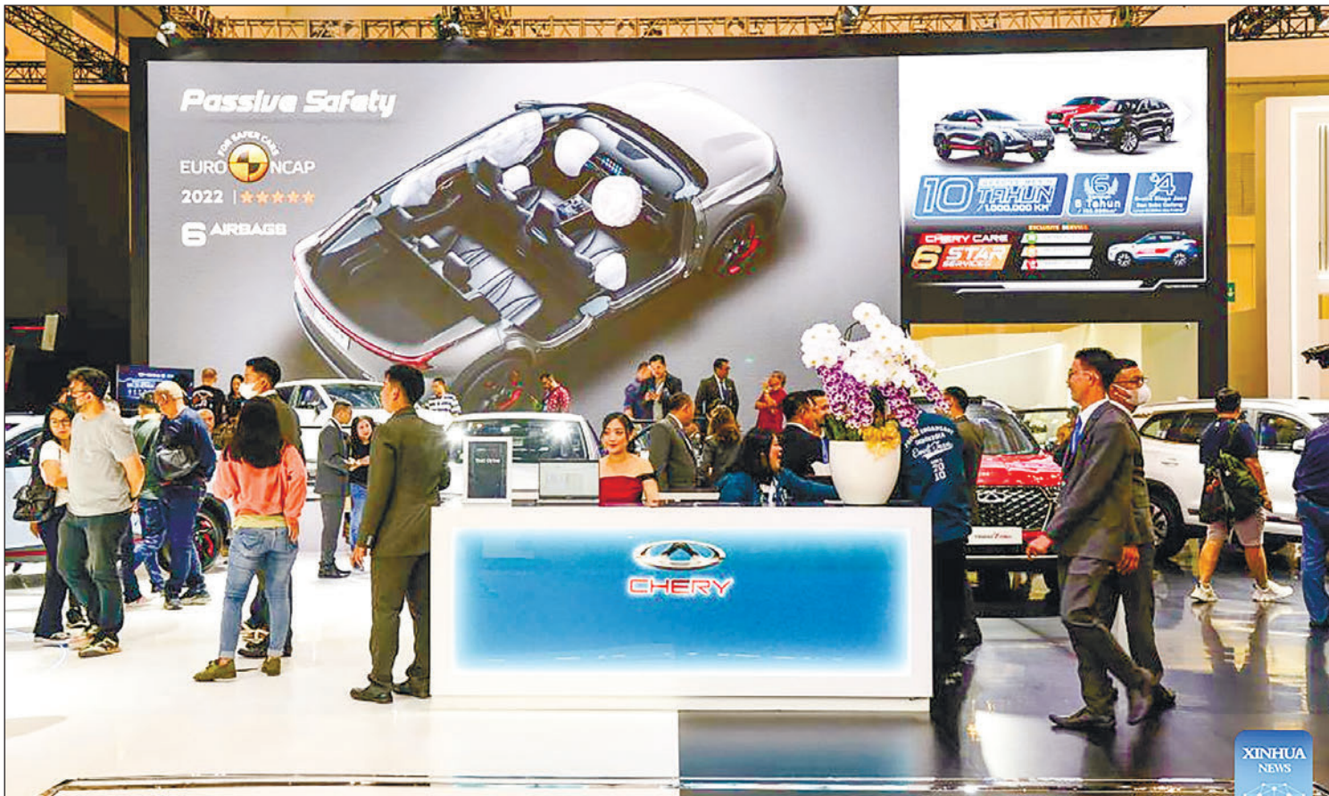
People visit the booth of Chery at the GAIKINDO Indonesia International Auto Show (GIAS) 2023 in Tangerang of Banten province, Indonesia, 14 August 2023. The GIAS 2023 will last till 20 August.