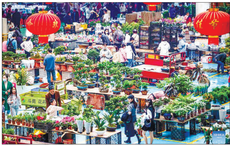
People visit the Kunming Dounan Flower Market in southwest China’s Yunnan Province, 31 January 2023.

WHILE many Chinese cities are currently experiencing scorching heat, the essence of spring lingers in the Dounan Flower Market in Kunming, southwest China’s Yunnan Province.