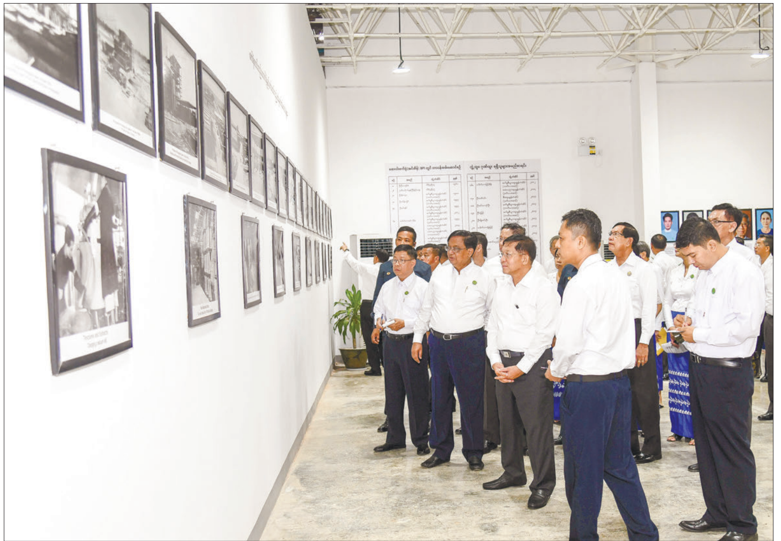
State Administration Council Chairman Prime Minister Senior General Min Aung Hlaing views the displays at the BPI Pharmaceutical Museum in Yangon yesterday.

In the anti-snake venom production industry, the Senior General heard reports on the production process, the capacity of the Freeze Dryer Machine and its production processes presented by officials.