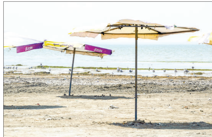
A picture shows empty tourist facilities by the Habbaniyah lake affected by severe drought in Iraq’s Anbar province, on 11 August 2023. PHOTO: AFP

The United Nations ranks water-stressed Iraq as one of five countries most impacted by some effects of climate change. — AFP