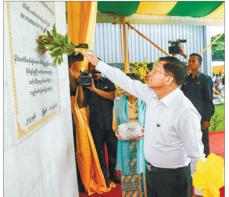
SAC Chair Premier Senior General Min Aung Hlaing performs scented water ritual at BPI Pharmaceutical Museum's founding plaque yesterday.