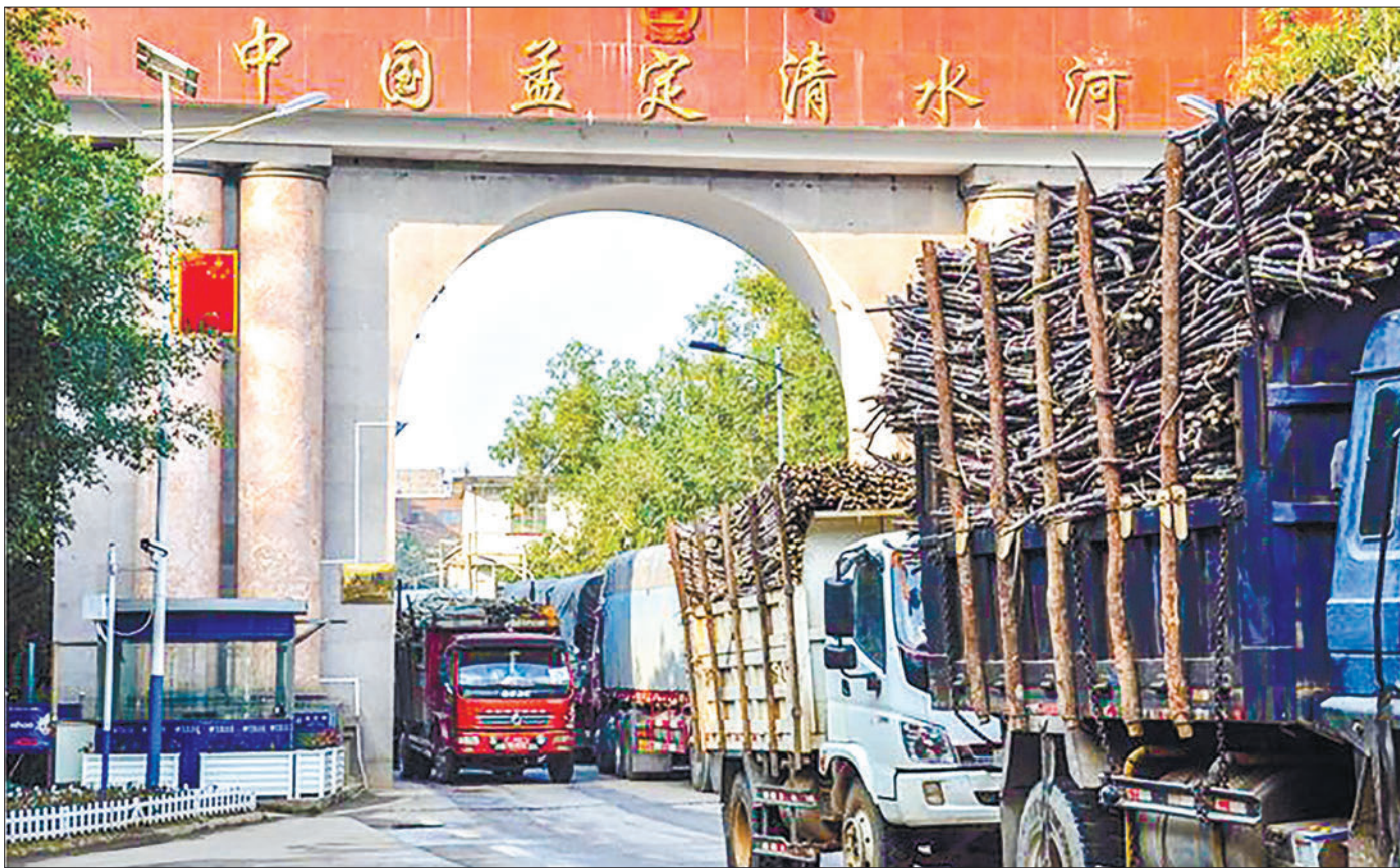
The photo shows trucks loaded with goods near the Chinshwehaw border between Myanmar and China.