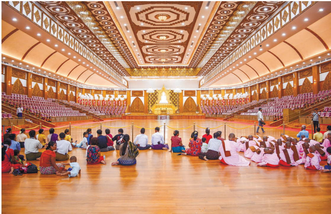
Devotees reverently pilgrimage around Maravijaya Image and Sasana Beikman Agga Dhipati ordination hall (images above and left).

organizations to recite Gathas and the people can view the pagodas in 24 special chambers around the platform of the Maravijaya Buddha Image. Similarly, the people can pay homage to the 720 stone plaque chamber pagodas on which Tri Pitaka treatises were carved in Pali and Romanized languages with the use of modern machinery. The Thudhamma