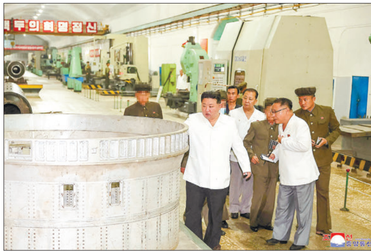
This undated photo released from North Korea's official Korean Central News Agency (KCNA) on 14 August 2023 shows North Korea's leader Kim Jong Un (C) during a visit to an important munitions factory at an undisclosed location in North Korea.