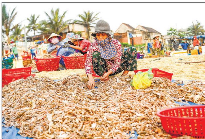
A seafood vendor sorts her catch at a morning fish market in Quang Nam province on 13 April 2023.

Exports to other key markets in July plunged between 5 and 40 per cent year on year, including the United States, South Korea and the European Union, the newspaper reported. — Xinhua