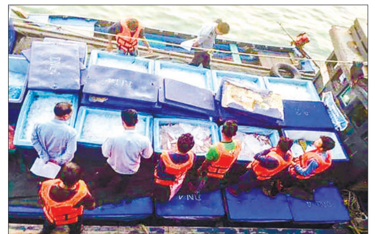
The photo shows fishery products to be exported to Thailand via the Kawthoung border.

Myanmar carries out cross-border trade with Thailand via Tachilek, Myawady, Kawthoung, Myeik, Hteekhee and Mawtaung borders. The majority of the trade was conducted via the Hteekhee border. — TWA/KK