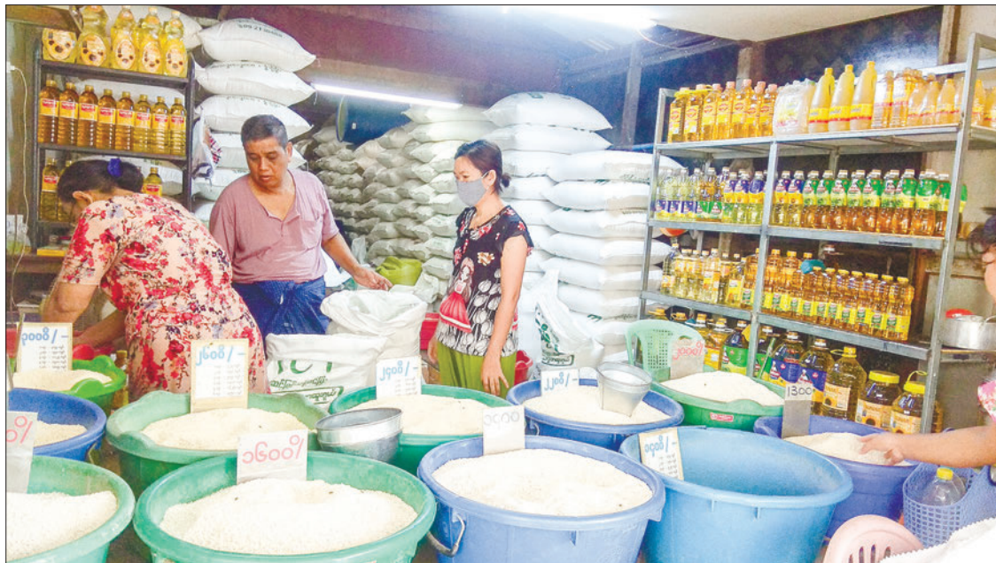
Varieties of rice are well organized for sale in the market in Yangon.

The MRF launched a subsidy scheme for Pawsan and Aemahta rice varieties on 7 August at Wah-