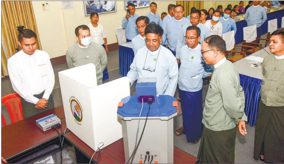
The demonstration of Myanmar's Electronic Voting Machine (MEVM) in progress yesterday in Nay Pyi Taw.