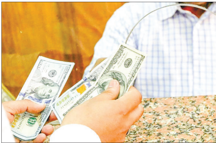
A bank employee is selling petty cash in foreign currency to a customer.

THE Central Bank of Myanmar has reported that banks with authorized dealer licences (AD-licensed banks) have disbursed petty cash ranging from US$300 to US$500 to each of 2,956 individuals who are preparing to travel abroad.