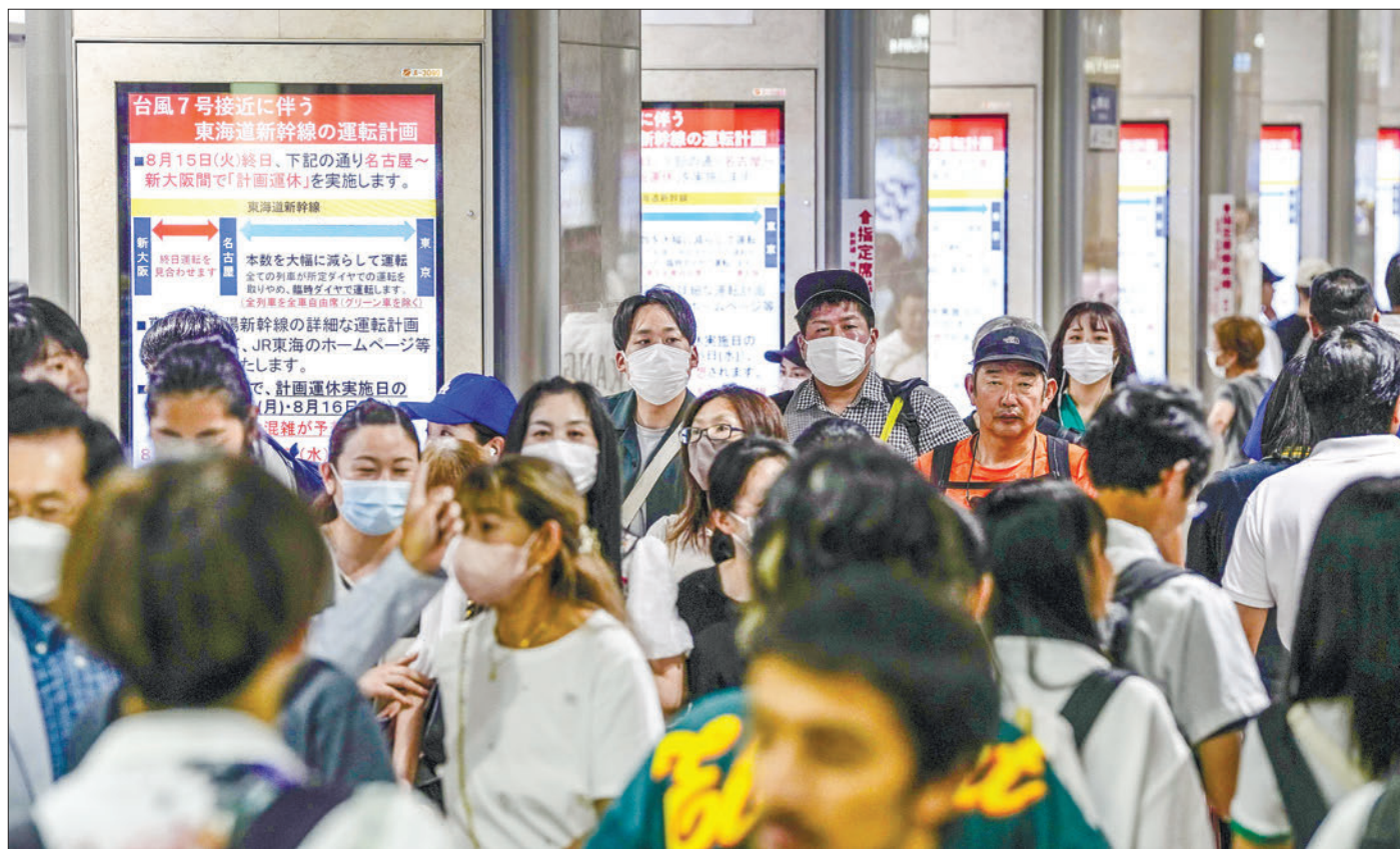
Monitors at JR Nagoya Station on 14 August 2023, show planned Shinkansen bullet train service cancellations due to the approach of Typhoon Lan.

SOME shinkansen bullet train services and flights are set to be cancelled as a strong typhoon remains on course to make landfall on the Pacific coast of western Japan on Tuesday, affecting many people during the annual Bon holidays, the weather agency and operators said.