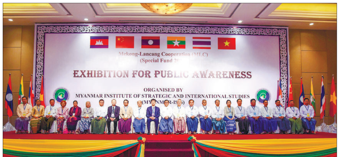
The documentary group photo of the Exhibition for Public Awareness on the Mekong-Lancang Cooperation in Nay Pyi Taw yesterday.

AN Exhibition on the Mekong-Lancang Cooperation for Public Awareness, organized by the Myanmar Institute of Strategic and International Studies under the auspices of the Mekong-Lancang Cooperation (MLC), was held at the Thingaha Hotel in Nay Pyi Taw on 14 August 2023. The Exhibition was inaugurated by Deputy Minister for Foreign Affairs U Kyaw Myo Htut and Minister Counsellor Dr Zheng Zhihong