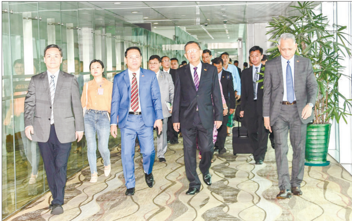
The Myanmar delegation is pictured at Yangon International Airport before departing for China yesterday.

To be held under the theme of "Solidarity Coordination &