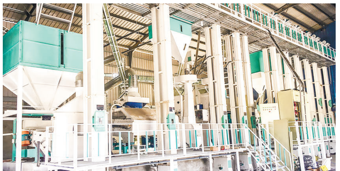
One of the rice mills in Ayeyawady Region.

The aforementioned businesses in the Ayeyawady Region were approved by the 3/2023 meeting of the Ayeyawady Region Investment Committee. — ASH/KZL