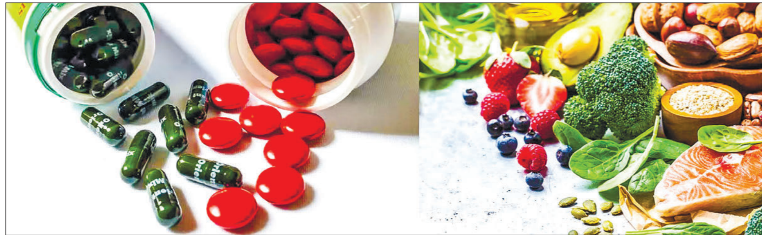
The true path to vitality lies in a balanced diet. A healthy lifestyle triumphs over vitamin supplements. Say goodbye to the vitamin craze and choose a delectable, nourishing banquet for your body.

In a world where health trends pop up like mushrooms after rain, one tiny hero has captured everyone's attention - the multivitamin! In a post-pandemic world obsessed with health, multivitamins have