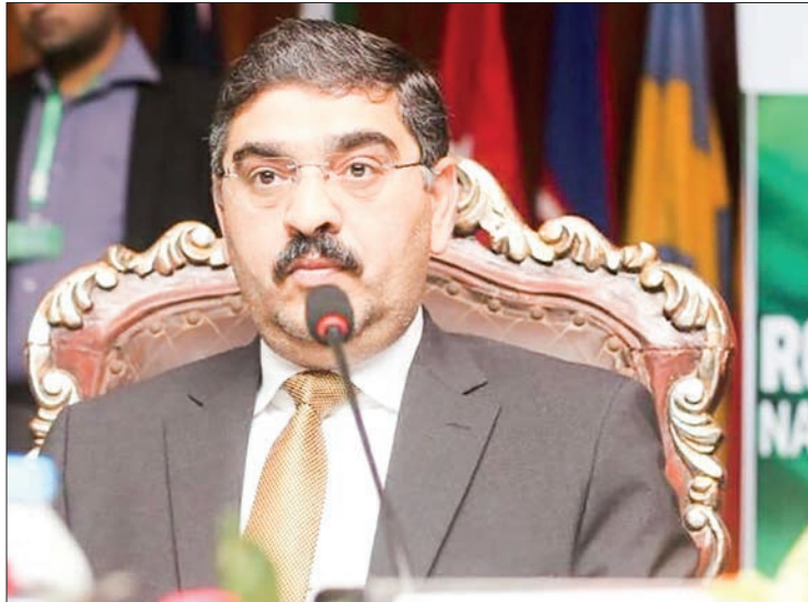
This undated photo shows Pakistan's caretaker Prime Minister Anwarul Haq Kakar.

Kakar's appointment followed negotiations between Prime Minister Shehbaz Sharif and Raja Riaz, the oppo-