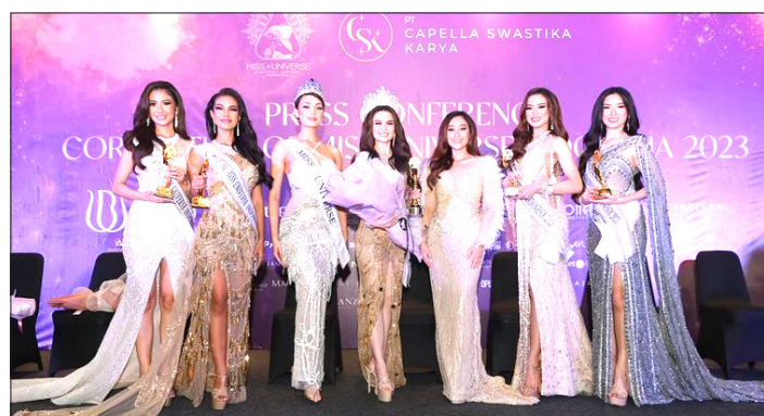
The Jakarta competition was held from 29 July to 3 August to choose Indonesia's representative to the 2023 Miss Universe contest.

It thanked the contestants for their bravery in coming forward and added that “providing a safe place for women” was the organization's priority. — AFP