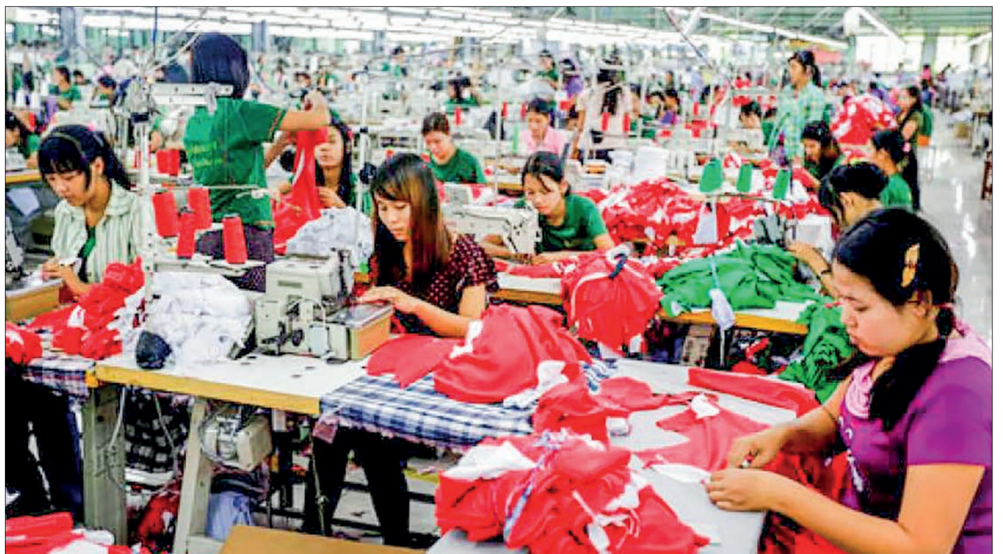
A garment factory operates manufacturing of CMP products in Myanmar in May 2023.