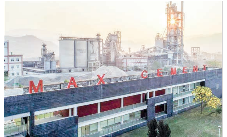
Max Cement Plant under operation in Lewe Township, Nay Pyi Taw Council Area.

ly to meet the annual cement demand. Among 19 domestic cement plants, some plants are equipped with five machine lines capable of producing 5,000 tonnes of cement or more, nine machine lines capable of producing between 1,000 tonnes and 5,000 tonnes and 13 machine lines capable of producing less than 1,000 tonnes.