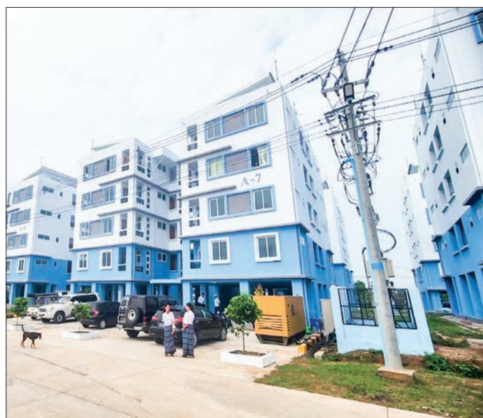
The photo shows completion of buildings from Thukhawady public rental housing in Dekkhinathiri Township of Nay Pyi Taw Council Area.

AT the opening ceremony of the housing project on 12 August, the Union Minister for Construction unveiled that as the Thukhawady public rental housing project in Nay Pyi Taw has been successfully completed, a total of 448 apartments within the hous-