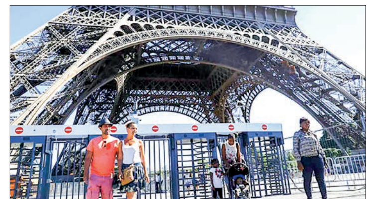
Visitors were evacuated from both the three floors and the square under the monument shortly after 1:30 pm (1130 GMT).

THE Eiffel Tower in Paris, France's most emblematic symbol, was evacuated for several hours on Saturday after a bomb alert.