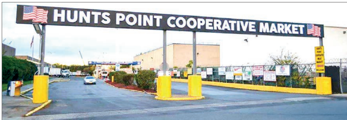
The Hunts Point Cooperative Market is a wholesale food market located in the Hunts Point neighbourhood of the Bronx in New York City.

US wholesale prices picked up in July on a surge in services costs, according to government data released Friday, although the overall inflation figure remains muted.