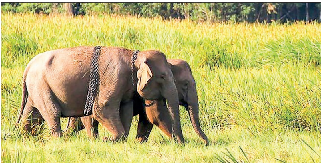
Two Sumatran elephants are seen at Way Kambas National Park in Lampung, Indonesia, 12 August 2023. World Elephant Day falls on 12 August. It is an annual event to raise people's awareness on elephant conservation.

The programme was graced by a number of dignitaries from both the states and over 300 people from both states including about 180 village women. —Xinhua/ANI