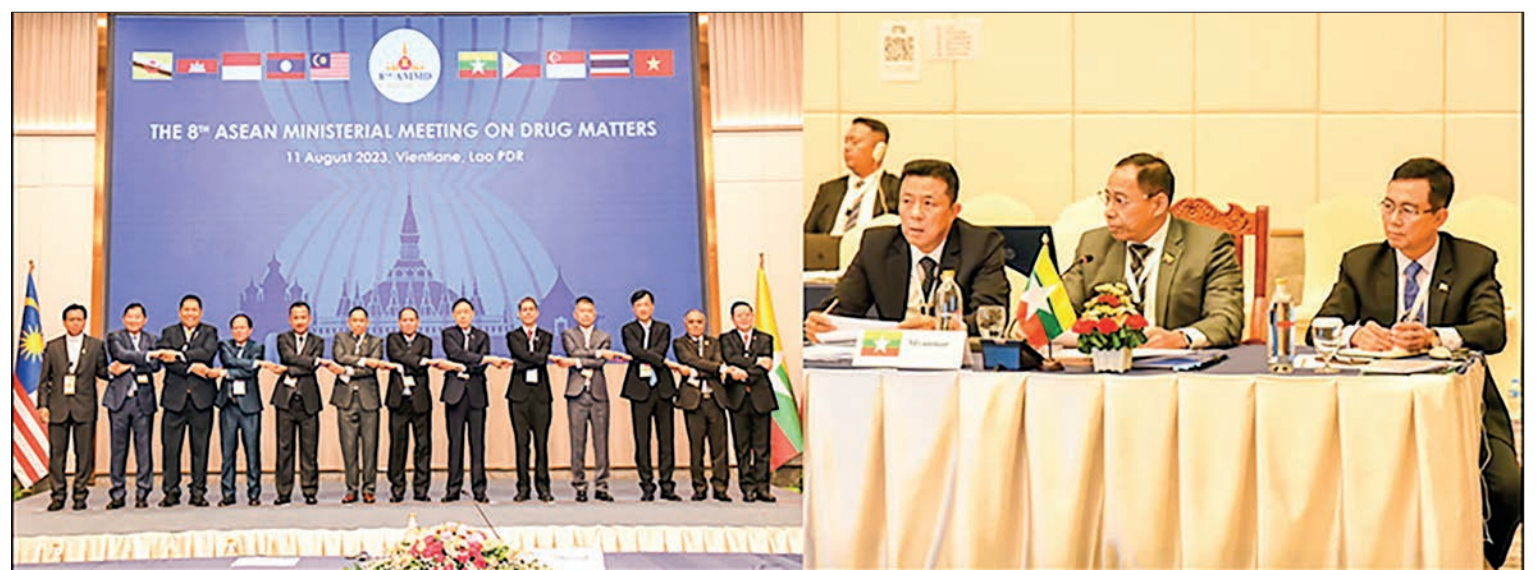
State Administration Council Member Union Minister for Home Affairs Lt-Gen Yar Pyae participates in the 8 th ASEAN Ministerial Meeting on Drug Matters (AMMD).

In the evening, they attended a dinner hosted by Pol Gen Vilay Lakhmfonng. — MNA/CT