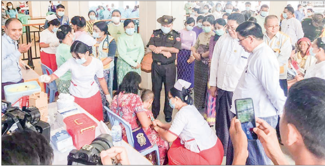
A child is vaccinated by a health worker during the medical visit of specialist team from Ministry of Health at Magway General Hospital.

A specialist team from Mandalay and Nay Pyi Taw General Hospitals in collaboration with medics from Magway General Hospital performed medical treatments for residents in Magway township, Magway Region on 12 and 13 August.