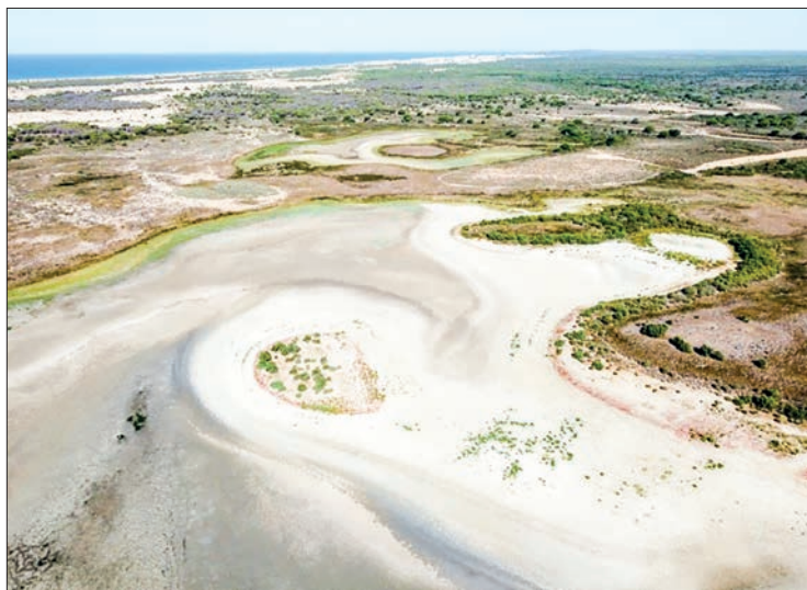
An aerial picture taken of the dried out Santa Olalla lagoon in southern Spain.

The lagoon — which once covered around 45 hectares (110 acres) — has been shrinking in recent years but this is the first time that it has dried out for two consecutive years, according to the Spanish National Research Council (CSIC). Scientists blame the lagoon's disappearance on a prolonged drought combined