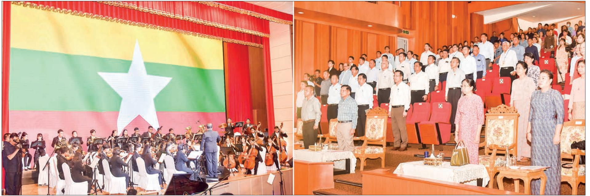
Chairman of the State Administration Council Prime Minister Senior General Min Aung Hlaing and attendees salute the National Flag while the State Orchestra plays the national anthem.