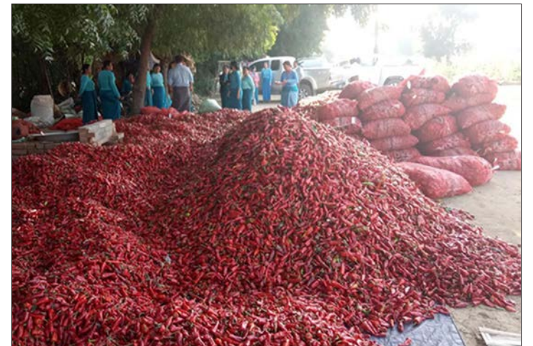
Old Moehtaung chilli pepper seen in the market.

THE price of old Pyawbwe Moehtaung chilli peppers is priced at K14,500/K15,000 per viss recently in the Bayintnaung chilli market, a grocer told The Global New Light of Myanmar daily (GNLM).