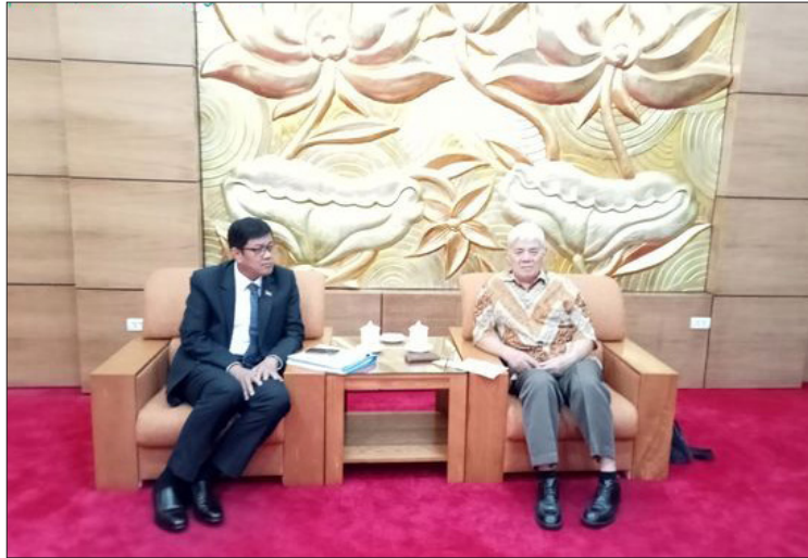
The discussions on trade and investment promotion between Myanmar and Viet Nam in progress in Viet Nam recently.

THE Myanmar Embassy to Viet Nam issued a press release, stating that a plan is underway to promote collaboration between Myanmar and Viet Nam across various sectors in order to increase trade and investment.