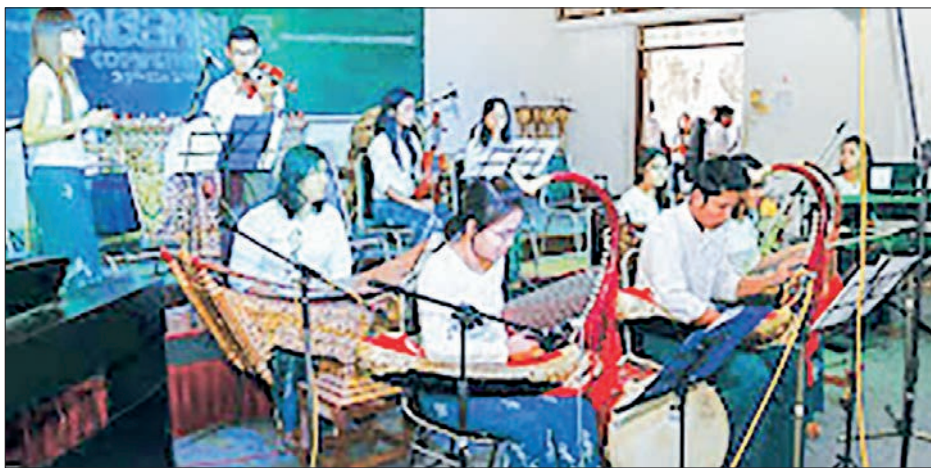
Students learning music course at National University of Arts and Culture (Yangon).

IN the academic year 2023-2024, candidates can submit applications to the National University of Arts and Culture (Yangon) to attend first-year courses on music, theatrical, painting, sculpture, film, drama and other specialized subjects, along with the first-year course for cultural heritage management by 17 October.