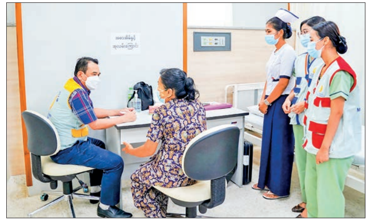
A gastroenterologist pays treatment to a patient from Magway Township during field trip of specialist team from Ministry of Health.

Similar programmes have already been conducted in Cyclone Mocha-hit Rakhine State, and Ayeyawady Region as well as Shan State and this initiative will continue to be implemented in other regions and states in the future.