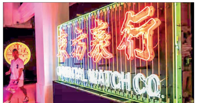
People visit a neon sign exhibition at Tai Kwun in Hong Kong on 5 July 2023, presented in association with Tetra Neon Exchange (TNX) a non-government organisation (NGO) that preserves Hong Kong's neon signs.

“Neon lights like these are becoming fewer and fewer... so I wanted to come here to take pictures to leave a memory for myself,” said 18-year-old student