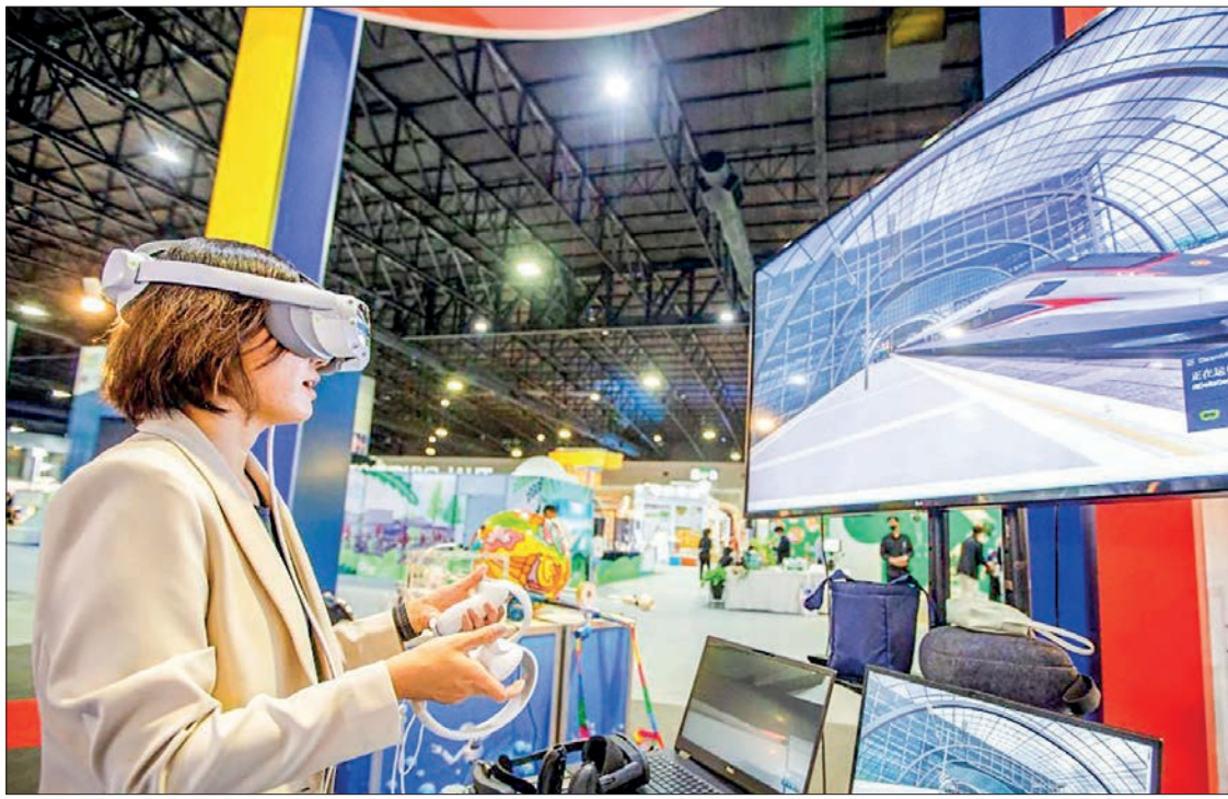
A visitor experiences a VR interactive system at the China Pavilion of Thailand National Science and Technology Fair 2023 in Bangkok, Thailand, 11 August 2023.