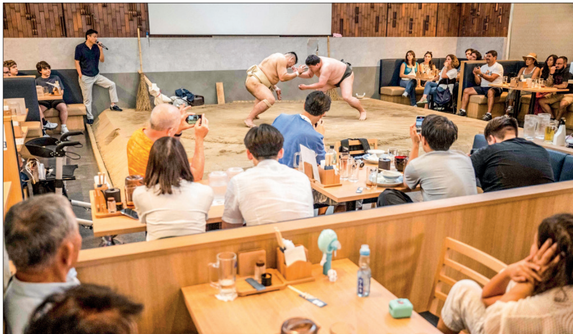
Former sumo wrestlers taking part in a demonstration match in front of tourists from abroad at the Yokozuna Tonkatsu Dosukoi Tanaka restaurant in Tokyo.

Afterwards, the spectators took selfies with the hulking athletes and donned padded sumo costumes and wigs to try their hand at the ancient art in a bout