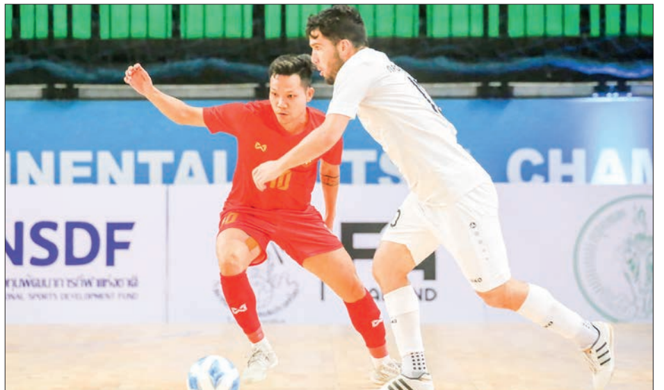
Myanmar player (red) fights for the ball against his opponent during the third-place match of the Continental Futsal Championship 2023.