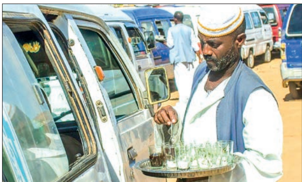
Out of work as fighting rages between the forces of rival generals, many Sudanese have been forced to find new ways to scrape a living.

Now the engineering lecturer and his family live in Wad Madani, a city where most of the nearly three million people displaced from the capital fled for safety with the few belongings they could bring. — AFP