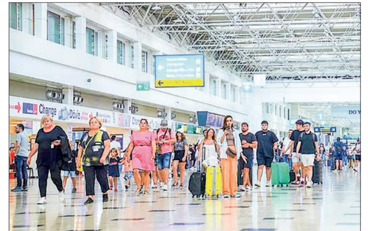
Antalya, a major tourist destination on Türkiye's southern Mediterranean coast, is undergoing a major expansion of its airport to accommodate the growing number of foreign visitors.