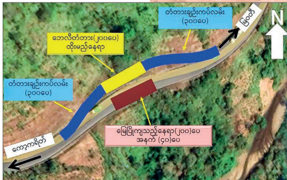
The aerial photo shows the construction site where a temporary bailey bridge is being built at the landslide-hit section of Asian Highway.