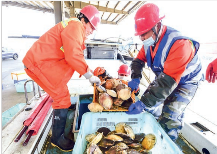
Japanese seafood is offloaded at a port in Taicang, a city in China's Jiangsu Province, on 28 March 2023.

In addition to seafood, other food and beverage items, including rice, from Japan have faced delays at Chinese customs fol-