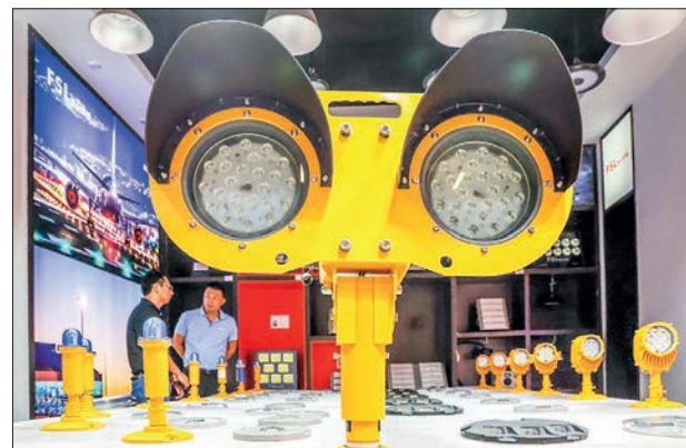
Lighting equipment of airport runway is displayed at an exhibition hall of Foshan Electrical and Lighting Co, Ltd in Foshan, south China's Guangdong Province, 8 August 2023.

FOSHAN Electrical and Lighting Co, Ltd (FSL) is one of the competitive lighting brands in China, providing full-range professional lighting solutions. The company has been actively engaging in