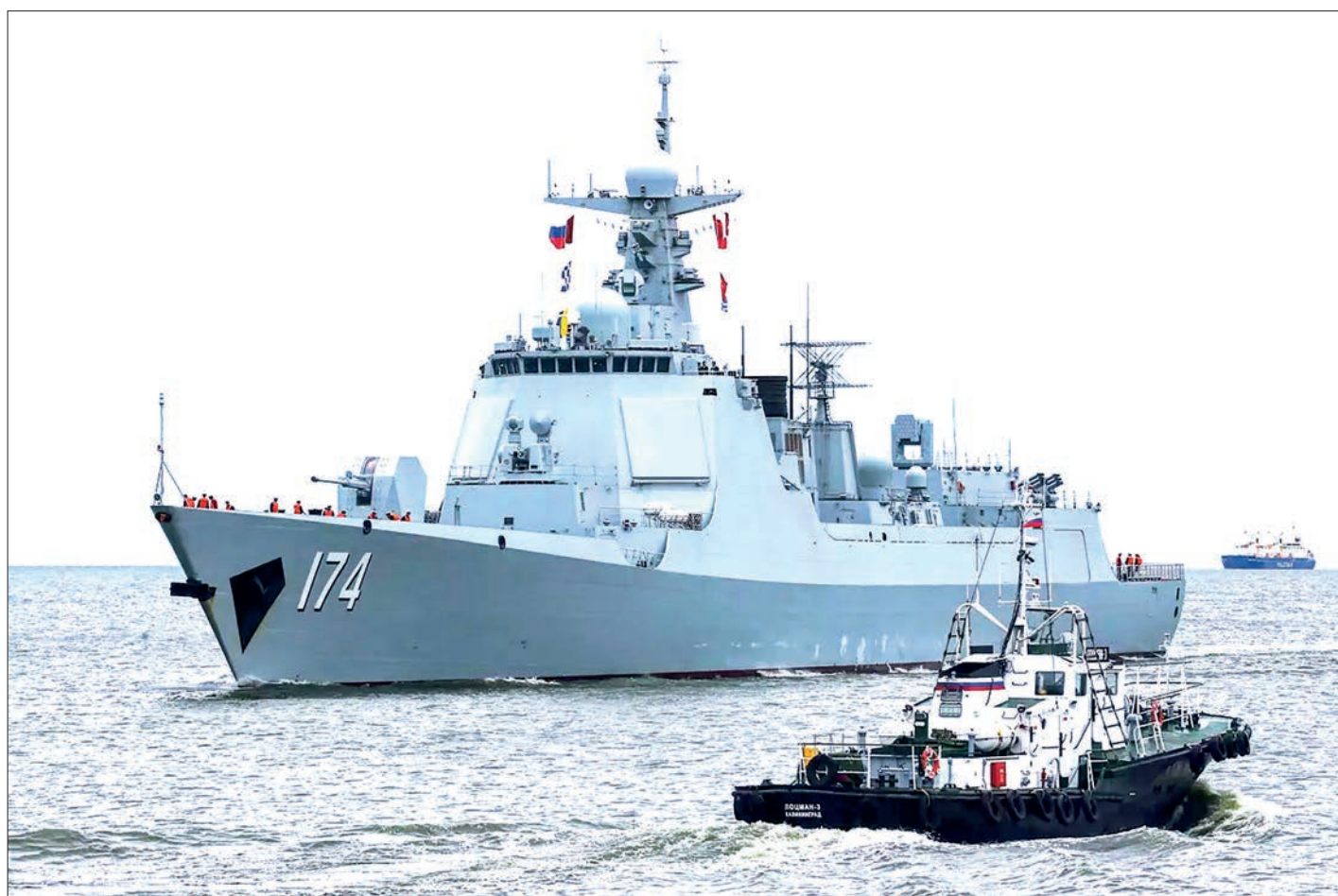
The Type 052D destroyer Hefei of the Chinese Navy arrives in Baltiysk for the 2017 Naval Cooperation Russia-China drills.

Meanwhile, the US mainstream press poured some more gasoline on the fire. On the very same day when the Pentagon said that the Russo-Chinese patrols posed zero challenge to the US, a mainstream American broadcaster told this story in its own way, hyping up the non-existent threat to gargantuan proportions. — SPUTNIK