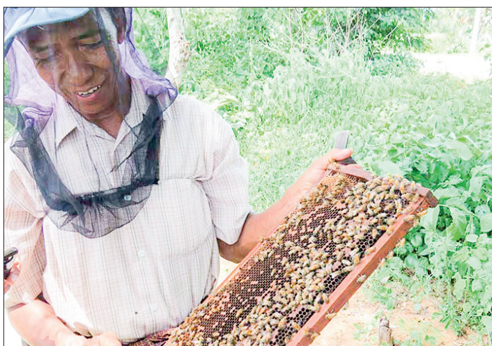
Bee-keeper inspects beehives for honey production in Magway.

Myanmar exported 1,853.74 MT to foreign markets by sea and 63.44 MT to neighbouring countries via cross-border. — NN/EM