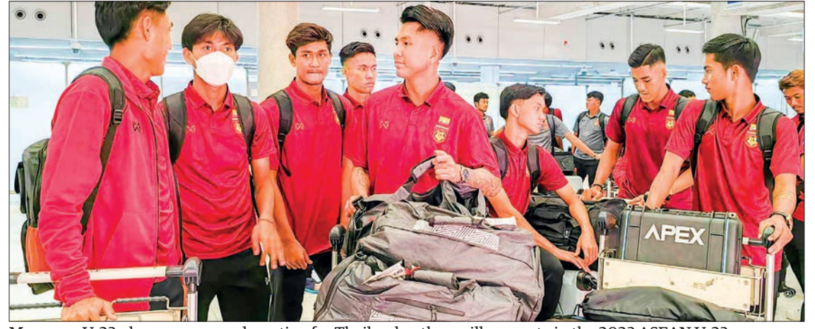
Myanmar U-23 players are seen departing for Thailand as they will compete in the 2023 ASEAN U-23 Championship.