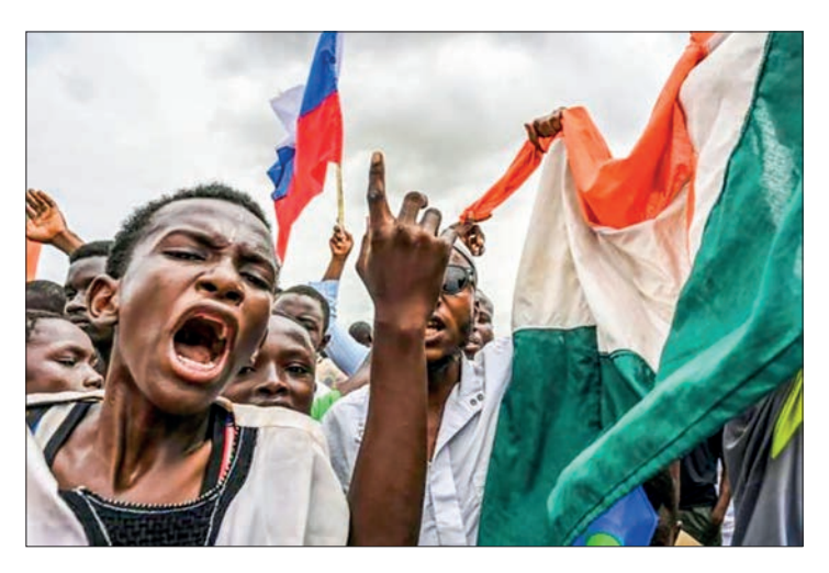
Supporters of the coup brandished Nigerien and Russian flags in the rally near the French airbase.

"We are going to make the French leave! ECOWAS isn't