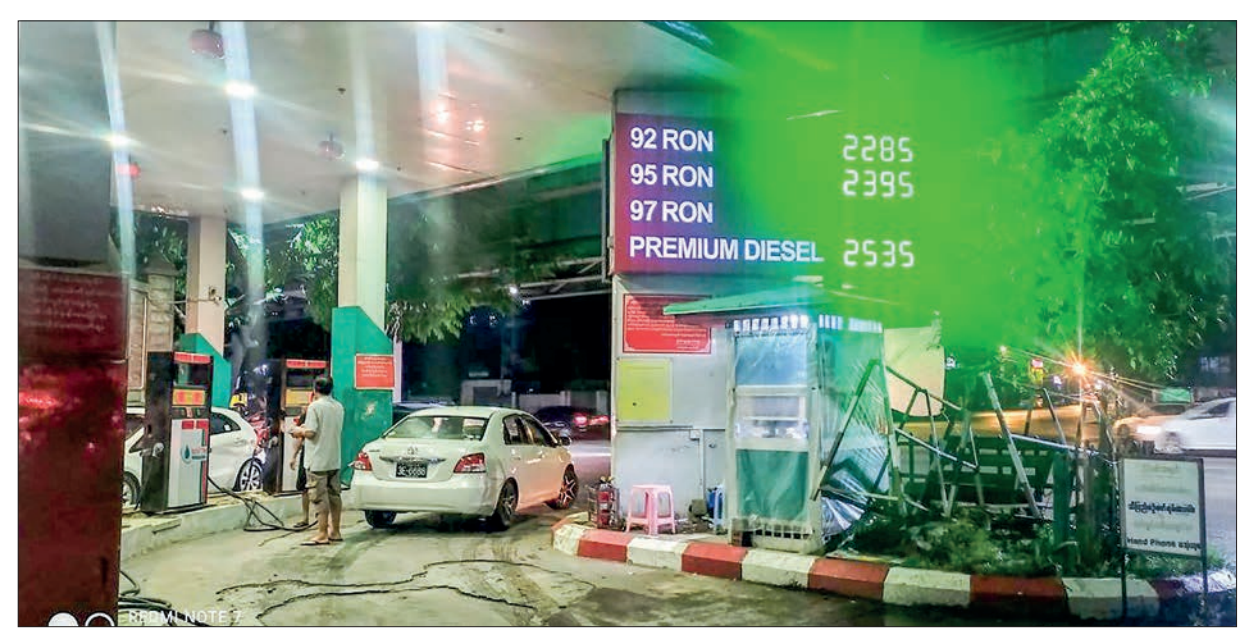
A petrol filling station showing prices of fuel on 12 August.