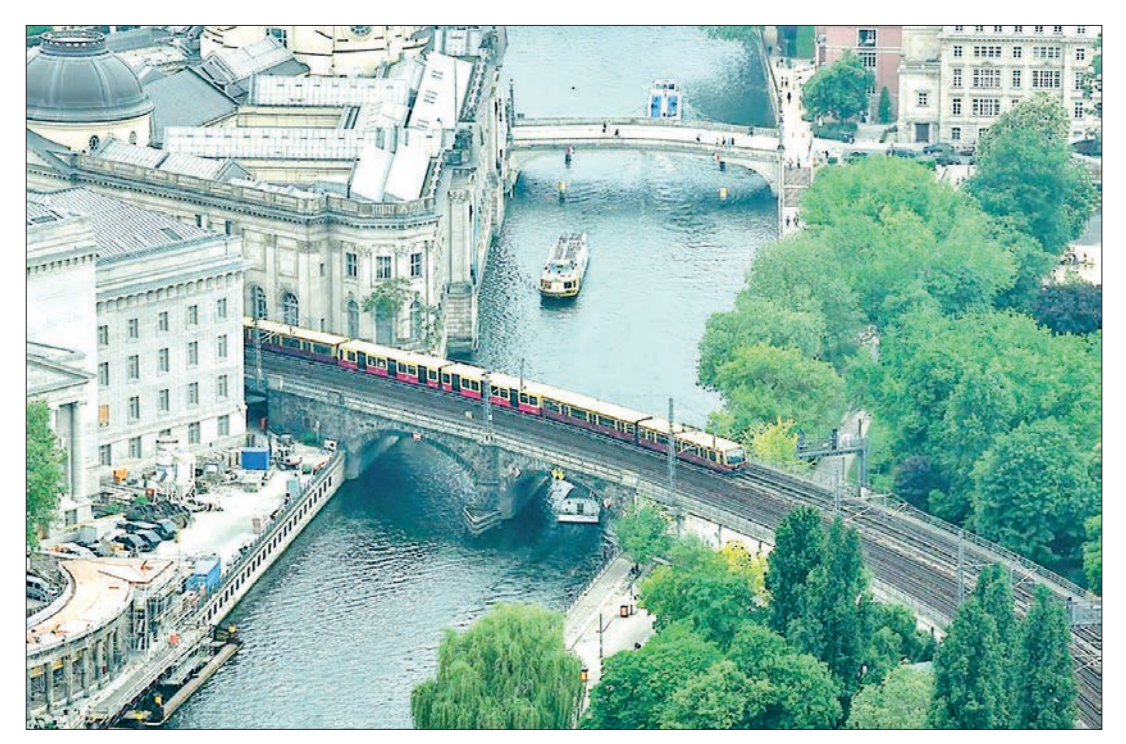
A train runs over the Spree River in Berlin, Germany, 23 May 2023.