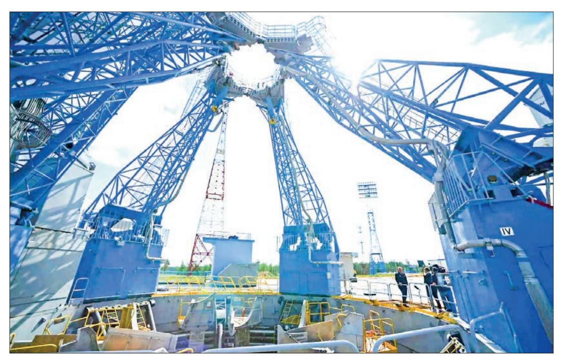
The Luna-25 station is like a spacecraft that can land gently on the Moon. It will collect and study samples of the Moon's soil to do important research for a long time.

THE Luna-25 station, equipped with soft landing technology, will take and analyze samples of the lunar soil to conduct long-term scientific research, including the study of the upper layer of the sur-