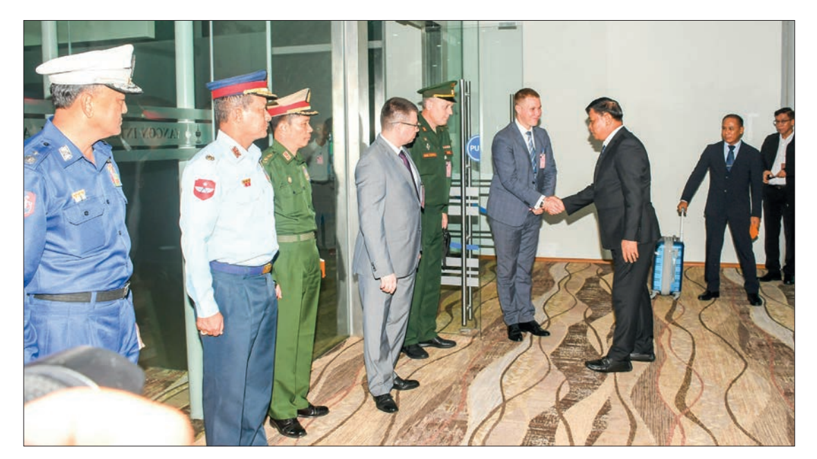
Deputy Prime Minister and Union Minister for Defence Admiral Tin Aung San is seen off by officials from the Embassy of the Russian Federation to Myanmar at Yangon International Airport yesterday.