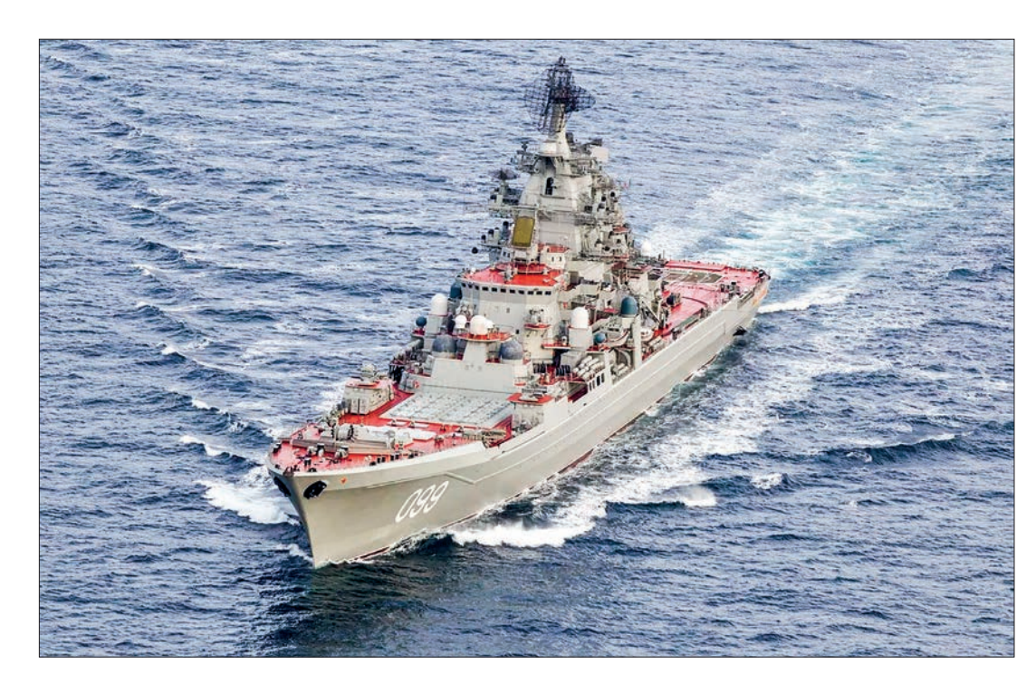
Russian Defence Minister Sergei Shoigu has checked the Russian grouping of troops in the Arctic zone and has flown over Russia's Central Test Site on Novaya Zemlya, the Russian Defence Ministry informs.

RUSSIAN Defence Minister Sergei Shoigu has checked the Russian grouping of troops in the Arctic zone and has flown over Russia's Central Test Site on Novaya Zemlya, the Russian Defence Ministry informs.