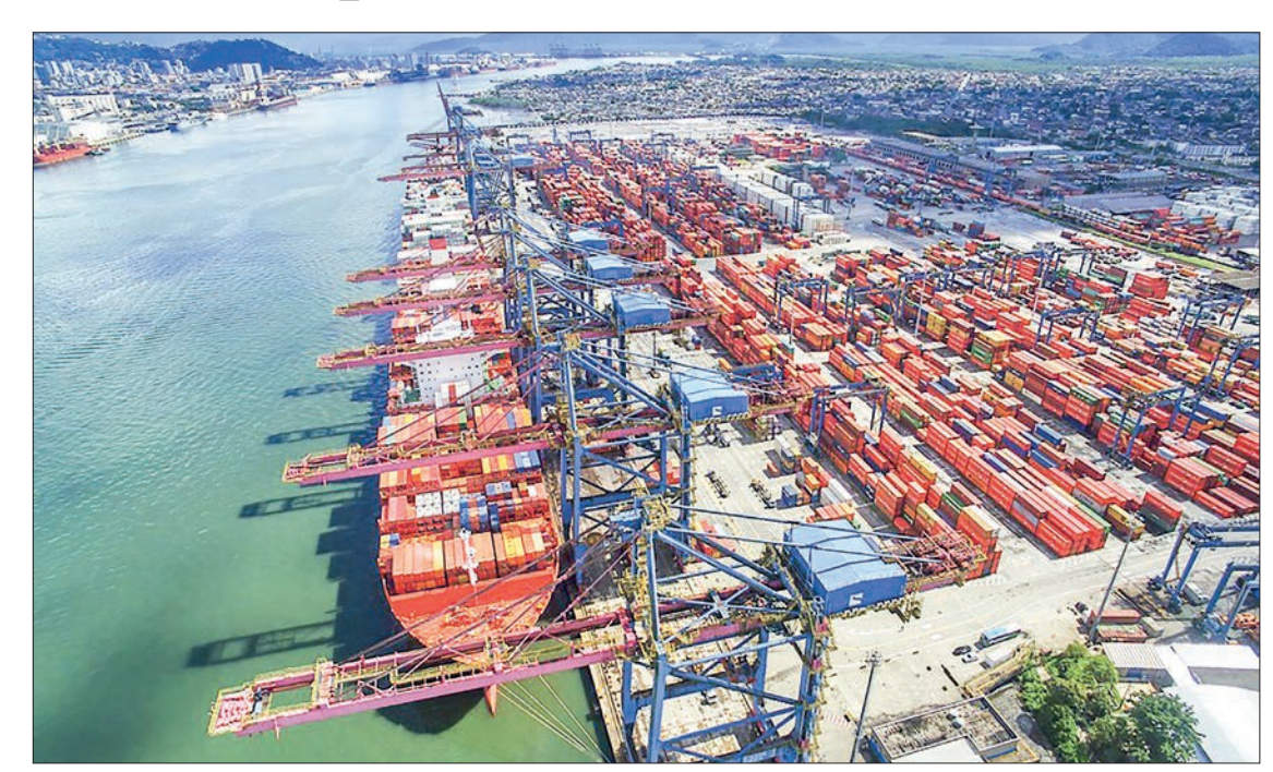
Bird's-eye view of the Port of Santos in Sao Paulo, Brazil.

and together, they evaluated the practical implementation of these measures.