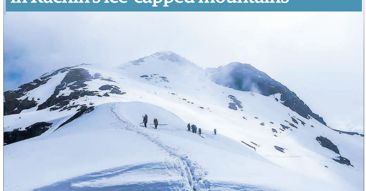
The hunters search for Sheepadees by trekking deep into the Hponkan Razi, Gamlang Razi, Madwe Razi and Hkakabo Razi (above photo), and the cordyceps fungus searched by Sheepadee harvesters are seen (right photos).

HE cordyceps fungus, Sheepadee in Myanmar, grows at altitudes of over 10,000 feet in the snow-capped Tibetan plateau of Putao District of Kachin State. Currently, the Sheepadee harvesters can make their extra income foraging for them.