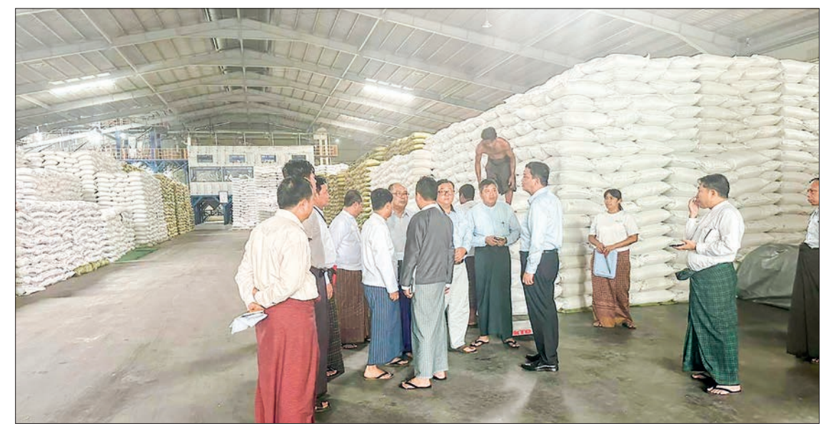
Officials from the State Reserved Rice Purchasing Supervisory Committee inspect the second batch of reserved rice purchasing process during a field visit yesterday.