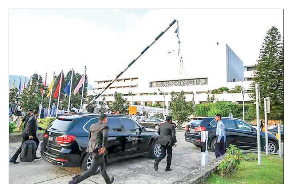
Security staff accompanied a vehicle transporting Pakistan's Prime Minister Shehbaz Sharif as he departed from the final session of the National Assembly in Islamabad on 9 August 2023.

PAKISTAN Prime Minister Shehbaz Sharif has expressed confidence that the name of the caretaker Prime Minister will be