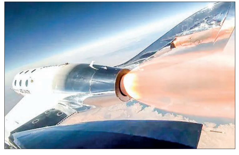
Virgin Galactic's first space tourism flight will include a mother-daughter duo from the Caribbean.

Goodwin, 80, an adventurer who competed in the 1972 Olympic games as a canoeist for Britain, became Virgin Galactic's first paying space tourist who won their tickets in a charity sweepstakes. — AFP