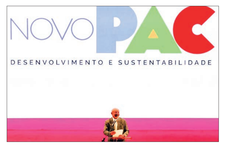
Lula during the launch ceremony of Growth Acceleration Programme (PAC) at Rio de Janeiro's Municipal Theatre.

Previous versions of the programme, in 2007 and 2010 during Lula's first and second terms (2003-2010), had mixed success since a number of planned projects had to be stopped due to lack of financing.