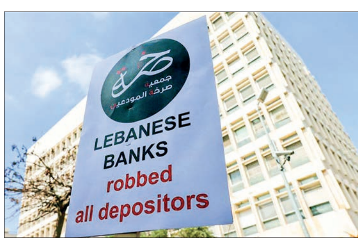
A file photo shows demonstrators carrying banners during a protest organized by the "Depositors' Outcry" association outside the Central Bank in Beirut to ask for deposits blocked in Lebanese banks.

copy of the preliminary report which was seen by AFP on Fri-