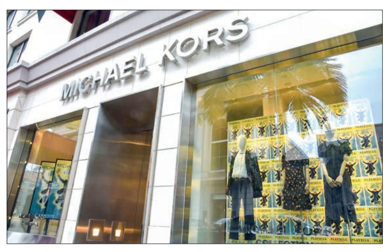
A file picture showing the Michael Kors store in Beverly Hills, California.