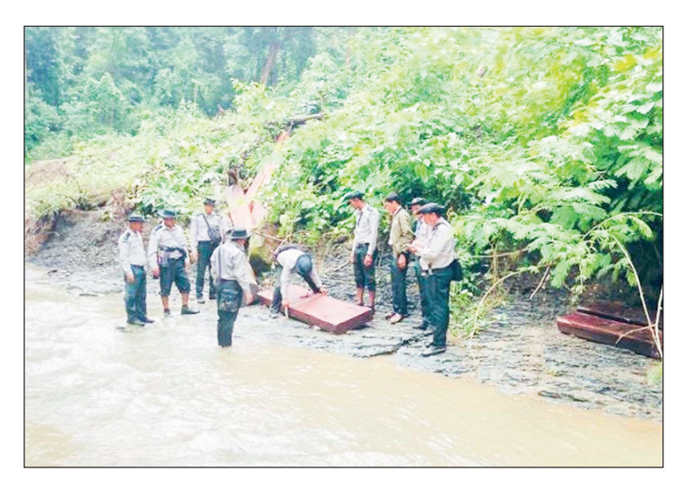
Officials from the Forest Department inspect confiscated hardwood timber in Toungoo District on 12 August.

THE combined on-duty teams under the management of Mandalay Region Illegal Trade Eradication Task Force made inspections on 11 August and confiscated a Nidi truck (approximately K30 million), headed to Mandalay from Muse, carrying 870 sets of Tecot electric pan cooker worth K10.44 million that were not declared in the Import Declaration (ID) at the milepost 20/5 on Mandalay-Muse