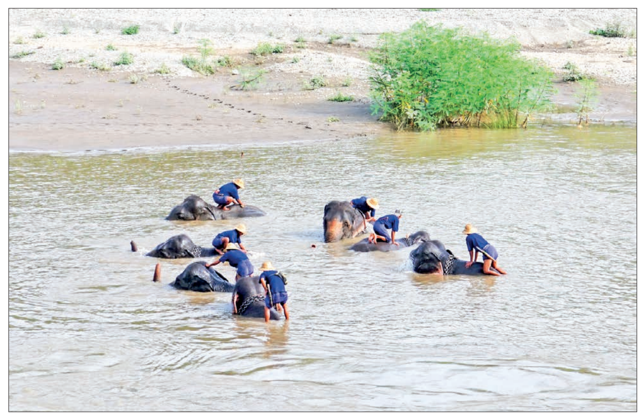
Photo shows elephants delight in refreshing baths at Shwesettaw Mann Creek.

The theme of this year is Bringing the World Together to Help Elephants.