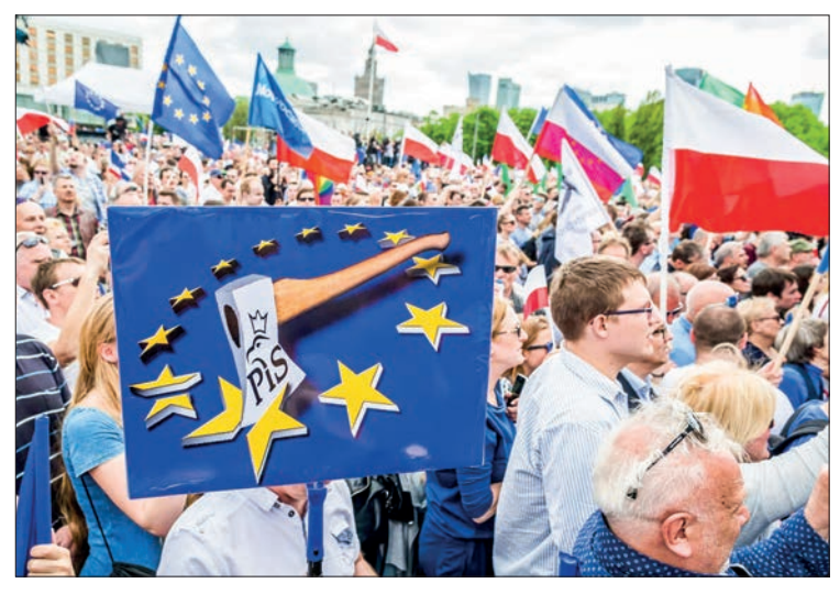
A protest against the governing PiS party takes place in Warsaw, Poland, on 7 May 2016.

POLAND'S populist, nationalist government is increasingly taking an anti-German, anti-European Union stance in the run-up to the October 15 legislative elections in the hope of mobilizing its most loyal followers, analysts say.