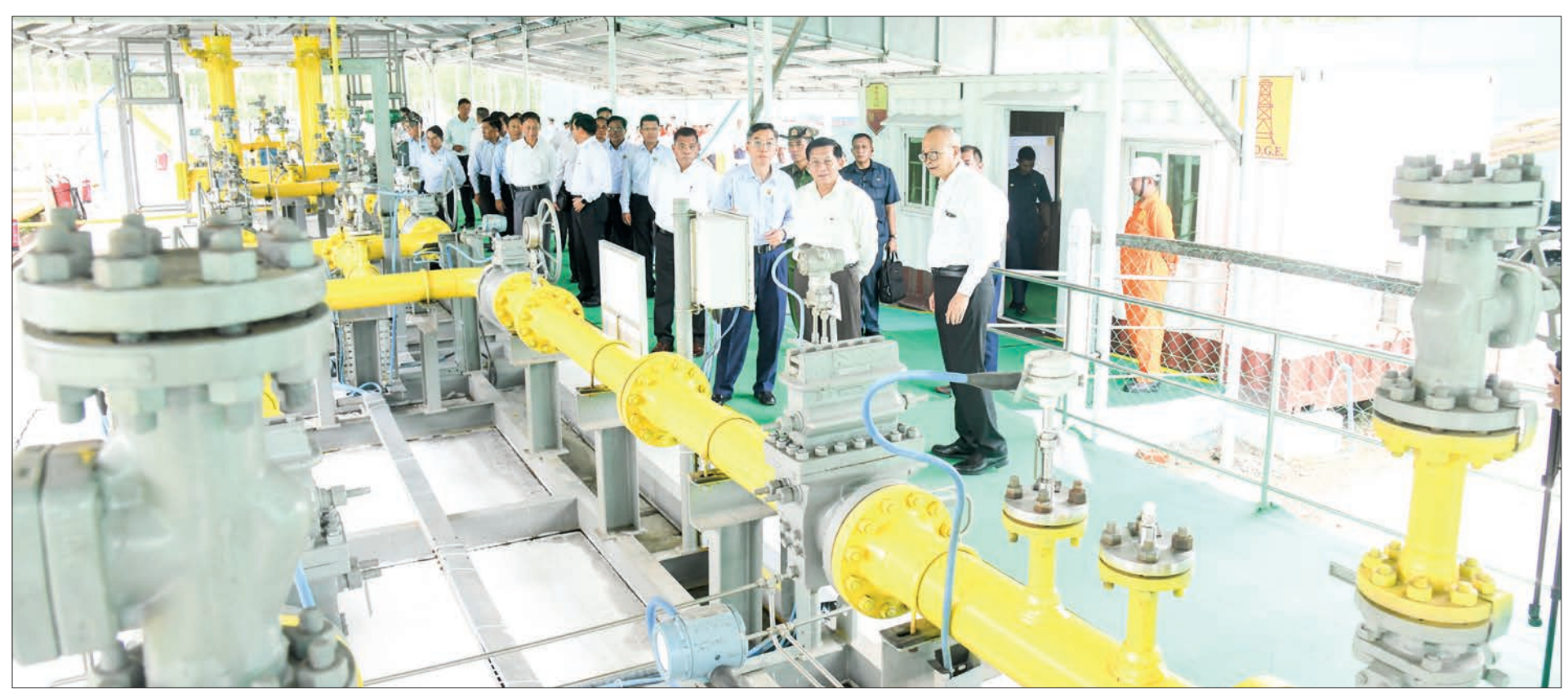
The Senior General inspects the supply of natural gas through a filtration system, pressure regulation system and metering system at the Thaboung natural gas distribution camp yesterday.