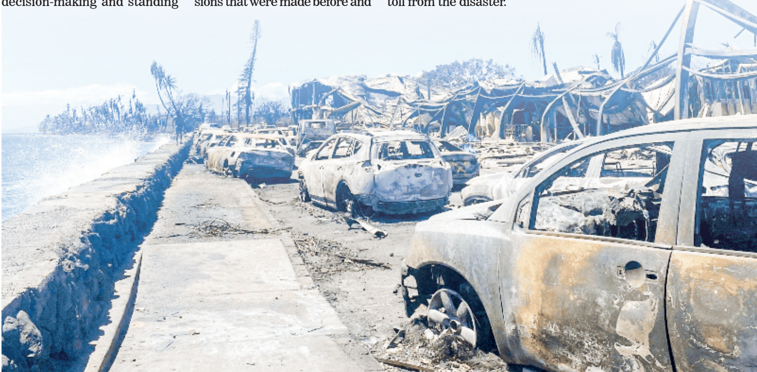
Officials have confirmed 80 deaths in the wildfires, but Maui County Mayor Richard Bissen warned the death toll "could go up".

"The number of fatalities is at 80," the county said, adding that 1,418 people were at emergency evacuation shelters.