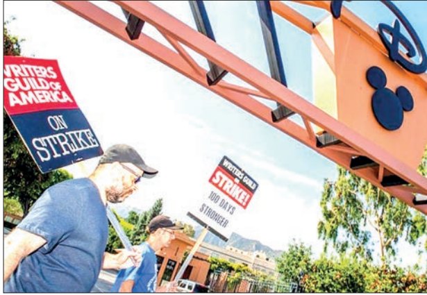
A loss of Disney+ subscribers comes as the entertainment giant faces off with striking actors and writers over the future of the industry.

DISNEY on Wednesday reported a loss for the most recent quarter, with the number of subscribers to its streaming service shrinking again, but a pledge to crack down on password sharing sent shares higher in after-market trades.