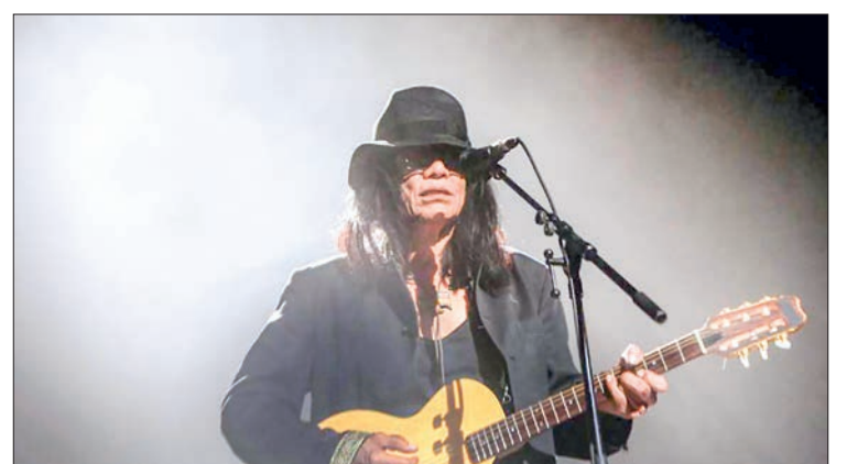
US singer and musician Sixto Rodriguez performs on stage during a concert at the Zenith on 4 June 2013, in Paris.

By most metrics, the albums bombed stateside, and Rodriguez quit the music industry to live a quiet, working-class life in Detroit. — AFP