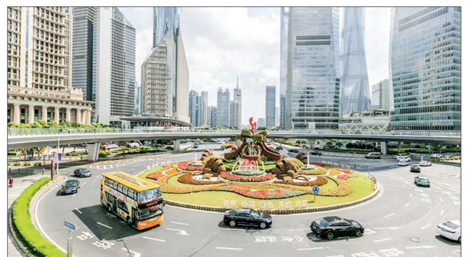
Photo taken on 30 September 2020 shows the street view of the Lujiazui area of Pudong, east China's Shanghai.

“We hope that the US side will respect the laws of market economy and the principle of fair competition, refrain from artificially impeding global economic and trade exchanges and cooperation, as well as setting obstacles for the recovery of world economic growth,” the spokesperson said. — Xinhua