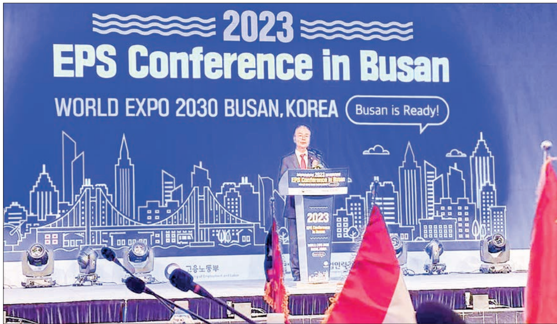
The 2023 EPS Conference held in Busan of Korea in progress.

“We will fundamentally reform the system following many economic and social changes compared to 20 years ago,” said Mr Lee Jung-Sik, Korean minister for the Ministry of Employment and Labour.