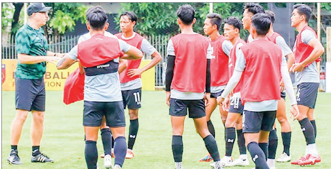
Myanmar U-23 players are seen preparing for the ASEAN U-23 Championship 2023.

THE Myanmar U-23 football team will play friendly matches in preparation for the ASEAN U-23 Championship 2023, as stated by the Myanmar Football Federation. With 37 preliminary squads, team Myanmar prepared their best starting on 6 August. Myanmar's youth team will play a friendly match