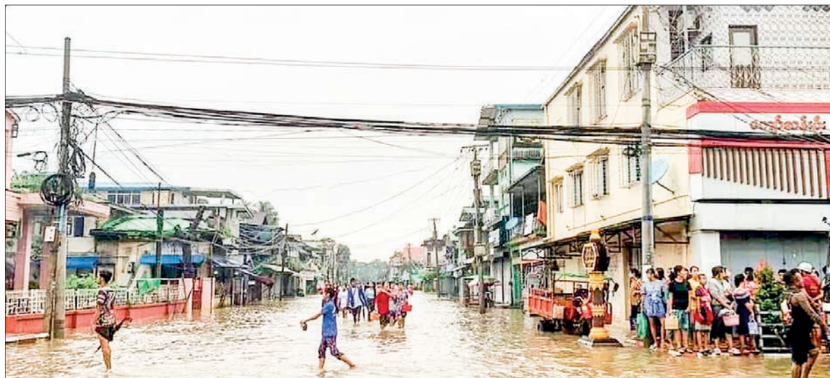
People are seen hurdling in the middle of floodwaters.

A total of 13 relief camps have been established to accommodate those affected by the flooding in low-lying areas and villages. Officials and generous contributors are supplying clean drinking water, sustenance, and medications to flood victims.