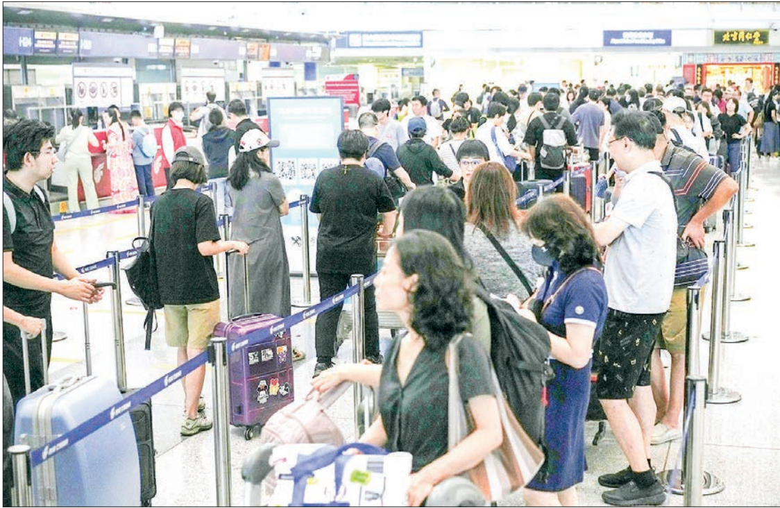
Travellers queue up to check in for flights to Japan at Beijing Capital International Airport on 10 August, 2023.

CHINA said Thursday that it has approved the resumption of Japan-bound group tours for its citizens, lifting restrictions introduced in January 2020 due to the COVID-19 pandemic, in a move expected to revitalize Japan's inbound tourism sector.