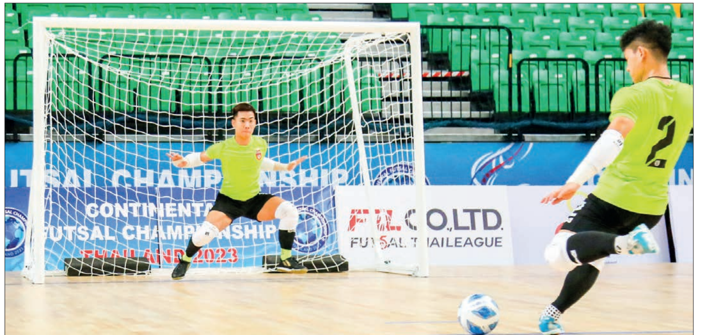
Myanmar futsal players are taking training intensively for the semi-final match of the Continental Futsal Championship 2023 against the Czech Republic.

The reported figure of over 100 million euros well exceeds their club record transfer outlay of 80 million euros paid in 2019 for French defender Lucas Hernandez. Hernandez left Bayern for Paris Saint-Germain in 2023 for 45 million euros. — AFP