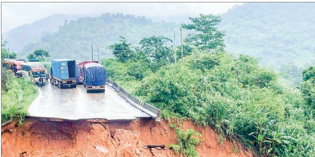
Trucks are seen stranded on the road due to the road collapse on Asian Highway.