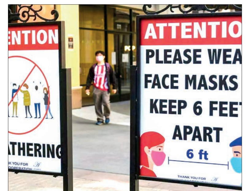
The US public health emergency declaration helped marshal resources during the worst of the COVID-19 crisis, when the virus was spreading rampantly.