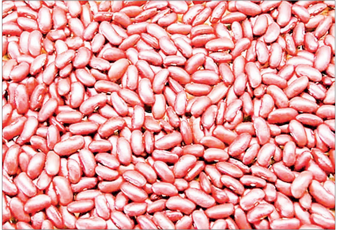
Kidney beans in Myanmar are grown in October and harvested in January and February.

Kidney bean cultivation begins in October-November and they are harvested in early February. They are grown in the upper Sagaing Region, Bhamo city in Kachin State, Kayin State and along Ayeyawady River. The beans produced from Katha and Bhamo townships are highly demanded in the domestic market on account of their large size. — NN/EM