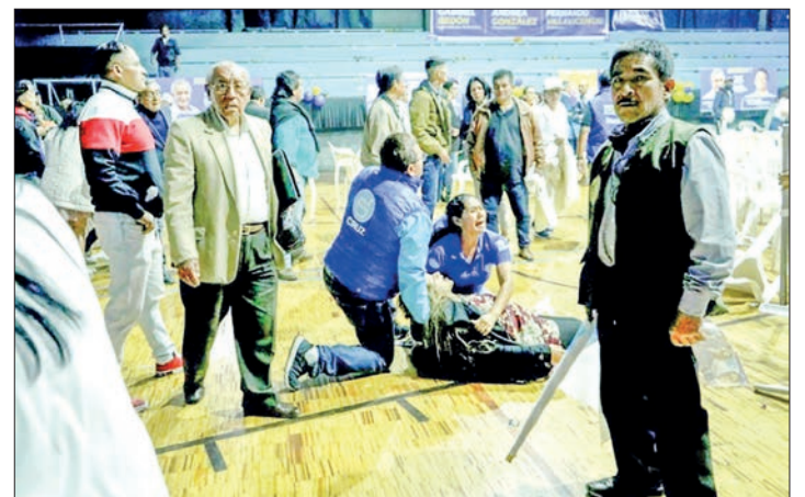
A woman is assisted after being wounded by shots fired during the assassination of presidential candidate Fernando Villavicencio after a rally in Quito.

A popular candidate running for Ecuador's presidency was shot dead as he was leaving a rally in the capital Quito on Wednesday evening, officials said.