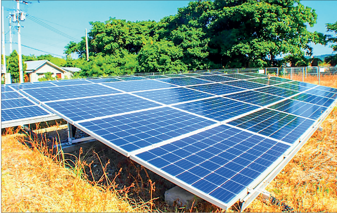
A glimpse into 2021: Solar Power Project in Wundwin Township in Mandalay Region.