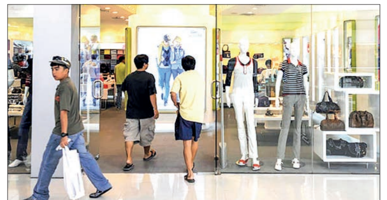
Filipino shoppers walk into a foreign brand clothes shop at a Manila shopping mall.

PHILIPPINE economic growth slowed sharply in the second quarter, official data showed Thursday, as high inflation, a drop in government spending and interest rate hikes dampened activity.