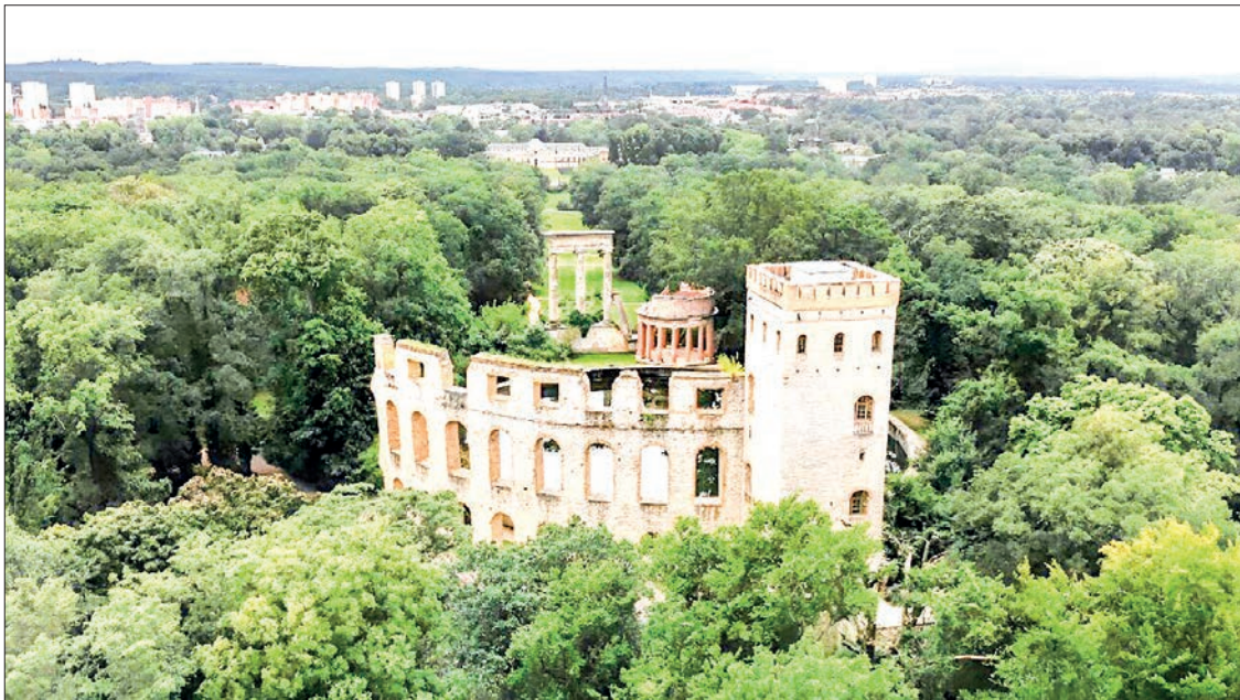
The grounds and manicured gardens in Potsdam are surrounded by a park filled with centuries-old trees.