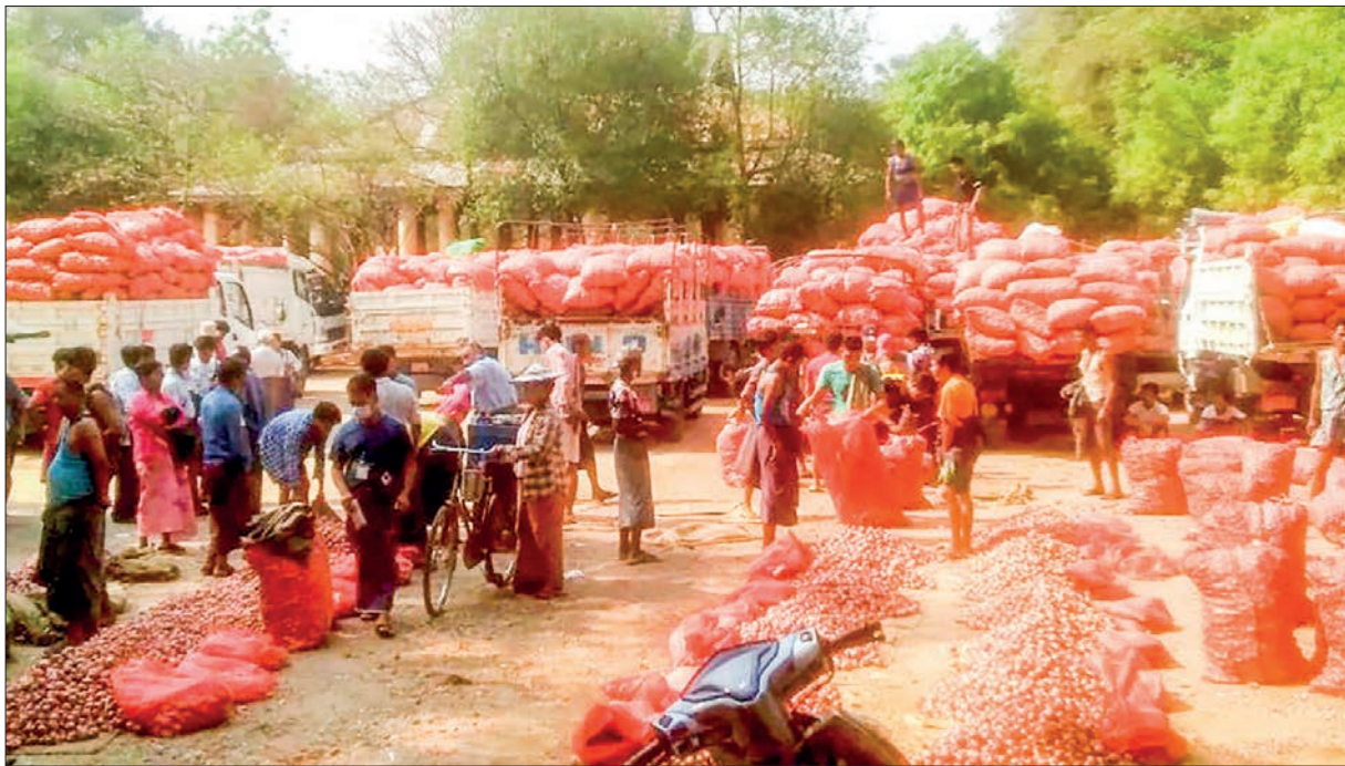
Sellers and buyers are seen at the Pakokku onion market.

APPROXIMATELY 1.8 million visses of onions (2,939 tonnes) from Seikphyu Township, Magway Region, were conveyed to domestic and foreign markets in July, according to the Trade Department under the Ministry of Commerce.