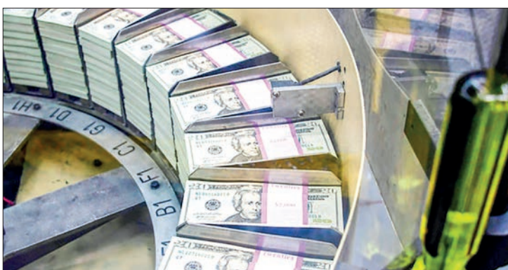
Packs of freshly printed 20 USD notes are processed for bundling and packaging at the US Treasury’s Bureau of Engraving and Printing in Washington, DC 20 July 2018.

STOCK markets and the dollar wavered Thursday before much-anticipated US inflation