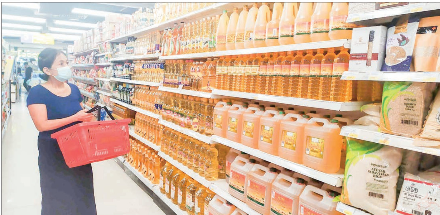
Edible oil displayed at one shopping centre.