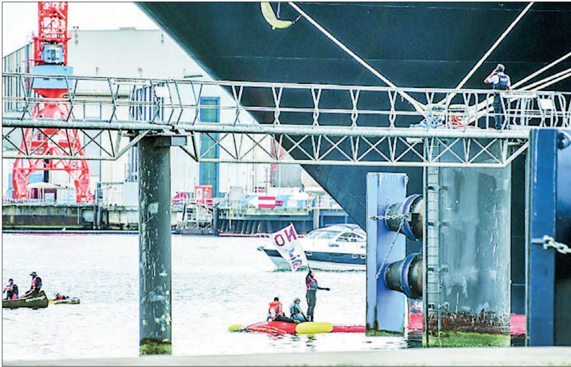
Climate activists of the u2018Smash Cruiseshitu2019 group on a small boat during an operation to block the Zuiderdam cruise ship at Kielu2019s harbour to protest against its carbon emissions.

BRITAIN will host an international energy security summit next year, the government announced on Thursday, inviting big oil-producing nations and companies but focusing also on net zero.