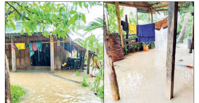
Photos show some houses are inundated in Taungup Township.

AFTER three days of continuous heavy rain, some residential houses were flooded in Ward No 1 and Ward No 2 of Maei, Taungup Township.