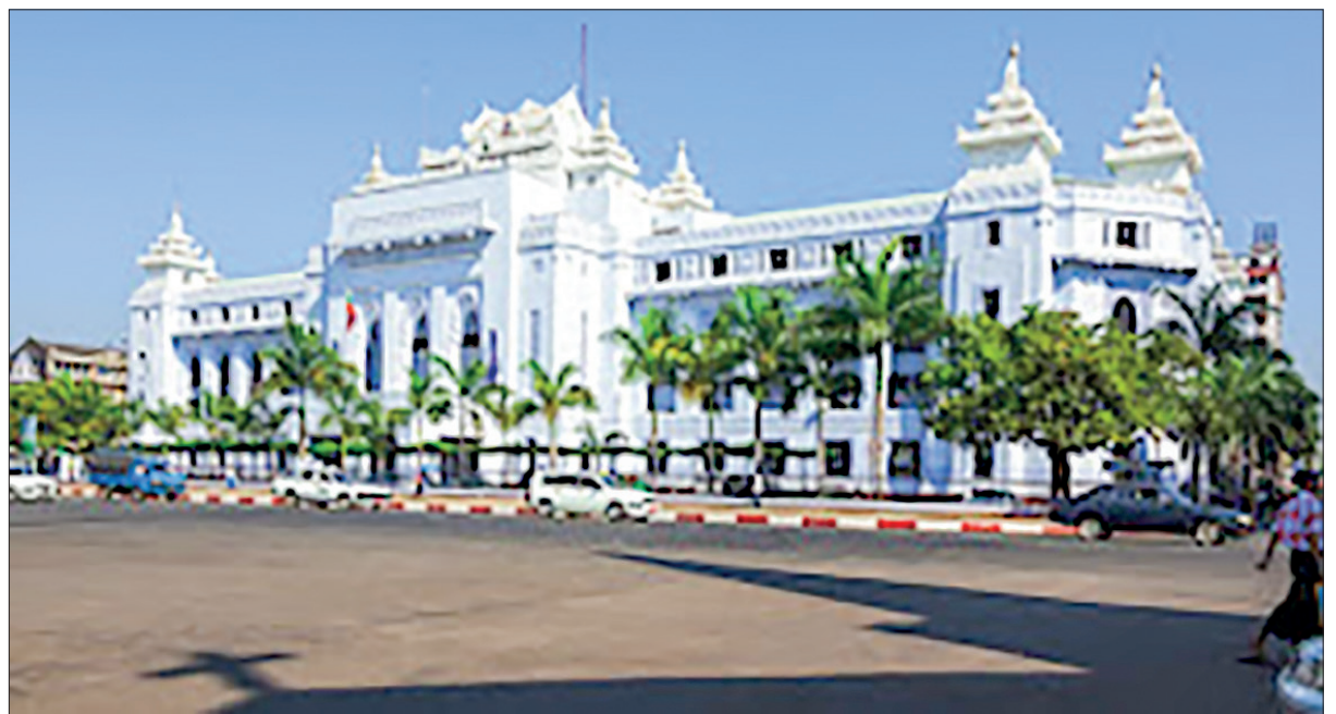
The photo shows the building where the YCDC office is located.

The buying price of onions in the summer of 2023 was high. However, there is uncertainty for the onions to reach the highest price recorded at the end of 2022. Yet, it is unlikely for the price to plunge at the lowest rate at the end of 2020 and 2021. The market observers pointed out that the growers who keep the stocks in hand might make a certain profit this year. — TWA/EM