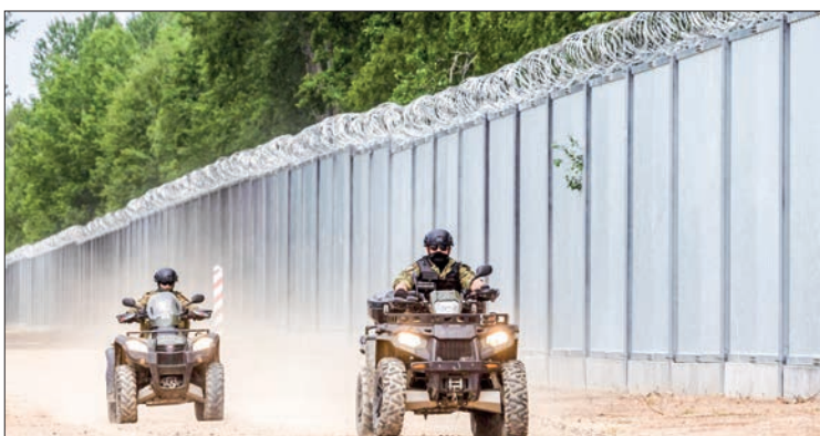
4,000 Polish soldiers will support the national border agency and the remaining 6,000 will be in the reserve. Polish border guards patrol along a section of the border wall in northeastern Poland.

"We decided to move troops closer to the Belarusian border in order to... scare the aggressor, so that the aggressor doesn't dare to attack Poland," he added. — AFP