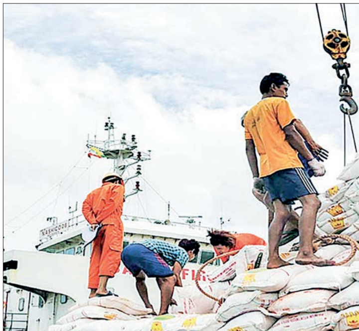
Bags of rice are seen being loaded onto the vessel for exportation at the wharf.

Myanmar pocketed over $809.135 million from approximately 2.164 million tonnes of rice export in the 2021-2022 FY (April-March).