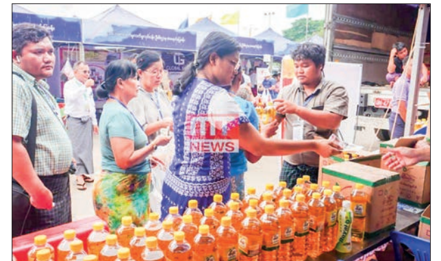
The photo shows sales of rice and cooking oil at fairer prices at the Monsoon Market Fair at People's Square on 4 August.

The rice and cooking oil were sold at fairer prices at the three-day monsoon market fair from 4 to 6 August at People's Square. On 7 August, the Shwebo Pawsan was sold at K110,000 to K120,000 per bag (108 pounds), Ayeyawady Pawsan K94,000 to K97,000, Aemahta (10 per cent) K65,000 and Aemahta (25 per cent) K60,000 at the rice wholesale centres (Wahdan and Bayintnaung). — TWA/KTZH