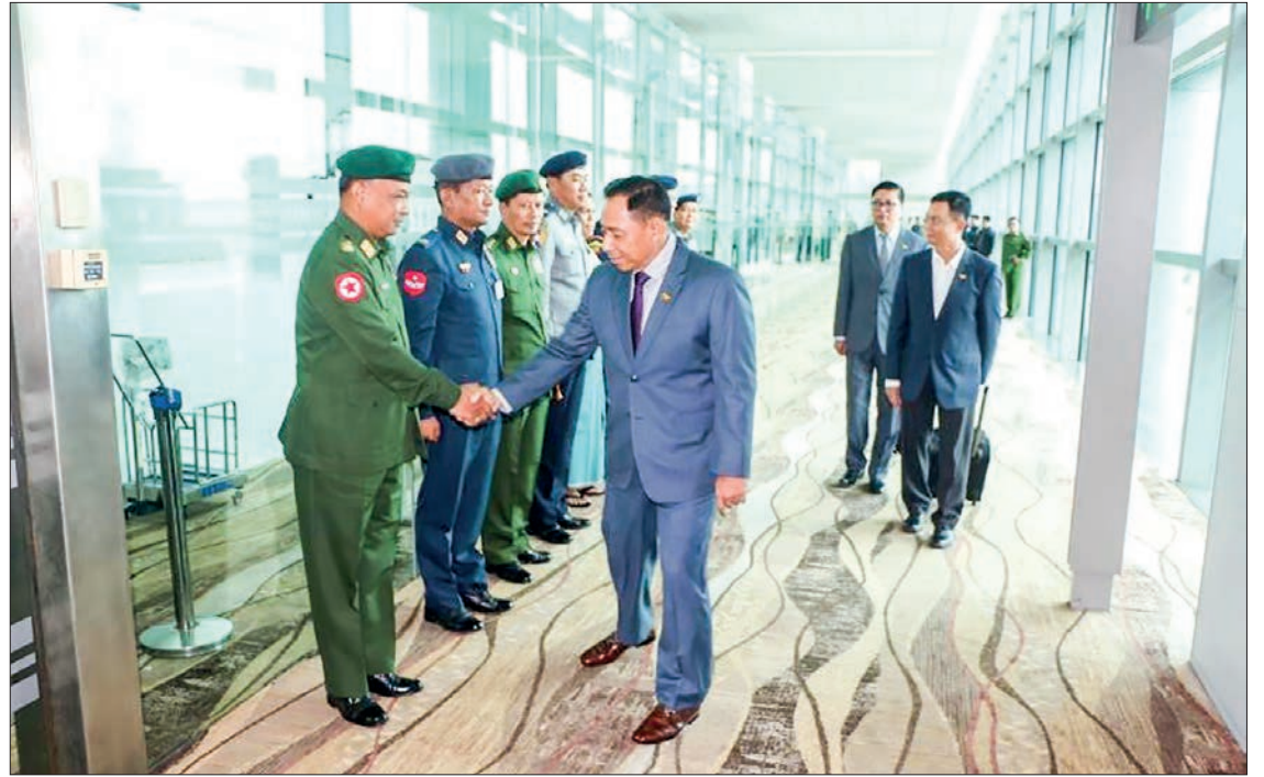
Union Minister Lt-Gen Yar Pyae is seen before leaving for Laos yesterday at Yangon International Airport.

al Meeting on Narcotics will foster a platform for constructive discussions and strategies aimed at tackling the pressing challenges posed by narcotics. Myanmar's active involvement, led by Union Minister Lt-Gen Yar Pyae, reinforces the country's resolve to collaborate and contribute meaningfully to regional efforts in dealing with this issue. — MNA/TS