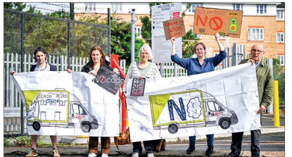
In a quiet corner of London a struggle is being waged over the site where Ocado wants to open a big distribution hub.

The battle has taken a group of parents and local residents — terrified by the potential air pollution impact on the school's hundreds of young pupils — all the way to London's High Court, and echoes similar concerns in other cities in Europe and beyond. — AFP