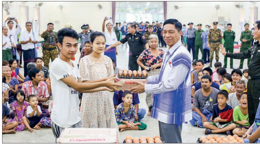
Union Minister Dr Soe Win provides foodstuffs to family members of flood victims yesterday.