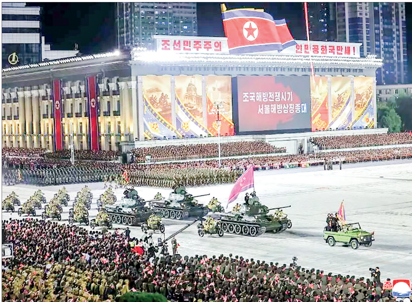
North Korea held a massive military parade commemorating the 70 th anniversary of the end of the Korean War, which the country refers to as Victory Day.

N ORTH Korean leader Kim Jong-un has signed a written order to further step up the army preparations “in the offensive way” after summarizing and analyzing the situation on the Korean peninsula, the state-run news agency reported on Thursday.