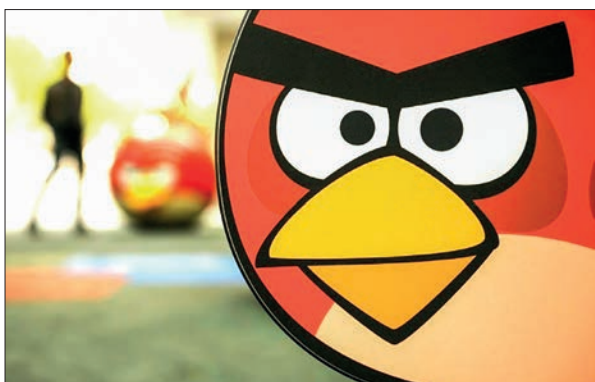
Angry Birds became one of the most successful mobile games ever after its release in 2009.

"As the minimum acceptance condition and all other conditions to complete the offer have been fulfilled, the offeror will complete the offer in accordance with its terms and conditions," Rovio said. — AFP