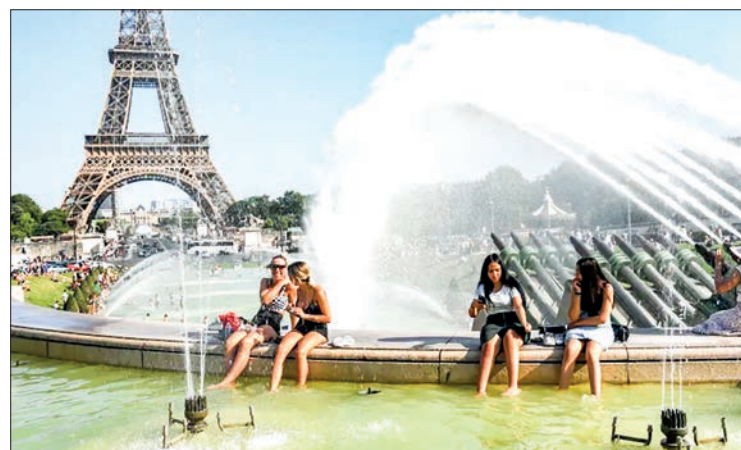
People cool off at the Trocadero Fountains next to the Eiffel Tower in Paris, on 23 July 2019 as a new heatwave hits Europe.

European Union’s climate observatory confirmed Tuesday.