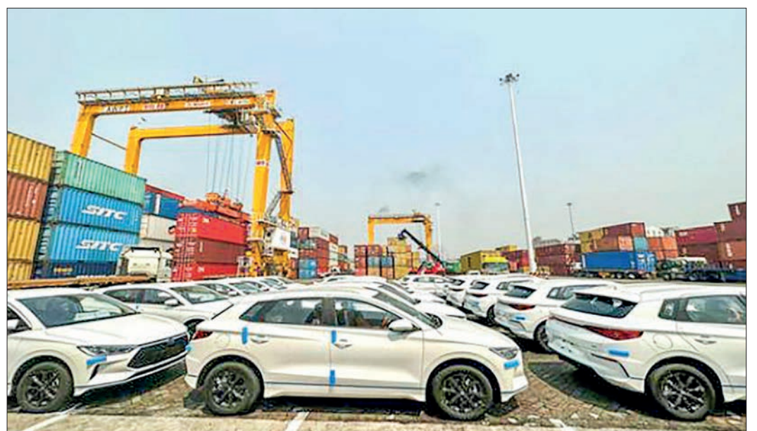
Fresh fleet of electric vehicles (EVs) arriving at Hteedan Port in Yangon.