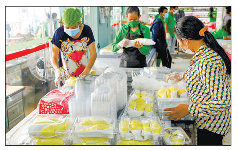
Workers prepares durian for sale at a shop in Phnom Penh on 17 June 2021.

"As rice price on the international market is soaring, Cambodia is studying strategies that can benefit the economy from this event," said Im Rachna, undersecretary of state and spokeswoman for the Ministry of Agriculture, Forestry and Fisheries. — Xinhua