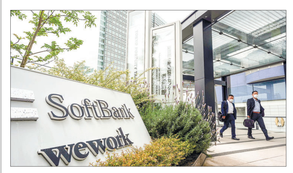
Pedestrians walk outside the headquarters for Japanese company SoftBank Group in Tokyo Portcity Takeshiba on 11 May 2023.

SOFTBANK Group Corp a net loss of 477.62 billion three months ended June, said Tuesday it registered yen ($3.3 billion) for the