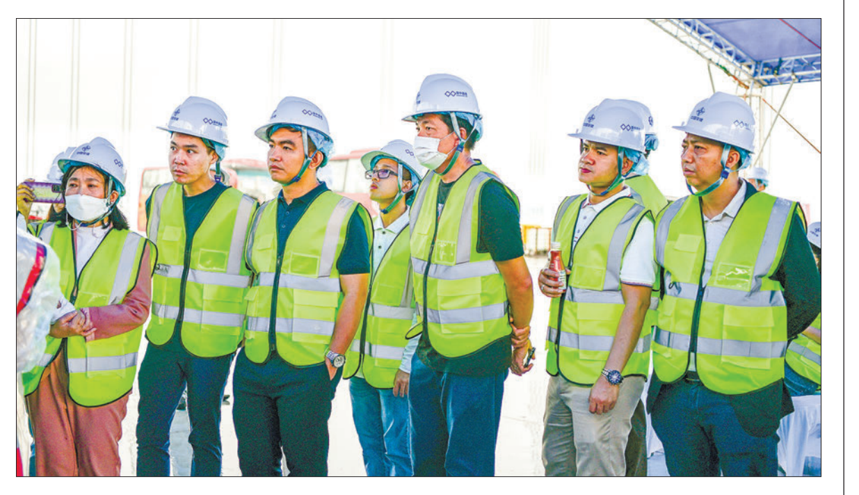
Journalists listen with interest to the explanations about the construction of the bridge.