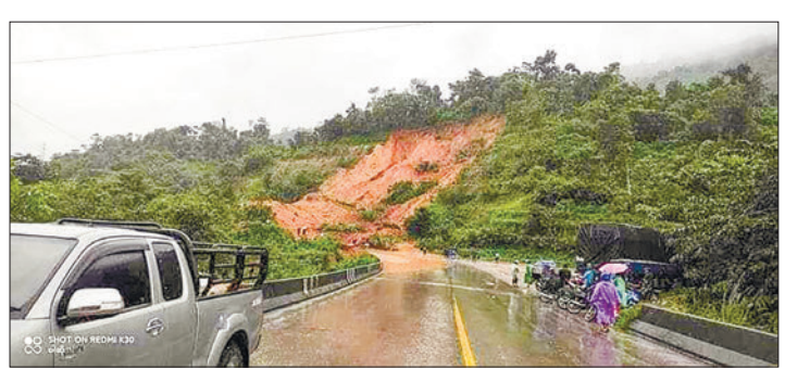
Image capturing landslide at Natsin corner and Yinkwal mountain road collapse on 8 August.

A larger landslide, roughly three times the size of the previous day's, has been reported near the site of yesterday's landslide along the Myawady-Kawkareik Asian Highway. On 8 August, around 12:30 pm, another landslide occurred close to the spot where a truck trailer had been engulfed during the previous