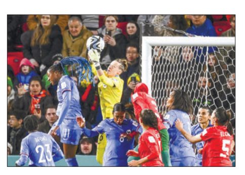
France's goalkeeper 16 Pauline Peyraud-Magnin (C) makes a save during the Australia and New Zealand 2023 Women's World Cup round of 16 football match between France and Morocco at Hindmarsh Stadium in Adelaide on 8 August 2023.

Nyein Min Soe for team Myanmar crowned the Man of the Match Award after the match against Solomon Island.