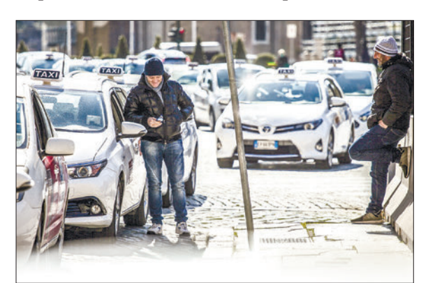
Taxi drivers wait for customers at a taxi rank on Piazza Venezia in downtown Rome on 10 March 2020.

Italy's competition watchdog said last week that it was looking into the taxi sector, which is run by a powerful lobby, amid reports of a severe shortage in major cities including Rome, Milan and Naples.