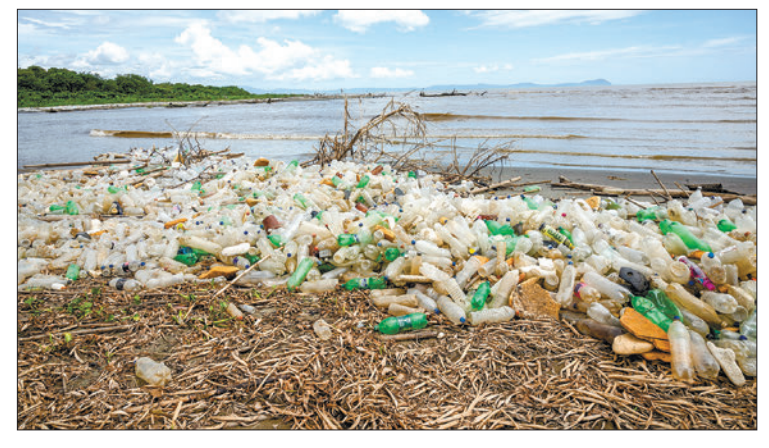
Garbage, including plastic waste, is seen at Paparo Beach in Miranda State, Venezuela, on 6 June 2023.

"Large, floating pieces on the surface are easier to clean up than microplastics," the study's co-author Erik van Sebille of Utrecht University in the Netherlands said in a statement. — AFP