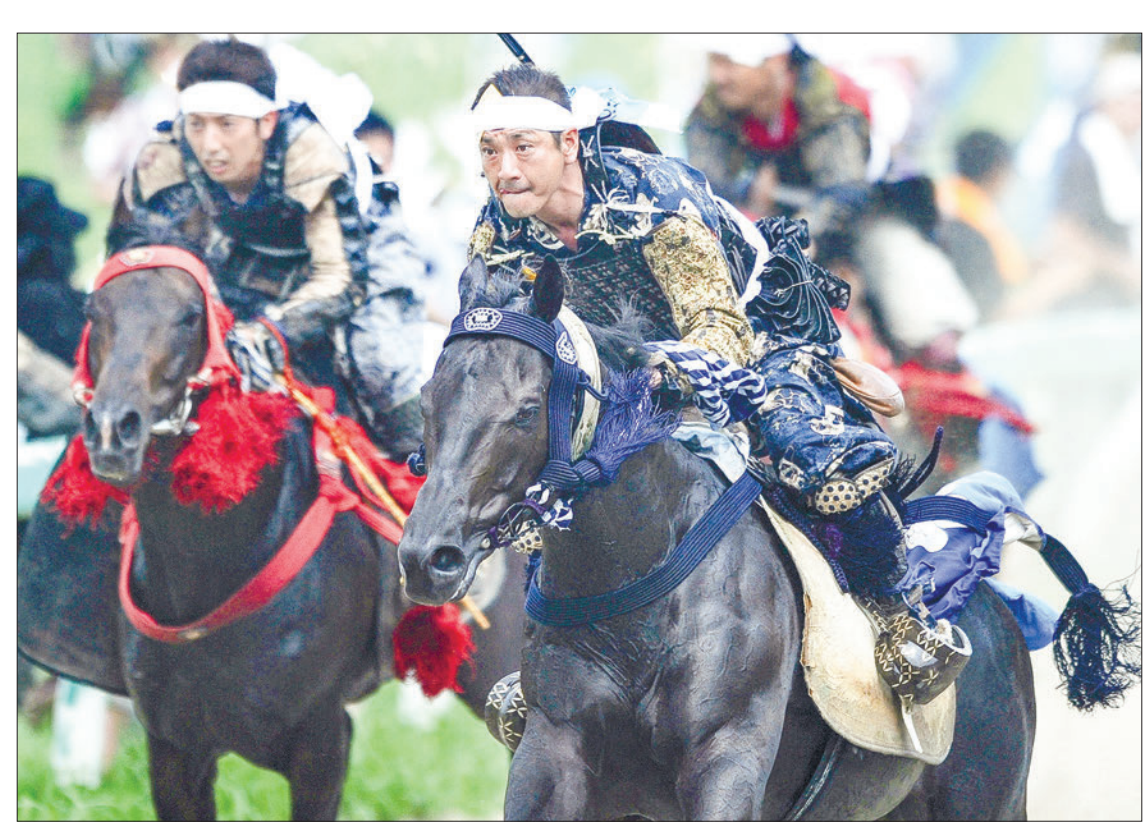
(FILES) People wearing samurai armour race horses during the annual Soma Nomaoi Festival in Minamisoma, Fukushima Prefecture on 29 July 2012.

Two of the animals died, they said. The annual three-day event, which features more than 400 participants dressed as medieval samurai warriors fighting on horseback over flags that are shot overhead by fireworks, attracted more than 120,000 people, reports