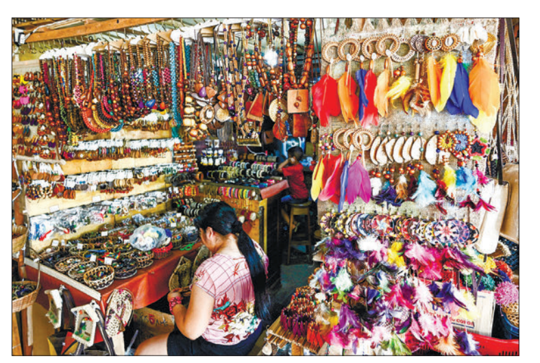
A vendor sells earrings and necklaces at a regional handicraft stall at the Ver o Peso market, the most popular tourist spot in Belem, Para State, Brazil, on 7 August 2023, ahead of the Amazon Summit in this city.

"We're calling on world leaders to work hard to promote conservation. Our struggle isn't just for Indigenous peoples, it's for the