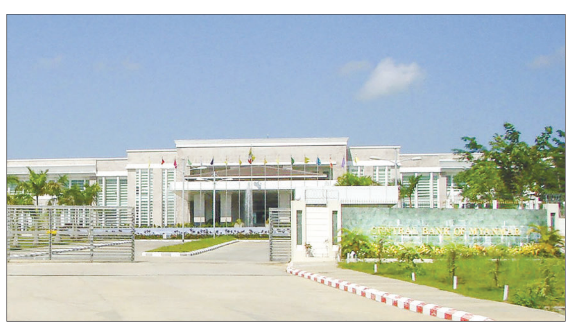
The photo shows the front view of the Central Bank of Myanmar office in Nay Pyi Taw.

The permitted transaction conditions are as follows; transactions for important goods and payment after due date, one entity is allowed to make transactions at the designated bank with the presence of import licence and overdue invoice when it