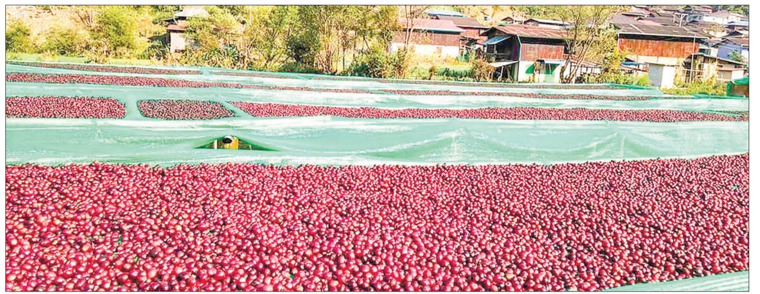
A farm \ worker \ handpicks \ coffee \ beans \ (top\ -right\ photo)\ while\ on\ the\ coffee \ farm,\ beans\ are\ sun\ -dried\ after\ being\ harvested\ (above\ photo).

Myanmar's coffee is harvested between December and March and distributed to the markets in late April. The coffee bean is mostly grown in Mandalay Region and Shan State and can be found in other regions and states as well.