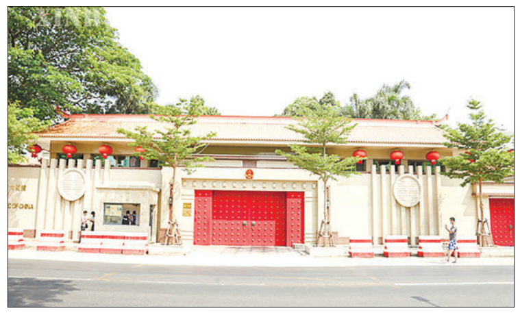
The Embassy of the People's Republic of China to Myanmar.

To facilitate the application of Chinese visas by foreigners, the Chinese Embassy in Myanmar stated that fingerprinting will be waived for business visas (M) that meet the requirements, tourist visas