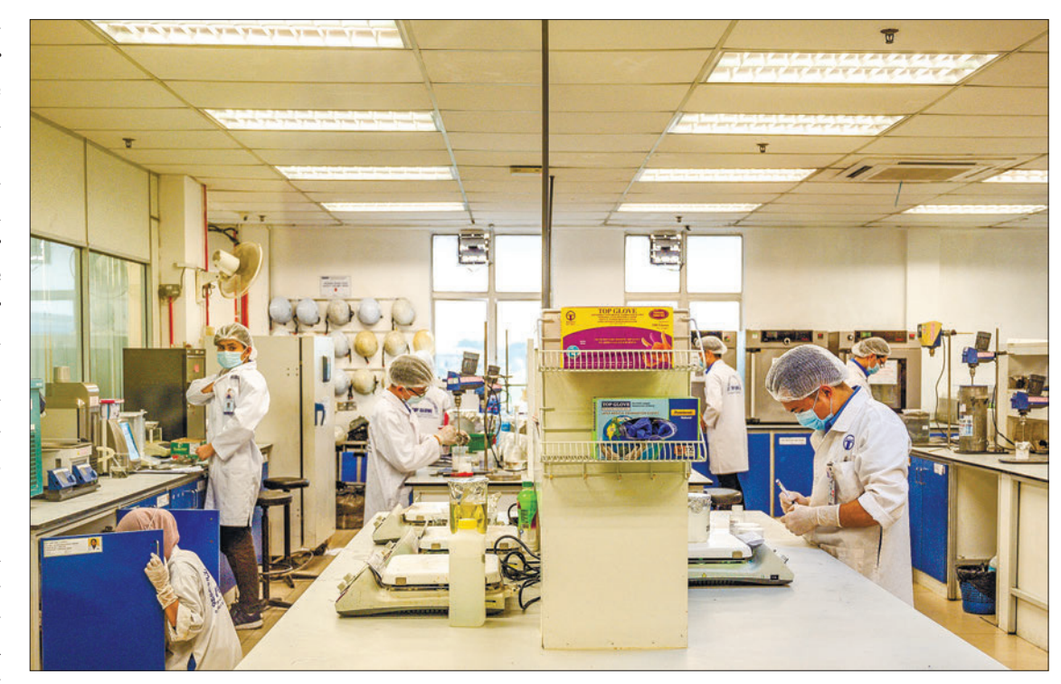
Staff of Top Glove factory works in the research and development department lab in Shah Alam on the outskirts of Kuala Lumpur on 26 August 2020. Top Glove, a Malaysian-based company is one of the world's largest rubber glove manufacturer

China remained the main destination for Malaysia's natural rubber exports which accounted for 50.6 per cent of total exports in June. This was followed by Germany (7.8 per cent), the United States (4.9 per cent), Pakistan (3.1 per cent) and Iran