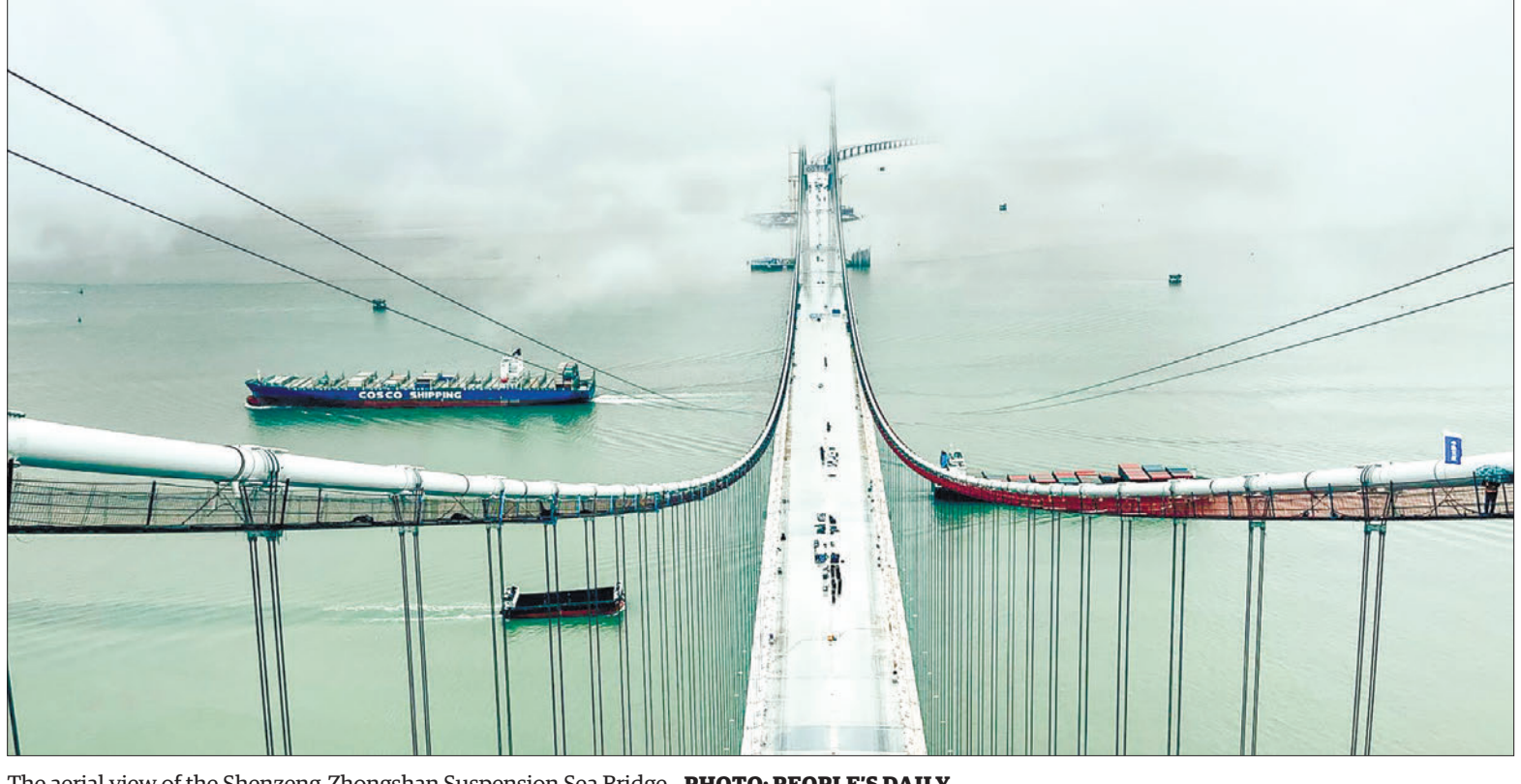
The aerial view of the Shenzeng-Zhongshan Suspension Sea Bridge.

The main cable of the bridge consists of 199 strands and each