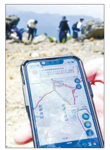
Photo taken in Fukushima Prefecture on 17 June 2023, shows a screen displaying the hiking app Yamap.

When informed of a stranded mountaineer, police and rescuers ask Yamap if the missing person is a user of the app. If so, the company then directly tells the rescue team the latitude and longitude of the location of the person. — Kyodo