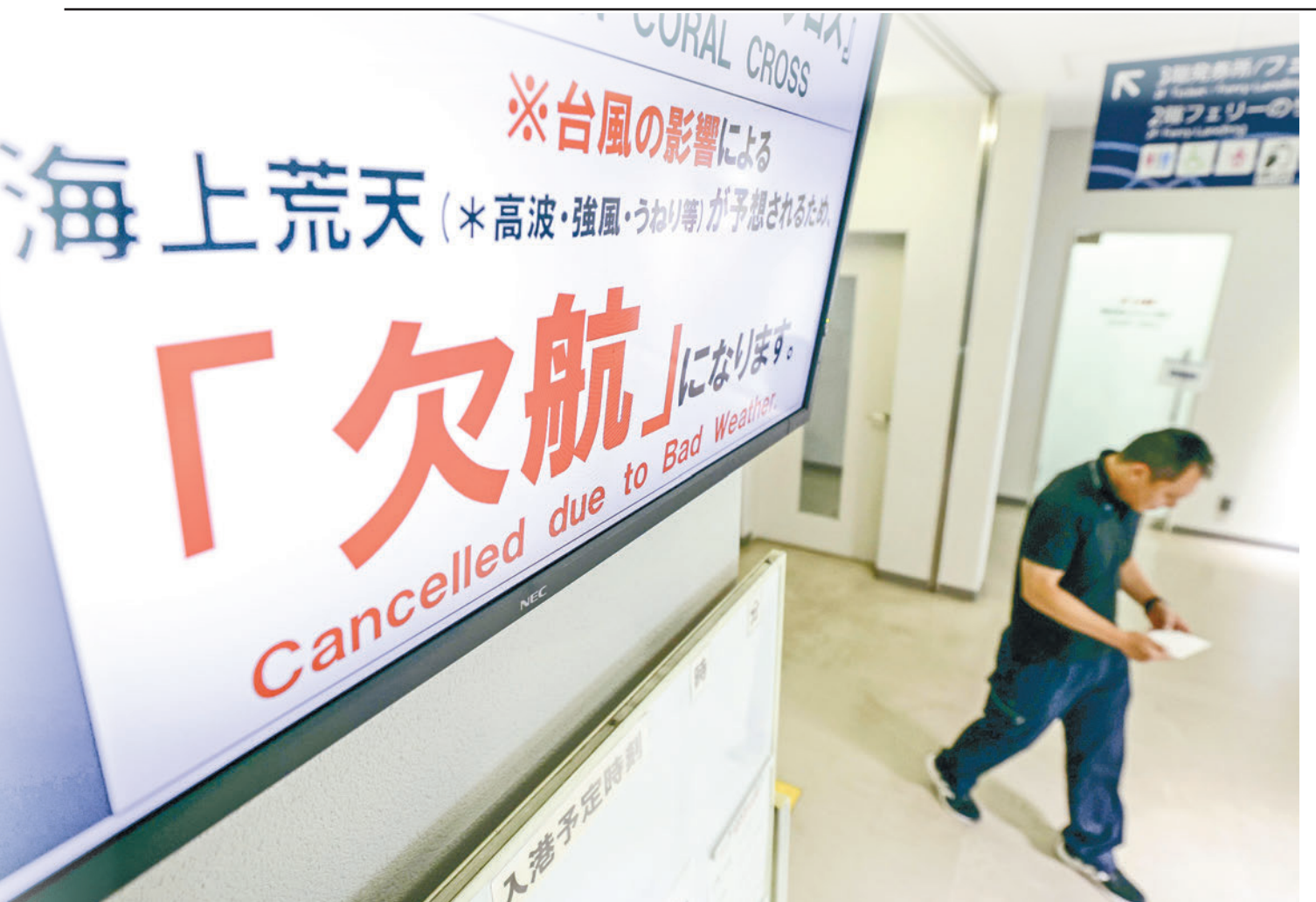
A display shows information on the suspension of ferry services in Kagoshima due to an approaching typhoon on 8 August 2023.