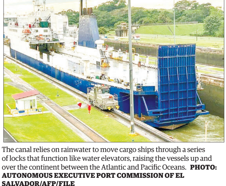
of locks that function like water elevators, raising the vessels up and

In the Lancang-Mekong Cooperation projects, construction cooperation is key. CCCC's creativity with the help of the Chinese government will best support Myanmar's road and bridge construction. Therefore, the strengthening of this cooperation is a better move for the Lancang-Mekong Cooperation, including Myanmar.