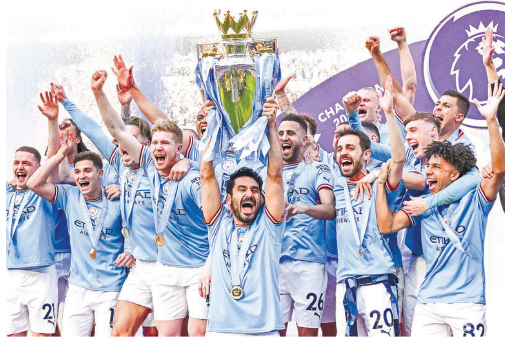
Manchester City's German midfielder Ilkay Gundogan lifts the trophy as Manchester City players celebrate winning the title at the presentation ceremony following the English Premier League football match between Manchester City and Chelsea at the Etihad Stadium in Manchester, north west England, on 21 May 2023.

The arrival of Croatian internationals Josko Gvardiol and Mateo Kovacic has softened that blow, but the champions have been quiet in the market compared to the chasing pack. — AFP