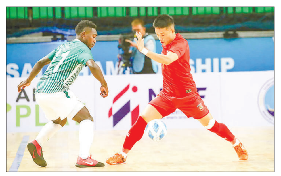
Myanmar futsal player (red) uses full strength to turn away the rival during the group match of the Continental Futsal Championship 2023 against Solomon Island on 8 August 2023.

MYANMAR futsal team has recorded one win and one loss outcome in the Continental Futsal Championship 2023 which is being held in Thailand.