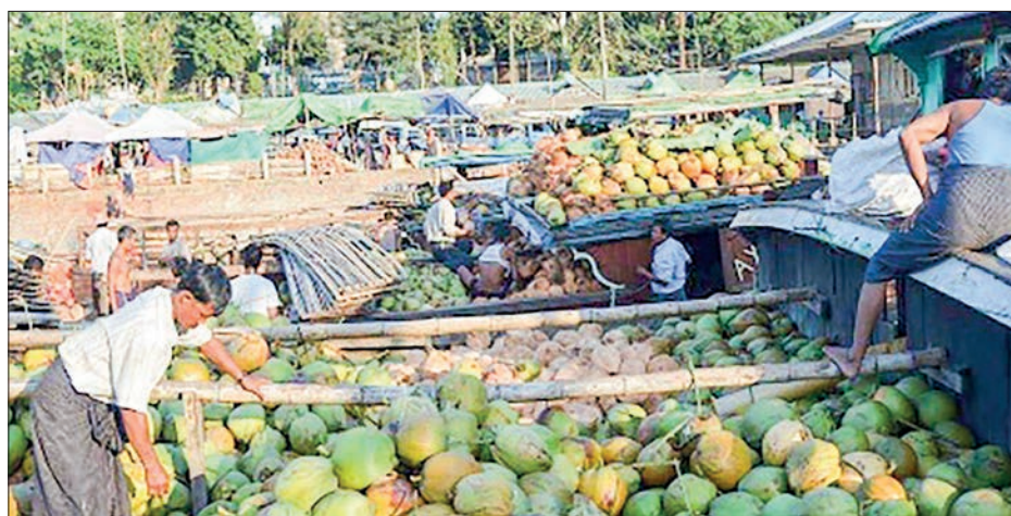
A bustling coconut market at Bagaya Jetty in Yangon City.

There are coconut depots at Kyimyintdine's jetty where coconut is distributed in the city. Before 2010, there were a large number of coconut and banana depots at Lanmadaw jetty when the water transport to the delta region developed. At present, ferry trips to some towns have declined. The number of businesses of coconut, banana and duck egg has decreased at that jetty accordingly.