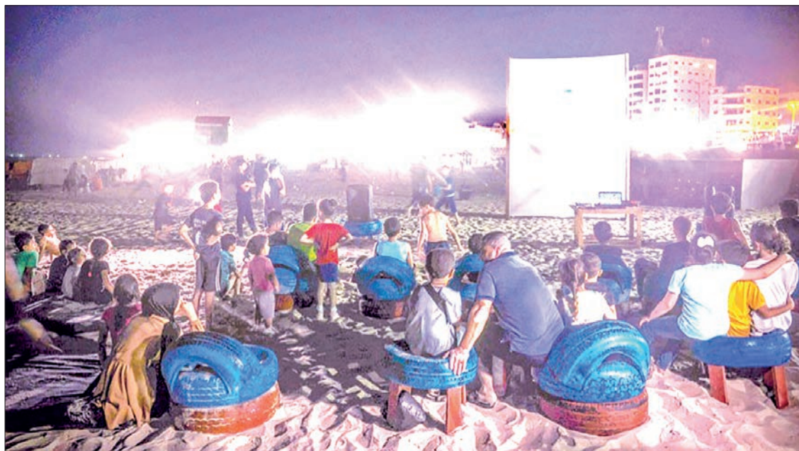
Palestinian children watch a movie at a pop-up open-air cinema at the beach in Gaza city on 28 July.

GAZA residents took their seats in front of a large projector screen set up on a sandy beach, a rare event in the Islamist-ruled blockaded enclave that has no operating cinemas.