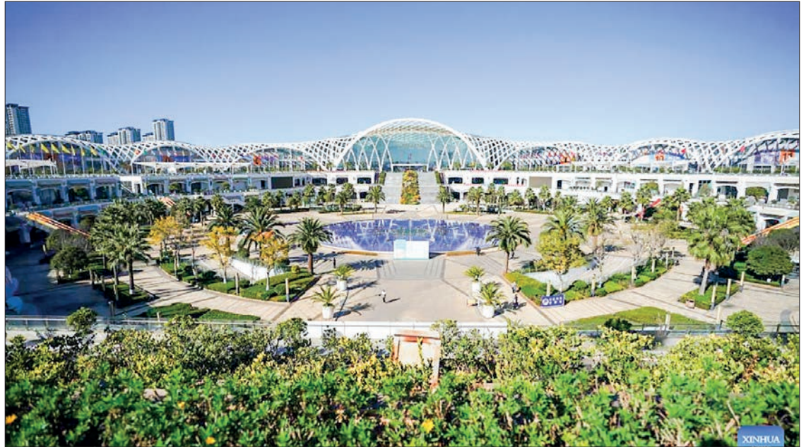
This photo taken on 19 November 2022 shows a view of Kunming Dianchi International Convention and Exhibition Centre, the venue for the 6 th China-South Asia Exposition in Kunming, southwest China's Yunnan Province.

More than 100 Myanmar businesspersons and merchants will display local products such as agricultural products, food products, handicrafts and precious gems and jewellery and attend the related forums. — NN/EM