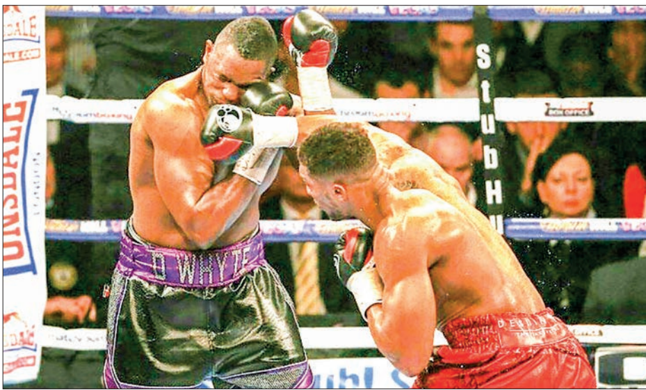
Dillian Whyte (L) was stopped by Anthony Joshua (R) at the O2 Arena in 2015 when contesting for the vacant British heavyweight title.

Arena on 12 August. Fight promoter Matchroom said in a statement: "Today, the Voluntary Anti-Doping Association (VADA) informed Matchroom, the Association of Boxing Commissions and the British Boxing Board of Control that Dillian Whyte had returned adverse analytical findings as part of a random anti-doping protocol. "In light of this news, the fight will be cancelled and a full investigation will be conducted." — AFP