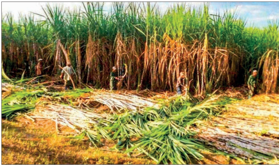
The prices of sugarcane remain upward trend on the back of strong demand and high price of sugar in the market. The photo shows the harvest of sugarcane.

NGWAY Yi Pale Sugar Co Ltd notified the sugarcane growers in early August that it will offer K110,000 per tonne of sugarcane in the upcoming 2023-2024 sugarcane season.