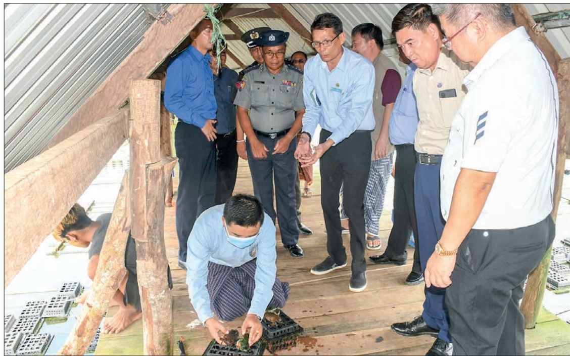
Chief Minister of Rakhine State U Htein Lin views round the progress of the soft crab farming at TMP soft crab farm in Abay Village of Taungup Township yesterday.

CHIEF Minister of Rakhine State U Htein Lin who is in the capacity of Chairman of Rakhine State