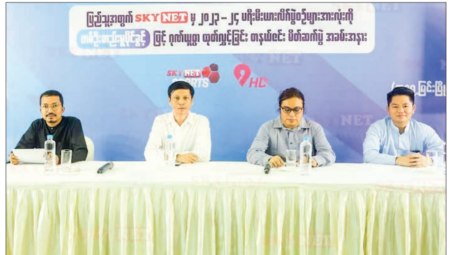
SkyNet officials explain the broadcast of the English Premier League football matches during the press conference.