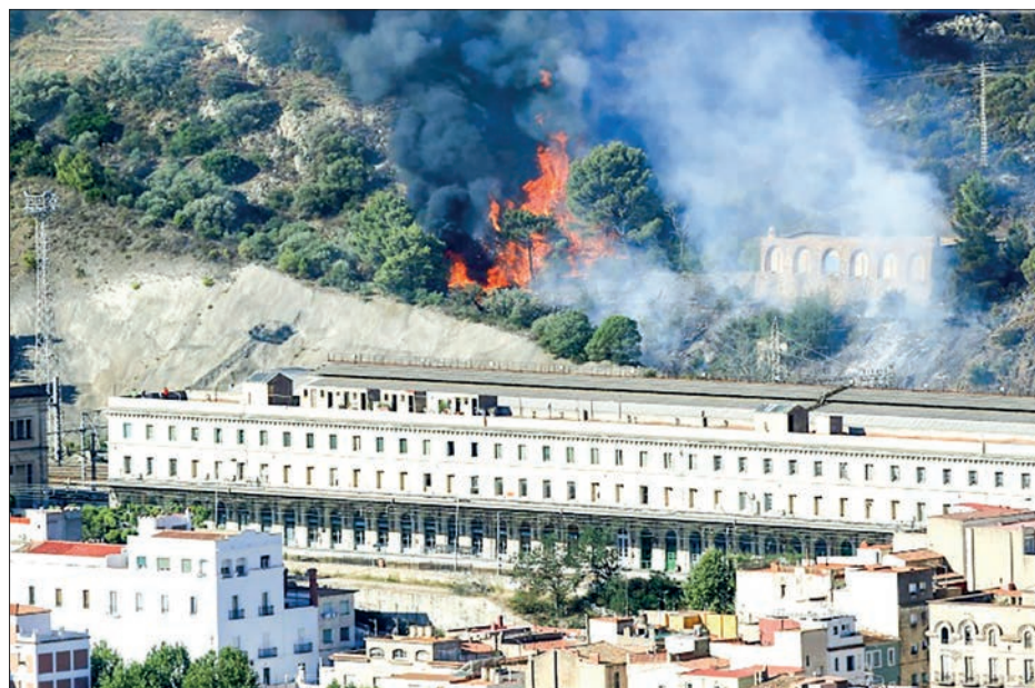
The fire, boosted by heavy winds, saw more than 130 people evacuated from their homes overnight.

ern region of Catalonia teamed up with French colleagues as the blaze ravaged some 435 hectares (1,100 acres) of land, with an estimated 2,500 hectares threatened.