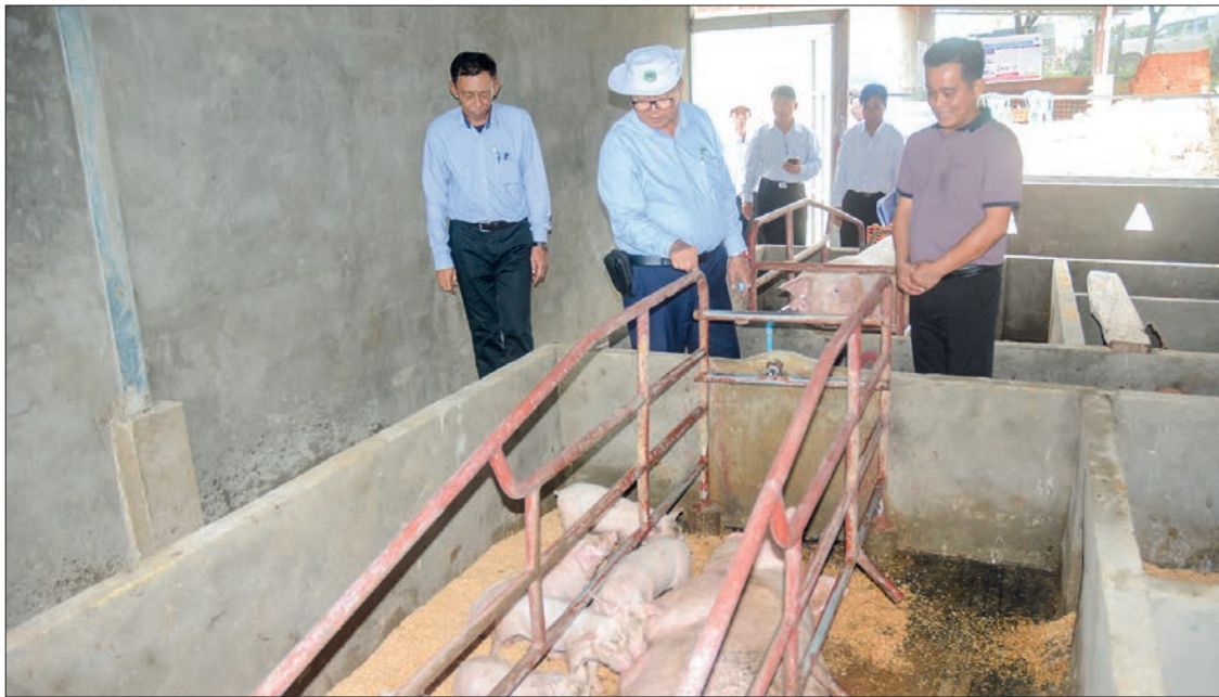
The MoALI deputy minister and officials seen inspecting a private-owned pig breeding farm on 4 August.

THE Ministry of Agriculture, Livestock and Irrigation is initiating a project to establish 70 pig farming units in Nay Pyi