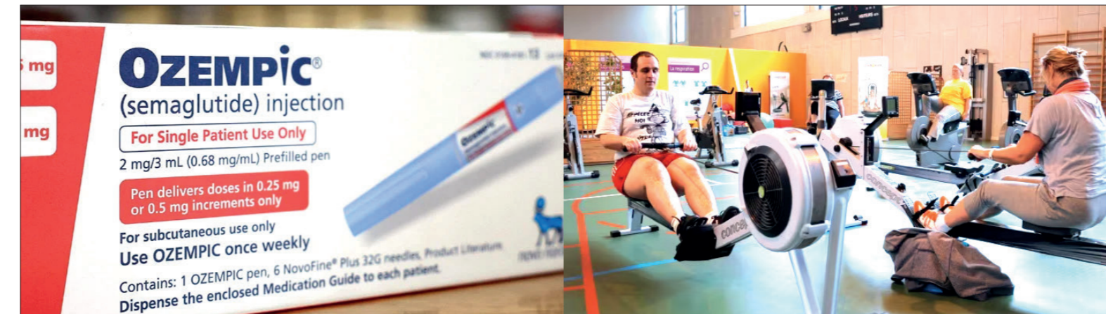
In this photo illustration, boxes of the diabetes drug Ozempic rest on a pharmacy counter on 17 April 2023 in Los Angeles, California. (L); It's important to remember that these medications are not a shortcut to weight loss and that a healthy lifestyle is still important.