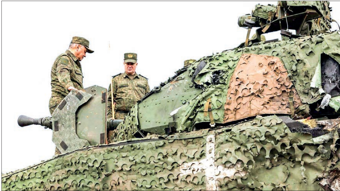
This handout photograph released by the Russian Defence Ministry's press service shows Russia's Defence Minister Sergei Shoigu (L) getting on a captured Swedish armoured vehicle CV90 while inspecting a command post of the Central Military Unit in an undisclosed location in Ukraine.

SAUDI Arabia was set to host talks on the Ukraine war on Saturday in the latest flexing of its diplomatic muscle, though expectations are mild for what the gathering might achieve.