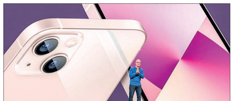
Chief Executive Tim Cook remarked during a conference call that they had performed exceptionally well in emerging markets, pointing out the year-over-year gains in China following a decline in the same comparison during the prior quarter.

$19.9 billion, up 2.3 per cent from the year-ago period. Revenues again declined, this time by 1.4 per cent to $81.8 billion, the third straight quarter with a year-over-year decline. Bright spots in the quarter for the tech giant included an "all-time high" in services revenue from the App Store, Apple Pay, Apple TV and other subscription services. — AFP