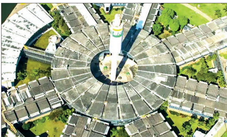
Aerial view of the Petrobras Research Centre in Rio de Janeiro.