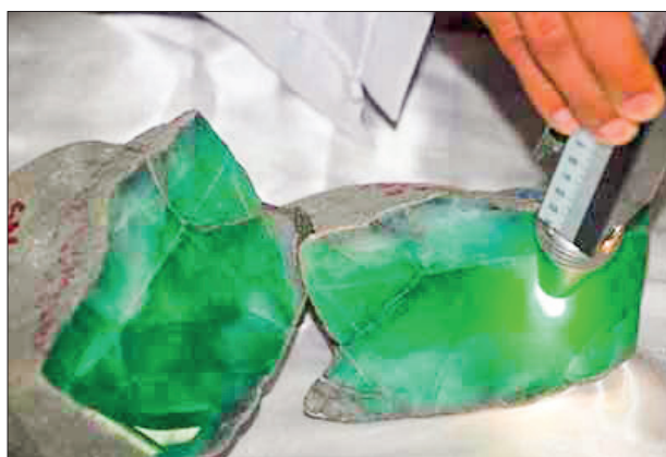
The photo shows gem merchants appraising uncut jade stones.

MYANMAR'S mineral exports amounted to US$116.017 million from 1 April 2022 and 28 July 2023 in the current finan-