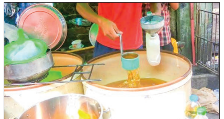
Capturing commerce: A glimpse of a palm oil retail shop in the Yangon market.

The market price hit K8,500 per viss at the end of July. About 11,000 tonnes of imported palm oil flowed into the domestic market in recent days. The market price is two times higher than the reference price despite a decline in international prices and palm oil's bulk import, a seller highlighted. — TWA/EM