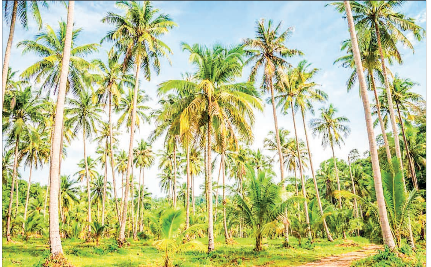
The photo shows coconut plantation flourishing in the delta region of the country.

The palm tree climbing business used to thrive in the central Myanmar Region. Now, some palm trees were cut down. Additionally, mangrove forests in the delta region are also suffering from overexploitation. Naturally grown mangroves can prevent coastal erosion.