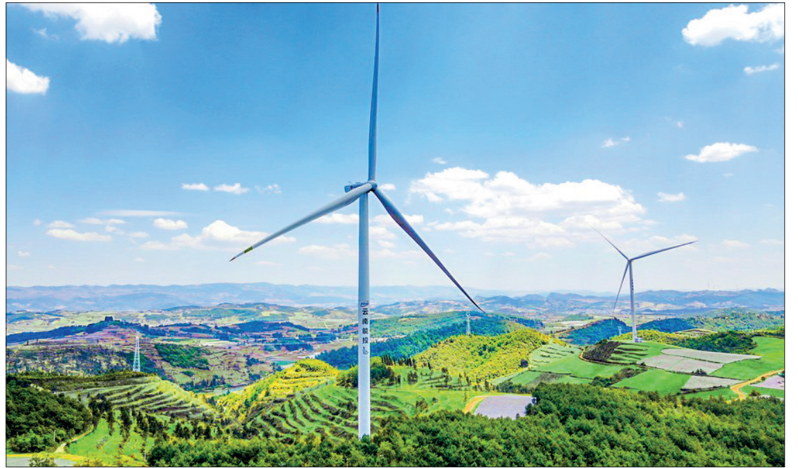
This aerial photo taken on 16 May 2023 shows wind turbines of Honghe Yongning wind power plant in Honghe Hani and Yi Autonomous Prefecture, southwest China's Yunnan Province.