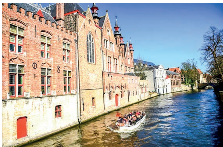
Bruges tourist authorities are encouraging tourists to see beyond the centre of the city, and visit at offpeak times.

balanced, to stop the city turning into a Disneyfied open-air museum.