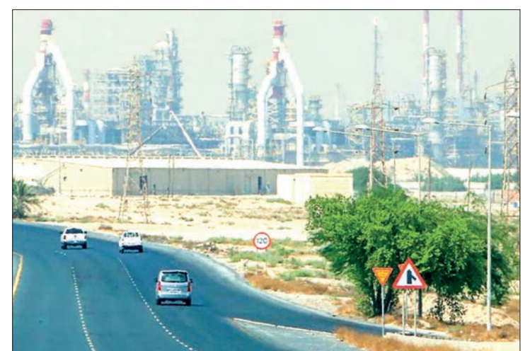
A picture taken on 13 October 2021, shows Kuwait's largest oil refinery at the Al-Ahmadi complex, about 40 kilometres (25 miles) south of the capital, Kuwait City.

The dispute over the field — whose recoverable reserves