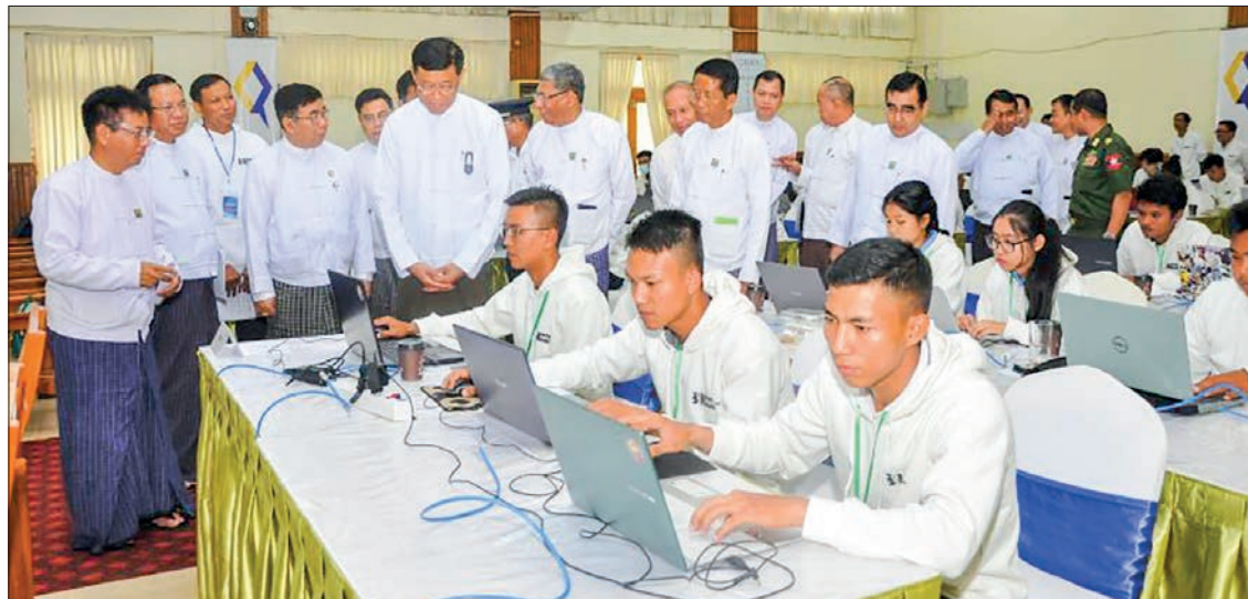
Union Minister for Transport and Communications General Mya Tun Oo views the contest among competitors who take part in the Myanmar Cyber Security Challenge 2023 on 5 August 2023 in Nay Pyi Taw.

The winners of the competition are sent to compete in cyber security competitions held in ASEAN countries. — MNA/KZL