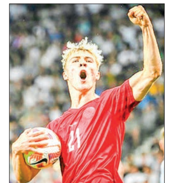
Denmark forward Rasmus Hojlund is reportedly on his way to Manchester United.

MANCHESTER United sealed their swoop for Denmark striker Rasmus Hojlund from Atalanta for a reported fee of £64 million ($82 million) on Saturday.