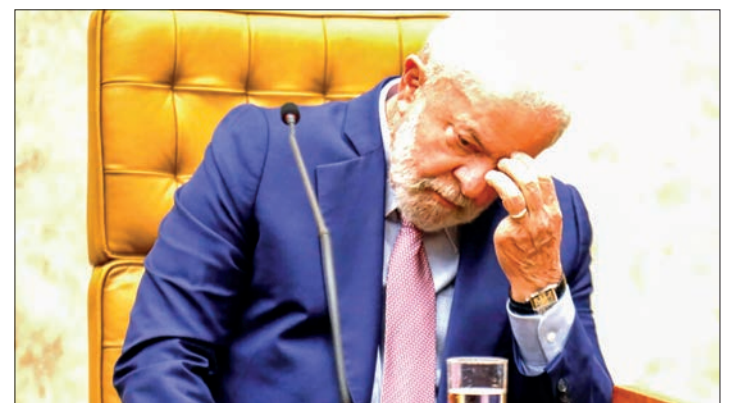
How to rally the world to help save the Amazon is proving to be a challenge for Brazilian President Luis Inacio Lula da Silva.

BRAZILIAN President Luiz Inacio Lula da Silva will host a regional summit next week with planetary stakes, as leaders of the countries that share the Amazon seek a roadmap to save the world's biggest rainforest.