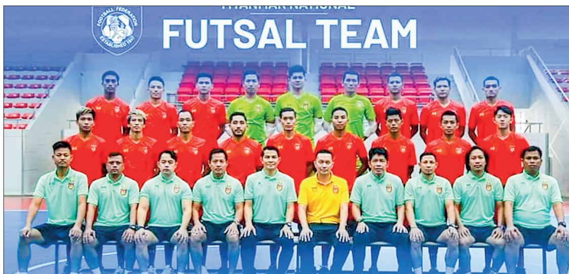
Myanmar futsal players and coaching staff who will compete in the Continental Futsal Championship 2023 in Thailand are seen posing for the group photo.

The Myanmar squad will play the group matches of the Continental Futsal Championship 2023 against the Thai team on 7 August and the Solomon Islands team on 8 August respectively. — TWA/KZL