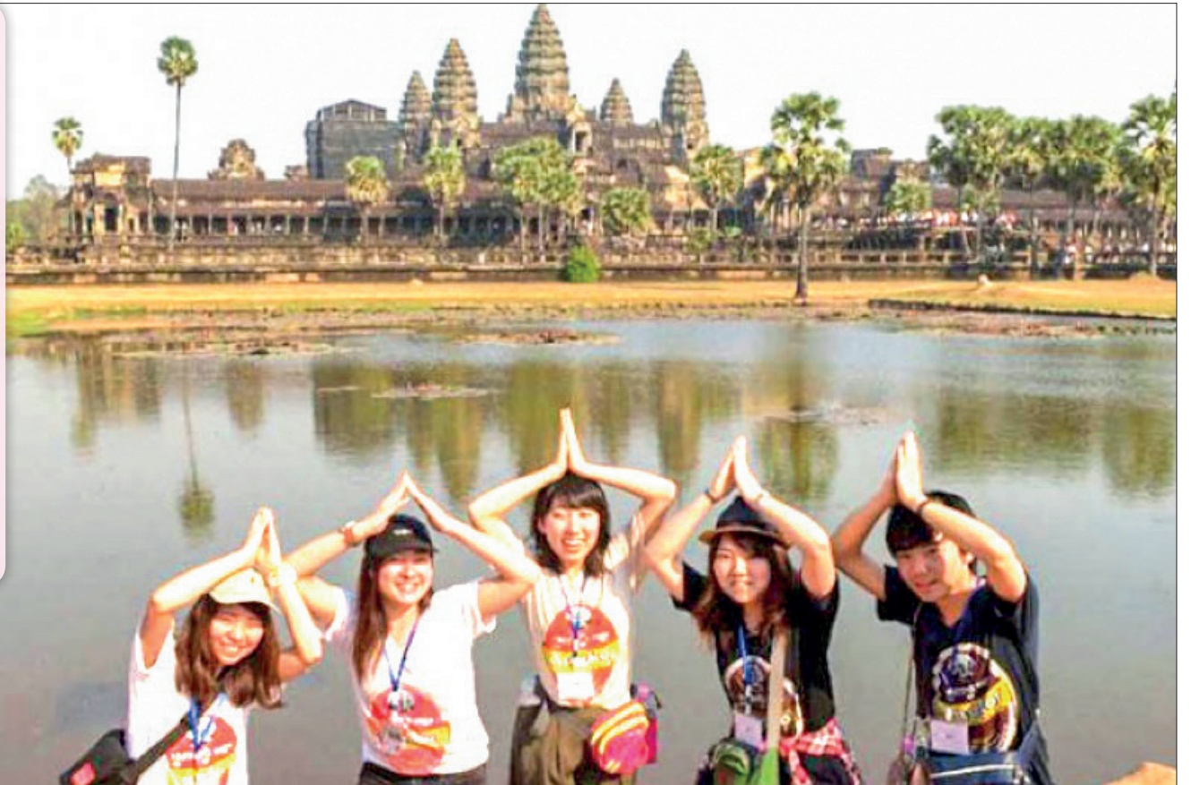
Chinese travellers flock to Cambodia's Angkor temples.

C AMBODIA'S famed Angkor Archeological Park earned 20.3 million US dollars from ticket sales in the first seven months of 2023, up 502 per cent from 3.37 million dollars in the same period last year, said a report on Friday.