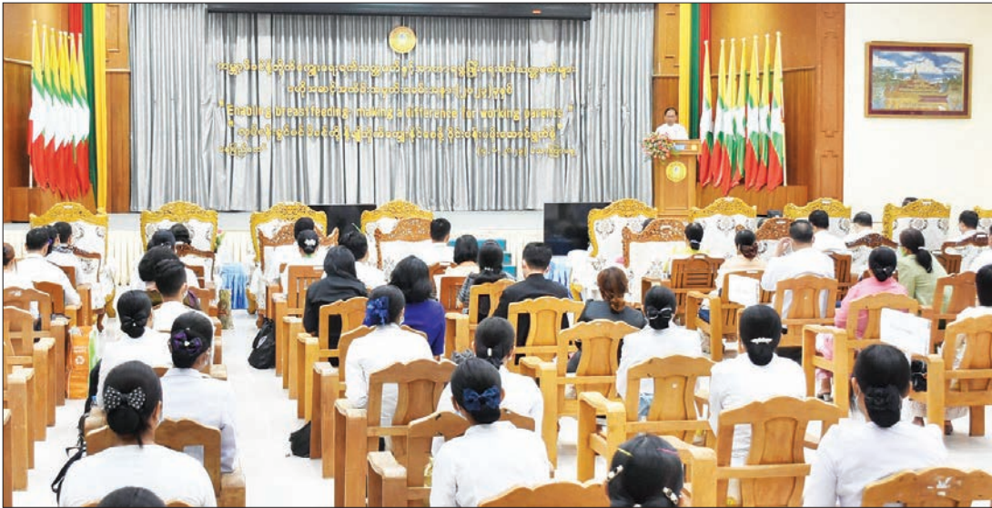
The World Breastfeeding Week and Nutrition Promotion Week event in progress.