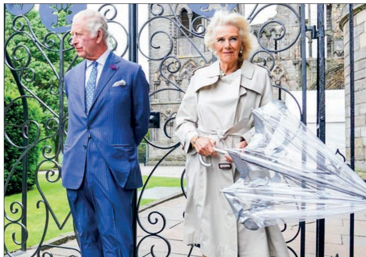
Britain's King Charles III with Queen Camilla.

The late queen used to mark the passing of her father, King George VI, on 6 February, 1952 in private at the Sandringham estate in eastern England. — AFP