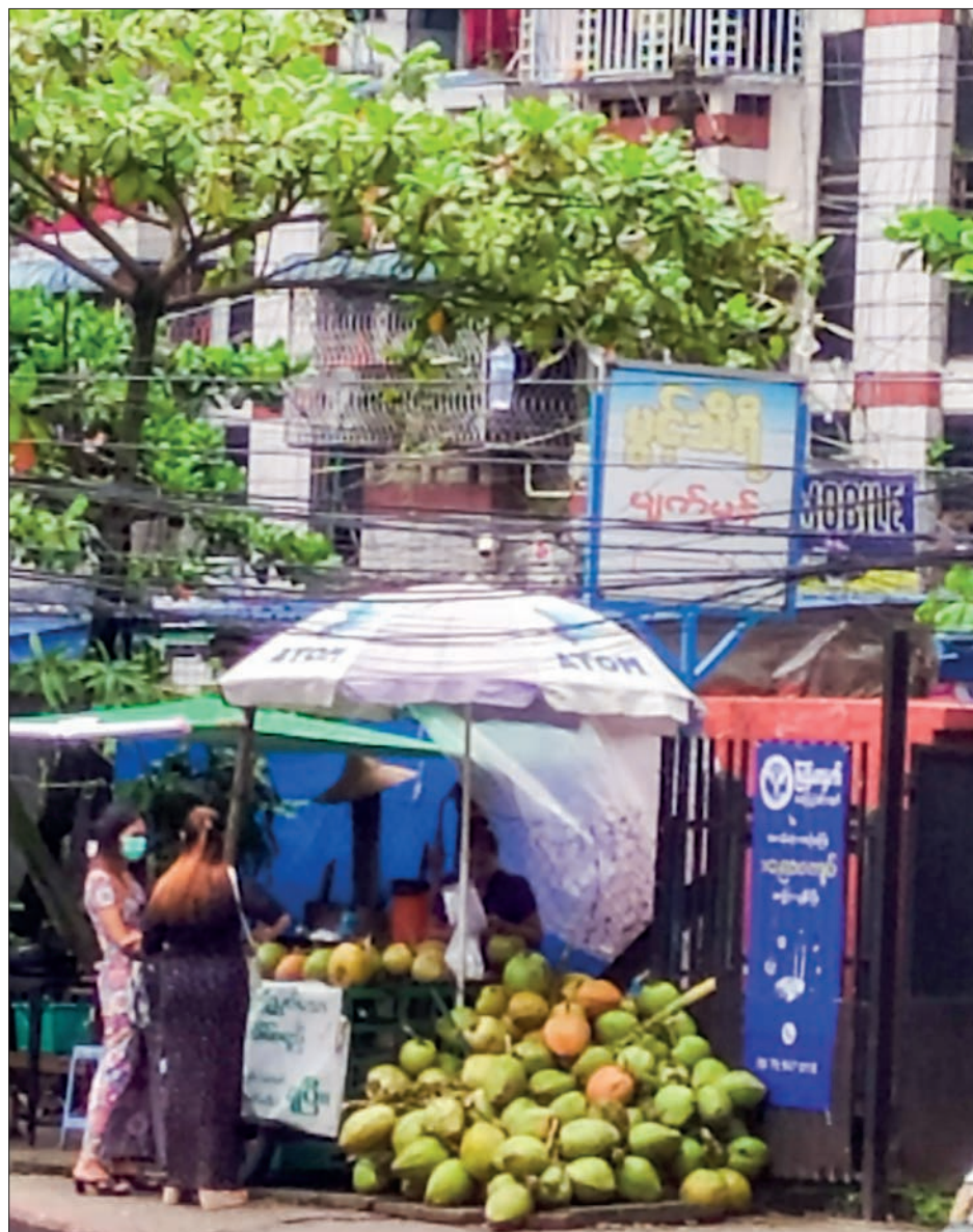
A refreshing coconut juice shop in Tamway Township, Yangon City.

palm is mostly found in the delta region. The total yield rate is over 400 million nuts per annum and the delta region accounts for the production of 130 million nuts. Half of the production is designated for local consumption and the remaining is sent to other regions.