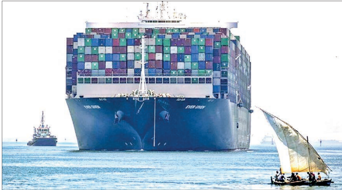
The MV Ever Given container ship sailing along Egypt's Suez Canal, pictured here on 7 July 2022.

The company will also seek cooperation and establish partnerships with both local and international companies to operate the infrastructure of the SCZone.