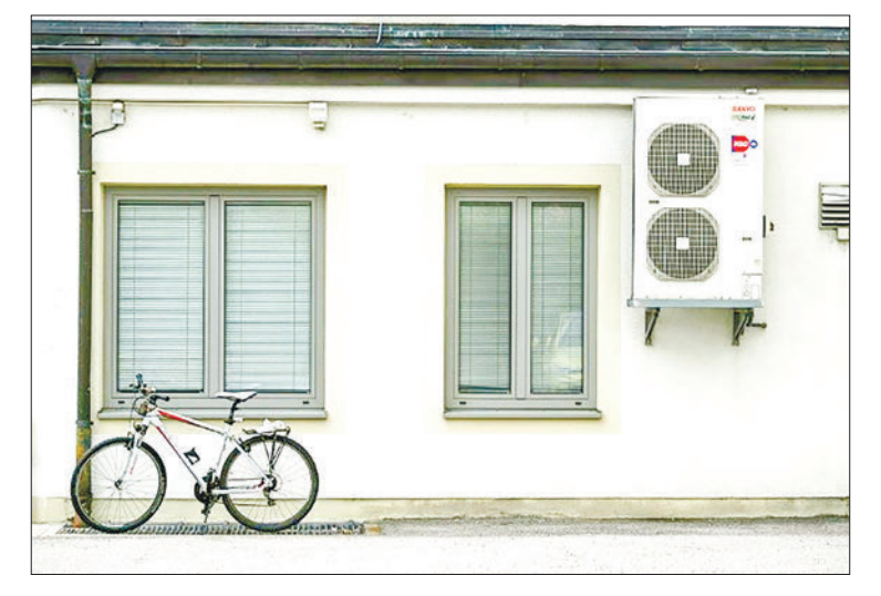
Air conditioning units, while helping keep people cool, are also responsible for emissions that warm the planet.

WITH air conditioner demand surging, scientists are looking for ways to improve the energy efficiency of cooling systems and limit damaging emissions that accelerate global warming.