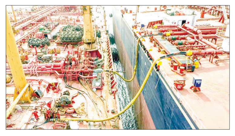
Workers prepare to transfer oil from the 47-year-old supertanker FSO Safer (L) to a UN-purchased replacement vessel in a bid to avert a catastrophic spill in the Red Sea off war-torn Yemen.