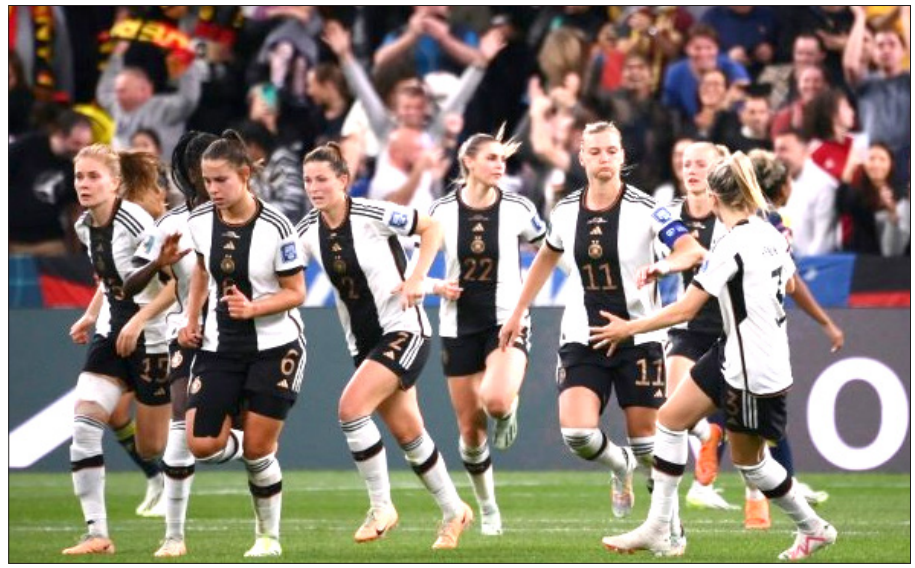
Germany celebrates after scoring at the Women's World Cup. PHOTO: AFP

"They press a lot and we know it could give us some space. It's about courage and creating spaces," she added. - AFP