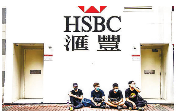
HSBC's profits have been boosted by surging interest rates by central banks aimed at taming inflation.

The firm also said second-quarter earnings came in better than forecast, jumping almost 90 per cent to US$8.8 billion, thanks to the bumper income from surging interest rates. With regards the outlook, it said: "Given the current market consensus for global central bank rates, we have raised our 2023 full-year guidance for net interest income to above US$35 billion." — AFP