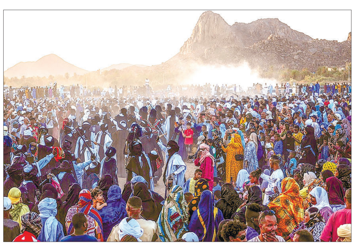
People attend the Sebeiba Festival, a yearly celebration of Tuareg culture, in the oasis town of Djanet in southeastern Algeria. PHOTO: AFP

The men parade their weapons and "then stand in a ritual circle rattling their swords continuously as the women sing traditional songs to the rhythm of the tambourine", says the UN cultural organization. — AFP