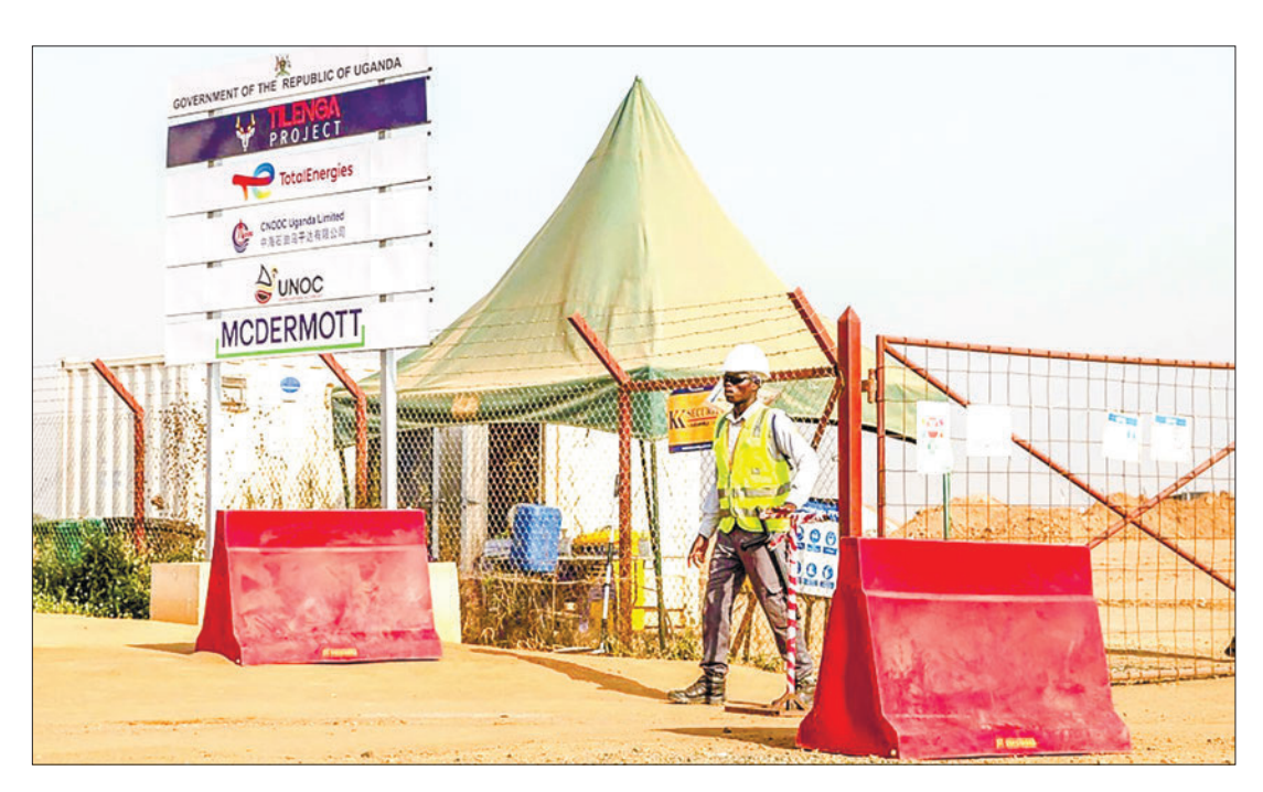
Guards work at TotalEnergies' central processing facility construction in Buliisa, Uganda on 20 February 2023.

FROM BP to ExxonMobil to TotalEnergies, none of the oil and gas majors have repeated the exceptional profits posted in 2022 when prices surged in the wake of Russia's invasion of Ukraine, but they nevertheless remain comfortably profitable this year.