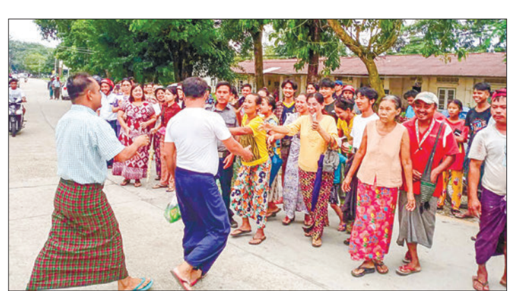
Family members and relatives embrace the released individuals in Kyaukpyu.

The order was announced under Article 419 of the Constitution to close pending criminal cases of 72 members of ethnic armed organizations and related individuals who are still facing trials in various courts in the country and to release the defendants. — Tin Htun Oo, Phyo Wai Lin (IPRD)/KZW