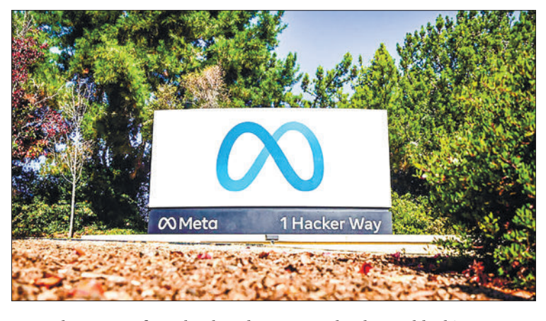
Meta, the owner of Facebook and Instagram, has begun blocking news links in Canada in protest at a new law requiring digital publishers to pay for such content.

An AFP reporter was still able to see news on Facebook Tuesday, but some users reported already getting messages saying such content was being blocked.