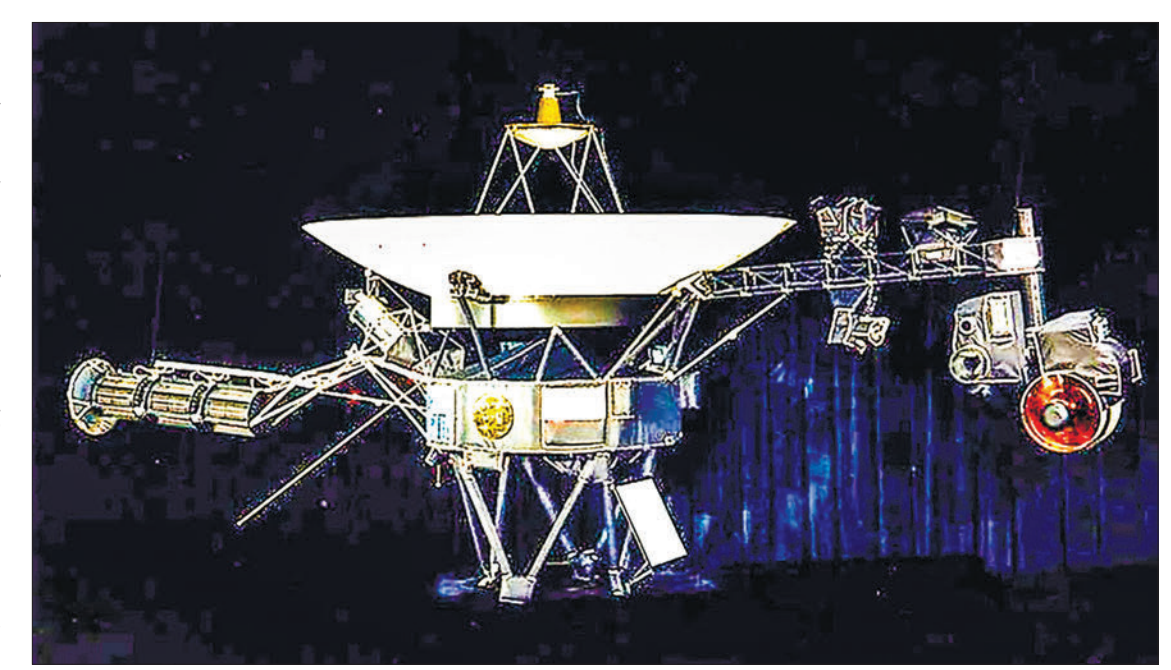
This NASA file image obtained 9 August 2002 shows one of the Voyager spacecraft.

This left it unable to transmit data or receive commands to its mission control -- a situation that was not expected to be resolved