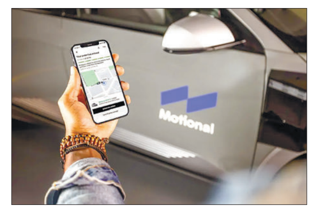
Both the mobility and delivery businesses have been essential components of Uber's growth and diversification strategy.

Khosrowshahi also cited "cost discipline" as a driver, with general and administrative expenses down sharply from the year-ago period. — AFP