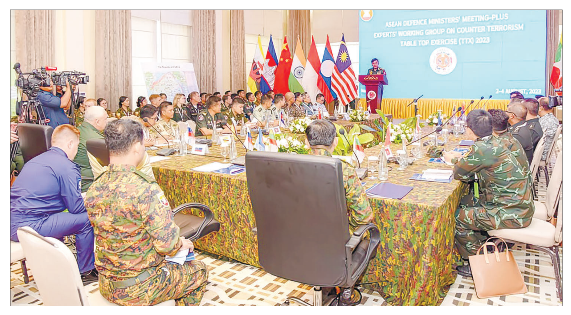
The opening \ event \ of the \ Myanmar-Russia \ co-chaired \ ADMM-Plus \ Experts' \ Working \ Group \ on \ Counter-Terrorism \ tabletop \ exercise \ in \ progress \ yesterday \ in \ Nay \ Pyi \ Taw.

Senior military officers from 12 nations gather in Nay Pyi Taw to enhance antiterrorism measures and foster mutual understanding