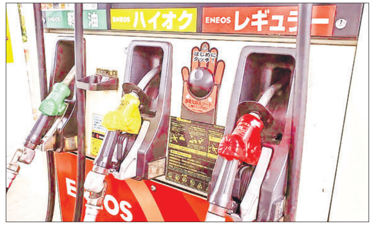
The average price for regular gasoline stood at 176.70 yen ($1.24) per litre as of Monday, advancing 1.90 yen from 24 July and hitting its highest level since August 2008.

THE average retail gasoline price in Japan has climbed to its highest level in 15 years, industry ministry data showed Wednesday, as the government subsidy to curb price hikes has been gradually scaling down.