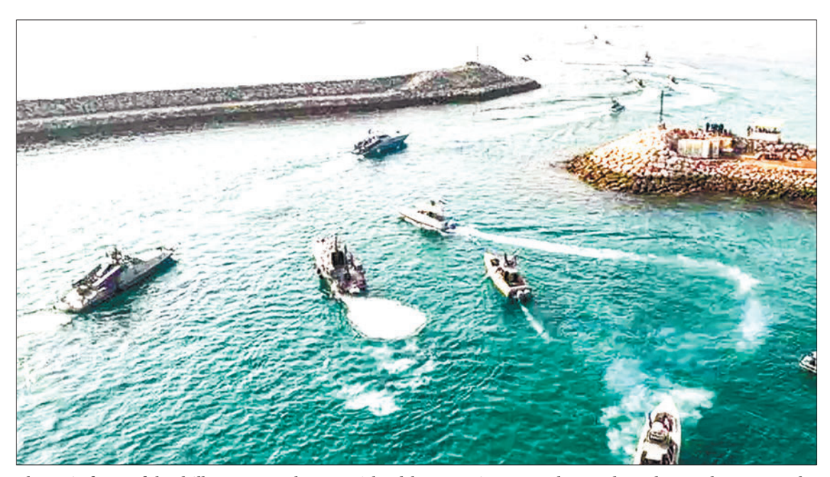
The main focus of the drills was near Abu Musa island, but exercises were also conducted around Greater and Lesser Tunb islands.

IRAN'S Revolutionary Guards launched naval drills on Wednesday near strategic Gulf islands