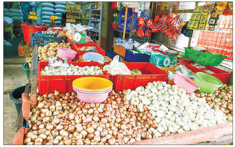
The photo shows a dry groceries outlet.

Interestingly, the Yangon potato market only published the price of Chinese potatoes from 11 to 31 July and did not include prices for potatoes from the Aungban area of Shan State. Chilli Pepper