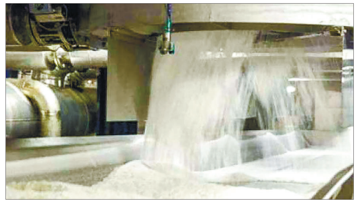
The production of sugar is seen at the sugar mill.

In the 2023-2024 season, new advanced machines will be added. Moreover, sugarcane expansion is also expected on account of soaring sugar prices, as per