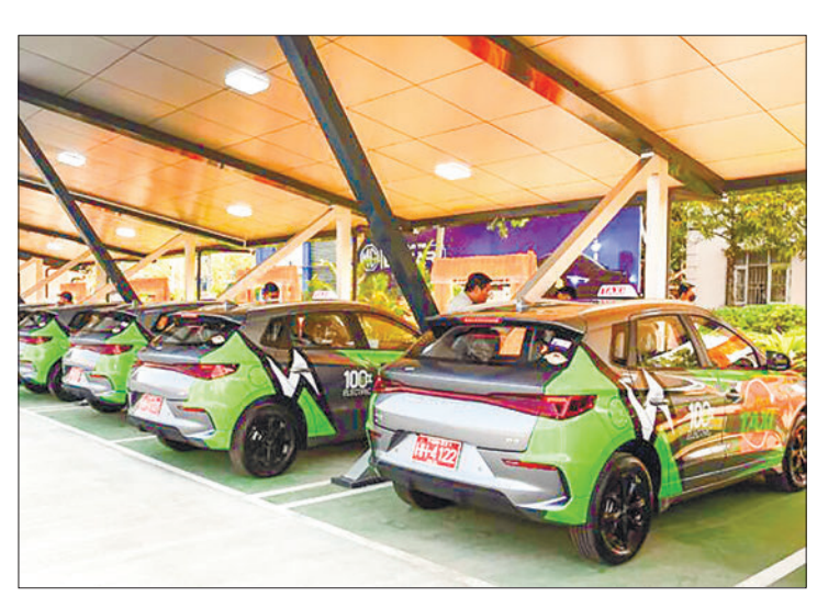
The photo shows some imported battery electric vehicles (BEVs).

During the exhibition, value-for-money restaurants will be opened and sold for the vendors and visitors, and