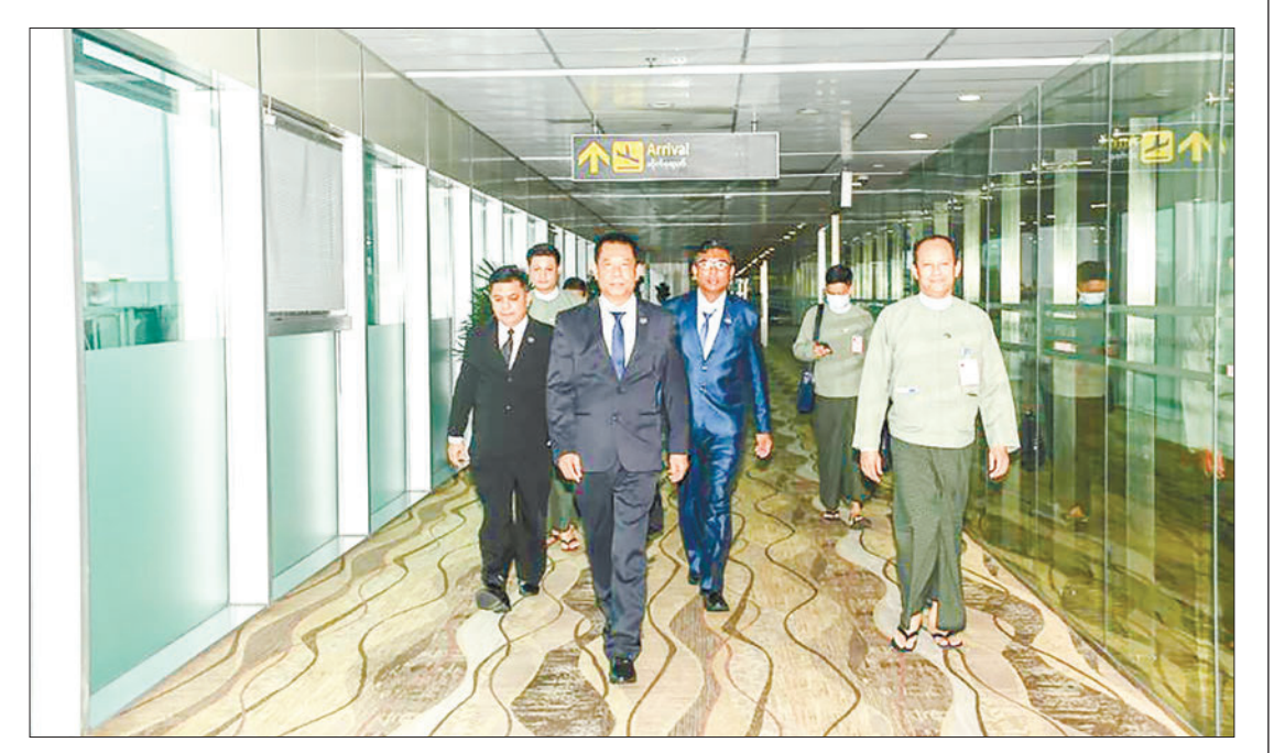
Election commissioner U Myint Thein (C) is pictured on his arrival back at Yangon International Airport yesterday.

The study tour offered valuable insights and potential areas of collaboration, paving the way for further interactions between Myanmar and China in the realm of developmental strategies and policies. — MNA/TS