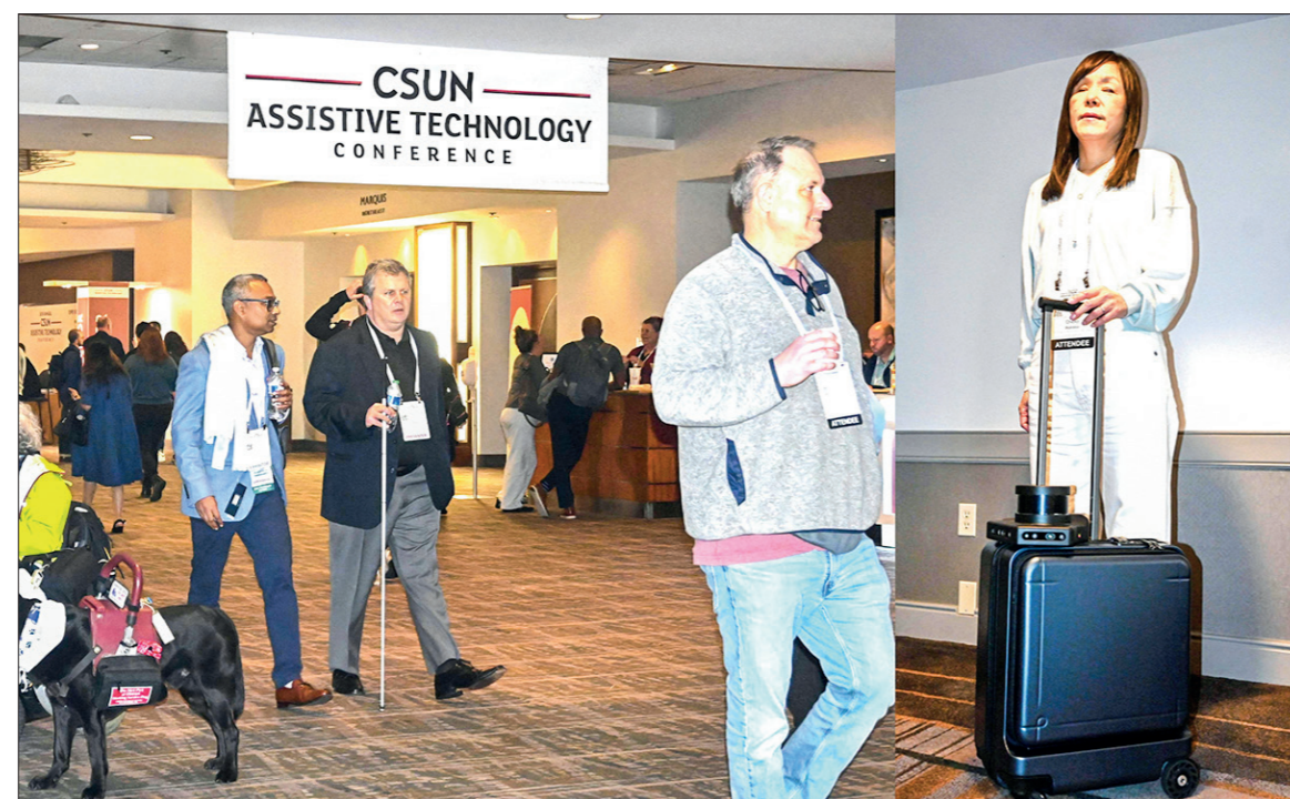
The CSUN Assistive Technology Conference, where the "AI Suitcase" was introduced, is held in Anaheim, California, in March 2023. (L); Chieko Asakawa, inventor of the "AI Suitcase," is pictured in Anaheim, California, in March 2023. (R).

During ketosis, the body shifts its primary energy source from glucose (derived from carbohydrates) to ketones (produced from fat breakdown). This can lead to weight loss as the body burns stored fat for energy.