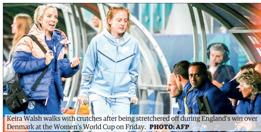
Keira Walsh walks with crutches after being stretchered off during England's win over Denmark at the Women's World Cup on Friday.

However, they are now waiting nervously to discover the extent of the injury suffered by Barcelona midfielder Walsh, who was stretchered off late in the first half. — AFP