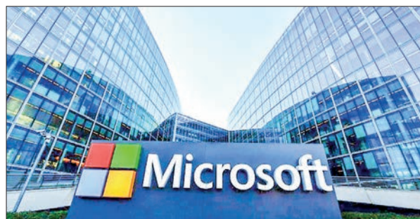
Should the outcome of the EU investigation go against Microsoft, the firm could face a heavy fine or other ordered remedies. PHOTO: AFP

“We must therefore ensure that the markets for these products remain competitive, and companies are free to choose the products that best meet their needs,” she said.— AFP