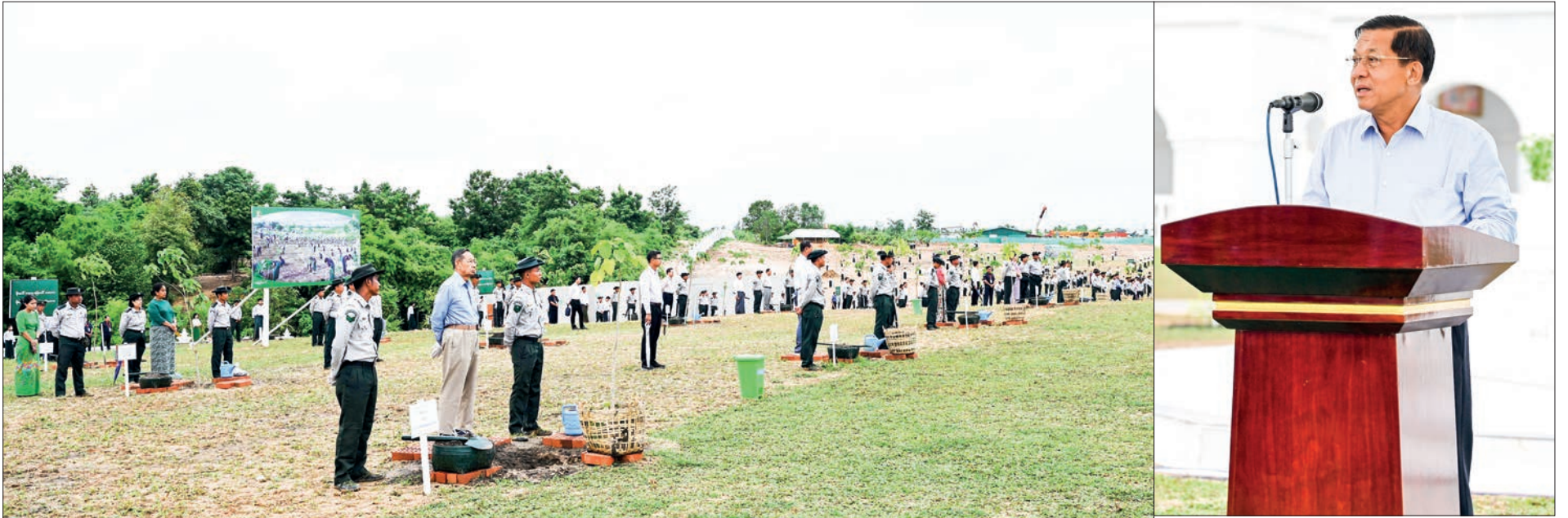
State Administration Council Chair Premier Senior General Min Aung Hlaing attends the second national-level monsoon tree-planting event at the surroundings of the Maravijaya Buddha image yesterday.