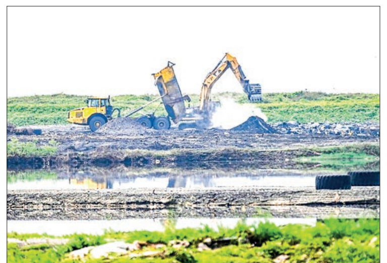
"It is imperative that we continue to use the Semakau landfill for as long as possible, and if possible extend its life beyond 2035," the landfill's manager told AFP.

Singapore generated 7.4 million tonnes of waste last year, of which about 4.2 million tonnes, or 57 percent, was recycled. — AFP