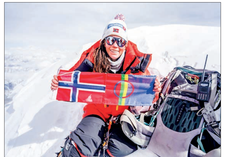
In this handout picture taken on 26 April 2023 by courtesy of Field Productions shows Norwegian climber Kristin Harila with her country flag at Shishapangma, 14 th -highest mountain in the world, located in China. PHOTO: HANDOUT / AFP

“Harila and Lama's collaboration has showcased the essence of mountaineering unity, transcending borders and cultures to achieve greatness together.” The pair surpassed Nepal-born British adventurer Nirmal Purja's record of six months and six days, set in 2019. — AFP