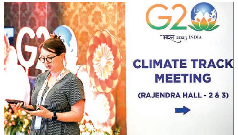
Environment ministers from G20 nations meeting in India on Friday raced against time to reach a last-minute consensus on the most contentious issues to redress the global climate crisis.

Some major oil producers — such as Russia and Saudi Arabia — were blamed for the lack of progress. — AFP