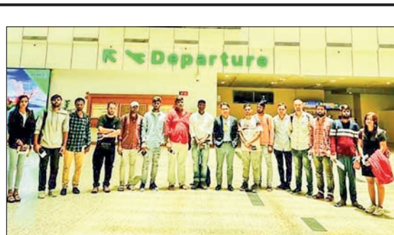
The photo shows 15 Indian nationals being duped by fake job offers from crime syndicates in Myanmar.