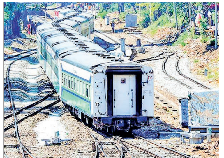
Upgrading works are seen at the Yangon Circular Rail Section.

The Yangon Circular Rail Section is undergoing significant improvements, with seven stations — Aung-san, Kamayut, Okkyin, Phawkan, Thamine, Tamway, and Kyaukyaydwin set to undergo upgrades and renovations. The tender announcement for these upgrades has already been released.