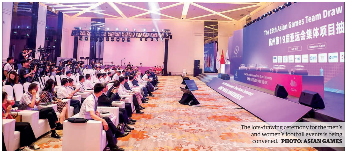
The lots-drawing ceremony for the men's and women's football events is being convened.