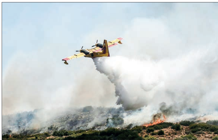
Hundreds of firefighters are battling flames in Greece as a heatwave bakes large parts of the Mediterranean.

THE fight against deadly wildfires raging in Greece for more than a week is improving, the fire service said on Friday, warning it remained on alert as fierce winds were forecast that could rekindle blazes.