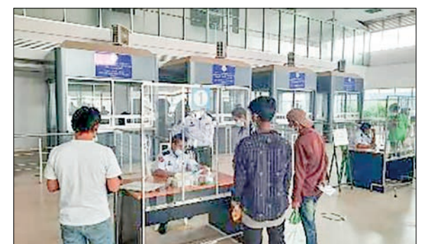
Officials conduct necessary checks on the re-entry of Myanmar citizens.

Out of them, those from the Bago region, Mon state and Taninthayi region will stay at the Sae-myonae quarantine centre in Mawlamyine of Mon state and those from other regions and states will be monitored at the Shwe Myawady quarantine centre in Myawady of Kayin state for 10 days. — TWA/MKKS