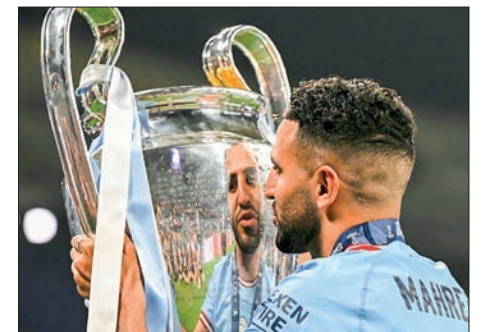
Riyad Mahrez poses with the Champions League trophy.

MANCHESTER City forward Riyad Mahrez has joined Saudi side Al-Ahli, the two clubs announced on Friday, becoming the latest big-name player to be lured to the cash-rich league in the Gulf state.