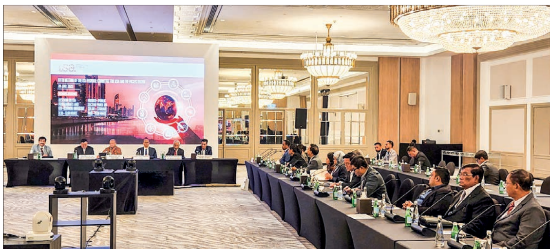
Union Minister U Thaung Han attends the fifth ministerial meeting of the Asian and Pacific Committee in Abu Dhabi on 26 July 2023.

The second part of the meeting delved into Solar Storage, including Energy Storage System (ESS) needs and management until 2030, as research in the Middle East and North Africa (MENA) region. Long Duration Energy Storage for power distribution from renewable energy and the benefits of Pump Stor-