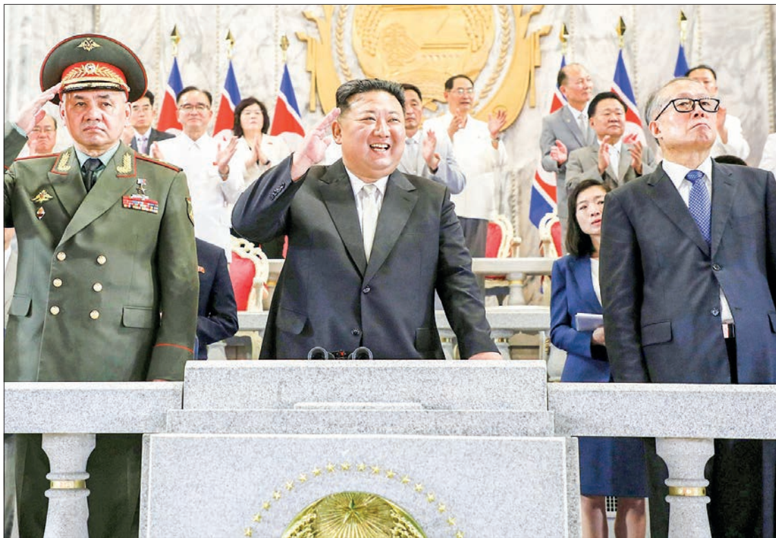
(Front from L) Russian Defence Minister Sergei Shoigu, North Korean leader Kim Jong Un and Li Hongzhong, a member of the Chinese Communist Party's Political Bureau, attend a military parade in Pyongyang on 27 July 2023.

North Korean Defense Minister Kang Sun Nam criticized recent military activities by the United States and South Korea and pledged in his speech at the event that the country's forces will "never