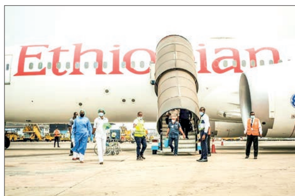
Ethiopian Airlines switched many of its passenger planes to transport cargo during the Covid pandemic.

“We carried 13.7 million passengers, which is a 57-per-cent growth compared to the previous year and 10 per cent higher than pre-Covid. We also carried 740,000 tonnes of cargo, which is nearly double pre-Covid,” he said.— AFP