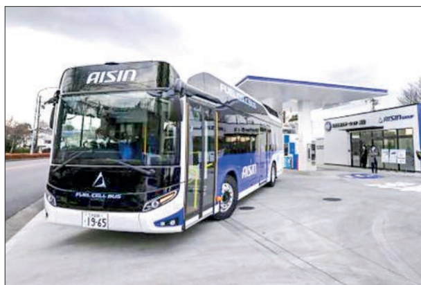
Photo taken 13 January 2022 shows a fuel cell bus introduced by Toyota Motor group companies for commuting in Kariya in Aichi Prefecture, central Japan.

Toyota said it sold 5.42 million vehicles globally in the six months ended June, including those sold by the group’s minivEHICLE maker Daihatsu Motor Co and truck manufacturer Hino Motors Ltd., up 5.5 per cent from a year earlier.