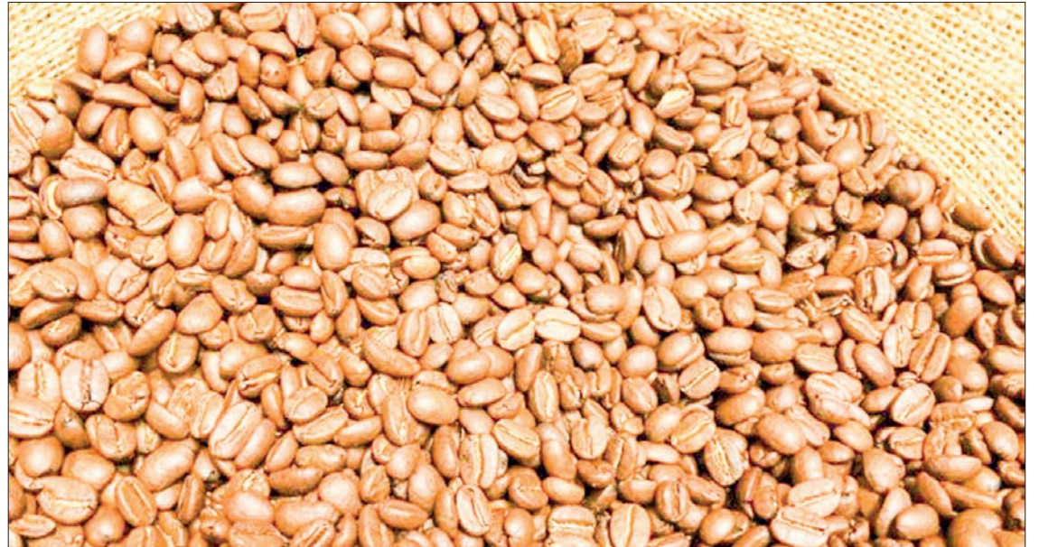
Myanmar's coffee plantations are found in Mandalay Region, Shan State and Kayin State. It is harvested between December and March and exported to external markets during the April-May period. The picture shows Myanmar's coffee beans.

The Thailand market accounts for 75 per cent of Myanmar's coffee production, earning K15-17 million per tonne.