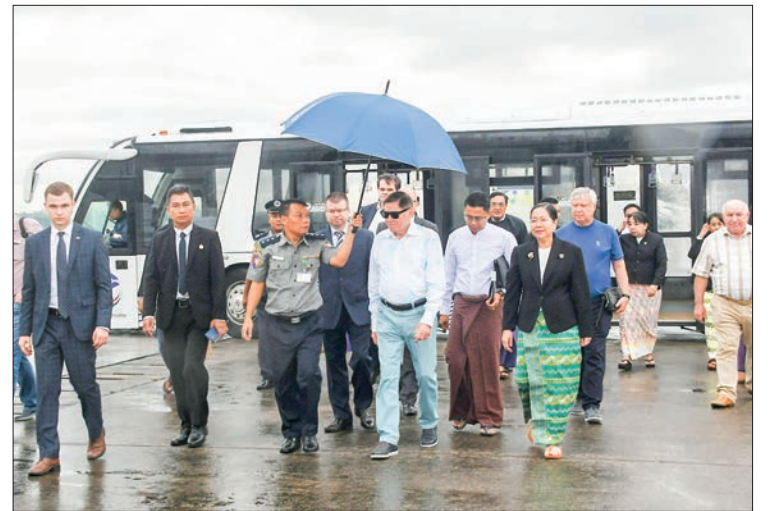
The Russian delegation is seen off at the Yangon International Airport yesterday.

The chief justice and the delegation were seen off at Yangon International Airport by Chief Justice Daw Sanda Thwe of the Yangon Region High Court and judges of the court.