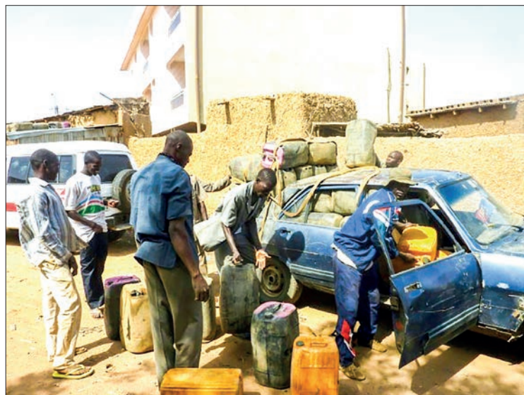
The once endless shuttling of cars and motorcycles loaded with jerrycans of petrol across the Nigeria border into Niger 'has stopped', a local mayor says.

subsidies, petrol exchanged hands on Niger's black market for between 250-275 CFA francs (42-46 US cents) a litre, or $1.61-1.76 per US gallon.