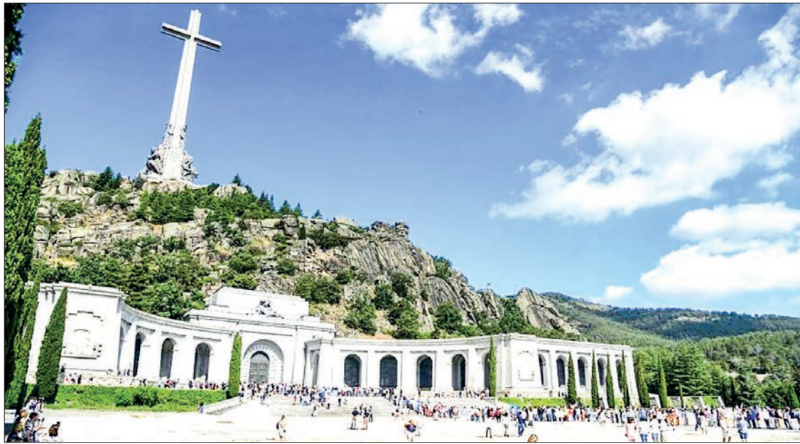
Spain is a popular tourist destination known for its rich history, diverse culture, stunning landscapes, vibrant cities, and beautiful beaches. In this file photo taken on 15 July 2018 people wait to enter the basilica at the Valley of the Fallen in San Lorenzo del Escorial near Madrid. Francisco Franco is buried in the imposing basilica carved into a mountain-face.

SPAIN'S unemployment rate fell in the second quarter of 2023 to its lowest level since 2008, official data showed Thursday, as the country's buoyant tourism sector boosted the labour market.