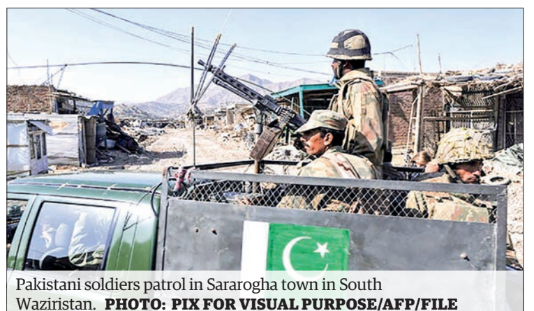
Pakistani soldiers patrol in Sararogha town in South Waziristan.