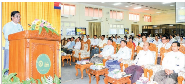
The second-day forum on boosting Mekong-Lancang MSME digital skills in progress yesterday.

THE second day of the forum to enhance the digital skills of Mekong-Lancang MSMEs was held yesterday morning at the Ministry of Industry in Nay Pyi Taw.