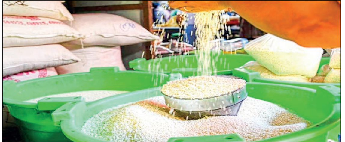
Rice is organized for sale in the market.

According to relevant statistical information, the amount of rice exported at the beginning of the 2023–2024 financial year, when prices are