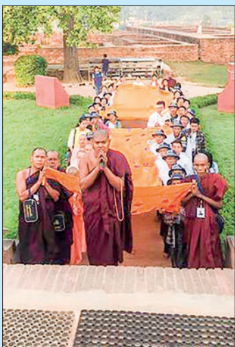
The picture of a group of Myanmar pilgrims visiting Bodh Gaya

TRAVEL companies planning to offer the Bodh Gaya Pilgrimage Service must register during the 2023-2024 financial