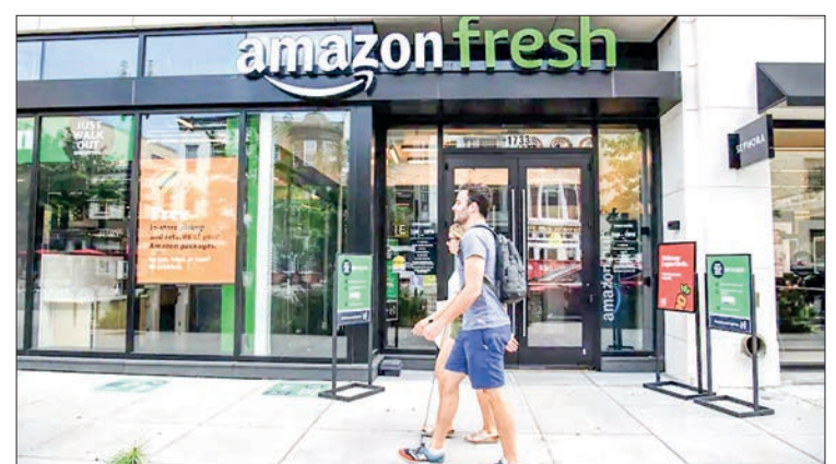
People walk past an Amazon Fresh store in Washington, DC, on 26 August 2021.

percent. It compares with 4.2 per cent growth in the first quarter, but increases in nearly all other types of spending, particularly private inventory investment and nonresidential fixed investment, contributed to the acceleration, offsetting decreases in exports and housing investment, according to the department. — Kyodo