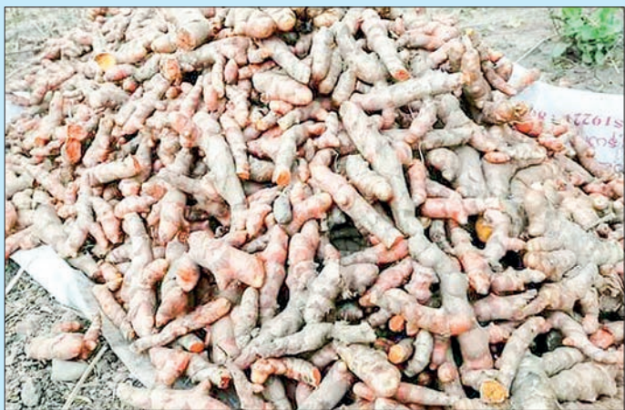
The photo shows Myanmar's ginger. The ginger produced in September and October is of good quality and good appearance, therefore, it meets export standards.

THE price of ginger has slumped in the domestic market owing to weak foreign demand.