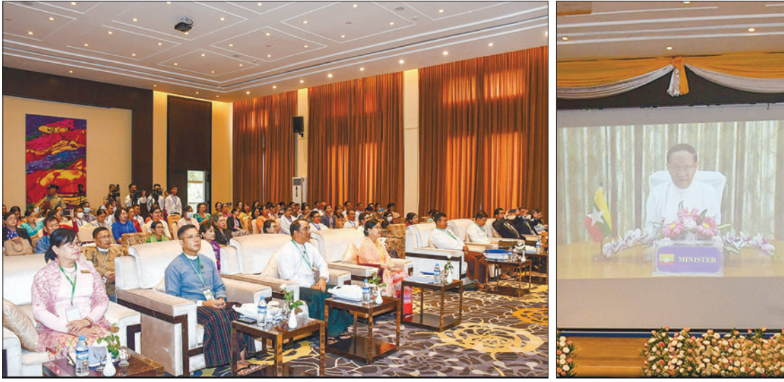
Union Minister U Ko Ko joins the Workshop on Building Networks on Preservation and Conservation of Literary Heritage among Lancang-Mekong Area yesterday.

THE rare literary heritages kept in libraries and archives of Lancang-Mekong countries will be preserved and conserved, according to the workshop on Building Networks on Preservation and Conservation of Literary Heritage among Lancang-Mekong Area held in Nay Pyi Taw yesterday.