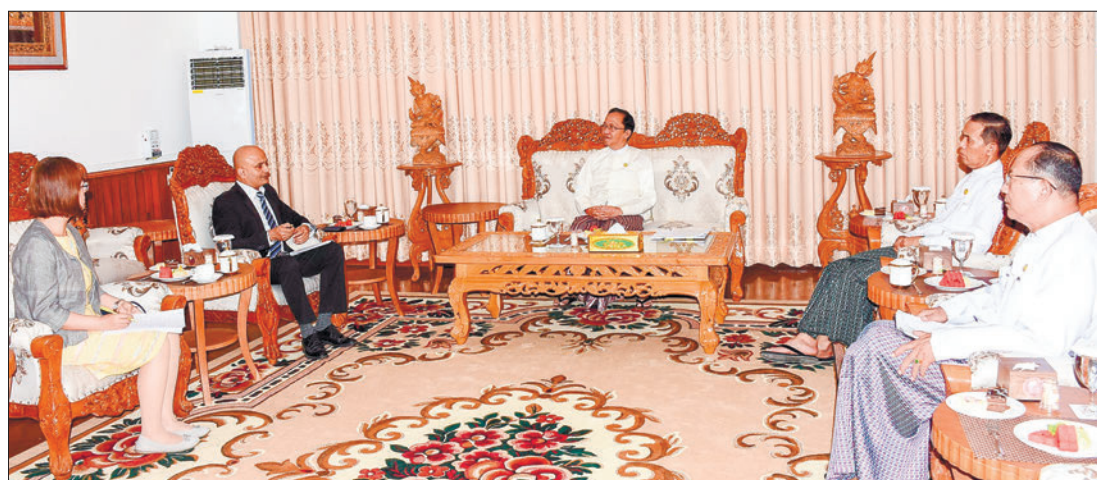
The UNFPA resident representative calls on Union Minister Dr Thet Khaing Win yesterday in Nay Pyi Taw.

These topics are to be embodied in the letter of agreement to be signed between Myanmar's Ministry of Investment and Foreign Economic Relations and the United Nations Fund for Population Activities. — MNA/KZW