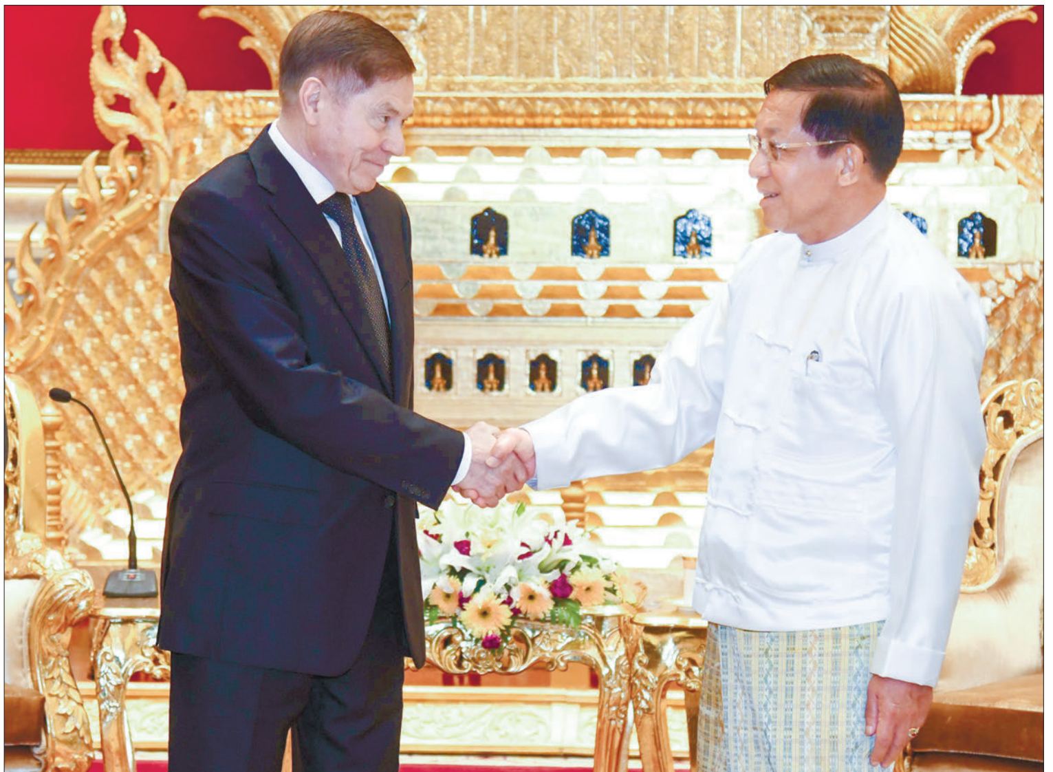
SAC Chair Premier Senior General Min Aung Hlaing receives Mr Vyacheslav Lebedev, Chief Justice of Russian's Supreme Court yesterday.

At the meeting, they openly exchanged views on the enhancement of diplomatic relations between Myanmar and the Russian Federation, plans of promoting cooperation in legal and judicial affairs, legal experts from Myanmar to study legal subjects in the Russian Federation, plans to further boost bilateral cooperation in the legal affairs sector and judicial affairs sector, and the progress of cooperation in all sectors between the two countries. — MNA/TTA