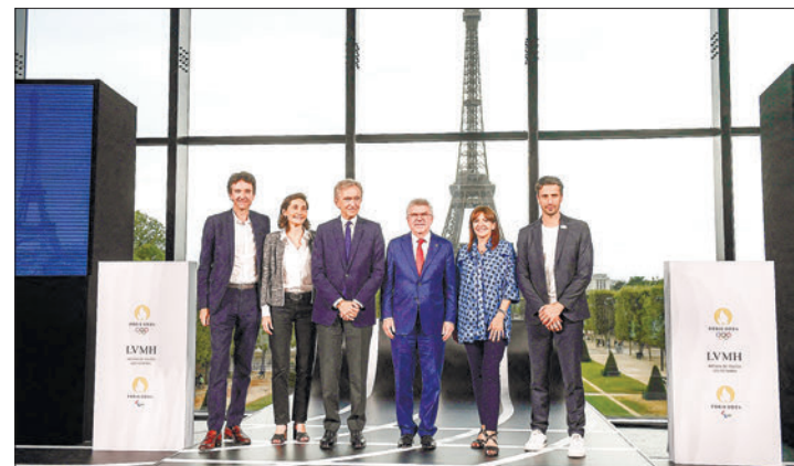
(FromL) CEO of LVMH Holding Company Antoine Arnault, French Sports Minister Amelie Oudea-Castera, World's top luxury group LVMH head Bernard Arnault, International Olympic Committee (IOC) president Thomas Bach, Mayor of Paris Anne Hidalgo and President of the Paris 2024 Organizing Committee Tony Estanguet pose for a group picture during a meeting after LVMH was named as final premium sponsor of 2024 Paris Olympics, in Paris on 24 July 2023, with the Eiffel Tower in the background.

He made the announcement at a news conference in Paris attended by International Olympic Committee President Thomas Bach, Paris 2024 chief organizer Tony Estanguet, Paris Mayor Anne Hidalgo and France's sports minister Amelie Oudea-Castera. With Wednesday marking one year to go until the opening ceremony of the Paris Olympics, the late completion of the deal with the world's biggest luxury group created great interest in France. — AFP