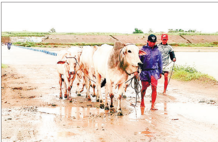
Farmers lead their cows to a safer place in Ilagan town, Isabela province, north of Manila on 25 July 2023 as Typhoon Doksuri heads towards the northern Philippines.