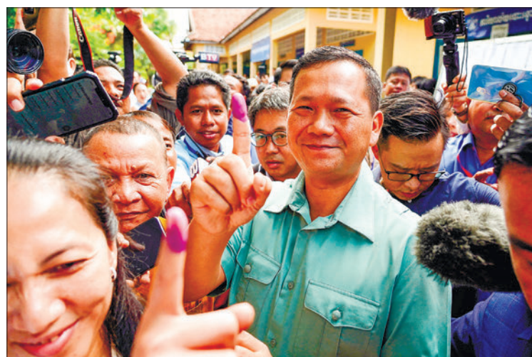
Hun Manet, commander of the Royal Cambodian Army and eldest son of Prime Minister Hun Sen, shows his finger after he casts his vote at a polling station in Phnom Penh on 23 July 2023.

Hun Manet, the future Prime Minister candidate for