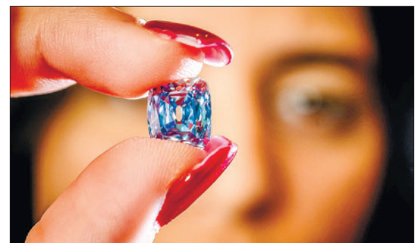
A model holds a De Beers cushion brilliant-cut fancy vivid blue 5.53 carats diamond that could fetch 15 million US dollars during a press preview by Sotheby’s auction house ahead of sale in Geneva on 3 November 2022.

The underground operation, employing about 4,300 people, is now 70 per cent complete, it said. — AFP