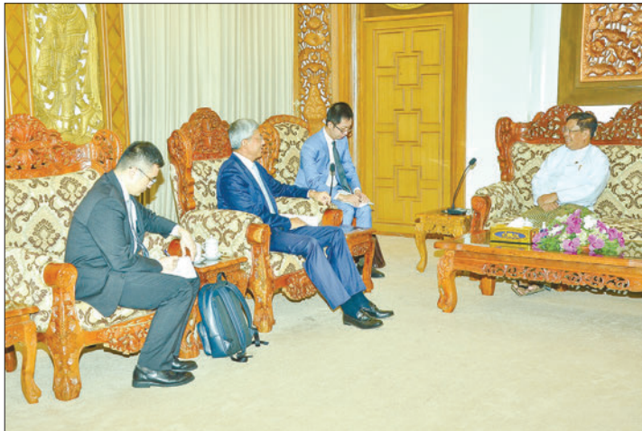
Chinese Ambassador Mr Chen Hai calls on Union Minister U Than Swe in Nay Pyi Taw yesterday.

UNION Minister for Foreign Affairs U Than Swe received Mr Chen Hai, Ambassador of the People's Republic of China to Myanmar, yesterday at the Ministry of Foreign Affairs, Nay Pyi Taw.