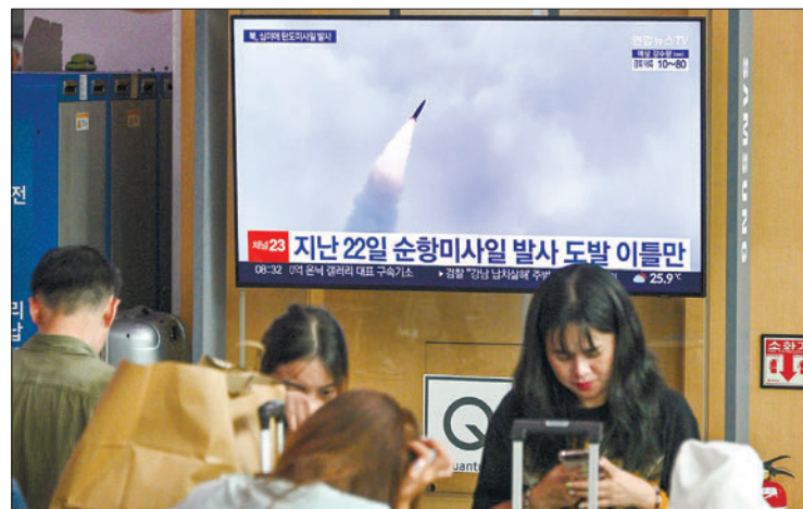
People sit in front of a television screen showing a news broadcast with file footage of a North Korean missile test at a railway station in Seoul on 25 July 2023.

South Korea's defence ministry described the two projectiles as ballistic missiles that flew about 400 kilometres (248 miles) before falling into the sea, according to reports by news agency Yonhap of South Korea and Japan's Kyodo. "Our military detected two ballistic missiles North Korea fired from areas near Pyongyang into the East Sea at 11:55 pm on the 24 th and at midnight of the 25 th ," Yonhap quoted South Korea's Joint Chiefs of Staff as saying. — AFP