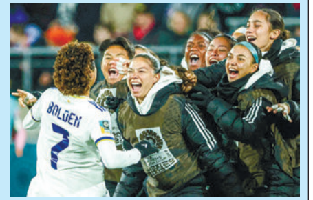
Philippines' forward (7) Sarina Bolden (L) celebrates scoring her team's first goal during the Australia and New Zealand 2023 Women's World Cup Group A football match between New Zealand and the Philippines at Wellington Stadium, also known as Sky Stadium, in Wellington on 25 July 2023.