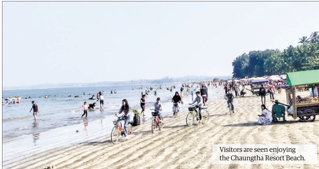
Visitors are seen enjoying the Chaungtha Resort Beach.

daung-Maungtau and Sittway-Angumaw-Maungtau trade channels, mostly from Kanyinchaung Economic Zone in Maungtau. — TWA/KK