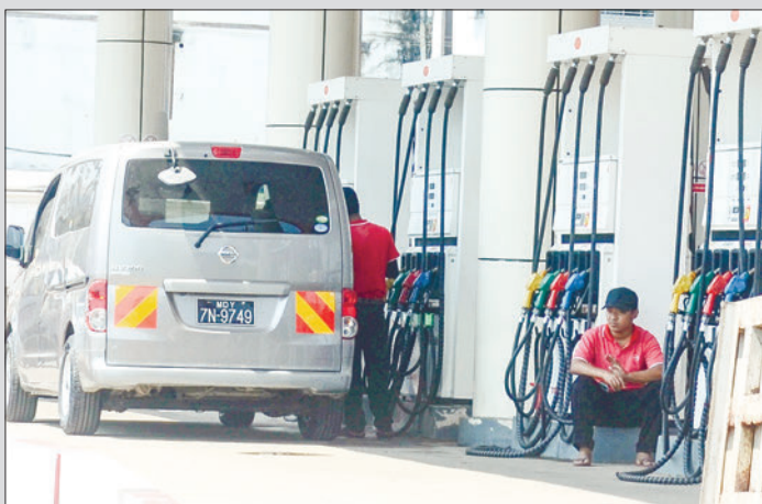
A vehicle is seen filling fuel at the petrol station in Yangon.

Some countries levied higher tax rates and hiked oil prices compared to that of Myanmar. However, Malaysia's oil sector receives government subsidies and the prices are about 60 per cent cheaper than that of Myanmar. Every country lays down different patterns of policy to fix the oil prices. Myanmar also levies only a lower tax rate on fuel oil and strives for energy consumers to buy the oil at a cheaper rate. — NN/EM