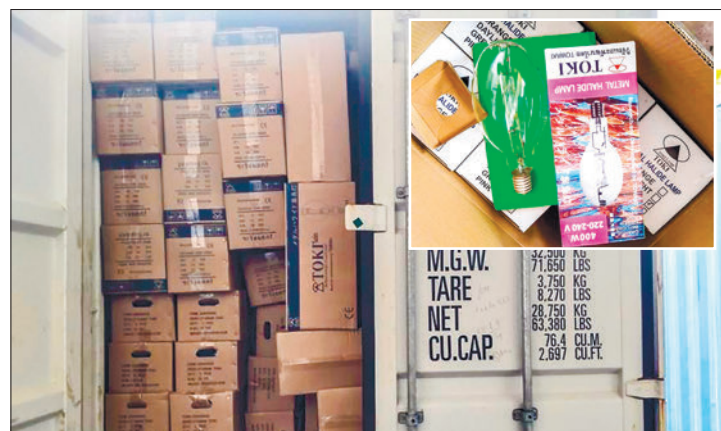
Confiscated illegal items at Asia World Port Terminal.

The action was taken under Customs procedures. A total of 17 arrests were made on 23 and 24 July, with an estimated value of K183,268,803, as reported by the Illegal Trade Eradication Steering Committee. — MNA/MKKS