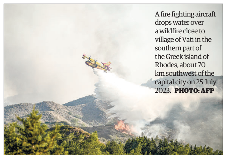
A fire fighting aircraft drops water over a wildfire close to village of Vati in the southern part of the Greek island of Rhodes, about 70 km southwest of the capital city on 25 July 2023.

the Greek Ministry of Defence, quoted by state TV ERT, which published a video of the aircraft as it crashed and disappeared behind a cloud of flames and black smoke. Wildfires have been raging in Greece amid scorching temperatures, forcing mass evacuations in several tourist spots including on the islands of Rhodes and Corfu. — AFP