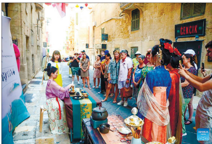
People view the Chinese tea ceremony during an event in Valletta, Malta, on 23 July 2023. The China Cultural Centre in Malta celebrated its 20 th anniversary on the weekend, with a series of events organized jointly with the Xi'an Municipal Administration of Culture and Tourism.

tural Centre in Malta has taken part in cultural exchanges,