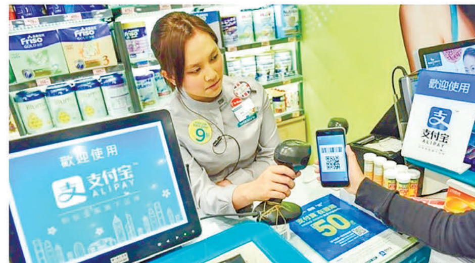
Alipay, along with its main competitor WeChat Pay (operated by Tencent), has transformed China into a predominantly cashless society. People in China commonly use their smartphones to pay for various goods and services, from small street vendors to large retailers. (L); This file photo shows customers leaving a shopping mall in downtown Yangon. (R).