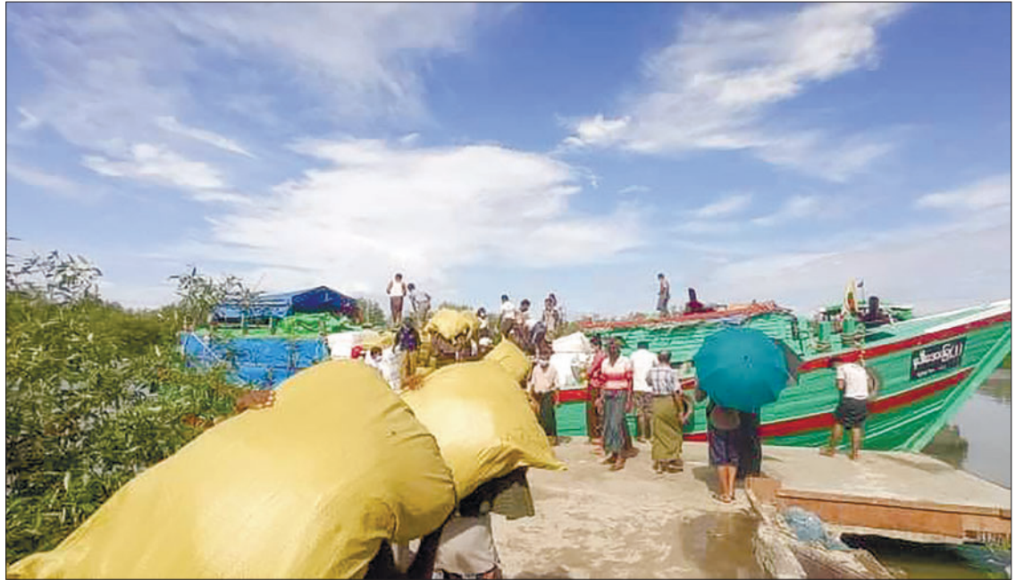
Export cargoes are seen being loaded onto a vessel at Maungtau Port.

a capacity of only 12-wheel and 6-wheel trucks. Despite the distance of 70 nautical miles between the two countries, climate conditions in the rainy season