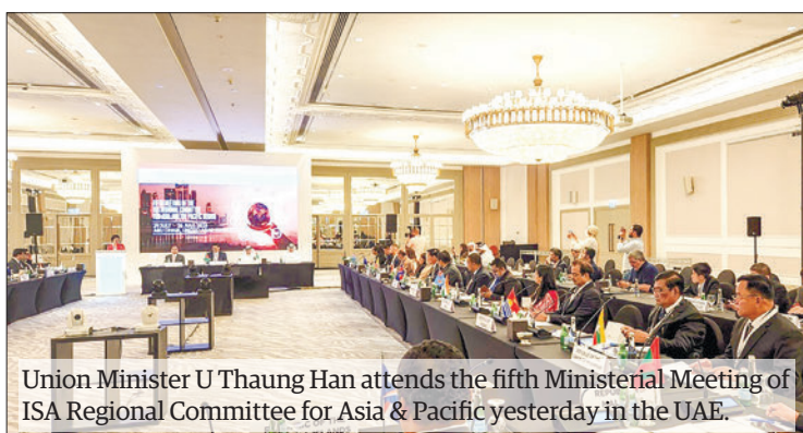
Union Minister U Thaung Han attends the fifth Ministerial Meeting of ISA Regional Committee for Asia & Pacific yesterday in the UAE.

Then, the Union minister discussed current activities to develop solar energy, and challenges in executing NDC's renewable energy development programmes of NDC. — MNA/KTZH