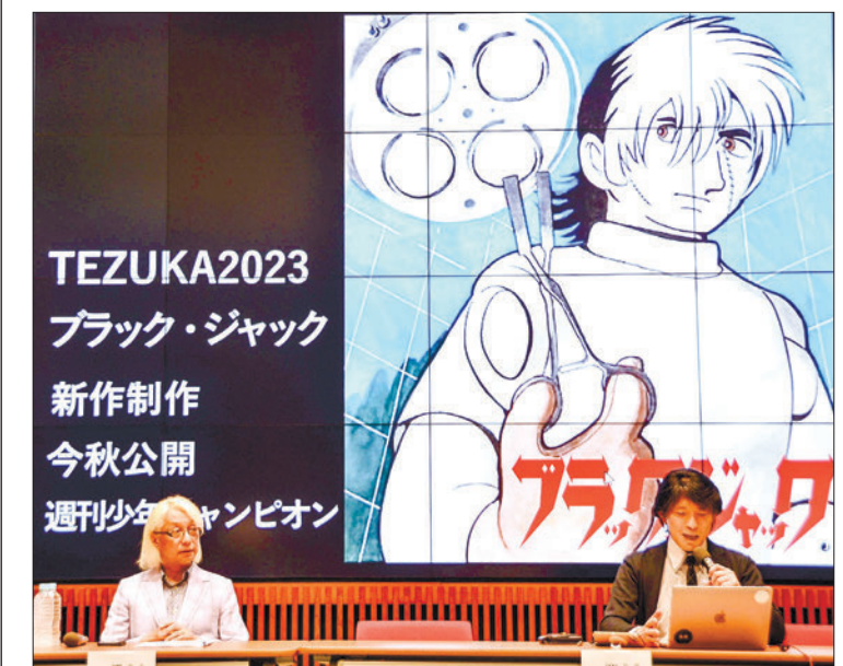
Members of the TEZUKA2023 project, under which a new episode of the well-known Osamu Tezuka manga "Black Jack" will be created with the help of artificial intelligence, attend a press conference in Tokyo on 12 June 2023.

JAPANESE manga artists and creators are exploring the use of generative artificial intelligence, pinning their hopes on using the technology to offer suggestions for illustration drafts and story plots, as well as for making the creative process substantially more efficient.