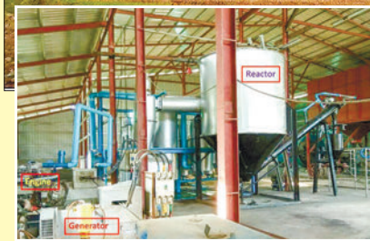
Homemade gasifier and its use for electricity generation (above and left photos.)

MINISTRY of Science and Technology plans to cooperate with business owners and experts to build well-designed gasifiers that consume paddy husk as fuel, according to the ministry.