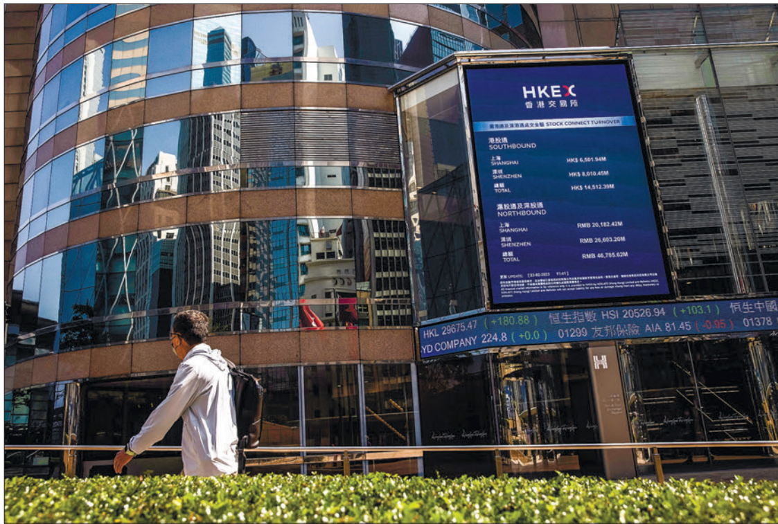
A man (L) walks through exchange square outside the Hong Kong Stock Exchange in Hong Kong on 23 February 2023.

In China, with recent data showing growth stuttering and business activity slowing in the