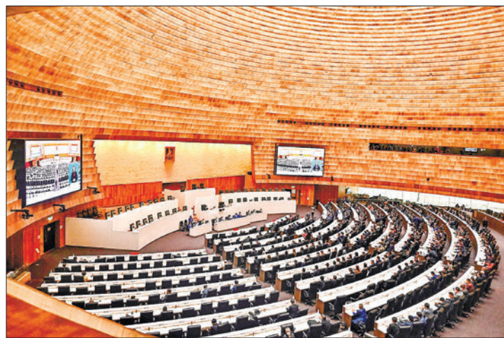
Members of Thai Parliament begin debate to decide proceedings before the second round of the parliamentary vote to decide the country's next prime minister in Bangkok on 19 July 2023. PHOTO: AFP

But their campaign promises of reform to the kingdom's strict royal defamation laws and monopolies provoked intense opposition from the conservative establishment. "I am aware of the postponing of the parliament meeting," Pita told reporters. "There is not much I can do but to be back on the ground and spend most of my time there." — AFP