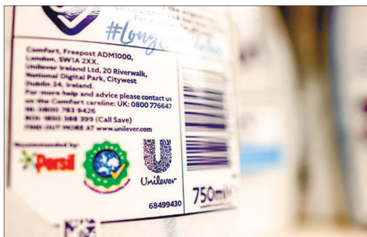
A Unilever logo is pictured on a bottle of the company's Persil washing detergent product in a shop in London on 20 January 2022.

Unilever on Tuesday added that its turnover increased 2.7 per cent to 30.4 billion euros in the first six months of the year. — AFP