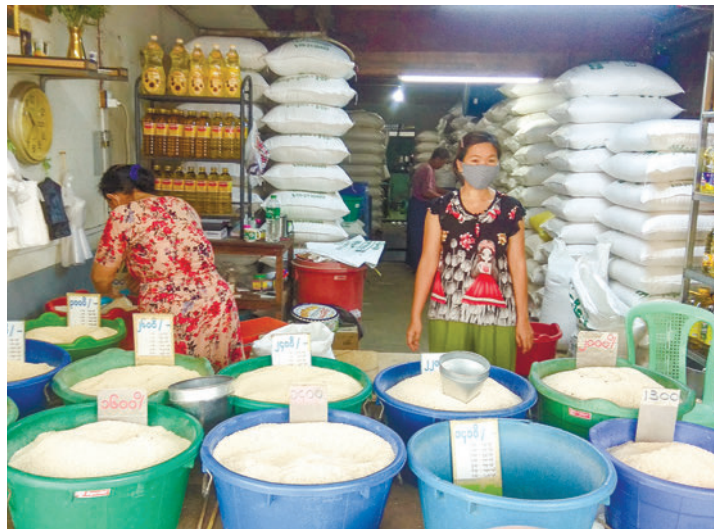
Vendors are organizing various kinds of rice for sale in the Yangon market.

Myanmar Rice Federation notified on 24 April that tips-off about those manipulators who spread malicious rumours on digital platforms to spark concerns of the consumers and raise the rice prices can be done for the sake of the long-term benefit of the rice industry. The federation will forward the reports of those manipulators to the relevant authorities if they refused to be persuaded. Those stakeholders in the supply chain need to exert concerted efforts in this as well. — NN/EM