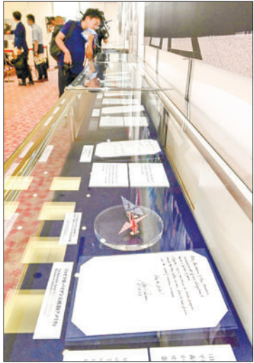
World leaders' guest book entries to the Hiroshima Peace Memorial Museum are on display at the "G-7 Hiroshima Summit Reminiscences" exhibition at the International Conference Centre Hiroshima on 25 July 2023.