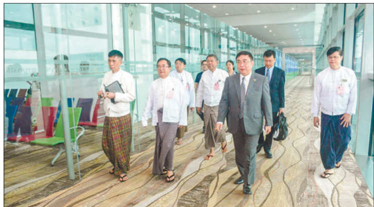
Union Minister Dr Nyunt Pe is seen before leaving for Indonesia yesterday.

THE invitation of the Minister of Education, Culture, Art, Research and Technology of Indonesia, the Myanmar delegation led by Union Education Minister Dr Nyunt Pe left Yangon for Indone-