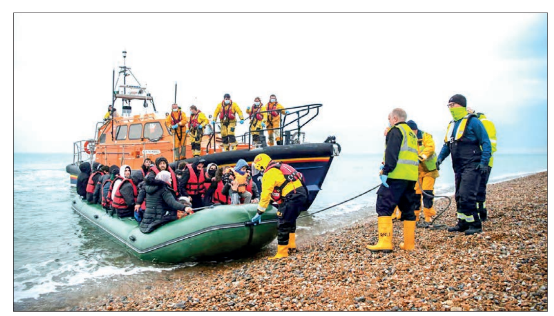
Migrants are helped ashore at a beach in Dungeness, on the south-east coast of England.