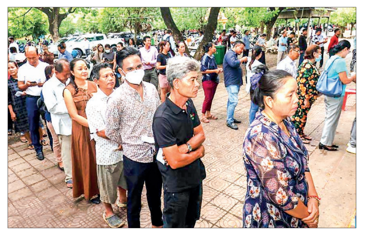
People wait for their turns to vote at a polling station in Phnom Penh, Cambodia, on 23 July 2023. The seventh general election kicked off in Cambodia on Sunday with a total of 18 political parties taking part in the race, a National Election Committee (NEC) spokesman said.