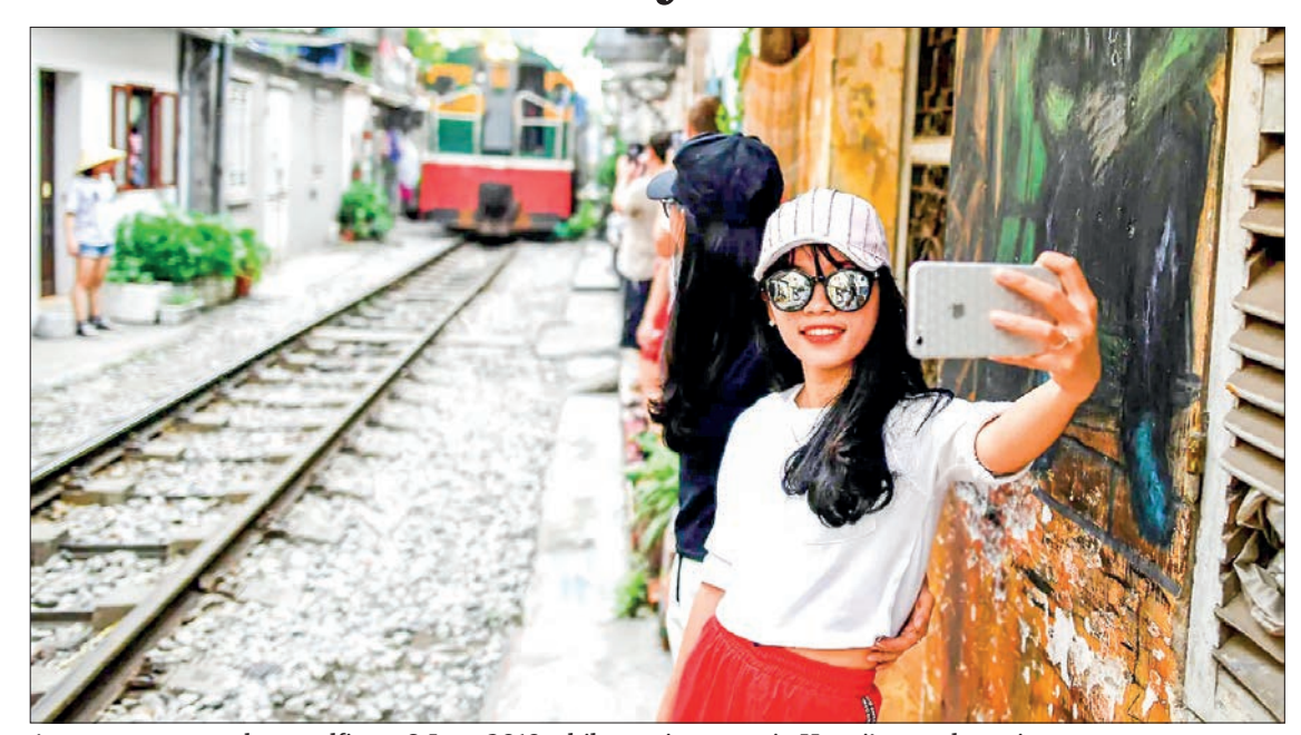
A young woman takes a selfie on 8 June 2019 while a train passes in Hanoi's popular train street.

NEARLY five billion people, or slightly more than 60 per cent of the world's population, are active on social media, according to a recent study.