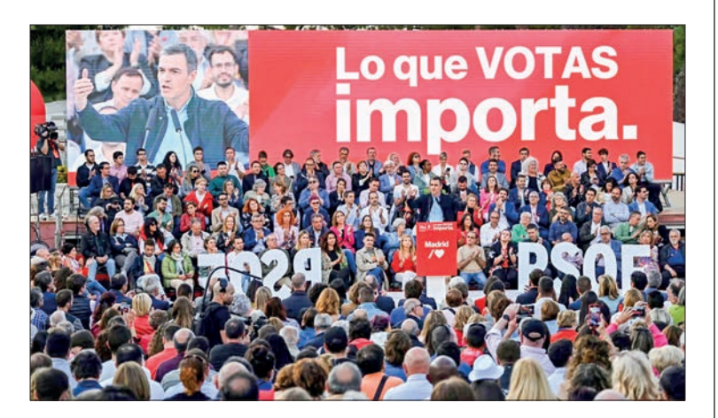
The 2023 Spanish general election took place on Sunday, 23 July 2023, to choose the 15<sup>th</sup> Cortes Generales of the Kingdom of Spain. Voters had the opportunity to elect all 350 seats in the Congress of Deputies and 208 out of 265 seats in the Senate.

As many Spaniards are on holiday, more than 2.47 million — a record number — of the 37.5 million registered voters have cast an absentee ballot, Spain's postal service said on Saturday. — AFP