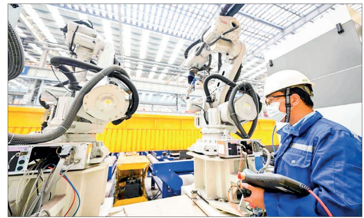
An employee works at a smart production facility in Tianjin.

This survey aims to figure out the basic situation and distribution of all legal entities, industrial activity units and self-employed households engaged in secondary and tertiary industry activities in China. — Xinhua