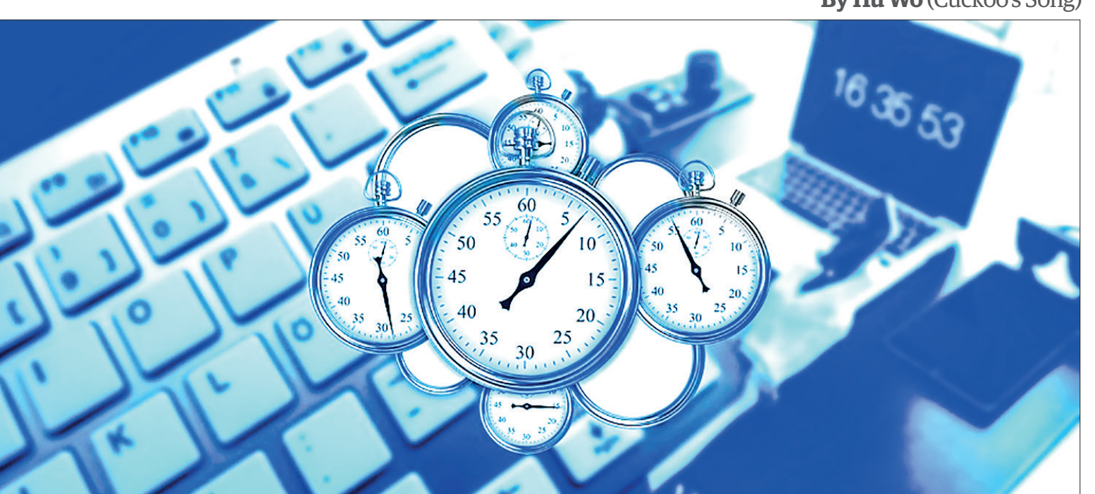
Time is considered priceless because once it passes, it cannot be reclaimed. Thus, making the best use of it is vital.

by teachers just another day can be conditionally postponed by students to a later but not-too-long date if they are dab hands with