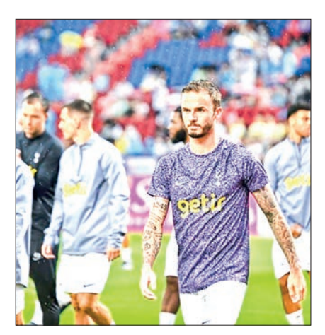
Tottenham's friendly against Leicester in Bangkok was called off because of a waterlogged pitch.

TOTTENHAM'S pre-season preparations suffered a blow on Sunday as their friendly against Leicester in Bangkok was called off because of a waterlogged pitch.