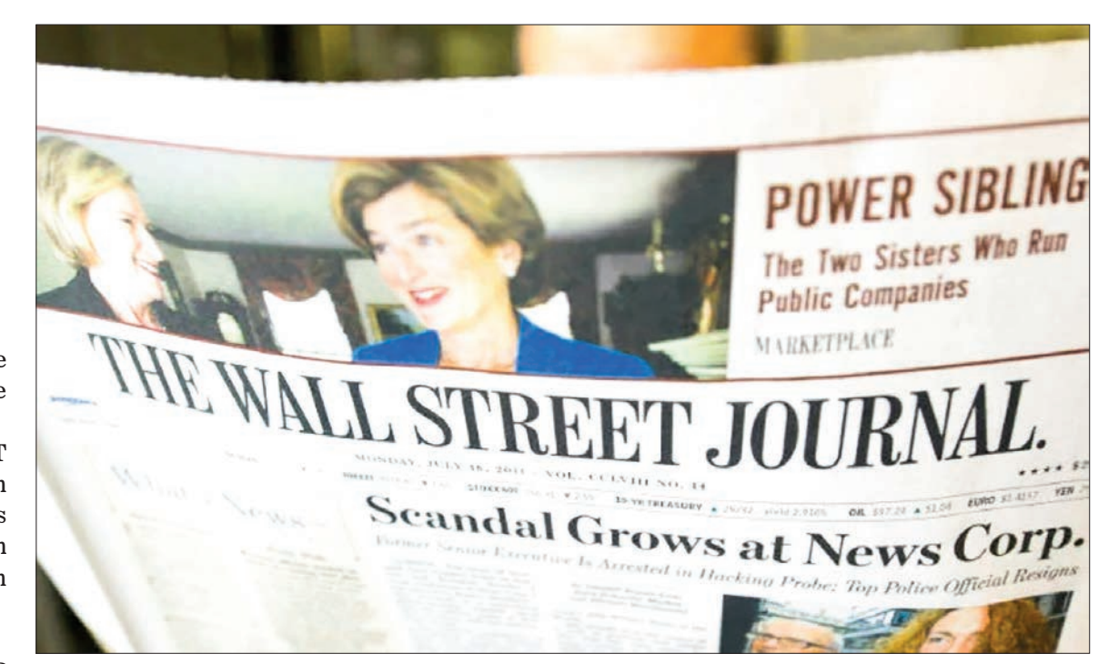
The initiative was first reported by The New York Times. Several prominent news organizations are involved in testing the new AI tool, including The Washington Post and The Wall Street Journal.