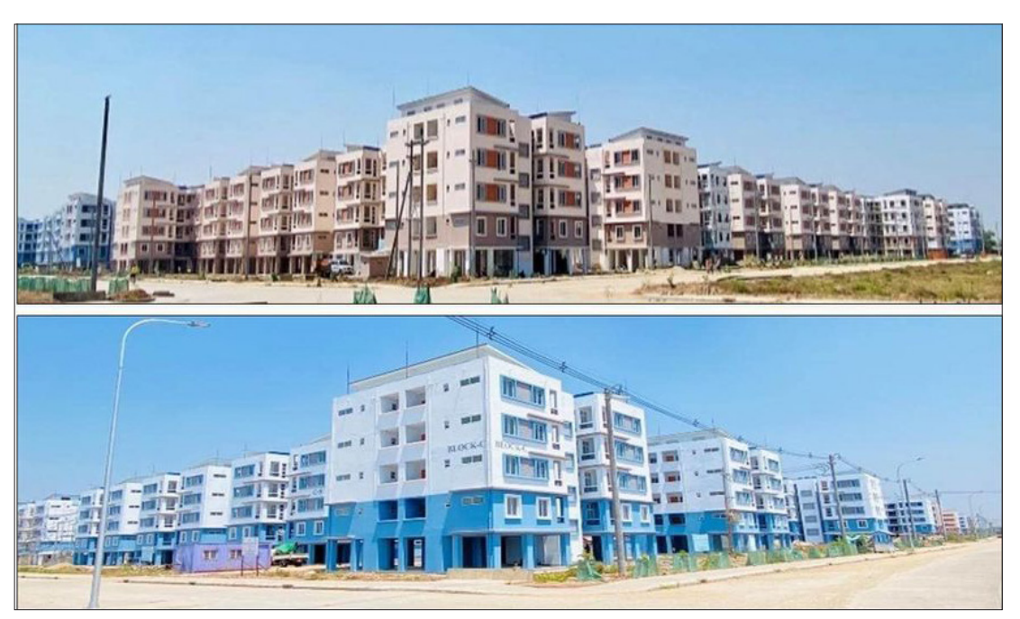
The apartments of Thukha Dagon Public Rental Housing are seen in Dagon Myothit (South) Township.

The housing project spans 171 acres of land near the intersection of No 2 Highway and No 7 Highway, encompassing 194 buildings with 3,104 apartments currently being constructed in the first phase. For this phase, the Myanmar Construction Entrepreneurs Federation (MCEF) and the Myanmar Licensed Contractors Association (MLCA) have allocated 97 buildings each for construction purposes. — MNA/CT