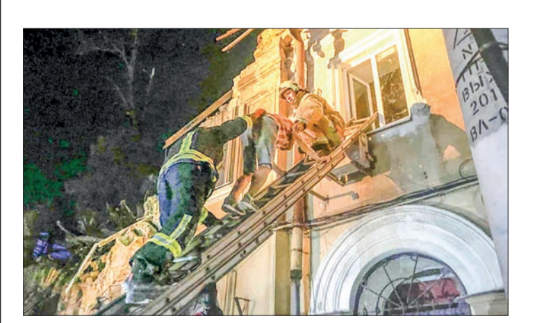
Rescue workers in Odesa evacuate a civilian from a building damaged by a Russian missile strike.

THE Ukrainian port city of Odesa came under renewed Russian missile attack early Sunday, just hours before President Vladimir Putin was due to hold a summit with his staunch Belarus ally Alexander Lukashenko.