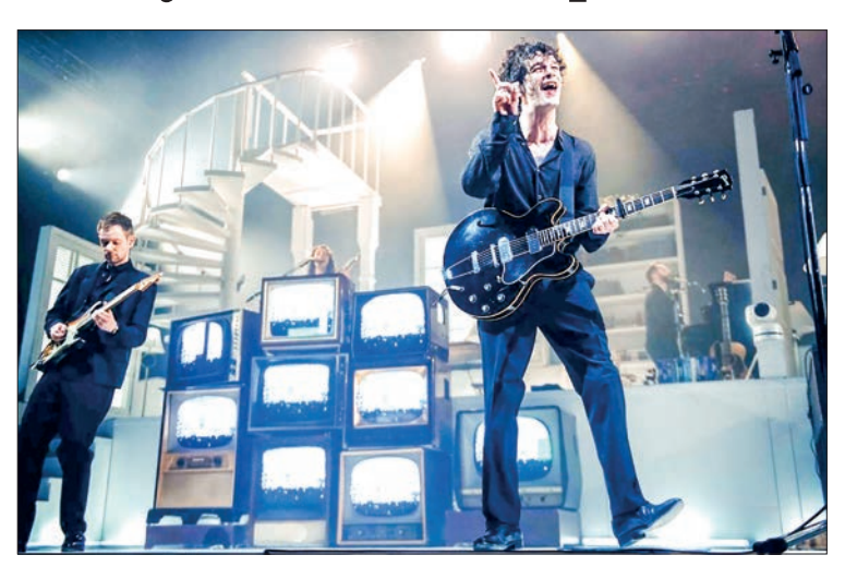
The British indie-rock band, The 1975, cancelled their concert in Indonesia following Malaysia's decision to axe a festival due to a same-sex kiss and criticism of Malaysia's anti-LGBTQ laws by the band's frontman, Matt Healy.

BRITISH indie-rock band The 1975 cancelled a concert in Indonesia Sunday, after Malaysia axed a festival over a same-sex kiss and tirade against the country's anti-LGBTQ laws by their