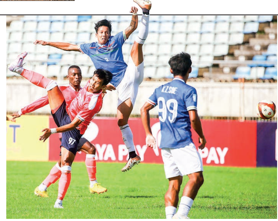
Maha United players (pink) vie for the ball with Kachin United player (blue) during their MNL Week-13 match at Thuwunna Stadium in Yangon on 23 July 2023.