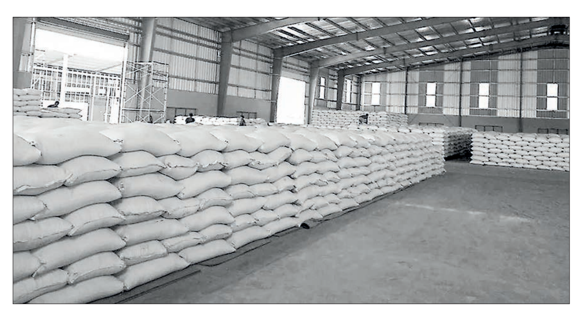
The photo shows newly supplied rice bags stockpiled at the Wahdan Rice Wholesale Centre in Yangon.

The Ayeyawady Delta regions and western Bago area primarily supply rice to the Yangon market for local consumption and foreign markets. There is an influx of about 100,000 rice bags per day to Wahdan and Bayintnaung Wholesale centres utilizing road and sea transport, the Global New Light of