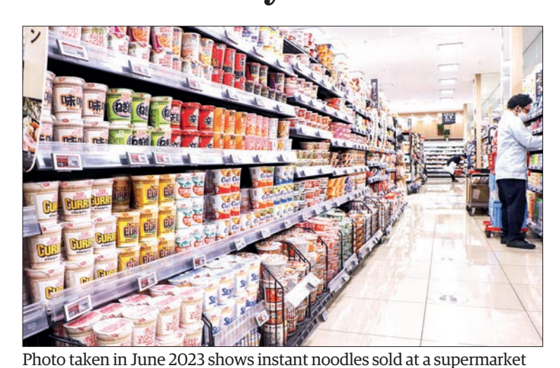
in Tokyo.

JAPANESE consumers will have seen price hikes on 30,009 food and beverage products by October as retailers pass on higher costs to protect their profits, according to a credit research