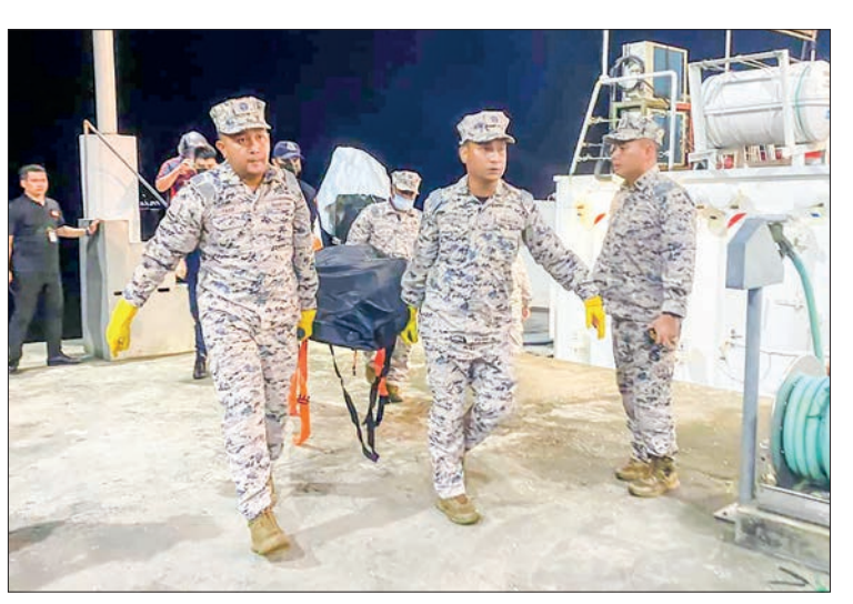
Officials carry the bodies that have been discovered onto the ship.

THE bodies of four individuals who were reported missing from the sinking of MV Tung Sung in Malaysian waters have been discovered by rescuers, as confirmed by Malaysia's maritime intelligence agency, Maritime State. However, their identities have not yet been established.