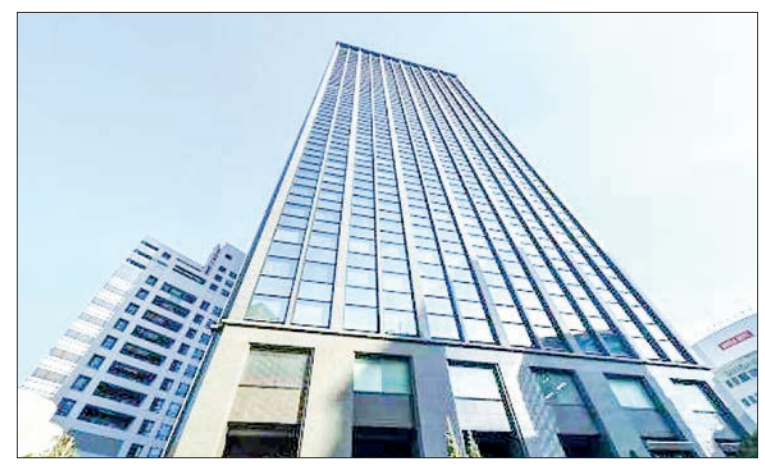
In Tokyo and the nearby areas, there were fewer new condos for sale compared to last year.

THE average unit price of a new condominium in Tokyo's 23 central wards in the first six months of 2023 soared to a record high 129.6 million yen ($930,000) due largely to high material prices