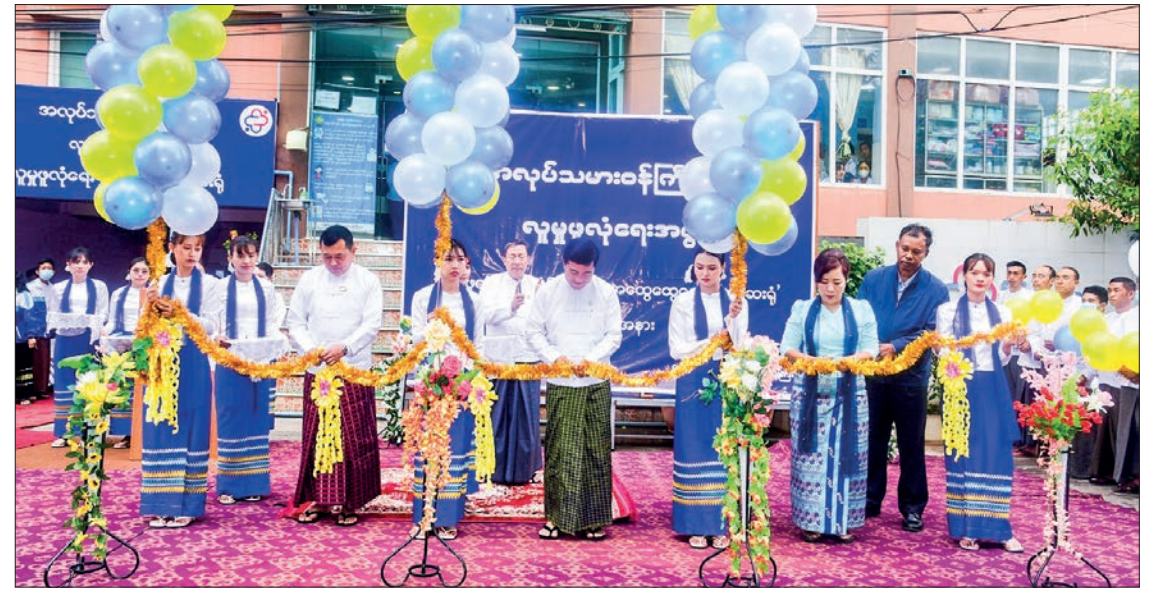
The opening event of the Social Security-Khine Metta General Clinic in progress on 21 July in Taunggyi.

SOCIAL Security-Khine Metta General Clinic (Taunggyi) for insured workers was launched in Taunggyi Township of Shan State on 21 July, according to the Ministry of Labour.