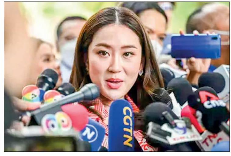
The Move Forward Party, the winner of Thailand's recent election, will support the Pheu Thai party to lead the eight-party coalition government. Pheu Thai Party's Paetongtarn Shinawatra speaks to the press after casting her ballot at a polling station in Bangkok on 15 May 2023.

THE reformist party that won Thailand's recent election said Friday it would back a rival candidate to become prime minister after its own leader was blocked by the military and pro-royalist establishment.