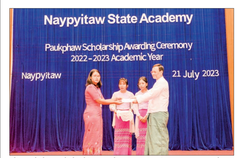
The Paukphaw Scholarship Awarding Ceremony in progress yesterday at the Naypyitaw State Academy.

The deputy minister also joined the opening ceremony of PhD courses for Myanmar, Geography and Marine Science subjects and youths and civics training courses launched at Myeik University for the first time online on the same day. – MNA/KTZH