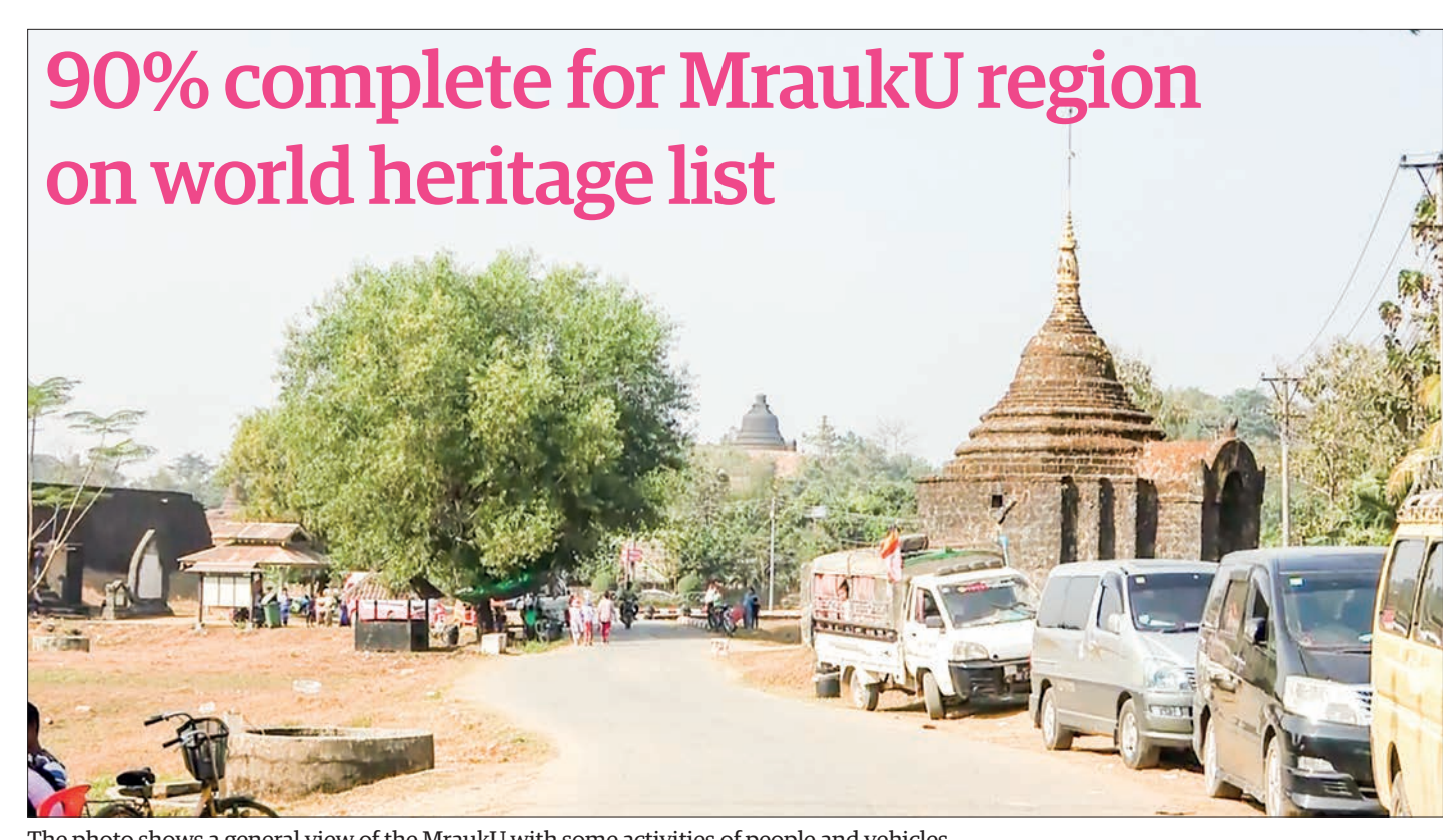
The photo shows a general view of the MraukU with some activities of people and vehicles.

... a ceremony to consecrate the Maravijaya Buddha image and hoist umbrellas atop small pagodas on stone plaque chambers will take place on a grand scale on 1 August 2023, the full moon of Second Waso (Dhammacakka Day), adding that more than 70 members of the Sangha from nine countries will consecrate the Buddha image.