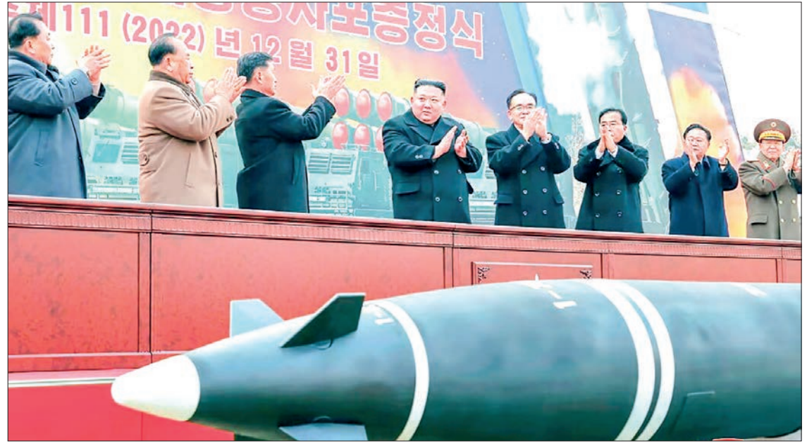
North Korean leader Kim Jong Un attends a ceremony at the headquarters of the Central Committee of the Workers' Party of Korea in Pyongyang on 31 December 2022.

North Korea last year adopted a sweeping nuclear