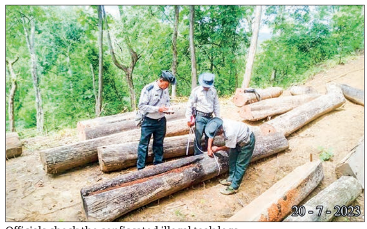
Officials check the confiscated illegal teak logs.

THE combined team under the supervision of the Yangon Region Illegal Trade Eradication Task Force nabbed a Hino Profia van (approximately K40 million) carrying 3,300 kilogrammes of Diamond Non-Woven Interlining worth K10.395 million that were not declared in the Import Declaration (ID) near the Inndaing checkpoint and an unregistered Toyota Crown (approximately K3.5 million) near the Mingaladon Police Station on Yangon-Pyay Road in Mingaladon township on 18 July. The action was taken under Customs procedures and the Forest Law.