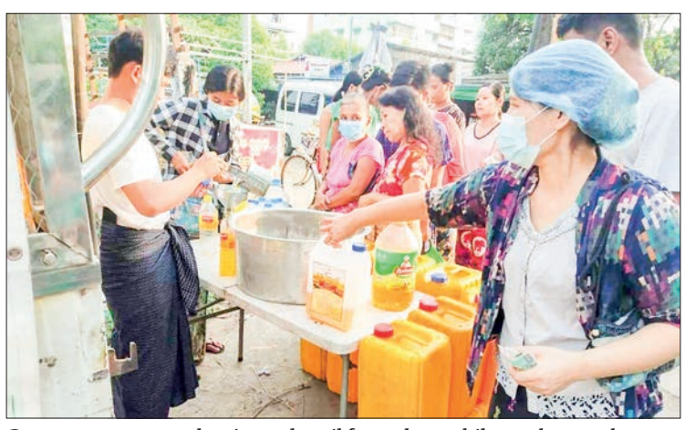
Consumers are seen buying palm oil from the mobile market truck.

An oil dealer in Htantabin Township, Daw Ama, told the GNLM that she had to purchase a few visses of palm oil from some outlets as a quota at a price range