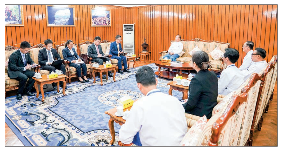
The delegation led by the ACC secretary-general calls on Union Minister U Aung Thaw yesterday.

UNION Minister for Hotels and Tourism U Aung Thaw received a delegation led by ASEAN-China Centre Secretary-General Mr Shi Zhongjun at the ministry in Nay Pyi Taw yesterday afternoon.