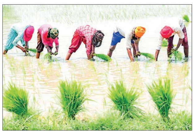
People plant rice saplings at a water-logged rice field on the outskirts of Amritsar, India, on 19 June 2023.

Global demand saw Indian exports of non-basmati