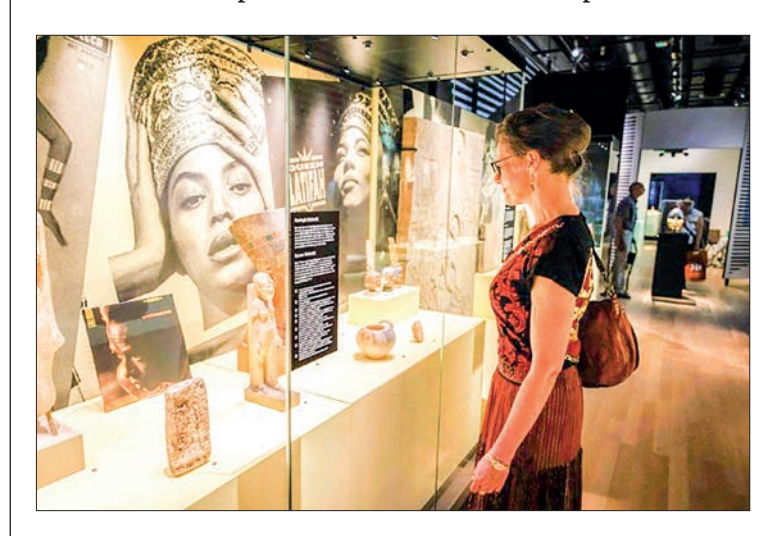
The exhibition, titled 'Kemet: Egypt in hip-hop, jazz, soul & funk', features modern black music alongside ancient sculptures.

Egypt's antiquities service said the museum is "falsifying history" with its "Afrocentric" approach, which seeks to appropriate Egyptian culture, Dutch media reported.—AFP