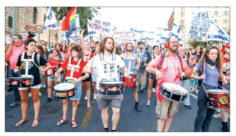
People take to the streets of Jerusalem to protest against the Israeli government's judicial overhaul bill.