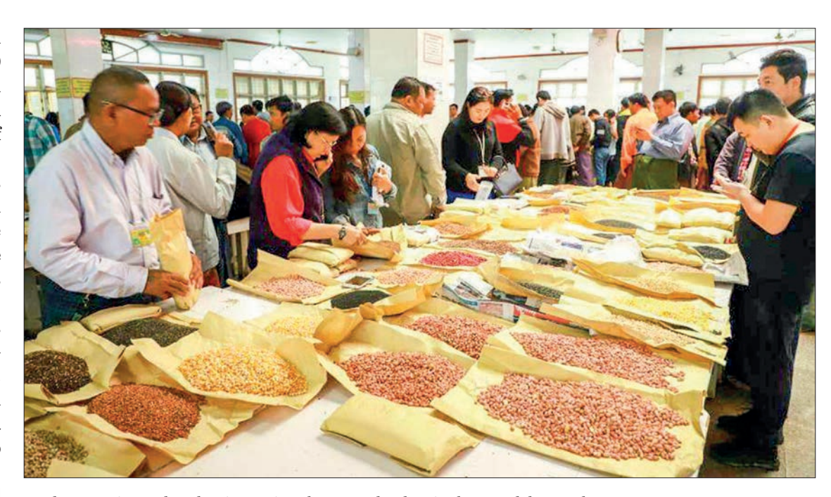
Traders are pictured evaluating various beans and pulses in the Mandalay market.

India has growing demand and consumption requirements for black grams and pigeon peas. According to a Memorandum of Understanding between Myanmar and India signed on 18 June 2021, India will import 250,000 tonnes of black gram and 100,000