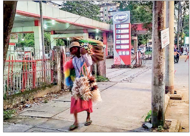
The petrol station is seen with a sign displaying fuel prices in Yangon.

THE prices of fuel oil have regained slightly in the domestic fuel oil market.