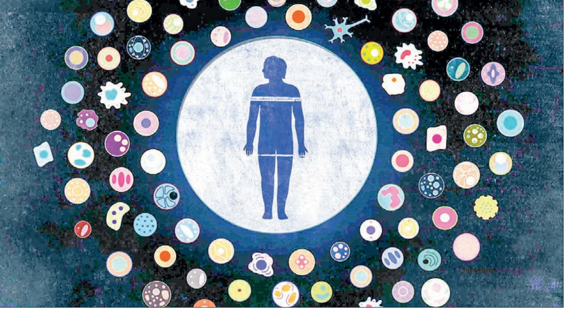
The decoding of the ageing process and the fluidity of traits highlight that self-discovery is an ongoing journey

or liver damage from drinking. Even more subtle behaviours can influence many decades later: Early and compulsive exposure to the sun and sun tanning; poor dental hygiene; poor exercise habits; and obesity all take their toll.