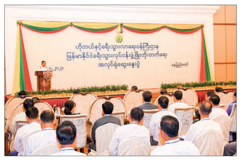
The workshop on the development of the tourism sector in progress.

After the press conference, officials conducted attendees round the Maravijaya Buddha Image and the Maravijaya Buddha Park.