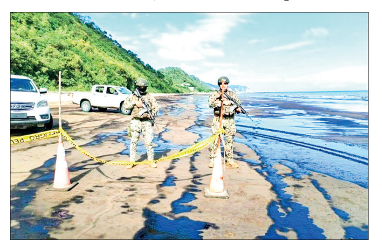
Members of the Ecuadoran Armed Forces stand guard on the shore of a beach covered with oil after a leak in Esmeraldas province on 19 July 2023. PHOTO: ECUADOREAN NAVY/AFP

The beach, in the province of Esmeraldas, has been closed to visitors as Petroecuador is engaged in a massive cleanup, nearly complete, of the sand and surrounding water. — AFP