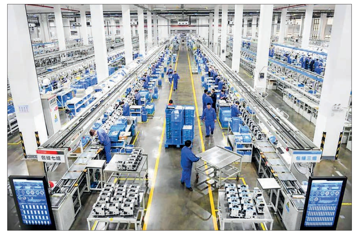
Workers work at a workshop of Jack Sewing Machine Co, Ltd in Taizhou, east China's Zhejiang Province, 23 March 2023.

tellectual property rights, the property rights of private firms, and the legitimate rights and interests of entrepreneurs as part of the legal guarantee for the growth of the private economy.