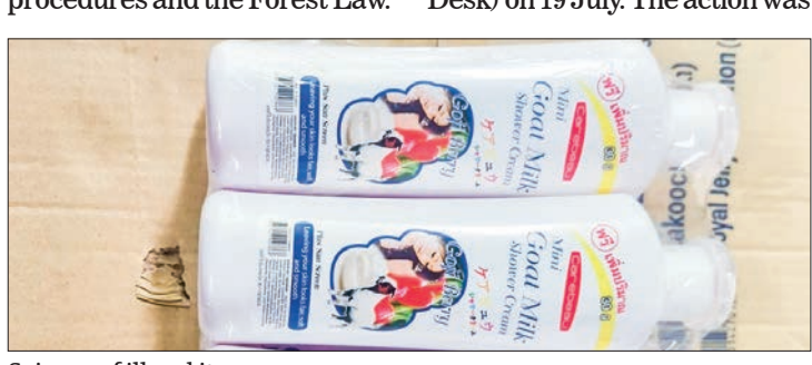
Seizure of illegal items.